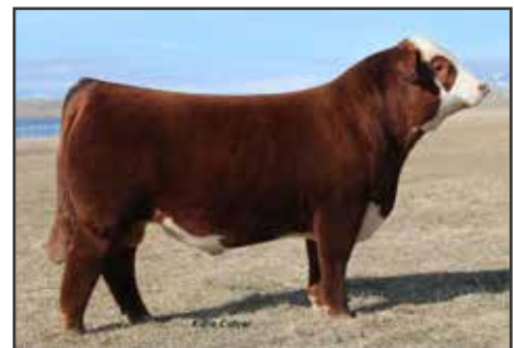
C ARLO 2135 ET $165,000 Sire of Lots 14-16