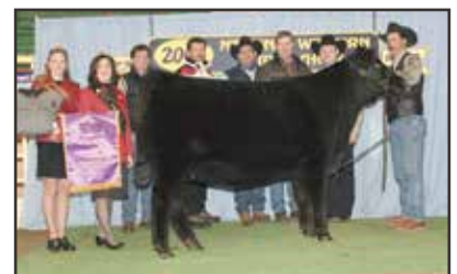
W C C FRONTIER GAL 39 Legendary Maternal Granddam of Lot 27

LOT 28A | BULL CALF BORN 7/1/24 SIRED BY SCC SCH 24 KARAT 838 (AAA: 19262743).