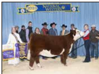
HAWK MYLA 39J ET 2023 NWSS

Grand Champion Polled Hereford Heifer Maternal Sister to Lot 12