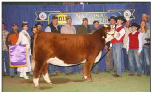
TCC MS DIANA 01 2012 NWSS Grand Champion Polled Hereford Heifer Full Sister to Maternal Granddam of Lot 7

LOT 7A | BULL CALF BORN 9/3/24 SIRED BY GKB 8123 BELLE AIR 1968 (AHA: 44305639).