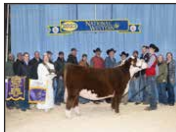
HAWK MURPHY 14J ET 2023 NWSS

Grand Champion Polled Hereford Heifer Maternal Sister to Lot 12