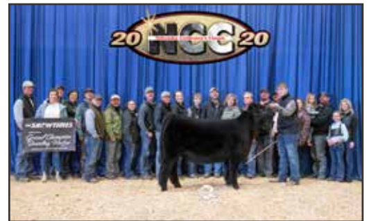
ELCX GOOD ONE 900G ET 2020 Nebraska Cattlemen's Classic Supreme Champion Junior Breeding Heifer Maternal Granddam of Lot 33