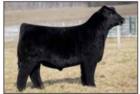
REVELATION 2K Sire of Lots 40 & 41

DAM: NOUVELLE MS SOPHIE Y83 NVL SOPHIE T83