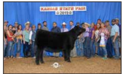
RATLIFFS FLIRT 892F ET Dam of Lots 34-39