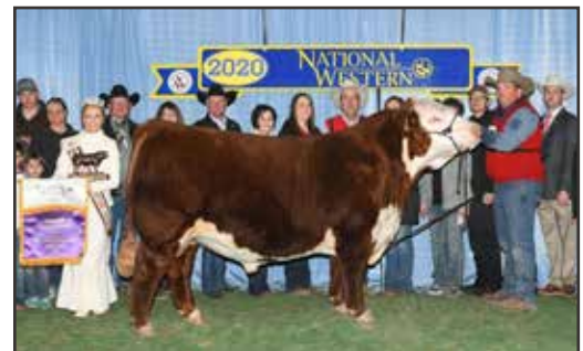
H THE PROFIT 8426 ET

2020 NWSS Grand Champion Polled Hereford Bull Sire of Lot 8