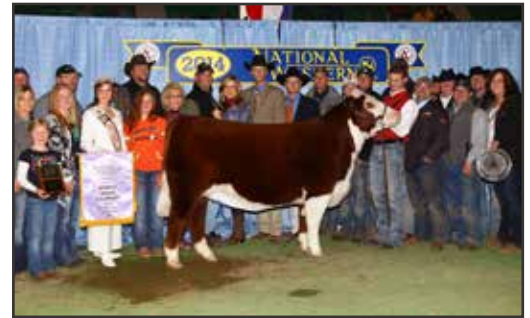
CHEZ STRAWBERRY WINE ET 204Z Full Sister to Lot 1 & Dam of Lot 2