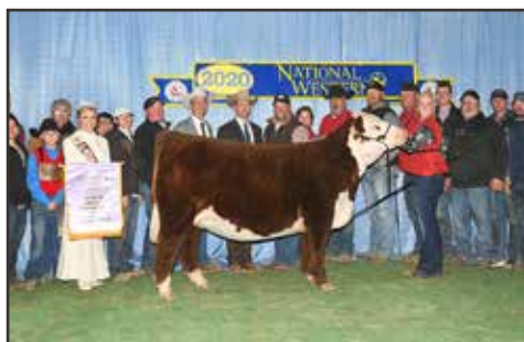
DELHAWK CLAUDIA 70F 2020 NWSS Reserve Grand Champion Polled Hereford Heifer Full Sister to Lot 5