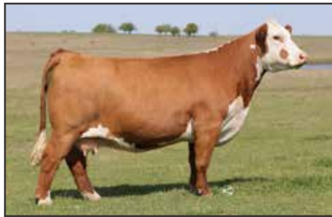
HAPP KOOL AID POINTS 1218 ET

Dominant Champion & Legendary Donor for Buck Cattle Company Maternal Sister to Dam of Lot 11