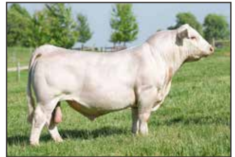
BOY OUTLIER 812 ET PLD Sire of Lot 45

DAM: WC CCC SWEETHEART 4163 P ET BLADRIDGE SWEETHEART 7M