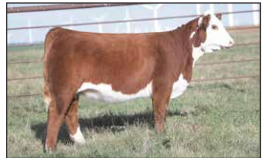
JDH AH ND 19Z 36E RITA 18J ET Dam of Lot 16