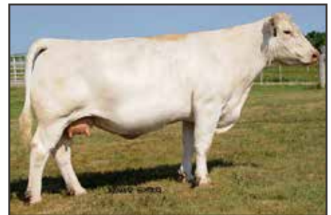
BLADRIDGE SWEETHEART 7M Maternal Granddam of Lot 45 & 46