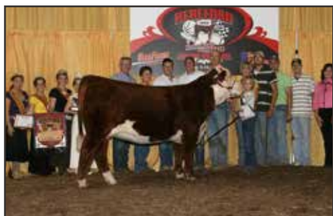
RRR L18 PENELOPE 0509 ET 2010 JNHE Grand Champion Horned Hereford Heifer 4th Generation Maternal Granddam of Lot 22