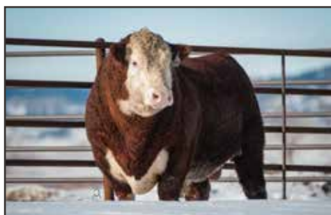
LCX PERFECTO 11B ET Sire of Lot 6