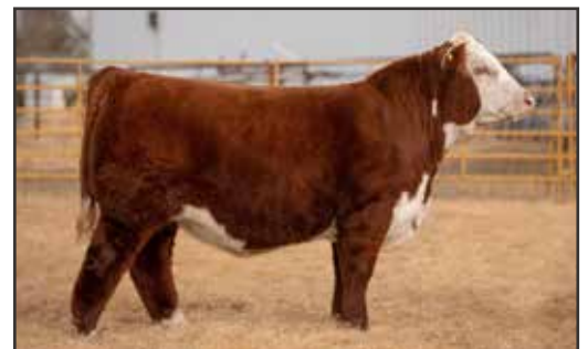
JDH AH LINCOLN 106H ET Maternal Brother to Dam of Lot 16