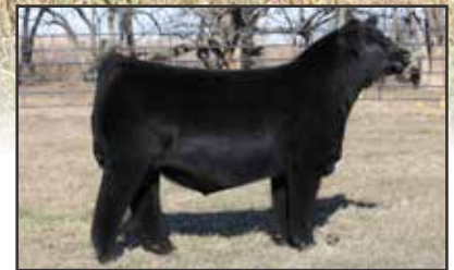
STCC TECUMSEH 058J $620,000 Sire of Lot 44

SILVEIRAS STYLE 9303 DAM: SHSK BENJIE 205H ET WLR PRADA