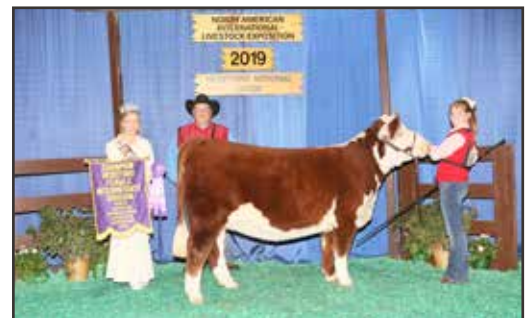
KOLT MS DIANA 3F

2020 NWSS Grand Champion Polled Hereford Bull Sire of Lot 8