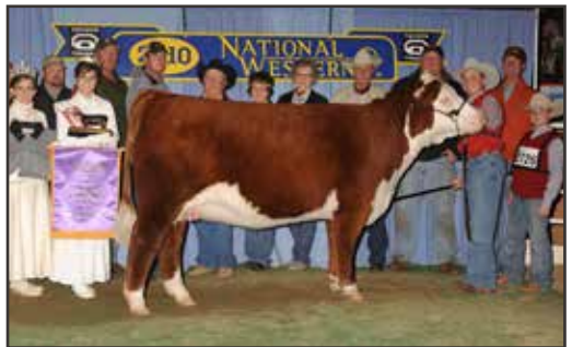
TCC MISS SHELBY 82 ET 2010 NWSS Grand Champion Polled Hereford Heifer 3rd Generation Dam of Lot 7