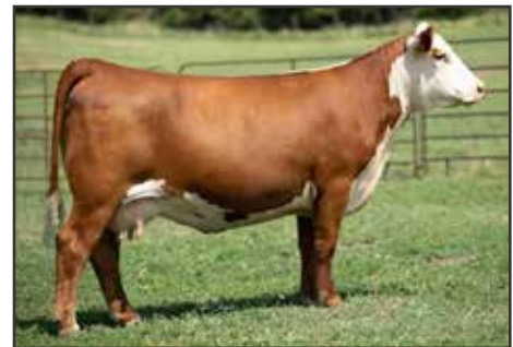
CH MS 2042 REAGAN 8212 ET 2019 American Royal Grand Champion Junior Hereford Heifer Full Sister to Dam of Lot 15