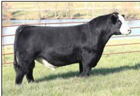
HOLTKAMP CLAC CHANGE IS COMING Sire of Lot 42