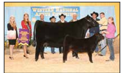
EXAR FRONTIER GAL 1405 2013 WNAF ROV Grand Champion Angus Heifer Dam of Lot 27