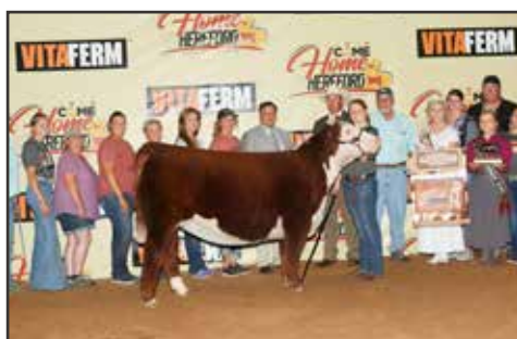
KOLT RUSTIC WINE 5546 ET 2020 JNHE Reserve Grand Champion Bred & Owned Heifer