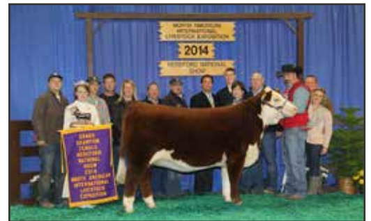
DELHAWK SAPPHIRE 102A ET Dam of Lots 4 & 5 Maternal Granddam of Lot 6

EST. DUE TO CALVE 2/16/25 TO GKB 8123 BELLE AIR 1968 (AHA: 44305639).