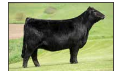
WLR PRADA Legendary Maternal Granddam of Lot 44