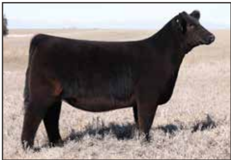
FIRES FLIRT 50L ET $40,000 Maternal Sister to Lots 34-39

NMR MATERNAL MADE DAM: RATLIFFS FLIRT 892F ET RIVERSTONE CHARMED