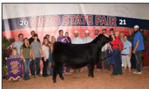
JSZC III TSSC LARISSA 101G ET 2021 OH State Fair Supreme Champion Junior Breeding Heifer Maternal Sister to Dam of Lots 34-39