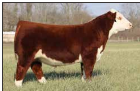
SCG SHOWTIME NO LIMIT III ET Sire of Lot 18