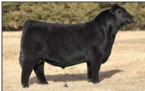
STAG GOOD TIMES 201 ET Sire of Lot 43