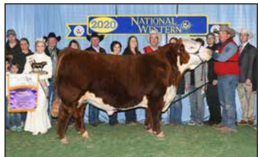
H THE PROFIT 8426 ET Maternal Brother to Dam of Lot 14