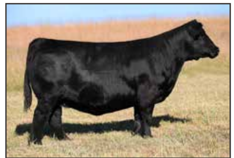
NOUVELLE MS SOPHIE Y83 Dam of Lots 40 & 41

SS EBONYS GRANDMASTER DAM: NOUVELLE MS SOPHIE Y83 NVL SOPHIE T83