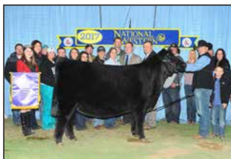
CCC SARA'S DREAM 5116 2017 NWSS ROV Grand Champion Angus Heifer Dam of Lot 31