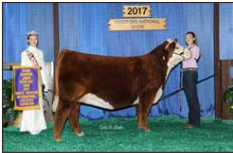
KOLT CARLY'S HARLEY 2858 ET 2017 NAILE Grand Champion Junior Hereford Heifer Full Sister to Dam of Lots 9 & 10