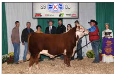
R&R FIREBALL 5086 7070 2018 KILE Grand Champion Hereford Bull Sire of Lots 26 & 27