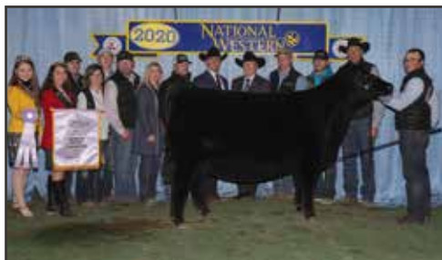
NORDS LUCY 8022 2020 NWSS ROV Reserve Grand Champion Angus Heifer Paternal Granddam of Lot 30