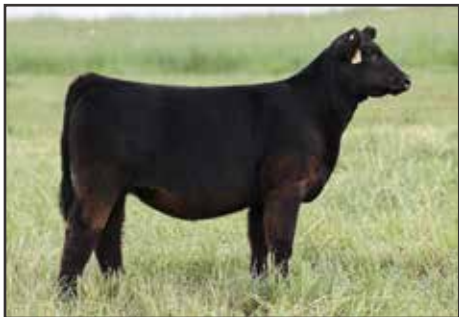
FIRES FLIRTATIOUS 67L ET $28,000 Maternal Sister to Lots 34-39