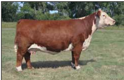
LCC TWO TIMIN 438 ET Iconic Maternal Granddam of Lots 9 & 10