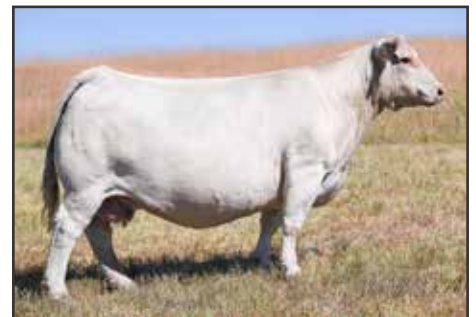
WC CCC SWEETHEART 4163 P ET Dam of Lots 45 & 46