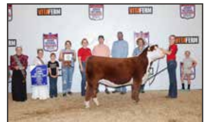
CHEZ TR LORRIE 3902 ET

2024 Jackrabbit Memorial Jackpot Show 3rd Overall (A) & 5th Overall (B) Full Sister to Lot 19