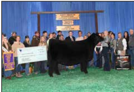
RATLIFF HOW BOUT IT 008H ET 2021 NAILE Supreme Champion Junior Breeding Heifer Maternal Sister to Dam of Lots 34-39

NMR MATERNAL MADE DAM: RATLIFFS FLIRT 892F ET RIVERSTONE CHARMED