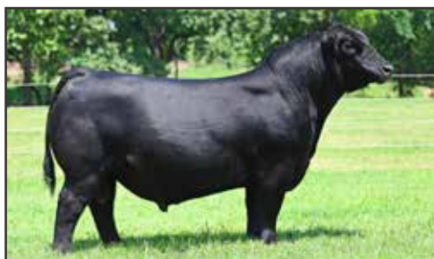
CONLEY A 1 $100,000 Sire of Lot 32