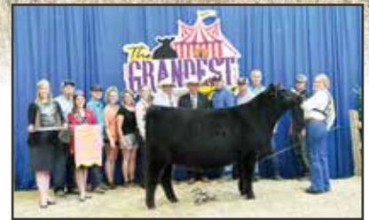
EXAR FRONTIER GAL 1400 2021 NJAS 4th Overall Owned Heifer