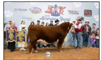
H MONTGOMERY 7437 ET 2019 American Royal Grand Champion Polled Hereford Bull Maternal Brother to Lot 13