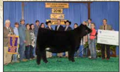
RIVERSTONE CHARMED 2016 NAILE Supreme Champion Junior Breeding Heifer Maternal Granddam of Lot 34-39

DHVO DUECE 132R SIRE: TASF CROWN ROYAL 960C ET TASF WHISKEY LULLABY 357W NMR MATERNAL MADE DAM: RATLIFFS FLIRT 892F ET RIVERSTONE CHARMED