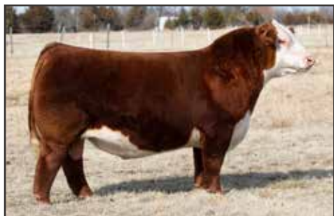
CH HIGH ROLLER 756 ET Sire of Lots 21-23