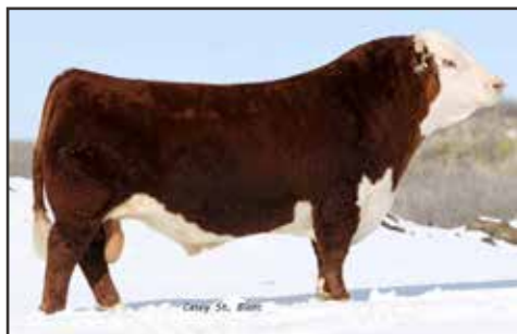
NJW 73S 980 HUTTON 109Z ET Maternal Grandsire of Lot 21