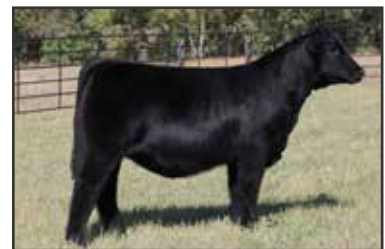
FIRES ROYAL FLIRT 7347K ET $51,500 Full Sister to Lot 34