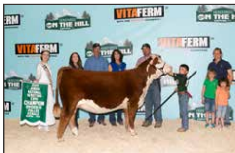
UPS MISS ENDURE 8475 ET 2019 JNHE Division III Champion Dam of Lot 17