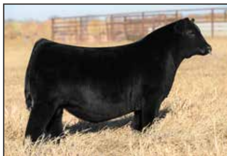
UDE NEW HEIGHTS 62/87 $280,000 Service Sire to Lot 29