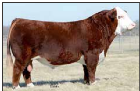
CHAC MASON 2214 Maternal Grandsire of Lot 27