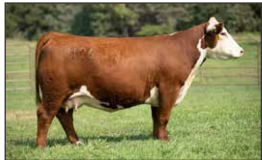
H LADY 9126 ET Dam of Lot 14

LOEWEN GENESIS G16 ET SIRE: C ARLO 2135 ET C 88X NOTICE ME 1311 ET CRR 5280 DAM: H LADY 9126 ET RST GAT NST Y79D LADY 54B ET