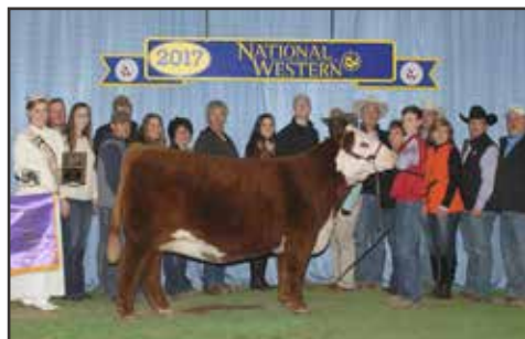
RJL LCC MISS POKER FACE 5C ET 2017 NWSS Grand Champion Polled Hereford Heifer Maternal Granddam of Lot 25

LOT 25A | BULL CALF BORN 9/22/24 SIRED BY CH HIGH ROLLER 756 ET (AHA: 43875385).