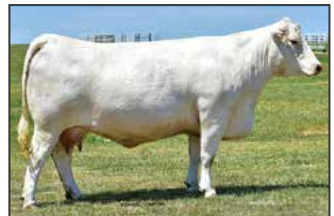
WC CCC SWEETHEART 1140 P Famous Maternal Sister to Dam of Lots 45 & 46