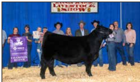
FIRES BLACK BETTY 30J Maternal Sister to Lots 34-39

NMR MATERNAL MADE DAM: RATLIFFS FLIRT 892F ET RIVERSTONE CHARMED