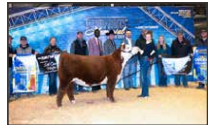
CHEZ TR LOLLIPOP 3910 ET

2016 JNHE Grand Champion Horned Hereford Heifer Dam of Lot 19