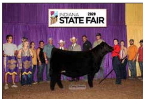
JSZC TSSC LARISSA 49G ET 2020 IN State Fair Reserve Supreme Champion Junior Breeding Heifer Maternal Sister to Dam of Lots 34-39