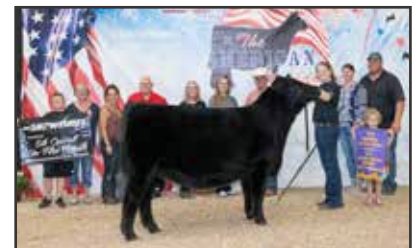
SHSK BENJIE 205H ET 2021 National Junior Limousin Show & Congress 5th Overall Lim-Flex Heifer Dam of Lot 44