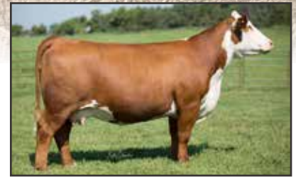
RST GAT NST Y79D LADY 54B ET Prolific Dam of Lot 13 & Maternal Granddam of Lot 14