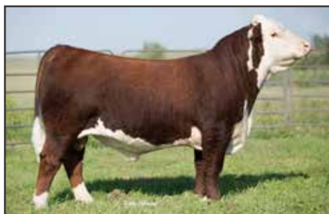
H FHF AUTHORITY 6026 ET Maternal Brother to Dam of Lot 20