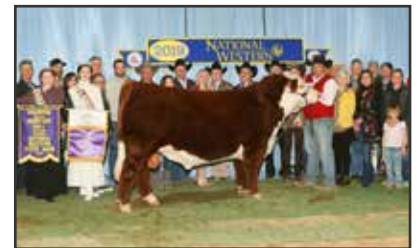
H DEBERARD 7454 ET 2019 NWSS Grand Champion Polled Hereford Bull Maternal Brother to Lot 13