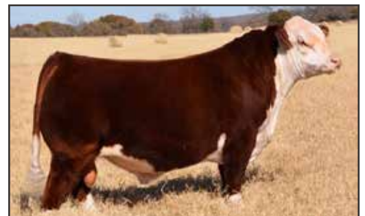
KLD RW MARKSMAN D87 ET Sire of Lot 4