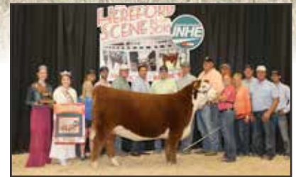
ECR CANDI 5451 ET

EST. DUE TO CALVE 3/20/25 TO GKB 8123 BELLE AIR 1968 (AHA: 44305639).