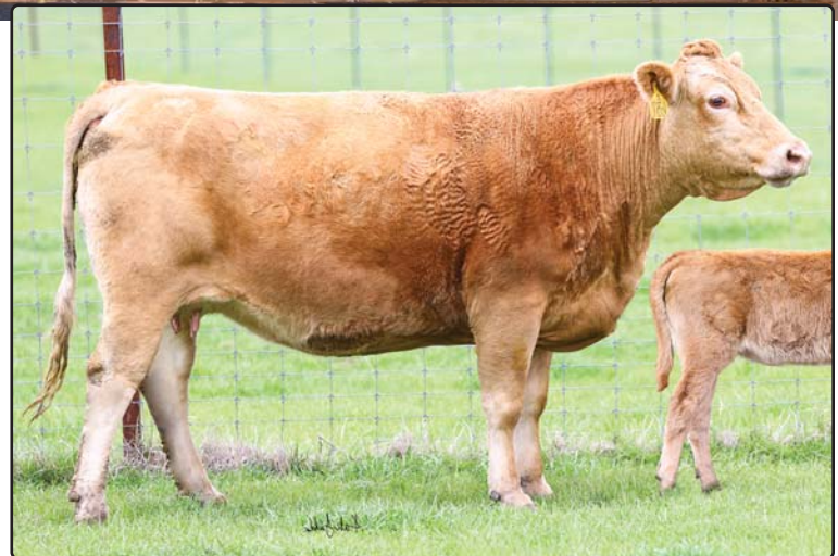
DAM HeartBrand Jennifer 637Z