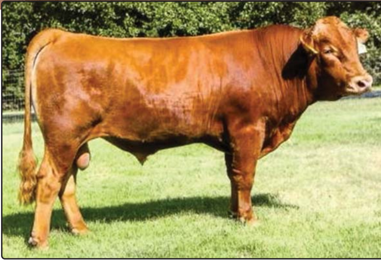
SIRE Rueshaw II