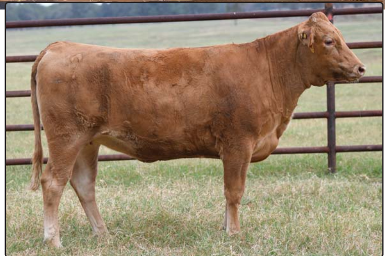
DAM HeartBrand Julia 1736A