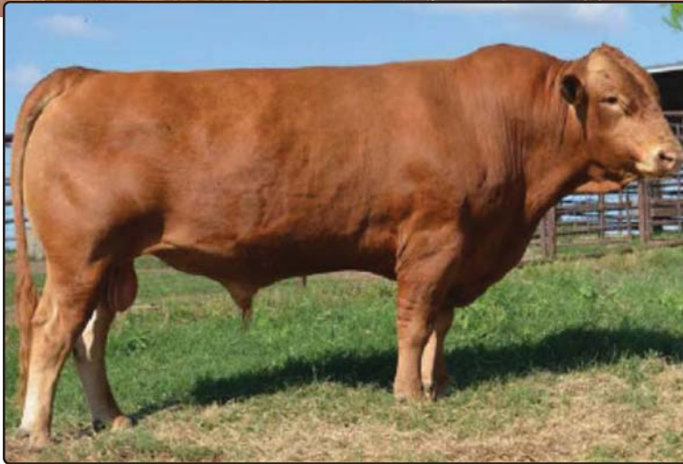
SIRE SOR Big Al