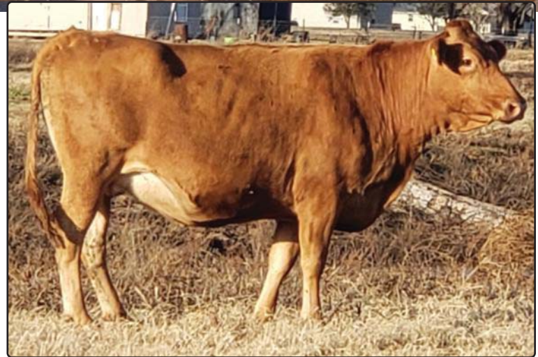
DAM HeartBrand 9787Y