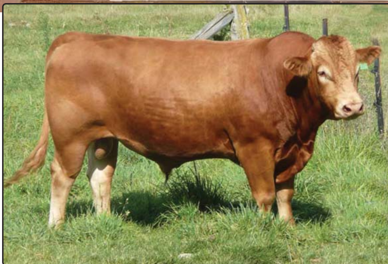
SIRE The Wright Wagyu Master Chef E146