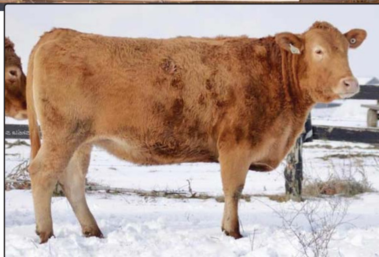
DAM Rapid Bay Asagao ET