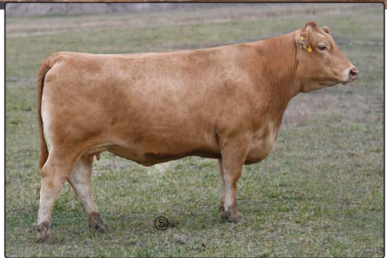
DAM STG Kaedemaru 001D CL