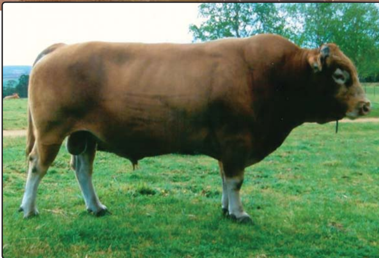
SIRE Ashwood Park Virile