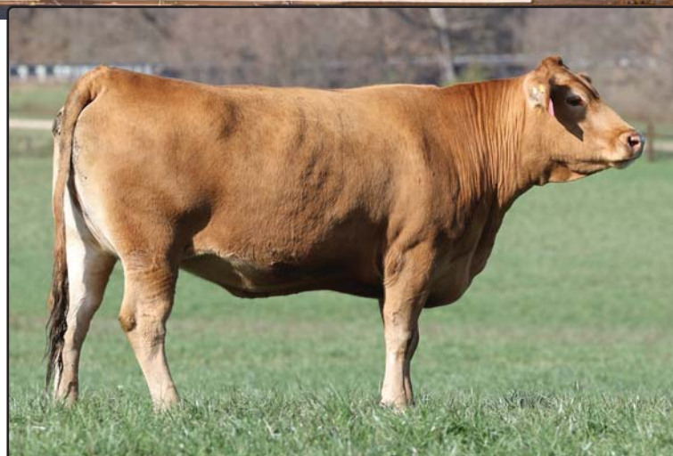
DAM LAG Ms Fairy Princess 1064C