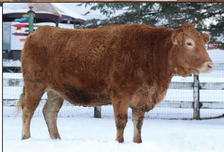
DAM Rapid Bay Akiko