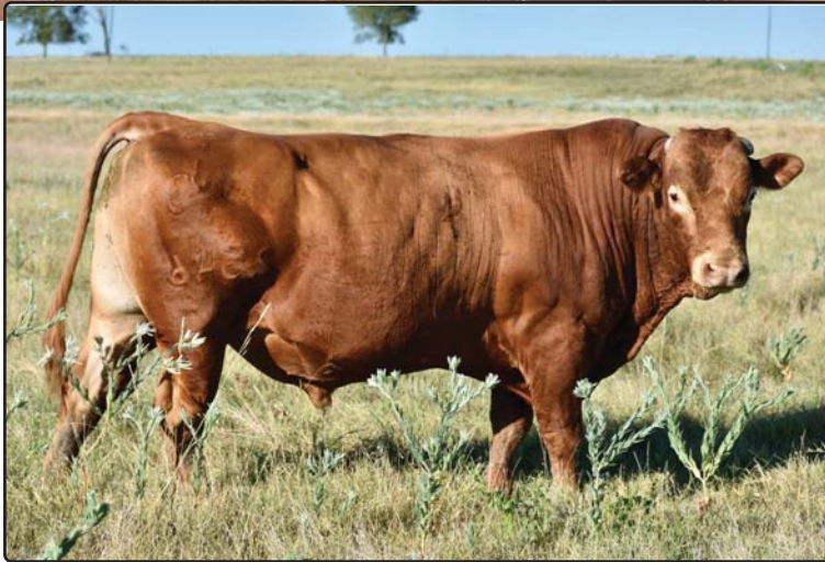
SIRE HeartBrand Excalibur 2546A