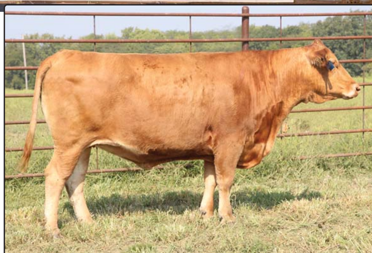
DAM Rapid Bay Natsuki ET