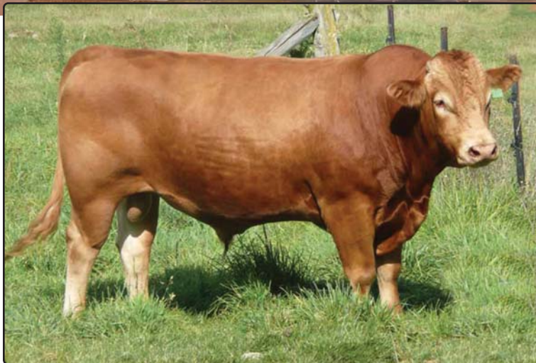
SIRE The Wright Wagyu Master Chef E146