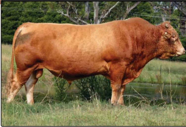
SIRE Academy International P107 ET