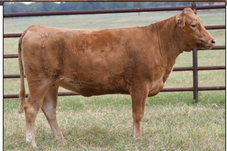
DAM HeartBrand Julia 1736A