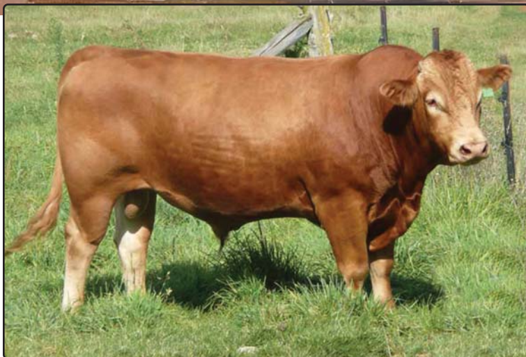
SIRE The Wright Wagyu Master Chef E146