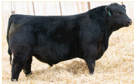
Allison Seminole 121J : Sire to 265, 266, 268, 269 and 272