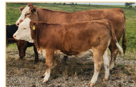
Southpaw Cattle Co.