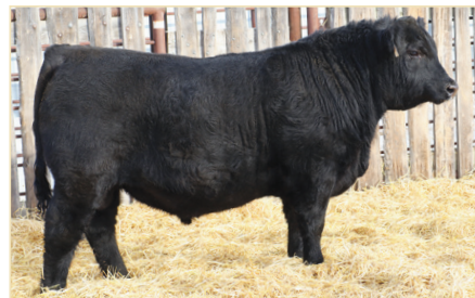
Richmond Jentry SRD 4J : Sire to 310, 312, 314, 322, 330 and 331