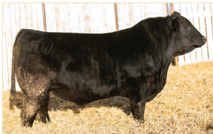
Black Wheel Dracarys 86G : Grandsire to 265, 266, 268, 269 and 272