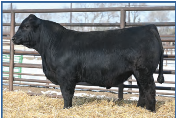
Wulfs Hat Trick 3034M • Sells as Lot 286