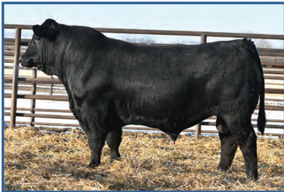
Wulfs Hemisphere 1787L • Sells as Lot 48