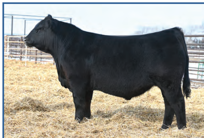
Wulfs Milestone 8704M • Sells as Lot 4