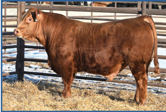
Wulfs Fifty 9723L • Sells as Lot 7