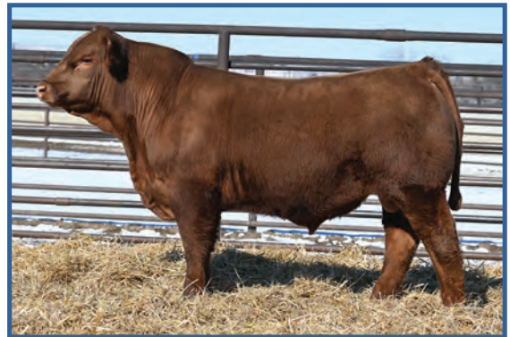
Wulfs Horton 2610M • Sells as Lot 102