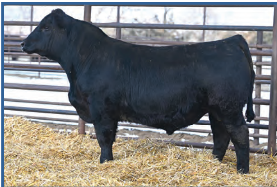
Wulfs John Boy 8120M • Sells as Lot 326