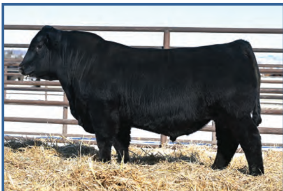
Wulfs Masterpiece 9332M • Sells as Lot 107