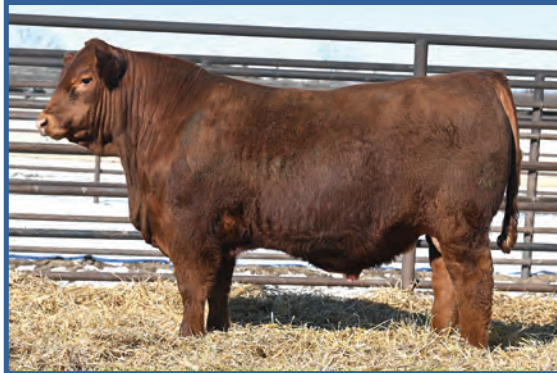
Wulfs Horton 9347M • Sells as Lot 159