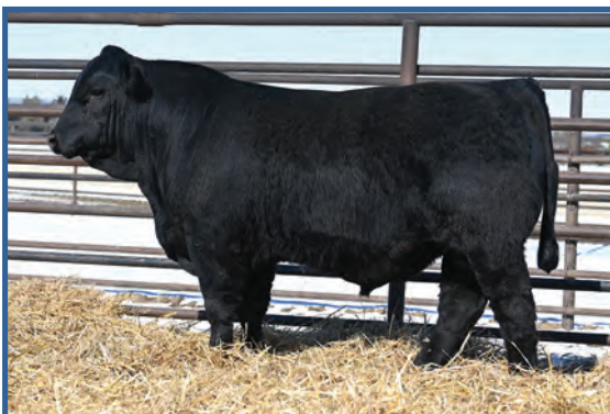
Wulfs Hunker Down 1391M • Sells as Lot 73