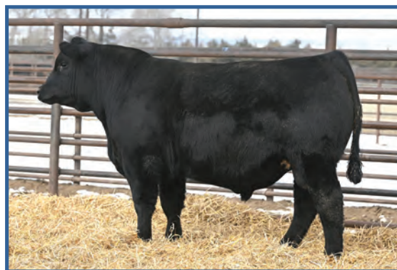
Wulfs Jaywalker 0085M • Sells as Lot 254