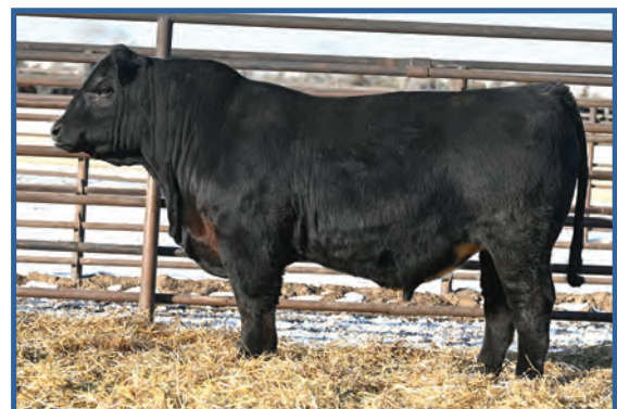
Wulfs Billy The Kid 4416L • Sells as Lot 54