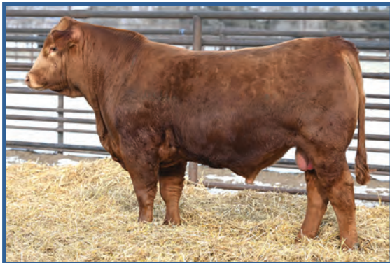
Wulfs Emprize 8804L • Sells as Lot 13