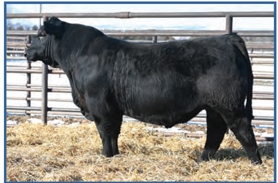
Wulfs Digits 1838M • Sells as Lot 126