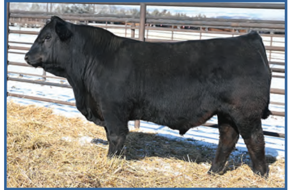
Wulfs Jim Beam 0310M • Sells as Lot 124