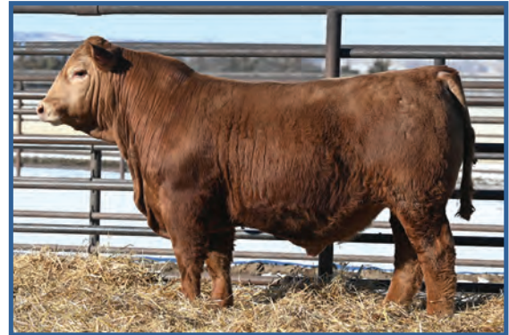
Wulfs Haiti 2139M • Sells as Lot 91