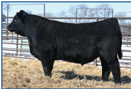
Wulfs Jim Beam 5518M • Sells as Lot 183