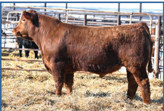
Wulfs Credentials 2643M • Sells as Lot 160