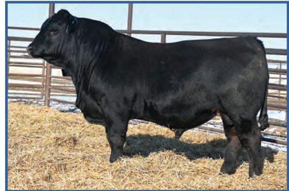
Wulfs Hook 8833L • Sells as Lot 53