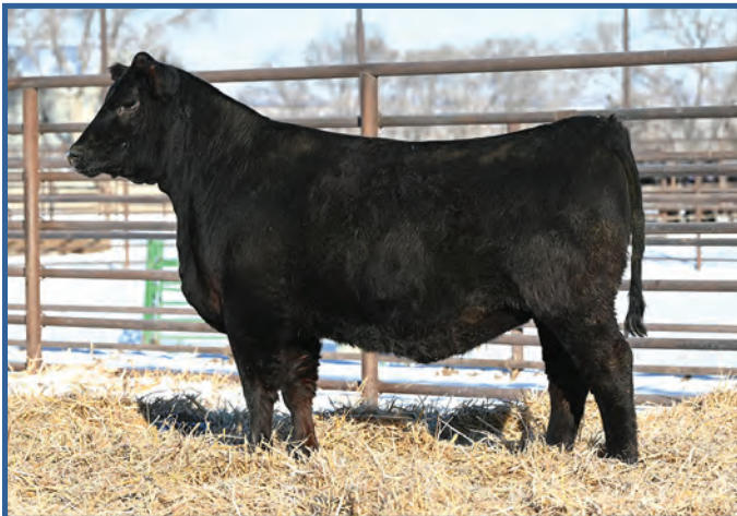
Wulfs Queen Lass 4027M • Sells as Lot 358

358 Wulfs Queen Lass 4027M Angus Cow BD: 1/24/24 4027M 20956475