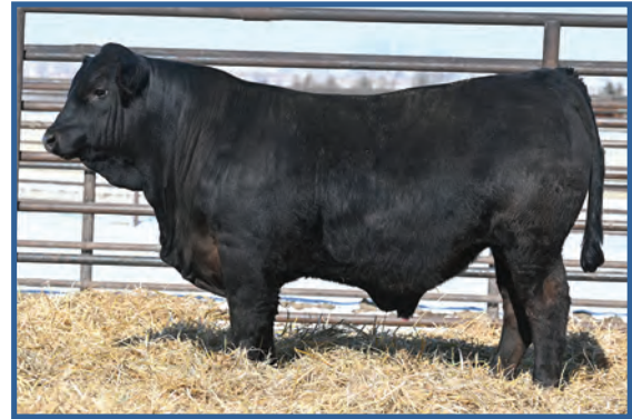
Wulfs Hard To Forget 1595M • Sells as Lot 74