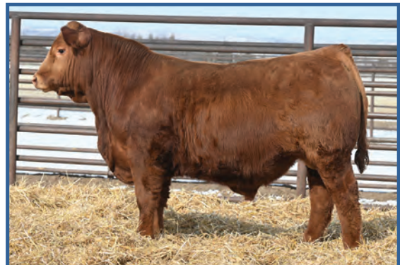
Wulfs Jaywalker 1270M • Sells as Lot 213