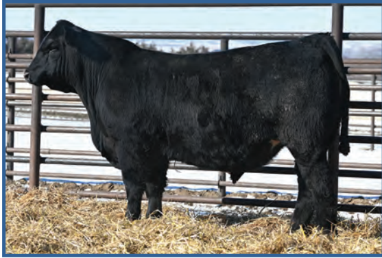
Wulfs Jim Beam 0221M • Sells as Lot 104