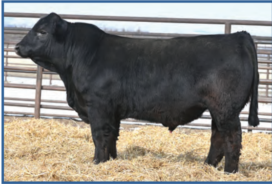
Wulfs Gameboy 7063M • Sells as Lot 228