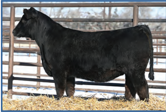
Wulfs Maki 4154M ET • Sells as Lot 351