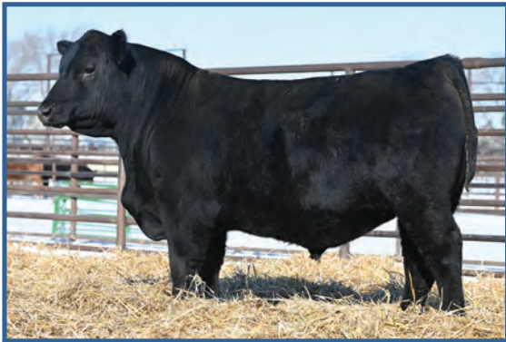
Wulfs Thedford A205M • Sells as Lot 207