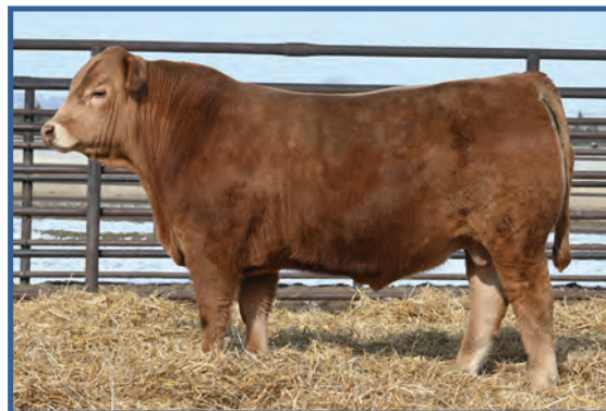
Wulfs Holliday 8271M • Sells as Lot 277