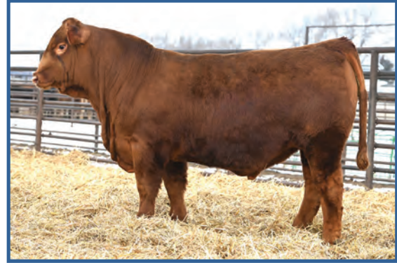
Wulfs John Wayne 9720L • Sells as Lot 8