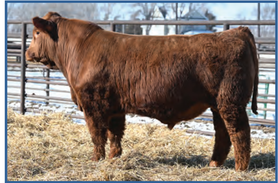
Wulfs Kut Above 5280M • Sells as Lot 90