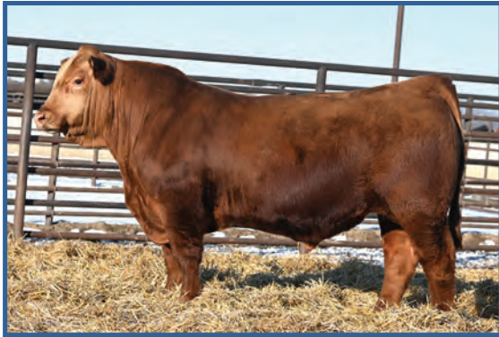
Wulfs Holliday 1823L • Sells as Lot 12