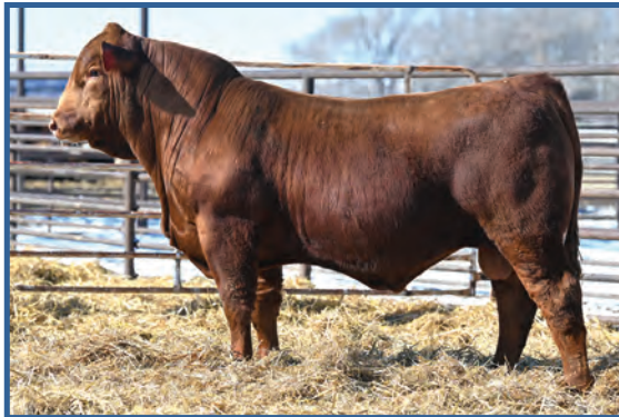
Wulfs Kut Above 6138M • Sells as Lot 158