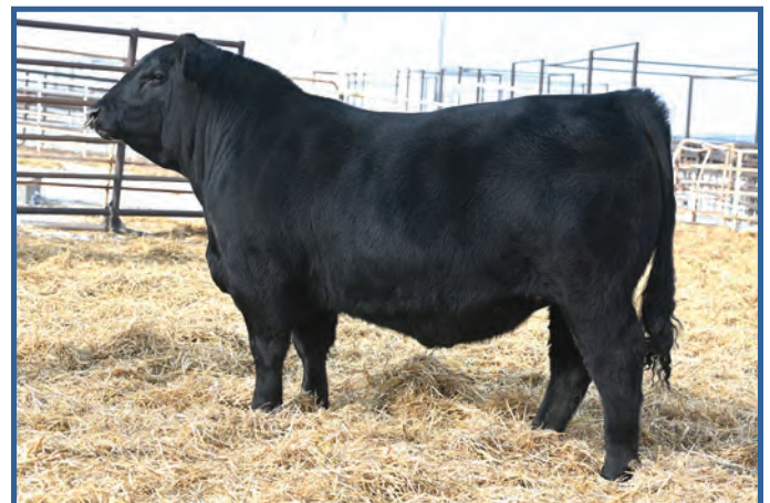
Wuls Moneyline 1568M • Sells as Lot 6