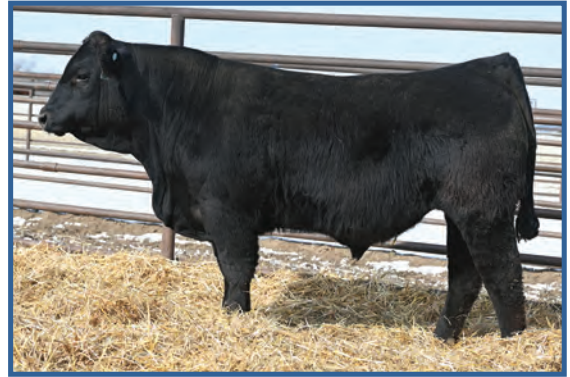
Wulfs Jackpot 814M • Sells as Lot 229