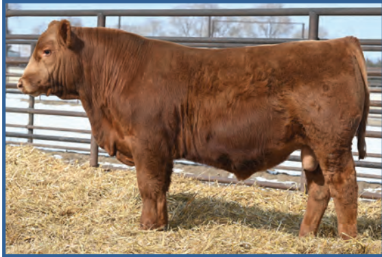
Wulfs Holliday K027M ET • Sells as Lot 281