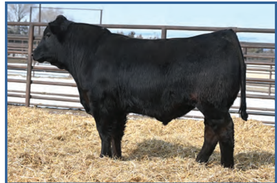
Wulfs Kingsman 0048M • Sells as Lot 226