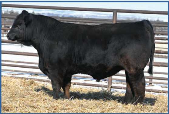
Wulfs Godfrey 1943M • Sells as Lot 130