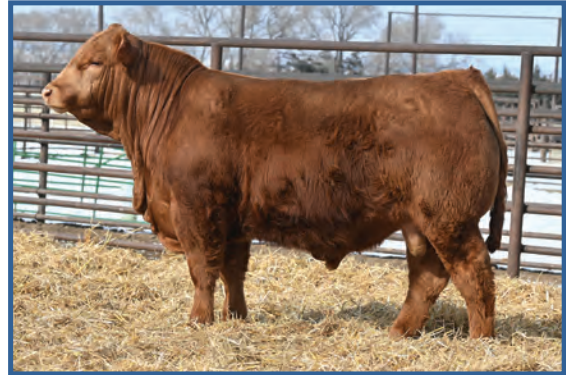
Wulfs Hat Trick 9390M • Sells as Lot 212