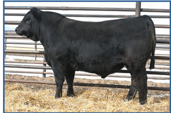
Wulfs Jim Beam 0376M • Sells as Lot 224