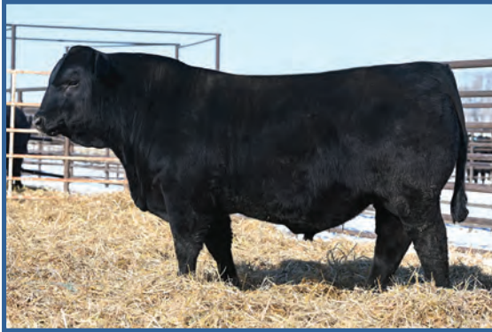
Wulfs Jim Beam 7244M • Sells as Lot 70