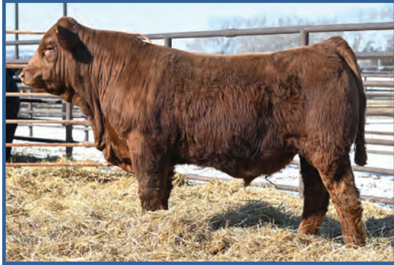
Wulfs Horton K812M • Sells as Lot 93