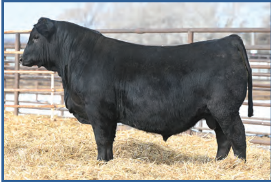
Wulfs Rawhide K504M ET • Sells as Lot 306