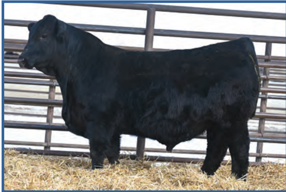
Wulfs Justification 6930M • Sells as Lot 255