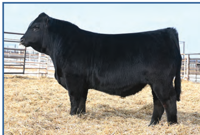
Wulfs Mobridge 8208M • Sells as Lot 2