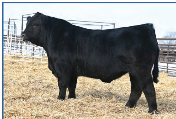
Wulfs McLaughlin 7179M • Sells as Lot 3