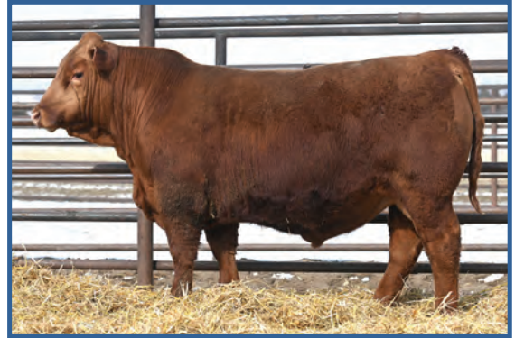
Wulfs Hickok K978M ET • Sells as Lot 282