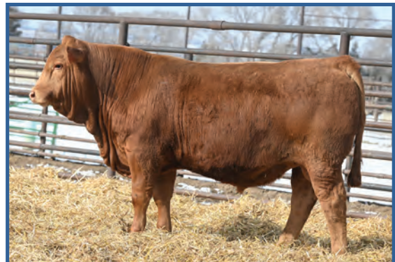
Wulfs Kactus 1113M • Sells as Lot 214