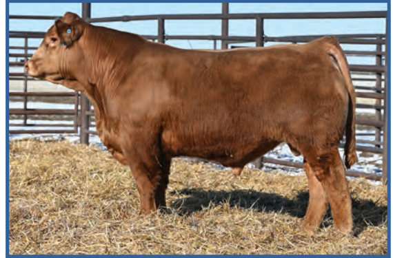
Wulfs Hat Trick 0314M • Sells as Lot 94