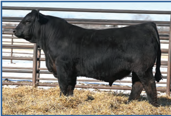
Wulfs Malkin 8228M • Sells as Lot 72