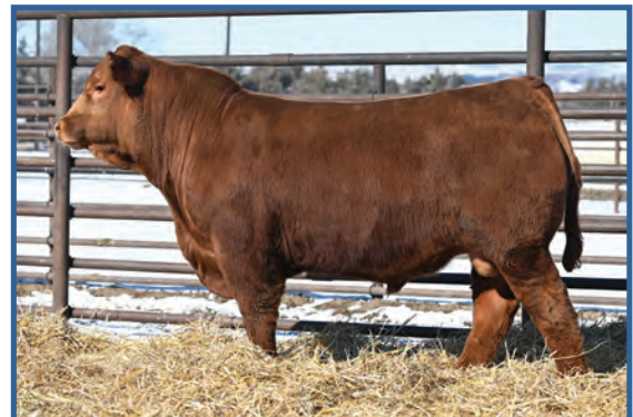
Wulfs Credentials 2025M • Sells as Lot 92