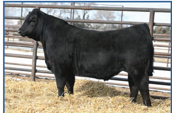
Wulfs Jim Beam 7399M • Sells as Lot 225