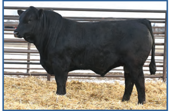
Wulfs Billy The Kid 7651L • Sells as Lot 27