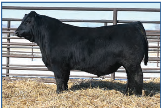
Wulfs Gronk 3910M • Sells as Lot 179