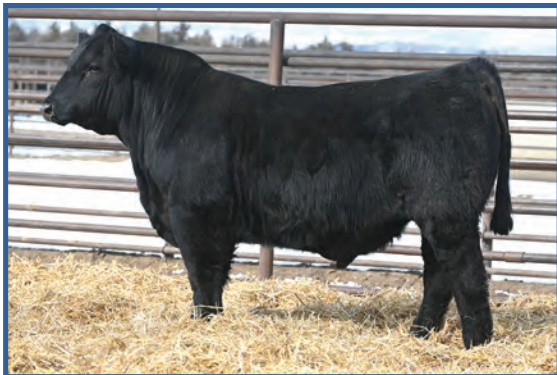
Wulfs Kommando 4918M • Sells as Lot 257