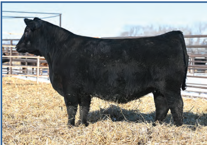
Wulfs Pride 4076M • Sells as Lot 359

359 Wulfs Pride 4076M Angus Cow BD: 1/29/24 4076M 20956459