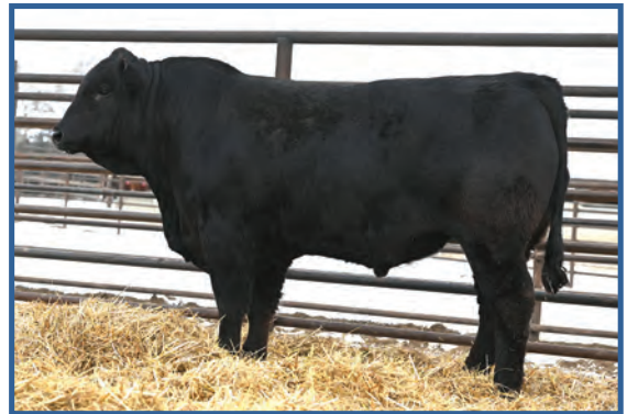
Wulfs Billy The Kid 7653L • Sells as Lot 28