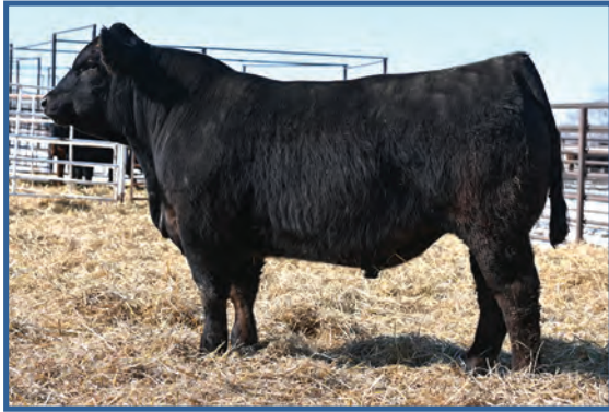
Wulfs Jim Beam 8067M • Sells as Lot 128