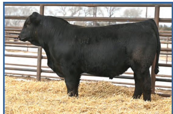
Wulfs Gameboy 6028M • Sells as Lot 227