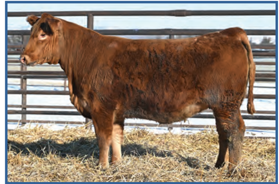
Wulfs Maiara 4112M • Sells as Lot 341