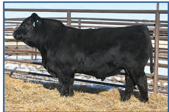
Wulfs Gronk 8768L • Sells as Lot 52