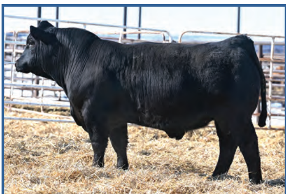
Wulfs Stetson 2212M • Sells as Lot 182