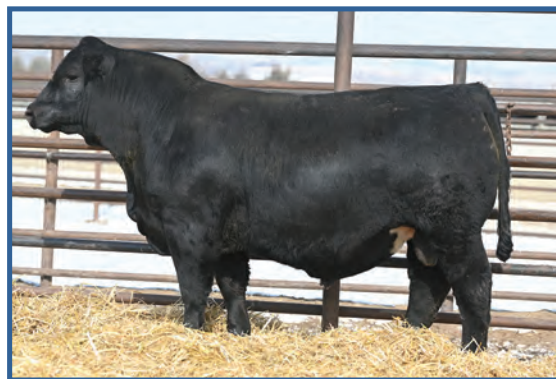
Wulfs Gameboy 9356M • Sells as Lot 253