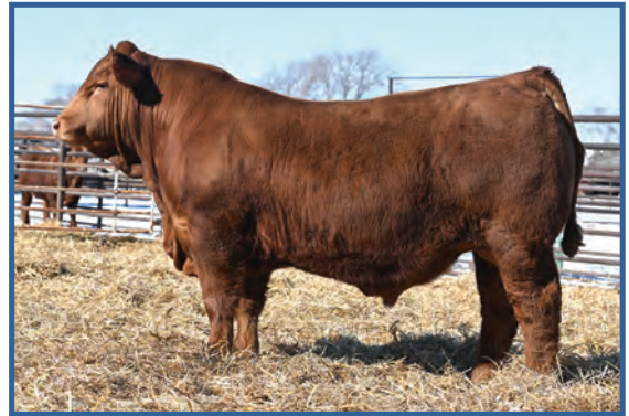
Wulfs Horton 9909M • Sells as Lot 101