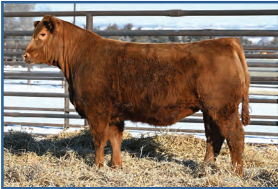
Wulfs Maelie 4061M • Sells as Lot 340