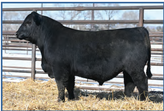
Wulfs Junk In The Trunk 199M • Sells as Lot 181