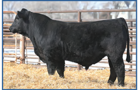
Wulfs Gameboy K376M ET • Sells as Lot 307