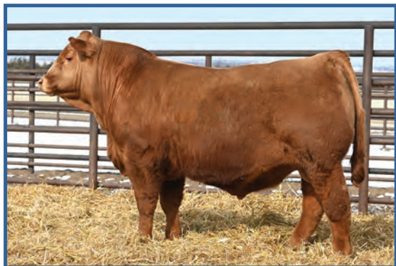
Wulfs Kactus 8298M • Sells as Lot 221