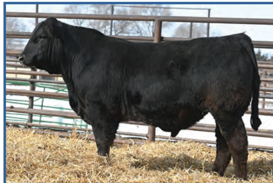
Wulfs Joint Venture 8427M • Sells as Lot 287