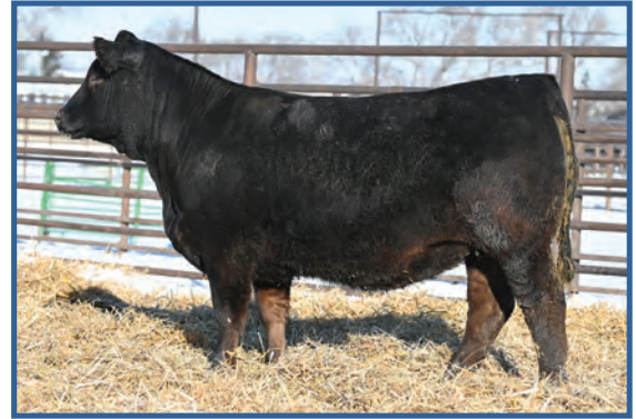
Wulfs Marge 4286M • Sells as Lot 352