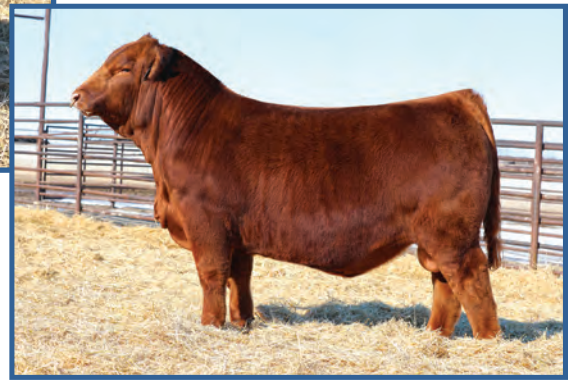
Wulf Kut Above 7118K • Sire of Lot 5