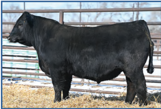
Wulfs Moderator 0110M • Sells as Lot 106