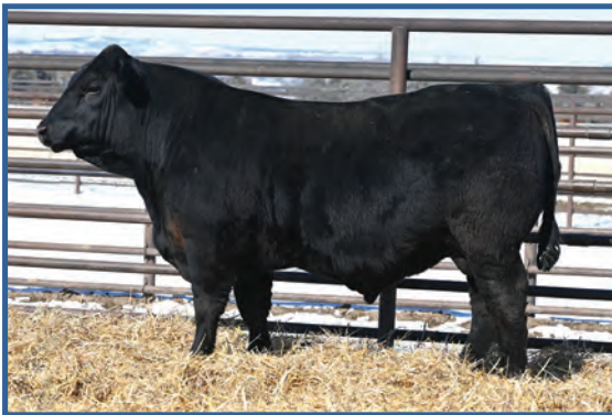
Wulfs Gronk 1410M • Sells as Lot 71