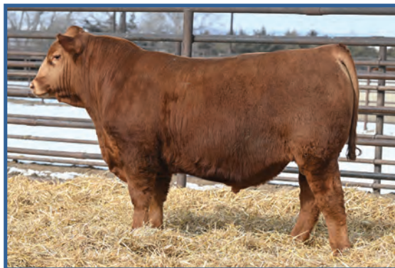
Wulfs Hard Drive K769M ET • Sells as Lot 280