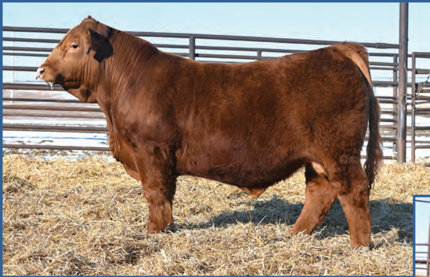
Wuls Miles Above 7026M • Sells as Lot 5