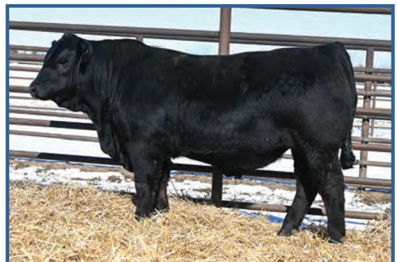
Wulfs Digits 2461M • Sells as Lot 127