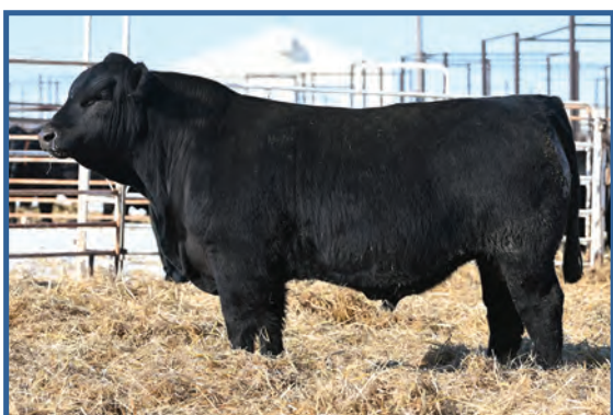
Wulfs Hard To Forget 1232M • Sells as Lot 180