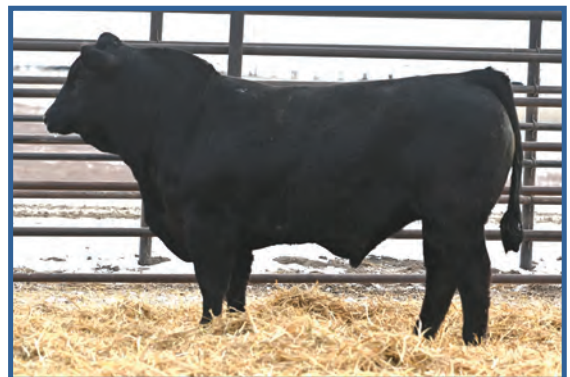
Wulfs Jenga 0967L • Sells as Lot 30