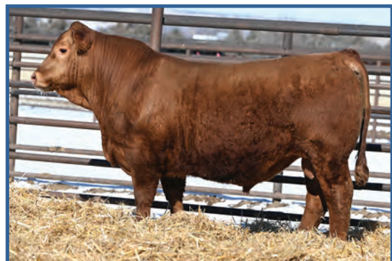
Wulfs Gallagher 1792M • Sells as Lot 171