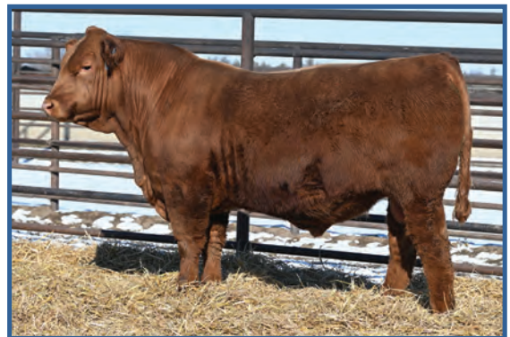
Wulfs Kactus 8219M • Sells as Lot 103