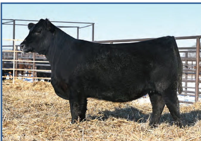
Wulfs Triple Time 4230M • Sells as Lot 360

360 Wulfs Triple Time 4230M Angus Cow BD: 2/18/24 4230M 20956601