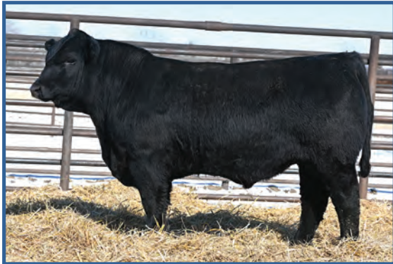
Wulfs Hunker Down 9008M • Sells as Lot 129