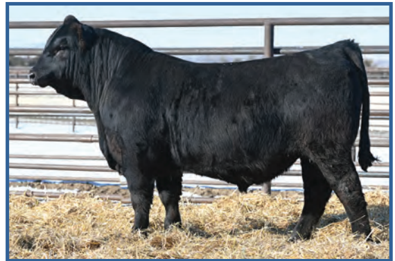
Wulfs Digits 2092M • Sells as Lot 125