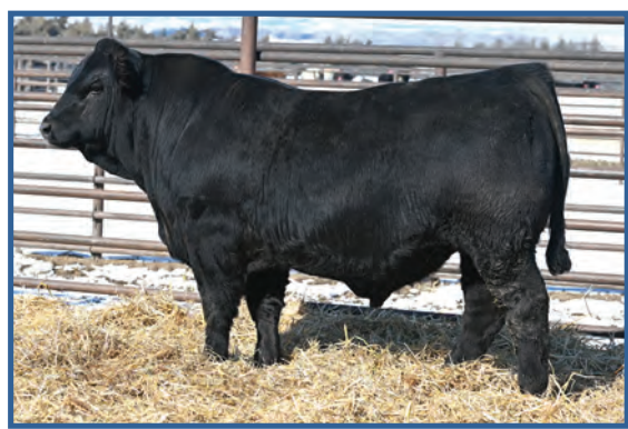
Wulfs Digits 1856M • Sells as Lot 178