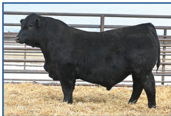
Wulfs Modifier K501M ET • Sells as Lot 305