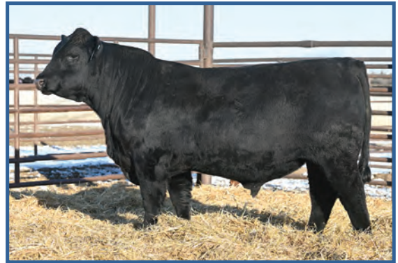
Wulfs Gamer 8944L • Sells as Lot 29