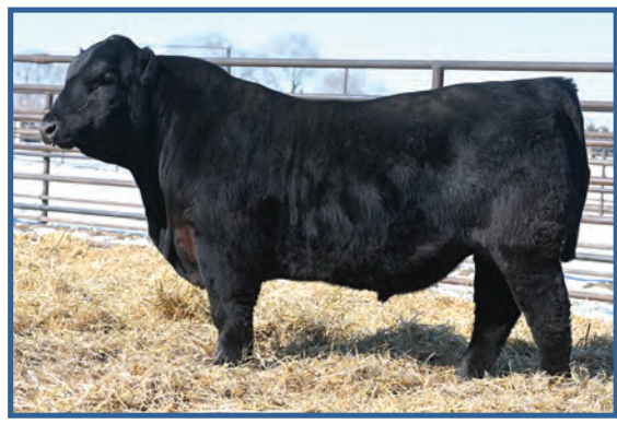
Wulfs Hunker Down 7904M • Sells as Lot 177