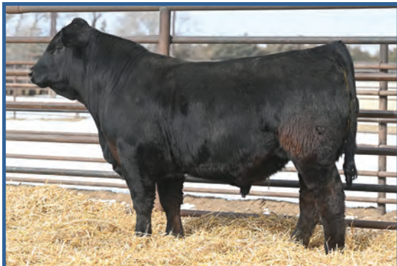
Wulfs Kingsman 0530M • Sells as Lot 256