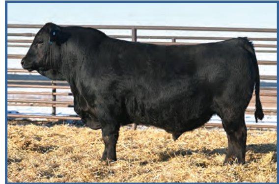
Wulfs Winchester 6334L • Sells as Lot 51