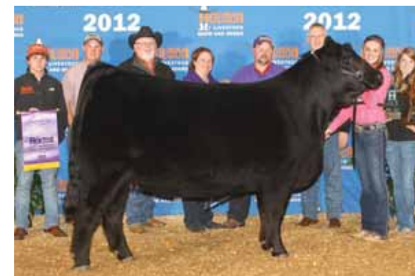
SBLX Xtra Special, dam of Lot 4 embryos.

SBLX Xtra Special 214X? beautiful female and a past Houston Open Show Champion Limousin Female. Her perfectly engineered skeleton and stunning maternal profile made her not only a 'can't miss me' female in the show ring, it also has made her one of the highest valued young donors in the breed at $106,000. The DHVO Deuce/MAGS Manuela mating has produced some of the finest cattle to set foot on ground, and SBLX Xtra Special is no exception. This maternal sister to SBLX Znote, is the dam of lots 1,2 and 3 in our 2015 Texas Traditions sale. Already, she has recorded an impressive WW ratio of 107 and YW ratio of 108 on 15 progeny. MAGS Manuela, arguably one of the superior cows to shape any breed.