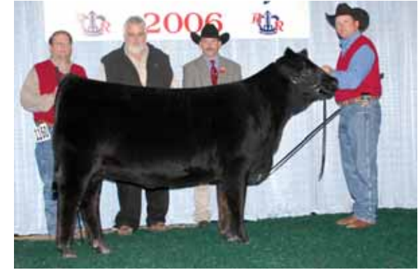
BOHI Red Robin 282R, dam of Lot 33.

- If you want a female that will add notoriety to your program then consider this young first calf heifer