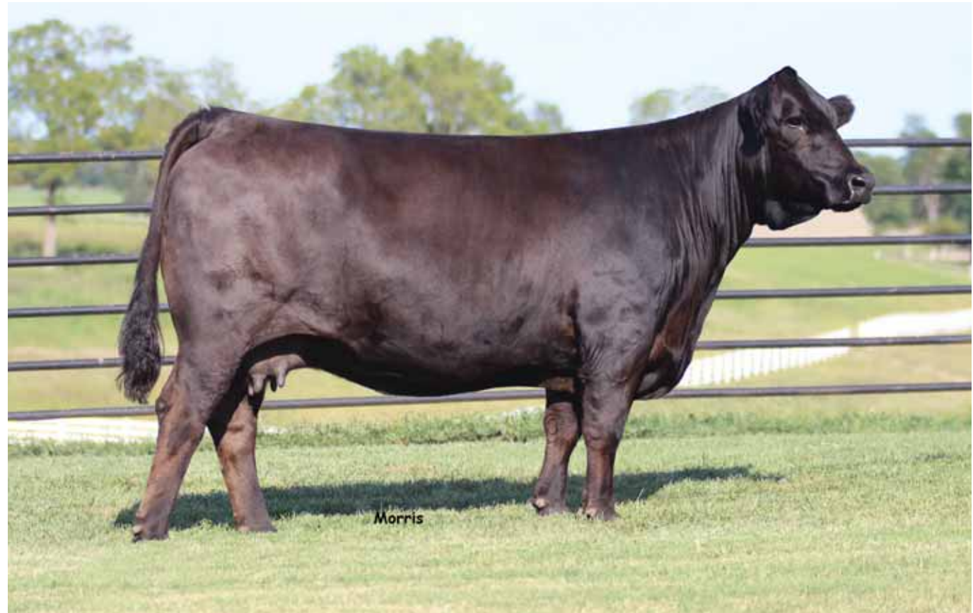
MAGS Manuela, dam of Lot 5.