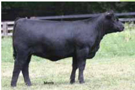
SBLX Yahoo, dam of Lot 29.