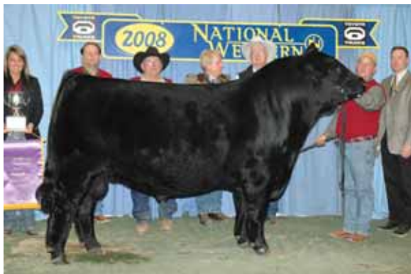
DHVO Deuce 132R, sire of Lot 30.