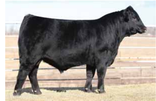
MAGS Bronson 2226B, service sire of Lot 17.