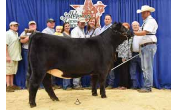
ELCX Candy 330C, All-American Futurity Supreme Champion Female.