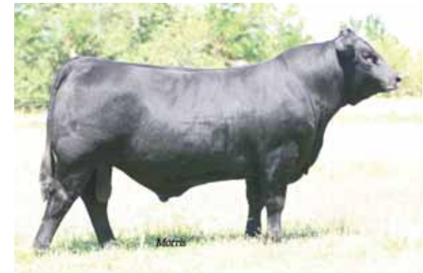
EBFL Ypsilanti 420Y, sire of Lots 17 and 18.