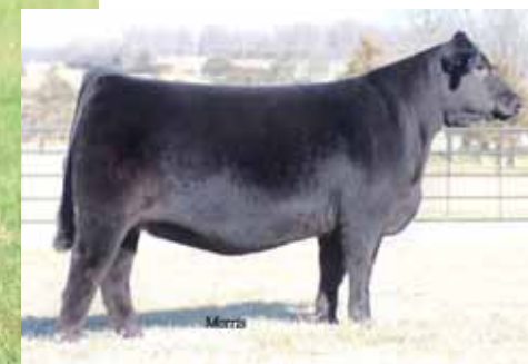
AUTO Bliss, full sister to Lot 6.