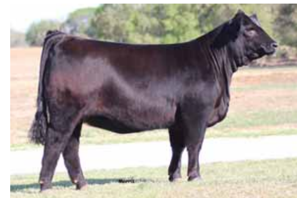
SBLX ZNote, dam of Lot 3 embryos.