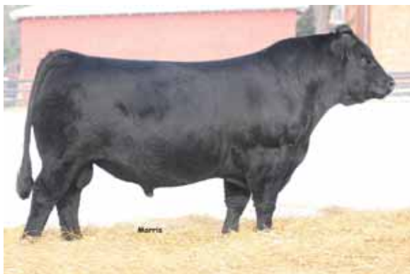
SBLX First Class, service sire to Lot 22.