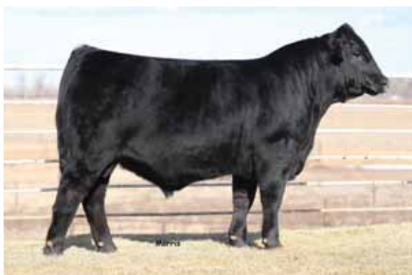
MAGS Bronson 2226B, service sire to Lots 30, 31 & 32.