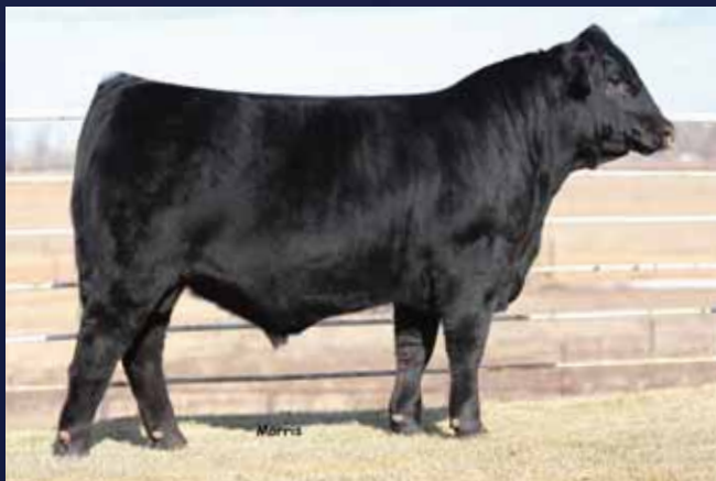
MAGS Bronson 2226B

They were time bred on May 12, 2016 to MAGS Bronson and then pasture exposed to Stowers and Coyote Hills Lim-Flex bulls.