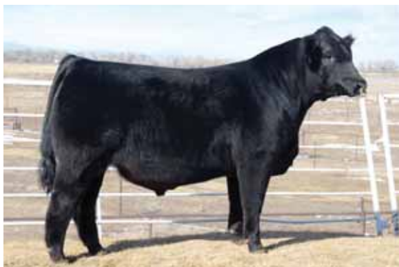
MAGS Zincograph, sire of Lot 21.