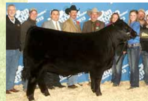
PBRS Your The One 1134Y, dam of Lot 8.