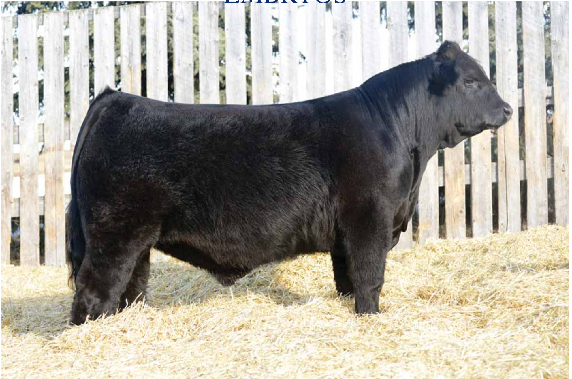
Riverstone Crown Royal, sire to Lots 2, 3 and 4 embryos.