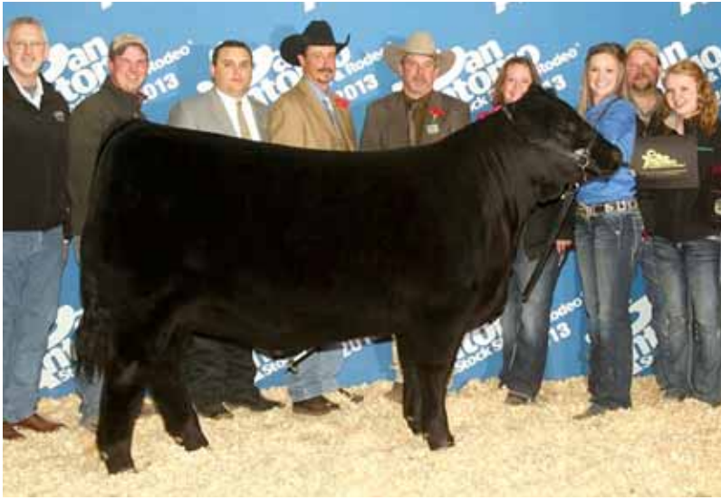
SSTO Your The One 1134Y, dam of Lots 10 and 11.