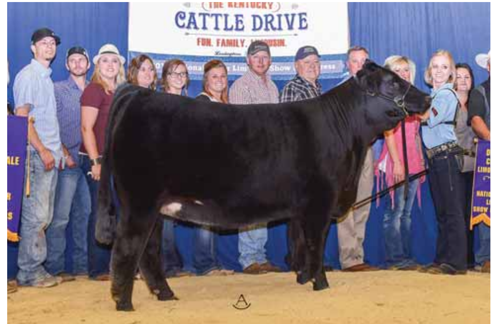
Riverstone Charmed, full sister to Riverstone Crown Royal.

$3,000 for a 3% semen share which gets the buyer 40 units of semen and after one year off the open market then the buyer will get 3% of the future semen sales.