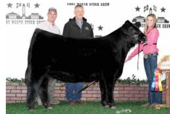
SSTO Watercolors 9450, dam of Lot 2 embryos.

SSTO Watercolors 9450 is a maternal sister to PBRS Your the One out of the highly used sire of champions, MAGS Savage. SSTO Watercolors was herself a champion at the 2011 Fort Worth Stock Show and Rodeo, her picture doesn't lie, her show ring presence is surpassed by very few. She is extremely eye appealing, straight lined and thick ended. Being a direct daughter of the P Bar S and Edwards Limousin donor, Carrousel Pina Colada increases her value quite a bit to us. We feel that anything tracing back to that dominant cow family adds a level of predictability that we can bank on. Like her maternal sister, she is homozygous black and we look to her to excel as a purebred foundation female.