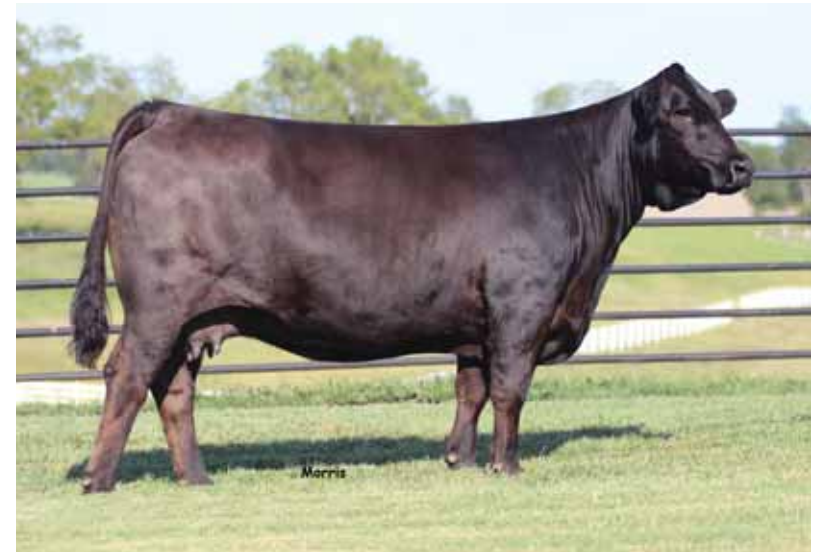
MAGS Manuela, dam of Lots 12 and 13.

MAGS Manuela made her mark in the Limousin breed as the top money generating female of all time. She is the black purebred daughter of EXLR Limited Edition that consistently produced excellence for owner Sugar Bush over the past several years. She has left many daughters in our breed that have produced excellence and have topped sales across the land.