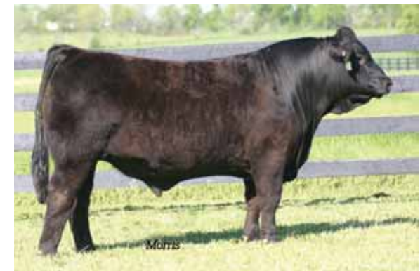
ENGD Yard Machine 1023Y, sire of Lot 19.