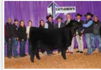
CONLEY FRKG QUEEN MEG 1085 Maternal Sister to Lot 64 Embryos