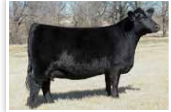
CONLEY SANDY 5104 Full Sister to Lot 65 Embryos