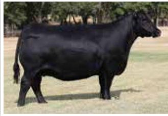
CONLEY SANDY 8104 Dam of Lot 63 Embryos