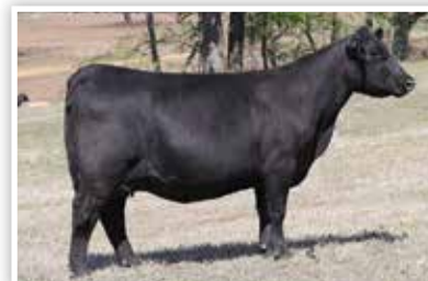
CONLEY SANDY 8355 Dam of Conley Red Zone 1121