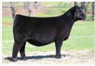
CONLEY DT MISS LUCY 3701 Full Sister to Lot 58 Embryos She Sells as Lot 40!