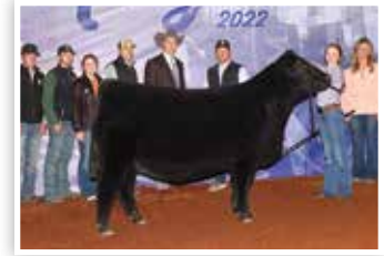
DIECKMANN LADY 1117 Dam of Lot 61 Embryos