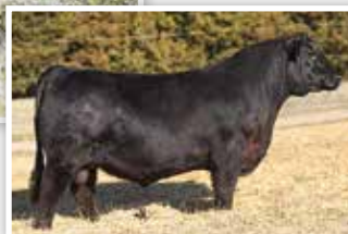
C-4 GCC PLAY IT SAFE H420 Sire of Lot 49

- We admire this female for her flawless build, bold rib design, and futuristic look of quality. The Maine-Anjou Junior Nationals is just a short drive up the road in Springfield, Missouri. Anyone that has ever taken their family always raves about what a fun and family oriented week the AJMAA does hosting this event. Bid with confidence, this female is very high quality!