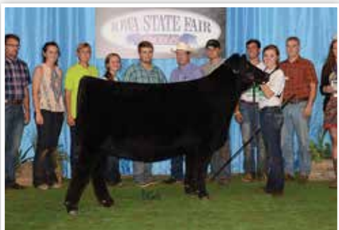
PLUM CREEK ANNIE LU 4472 Paternal Granddam of Lots 34 & 35