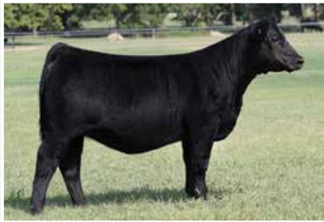
CONLEY MADDIE 3157 $220,000 Full Sister to Lots 19-27

- 3618 has been a standout since day one, offering a supreme look of quality and eye appeal that is hard to mirror. Much like her sisters, she is elegant in terms of her pattern with an ultra-high quality build that is sure to go the distance!