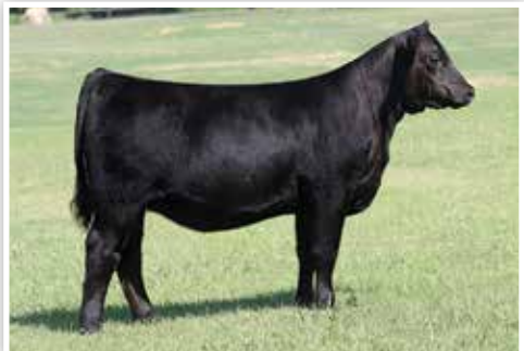
CONLEY MADDIE 3213 Full Sister to Lot 19