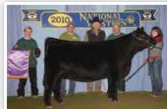
LLSF CAYENNE UP401 Maternal Granddam of Lot 48