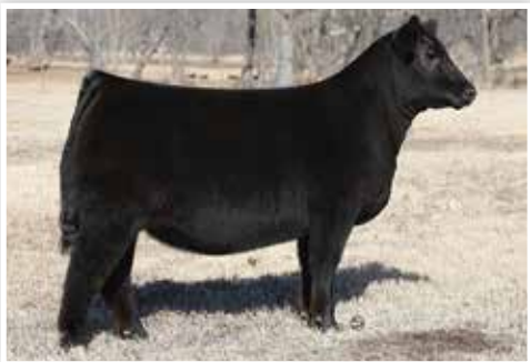
CONLEY DT BLACKBIRD 1067 $15,000 Maternal Sister to Dam of Lot 42