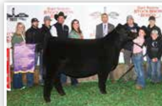
BK JELLY YUM 109J 2022 FWSS Grand Champion Maine-Anjou Heifer & Dam of Lot 49