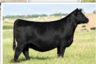
HOFFMAN PEG 9539 Full Sister to Dam of Lot 47