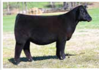
CONLEY DT BLACKBIRD 3910 Maternal Sister to Lot 59 Embryos She Sells as Lot 42!