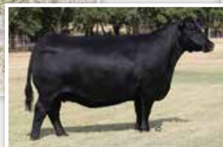
CONLEY SANDY 8104 $75,000 Maternal Sister to Lots 9 & 10