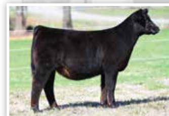
CONLEY DT GEORGINA 3807 Full Sister to Lot 66 Embryos She Sells as Lot 32!

PACKAGE 65A - Mated to EXAR Blue Chip 1877B 4 conventional embryos