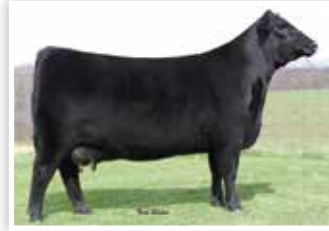
CHAMPION HILL GEORGINA 8547 Dam of Lot 60 Embryos