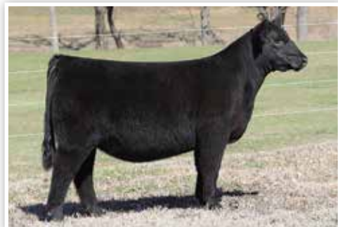
CONLEY DT SANDY 2900 $140,000 Full Sister to Lot 13

- Her neck attachment comes high out of the topside of her shoulder, while remaining big topped and bold in her rib cage. She is stout hipped and wide pinned. This female will be a fun one to campaign at every stage and competitive at every level!