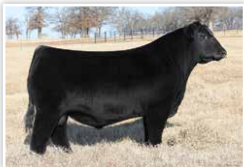
CONLEY LEAD THE WAY 0738 $920,000 Valuation Sire of Lot 18