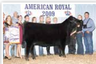
K N C CABIN CREEK SANDY 804 Legendary Maternal Granddam of Lots 4-10