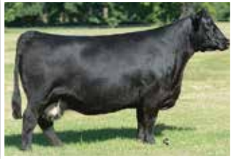
SILVEIRAS S SIS SANDY 2355 Dam of Lot 62 Embryos