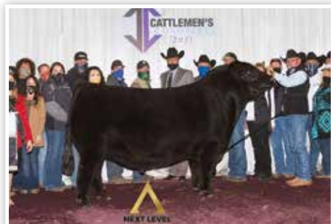
SILVEIRAS FORBES 8088 Sire of Lot 37