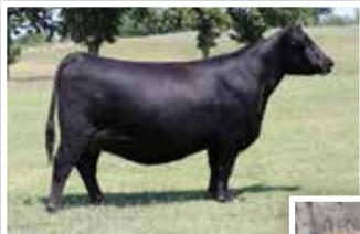
CONLEY DS SANDY 0213 Dam of Lot 11