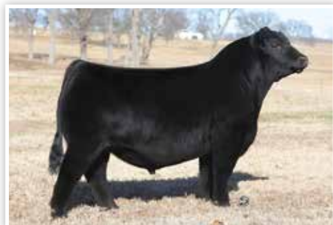
CONLEY DS CLEAR CUT 0510 Sire of Lot 45