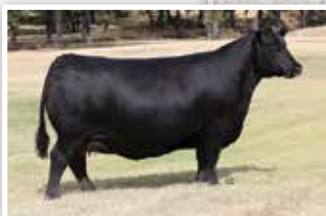
CONLEY SANDY 7350 $90,000 Granddaughter of K N C Cabin Creek Sandy 804