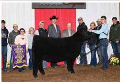
CONLEY MADDIE 3157 2023 Hoosier Beef Congress 4th Overall Junior Breeding Heifer & Full Sister to Lots 19-27