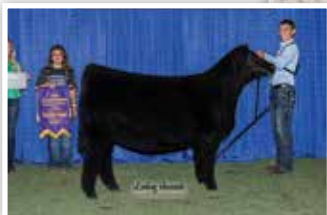
CONLEY SANDY 2300