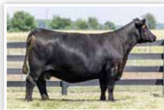
GAMBLES LADY 1084 Maternal Granddam of Lot 44