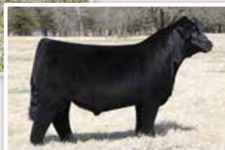
R/C SFI CREEDENCE 417J Sire of Lot 48