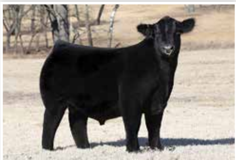
CONLEY A 1 $100,000 Sire of Lots 42 & 43