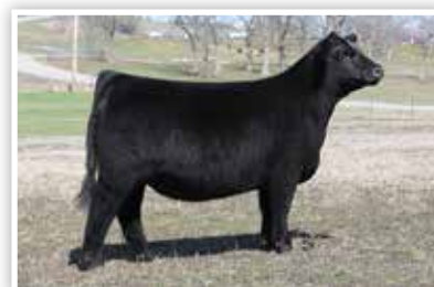
CONLEY BELL SANDY 2662 $40,000 Full Sister to Conley Bristow 2317