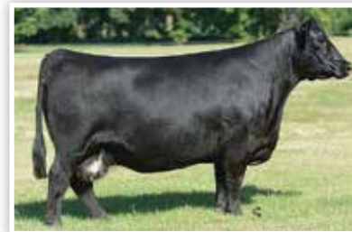
SILVEIRAS S SIS SANDY 2355 Dam of Conley No Limit

- Owned with Schaeffer-Tice Show Cattle.