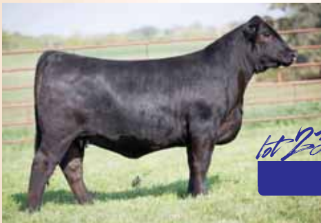
CJSL 6097D ET