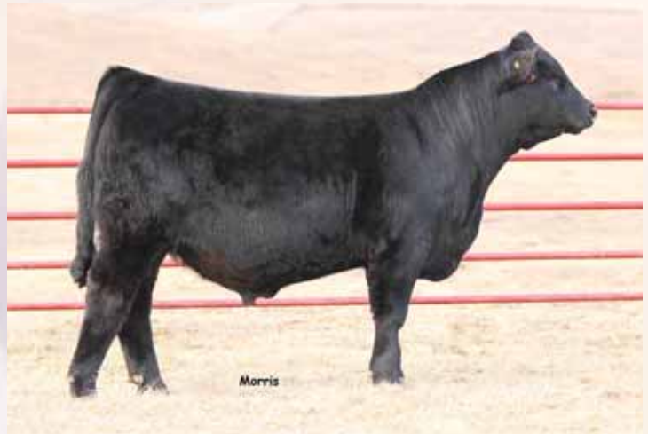
LBS BANK ACCOUNT 8116B, sire of Lot 48.

Here is a purebred Limousin female and we are certain is one that you are definitely going to like. She is sired by the now deceased but highly syndicated sire LVLS Bank Account. He is the big numbered son of MAGS Wazowski that ranks in the top 1% of the breed in gestation, weaning weight, carcass weight and top 2% for yearling weight. This female is just a first calf heifer that is sound made, easy on the eye and has a stout made bull calf at her side.