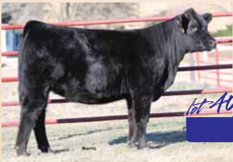
LVLS Deep Dish 308D