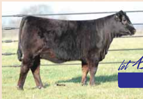
MCBN Cherry 510C