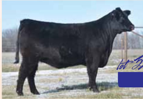
JCL Keilma 511C