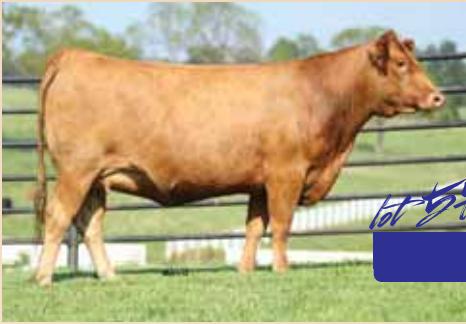
AUTO Cheyenne 639C