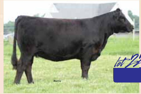
ELCX Clone Me 67C