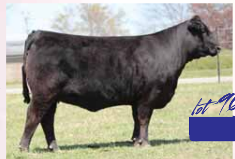
OCCC Delani 400D