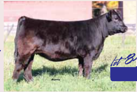
SBLX 625D ET