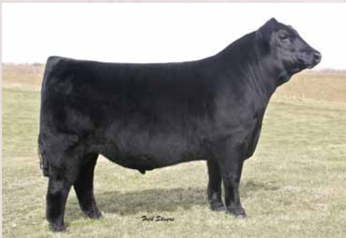
MAGS Y SO TANGLED, sire of Lot 137.

believes in a firm handshake and the integrity needed to move forward in life with their faith strongly with them!