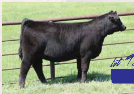
SSTO SULL Down Under ET