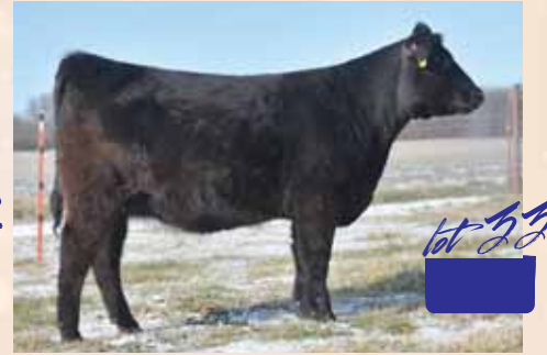
JCL Spirit LNLN 515C