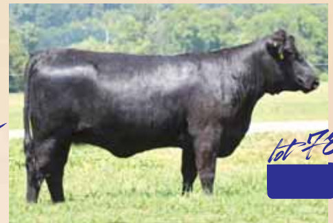
RVF Classy 688C