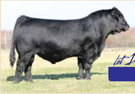
AUTO Direct Drive 107D ET