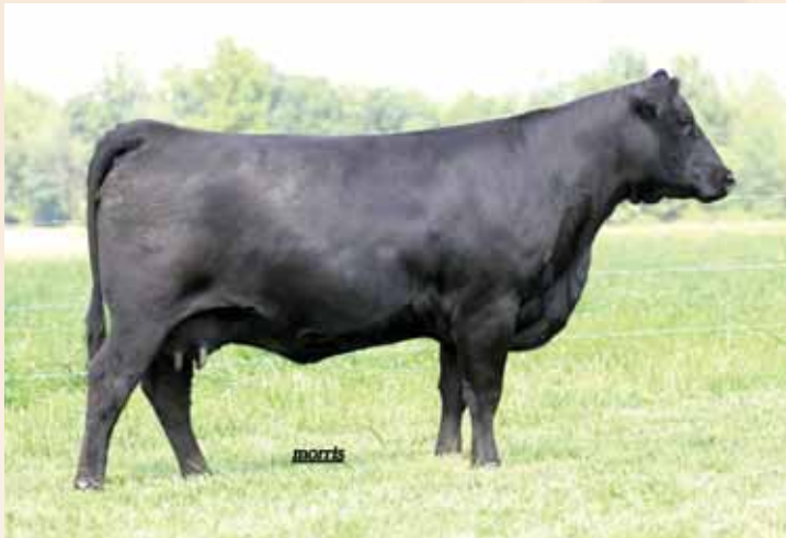
GPFX BLAQUE DESTINY, dam of Lot 130.