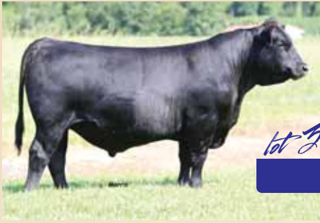
ELCX Camp Fire 508C ET