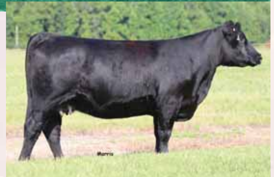
PBRS AUDREY 346A, dam of Lot 17.