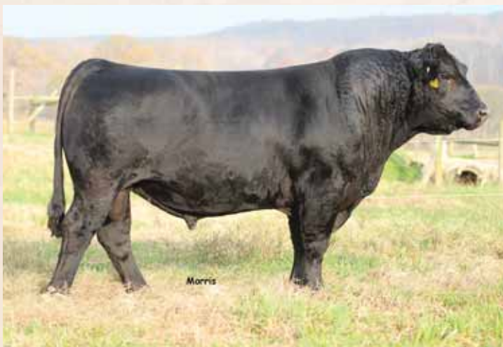
ELCX BALANCER 170Z, sire of Lot 132.

If you're looking to add more performance across the board in your herd-look no further. OCCC 323D is a breed leader in the marbling department with a 0.71 and her yearling weight ranks in the top 20% of the breed. This daughter of ELCX Balancer 170Z is homozygous polled and double black. Her dam is the chart-topping marbling and SMTI proven donor for P Bar S Ranch, PBRS All In White 323A. This 40% Lim-Flex female is a coming two-year old that will be the easy-keeping kind.