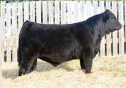
RIVERSTONE CROWN ROYAL, sire of Lot 18 embryos.