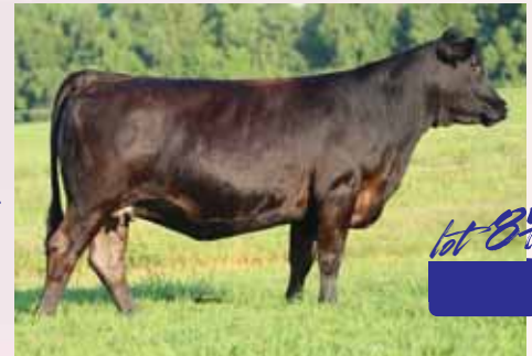
ELCX Bea 572B