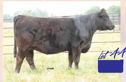
MCBN Bootylicious 409B