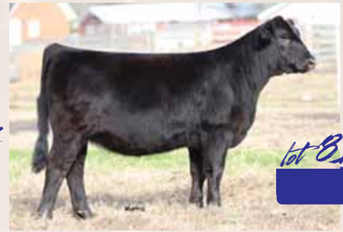
ELCX Double Dip 621D ET