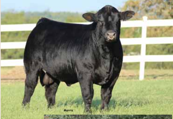
RLBH DAYS OF THUNDER, sire of Lot 14 embryos.