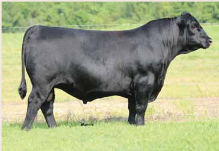
ELCX BENCHWARMER 363B, sire of Lot 138.

ELCX Emery is a 40% Lim-Flex daughter of ELCX Benchwarmer 363B, a son of MYTTY In Focus. Her dam is a daughter of MAGS Teddie and goes back to the donor CFLX Cookie Cutter 066U. This young female ranks in the top 1% of the breed for marbling with a .61 and top 3% of the breed for MTI with a 69.83.