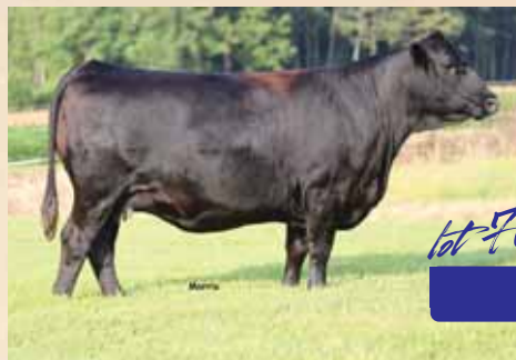
ELCX Lady A W355A