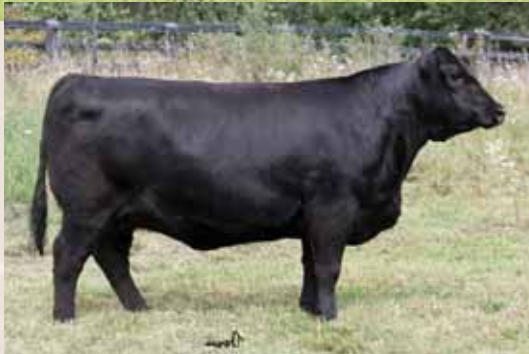
SBLX ZERO PERCENT, dam of Lot 14.