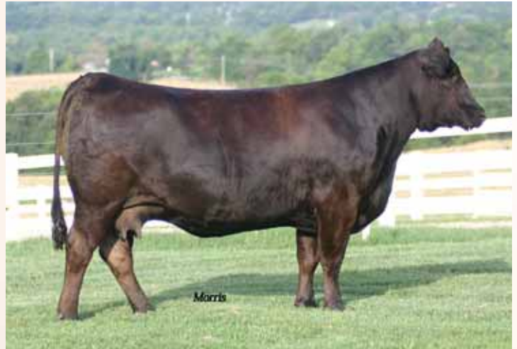
AUTO EXCEPTIONAL 282S, dam of Lot 110.

Here is a female that offers functionality, doability and a set of breed-leading EPDs. AUTO Emma 400B ET is an impressive daughter of EXAR Denver 2002B. Denver is the youngest bull whose first calf crop ranked him among the Top 25 sires of progeny registered in 2014 in the Angus breed. He set a sales record at America's largest seedstock operation, Express Ranches, when he sold one-third semen interest for $340,000. AUTO Emma has an impressive marbling EPD, 0.55 that ranks in the top 4% of the breed and yearling weight in the top 10%. So much proven and consistent power is stacked in this female's favor and we are confident she will make a great addition to any herd