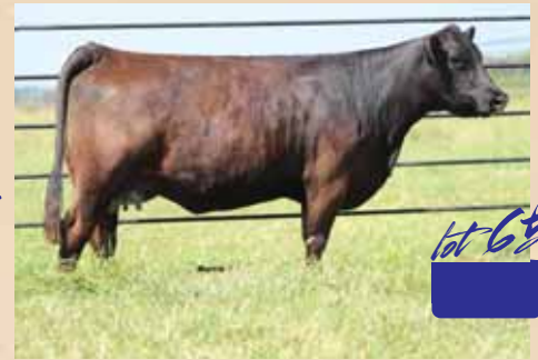
MCBN Amarina 392A