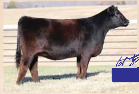
AUTO Rhonda 255C ET