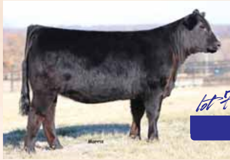
AUTO Brunetta 266B