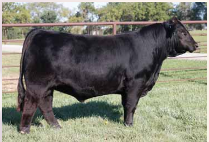
PBRS HOUSE OF CARDS 698D, service sire to Lots 93 - 95.

Here is a solid producing commercial female. She is solid in her make-up and very easy to maintain in her condition. She has done a top job in production in the last year and we feel she has and even brighter future.