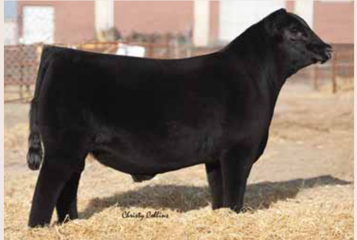
SILVEIRAS STYLE 9030, sire of Lot 16 embryos.

What a future there will be when these calves hit the ground -Sired by the leading Angus sire of champions, Silvieras Style. The Style bull has been the leading Angus sire to use in the creation of Lim-Flex cattle. MAGS Xray is the leading purebred donor for White Valley Ranch. She is a daughter of the national champions DHVO Deuce and from MAGS Ramada. The lineage behind this female is like no other and as been some of the very finest in the entire breed. This is a mating that will add a tremendous amount of value and promotion to your program.