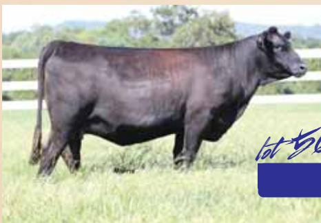
PBRS BRITTA 4143B