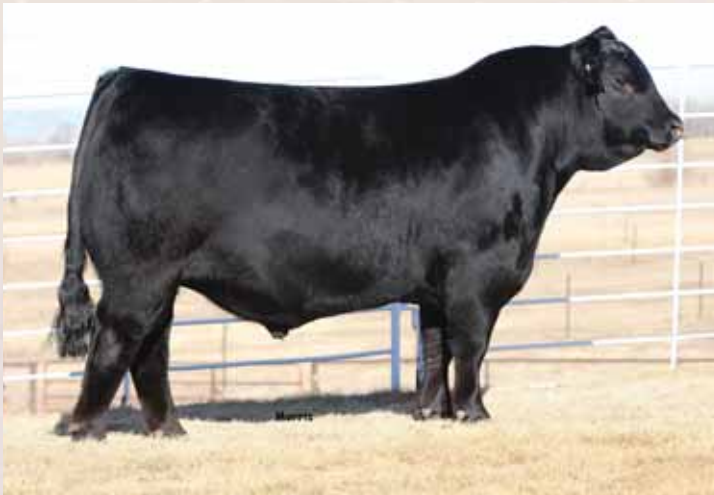
MAGS CABLE, sire of Lot 19 embryos.