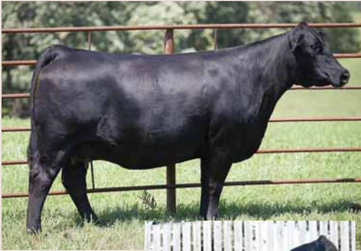
MAGS XTRA REST, dam of Lot 18, 19 & 20.