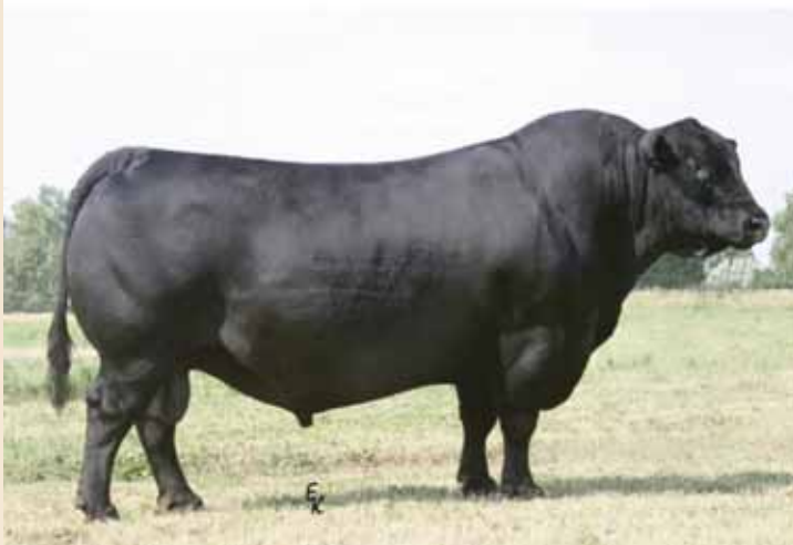
S A V FINAL ANSWER 0035, paternal grandsire of Lot 55.