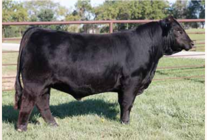
PBRS HOUSE OF CARDS, service sire to Lot 24.

This 50% Lim-Flex female is a moderate framed and very deep bodied first calf heifer. She is a daughter of EXAR Blue Chip and from AUTO Poppy 421Z. AUTO Poppy 421Z is a daughter of AUTO Cruze and from the famed MAGS Manuela 662M. This young female ranks in the top 2% of the breed for marbling and $MTI, top 10% for CEM and top 15% for CW and YW. She is very sound in her structure, easy to maintain in her condition and has a gorgeous profile and look to her. She sells due to calf the to the prominent PBRS House of Cards, the prominent son of MAGS Aviator from MAGS A Jay.