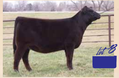
RVF Donna 737D