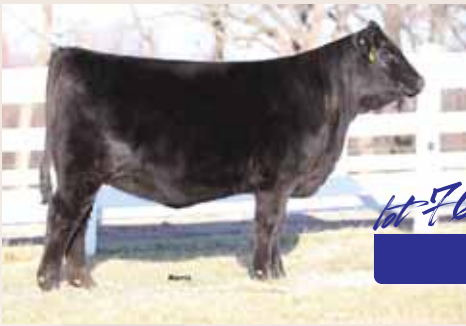
MCBN Due Process 642D