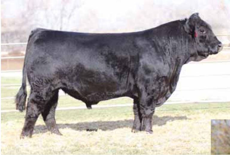
MAGS XTRA WET, maternal sibling to Lot 10.