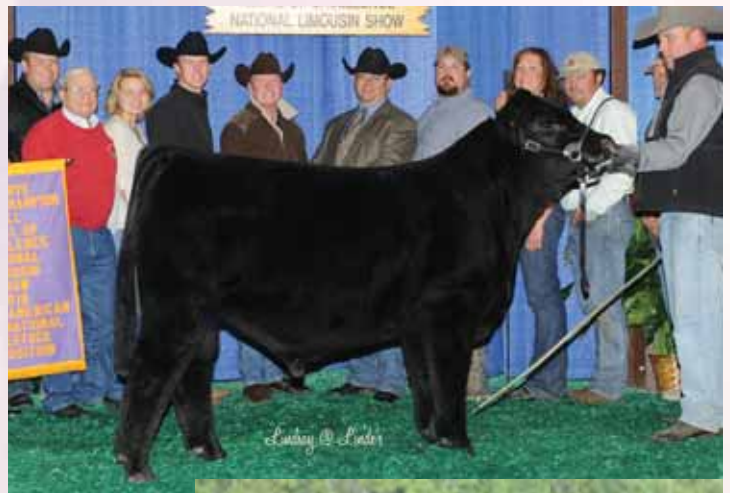
ELCX KINGS LANDING 599 D ET, sire of Lot 17 embryos.

Love this mating and how it represents strong, very strong championship genetics. Sired by the 2016 NAILE reserve grand champion bull ELCX Kings Landing. From PBRS Audrey, the partnership donor for White Valley Ranch and Edwards Land & Cattle Co. She is the dam of the 2016 All American Futurity Supreme Champion female ELCX Candy that was shown by Edwards L & C and Wies Limousin where later part interest was sold to P Bar S Ranch.