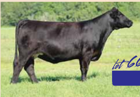
ELCX Correct 9C