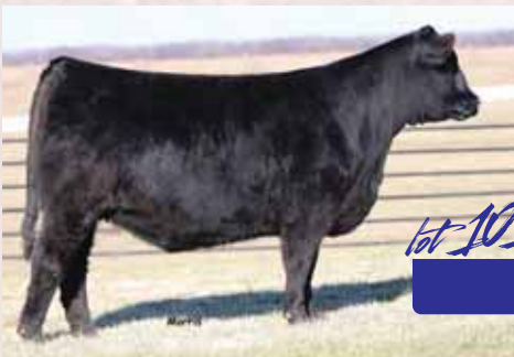
AUTO Madrin 423Z