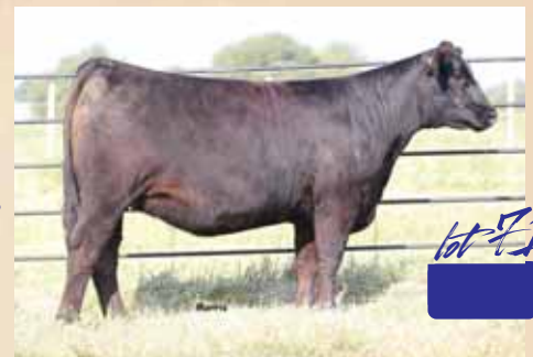
MCBN Baylee 492B