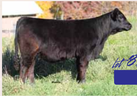
SSTO Dee Dee