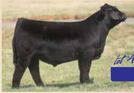
JCL Driver 617D