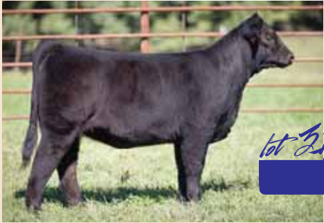
CJSL 6093D ET