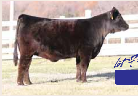
MCBN Digital 682D