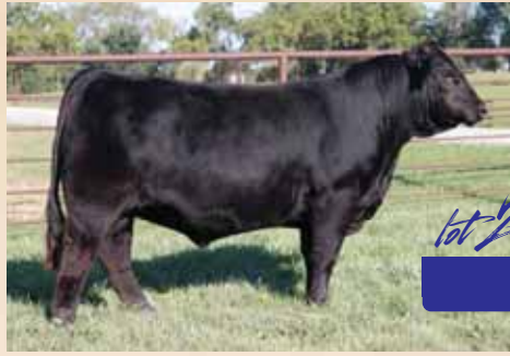
PBRS House of Cards 698D ET