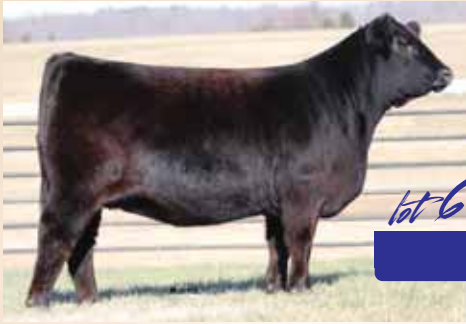
AUTO Chloe 264C ET