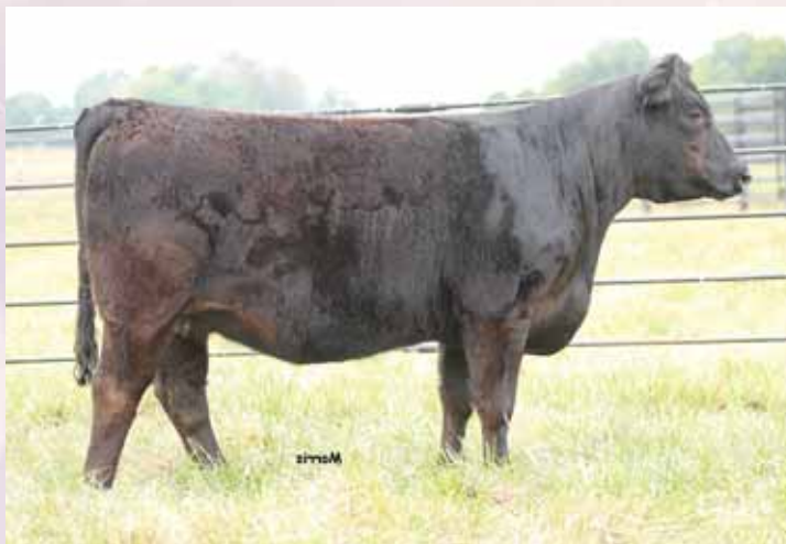
RVF CLASSIC ICE 702C ET, dam of Lot 139.

This 54% Lim-Flex daughter of MAGS Aviator is from a big time donor RVF Classic Ice 702C. She is a daughter of Dameron C-5 American Classic back to the Riverside Valley Farm donor MAGS Thin Ice. This young heifer is very well bred and has tremendous genetics stacked in her favor and we think has a world of potential.