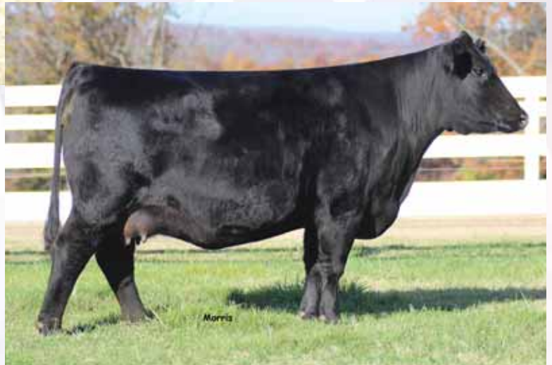
MAGS WHISPERING CANYON, dam of Lot 11.