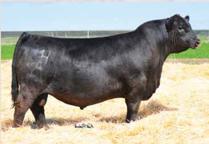
HA COWBOY UP 5405, sire of Lot 20 embryos.