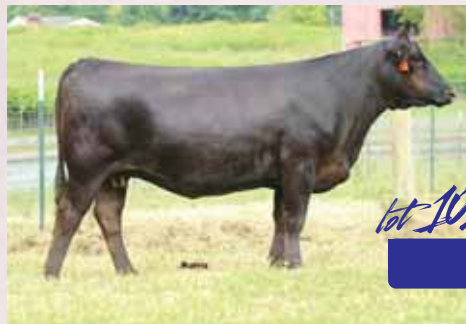
CJLM Destined 155Y