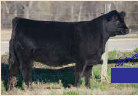
RVF Demi 738D ET