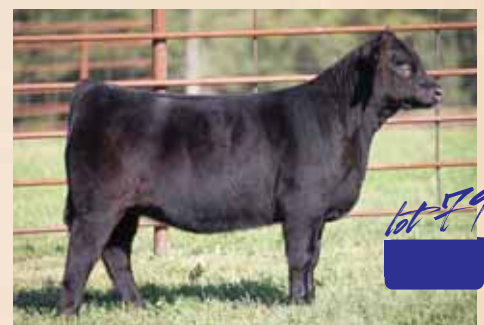
CELL 6193D ET

More quality in a sale offering than you can image!