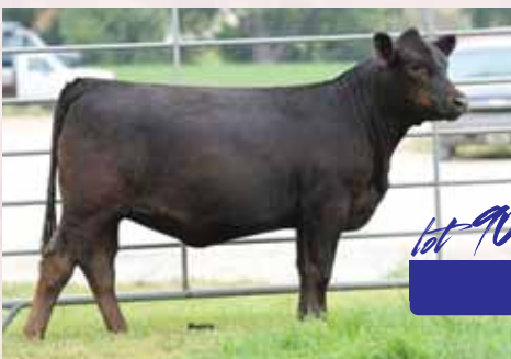
LVBR Donnette 67D