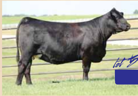
AUTO Cedar 294C ET