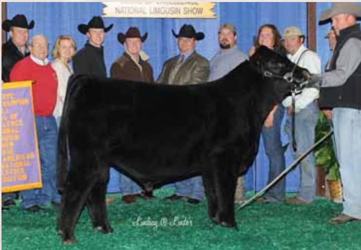
ELCX KINGS LANDING 599 D ET, sire of Lot 15 embryos.

SBLX Zero Percent 8647Z is the $35,000 valued donor owned by White Valley Ranch and Sullivan Farms, Dunlap, IA. She is the big ribbed and very well bred daughter of SAV Brilliance and from the famed and now deceased MAGS Manuela. These future calves are sired by RLBH Days of Thunder, the full brother to the very popular RLBH Air Force One. He is the leading sire for P Bar S Ranch and is one very strong made and powerful service sire. These calves will have a world of potential and ones that I really think will add extra value when debuted to the open market.