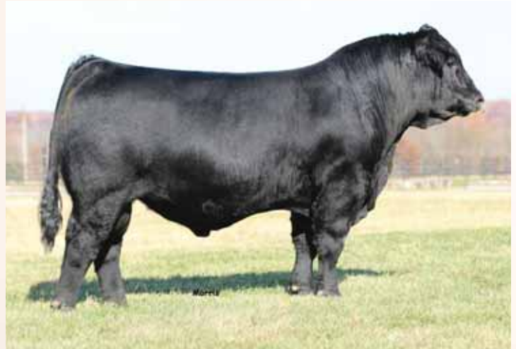
AUTO DIRECT DRIVE 107D, service sire to Lots 67 - 70.

50% Lim-Flex, double black and homozygous polled; This female ranks in the top 10% of the breed for YW with a 116, CEM with a 9, CW with a 41, MB with a .37 and SMTI with a 66.17; This female was created by blending the best in purebred Limousin with the best in purebred Angus. She is sired by Wulf's Warrior and from a daughter of Basin Franchise