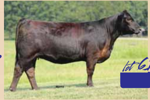
AUTO Cheney 475C ET