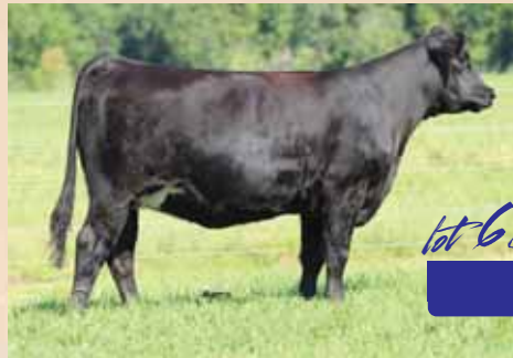
ELCX Count On Me 398C