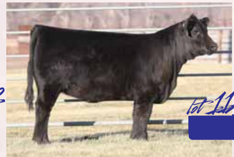
RRDC Brandi 21B