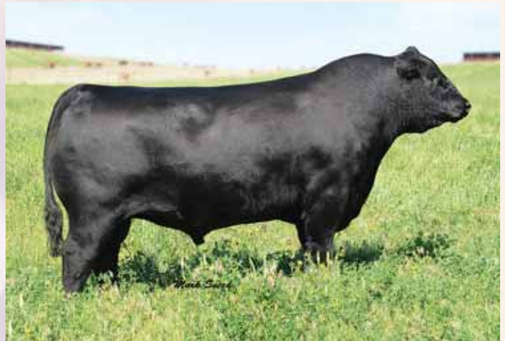
CONNEALY CONSENSUS 7229, sire of Lot 111.

MS Moreno Stella 0518A ET is a homozygous polled and homozygous black 50% Lim-Flex female with an impressive pedigree. Talk about a combination female, this daughter of Connealy Consensus 7229 is a powerhouse from every angle. Her dam, LVLS Stella 111S has been a powerful donor for the McKinney/Moreno program. She has all the features to continue as a female of exceptional merit and position within the breed. This female's marbling EPD, 0.54 ranks in the top 4% of the entire breed. And her yearling weight ranks in the top 15%.