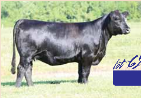
ELCX Giggle 292B