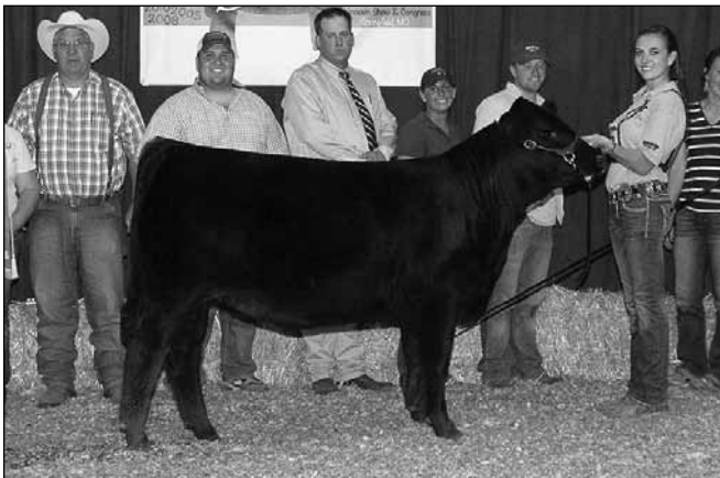
KYDL Blackbird, a paternal sister to Lot 15.