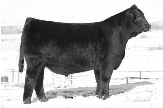
MAGS Aviator 373A, service sire to Lot 8 & 9.

Consigned by Owen Cattle Company, Hornbeak, TN