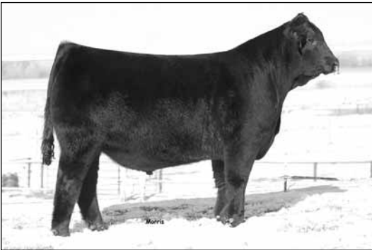
MAGS Aviator, sire of Lot 25 embryos.