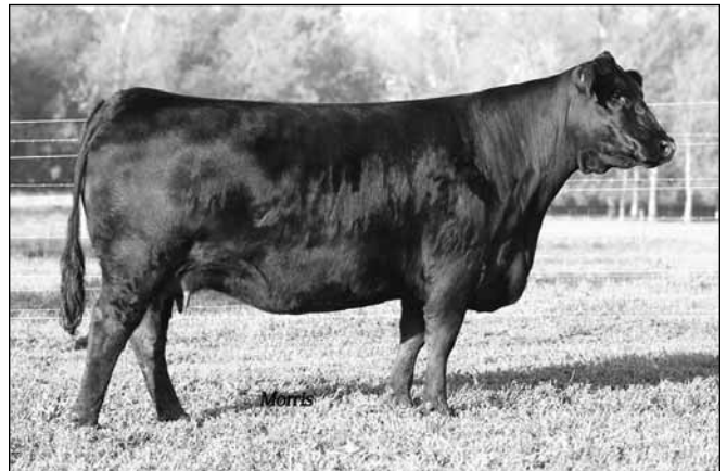
SBLX University Girl 105U, dam of Lot 12.

Consigned by Owen Cattle Company, Hornbeak, TN