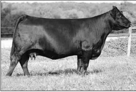
MAGS Thin Ice, dam of Lot 24 embryos.