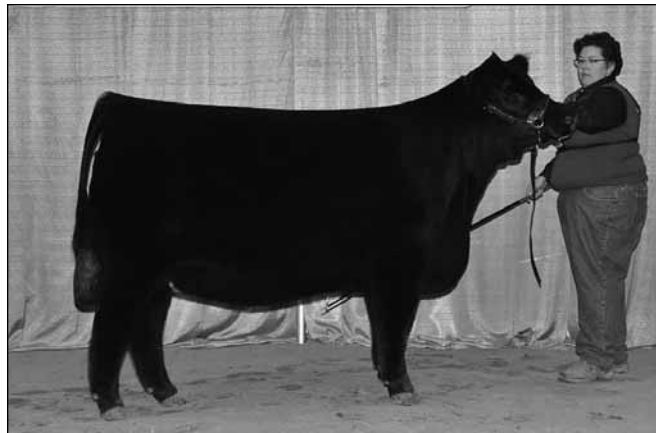
ELCX Anastasia 323A, dam of Lot 16.

Consigned by Owen Cattle Company, Hornbeak, TN