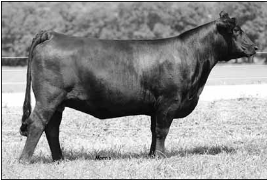
SBLX Zity Nights 770Z, dam of Lot 22 embryos.