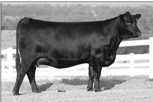
SBLX Zero Out 1361Z, dam of Lot 27 - 30 embryos.