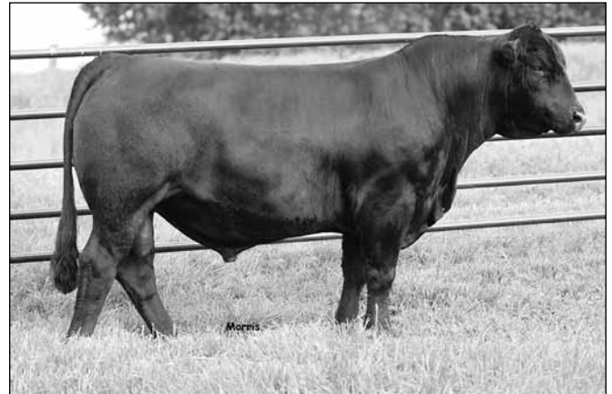
RVF Arsenal 179A, pasture exposed sire to Lot 4 & 5.

Consigned by Riverside Valley Farm, Hohenwald, TN