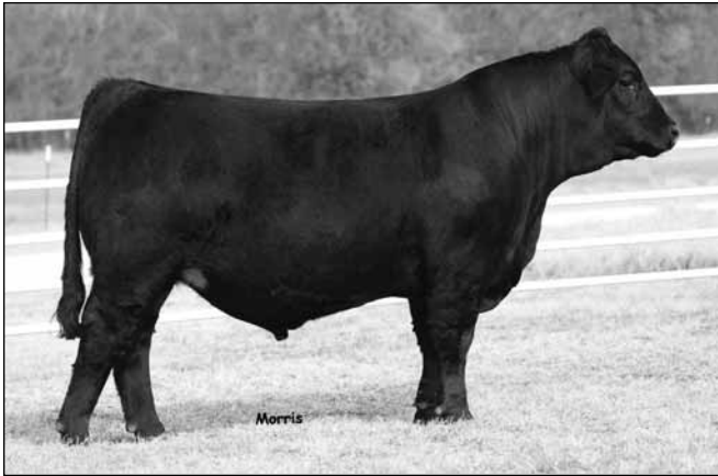
RVF Fire Ball 180A, service sire to Lot 7.