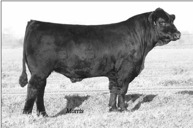
SBLX Yinnie, sire of Lot 14.