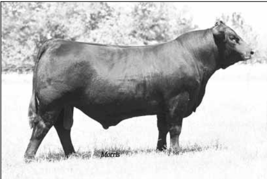
EBFL Ypsilanti 420Y, sire of Lot 26 embryos.