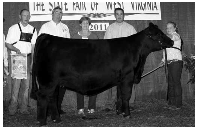
TMCK Krissa 18X, maternal grandam of Lot 6.