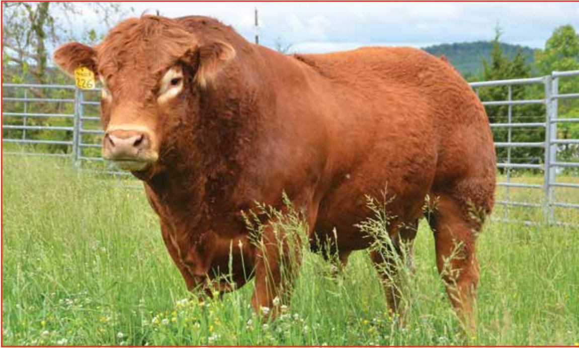
AR ZILLION 226Z • Sire of Lots 22 & 23