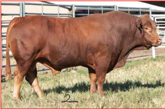
AR EXPRESS CARD 7129E • Sire of Lot 47A Semen sells as lot 74