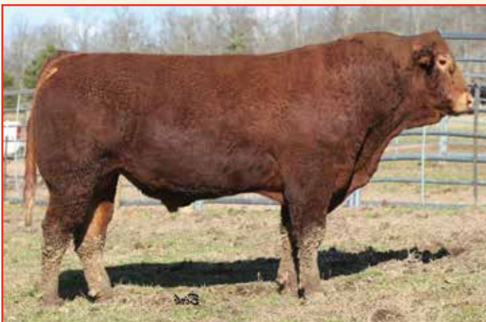
AR COLONEL 531C • Sire of Lots 27 & 28