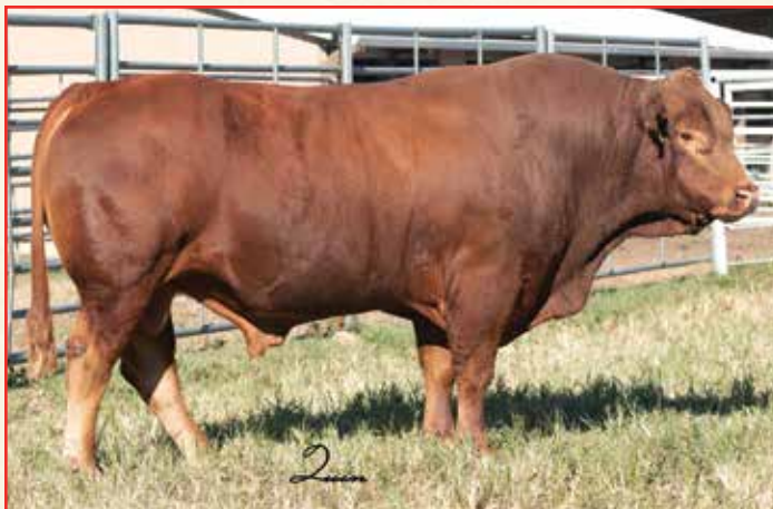
AR EXPRESS CARD 7129E • Sire of Lots 68 & 69

AR Hot Milly is a double polled Fullblood from our resident herd sire, AR Express Card, a Zillion son who carries on the powerful heritage of his sire. Her dam, AR Yilly Milly, a fantastic producing female who goes back to the McKown cow, MK Kathleen, a cornerstone in our herd. Maternal sisters sell as Lot 58 and 59. Sells open.