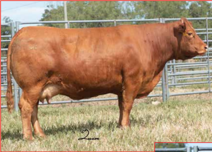
LOT 36 • Maternal sib to Lot 50