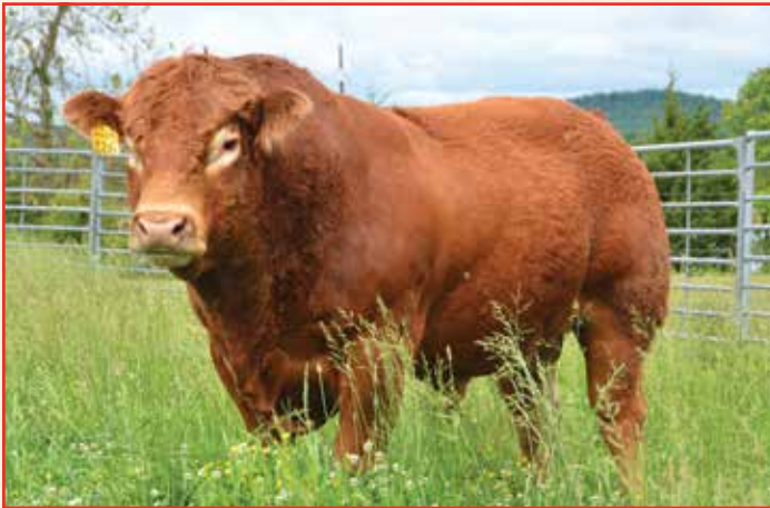
AR ZILLION 226Z • Sire of Lots 48 & 49