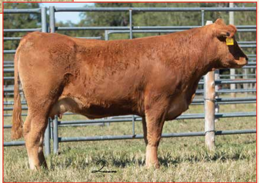
LOT 16 • Maternal sib to Lot 51