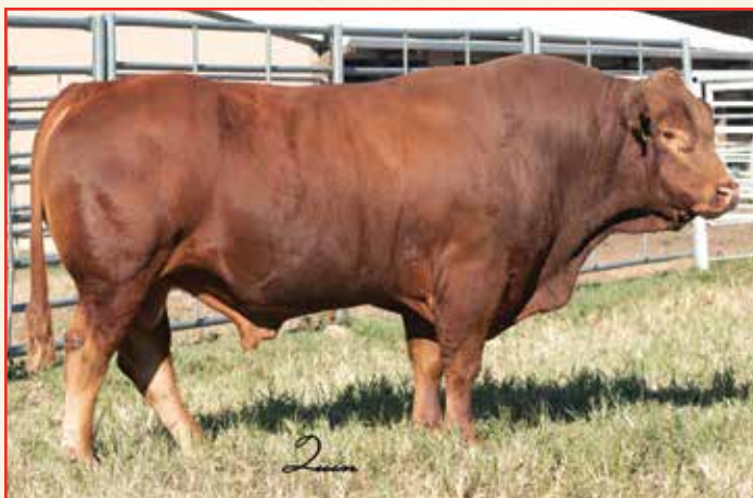
AR EXPRESS CARD 7129E • Service sire of Lots 59, 61 & 62

AR Endearing Milly 7117E is another Zillion daughter from the Milly family. Her dam, AR Yilly Milly, has done her part in raising picture-perfect Fullblood females. Endearing Milly is a maternal sister to Lot 58. She sells safe to AR Express Card for a spring 2022 polled Fullblood.