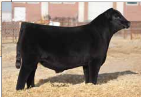
Silveiras Style 9303, sire of Lot 10B embryos

Lot 10A One of the breed's leading herds in the country is P Bar S Ranch. They purchased a flush on the elite donor MAGS Uahuka from Edwards Limousin in Missouri. She is the 2009 All American Futurity grand champion female and the 2010 Denver National grand champion female. She has continued her prominence by and elite donor in producing excellence. She is a daughter of the past Denver National champion bull and breed leader, DHVO Deuce and from the once national champion female Carrouseles Pina Colada. These heifer pregnancies are sired by MAGS Cable and Silveiras Style. Cable is the 50% Lim-Flex double homozygous son of MAGS Appleseed. He is the leading sire for Graven Land & Cattle and Magness Land & Cattle. Silveiras Style is a purebred Angus bull that has seemed to work wonders when mated to Limousin females. Either one of these heifer matings will work and we think very well for the new buyer. This is a highlight lot in selling a pick of these two matings from the heart of the embryo transplant program.