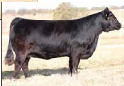
SBLX Xtra Special, dam of Lot 33 embryos.

Lot 33 This is one unique opportunity to invest in supreme quality genetics. MAGS Cable was the lead bull in the 2016 NWSS Grand Champion Pen of Lim-Flex bulls. SBLX Xtra Special is one of the greats in the industry. She is a past San Antonio Supreme Champion Overall female. She is so perfectly designed and has a beyond stunning maternal profile. The DHVO Deuce/ MAGS Manuela mating has produced some of the top individuals in the breed. She is a maternal sister to SBLX Znote and has recorded impressive numbers. These embryos are 50% Lim-Flex, double polled and homozygous black.