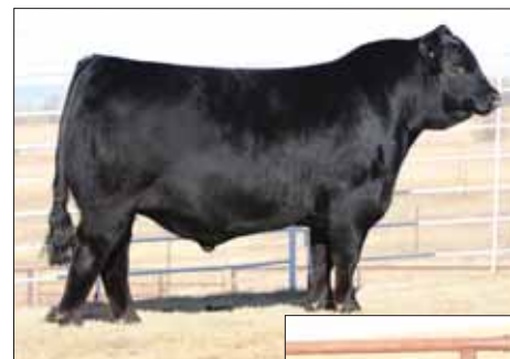
MAGS Cable, sire of Lot 29 embryos.