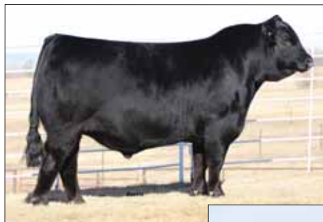
MAGS Cable, sire of Lot 24 embryos.