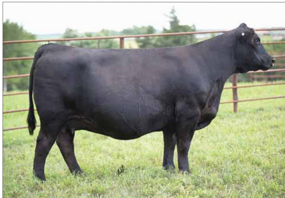
MAGS Thora, dam of Lot 11 embryos.

11 Lot Half due at time of sale and balance at time of selection. Total of 5 calves due fall of 2018.