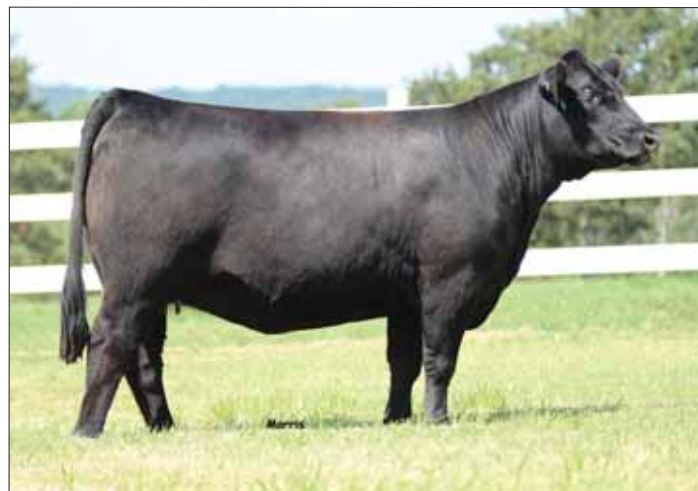
PBRS 5136C ET, full sibling to Lot 37A & 37B embryos.