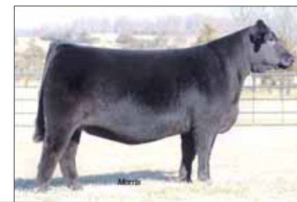
AUTO Bliss 265Y, full sib of Lot 17 pregnancies.