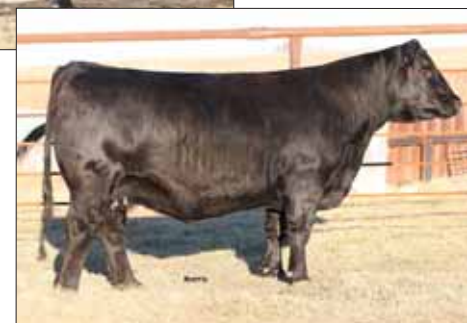
LVLS Bare Assets 798B, dam of Lot 30 embryos.

Lot 30 .This three-embryo offering is one you won't want to look past. Double polled, double black and 50% Lim-Flex any producer will benefit from these powerful genetics. MAGS Wazowski is the big footed, super stout and incredibly sound bull that works great for softness and performance. LVLS Bare Assets 798B is the versatile daughter of MAGS Unhooks and angus donor, LVLS 798R. If you are in search of power from both sides of the pedigree, look no further.