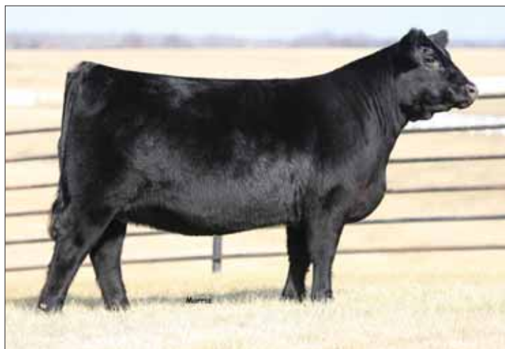
AUTO Chaperall 406C, dam of Lot 35A & 35B embryos.