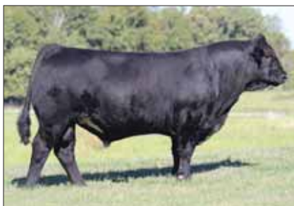
AUTO Cruze 132X, sire.