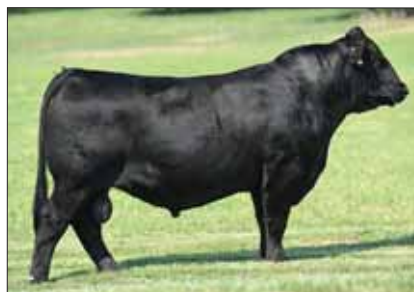
HBRL Deluxe Package