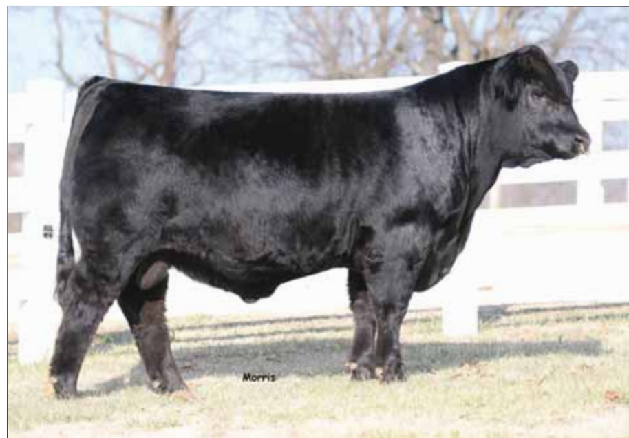
ELCX Devoted 657D, service sire to Lot 36.

36 Sells bred to calve in the Spring to ELCX Devoted 657D.