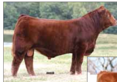
MAGSWL Usual Suspect 538U, sire of Lot 16 embryos.