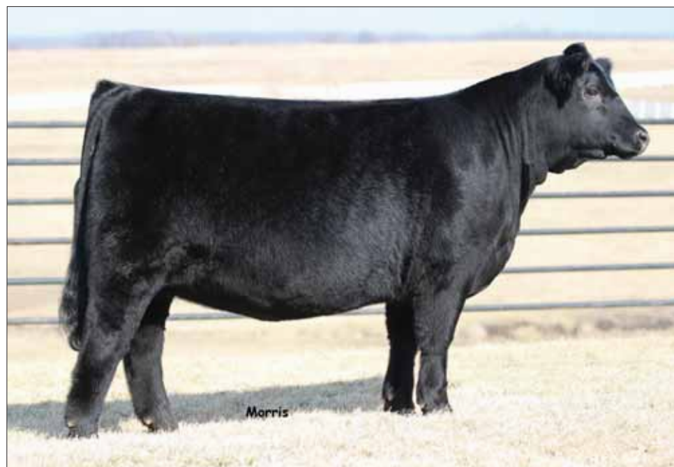
AUTO Adorie 439A, dam of Lot 34 embryos.