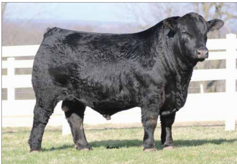
CELL 20/20, sire of Lot 34 embryos.