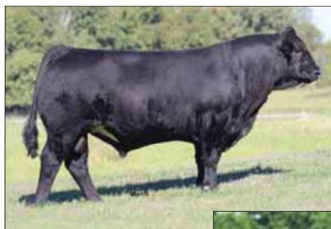
AUTO Cruze 132X, sire of Lot 25 embryos.