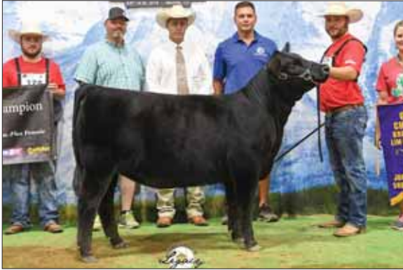
WFL Evangeline, daughter of SSTO Wondergirl 9803W.