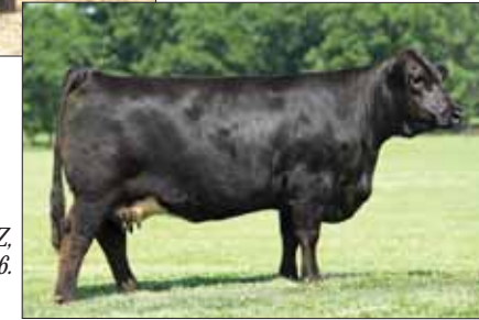
AUTO Zofia 439Z, dam of Lot 26.