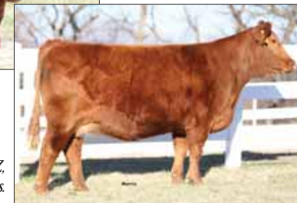
MCBN Show Me Paid 281Z, dam of Lot 16 embryos.