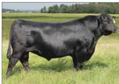
GAR Prophet, sire.