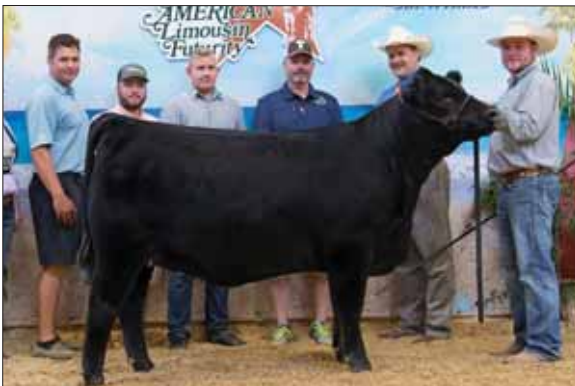
WFL Dixie 615D, donor dam.