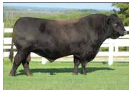
HBRL Genesis 404B, sire.