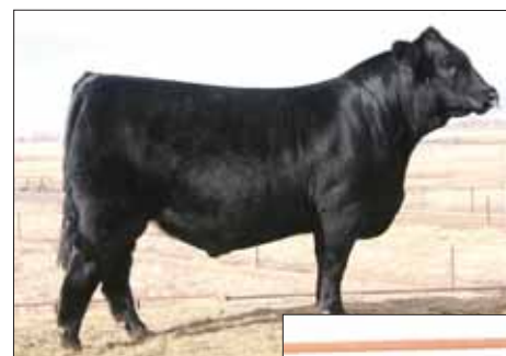
MAGS Wazowski, sire of Lot 30 embryos.