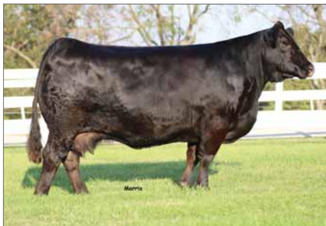
AUTO Exceptional 282S, donor dam.