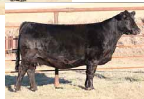
LVLS Without U 9098W, dam of Lot 29.