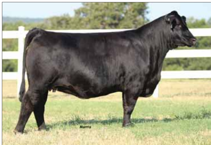
PBRS 646D, donor dam

Lot 32 Guarantee of 5 embryos sired by the bull of the buyer's choice.