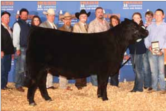
LFL Candy Corn, full sib to Lot 40 embryos, and 2014 Houston Supreme Champion Female.