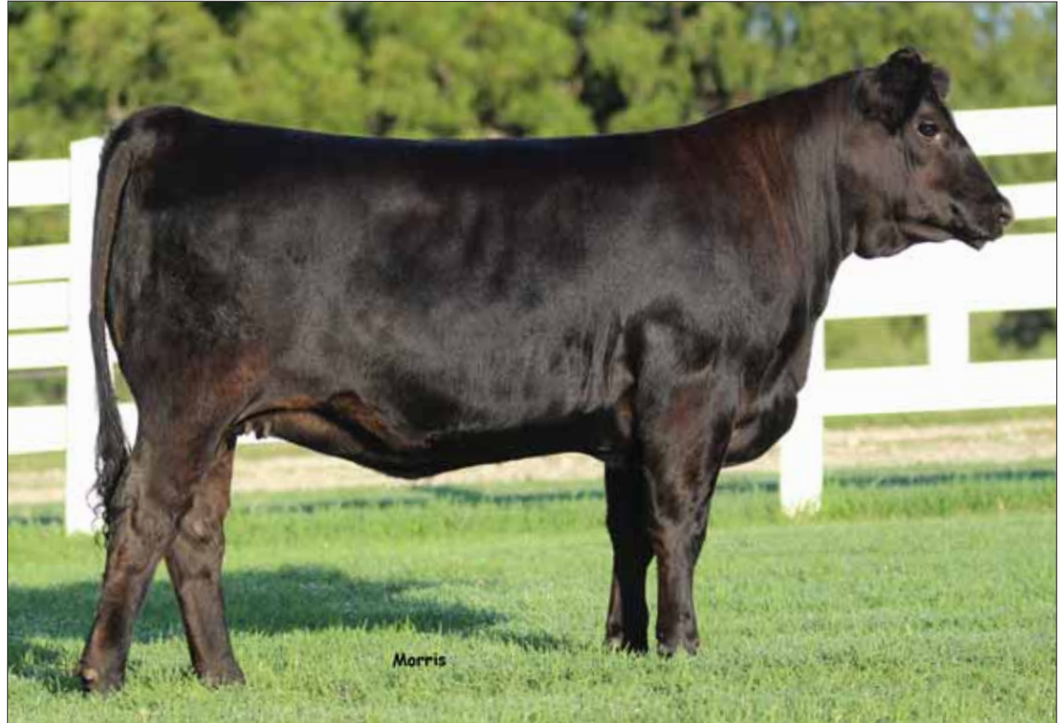
HBRL Empowered 7541E, Lot 31B.