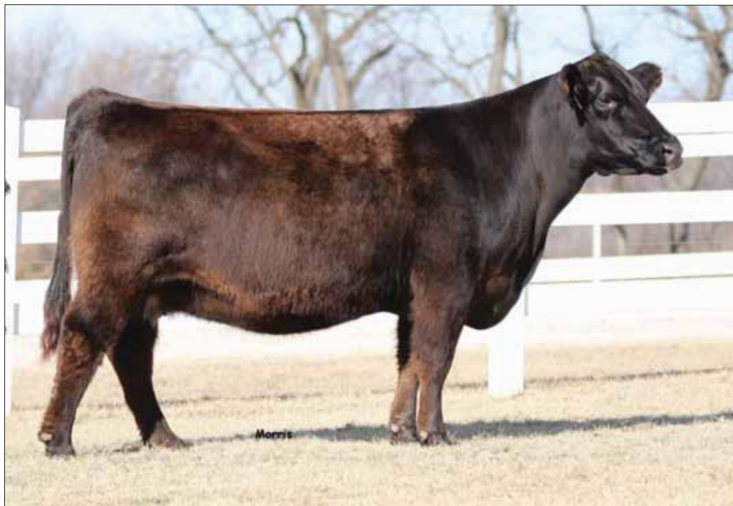
PBRS Widow Woman 209W, Lot 36

The Hamm Family | 931.628.3212 | Cmhamm10@hotmail.com 4403 Buffalo Road, Hohenwald, TN 38462 www.riversidevalleyfarm.com