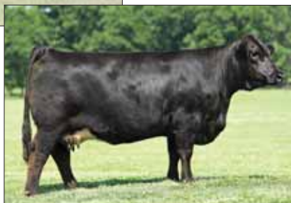
AUTO Zofia 439Z, dam of Lot 25 embryos.

Lot 24 J6 Farms is pleased to offer three heifer embryos in this highlight sale. They are sired by the ever popular sire, MAGS Cable. He is the 50% Lim-Flex and double homozygous son of MAGS Appleseed. He is a complete outcross to most established sires in the business. These future heifer calves will be from AUTO Darian 226D. She is a daughter of BSF Opportunist and from the famed donor, MAGS Manuela. The genetics behind this mating are some of the finest in the breed and any potential buyer should feel good about the predictability of this mating.