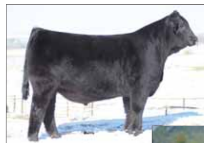
MAGS Aviator, sire of Lot 20 pregnancy.

Consigned by Diamond Hill Cattle Company