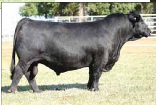
PBRs Bunk House 48B, sire of Lot 13 embryos.