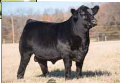
SSTO Best Bet 456B, sire of Lot 35B embryos.

Lot 35A Embryos of this caliber and quality are rarely offered to the buying public but, the 2019 Summit Sale is your opportunity to invest in some of our breed's very finest. Study the unique combination of the widely popular AHCC Hemi 0901E and SSTO Best Bet 456B A.I sires and the visually stunning donor, AUTO Chaparral, which was a highlight and standout at the 2017 Annual Pinegar Limousin Sale. She was admired for her structural prowess, depth of body and stunning eye appeal. Simply stated, the rare combination of phenotypic quality, numbers package, predictability and unique pedigree twist make this genetic lot one to invest in sale day.