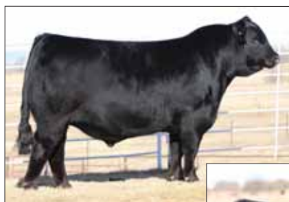
MAGS Cable, sire of Lot 33 embryos.