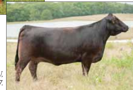
WLR Ugly Betty 432U, dam of Lot 17.