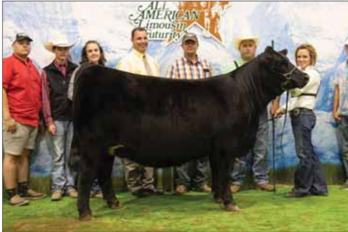
AUTO Callie 403D, Grand Champion Female 2018 All-American Futurity

850 W Farm Road 56, Springfield, MO 65803-7539