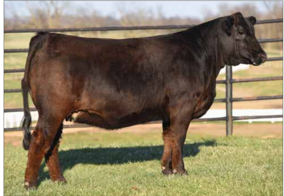
AUTO Mercy 646D, dam of Lot 38 embryos.

38 High quality, stout featured, performance oriented and huge numbered are terms that appropriately summarize this designer mating! We are offering you 6 embryos by one of the hottest off the market bulls in the business, MAGS Summit - the 2018 National Champion and anchor bull in the People's Choice Champion Carload at the National Western Stock Show. The donor dam, AUTO Mercy is one that is flawless at the ground—she's big footed, relaxed in her pasterns, long striding and one that hits you hard when she's set in motion. Aside from that, admire Mercy for her front end design, depth of body, square hip and natural muscle shape. Numerically, she is among the breed's very best, ranking in the top 30% or higher for 12 industry relevant traits—GEST, CE, BW, WW, YW, MK, TM, CM, SC, CW, MB and $MTI. All of that said, invest in this unique lot today and invest in your genetic future.