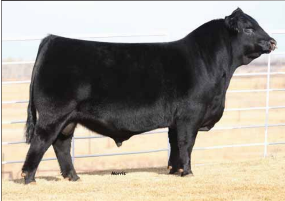
MAGS Summit, sire of Lot 38 embryos and NWSS Grand Champion Bull.