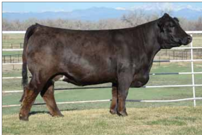
MAGS Uahuka 3602, dam of Lot 10 embryos.