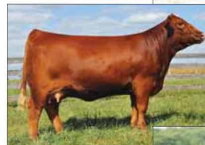
AUTO Bette 266Y, full sib of Lot 17 pregnancies.