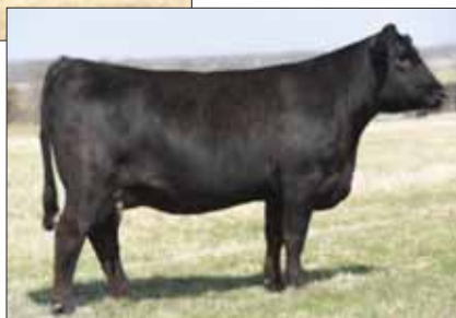
AUTO Darian 226D ET, dam of Lot 24.