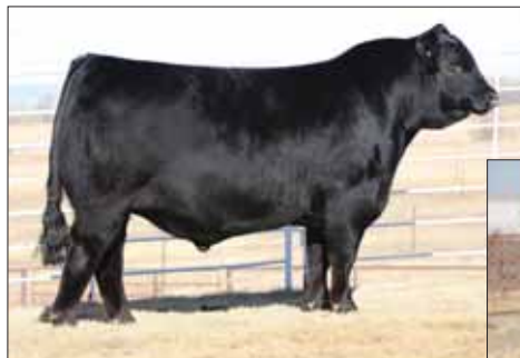
MAGS Cable, sire of Lot 10A embryos