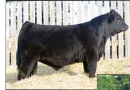
Riverstone Crown Royal, sire of Lot 26 embryos.