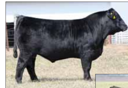
CELL Envision 7023E, sire of Lot 27 embryos.