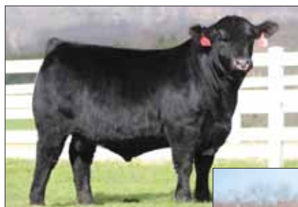
AHCC Hemi 0901E, sire of Lot 35A embryos.