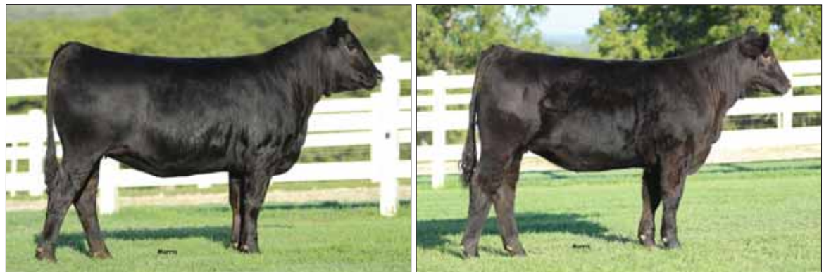
HBRL Ever Classy 7536E, Lot 31D