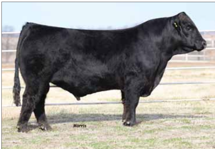
MAGS Anchor, sire of Lot 37A & 37B embryos.