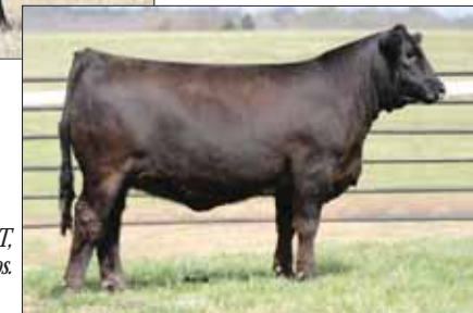
AUTO Dalejah 211D ET, dam of Lot 27 embryos.