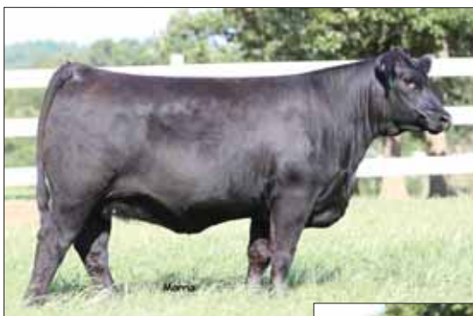
PBRs Classen 57C ET, dam of Lot 13 embryos.