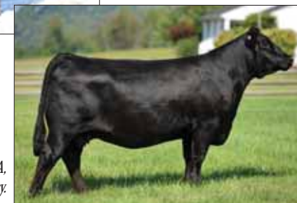
TMCK Applause 301A, dam of Lot 20 pregnancy.