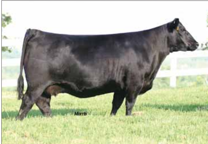
BUF Eppionia 7307, dam of Lot 37A & 37B embryos.

Ronnie Byrum, 479.640.5267 | ronnie.byrum@aol.com 8541 White Oak Drive Rogers, AR 72756