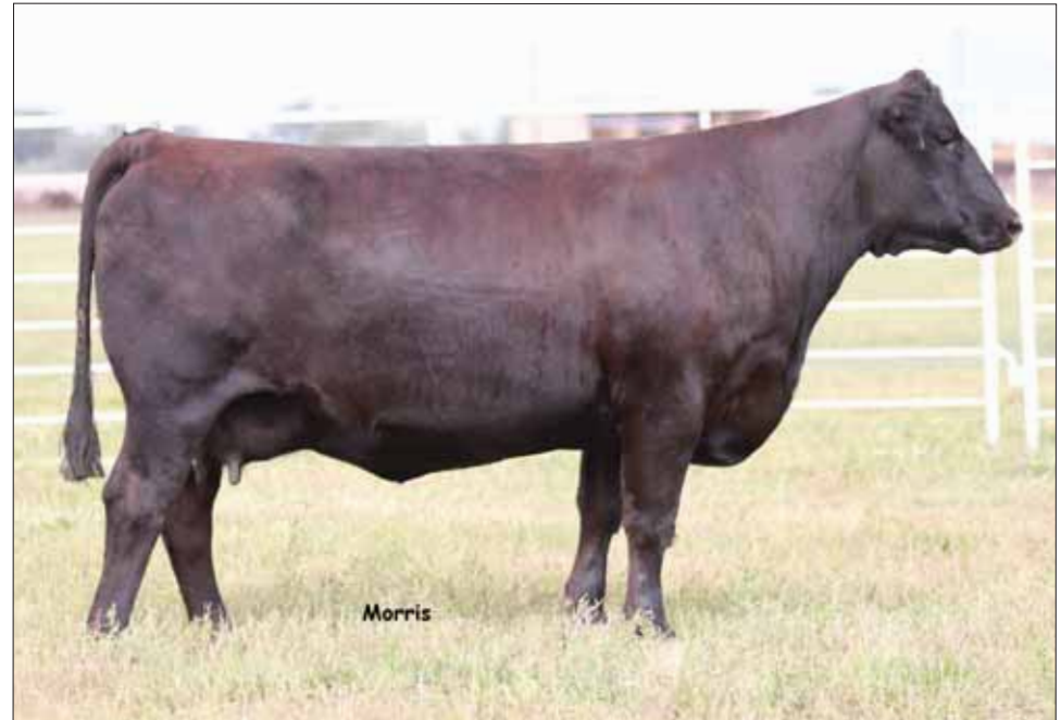
MAGS Zaneeta, dam of Lot 23A & 23B embryos.