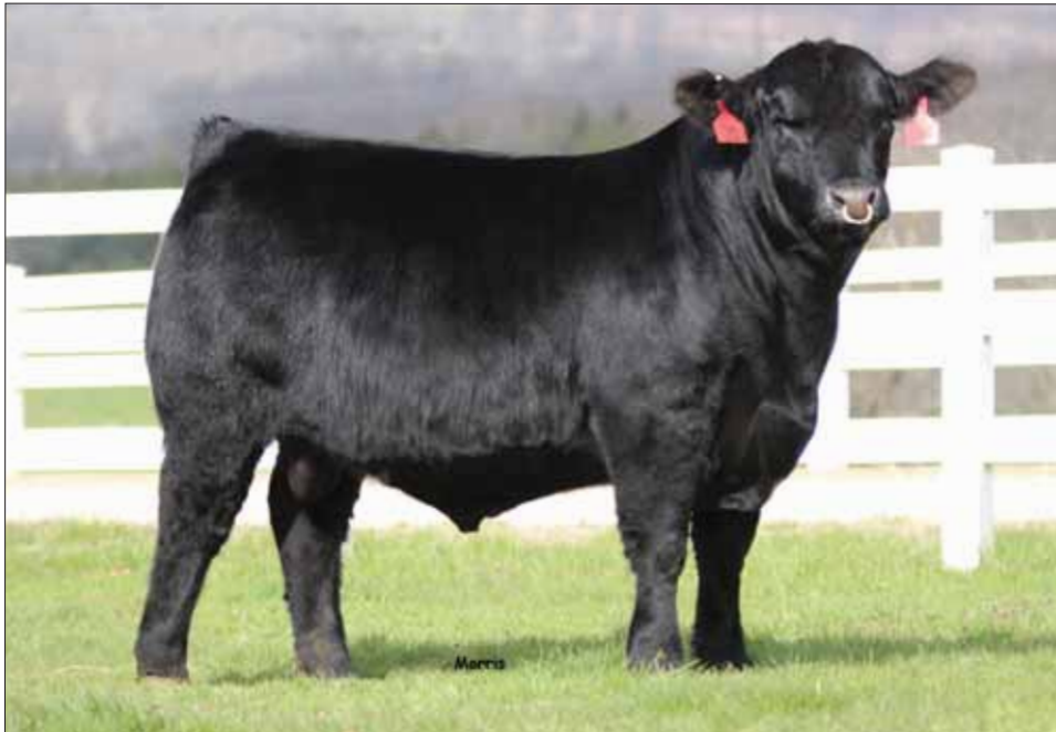
AHCC Hemi 0901E ET, sire of Lot 23A & 23B embryos.