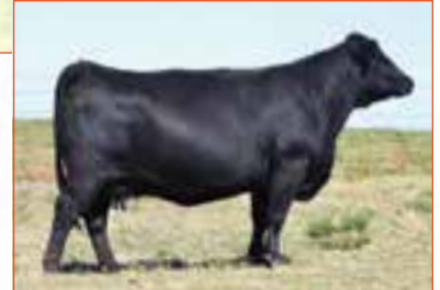
KRVN TORCH 259T Dam of Lot 29

CONSIGED BY: COYOTE HILLS RANCH, CHATTANOOGA, OK