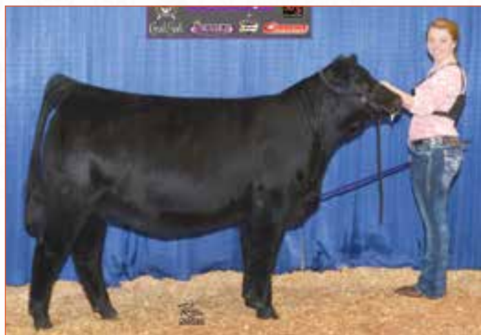
PEHL BLOSSOM 1894B - Daughter of Lot 13A

Show heifers are supposed to make cows and Wooden Nickel has done just that. After paying her dues as Peyton's first show heifer, she has adjusted to production nicely. Take a look at her yearling daughter (pictured) who Peyton currently campaigns as a bred-and-owned. The mating options for this double homozygous purebred female are many as evidenced her yearling daughter (pictured) and attractive Silveiras Style heifer currently at side. Intentionally left open and ready for immediate transplant.