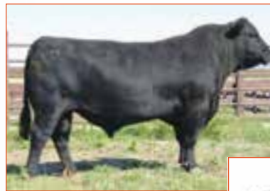
A A R TEN X 7008 S A Sire of Lot 25

A tremendous package of embryos sired by the great A A R Ten X, the 2014 record-setting AI sire of Accelerated Genetics who excels in calving-ease, performance, carcass merit and $Values. AUTO Brooklyn 249U is quickly making her way to the top of the Lim-Flex breed based on her consistency. Her progeny were among the top sellers in Tubmill Creek Farm's recent sales, and she impresses many with her power and production. She is a direct daughter of the famed Angus carcass legend, GAR Predestined.