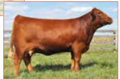
AUTO BETTE 266Y Dam of Lot 31