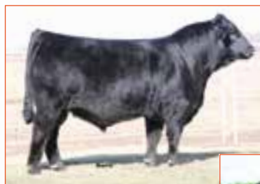
MAGS ALL-STAR 700A Sire of Lot 16

CONSIGNED BY: JCL LAND & CATTLE, WELCH, OK