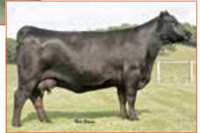
DALTONS QUEEN B 3308 BW MF Dam of Lot 23