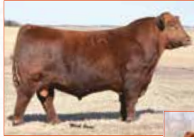
PIE THE COWBOY KIND 343 Sire of Lot 20