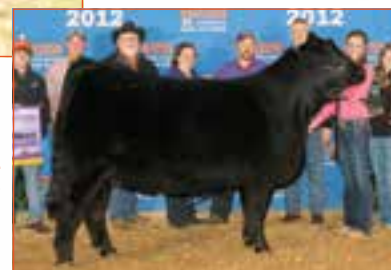
SBLX XTRA SPECIAL Dam of Lot 15

This beautiful female is a past Houston open and junior show champion, as well as San Antonio open show. Her perfectly engineered skeleton and stunning maternal profile made her not only a can't-miss female in the show ring, it also has made her one of the highest valued young donors in the breed at $106,000. The DHVO Deuce/MAGS Manuela mating has produced some the elite cattle to set foot on ground, and SBLX Xtra Special is no exception. She has recorded an impressive WW ratio of 107 and YW ratio of 108 on 15 progeny. EXAR Classen was the NWSS Champion Carload lead bull for Express Ranches and is not only a son of a Denver Champion (Dameron First Class), his sister is a Denver Reserve Champion and his maternal grandam is a Denver Champion as well!