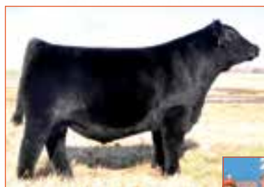
EXAR CLASSEN 1422B Sire of Lot 15

CONSIGNED BY: STOWERS LIMOUSIN, BRIDGEPORT, TX & SUGAR BUSH CATTLE, ALLEN, MI