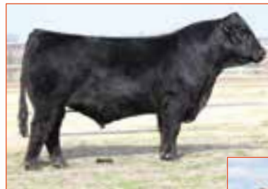
MAGS ANCHOR Sire of Lot 31