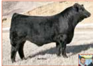
TMCK HYDRAULIC 17Y Sire of Lot 32