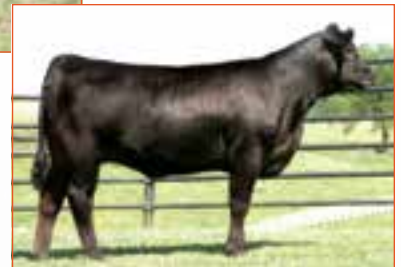
AUTO BROOKLYN 249U Dam of Lot 25