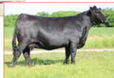
PBRB UNBELIEVABLE 8149U Dam of Lot 16