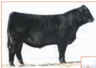
MAGS WINSTON Sire of Lot 18