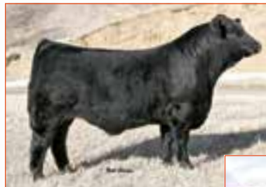
TMCK HYDRAULIC 17Y Sire of Lot 22