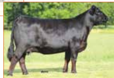
AUTO MABELLINE 267Z Dam of Lot 27