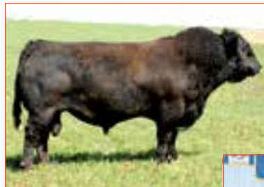
LH RODEMASTER 723R Sire of Lot 21