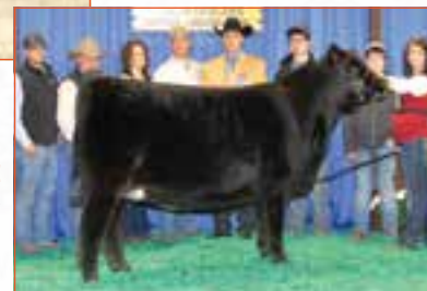
LLJB ABSOLUTE STYLE Dam of Lot 14

Attention folks, on offer is the first opportunity to invest in genetics out of the $40,000, wildly popular and the three-time 2014 national champion female, LLJB Absolute Style 3056A! The sire of this mating, MAGS Zodiac, was a member of the 2013 National Western champion carload and his first progeny are known for their stoutness, growth, foot size and look. This elite mating promises to produce homozygous polled, phenotypically exceptional calves that rank among the breed's top 35% for BW, YW and $MI.