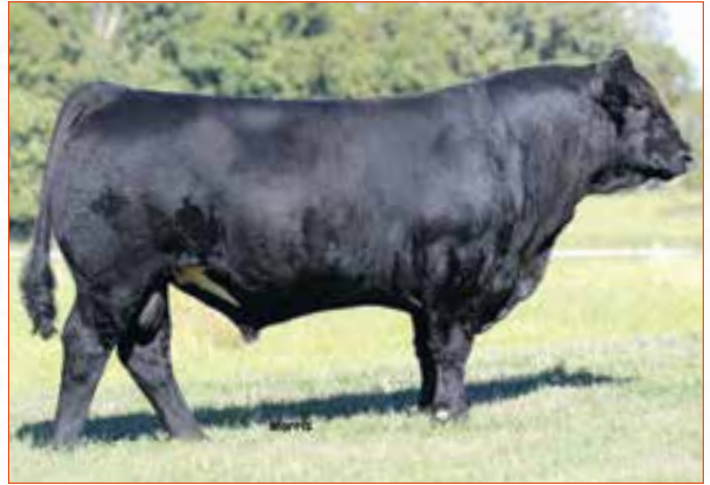
AUTO CRUZE 132X