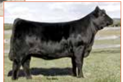
MAGS WALLPAPER Dam of Lot 22

CONSIGNEE BY: AGRI-EXPOSURE LLC, HARRODSBURG, KY & MASSEY LIMOUSIN, LONDON, KY