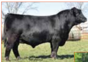
LH ADVANTAGE 105A Sire of Lot 28