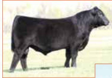
MAGS Y-AXIS Sire of Lot 29