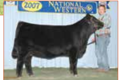
ALMA JO DHVO 723R Dam of Lot 21

CONSIGNEE BY: LAWRENCE FAMILY LIMOUSIN, ANTON, TX