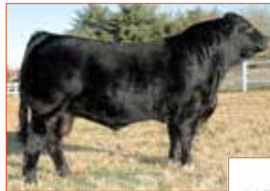
WULFS XCLUSIVE 2458X Sire of Lot 24

AUTO Brooklyn is quickly making her way to the top of the Lim-Flex breed with consistency that rivals many of the donors who have made their mark on the breed prior. Her progeny were among the top sellers in Tubmill Creek Farm's trio of sales in 2014-2015, and she has the nation's Limousin breeders talking about her power and production. She is a direct daughter of the Angus carcass legend, GAR Predestined, who led all beef bull semen sales at Select Sires for many years. Wulfs Xclusive is a maternal brother to Kenworth, Xcellisor and Success, and ranks in the top 1% for marbling.