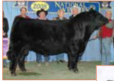
DHVO DEUCE 132R Sire of Lot 23

Daltons Queen B 3308 BW MF is a large-volumed, thick-ended daughter of BCC Bushwaker, stemming from the ever-popular Queen B family, was a staple in the Daltons on the Sycamore program for years. She ranks in the top 10% for $MI and Marbling, and top 15% for BW. Her picture says it all, she is one the Agri-Exposure team takes a tremendous amount of pride in. This mating was designed to produce solid, fault-free progeny that will excel in a variety of scenarios. Embryos are sired by DHVO Deuce who has been at the top of the breed registry for years for obvious reasons. His progeny grow and have solid foundations to build on.