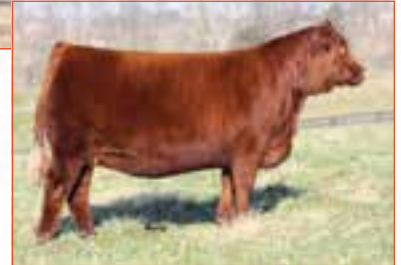
ENGD ZENANA 2074Z Dam of Lot 20

CONSIGNEE BY: ENGLEWOOD FARMS, LEXINGTON, KY