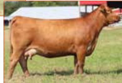
SBLX ZANE Dam of Lot 17

CONSIGNEE BY: EDWARDS LAND & CATTLE CO., BEULAVILLE, NC