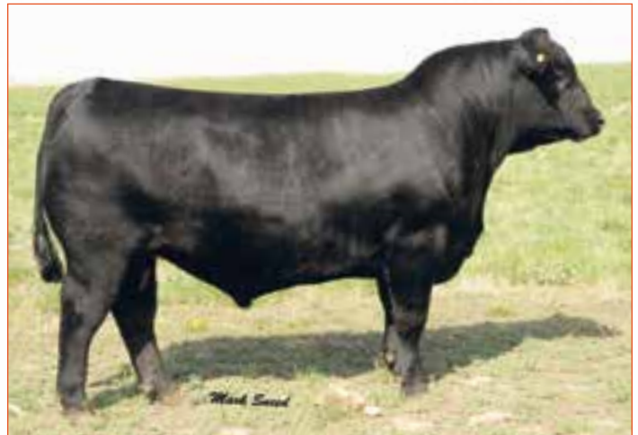
R B TOUR OF DUTY 177 - Sire of Lot 30

CONSIGED BY: GATES LIMOUSIN, ABSAROKEE, MT