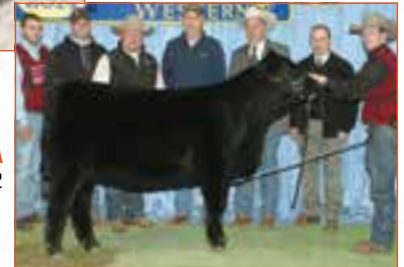
EF ALL IN FUN 851A Dam of Lot 32

CONSIGNEE BY: MASSEY LIMOUSIN, LONDON, KY