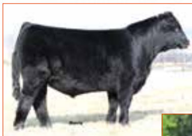
AUTO LUCKY STRIKE 118B Sire of Lot 27

Offering AUTO Mabelline embryos by AUTO Lucky Strike, the 2014 American Royal Champion Bull. He is a black and polled son of one of the biggest-numbered Lim-Flex bulls in the business, LH U Haul. His dam is the popular show female AUTO Luckie 246W who has earned her right as a big-league donor in the aggressive Pinegar transplant program. You have to admire his foot size, heaviness of bone and strong stance. The many-time champion AUTO Mabelline is familiar to many as a structurally flawless daughter of Connealy Consensus out of the purebred legend, MAGS Manuela.