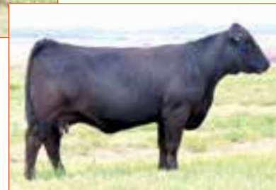
MAGS XTRA NICE Dam of Lot 19

CONSIGNEE BY: HALL CATTLE CO., SWEETWATER, TX