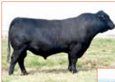
MAGS EAGLE Sire of Lot 19