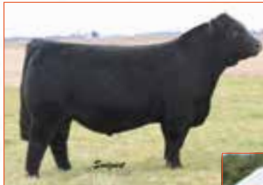
RLBH AIR FORCE ONE Sire of Lot 17