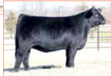
AUTO POEM 273Y Dam of Lot 18

CONSIGNEE BY: EDWARDS LAND & CATTLE CO., BEULAVILLE, NC