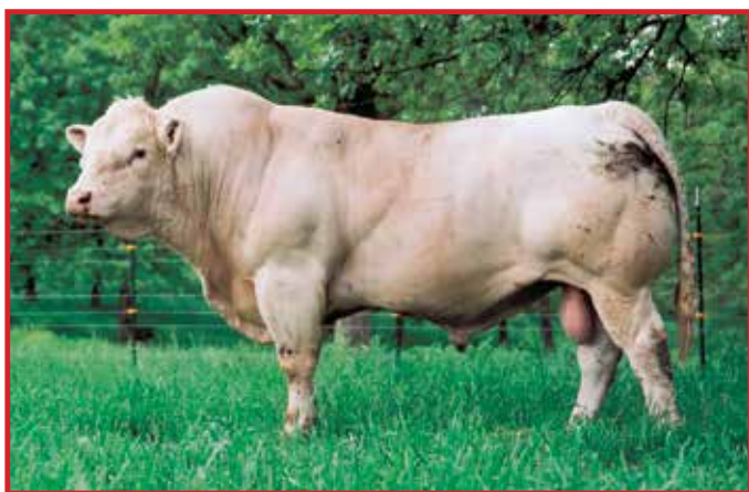
JDJ Smokester 1377 P ET— Maternal grandsire of Lots 262-264