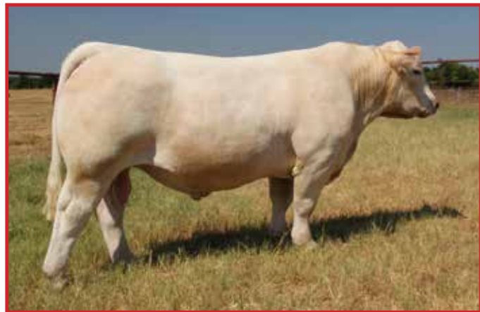
M6 Bells & Whistles 258 P— Sire of Lots 16, 19 & 20