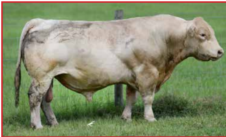
M6 Next Step 164 P