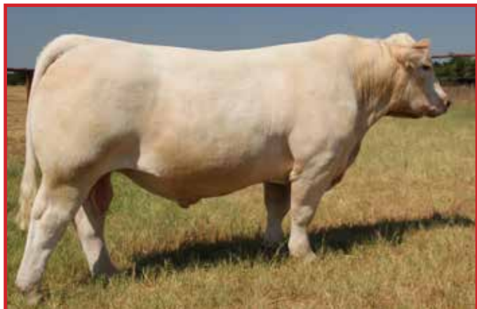
M6 Bells & Whistles 258 P— Sire of Lots 378-380