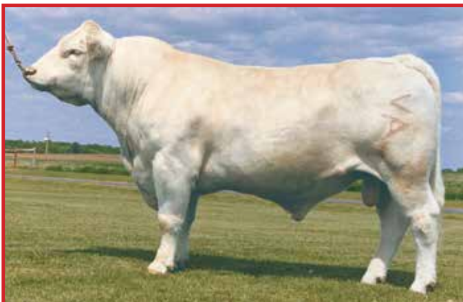
VCR Sir Duke 914 Pld — Sire of Lots 169-170