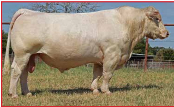
M6 Cool Rep 8108 ET