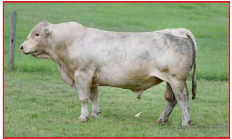
M6 Silver Star 308 P ET