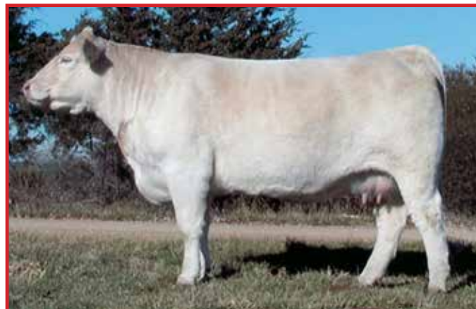
OW Miss Marion 0025 ET

AI 3-24-17 to CCC WC Resource 417 P and PE 4-4-17 to 6-6-17 to LT Blue Mountain 1041 Pld and PE 6-6-17 to 6-22-17 to M6 Cool Bachelor 383 ET and PE 6-22-17 to 8-15-17 to M&M Ledger 2543 P/S