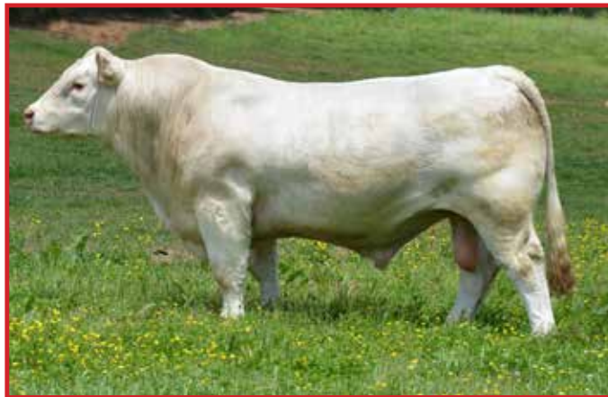
JDJ Maximo A18 P—Sire of Lots 309 & 310