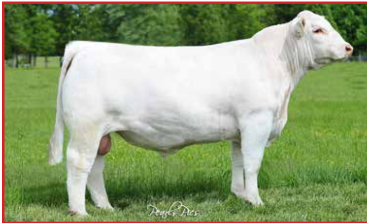
LT Blue Mountain 1041 Pld