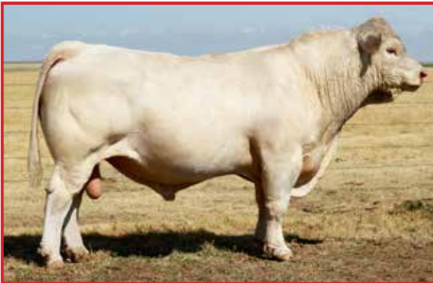
M6 Fresh Air 8165 P ET — Sire of Lots 45-50

AI 3-24-17 to WC Milestone 5223 P and PE 4-14-17 to 8-15-17 to LT Blue Mountain 1041 Pld