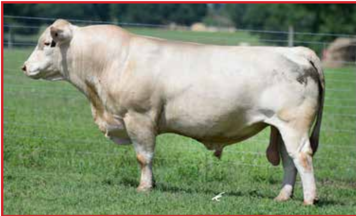
M6 Confidence 503