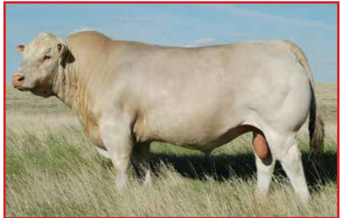
LT Ledger 0332 P