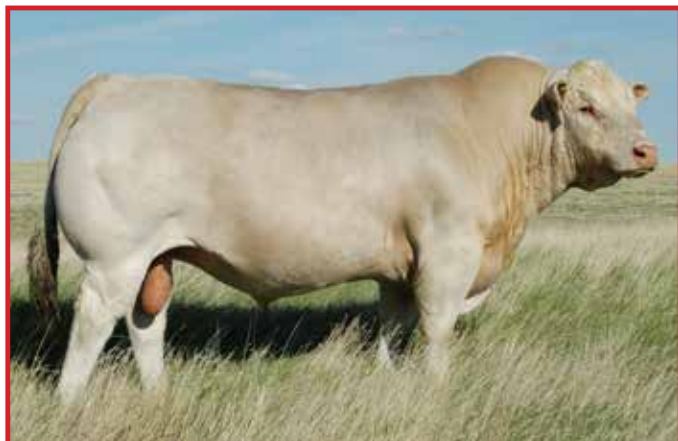
LT Ledger 0332 P—Sire of Lots 4-6

AI 2-14-17 to M6 Sleep Easy 734 PLD and PE 2-18-17 to 4-19-17 to Red Angus 5093C and PE 2-22-17 to 4-19-17 to M&M Ledger 2543 P/S and PE 4-19-17 to 8-15-17 to M6 Comfort Zone 565