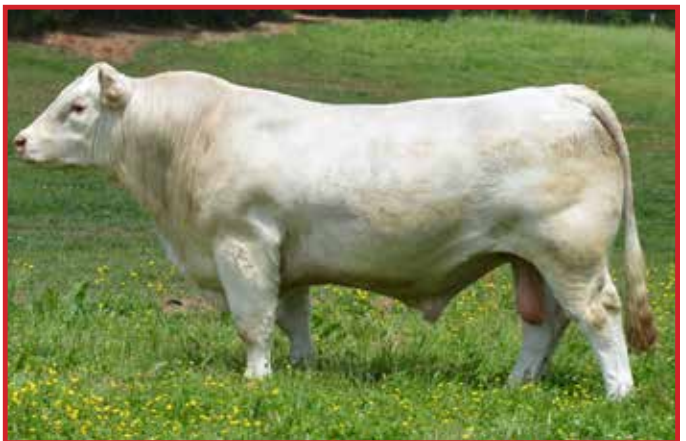
JDJ Maximo A18 P — Sire of Lots 373 & 374

AI 3-23-17 to M6 Comfort Zone 227 P and PE 3-24-17 to 8-15-17 to M6 Comfort Zone 565