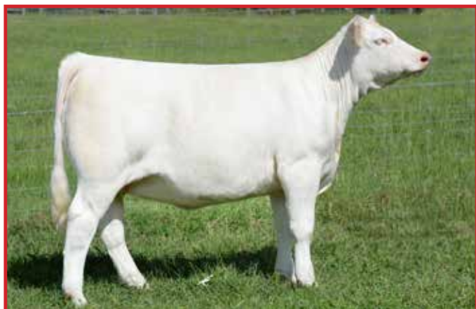
Daughter of Lot 149—She sells Lot 179

SCC Dutchess 0038 ET is another “overlooked” donor in this herd. She is a daughter of RC Ms Budsmydad 458 Polled highly respected donor for Rambur Charolais in Montana, Swan Creek Charolais in Tennessee, Palla Charolais in Texas and Southern Cattle Company.