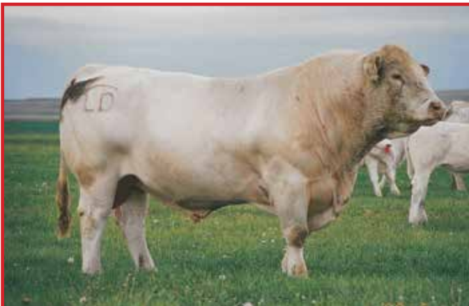
LHD Cigar E46—Maternal Grand Sire of Lots 169-172