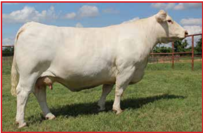
M6 Ms Gain & Grade 552 P—Dam of Lots 126-127

PE 3-8-17 to 4-30-17 to Southern Ledger 35084 and PE 4-30-17 to 8-15-17 to M6 Confidence 503