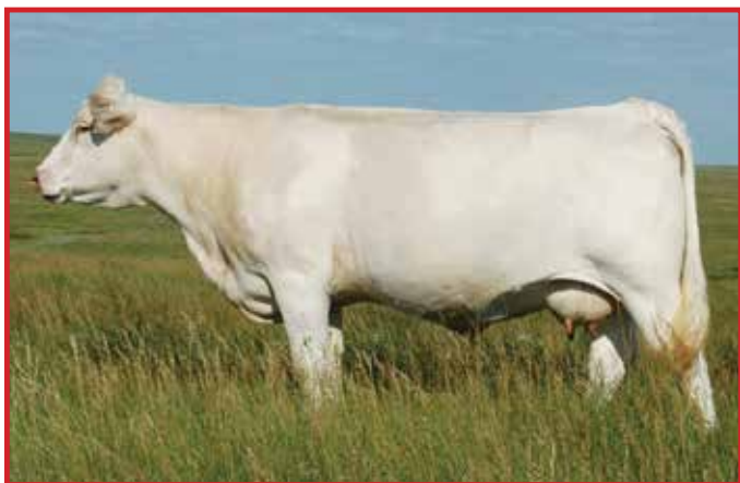
LT Brenda 1014