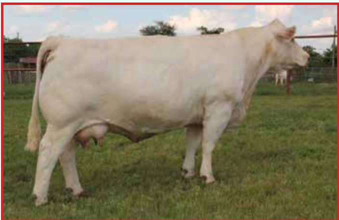
M6 Ms 5078 Mark 635 Pld ET

The Ms Jewel 0155 cow family consists of the Ms 5078 Mark 635 donor, the Ms Unlimited 3103 donor and finally back to the one that started it all – WCR Miss L06 5078 ET P! #5078 was purchased by SCC out of the 1998 20th National Charolais Sale many years ago for $10,500 from Jensen Charolais in South Dakota. In November 2002 she topped the Southern Mature Cow Herd Dispersal Sale at $25,000! She produced some great females across the country including 3103, K285, K300 who sold for $30,000, K385 and SCC Miss 3027 ET the great donor for Wright Charolais. Ms 5078 Mark 635 quickly became a donor of record when she produced Ms Jewel 0155. One-half interest in her sold for $36,000 and she produced sons that sold for $21,000, $45,000, $22,000 and $12,000. A daughter sold for $19,000. In 2016 they sold all of Ms Jewel 0155 for $32,500. Here is your opportunity to buy into this cow families success!