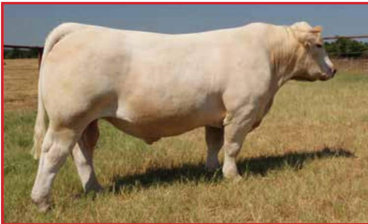
M6 Bells & Whistles 258 P—Sire of Ref. Sire T