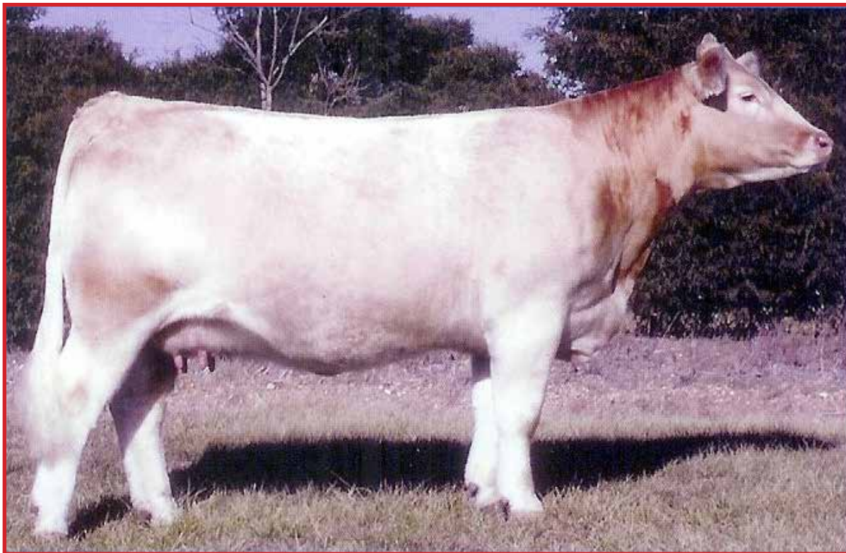
DA Ms Marion 328 ET

This cow family, backed by matriarch DA Ms Marion 328 P ET, is as powerful and numerous as any we will see on sale day. She first popped on the national scene in 2007 when she sold in the National Sale in Louisville for $16,000! Since that date she has produced 108 ET and natural progeny with over the top production. Again, we will let you be the judge, go sort through her daughters and granddaughters on the next three pages. We know you will be impressed!