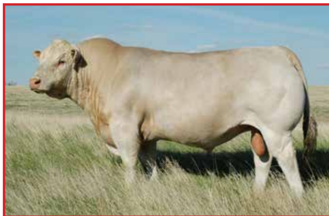
LT Ledger 0332 P – Sire of Lots 97 – 100

AI 4-21-17 to M6 Comfort Zone 227 P and PE 5-15-17 to 6-26-17 to M6 Ring Da Bell 469 ET