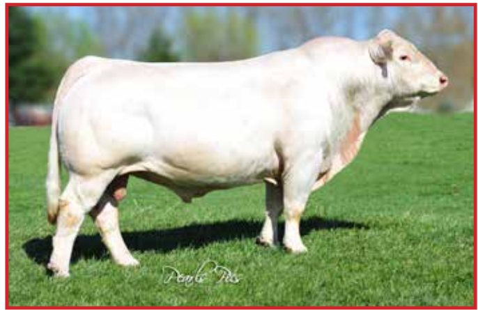
DA Passport 502 P ET— Paternal Grand sire of Lots 105-109

PE 4-4-17 to 8-15-17 to LT Blue Mountain 1041 Pld