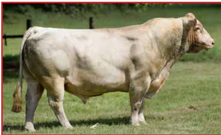
M&M Ledger 2543 P/S