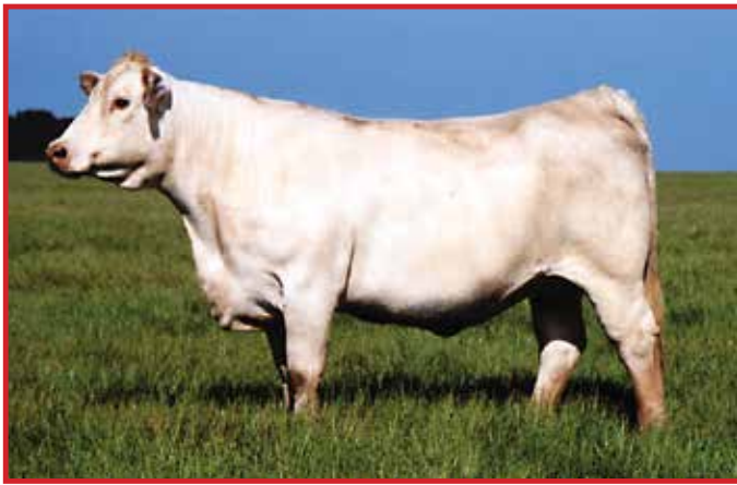
SCC Miss Mary G009 P ET — Dam of Lots 165-166 & granddam of Lots 167-168