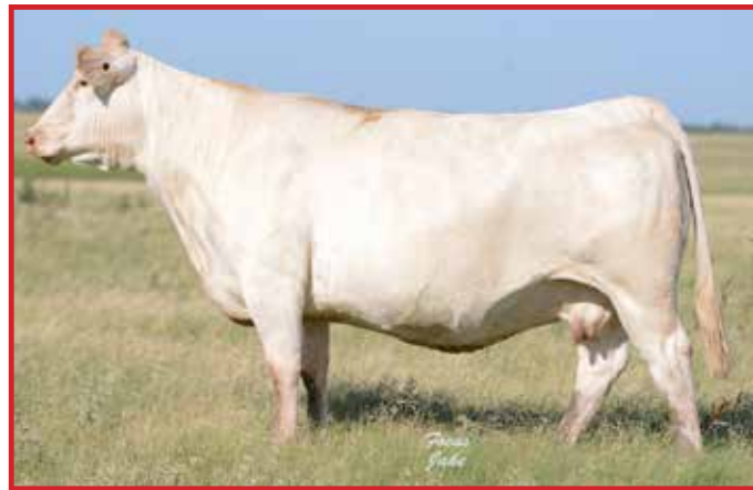
M&M Ms Stealth 8512 ET