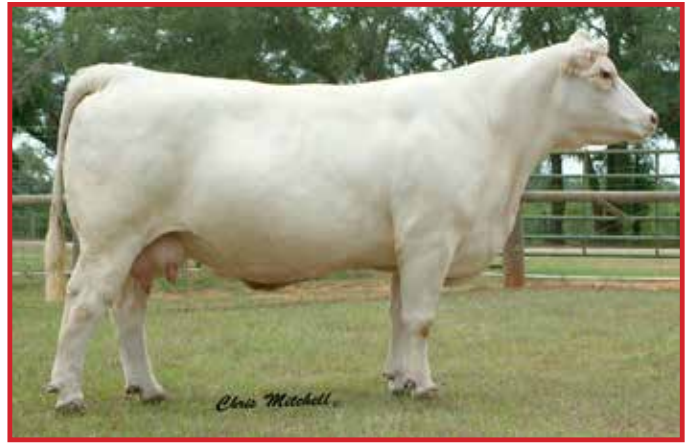
SCC Dutchess 0038 ET—Grand dam of Lots 91-92

AI 4-21-17 to LT Ledger 0332 P and PE 5-15-17 to 6-26-17 to M6 Ring Da Bell 469 ET