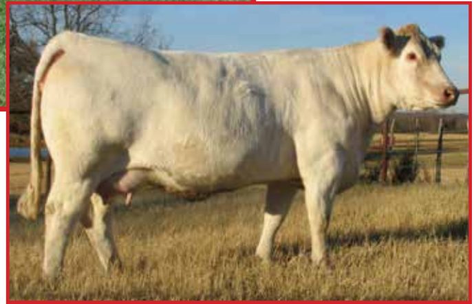
M6 Ms Grid Maker 2175 ET