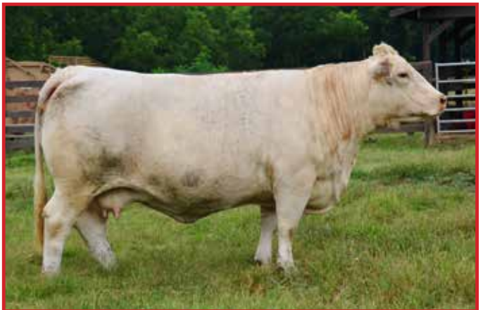
OHF Vanessa G101 P— Dam of Lots 370-372

AI 3-23-17 to M6 Comfort Zone 227 P and PE 3-24-17 to 8-15-17 to M6 Comfort Zone 565