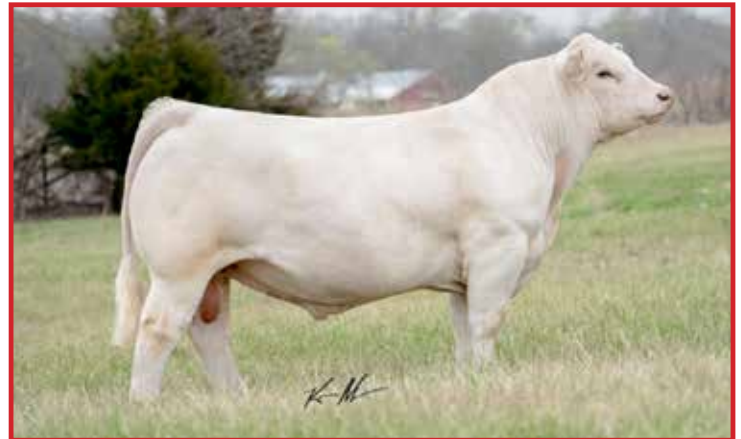
WC Milestone 5223 P