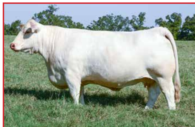
M6 Ms New Jewel 0155 Pld

One exciting young herd sire! He was purchased by SCC out of the 2014 M6 Fall Event for $21,000. He is a full brother to the 2015 M6 Ranch high-seller, M6 Slam Dunk 3115 P ET. His full sib sister also sells as Lot 115. 1/3 Semen interest owned by M6 Ranch.