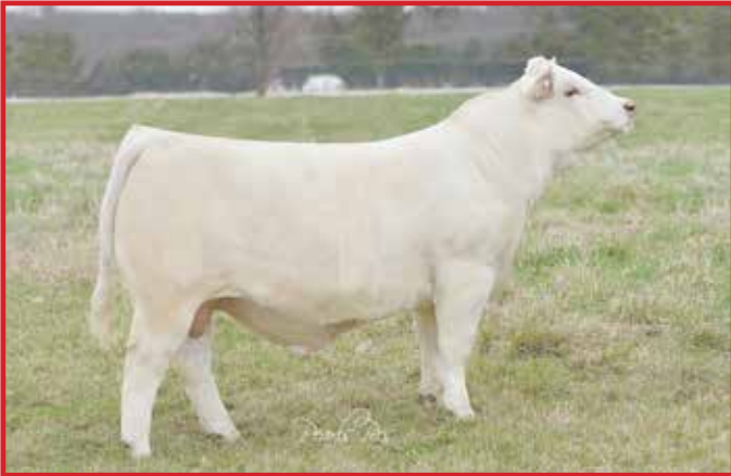
CCC WC Resource 417 P—Sire of Lot 119