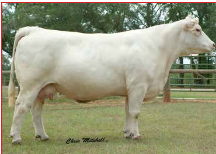
SCC Dutchess 0038 ET— Dam of Lots 149-151

SCC Dutchess 0038 ET is another “overlooked” donor in this herd. She is a daughter of RC Ms Budsmydad 458 Polled highly respected donor for Rambur Charolais in Montana, Swan Creek Charolais in Tennessee, Palla Charolais in Texas and Southern Cattle Company.