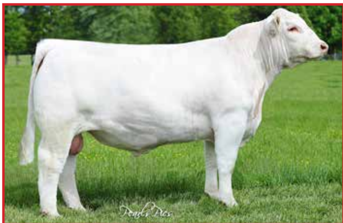
LT Blue Mountain 1041 PLD—Sire of Lot 87