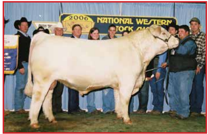
WDZ Polled Profit 4002

SCC Miss Mary G009 P ET has 56 progeny registered at AICA, including the National Champion Bull WDZ Polled Profit, and a Show Bull of the Year in WDZ LPC Precision and donors #2500 for Rathmourne Charolais and #2509 for Cannon-Deutsch Charolais.