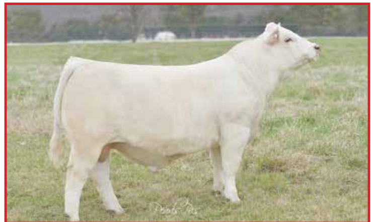
CCC WC Resource 417 P