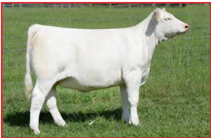
Daughter of Lot 232 —She sells as Lot 179

PE 3-9-17 to 4-30-17 to M6 Silver Star 308 P ET and PE 5-20-17 to 8-15-17 to Bamboo Ledger 3363