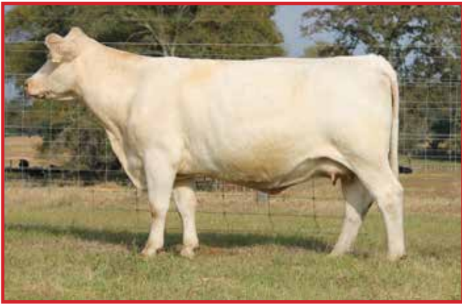
Faraway Mary 106X