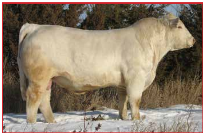
Keys Ten-Acious 166S—Sire of Lot 86