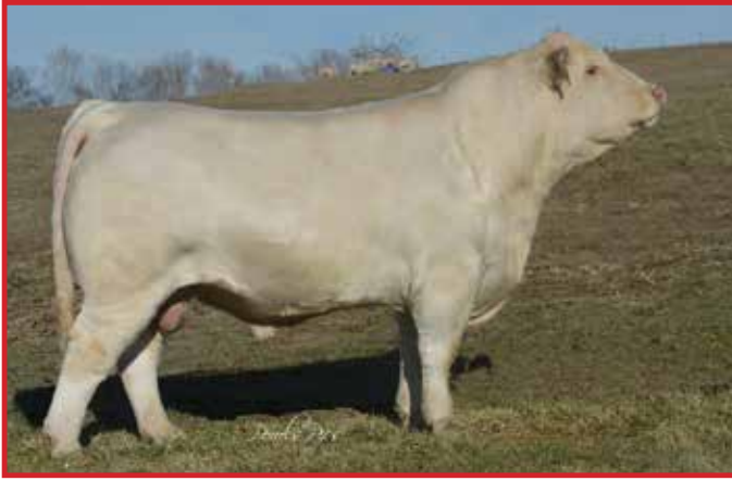
WC Capital Gain 2220 P ET — Sire of Lots 51-54