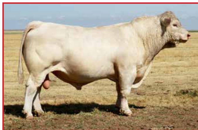
M6 Fresh Air 8165 P ET —Sire of Lots 3, 7, 8 & 9

PE 4-4-17 to 6-6-17 to LT Blue Mountain 1041 Pld and PE 6-6-17 to 6-22-17 to M6 Cool Bachelor 383 ET and PE 6-22-17 to 8-15-17 to M&M Ledger 2543 P/S