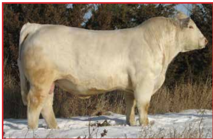
Key's Ten-Acious 166S—Sire of Lot 24