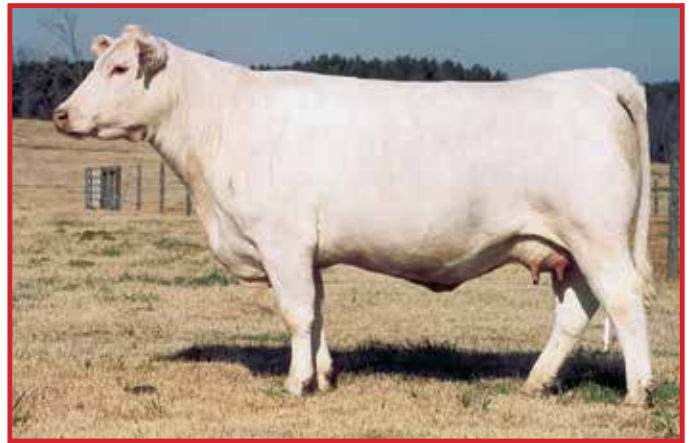
JWK Clarice J139 ET—Dam of Lots 60-62 & granddam of Lots 63-65. J139 is truly one of the great donors of the breed

AI 4-21-17 to LT Ledger 0332 P and PE 5-15-17 to 6-26-17 to M6 Ring Da Bell 469 ET