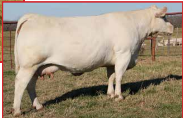
M6 Ms Bravo Grid 844 ET