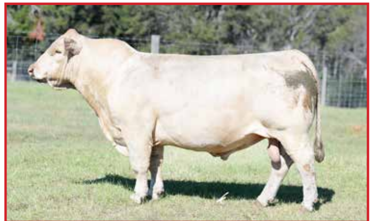
M6 Cool Bachelor 383 ET