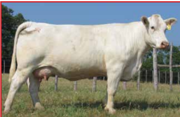
SR Lady Ease 914 ET — Dam of Fresh Air