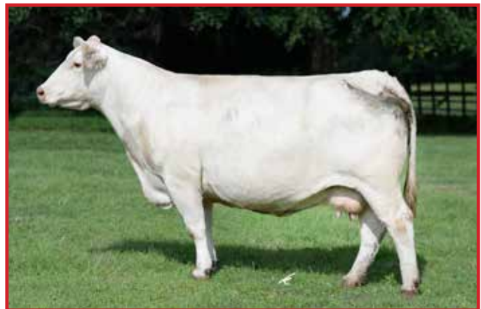
Double-H TLC Marion 0429 ET—Grand dam of Lots 94 & 96 & Paternal grand dam of Lots 91-92

AI 4-21-17 to LT Ledger 0332 P and PE 5-15-17 to 6-26-17 to M6 Ring Da Bell 469 ET