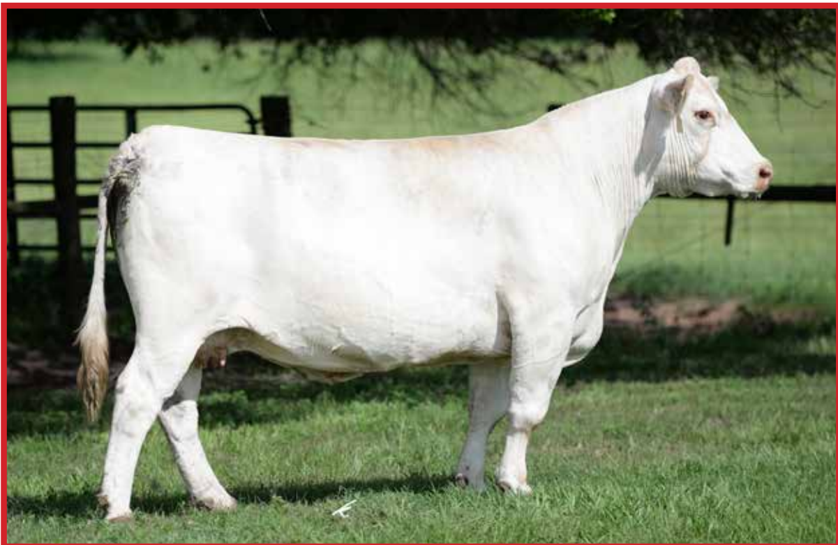
SCC Miss Duke 2507 ET

PE 1-18-17 to 4-7-17 to Southern Ledger 38028 and PE 4-10-17 to 8-15-17 to M6 Comfort Zone 565