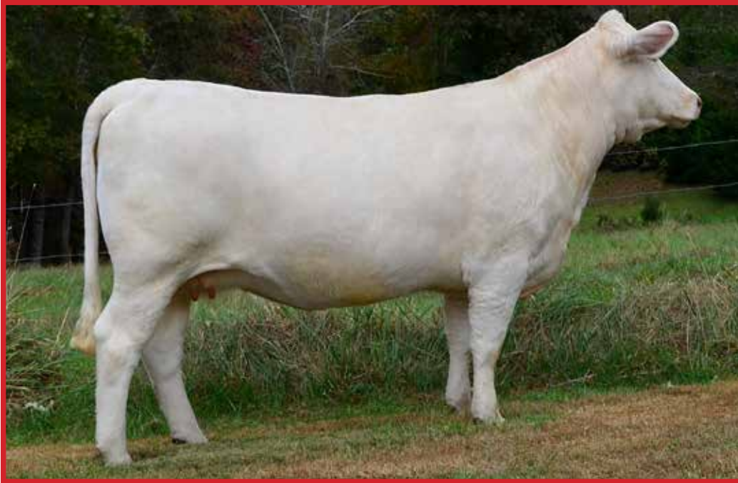
MV 934 Vanessa 280 ET