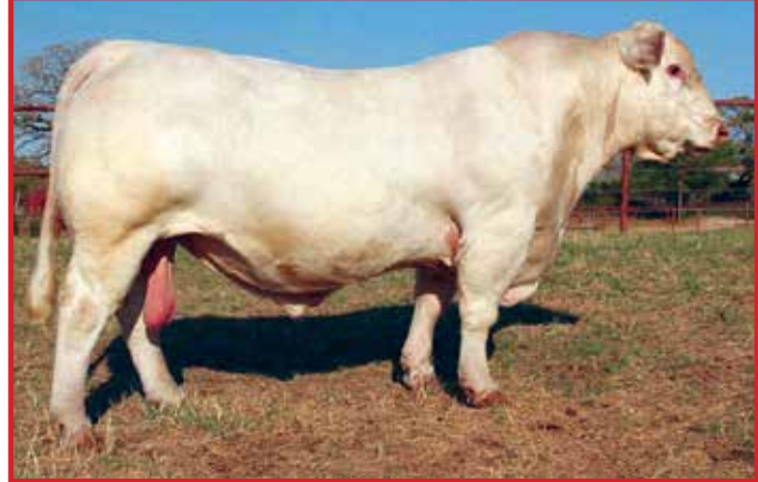
M6 New Standard 842 P ET –Sire of Lot 208