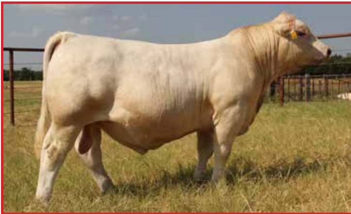
M6 Ring Da Bell 469 ET