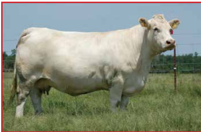
Link Ms 314 Value 136 P—Dam of Lots 159-162