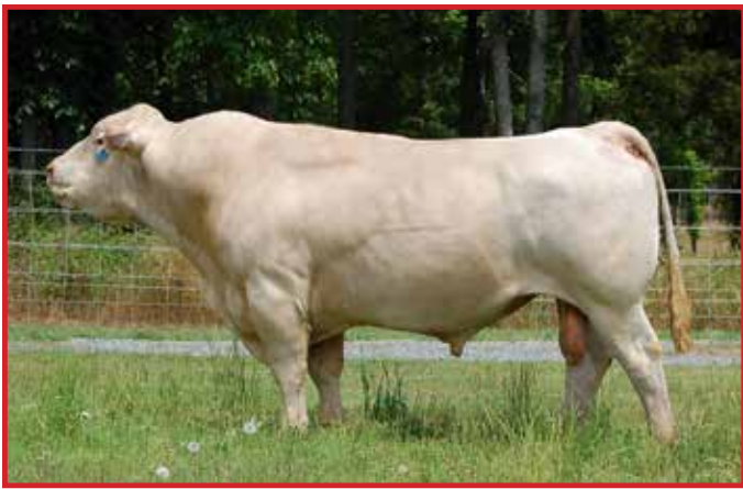
WCR Sir Duke 7340 P—Sire of Lots 308 & 311