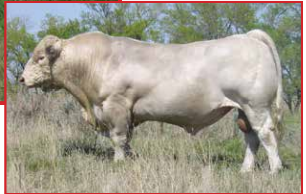
M6 Grid Maker 104 P ET

128 WEAVERS AMANDA 0811 3/8/2008 F1091467 P WCR SIR TRADITION 066 WCR SIR TRADITION 4402 IDEAL 809 45 OF 25 M6 GRID MAKER 104 PET VCR MISS MAC IV 317 M633377 WCR SIR FA MAC 2244 VCR MISS DUCHESS 113 PLD VCR SIR DUKE 914 PLD WCR SIR DUKE 761 WCR MISS MAC IV 534 WEAVERS AMANDA 0621 ASC ELIMINATOR 032 F1051600 WEAVERS JESSICA 0221 WEAVERS YVETTE