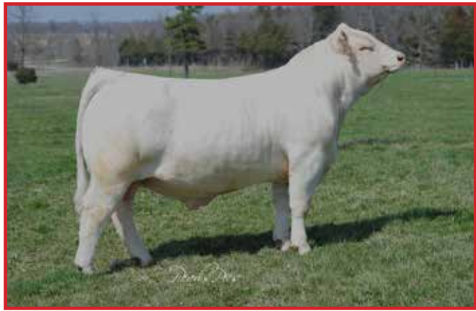
WC Benelli 2134 P ET— Sire of Lots 334, 336, 339, 343 & 345

AI 2-14-17 to LT Ledger 0332 P and PE 2-18-17 to 4-19-17 to Red Angus 5093C and PE 2-22-17 to 4-19-17 to M&M Ledger 2543 P/S and PE 4-19-17 to 8-15-17 to M6 Comfort Zone 565