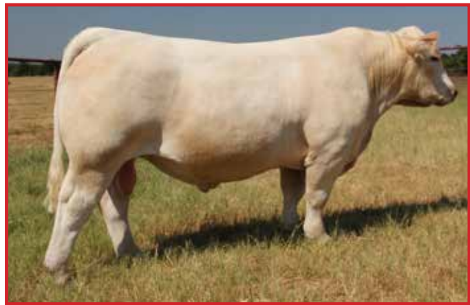
M6 Bells & Whistles 258 P—Sire of Lot 210