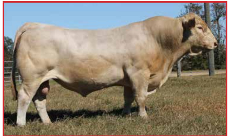
M6 Sleep Easy 734 Pld