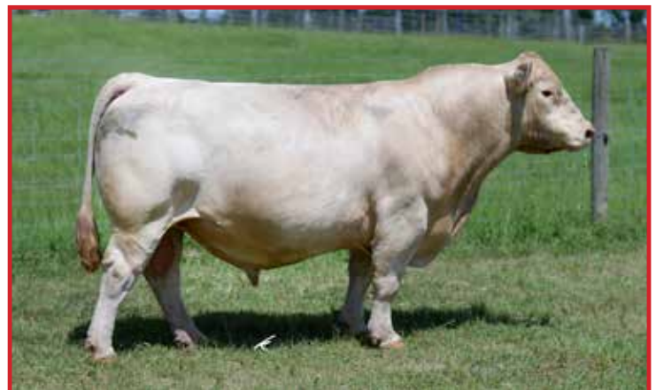
Southern Ledger 38028