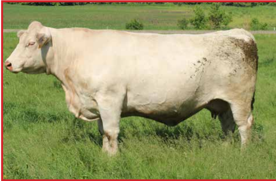
CJC Ms Cigar U124 — Dam of Lots 169-172

CJC Ms Cigar U124 was Double-H Charolais' Pick of the Herd from DeBrycker Charolais at $16,000! Lots of performance in these genetics.