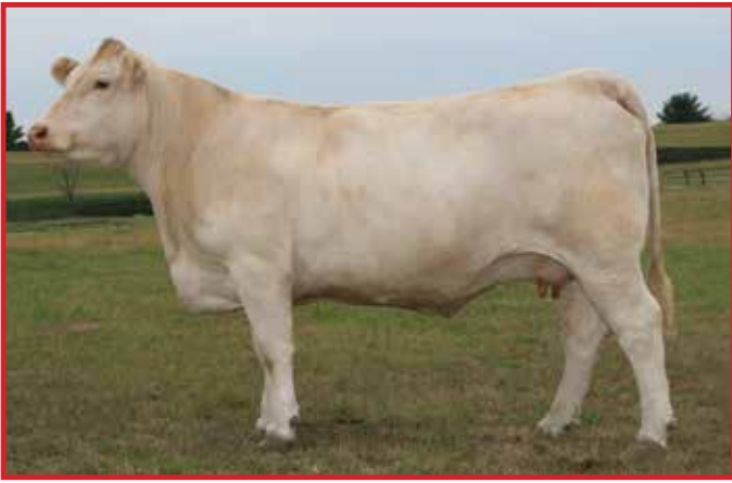
WCCC Ms Wind 448 ET—Dam of Lots 173-175

WCCC Ms Wind 448 was perhaps the best show heifer ever produced out of the $24,000 Baldrige Elvira 103H donor, but died early in life after producing a few embryos for SCC and Thomas Ranch.