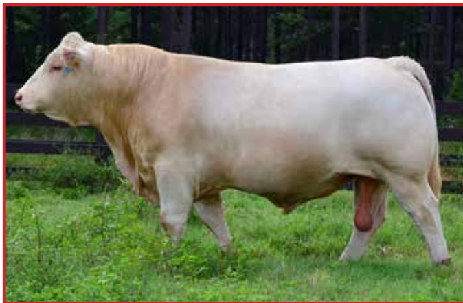
Bamboo/VPI Paradigm Shift 133 Y —Sire of Lots 11-13