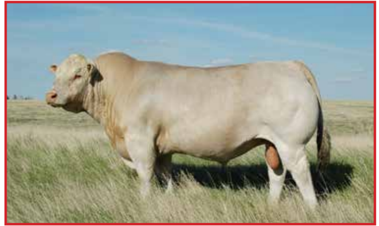
LT Ledger 0332 P