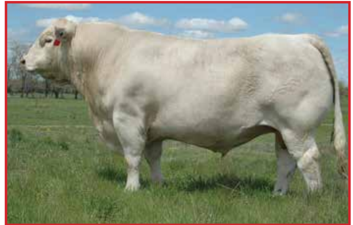
LT Bluegrass 4017 P—Sire of Lots 167 & 168