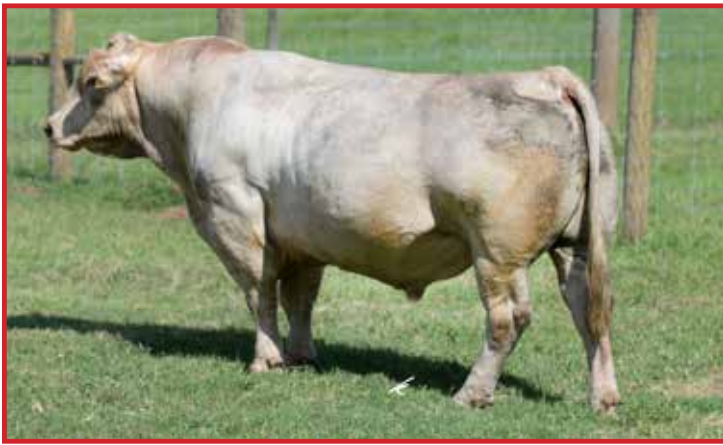
Southern Ledger 35084