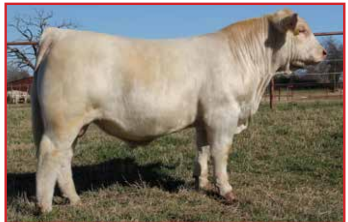
M6 Rock Star 306 P ET—Sire of Lots 290-291