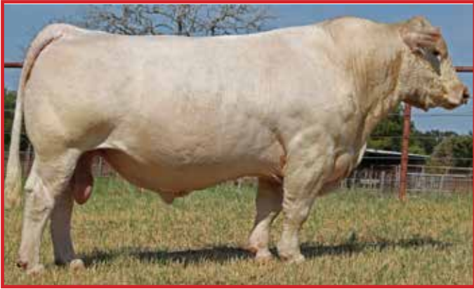
M6 Cool Rep 8108 ET— Sire of Lots 255-258