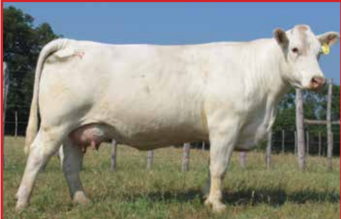
SR Lady Ease 914 ET— Dam of M6 Cool Rep 8108