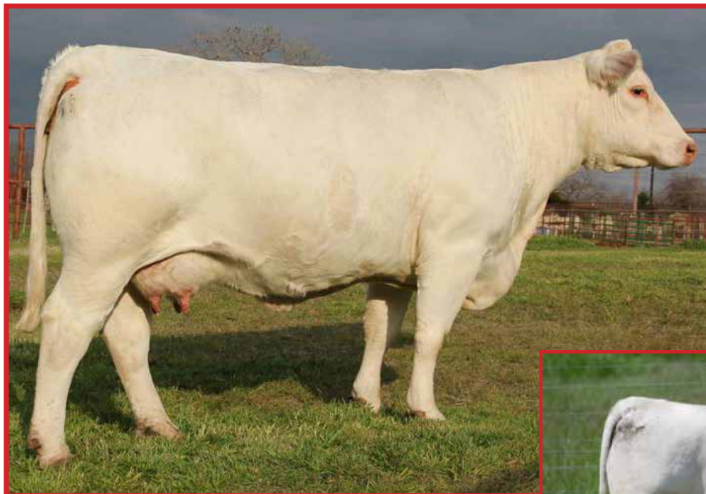
M6 Ms 761 Nancy 6100 P ET—Dam of Lots 132-135

M6 Ms 761 Nancy 6100 P ET is one of the great breeding pieces to come from using the semen from the old Duke 761 genetics. WCR Sir Duke 761 was born in 1987! Ms 761 Nancy 6100 has produced 91 progeny for registration at AICA. North Grove Charolais in Minnesota produced her most popular offspring sired by LT Ledger in which the first few progeny sold by them sold for $13,500, $18,000 and $41,000. #6100's dam #382 is a daughter of Nancy 106 previously mentioned one page back, the full sister to M6 Grid Maker and she (#382) has produced 67 progeny.