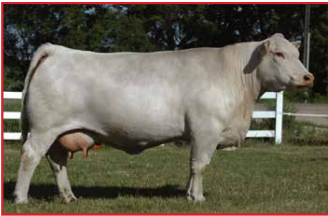
M6 Ms E46's Duke 248 PET

M6 Ms E46's Duke 248 P ET has taken her place as one of the breed's greatest donors! Besides being the maternal grand-dam of Lot 1 and New Standard 842 she has produced a total of 163 progeny registered at AICA, including one of the all-time high selling bulls in breed history M6 Right Now 5239 P ET at $170,000. Take a look at several ET sire groups on the following pages and see if you don't agree there is maternal strength and power in this large cow family!