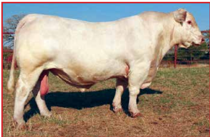
M6 New Standard 842 P ET—Sire of Lot 88