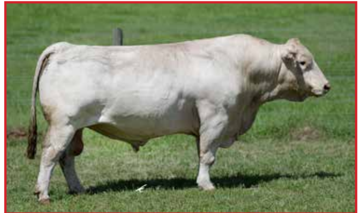
M6 New Rep 333 ET