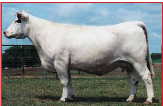
WCR Miss L06 5078 ET P

AI 4-21-17 to LT Ledger 0332 P and PE 5-15-17 to 6-26-17 to M6 Ring Da Bell 469 ET This very young heifer is a full sister to M6 Ms New Jewel 0155 Pld, the dam of Lots 114 and 115.