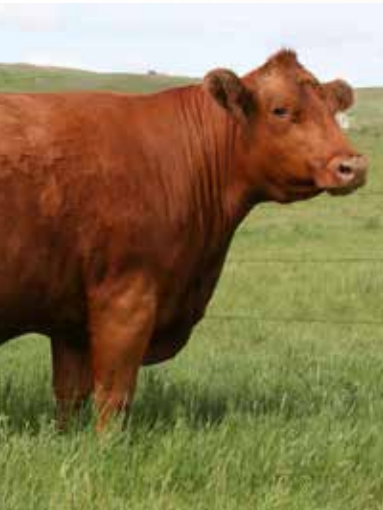
NDAM OF LOTS 27 - 29

Sadie M68 is one of the original Simmental purchases for RMVR and that great breeding female was the dam of TNT Top Gun who never missed. It is rewarding to continually see some of our very best still branching back to that impressive past donor. The Sadie cow line has always been good footed, solid udder and highly productive.