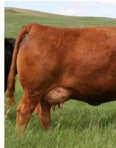
M68 - MATERNAL GRA

sire W/C HOC HCC RED ANSWER 33B W/C DEPTH CHARGE 0266E MISS WERNING 0266X dam KUNTZ SUPER DUTY 4Y RUST MISS 5215C TNT MISS SADIE M68