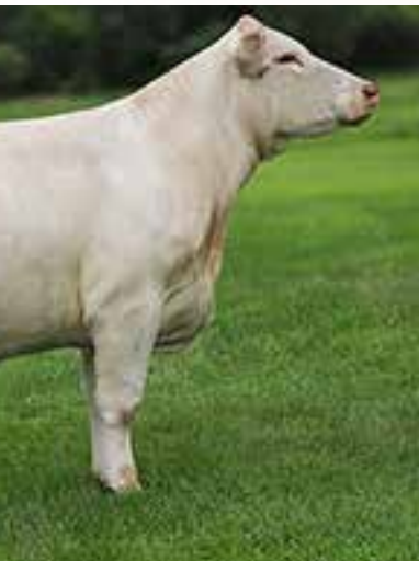
NOR DAME IN LOTS 38 - 47

sire LT LEDGER 0332 P DCR MR SUBSTANCE A240 JCH MS DOUBT W25 dam TR MR FIRE WATER 5792RET HARVIE MS IMPRESSIVE 267Z THOMAS MS IMPRESSIVE0641