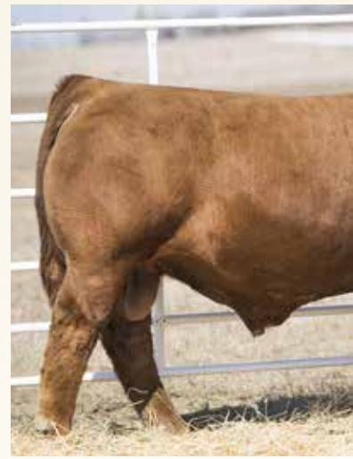
SIRE OF L

sire W/C HOC HCC RED ANSWER 33B W/C DEPTH CHARGE 0266E MISS WERNING 0266X dam COME AS U R RED ROCKET RUST MISS D6114D RUST MISS PRAIRIE WIND 113Y