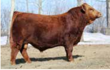
GRANDSIRE OF LOTS 28 & 29

sire W/C HOC HCC RED ANSWER 33B W/C DEPTH CHARGE 0266E MISS WERNING 0266X dam NUG ROYAL RED 324A RUST MISS 618D TNT MISS SADIE M68