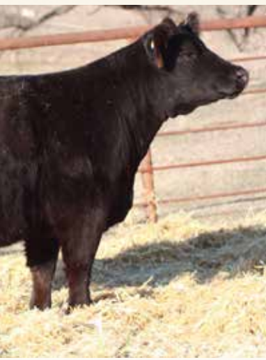
OTS 14 - 16

sire WHEATLAND BULL 630D IPU BENTLEY 81F CLAYHILL FANCY LUCA 39A dam YARDLEY HIGH REGARD W242 HARRELL ANGEL 5870C W/C MISS ANGEL 2870Z