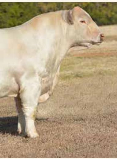
OTS 42 - 48