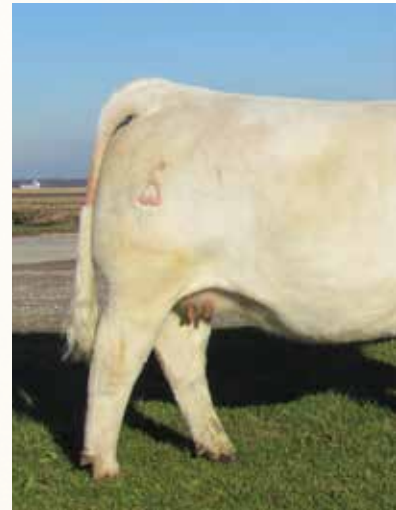
267Z - DONOR DA

sire MXS CAVIAR 515R WHITECAP LAREDO 232T HKS CUTTING EDGE LADY196P dam TR MR FIRE WATER 5792RET HARVIE MS IMPRESSIVE 267Z THOMAS MS IMPRESSIVE0641