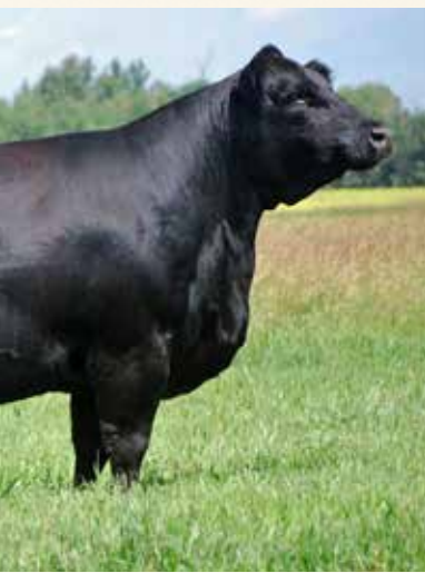
FULL SIB TO GRANDAM OF LOT 7 & 8

sire CCR COYBOY CUT 5048Z WS PROCLAMATION E202 WS MISS SUGAR C4 dam W/C NIGHT WATCH 84E RUST MS CERTIN FLIRT 909G RUST FLIRT 4 CERTIN 707E