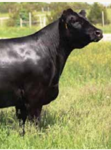
OTS 9 - 12

sire S A V PRESIDENT 6847 S A V AMERICA 8018 S A V MADAME PRIDE 0075 dam WAGR DREAM CATCHER 03R MISS WERNING KP 8543U MISS WERNING 534R