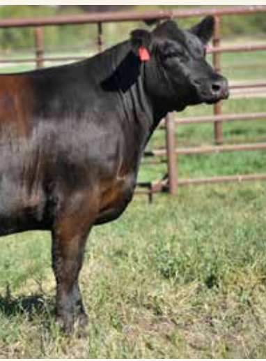
LOTS 1 - 3