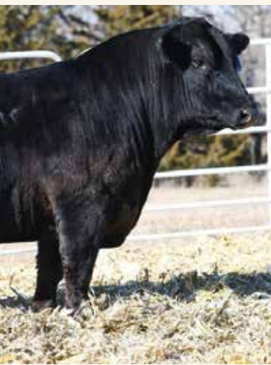
OTS 24 - 26