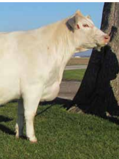
FROM LOTS 38 - 47