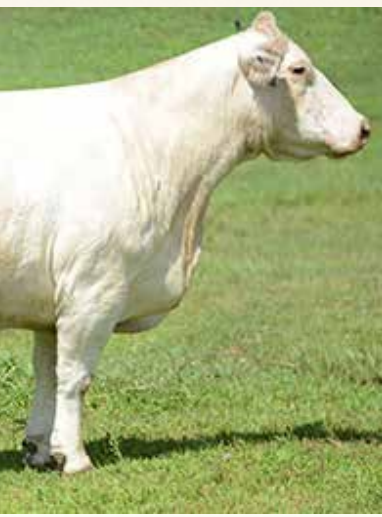
1 OF LOTS 38 - 47

sire LT LEDGER 0332 P DCR MR SUBSTANCE A240 JCH MS DOUBT W25 dam TR MR FIRE WATER 5792RET HARVIE MS IMPRESSIVE 267Z THOMAS MS IMPRESSIVE0641