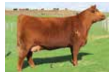
DAMAR MIMI W085 Maternal Granddam of Lot 23