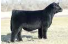
FIRES ZION 17H ET Sire of Lots 36 & 37