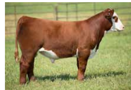
H BELL RINGER 8459 ET Sire of Lot 4