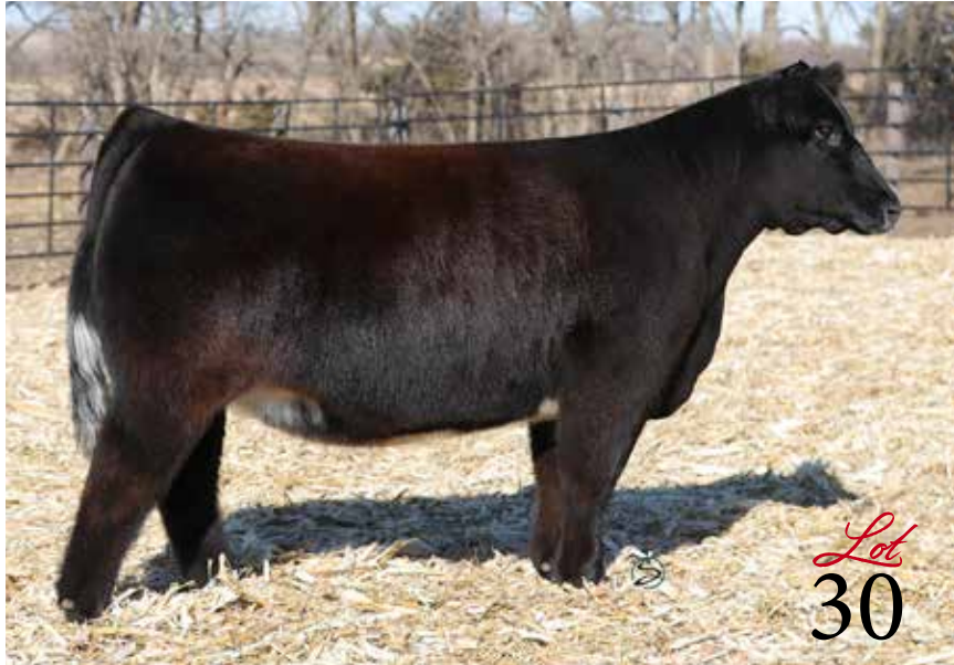
BBR KEIRA 824K