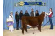
2022 NWSS RESERVE GRAND CHAMPION POLLED HEREFORD HEIFER Full Sister in Blood to Lots 6-9