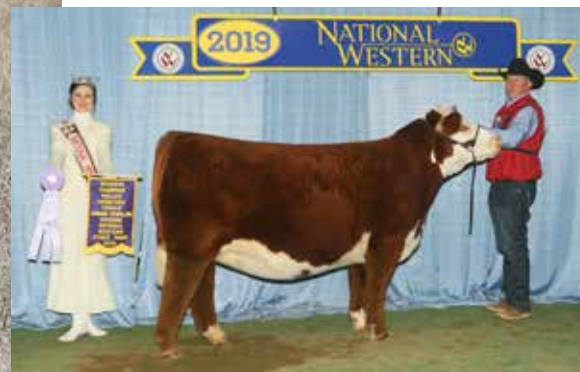
EXR MS DOM 7102 ET 2019 NWSS Reserve Division Champion