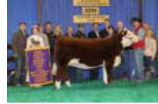
DELHAWK SAPPHIRE 102A ET Maternal Granddam of Lot 11