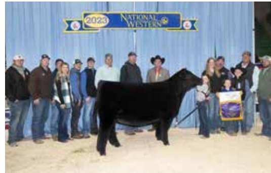
2023 NWSS GRAND CHAMPION MAINE-ANJOU HEIFER