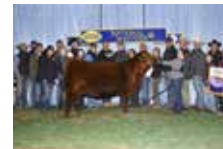
2019 NWSS GRAND CHAMPION RED ANGUS HEIFER Maternal Sister to Dam of Lot 23