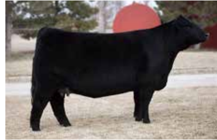
GEF MISS DOMINATRIX 236A Maternal Granddam of Lot 29

BOE EPIC DUEL ICON 802F DUEL WORRY NOT 4303B BBR ZYLER 11Z BBR MORGAN 1544C GEF MISS DOMINATRIX 236A