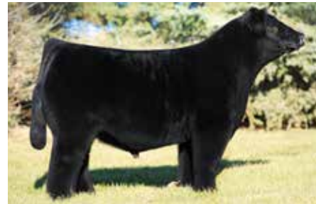
WYNNE IN DOUBT Sire of Lot 30

HERE I AM WYNNE IN DOUBT MF STRUCTURE 3452 "DONOR 6" BBR DENVER 1D ET BBR MORGAN 1824F BBR MORGAN 1547C