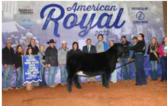
2022 AMERICAN ROYAL GRAND CHAMPION MAINE-ANJOU HEIFER