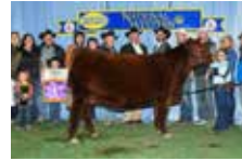
2020 NWSS GRAND CHAMPION RED ANGUS HEIFER Dam of Lot 22