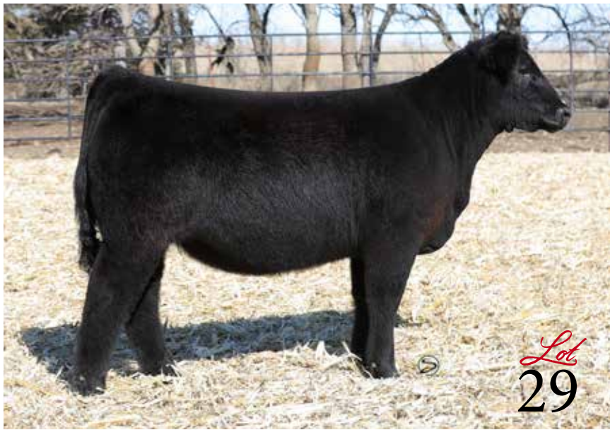
BBR KELLY 544K