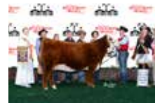
2017 FWSS GRAND CHAMPION HORNED HEREFORD HEIFER Full Sister to Dam of Lots 6-9