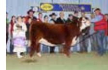
2016 NWSS GRAND CHAMPION HORNED HEREFORD HEIFER Full Sister to Dam of Lots 6-9