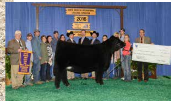
RIVERSTONE CHARMED 50C Maternal Granddam of Lots 26 & 27