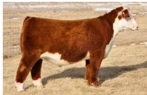
BNR AMERICAN MADE 906 ET Service sire to Lot 1 and sire of Lot 2