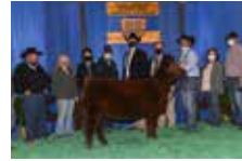
2020 NAILE RESERVE GRAND CHAMPION RED ANGUS HEIFER Full Sister to Lot 22