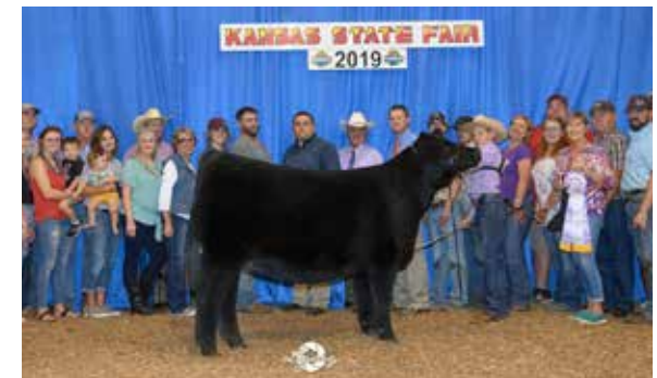
RATLIFFS FLIRT 892F ET Dam of Lots 26 & 27