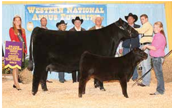
EXAR FRONTIER GAL 1405 Maternal Granddam of Lot 19