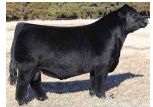
JSUL SOMETHING ABOUT MARY 8421