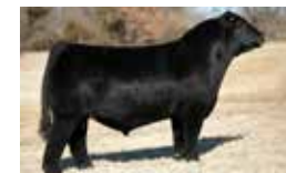
BKMT GAME ON 227G ET Sire of Lot 38