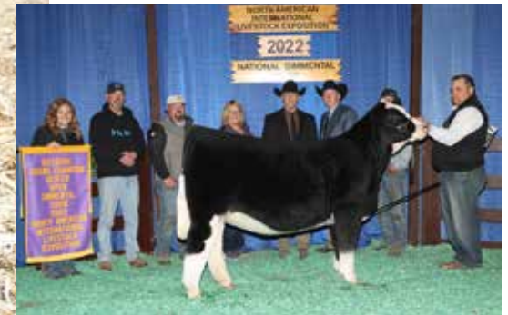
2022 NAILE RESERVE GRAND CHAMPION PB SIMMENTAL HEIFER