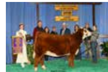
2018 NAILE GRAND CHAMPION HEREFORD HEIFER Maternal Sister to Dam of Lots 6-9