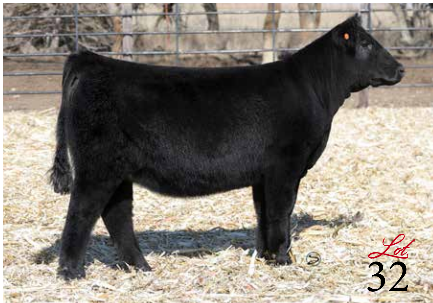
SN ERIKA 285K