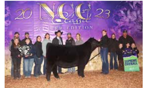
2023 NCC - THE CLASSIC GRAND CHAMPION BREEDING HEIFER