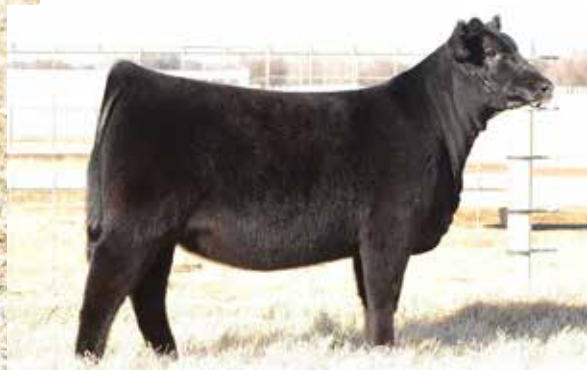
EXAR FRONTIER GAL 6833 Dam of Lot 19

BC II SKYFALL 2812 EXAR FRONTIER GAL 6833 EXAR FRONTIER GAL 1405