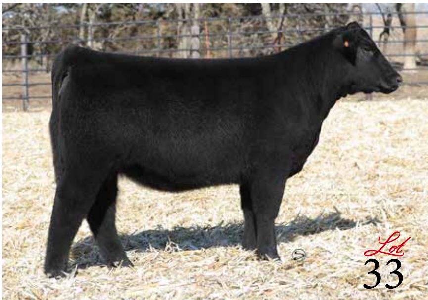
SN BLACK MAGGIE 280K