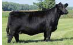
MISS IZZY 1207Z Dam of Lots 36