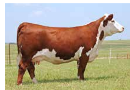
STAR KKH SSF OLIVIA 15U ET Dam of Lot 4

REMITALL ONLINE 122L STAR KKH SSF OLIVIA 15U ET SSF KEYSHA 949