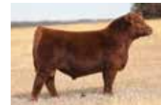
SIX MILE PARABELLUM 675G Sire of Lot 23