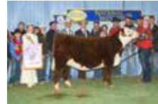
2020 NWSS RESERVE GRAND CHAMPION POLLED HEREFORD HEIFER Full Sister to Dam of Lot 11