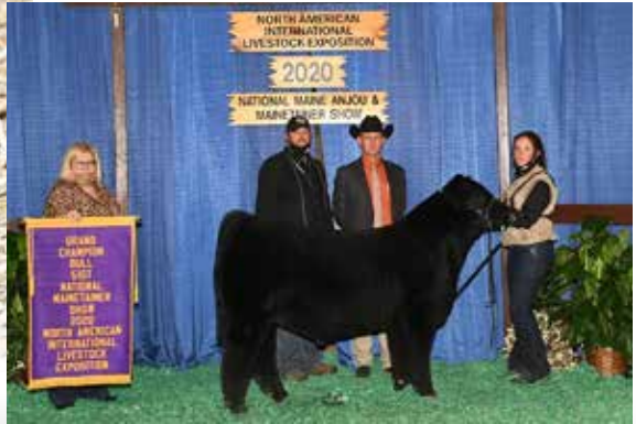
DUNK YELLOWSTONE 027H Sire of Lot 28

MCCURRY THUNDER 5400 BBR MORGAN 1979G BNWZ LADY DI 25A