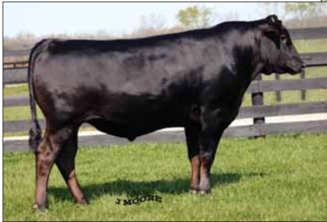
GAF Harukatani, full sib to Lot 11.