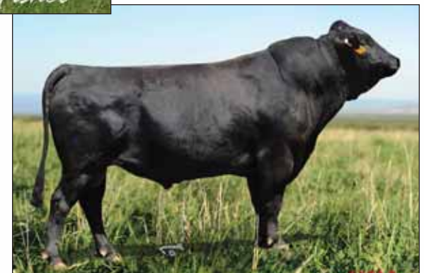
Bar R Sanjirou 4P, sire of Lot 22 heifer calf.