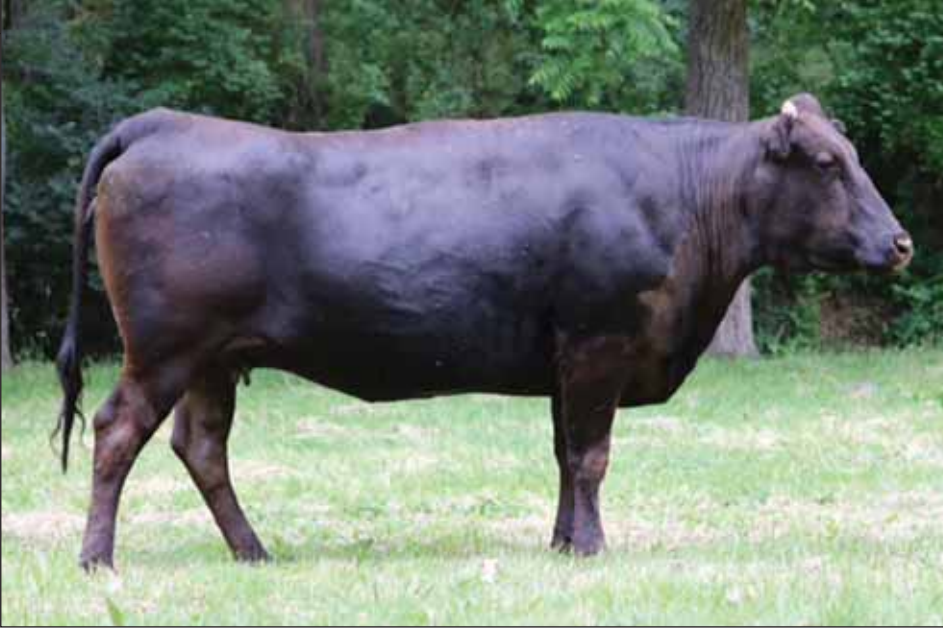
Suzito 3, dam of Lot 14 embryos.