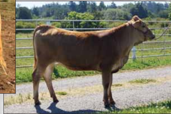
IWG MS Shigemaru 95, Lot 46