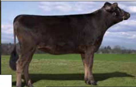
Bay Misao ET, dam of several Lots selling.