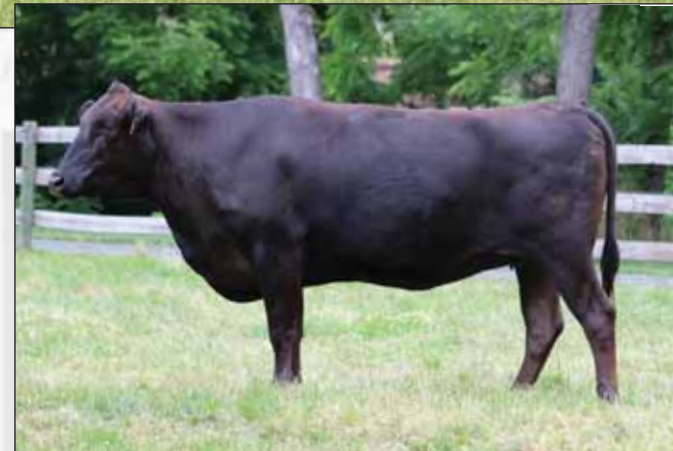
ESF Shigetani 42-250, dam of Lot 55.