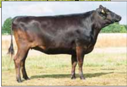
Sapporo, full sister to Lot 10 dam.