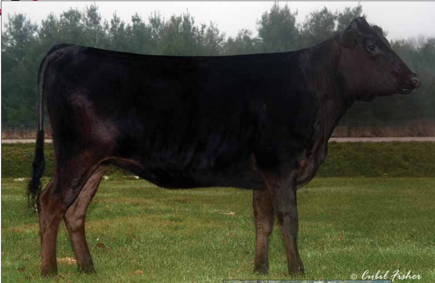
Bay Mak Mana 129, dam of Lots 19 - 23.