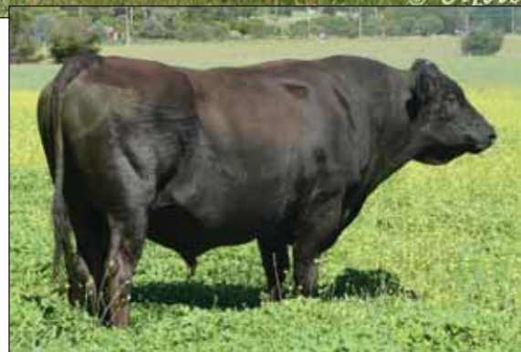
Westholme Hirashigetayasu Z278, sire of Lot 21 heifer calf.