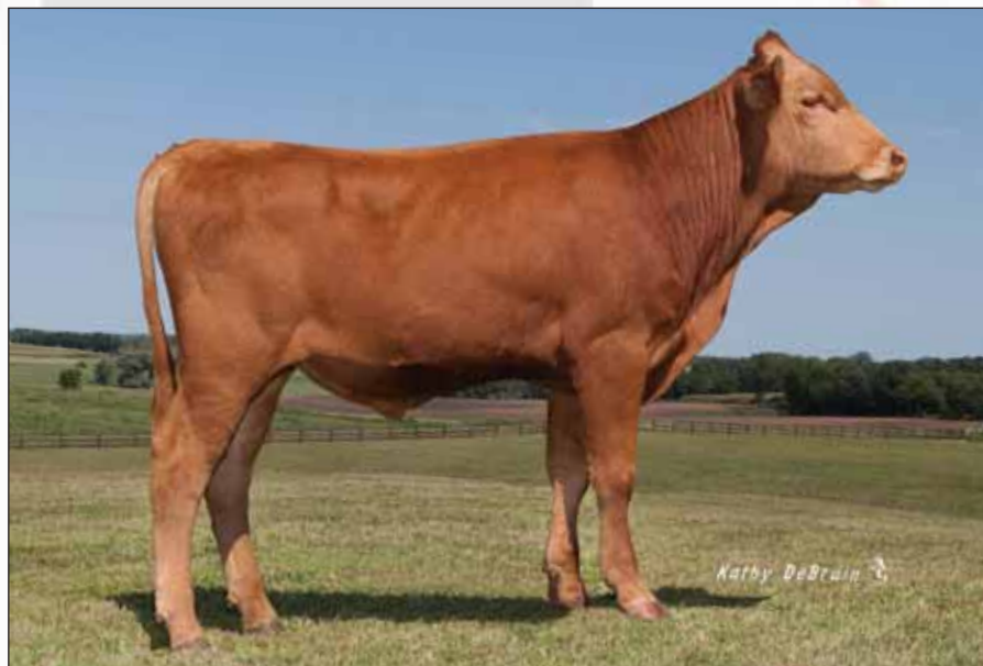
IWG 145, Lot 61

Consigned by Idaho Wagyu Genetics, Soda Springs, ID