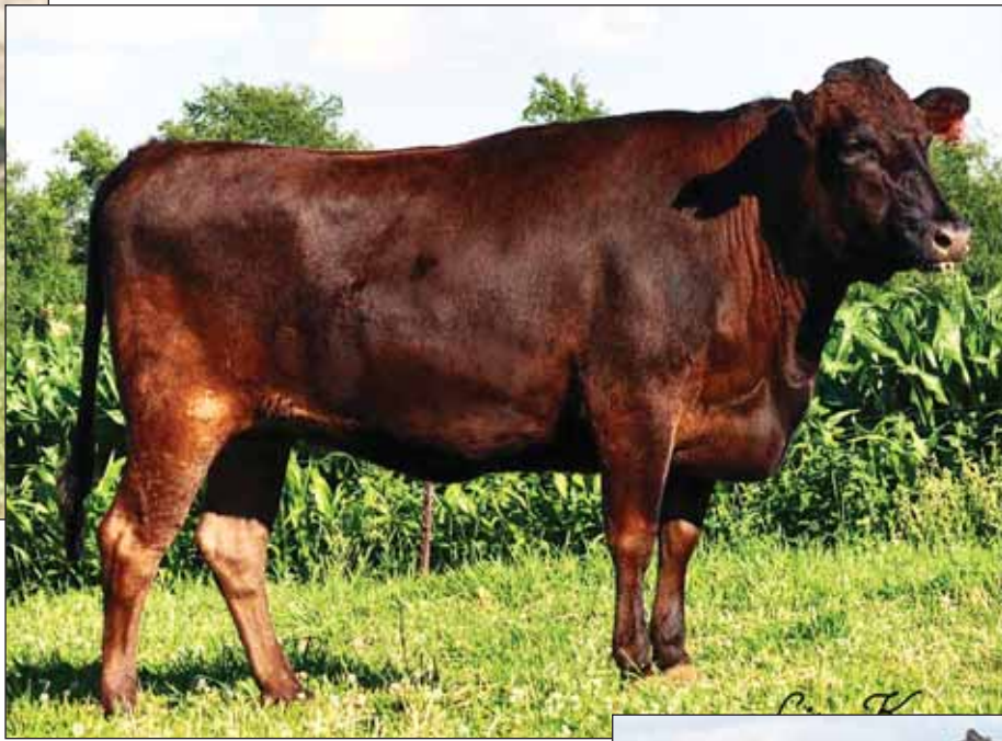
Bay Itomichi 1/2 Toshimi 175, dam to Lot 10 embryos.