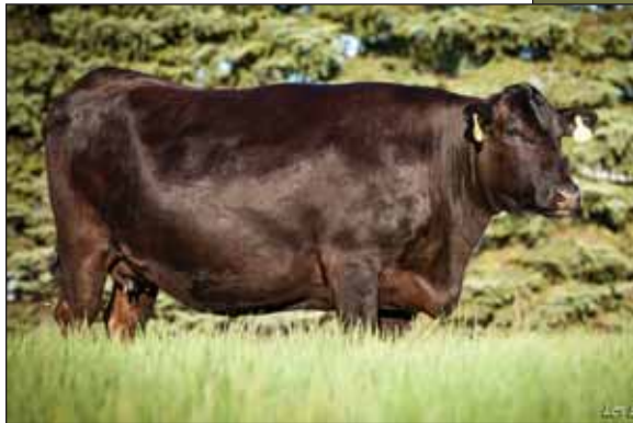
Bay Kiseki 87 -ET, dam of Lot 47.