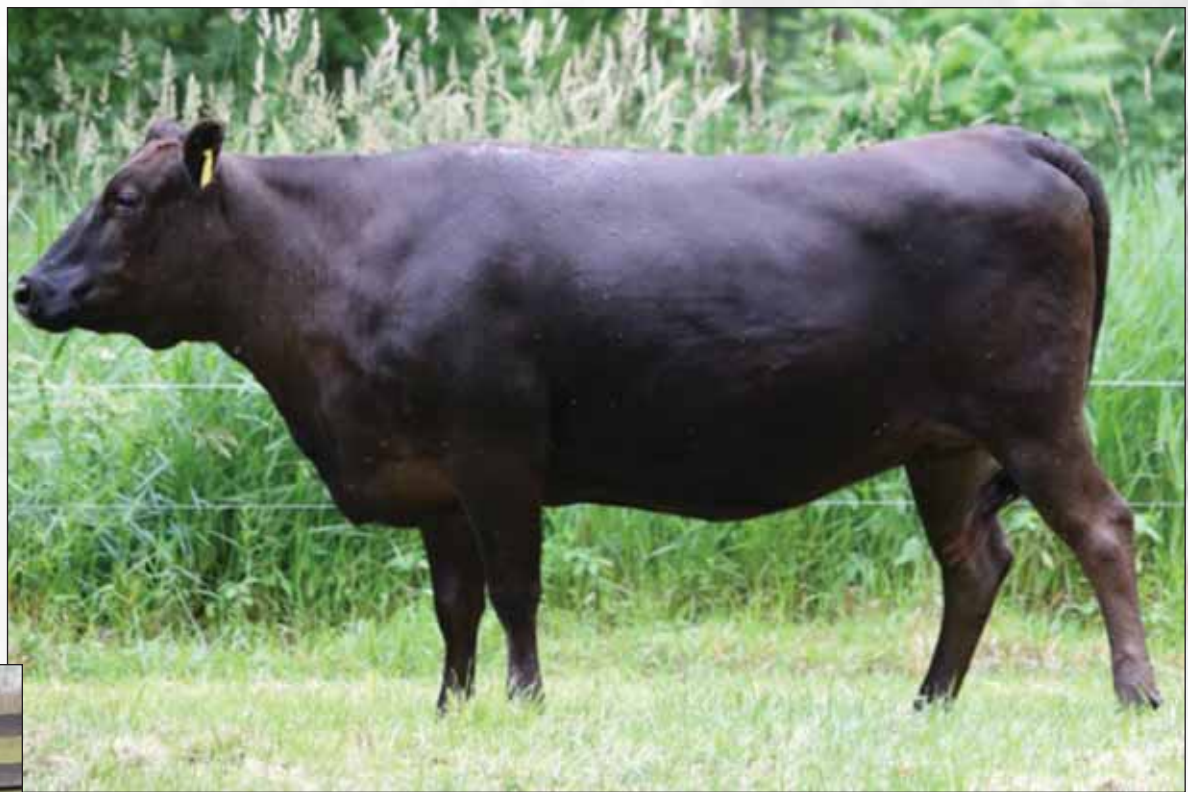
BPF Ms Mich 109, dam of Lot 11 embryos.