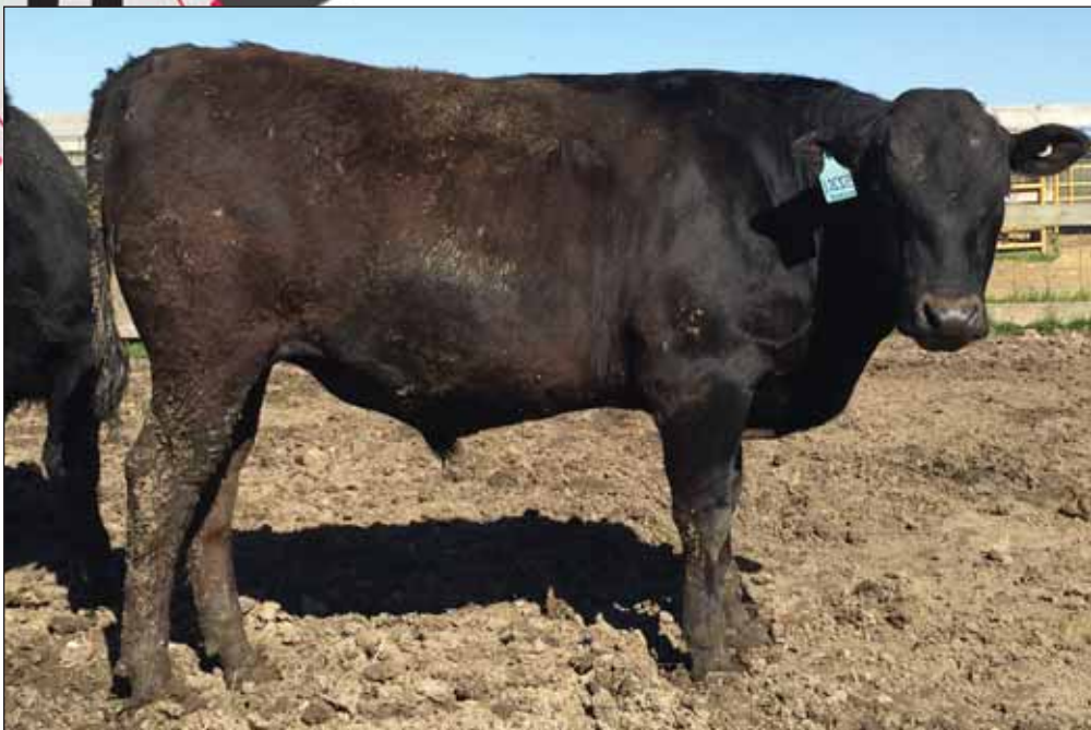
MFC Michiyoshi 522C, Lot 62