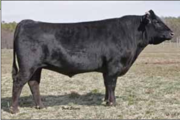
Ichiro, full brother to Suzito 3, dam of Lot 14 embryos.