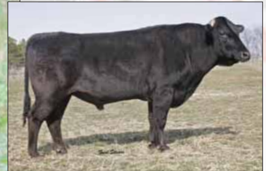
BPF Mr San 4, a full brother to CHR MS Sanjirou 313, dam of Lot 50.