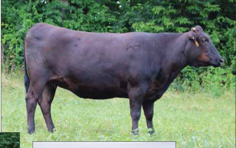
Sarah P, dam of Lot 13 embryos.