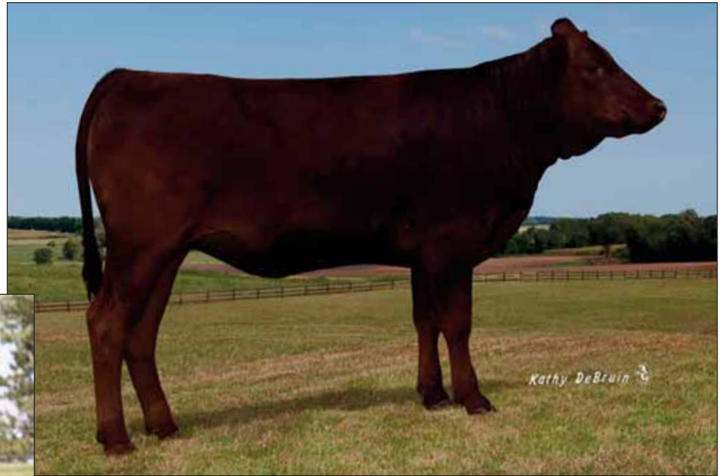
HPW Keiko -ET, dam of Lot 66.