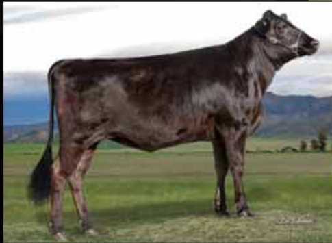
Bay Hero Kiku 172, Lot 50