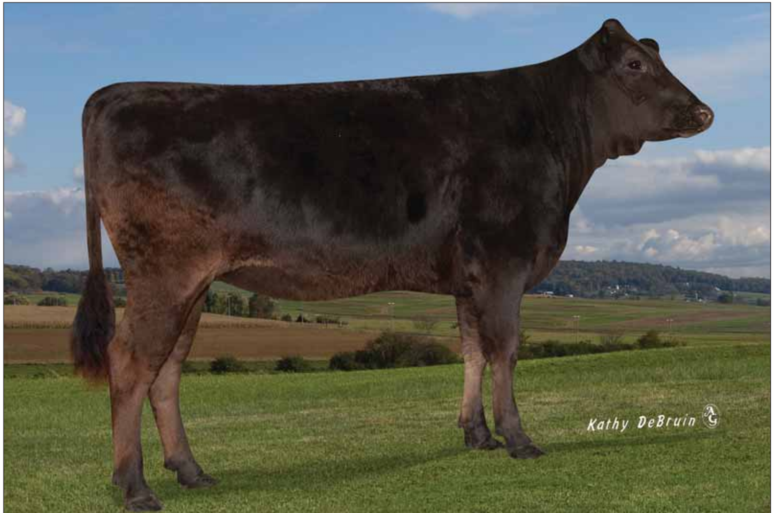
JC MS Hakari 84, Lot 51