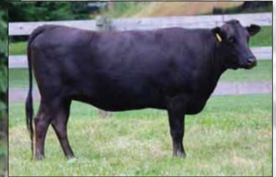
CHR MS Sanjirou 313, dam of Lot 50.