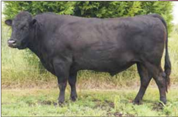
CHR Itosuru Doi 282T, sire of Lot 59.