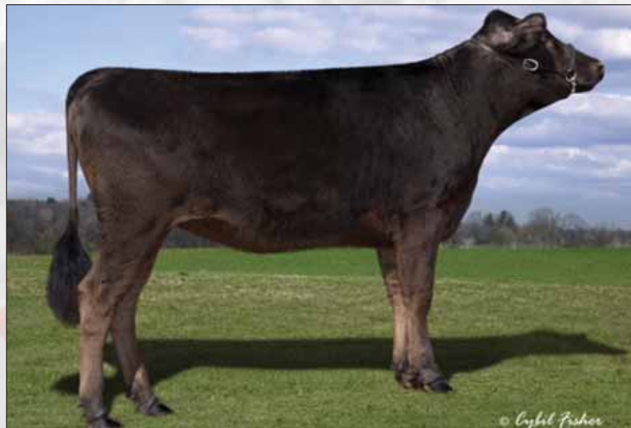
Bay Misao ET, dam of Lot 27 & 28.

Consigned by Designer Wagyu, Fon du Lac, WI