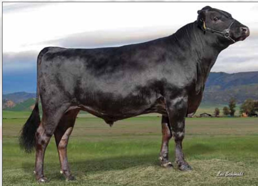
Bay Itomichi 1-2 Houdini 170, Lot 60

Consigned by Baycroft Wagyu, De Pere, WI