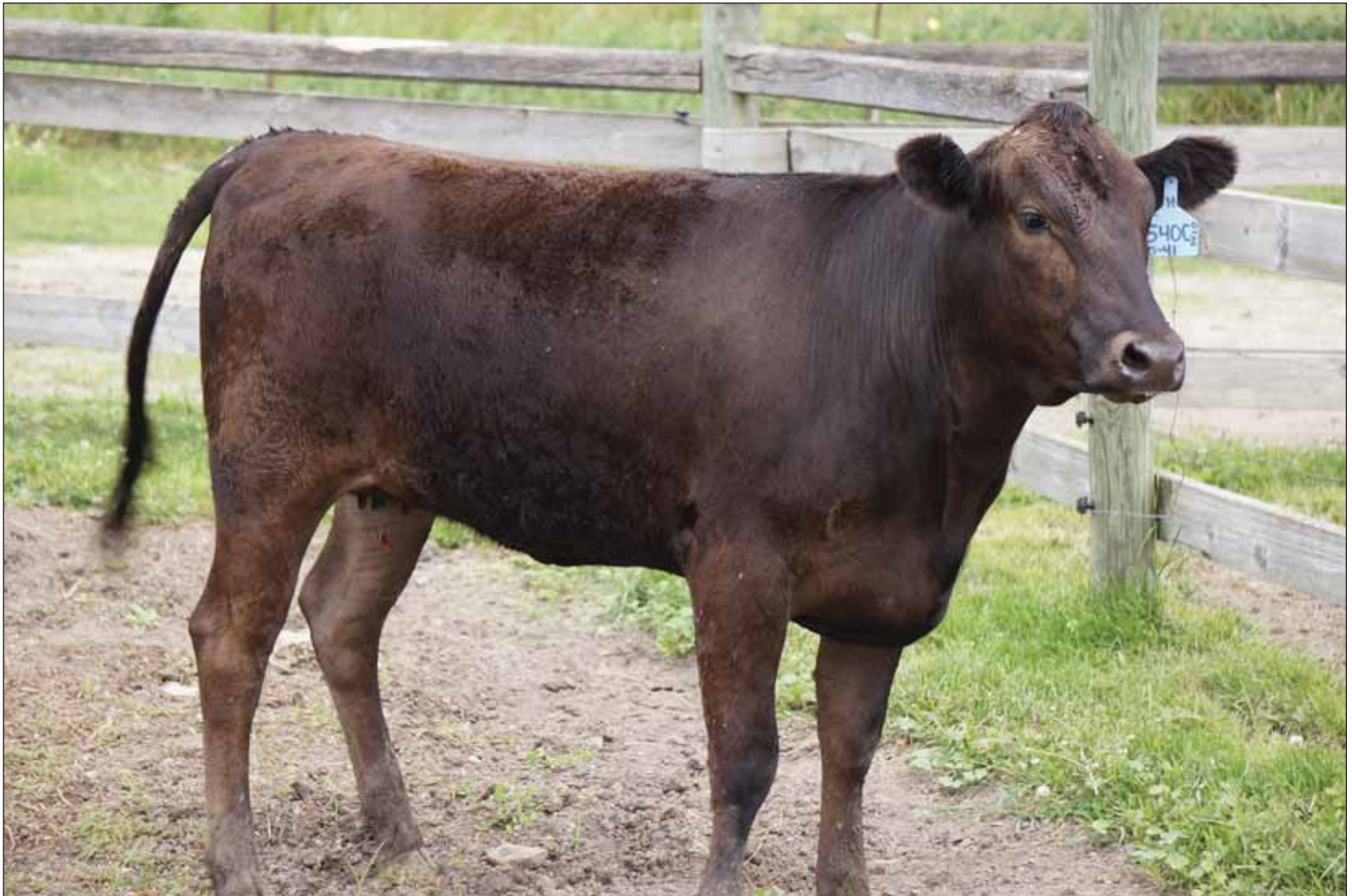
MFC Itomoritaka 40C, Lot 56