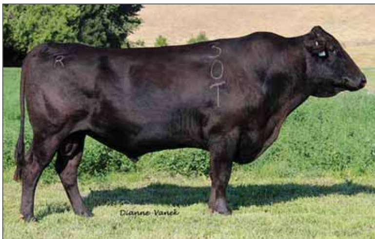
Bar R Shigeshigetani 30T, son of Lot 1 Donor, and sire of Lots 3, 4 & 5.