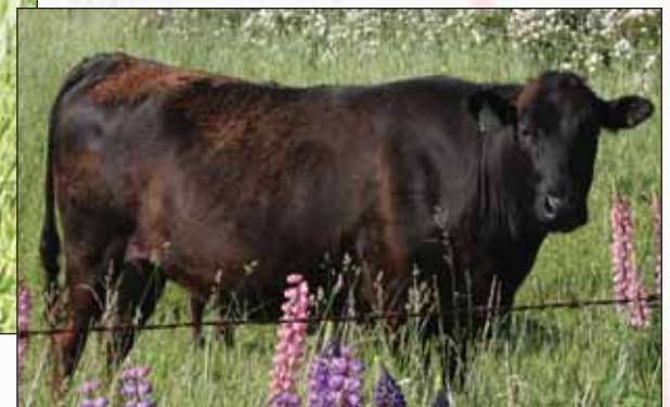
MS Kikuyasu 220Z, dam of Lot 52.