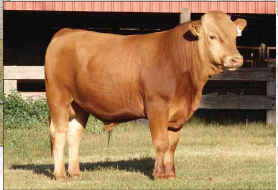
Academy Red Wagyu J34