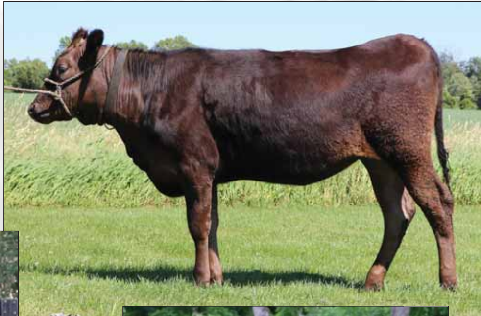
Synergy Z278 Yuritani 31, Lot 55