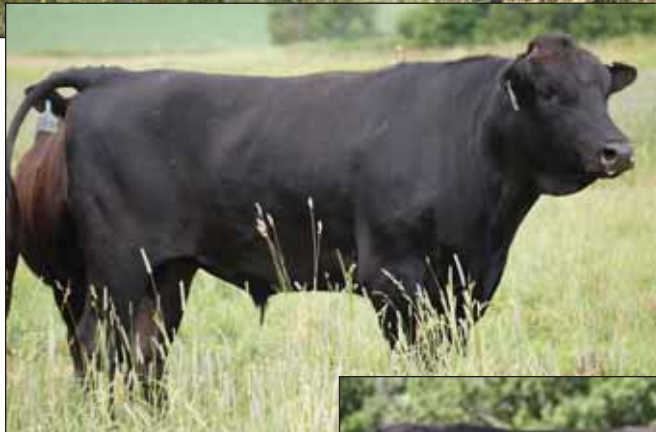
MFC Kimitofuki 434B, sire to Lot 15 embryos.