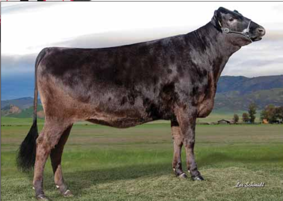
Bay Shige Mika 168, Lot 53