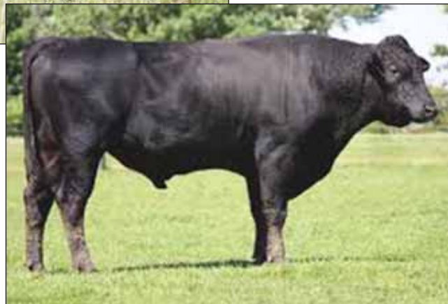
Michiyoshi, sire to Lot 16 embryos.