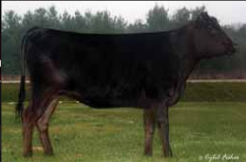
Bay Mak Mana 129, dam of several Lots selling.