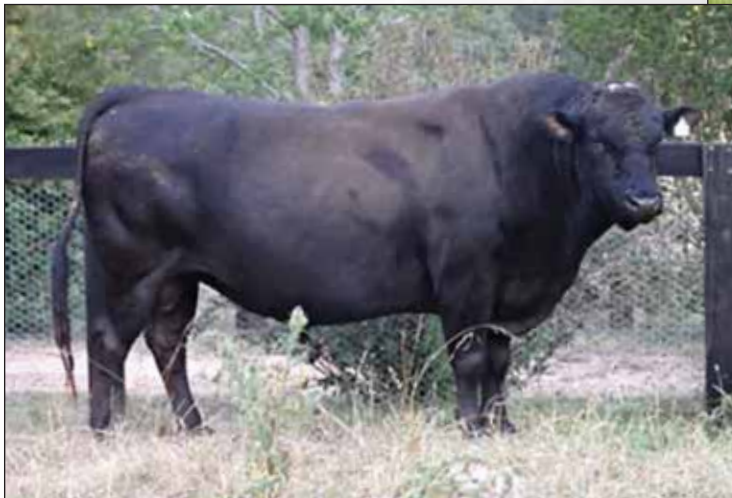
Westholme Hirashigetayasu Z278, sire of Lot 55.