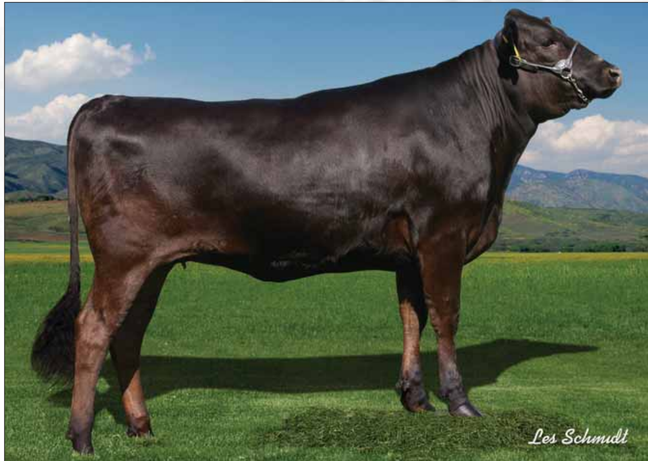
Bay Itomichi 1-2 Mi 171 ET, Lot 48