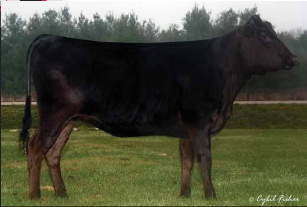
Bay Mak Mana 129, dam of Lot 6 embryos.