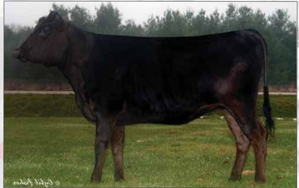
Bay Mak Mana 129, dam of Lot 64.

Consigned by Designer Wagyu, Fond du Lac, WI