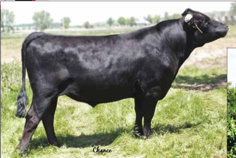
CHR Hirashige Tayasu 533, sire of Lot 10 embryos.