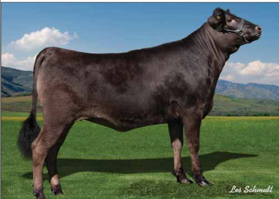
Bay Michifuku Blue Moon 182, Lot 54

Consigned by Baycroft Wagyu, De Pere, WI