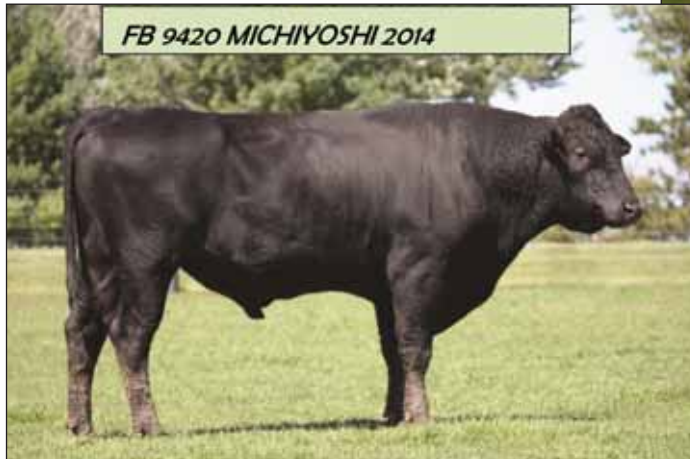
Michiyoshi, sire of Lot 66.