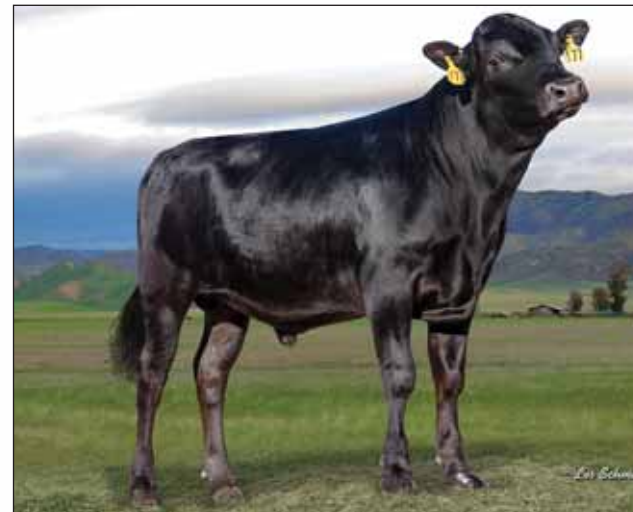
Bay Ito Macho 177

Consigned by Triangle B Ranch, Stigler, OK