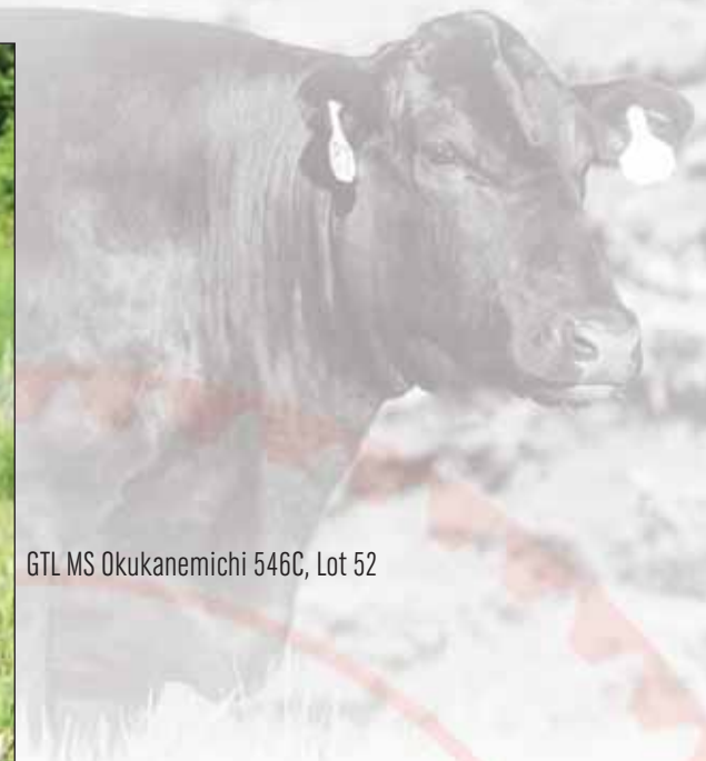
GTL MS Okukanemichi 546C, Lot 52