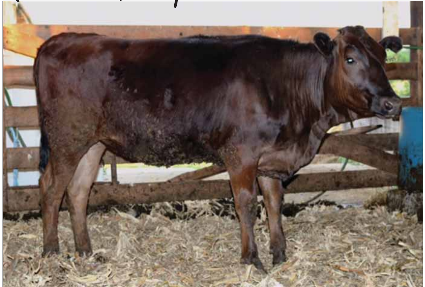
Stud Shig-Yuriko 148NB, Lot 49