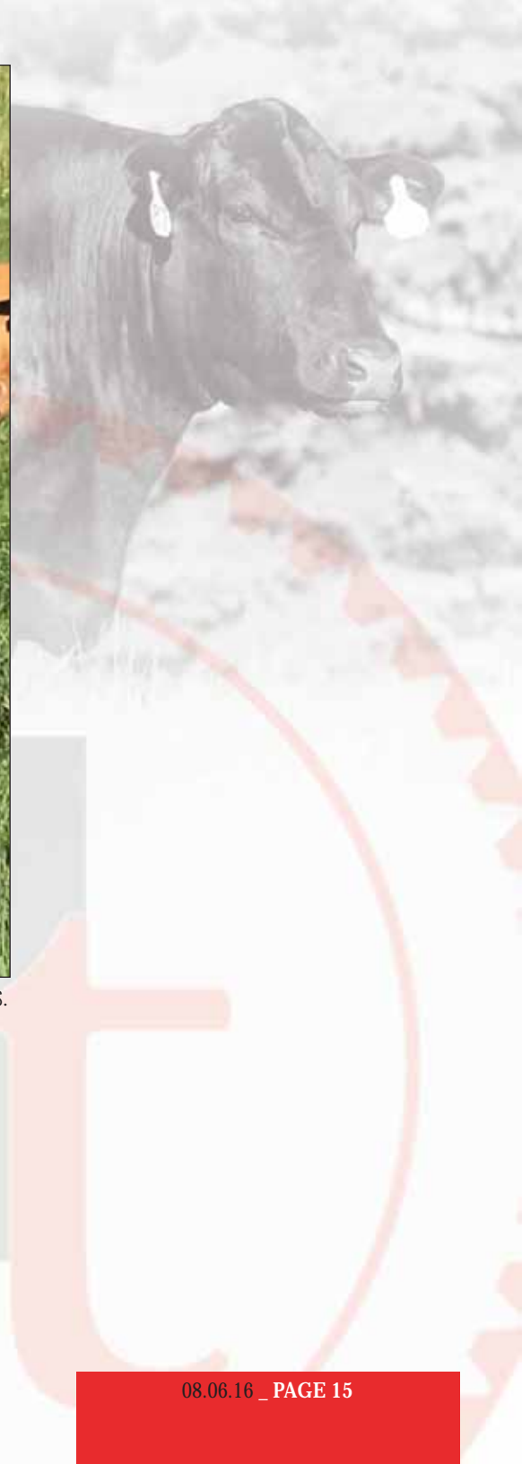
IWG Judo 76Z, dam of Lot 17 embryos.