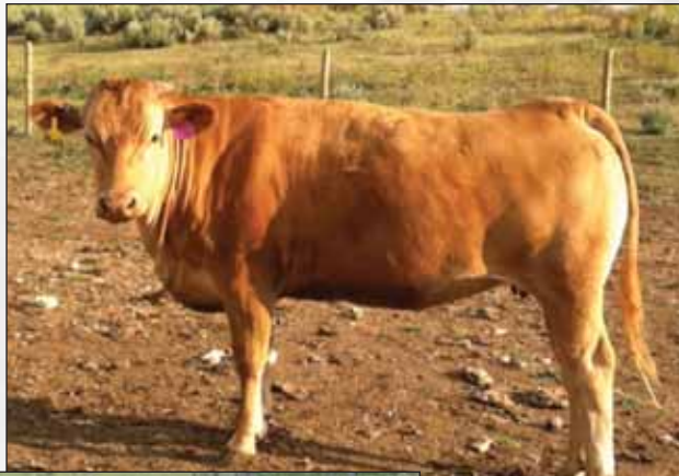
Gabni Rubi, dam of Lot 49.