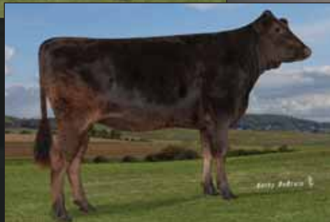
JC MS Hakari 84, Lot 58