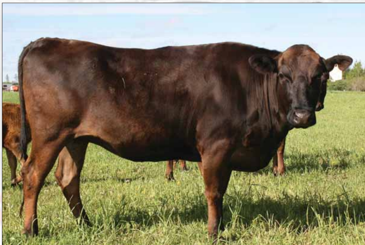
GTL Ms Shigeshigetani 232A, dam of Lot 9 embryos.