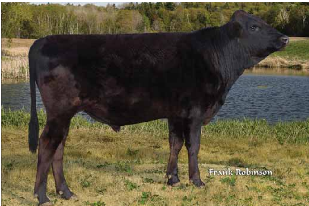
Webbco Michiyoshi B113, Lot 63

Consigned by Muddy Flats Cattle Co., Augusta, WI