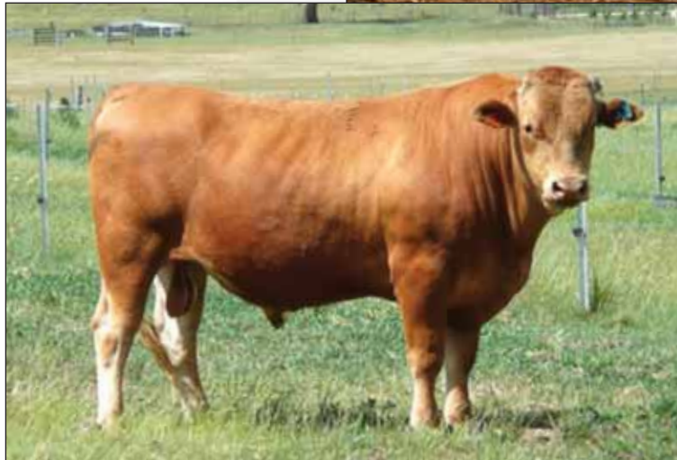
Kalanga Red Star, sire of Lot 49.