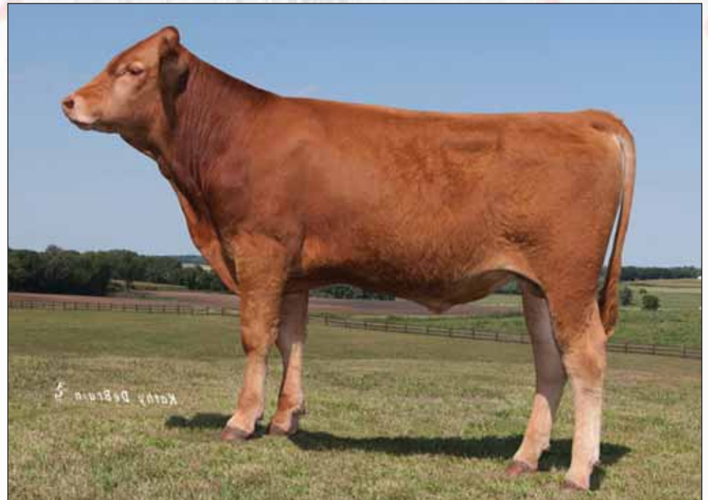
IWG 140, Lot 65