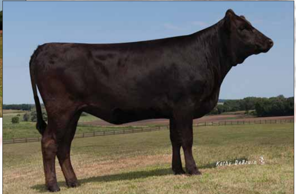
HPW Kia -ET, Lot 58