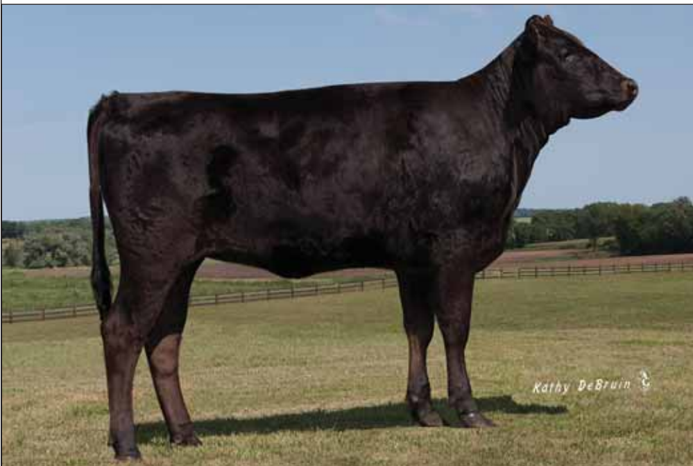
Bay Sanj Kumiko 147, dam of Lot 7 embryos.