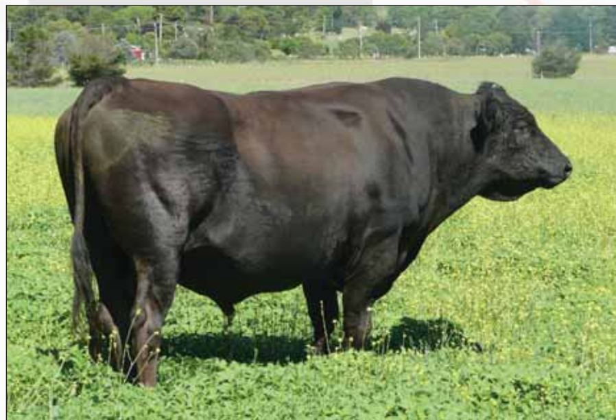
Westholme Hirashigetayasu Z278, sire of Lot 28.

Consigned by Designer Wagyu, Fon du Lac, WI