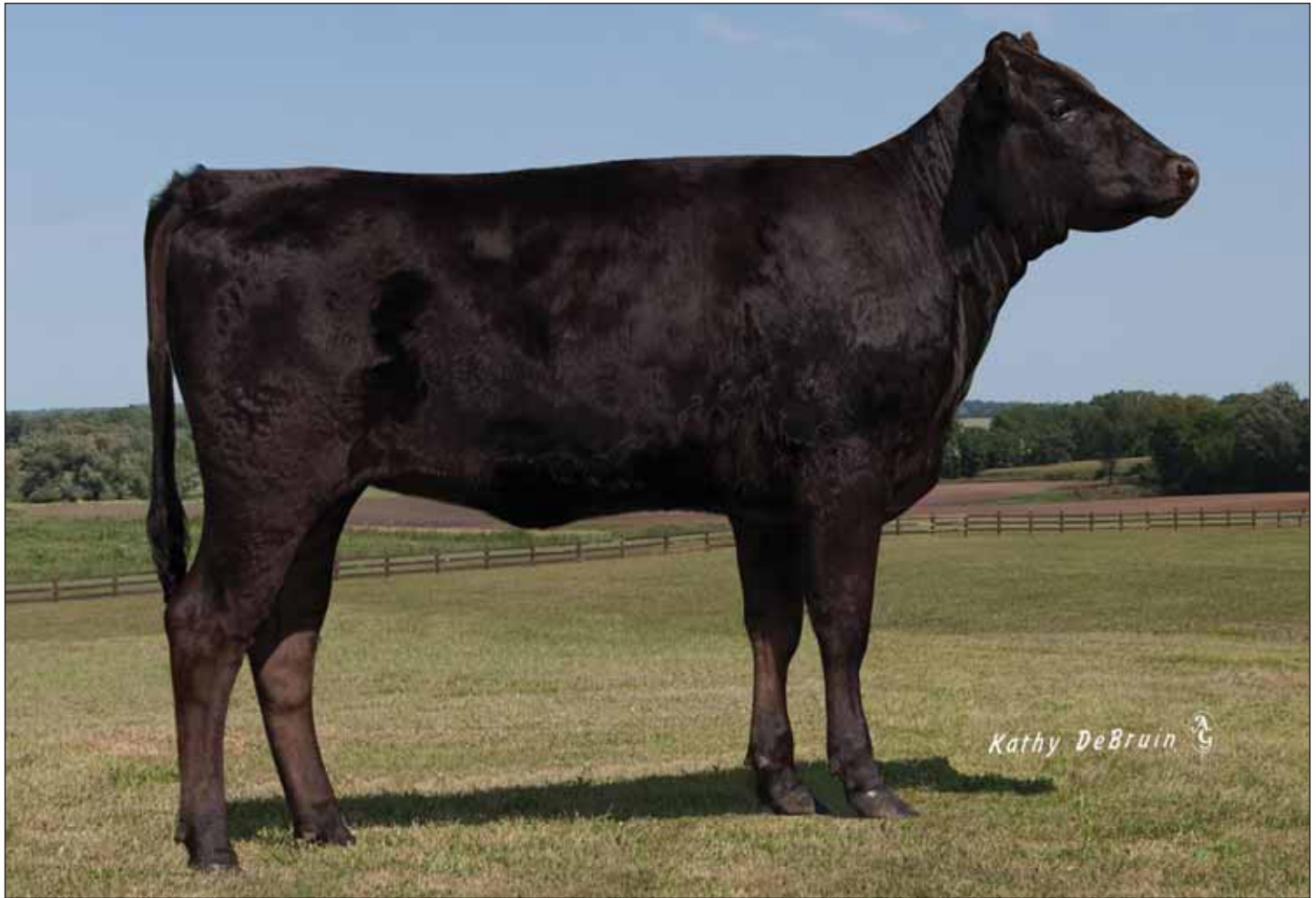
Bay Sanj Kumiko 147-ET, dam of Lot 24 planned heifer mating.