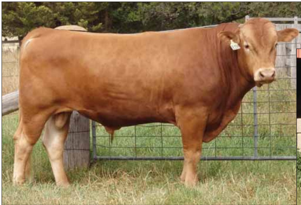
Academy Red Wagyu Tambo H18