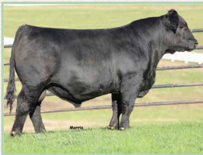
AUTO Power Plus 135B | Sire of Lot 109A

LOT 109A: AUTO 601E. HB/HP heifer born 1/9/17, sired by AUTO Power Plus 133B A direct daughter of AUTO Pia 245X, one of the greatest daughters of 292S in existence.