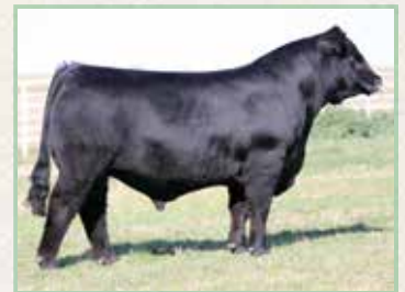
SSTO 588C | Full sib to Lot 83