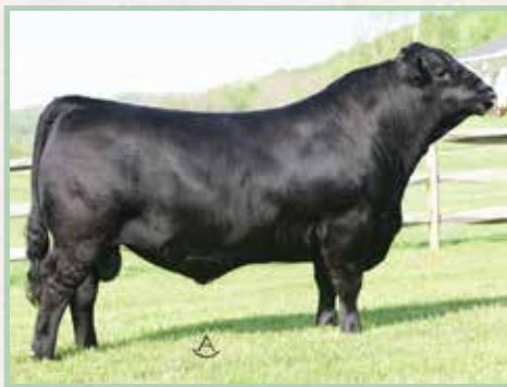
TMCK Cash Flow 247C | Sire of Lot 80A