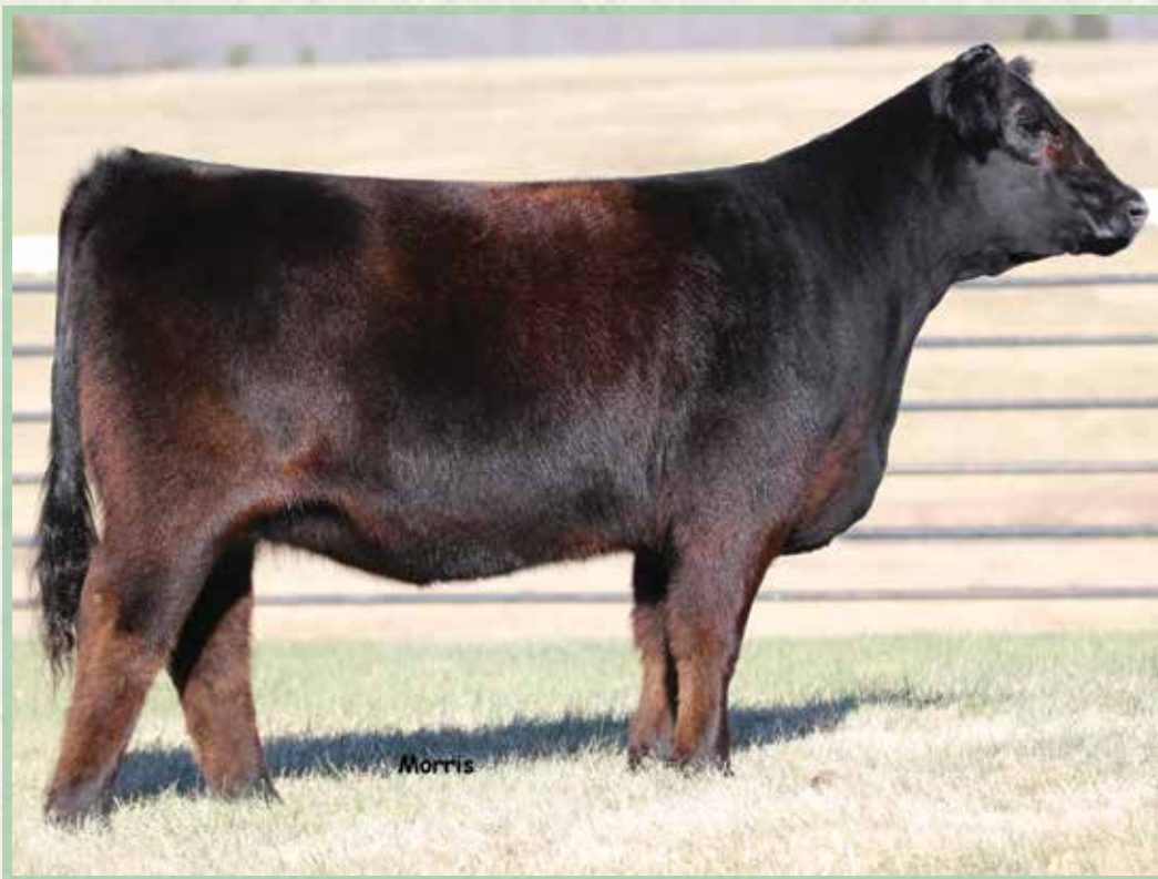
AUTO Rhonda 225C | Dam of Lots 81A & 81B