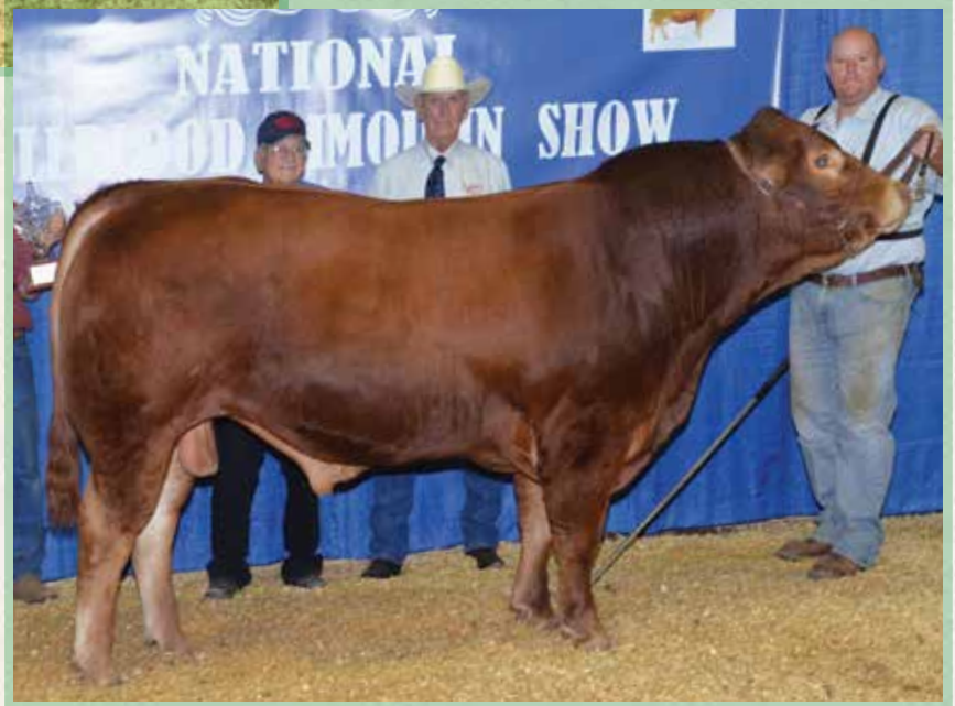
SVL Polled Advantage 961Z | Sire of Lot 60