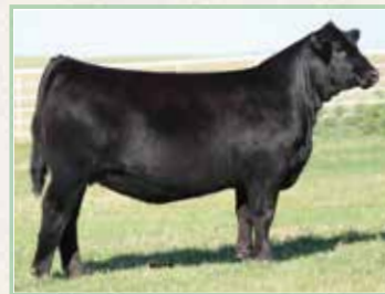
SSTO 609D | Full sib to Lot 83