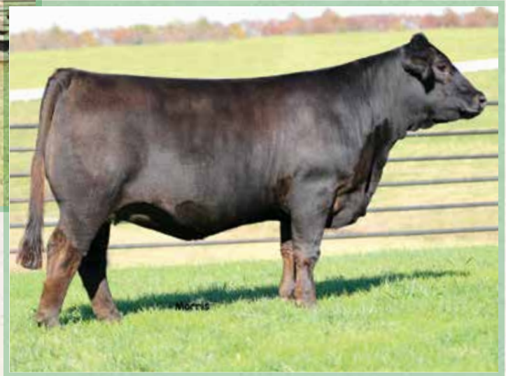
AUTO Olga 498A | Dam of Lot 82