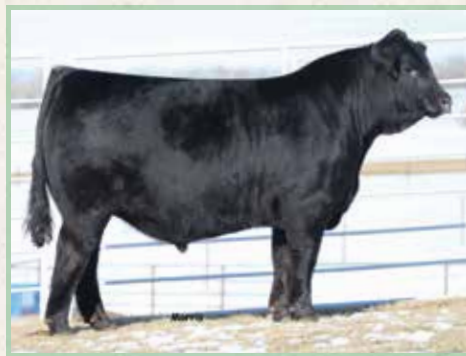
MAGS Cable | Sire of Lot 80B