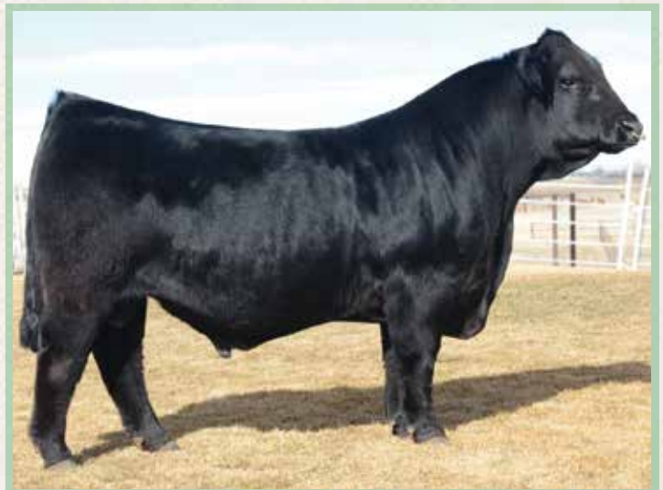
MAGS Yip | Sire of Lot 97A

LOT 97A: HB/HP heifer born 3/17/17, sired by MAGS Yip. This 75% Lim-Flex is double homozygous and sired by the big-numbered MAGS Y-Axis out of a top-producing daughter of AHCC Westwin. Lace & Ribbons was a top-selling lot from a past Woodbrook sale. Her first calf, by Connealy Consensus, is a top producer for Edwards Land & Cattle Co. Go to winvue.net for pictures and videos.