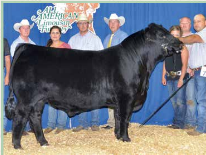
AUTO Lucky Strike 118B | Sire of Lot 106A

A solid-producing daughter of Robin Hood, who is raising a really stout ET calf. These Robin Hood daughters are making tremendous cows.