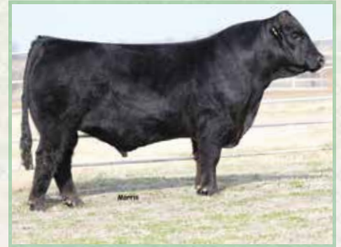
MAGS Anchor | Sire of Lots 50, 51 & 52