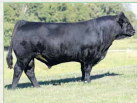
AUTO Cruze 132X | Sire of Lot 78