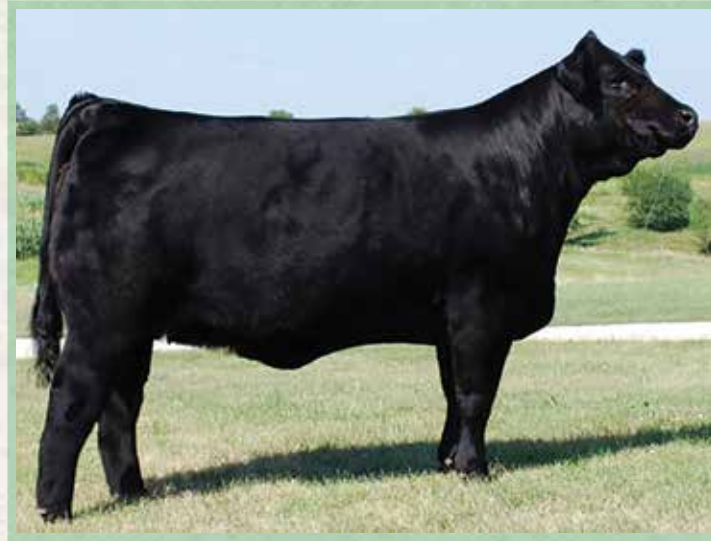
AUTO Tootsie Pop 2272T | Dam of Lots 80A, 80B & 80C