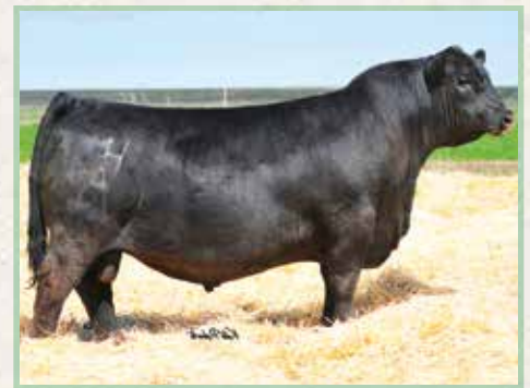
HA Cowboy Up 5405 | Sire of Lot 80C