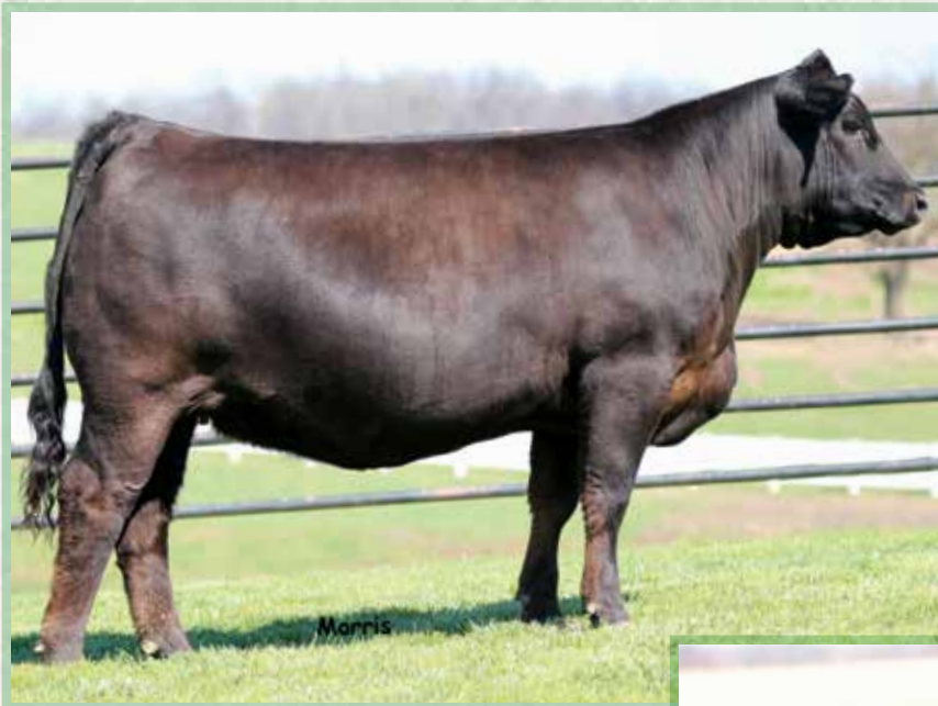
AUTO Paris 406B | Dam of Lot 78