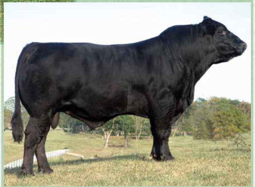
AUTO American Idol 162L | Sire of Lot 58