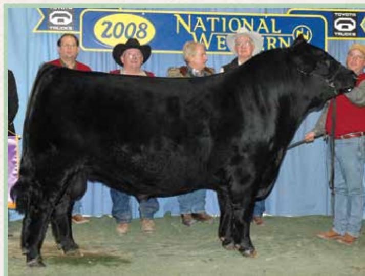
DHVO Deuce 132R | Sire of Lots 72 & 73

This one was bred to perform and her EPDs indicate she will do just that. Within her pedigree are some of the high-performing purebred sires in the history of our breed.