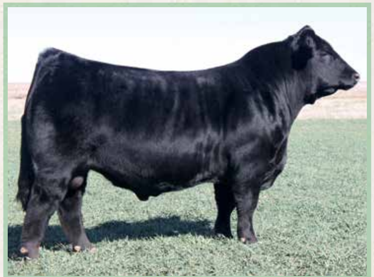
AUTO Black Coffee 512A | Sire of Lot 102A

LOT 103A: AUTO 610E. DB/DP heifer born 3/1/17, sired by AUTO Power Plus 133B. AUTO Blackie 405A is one uniquely bred Lim-Flex. Where else can you find TEXS Star 208Y only one generation back?