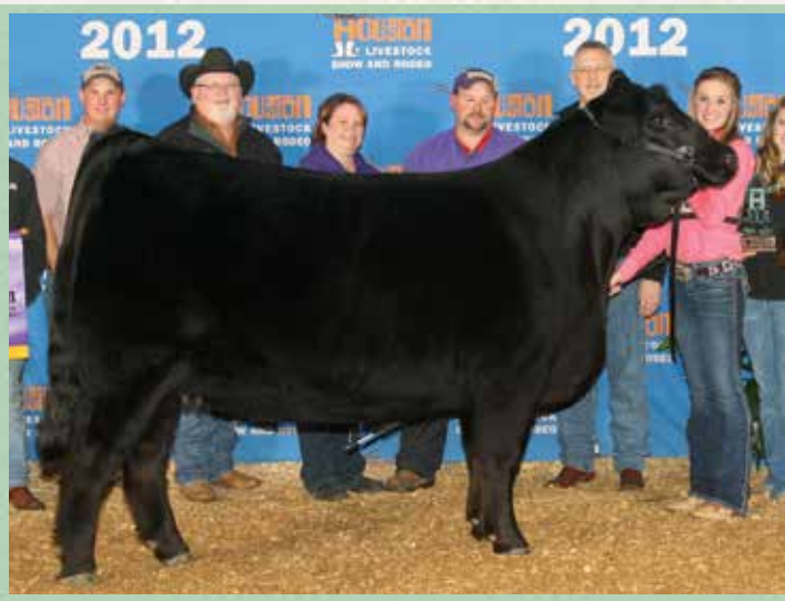
SPLX XTRA SPECIAL | Dam of Lot 83