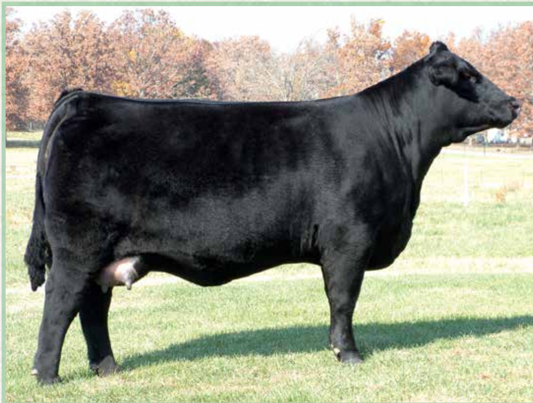
AUTO Rebeca 292S | Dam of Lots 107 & 108