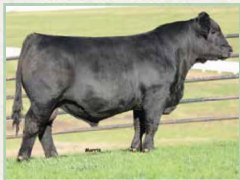
AUTO Power Plus 133B ET | Sire of Lot 79