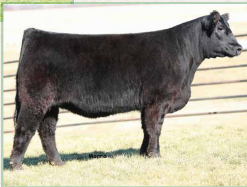
AUTO Pepsi 412B | Dam of Lot 79