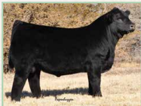
Cottage Lake Border Agent | Sire of Lot 81A