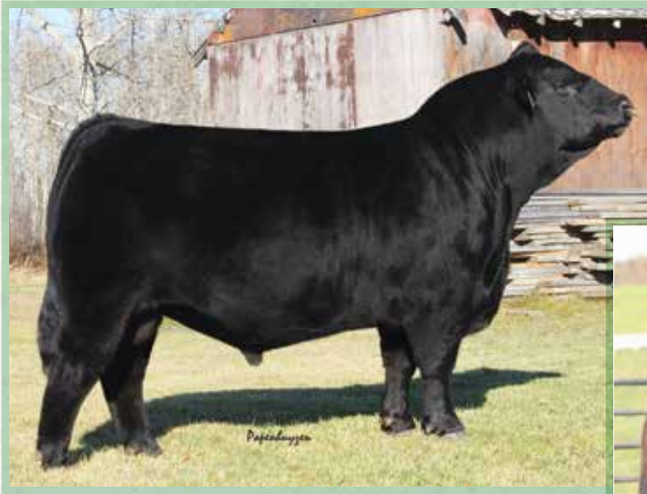
Cottage Lake Big Star | Sire of Lot 82