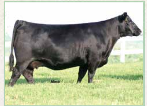
BUF Eppionia 7307 | Dam of Lots 50, 51 & 52