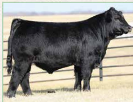
AUTO Direct Drive 107D ET | Sire of Lot 81B