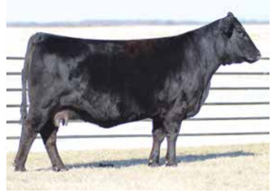
AUTO ANGEL 236U - Dam of Lot 20