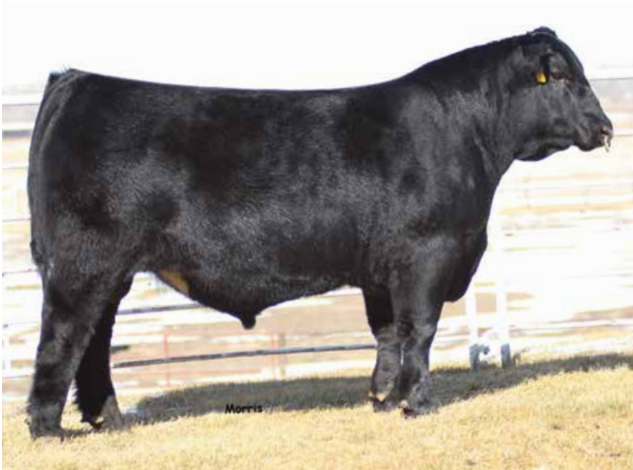
MAGS ALI - Sire of Lots 92A & 92B