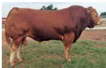
CVER NEW GENERATION 365Z Sire of Lots 41-45

Sells 3 months bred by sale day to SVL Polled Excellent 201B (HP Fullblood)