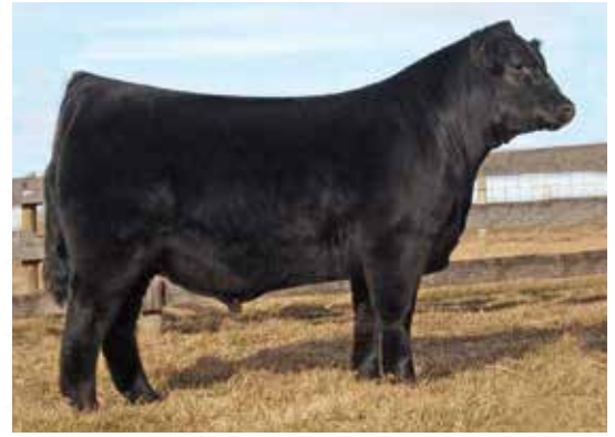
TASF BELIEVE 845B - Sire of Lot 93