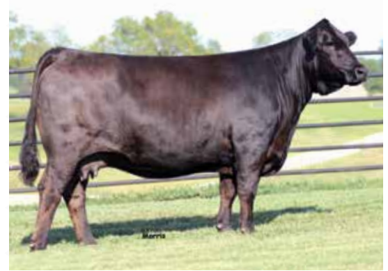
MAGS MANUELA - Dam of Lots 11 & 12 Maternal grandam to Lots 9, 10 & 13