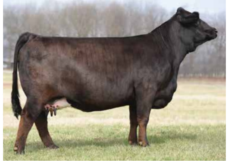
AUTO ZOFIA 439Z

If you have been following along with us since the beginning of this catalog, you realize the extreme importance Pinegar Limousin places on strong cow families. Few other programs in the Limousin business have so masterfully mixed and matched the most prolific bloodlines available to them. What better way to wrap up this catalog, than to offer you the choice of one, two or three flushes from these most unique and intriguing donors in the Pinegar arsenal and to the bull of your choice. Take advantage of the years of strict selection backing these females and align yourself with not only the breeding principles, but the built in promotion afforded to you through the Pinegar Limousin program. Guarantee five embryos with a maximum of 10.