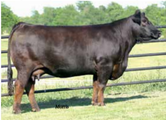
AUTO MANUELA 298S - Dam of Lots 62A & 62B