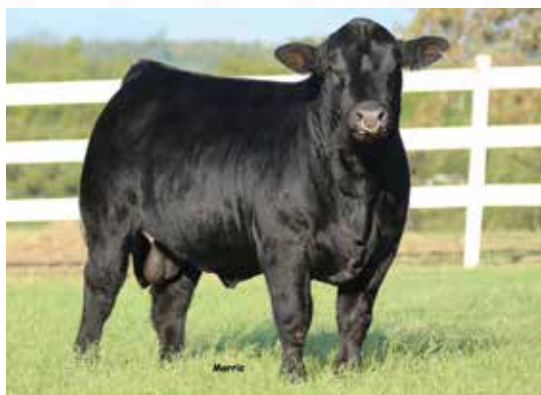
RLBH DAYS OF THUNDER - Service Sire of Lots 46A & 46B