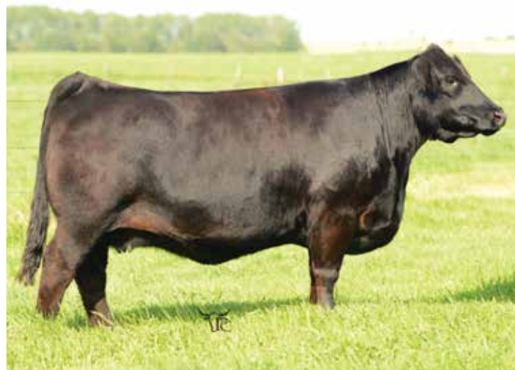
HSF YOUR FANTASY - Dam of Lots 91B & 91C