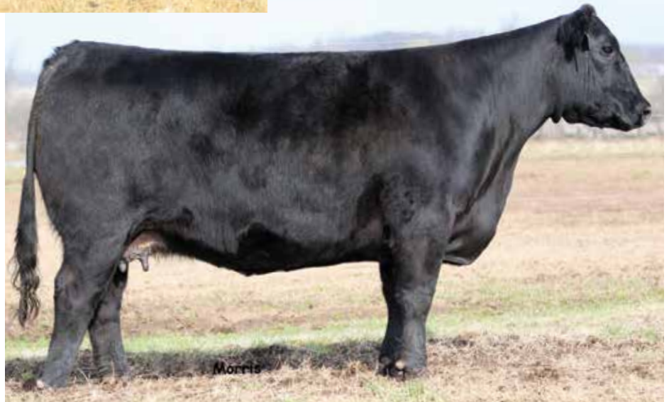
MAGS UR SALINA - Dam of Lots 92A & 92B