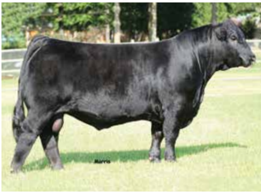
AUTO LUCKY STRIKE 118B - Sire of Lots 78 & 79