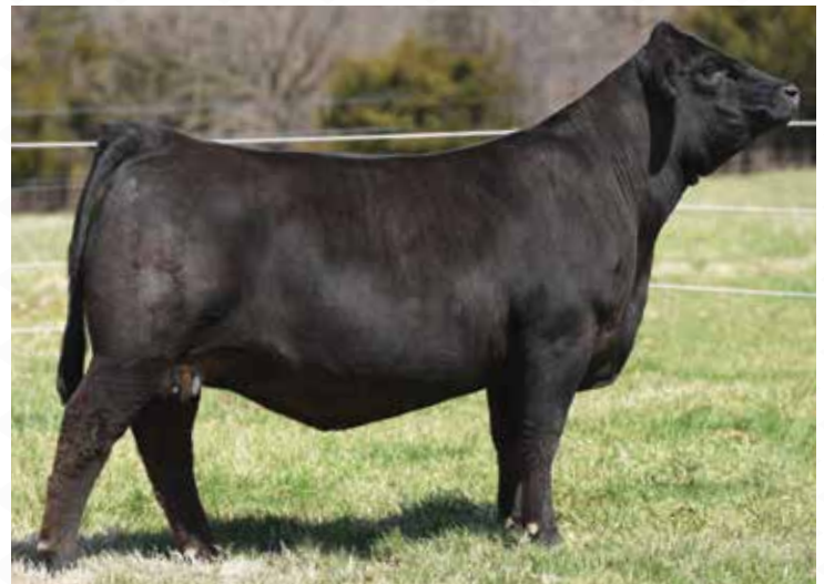
CELL MISS RESPONDER 6078D