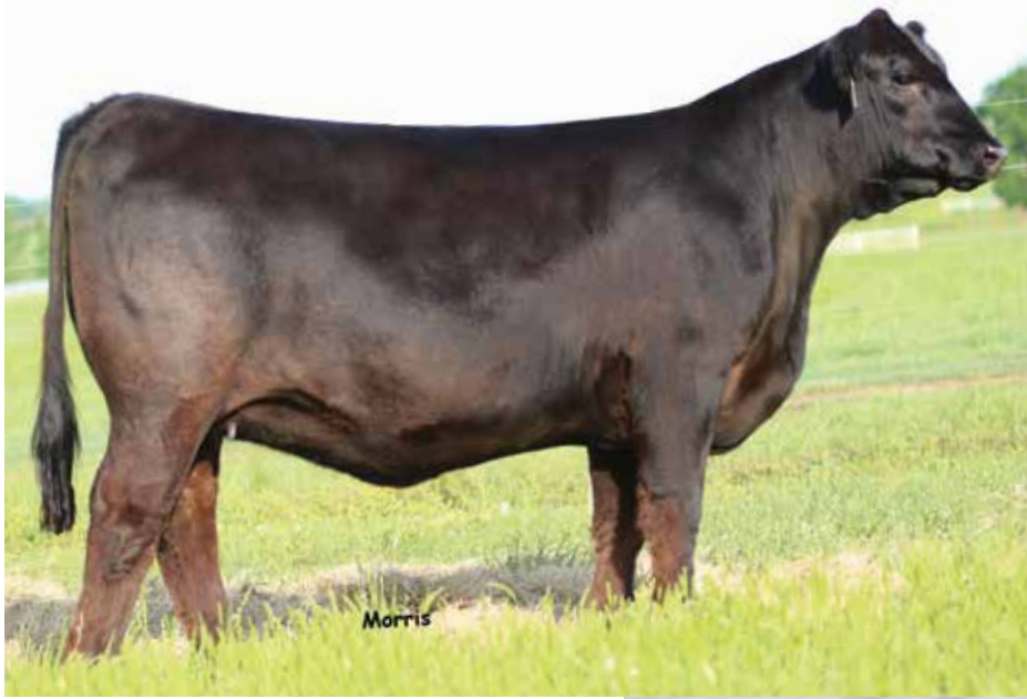
MAGS AMERICAN BEAUTY - Dam of Lot 93