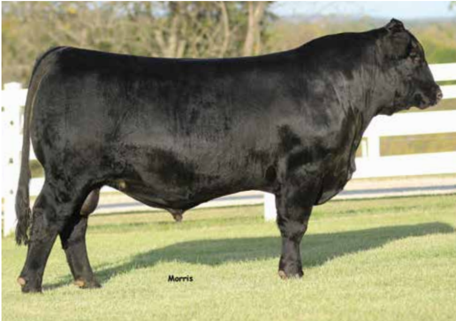
HBRL DELUXE PACKAGE 6114D - Maternal sibe to Lot 95

LOT 95 - Check out this exciting mating. This heifer pregnancy is by MAGS Cable and out of our exciting young donor, HBRL Bambi 489B. Bambi is a known daughter of the proven and productive, AUTO Exceptional 282S, a flushmate to the Pinegar Limousin sire, AUTO Lode Up 137B, and dam of HBRL Deluxe Package 6114D, a Zodiac son owned by Pinegar and Buck Ridge. This heifer pregnancy has a pedigree stacked for success and is sure to be a great one. Includes recipient cow and pregnancy. Due 10/25/18.