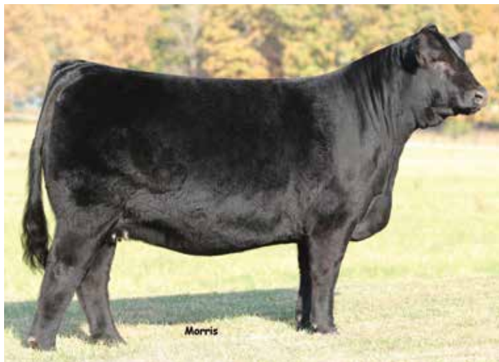
AUTO USUALLY YOURS 290A - Dam of Lot 82 embryo calf