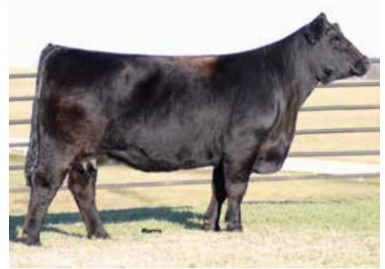
AUTO GEMINI 248T - Dam of Lots 5, 6, 7 & 8