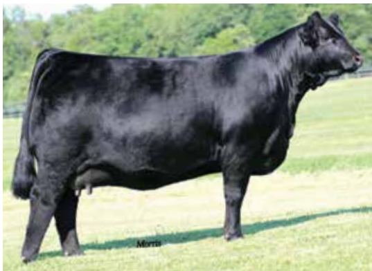
AUTO LUCKIE TOO 423Y - Dam of Lot 19