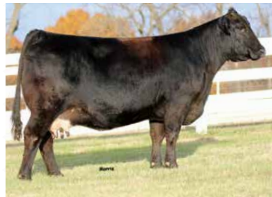
MAGS XOSA - Dam of Lot 64