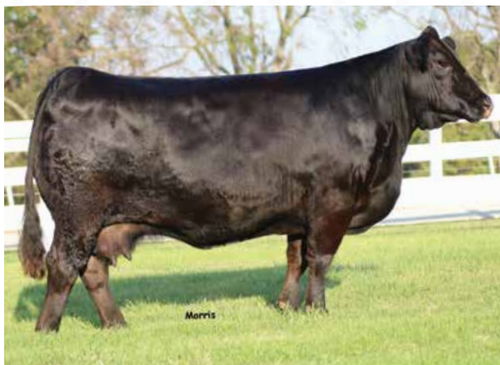
AUTO EXCEPTIONAL 282S - Dam of Lot 51

A heritage breeding piece if there every was one. Her sire and dam are two of the most influential fullblood animals on the North American continent. Here is your chance to own a proven piece of history that has tremendous future value.