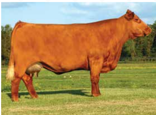
CARROUSELS PEACHES - Dam of Lot 33