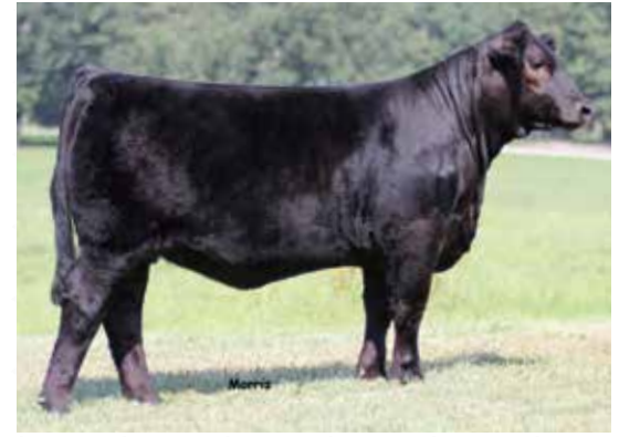
AUTO SPRITZ 278Z - Dam of Lots 78 & 79