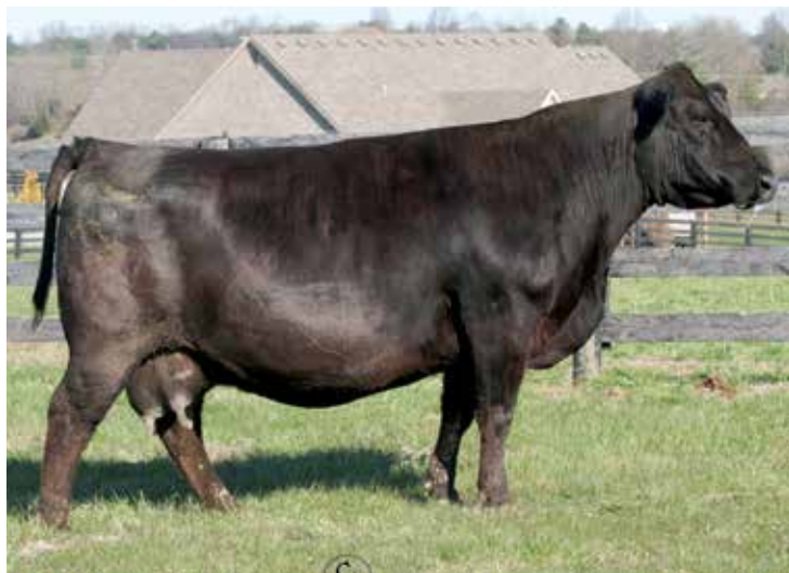
TMCK UNTOUCHABLE 14X - Dam of Lot 91A