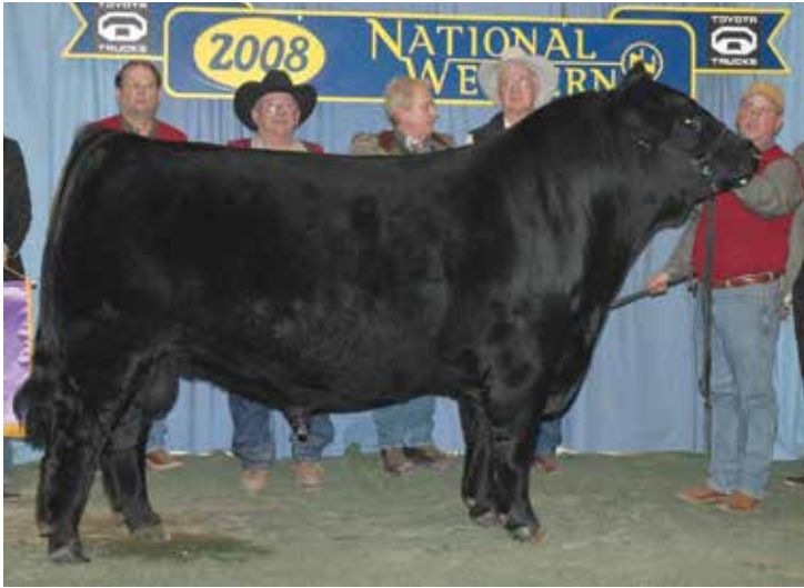
DHVO DEUCE 132R - Maternal grandsire of Lot 69

Wendy is a maternal sister to the high-selling Fullblood in the 2017 Select Breeders Sale. She is correct in structure, docile and has eye appeal. She will work in the show ring, the pasture or as a future donor. Her sire, SVL Polled Extra, the Exclusive son of Empress (Harvest Olympus) is siring outstanding offspring. Extra sired the 2017 National Junior Fullblood Show Grand Champion Heifer.