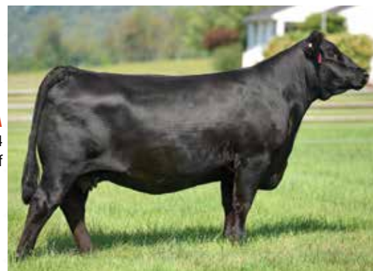
TMCK APPLAUSE 301A Dam of Lot 84 embryo calf

Due 11/24/18 to DHIL Colt 5793C (HP/HB) With Rodemaster and 616 in her pedigree, it is no wonder this double homozygous 4-year-old has been a top producer for Diamond Hill Cattle Co. Her ET bull calf at side checks all the boxes necessary to be a herd sire of importance.