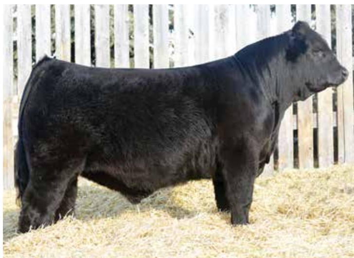
RIVERSTONE CROWN ROYAL - Full sib to Lot 91B & maternal sib to Lot 91C

TMCK Untouchable 14X is one of our can't-miss producers. She always takes to the first AI and always puts phenotype and growth in her progeny as evident as her daughter, BFEC Dandi 14D, who sells as Lot 40 in this offering. Selling a guarantee of six embryos and if the cow flushes more, the buyer can purchase the remaining embryos at 70% of the purchase price. If the cow does not produce the purchased six at flush time, the seller will let the buyer know the next possible flush date where she'll be done again.