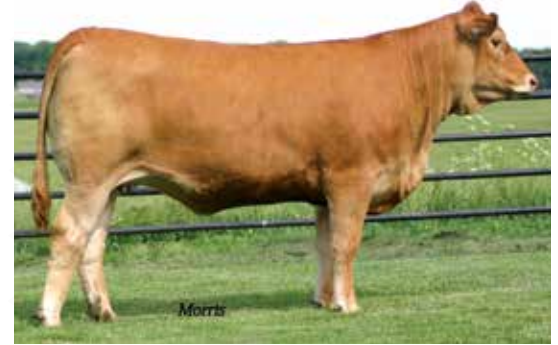
AUTO APPLE 228X - Dam of Lots 53A & 53B