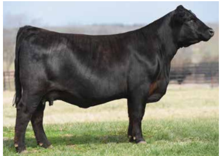
AUTO DANIELLE 205D