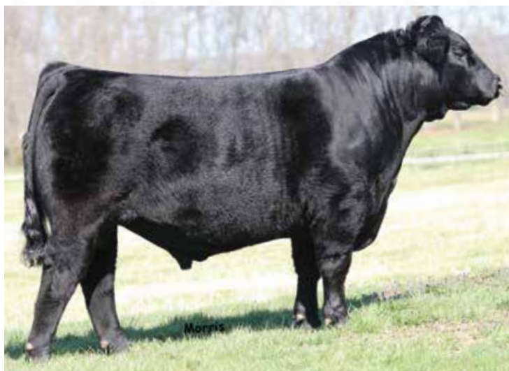
AUTO REAL DEAL 150B - Sire of Lots 81A & 81B

This sporty November baby will stand some serious competition. With both Cruze and Brilliance in her pedigree, she represents some of the most successful show ring genetics in the business. Plus her number profile make her a valuable breeding piece.