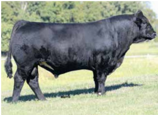
AUTO CRUZE 132X - Sire of Lot 98