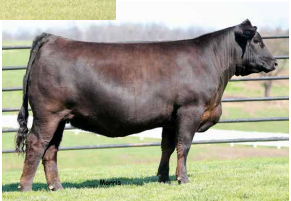
AUTO PARIS 406B - Dam of Lot 96

LOT 96 - Here are some of the finest genetics you can get your hands on. They are by the outcross and popular, double homozygous sire MAGS Cable, and from AUTO Paris, the big-numbered daughter of EXAR Denver from the famed EF Yadda Yadda. The numbers of these future calves are some of the best in the business and we truly think this mating will create calves in demand serious seedstock producers.