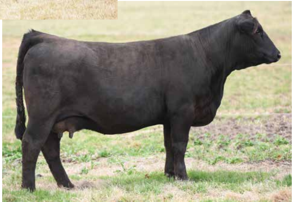
AUTO CINDEE 160C - Dam of Lot 98