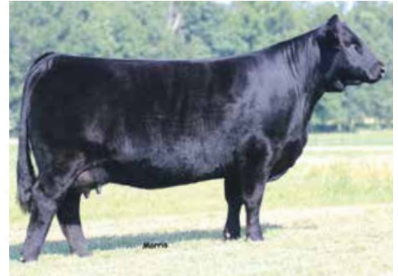
AUTO LUCKIE 246W - Dam of Lot 18