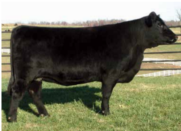
AUTO MAYKALA 658U - Dam of Lot 52

Due 9/19/18 to Quaker Hill Rampage (Angus) This big-numbered half sister to the great TMCK Cash Flow is out of the leading performance donor, AUTO Exceptional 282S. She is carrying a bull calf by the standout Angus bull, Quaker Hill Rampage. The royal pedigree of this donor prospect combined with Rampage makes this a once in a life time package. 7 Cross Ranch reserves the right to flush Donna once at the buyer's convenience and at the seller's expense.