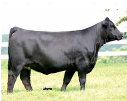
PBRs WINNING WAYS 29W - Dam of Lot 63B