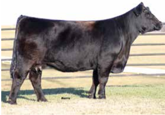
AUTO GEMINI 248T - Dam of Lots 30 & 31

We put Lot 30 and 31 together because they are from the same dam, AUTO Gemini 248T, who has been a solid producer at our farm for years. We can't say enough good things about the 248T daughters. AUTO Donella 210D is sired by the Express show bull EXAR Blue Chip 1877B who has gone on to sire champions and generate many dollars in the Express program. This heifer is loaded with eye appeal and numbers. We think you'll like AUTO Easy Going 269E, she's easy going, solid from the ground up and is by the big-numbered, highly popular Cowboy Up sire. 269E's two flushmate sisters sold in our 2018 HerdBuilder for $15,000 and $8,500, respectively.