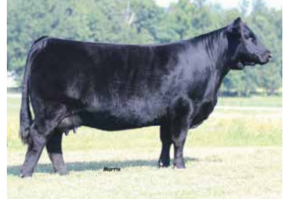
AUTO LUCKIE 246W - Dam of Lot 63A