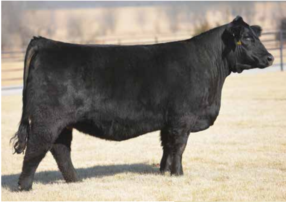
AUTO CYLIE 284C - Dam of Lot 97