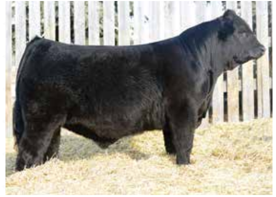
RIVERSTONE CROWN ROYAL - Sire of Lot 97