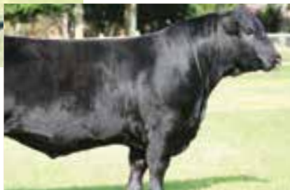
AUTO LUCKY STRIKE 118B