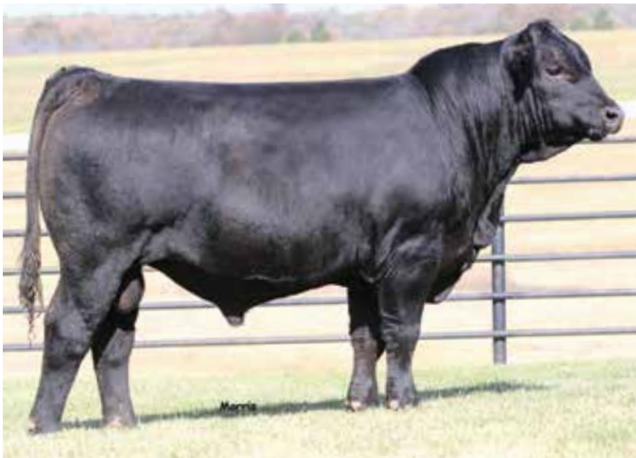
LOT 1 | AUTO GREAT DEAL 151D ET