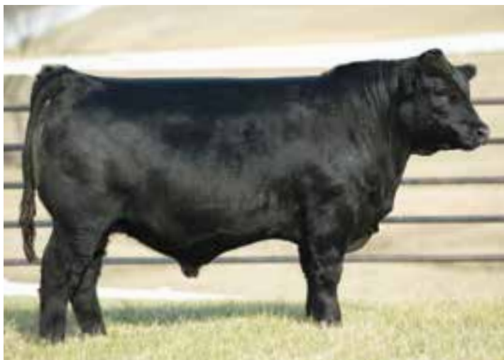
LOT 36 | AUTO REBAR 706D

AUTO Rebar 706D, is a big-ribbed, big-hipped, herd-bull prospect, who has an abundance of muscle expression, substance of bone and he is ready for heavy service. He is double polled and homozygous black, and is in the top 2% for MK, top 4% for TM, along with top 5% for REA. Sired by MAGS Robin Hood 276Y out of a MAGS Y- Axis daughter of the Pinegar donor MAGS Pia 245X.