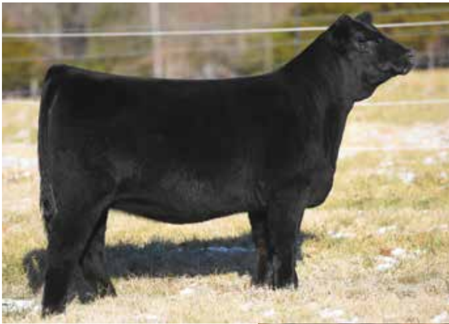
LOT 88 | AUTO ECHO 270E ET