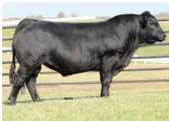
LOT 32 | AUTO SAMSON 561D