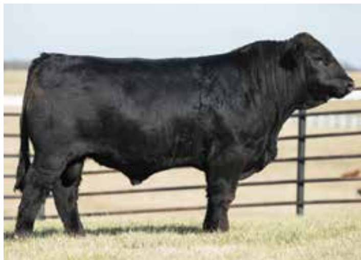
LOT 14 | AUTO TREND 567D

When we purchased HBRL Baby 479B from Buck Ridge Cattle Co. it was noted that her future was limitless, and they weren't exaggerating, AUTO Trend 567D is her first calf and she did an exceptional job. 567D is a special double homozygous son of MAGS Zodiac. Trend is double digits for CED and 119 for YW, all the while ranking in the top 25% for MB. Study this pedigree and there is an intriguing alignment of impactful, breed-changing sires such as Connelly Consensus 7229, DHVO Deuce 132R and MAGS Winston.