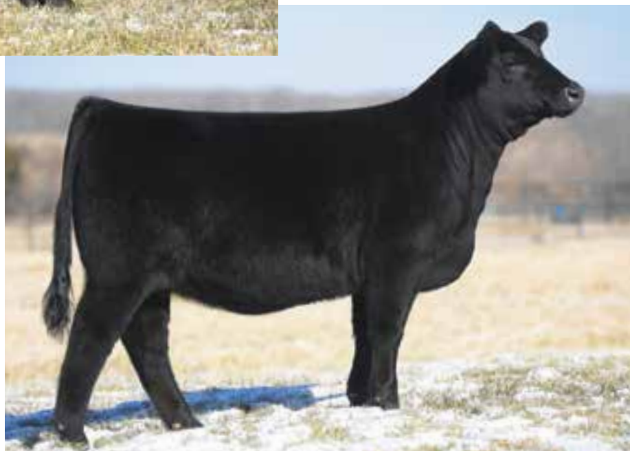
LOT 91 | AUTO EASTON 261E ET