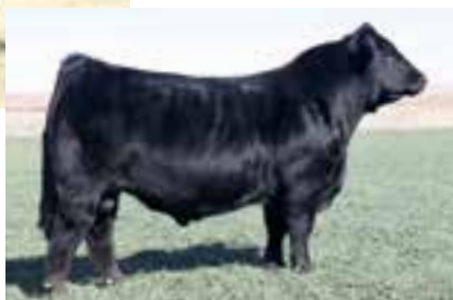
AUTO BLACK COFFEE 512A