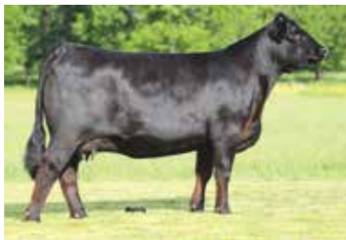
AUTO MABELLINE 267Z | DAM OF LOT 81