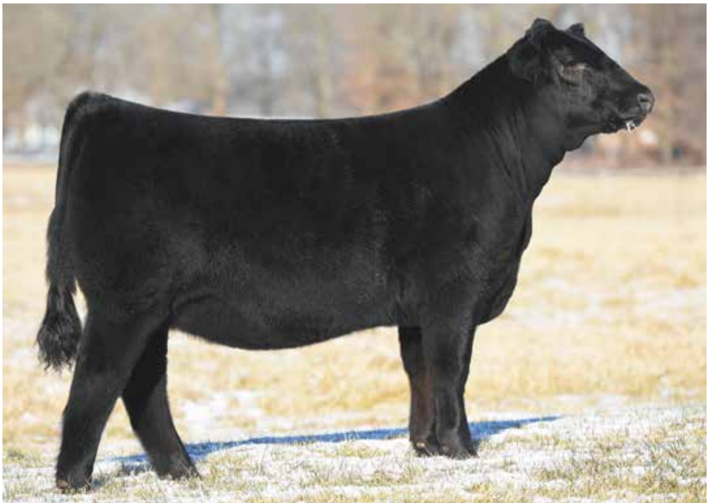
LOT 82 | AUTO EMALINE 267E ET