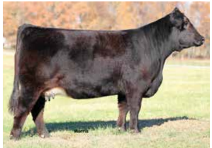
AUTO ZOFIA 439Z | DAM OF LOTS 23, 24 & 25

Rounding out this trio of full brothers is AUTO Liberty 173D who is further proof of just how consistent of a producer AUTO Zofia and AUTO Sure Deal. This is the type of consistency that we are seeing more and more of as we are incorporating even more AUTO prefixed bulls into our AI rotation. AUTO Sure Deal and his brother Real Deal are two of the top sires we offered in our 2015 sale. Their sire is a full brother to AUTO Real Deal, Lots 1, 2 and 3.