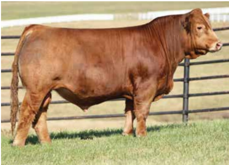
LOT 11 | AUTO RED ROBIN 190D ET