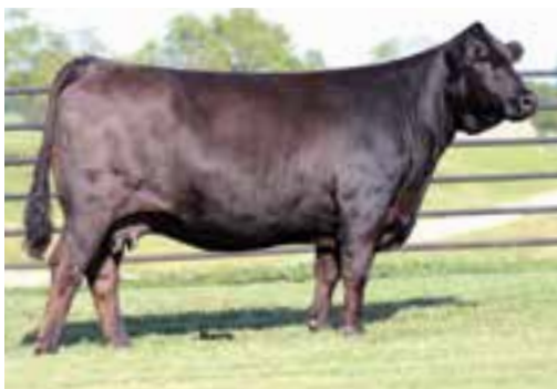
MAGS MANUELA | DAM OF LOT 63