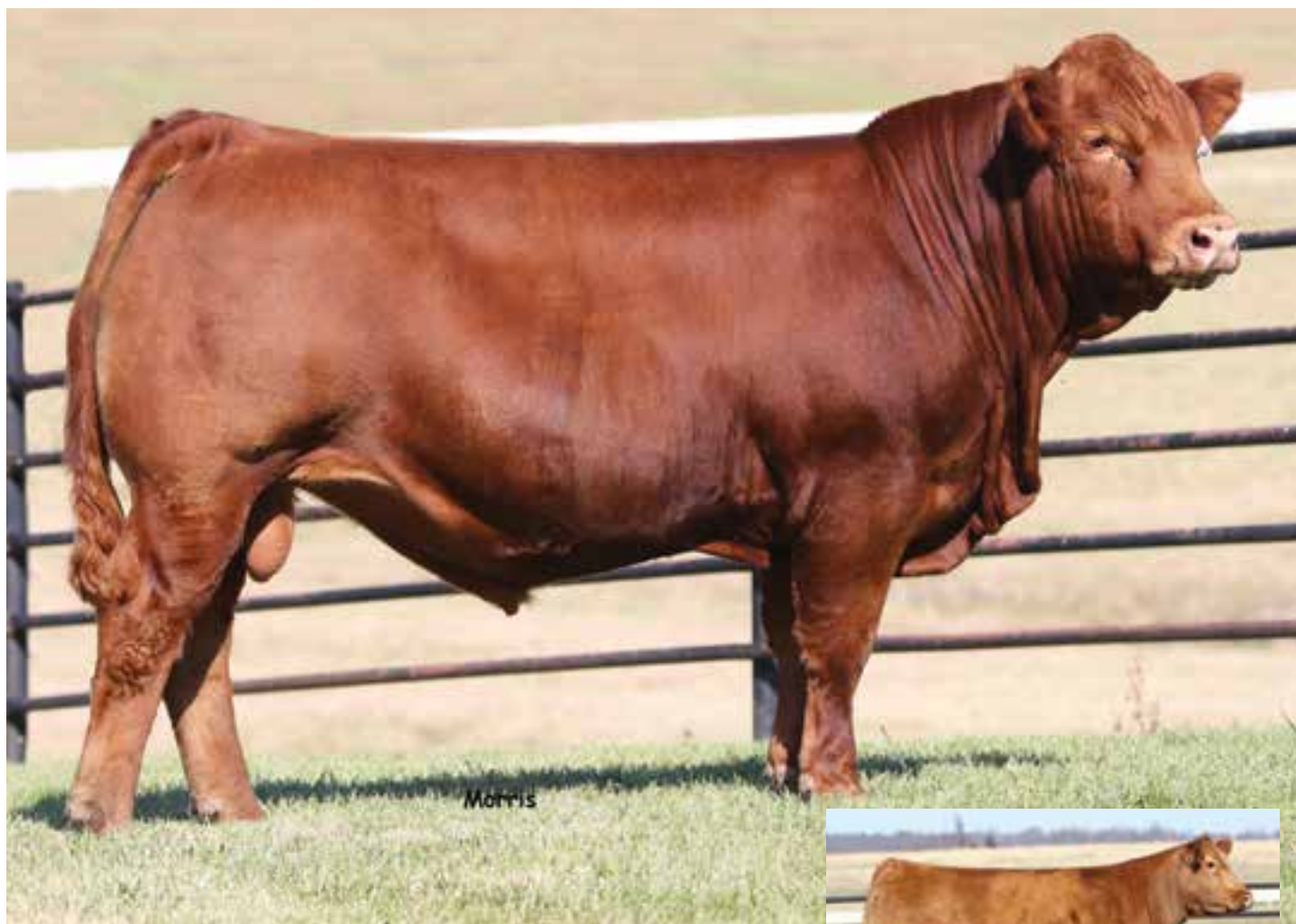
LOT 21 | AUTO RED ALERT 185D ET