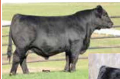
AUTO POWER PLUS 133B ET