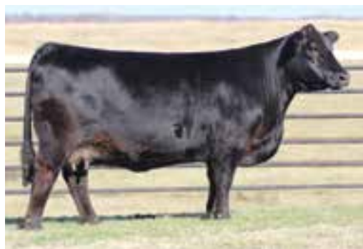
SBLX UMBRELLA 305U | DAM OF LOT 47