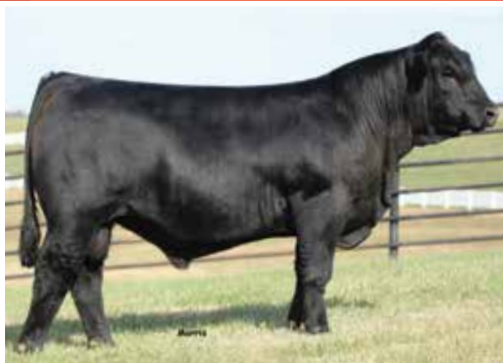
LOT 13 | AUTO BOOMER 189D ET