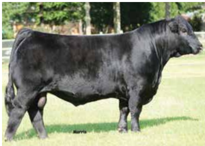
AUTO LUCKY STRIKE 117B | FLUSHMATE TO SIRE OF LOTS 74, 75 & 76

DUE 8.25.18 TO AUTO POWER PLUS 133B (HP/HB) Another full sib to AUTO 425D and AUTO 442D, AUTO Ambrosia 423D is a homozygous polled and homozygous black female. We admire the length of body and sound structure on this female. When you put her on the move she tracks with an incredible amount of confidence. She will produce cattle with look, dimension and functionality.