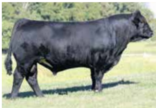
AUTO CRUZE 132X | SIRE OF LOTS 44 & 45