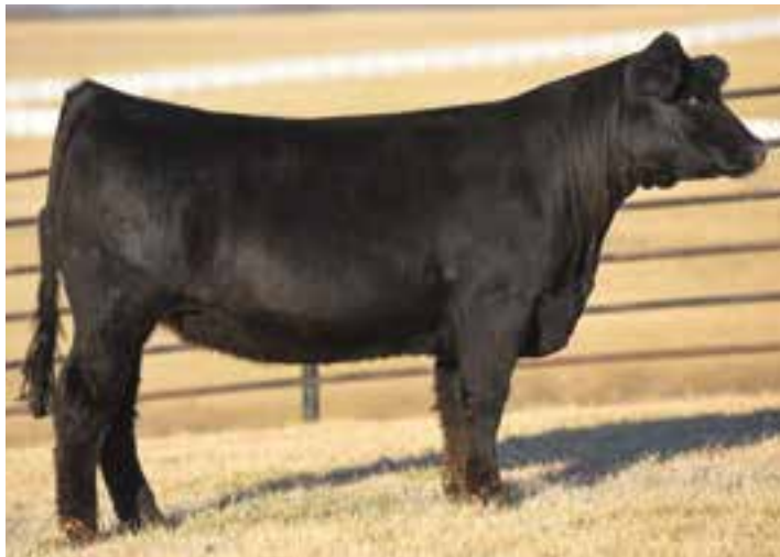
LOT 78 | AUTO FANFARE 299D ET

Here is a female with truly a royal pedigree. AUTO Bethany 278D is a daughter of TMCK Hydraulic 17Y, the sire of the NAILE and All-American Reserve Champion bull, TMCK Architect. This female will produce offspring with a killer look and massive amounts of growth and muscle. Her dam is the famed donor cow, MAGS Wallpaper. She is a 67% Lim-Flex homozygous black and homozygous polled female. Her marbling and weaning weight EPDs both rank in the top 20%. Buy into a tremendous pedigree that has been proven time and time again.