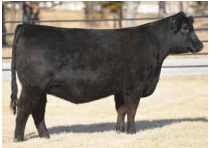
LOT 53 | AUTO GINNY 635D

AUTO Ginny 635D is an AUTO Gunn Point 192Y daughter. Gunn Point is from AUTO Gretchin 818Y, a daughter of the once National Limousin Sale top seller, AUTO American Idol 162L. She is a 75% Lim-Flex homozygous polled, homozygous black female. Her milk EPD ranks in the top 30%. We love the length and width of top she offers, the muscle design and the fleshing ability. She is so deep bodied and has a tremendous amount of natural rib shape.