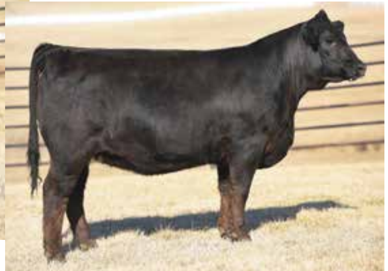
LOT 73 | AUTO ROBIN 294D ET