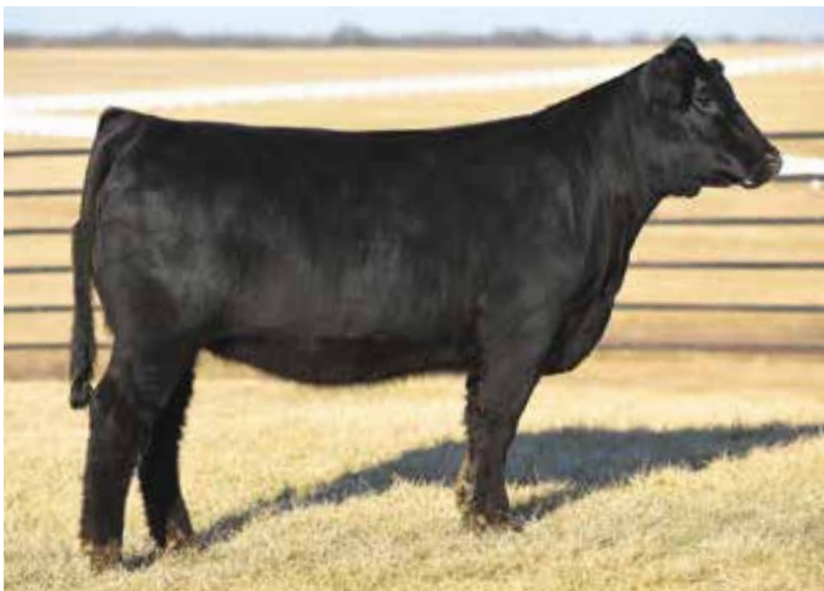
LOT 62 | AUTO TRUMPET 267D ET