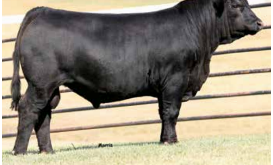
LOT 2 | AUTO BEST DEAL 559D