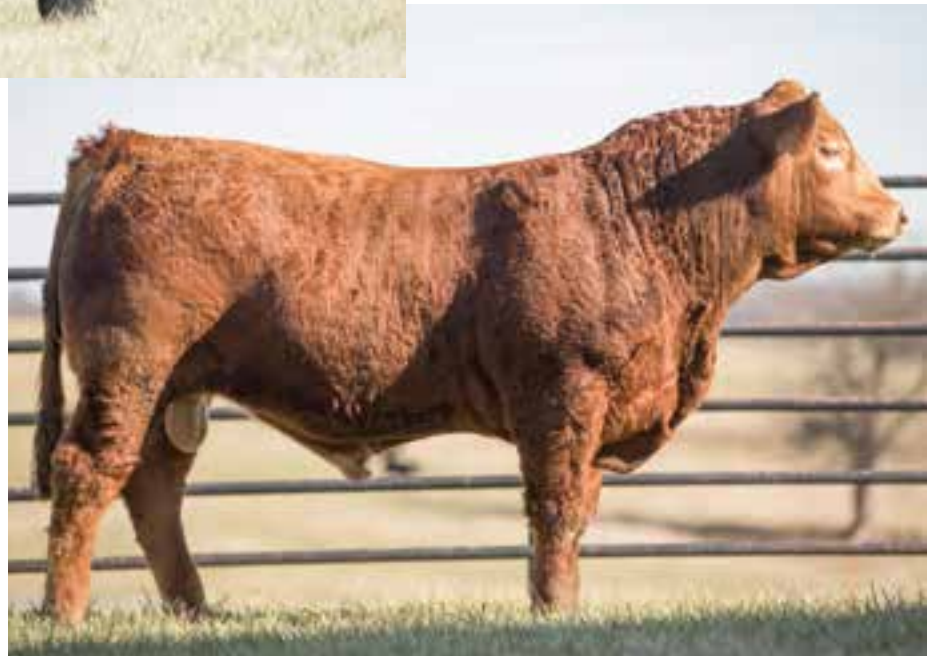
LOT 20 | AUTO GENUINE 147D ET