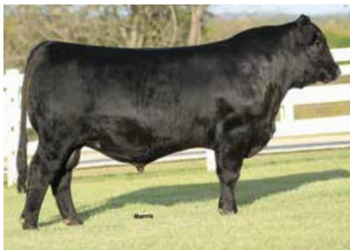
HBRL DELUXE PACKAGE 614D | SERVICE SIRE OF LOT 61

This homozygous black, homozygous polled daughter of MAGS Zarah is one you won't want to look past. Zarah is the Whitcomb son who has been producing some of the best show-heifer prospects across the country. AUTO 281D's marbling EPD ranks in the top 25%. Her dam, AUTO Pamela 6622Y, is a daughter of the breed-leading MAGS Manuela cow and MAGS U Haul. Manuela has proven time and time again that she is the all-time leading donor of show champions and breed changers. AUTO Danica 281D is super long bodied and we love the set to her hind leg.