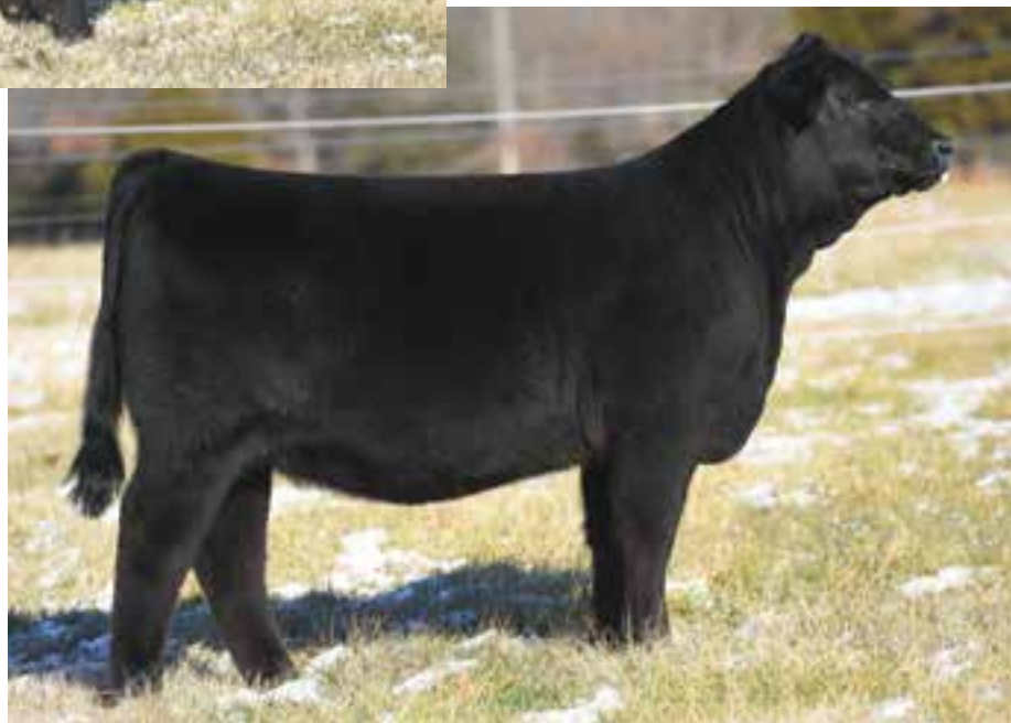
LOT 87 | AUTO ELEGANT 241E ET