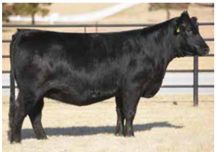
LOT 54 | AUTO DALYSE 602D

Here is a daughter of MAGS Robin Hood 276Y. You can't beat this one's number profile. Her yearling weight ranks in the top 2%, weaning weight in the top 4% and milk in the top 10%. She is level down her top and from hooks to pins, stands square on all four corners and moves with ease off both ends. She is sure to produce offspring that are superior numbered, functional and full of power.