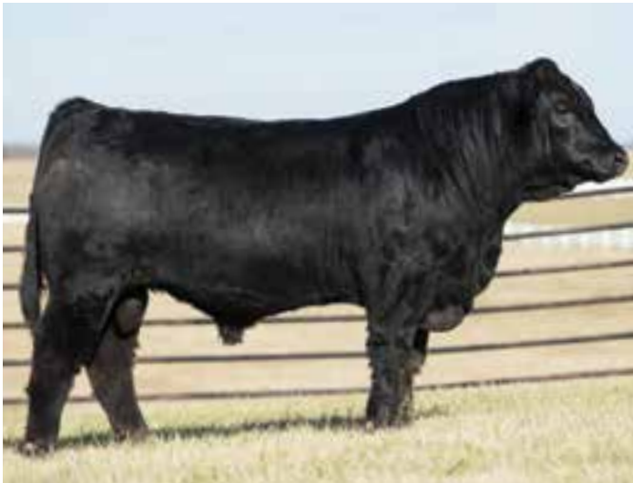
LOT 23 | AUTO TOPLINE 176D ET