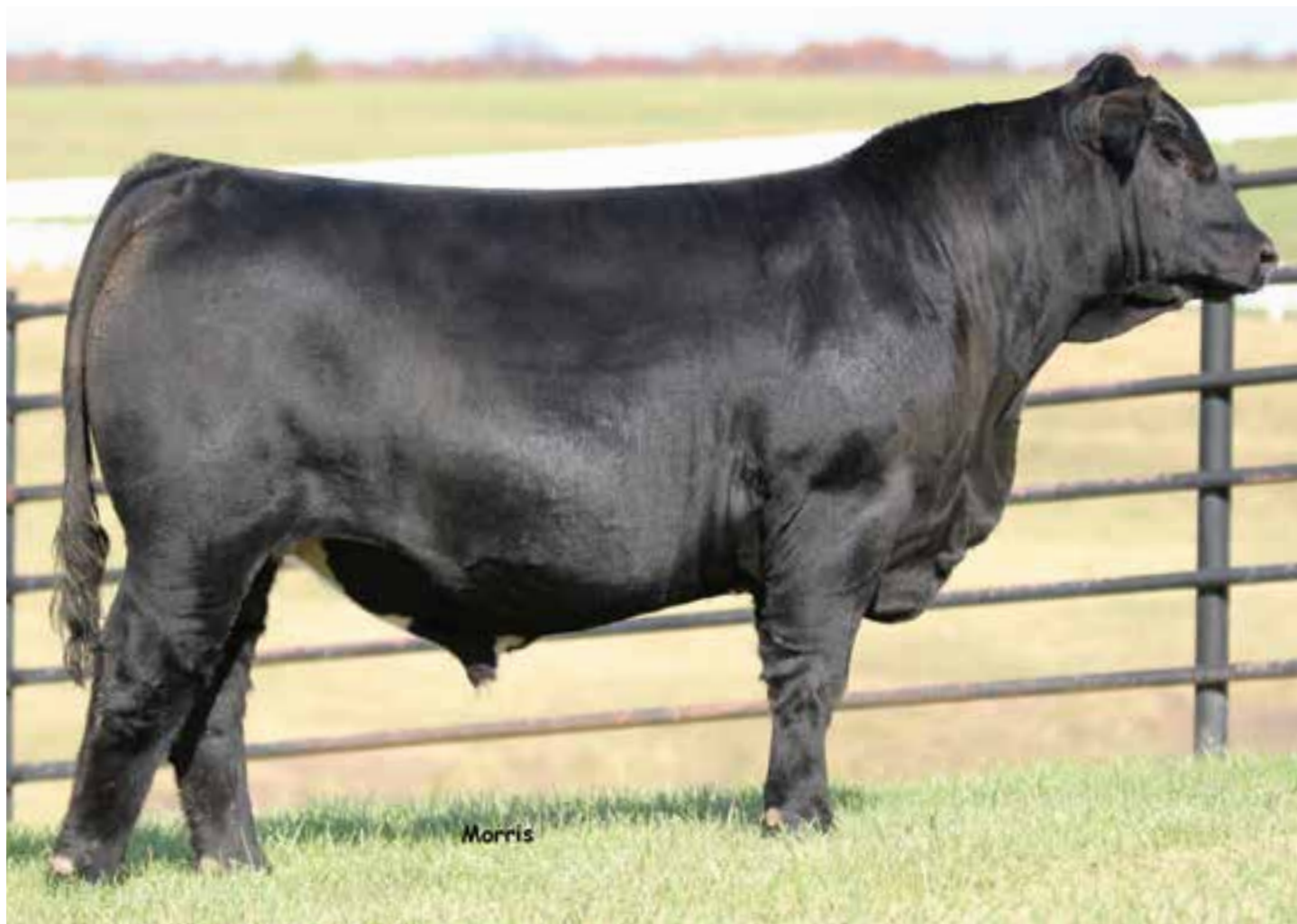
LOT 7 | AUTO LANDMARK 182D ET