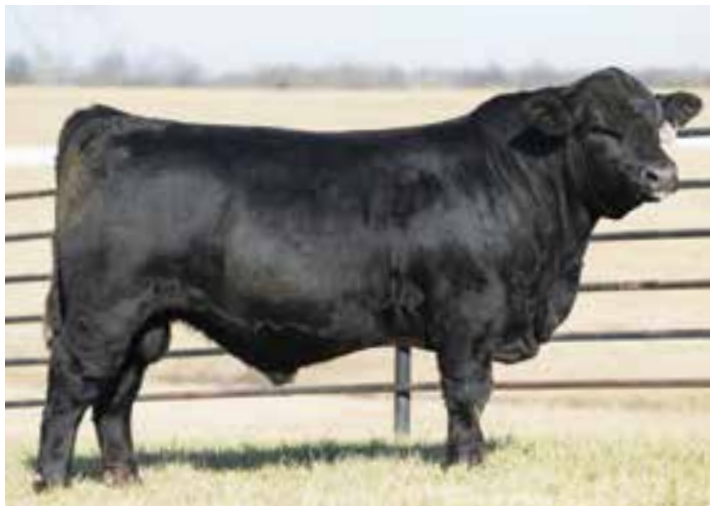
LOT 17 | AUTO INTERSTATE 154D ET

Ever looked at two celebrity parents and thought, "my gosh they are going to have beautiful children?" Well, that's what happened with this mating. Mother nature pulled through and the stars aligned to bring all the good in AUTO Cruze and PBRS Dutches 790X together in an amazing package. AUTO Matlock 166D takes the mystery out of upcoming breeding seasons. His consistent across the board numbers, exceptional phenotype and moderate frame gives you a variety of options and directions to go. PBRS Dutches 790X has done an amazing job producing embryo offspring in the Milam, Stowers and Pinegar programs; all of which are based around blending performance and phenotype into versatile breeding pieces.