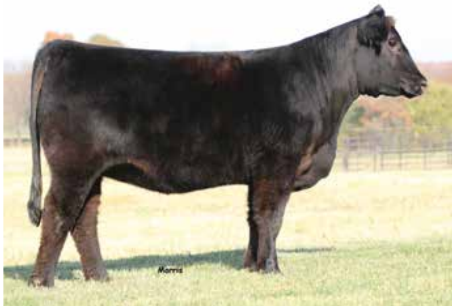
LOT 46 | AUTO DARIAN 226D ET