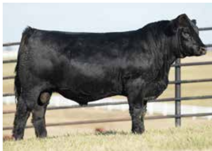
LOT 31 | AUTO EMPIRE 307D ET

MAGS Manuela, WLR Direct Hit, AUTO Luckie 246W and LH U Haul all in the first generation back in AUTO Star Wars 570D's pedigree, with that being said, he is bound to be epic and timeless. These cattle are bred to withstand the test of time and add good to programs from so many different angles that their value is hard to measure. 570D has some of the all-time greats in his lineage, and he possesses the DNA to produce one of the next great ones.