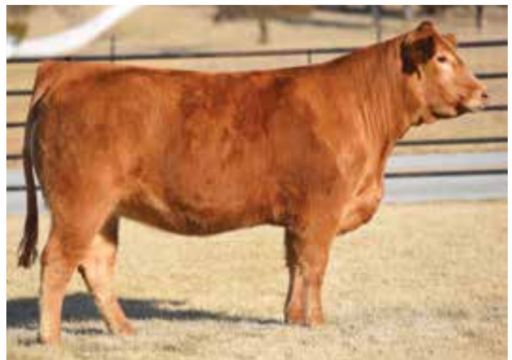
LOT 59 | AUTO DIVI 236D ET

AUTO Divi 236D is out of Posthaven Polled Yellowstone. She is a fullblood female that ranks in the top 10% for milk. Talk about a female who is a tank full of broodiness and muscle—here she is. AUTO Divi is huge footed and super sound on her feet and legs. Her offspring will be heavy muscled and incredibly powerful.