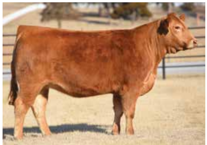
LOT 60 | AUTO DONLITA 237D ET

AUTO Donlita 237D is a purebred daughter of Posthaven Polled Yellowstone. Her milk EPD ranks in the top 10%. She is super broody in her makeup, heavy muscled and structurally sound. This female will produce cattle that have tremendous muscle expression, thickness and performance.