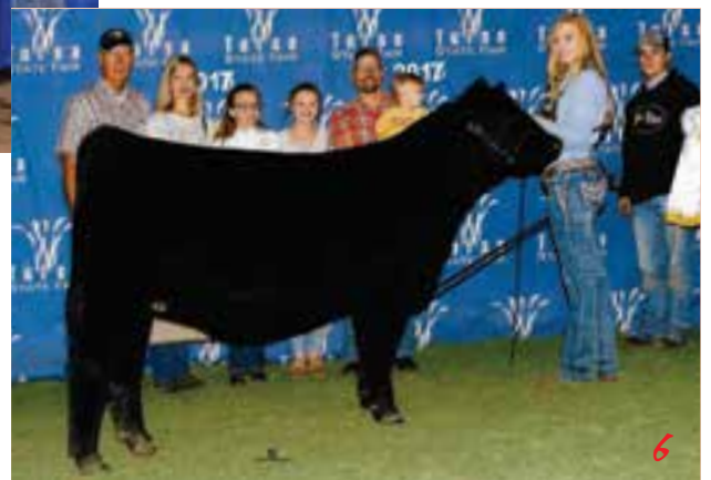
6 AUTO GRETCHEN 448D Owned by Lana Sherry, OK