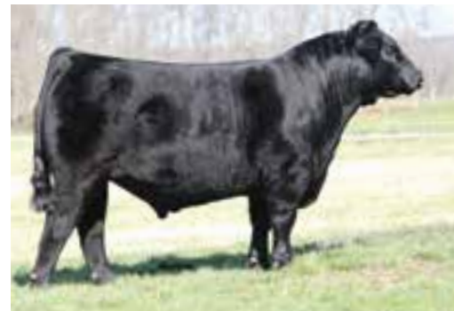
AUTO REAL DEAL 150B | SERVICE SIRE OF LOTS 62 & 63