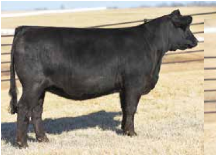
LOT 71 | AUTO BOLIVAR 458D ET