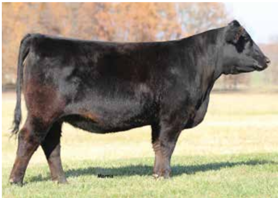
LOT 48 | AUTO COSTA 459C ET