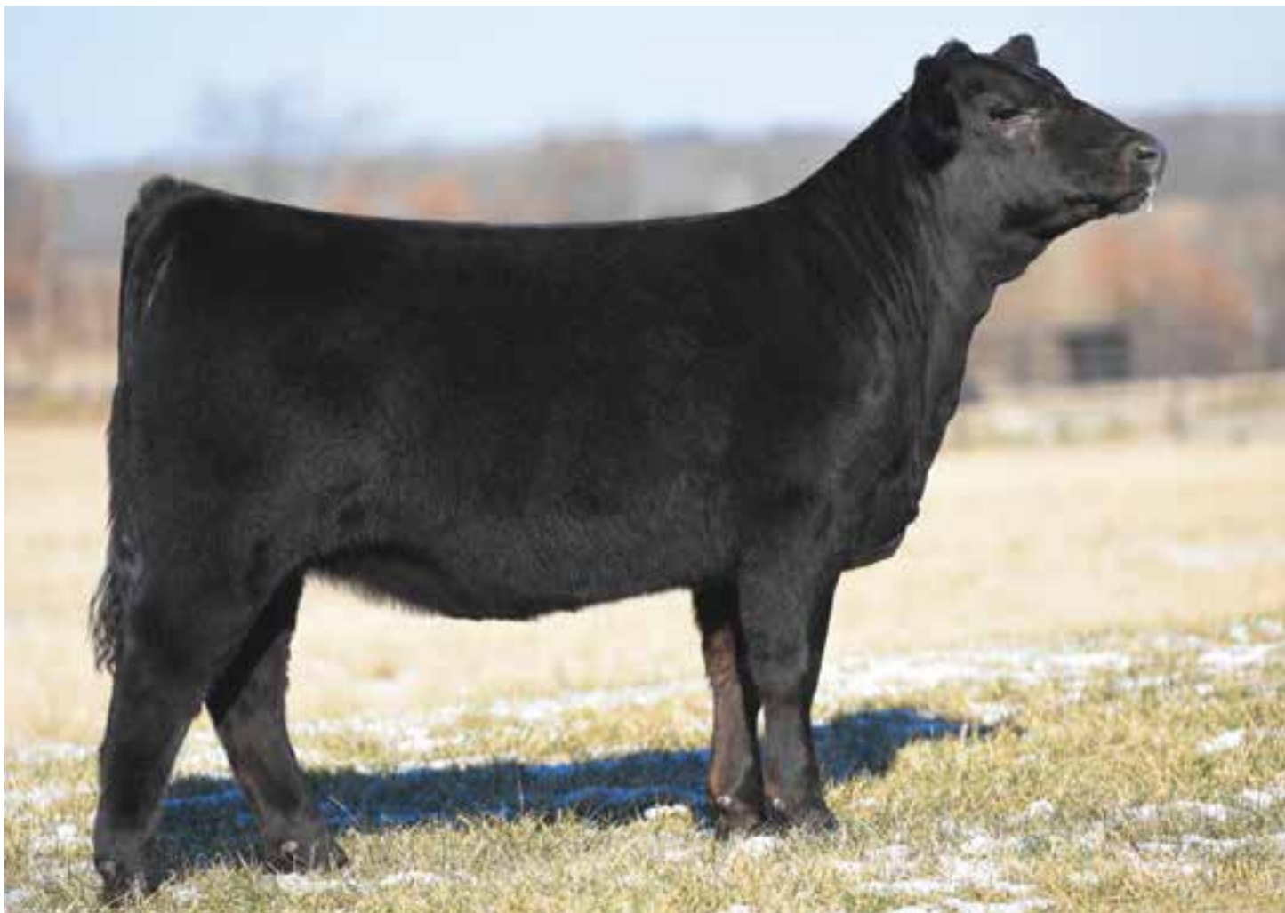
LOT 83 | AUTO ETSY 263E ET