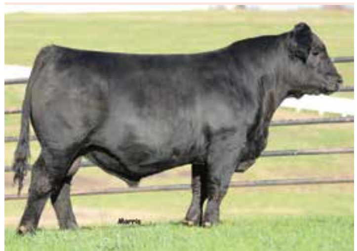
AUTO POWER PLUS 133B | SIRE OF LOT 38

AUTO Wide Trak 703D, son of AUTO Power Line 135B ET, who is by the leading Angus sire EXAR Denver and out of the leading Linhart Limousin donor EF Yadda Yadda 809Y. She is a daughter of the two-time National champion sire DHVO Deuce. His dam AUTO Bojo 421B ET, is a direct daughter of the world renown MAGS Manuela, the most prolific Pinegar donor to date having 241 recorded offspring, sired by EXAR Classen. He is homozygous polled, and is in the top 5% for MB and the top 10% for SMTI.