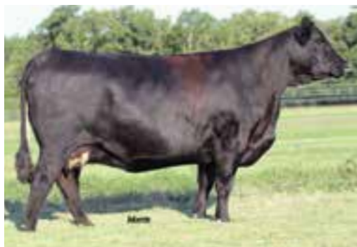
SBLX UNNA 391U | MATERNAL SISTER TO LOTS 48 & 49 DONOR FOR COUNSIL FAMILY LIMOUSIN & DEMAR FARMS