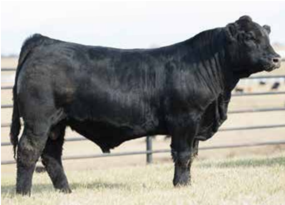
LOT 19 | AUTO FULL METAL 582D