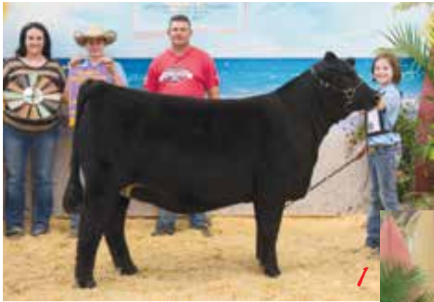
1 AUTO CALLIE 403D Owned by Ellie Dill, MO