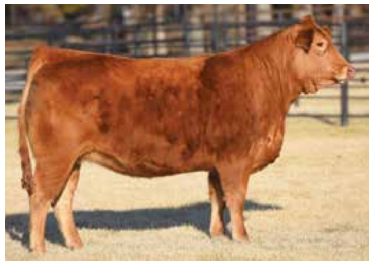
LOT 58 | AUTO DIXI 235D ET

This female is a fullblood daughter of Posthaven Polled Yellowstone. AUTO Dixi 235D ranks in the top 10% for milk. She is super strong topped and has a great amount of muscle expression. This one will be a heck of a cow out in the pasture that will be super sound for years to come. There's no question that this female will raise cattle that are packed full of substance and muscle.