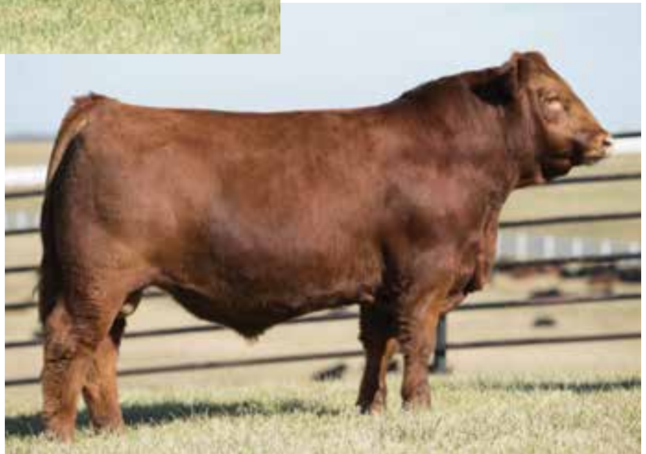
LOT 12 | AUTO BROKER 181D ET