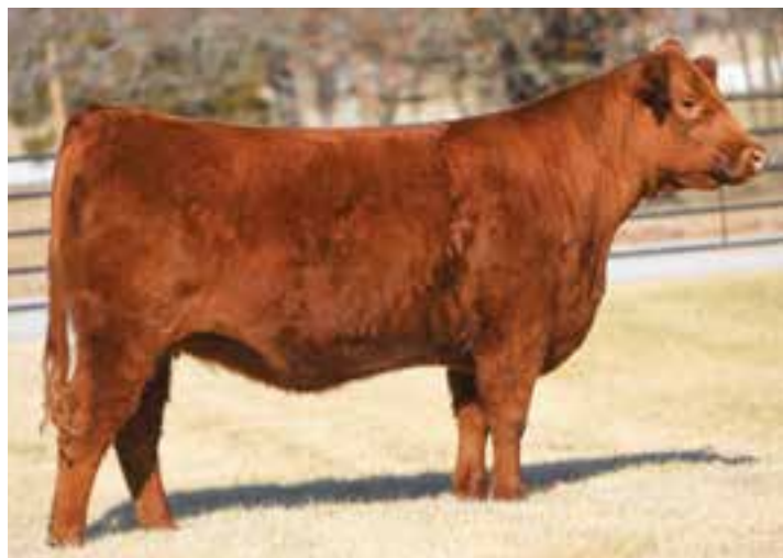
LOT 55 | AUTO DESTANI 640D