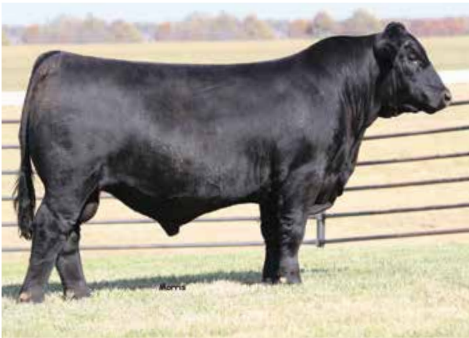
LOT 5 | AUTO AIM 146D ET