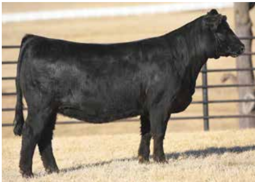
LOT 65 | AUTO POWER GIRL 424D ET