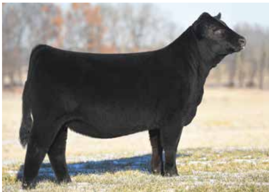
LOT 84 | AUTO ELLY 251E ET