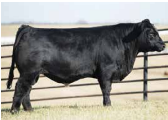
LOT 18 | AUTO ENTERPRISE 100E ET

Have you been putting on the miles to find one that checks all the boxes for doing the fundamental things right? AUTO Interstate 154D will lead you to your destination. Sired by past Pinegar sale topper AUTO King James and out of the stunning PBRS Dutches 790X, 154D is the type of bull that we all can use, he is negative for BW and above breed average for growth and maternal traits. He is absolutely an ideal for the Purebred producer looking for a bull to use on a variety of females or the commercial guy who wants to inject additional quality into his next calf crop.