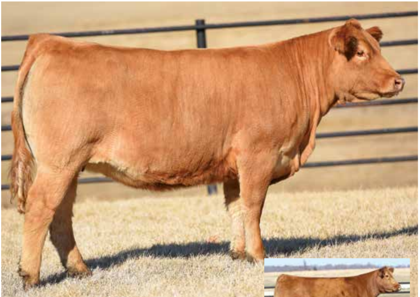
LOT 67 | AUTO RUBY 430D ET