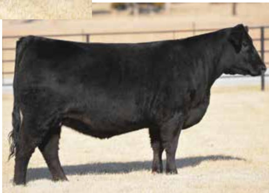
LOT 43 | AUTO DUSTY 217D ET