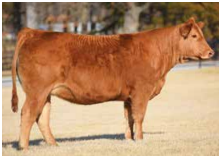
LOT 57 | AUTO DARLENE 259D ET

Here is a daughter of AUTO New Roads 190A. Her dam, EXLR Molly 7103K, is the prominent red and polled donor who has raised some of the finest individuals in the breed. We admire the smoothness of lines and the set to this female's hind leg. She is super flexible off both ends of her skeleton when she's in motion. She is a 75% Lim-Flex.