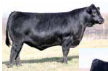
AUTO ACE VENTURA 557C