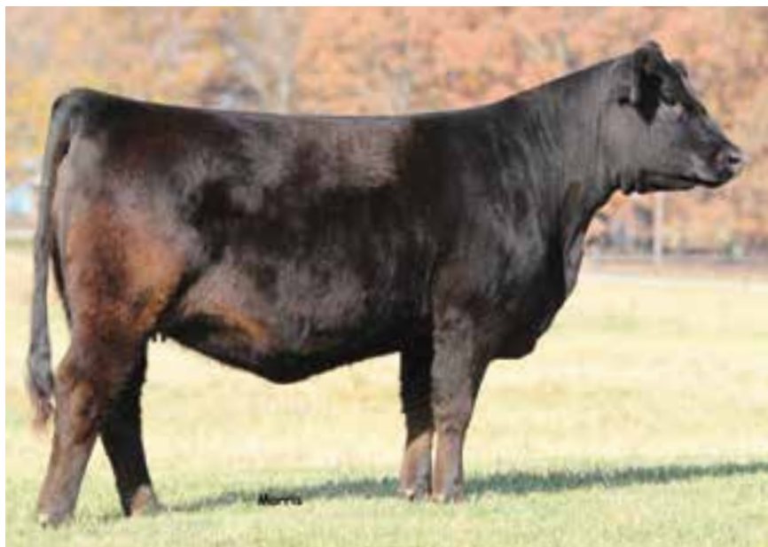
LOT 44 | AUTO COPY CAT 403C ET