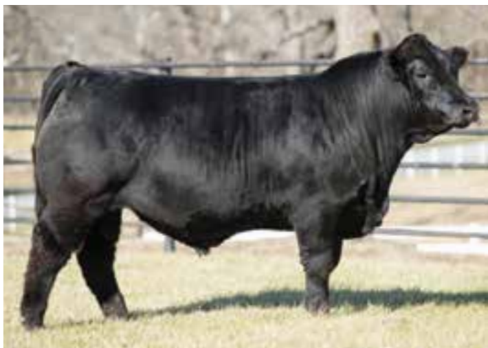
LOT 27 | AUTO DISCOVERY 564D

This double bred MAGS Xylopolist son is a sure bet and not a gamble! AUTO Sweepstakes 573D is homozygous black and homozygous polled son of Begert/Keeton herd sire and A.I. sire AUTO Black Coffee. Right out of the gate in his first calf crop AUTO Black Coffee was siring major show winners and was producing highly marketable progeny for those who used him. We have a lot of faith that AUTO Sweepstakes will follow in his famous father's footsteps.