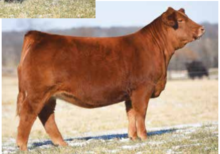
LOT 93 | AUTO EVONE 216E ET