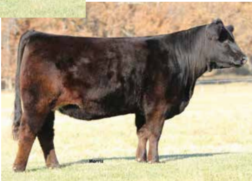
LOT 45 | AUTO CARY 299C ET