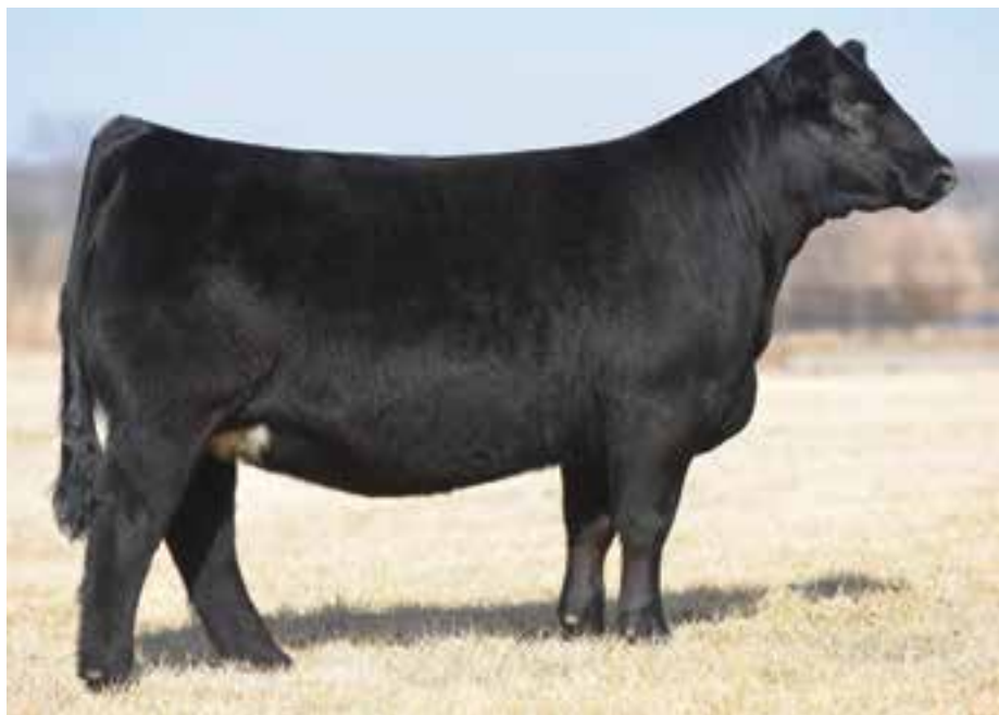
LOT 80 | AUTO NATASHA 433D ET