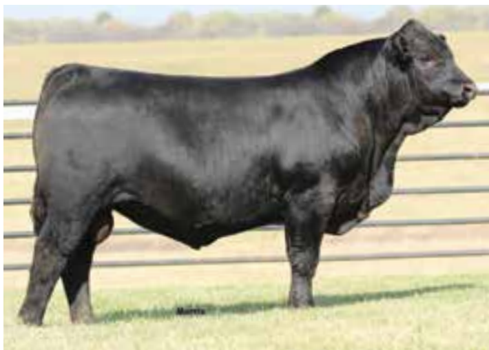
LOT 33 | AUTO WACO 569D