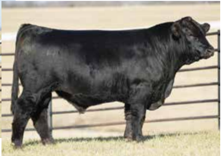
LOT 25 | AUTO HAWKEYE 170D ET