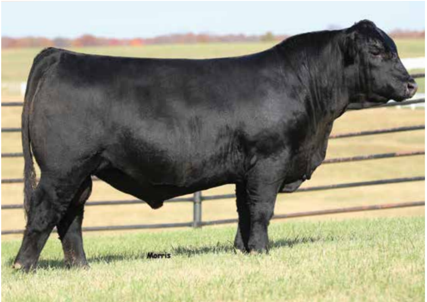
LOT 4 | AUTO REDI 198D ET