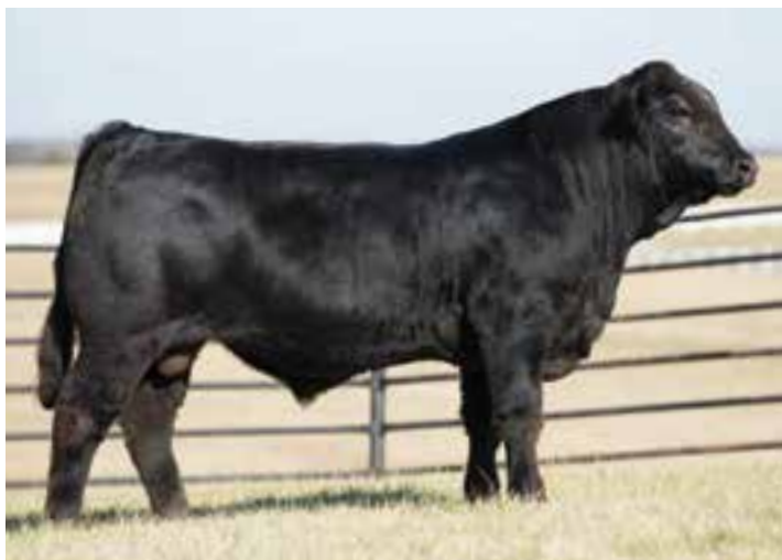
LOT 26 | AUTO SWEEPSTAKE 573D