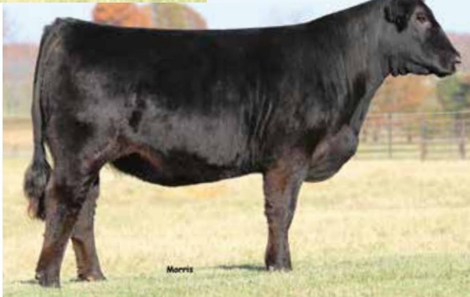
LOT 47 | AUTO DANITA 222D ET