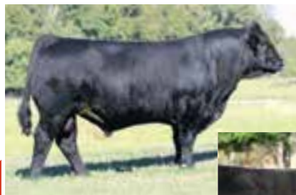
AUTO CRUZE 132X