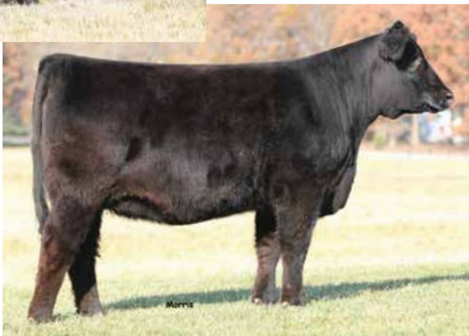
LOT 51 | AUTO DIOR 245D ET