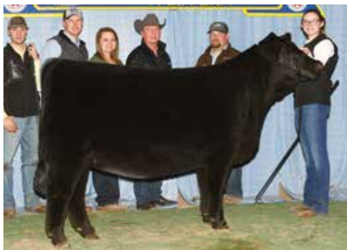
AUTO PONDER 454D | FULL SISTER TO LOT 64