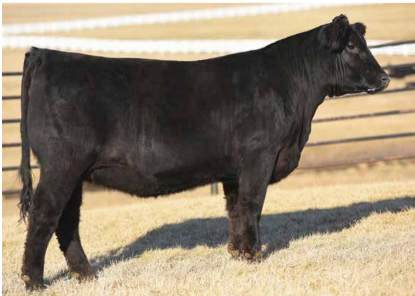
LOT 64 | AUTO MADELINE 447D ET