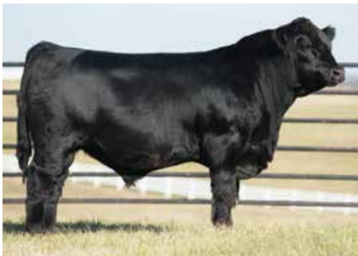
LOT 28 | AUTO STARMAN 577D

You may have not discovered 564D yet, but the ultrasound machine sure did! AUTO Discovery 564D yielded a 123 ratio of IMF. In just a matter of time you will have an opportunity to see AUTO Discovery 564D in person and you will not be disappointed. This homozygous polled and homozygous black herd sire prospect was raised by a first calf heifer who did an exceptional job, we expect great things out of her in the years to come.