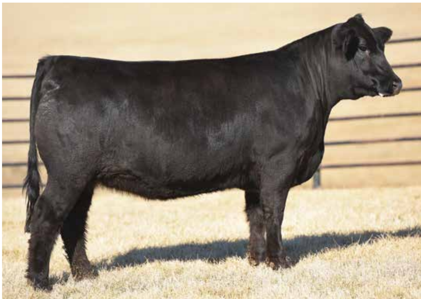
LOT DANICA 61 | AUTO 281D ET