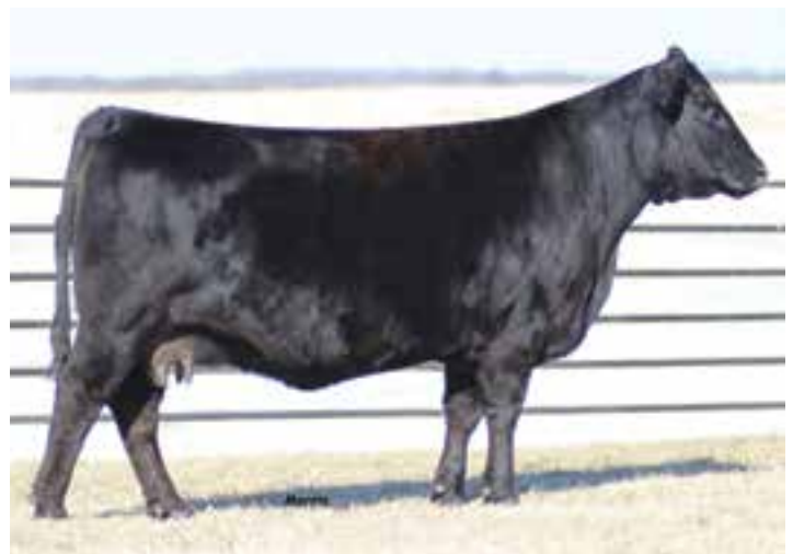
AUTO ANGEL 236U | DAM OF LOTS 69-73

DUE 8.26.18 TO AUTO REAL DEAL 150B (HP/HB) AUTO Black Jewell 450D is a daughter of the Stowers Limousin herd sire, AUTO Power Plus 133B, a son of the popular EXAR Denver 2002B. Her dam is the popular AUTO Angel 236U. This 75% Lim-Flex female is homozygous polled and homozygous black. Her milk and yearling weight EPDs rank in the top 10%. Big bellied and stout at the ground is how we like to describe this female.