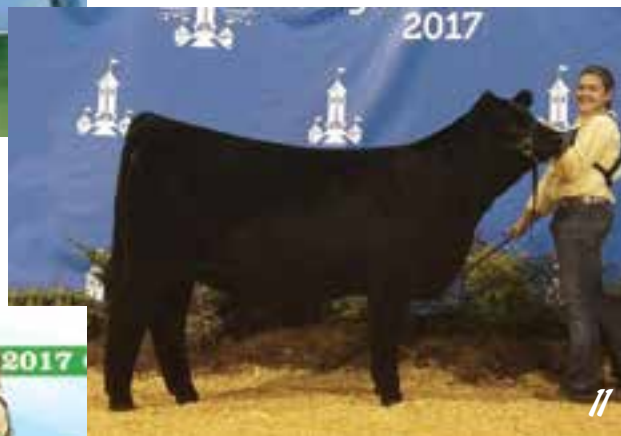
11 AUTO BLACKBIRD 428D Owned by Keely Shultz, GA