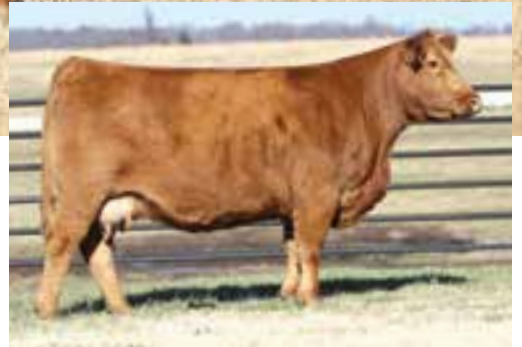
MAGS HANNAH 9726W | DAM OF LOTS 67 & 68