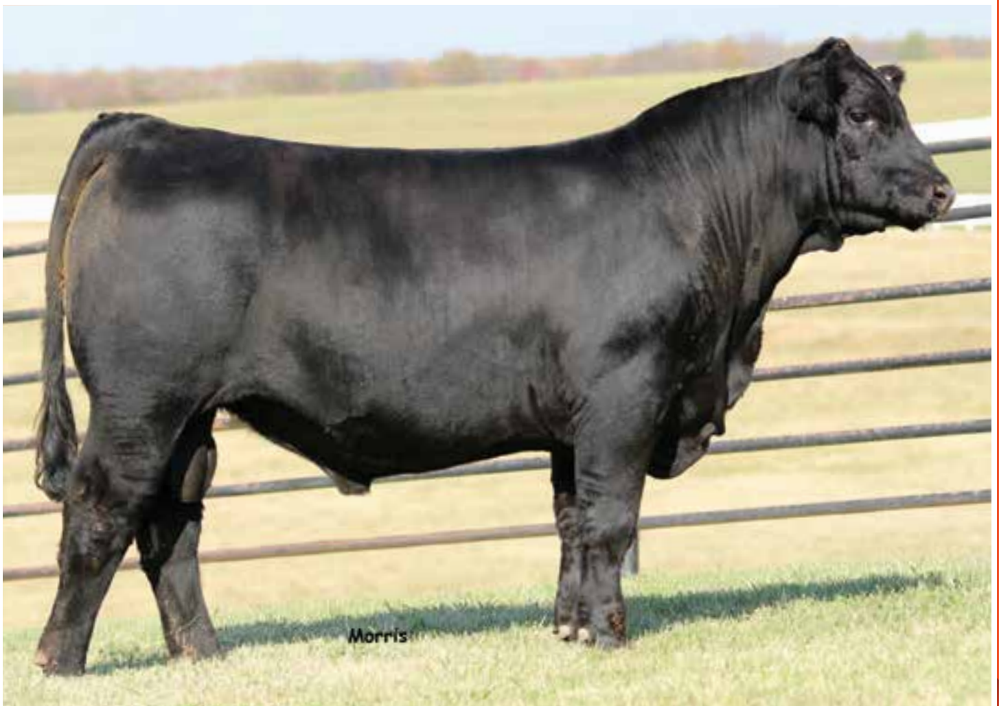
LOT 3 | AUTO SWEET DEAL 161D ET