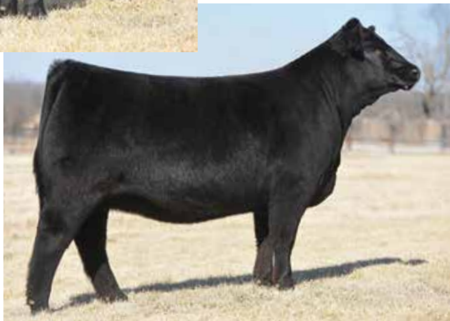
LOT 81 | AUTO ZADIE 467D ET