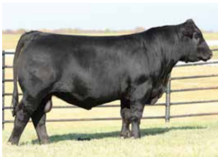
LOT 15 | AUTO CIRCUIT BREAKER 157D ET

AUTO Circuit Breaker is a maternal brother to one of the hottest heifers on the 2018 show circuit, LFL Daisy 6061D ET. Folks, this pedigree is absolutely timeless! You can search far and wide and not find a pedigree as proven as this one is. 157D's dam is out of one of the most significant flushes in the history of the Limousin breed, her flushmates consist of DHVO Deuce, DHVO Trey and Ava Jo, to name just a few. This homozygous black son of LH Rodemaster is 75% Lim-Flex who had an adjusted YW of 1,211 and 37 cm. SC.