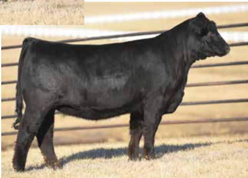
LOT 66 | AUTO DOTTY 295D ET