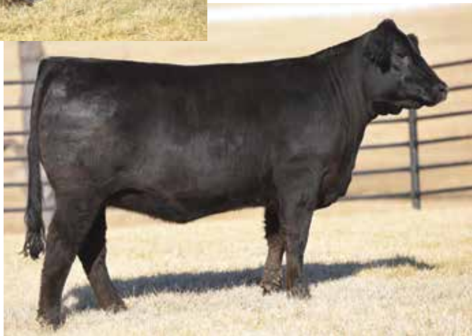
LOT 63 | AUTO PARKER 401D ET