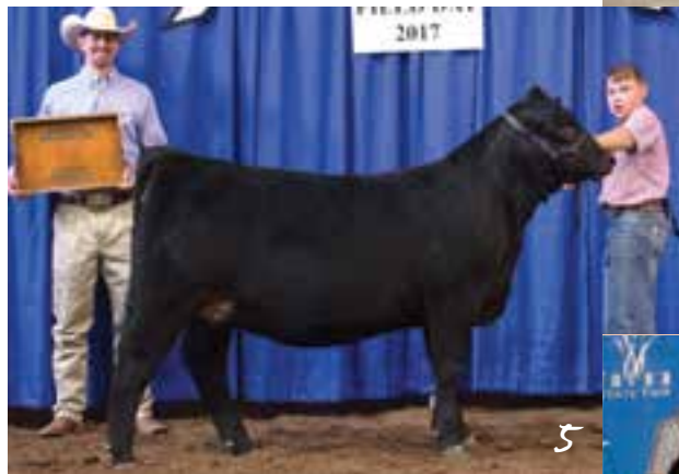
5 AUTO PENNY 291D Owned by Logan Chachere, TX