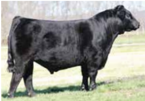
AUTO REAL DEAL 150B | FULL BROTHER TO LOTS 1, 2 & 3