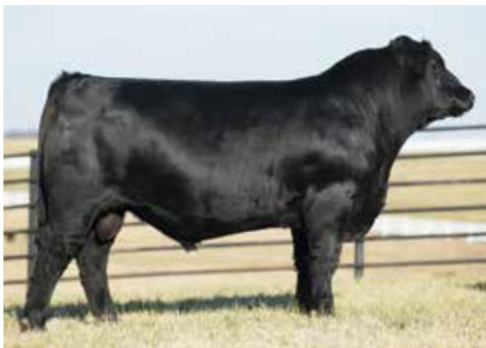
LOT 16 | AUTO MATLOCK 166D ET