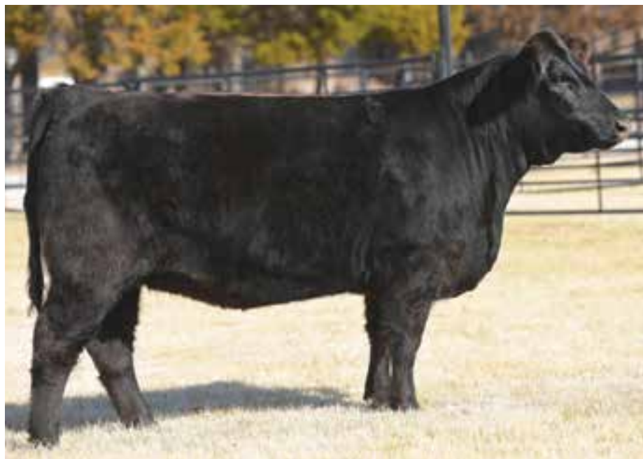
LOT 50 | AUTO DAKIN 255D ET