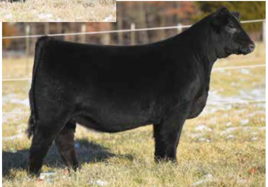
LOT 89 | AUTO EYDIE 278E