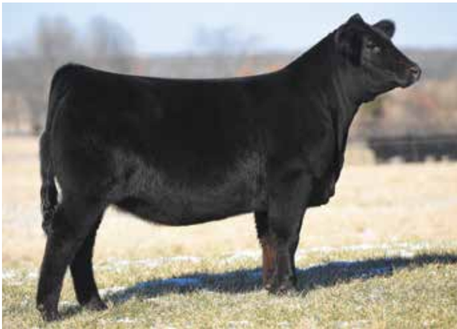
LOT 92 | AUTO ERNA 252E ET