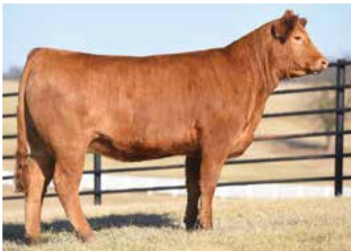
LOT 79 | AUTO APPLE 292D ET

This 67% Lim-Flex female, AUTO Fanfare 299D is a full sib to AUTO Bethany 278D. This female has a stacked, proven pedigree. She is homozygous polled and heterozygous black. Her marbling EPD ranks in the top 25% of the breed. She is super long spined and clean fronted.