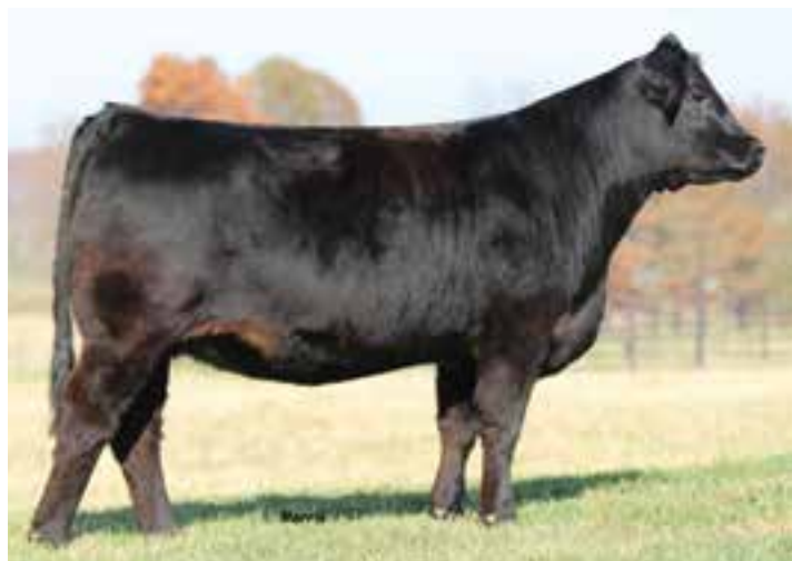
LOT 56 | AUTO DAPHNE 203D ET

AUTO Destani 640D is an extremely powerful daughter of AUTO Gunn Point 192Y. Look at the length of head and neck along with this female's length of body. She is so pretty down her top from the side and stands on all four just as perfect as you would want. This cherry red female is big bodied and we love the way her neck comes out of her smooth shoulder. She is homozygous polled.