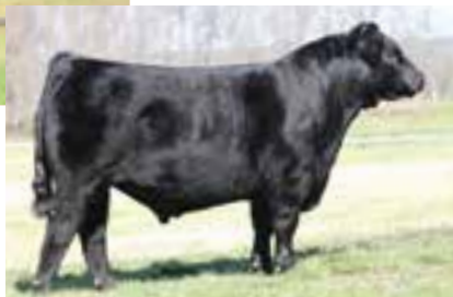
AUTO REAL DEAL 150B