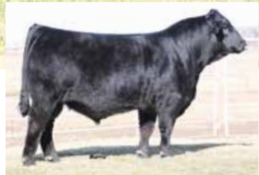
MAGS ALL-STAR 700H | SIRE OF LOT 10