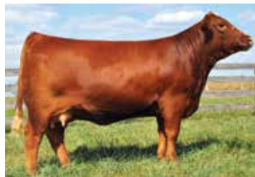
AUTO BETTE 266Y | DAM OF LOTS 44 & 45