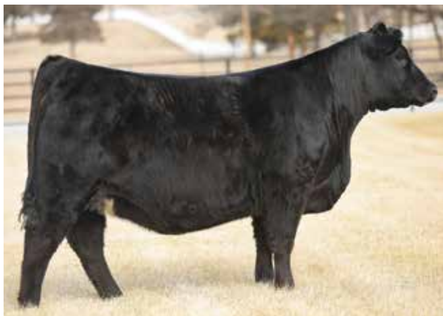
LOT 42 | AUTO CHEYANNE 440C ET