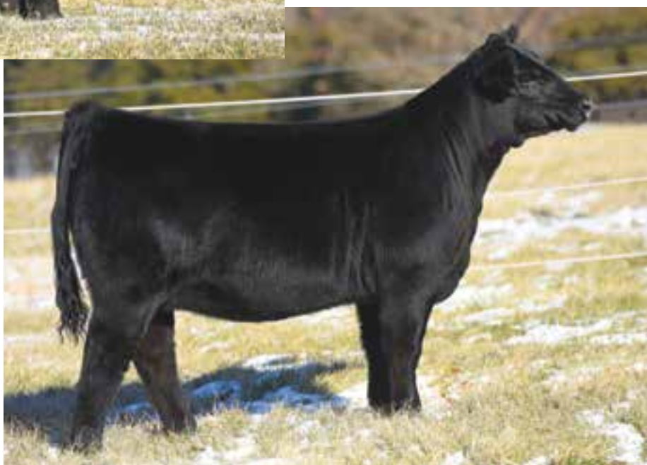
LOT 85 | AUTO EBONI 217E ET