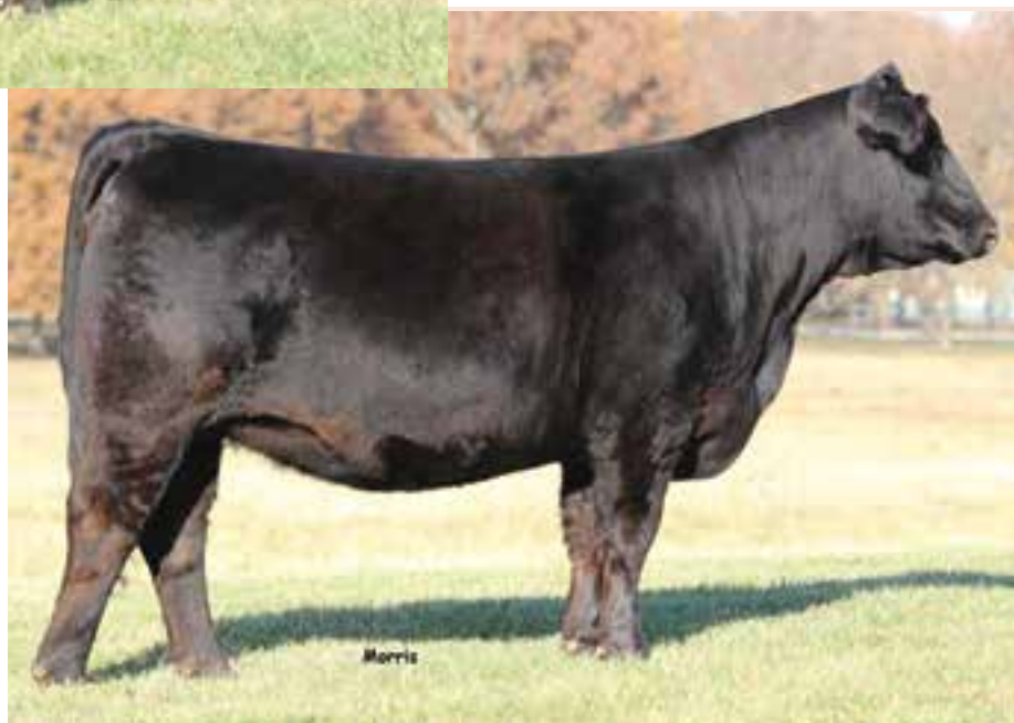
LOT 49 | AUTO CINDEE 160C ET