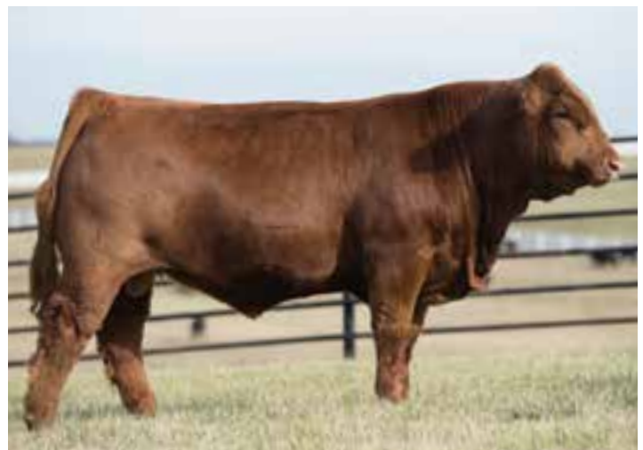
LOT 40 | AUTO RECALL 505E

AUTO Classic 305D This homozygous Black son of AUTO Air Strike 116B, the full brother to the 2015 All American Futurity grand champion bull, AUTO Lucky Strike. his dam, AUTO Angel 236U is a full sister in blood to the multiple trait-leading sire AUTO Dollar General 122R. This herd-sire prospects has the pedigree power to work in any breeding scenario! Classic ranks in the top 10% for MK and TM. He shows his performance in his individual data ratioing 105 for weaning and 102 for yearling weight.