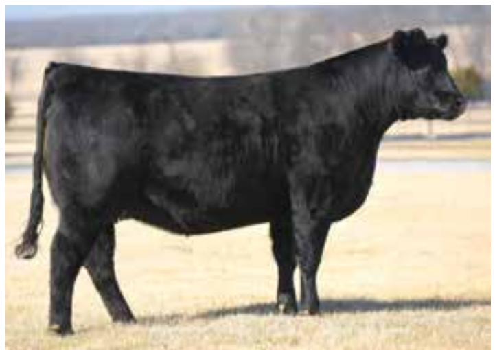
LOT 52 | AUTO DIAMOND 215D ET

AUTO Diamond 215D is a SAV Brand Name 9115 daughter. Brand Name was the top-selling bull in the record-setting 2010 Schaff Angus Valley Bull Sale. He is out of the famed Bismarck bull. Her dam, EXLR Luvly 080T is an elite donor of ours who is out of LESF Asphalt. This female is homozygous polled and heterozygous black. She is a 50% Lim-Flex female. We admire the length of body this female has and how clean fronted she is through her front one third. She has a tremendous amount of muscle expression and depth of body.