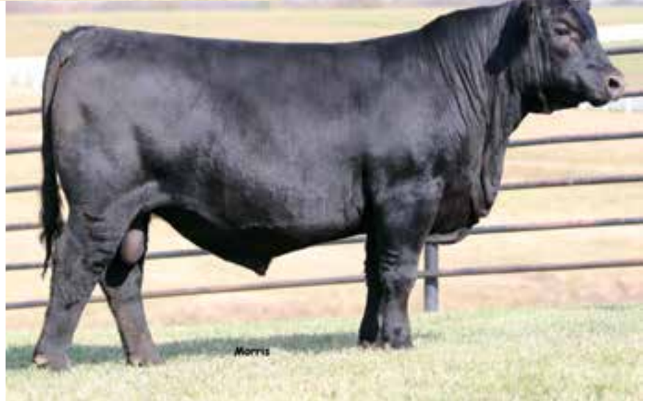
LOT 6 | AUTO FIRE 199D ET