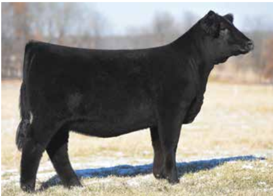
LOT 86 | AUTO EZRA 230E ET