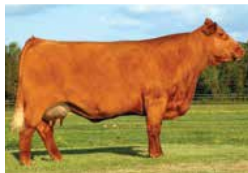
CARROUSELS PEACHES 4430P | DAM OF LOT 42