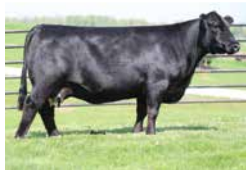
PBRs DUTCHES 790X | DAM OF LOT 80