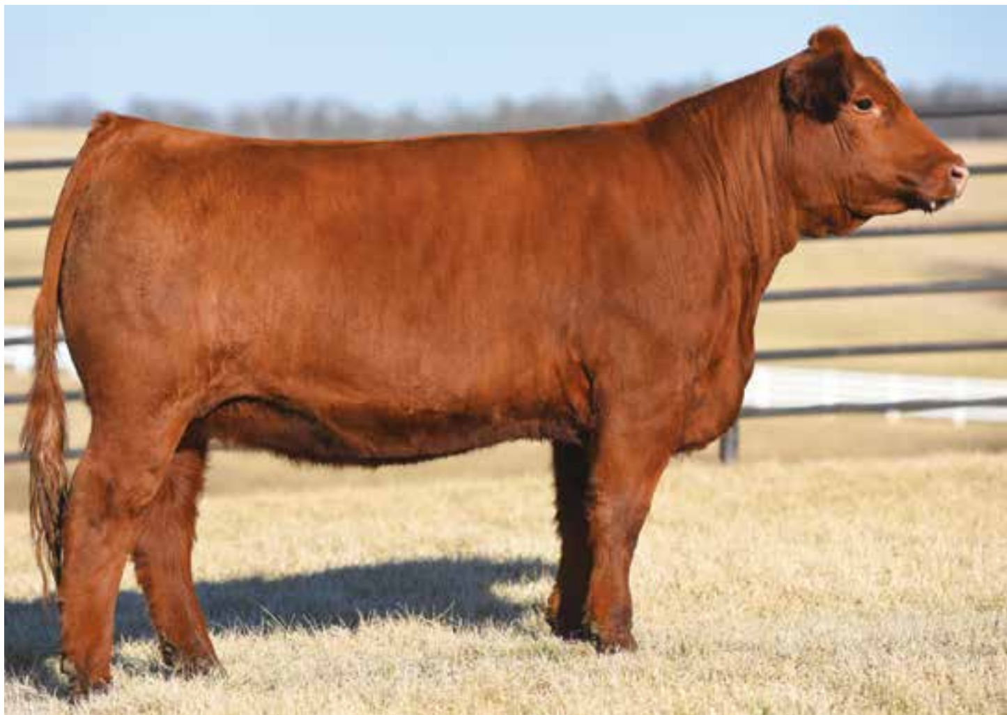
LOT 70 | AUTO DELIGHTFUL 282D ET