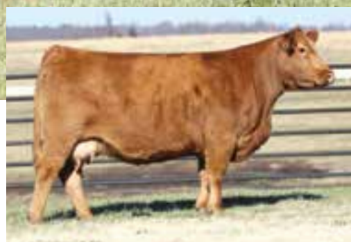
MAGS HANNAH 9726W | DAM OF LOTS 21 & 22