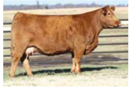
MAGS HANNAH 9726W | DAM OF LOTS 11 & 12