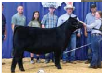
2019 All-American Futurity Reserve Grand Champion Female