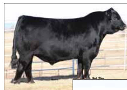
Sire, MAGS Cable