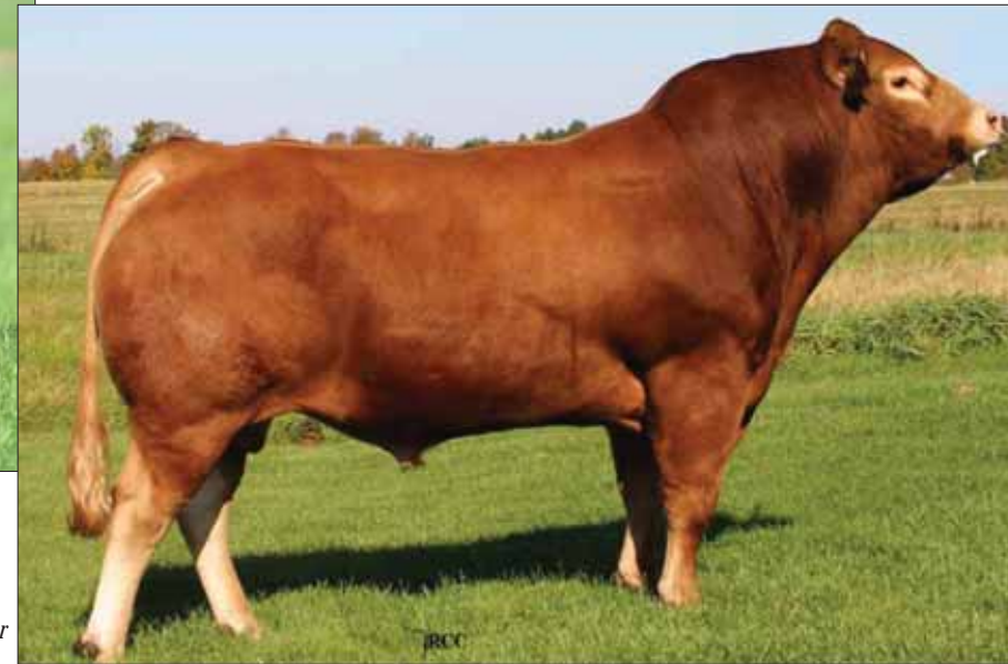
Sire, Posthaven P Zansibar