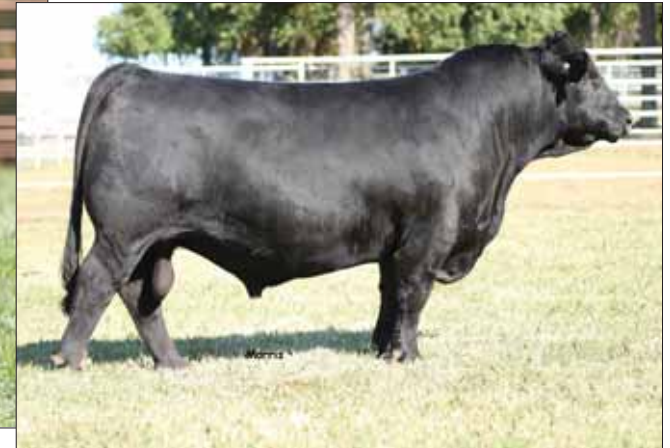
PBRS Bunk House

3 Selling semen packages. 15 units for $1,000.