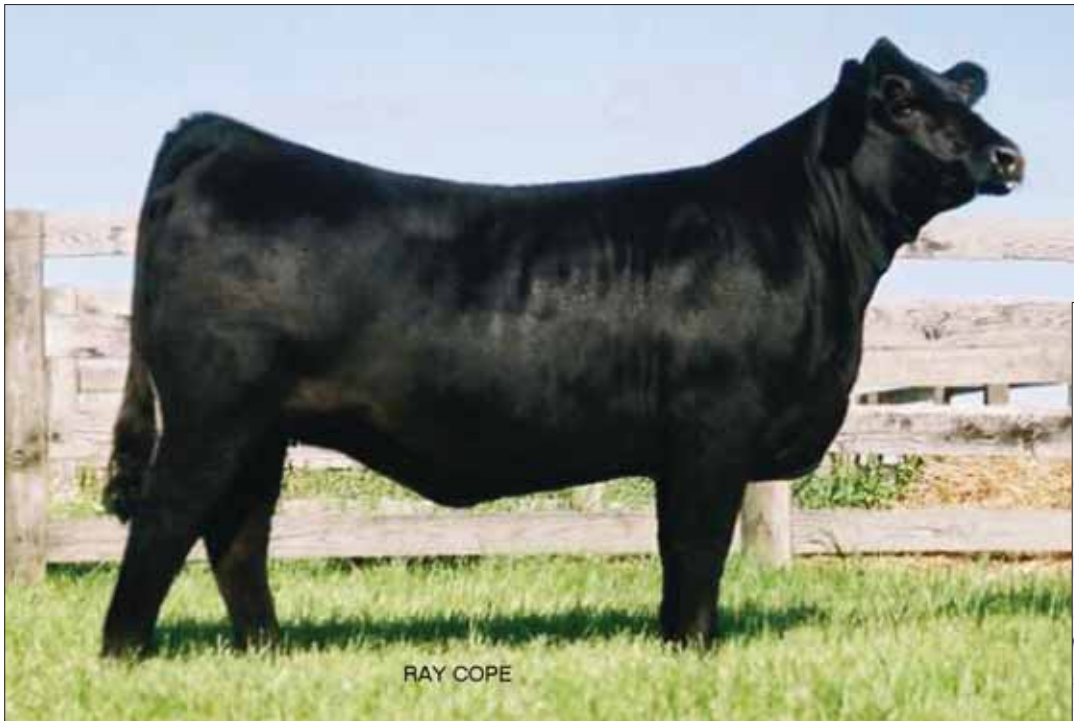
Donor, AUTO Christy 8889R