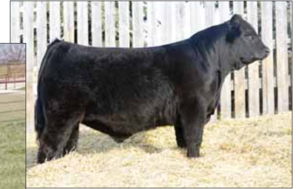
Sire, Riverstone Crown Royal