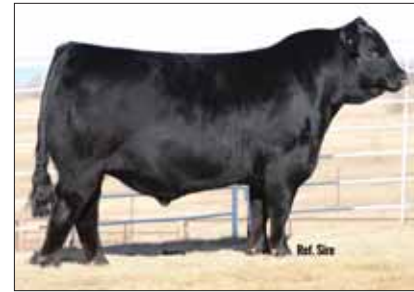
Sire, MAGS Cable