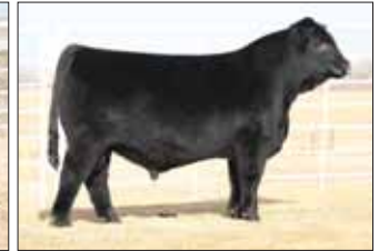
Sire, AHCC Earning Power 900E ET

This genetic consignment epitomizes the crossroads of where phenotypic quality, huge numbers and genetic diversity meet. These designer matings offer you the opportunity to invest in some of the breed's freshest and most industry relevant genetics. The imagination runs wild when you project the boundless possibilities of the future offspring of these breed standouts. The numerical giant, MAGS American Beauty, a daughter of the deceased MAGS Winston A.I sire possess a combination of structural integrity, body depth and fleshing ability even the most discriminating cattlemen would appreciate. Her offspring to date have been exceptionally high performing and marketable! We feel these matings speak for themselves and represents the progressive direction of acclaimed ATAK Limousin breeding program. We invite you to appraise the unmatched genetic value on offer.