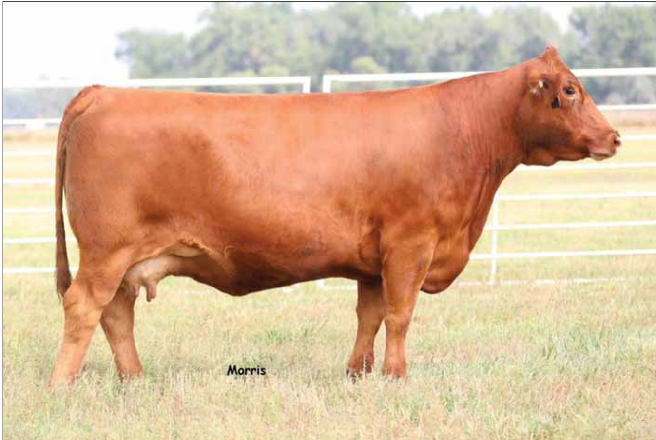
Donor, MAGS Yesteryears