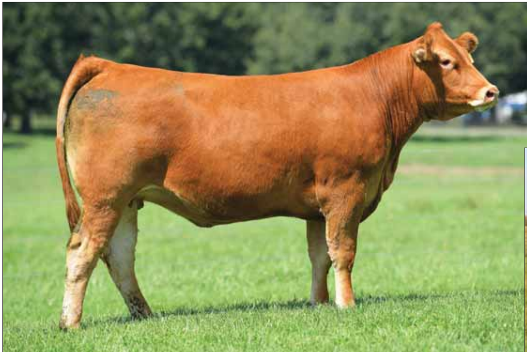
Donor, AUTO Strawberry 431D