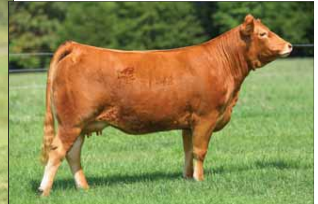
Full Sib to Lot 9, AUTO Redbird 421D.