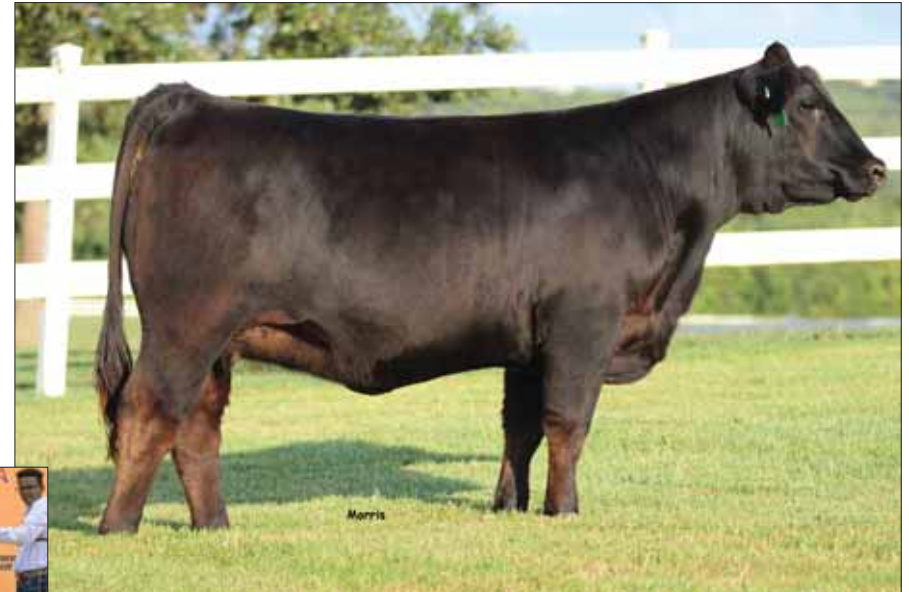
Dam, PBRS Diva Note 6298D