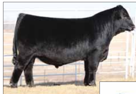
MAGS Firestone 218F, sire of Lot 4A.