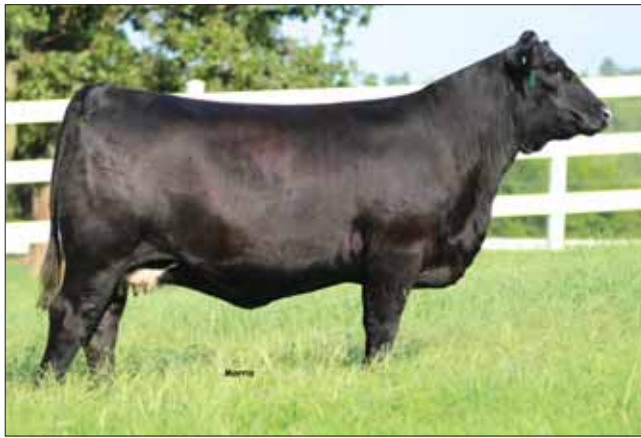
Donor, PBRS Destiny 6285D