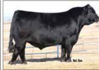
Sire, MAGS Cable