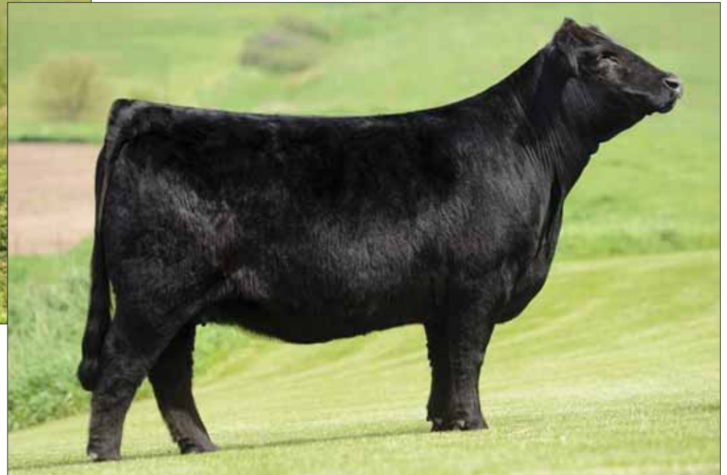
Dam, WLR Prada

16 This elite consignment is just plain exciting in our minds and should send chills down your spine. Colburn Primo 5153 is the simply amazing son of Dameron First Class and from an extremely decorated Silveiras Style daughter, Silveiras Saras Dream. Primo sires cattle that are deep bodied, big boned and flawlessly designed. WLR Prada is the premier, two-time National Gold Medal M.O.E. dam. She is one of the finest females to carry the WLR prefix and is such a standout even in production. This genetic combination has everything stacked in its favor and we couldn't be more excited to see the outcome. These three embryos are 50% Lim-Flex, homozygous polled and double black. They are IVF reverse sort heifer embryos.