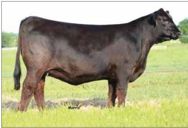
Donor, MAGS American Beauty