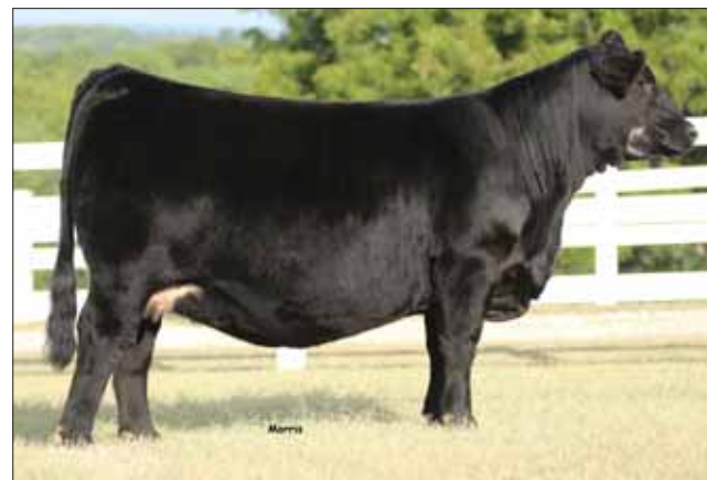
Donor, AUTO Callie 403B ET