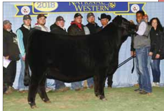
Dam, AUTO Dana 265D