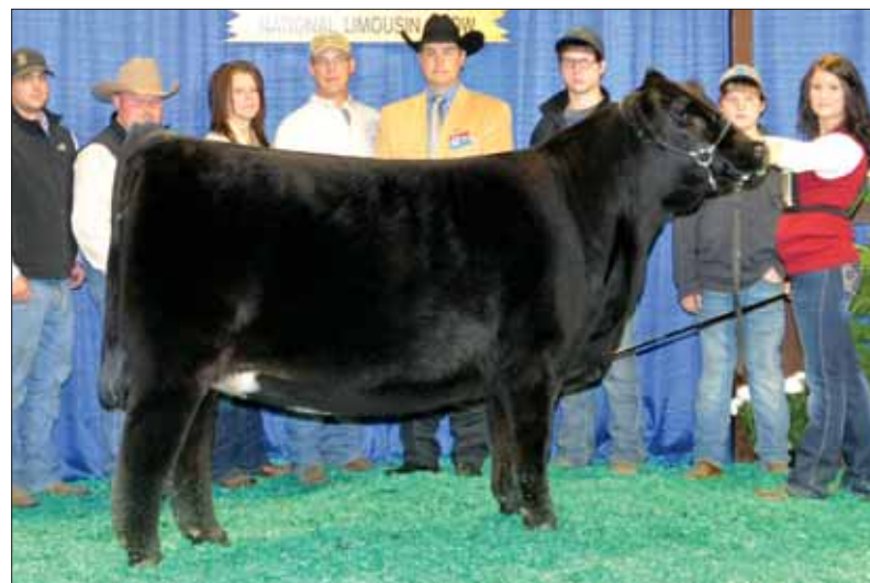
LLJB Absolute Style 3056A, dam of Lot 4.

Folks, here's your chance to be the judge! Study this rare opportunity brought to us by the progressive Wilder Family Limousin program to take your pick of these big time matings. The breeding combinations at hand boasts some of the most proven and desirable genetics that have excelled both in production and in the show ring at national levels. The A.I sires featured in this lot, represent a combination of exceptional phenotype, mainstream numerics and marketability. The prolific donor dam is the many times champion, LLJB Absolute Style 3056A. Over the years she has produced more than 50 calves on file, generated north of $500,000 in six years and is known for eye appealing progeny that excel in terms of structural integrity. October 6th don't miss your chance to take your pick of pregnancies and invest in top flight genetics from a reputation program.