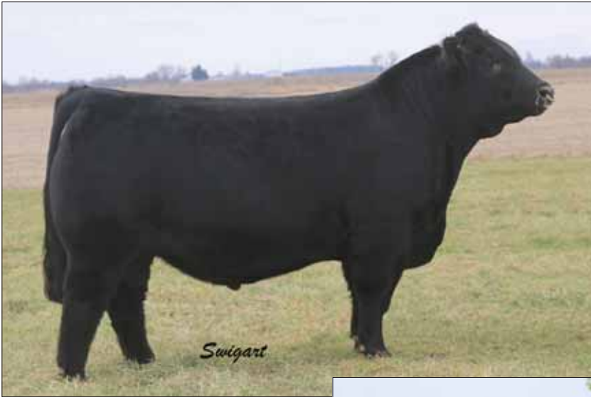
Sire, RLBH Air Force One