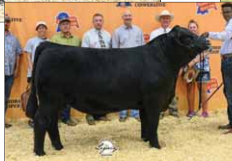
2019 Nebraska State Fair Reserve Supreme Champion Bull

21 Selling three grade one, conventional embryos.