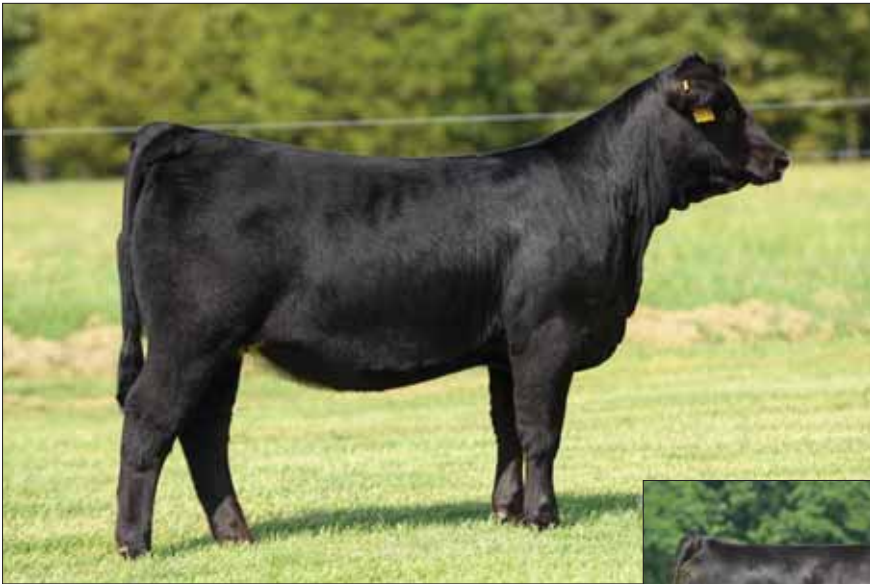
AUTO Grandeur 214G, Lot 7.