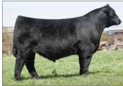
Sire, CELL Freedom 8208F ET