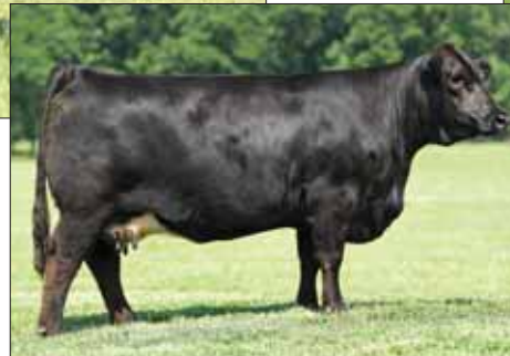
AUTO Zofia 439Z, dam of Lot 7 & 8.