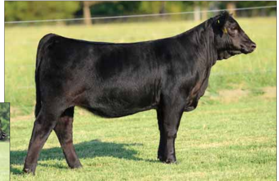
AUTO Guess Work 215G ET, Lot 8.