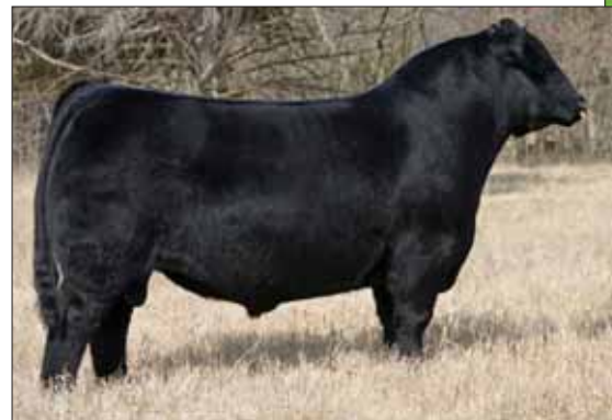
Sire, Greene Pokerface 1304

These future calves have a world of potential bred into them. These embryos are sired by the Silveiras Style son, Green Poker Face 1304. He is moderate framed, easy in his condition and very appealing. The great thing about this mating is the blending of the best of Angus with the best of purebred Limousin and that is exactly what you will get.