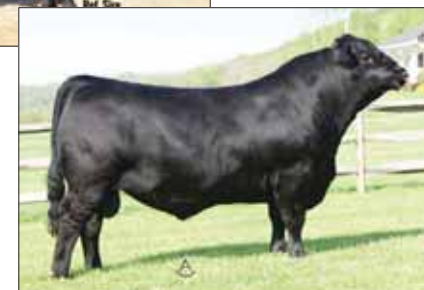
Sire, TMCK Cash Flow 247C