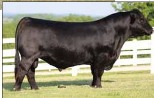
ELCX Bullet Proof 438B, maternal sib to Lot 12.