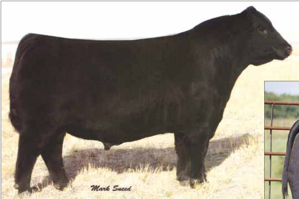
Sire, Barstow Cash