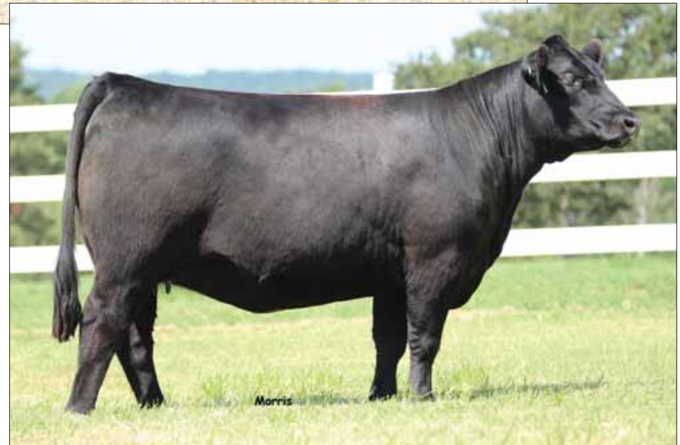
Dam, PBRS 5136C ET

— TMCK DURHAM WHEAT 6030X DHVO DEUCE 132R RIVERSTONE CROWN ROYAL MAGS STRAWBERRY PIE — HSF YOUR FANTASY MAGS WAR ADMIRAL HSF TINKERBELL — MAGS ANCHOR LH WAR HERO 195W PBRS 5136C ET MGS XIPHOPAGOUS — BUF EPPIONIA 7307 S A V 8180 TRAVELER 004 SITZ EPPIONIA 534