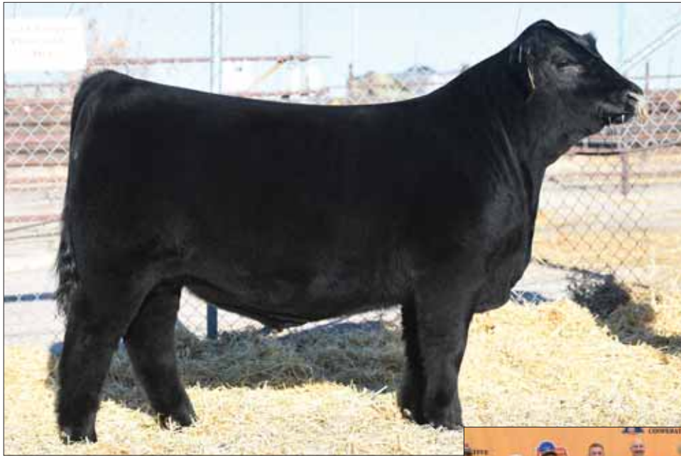
Sire, WLR Final Call