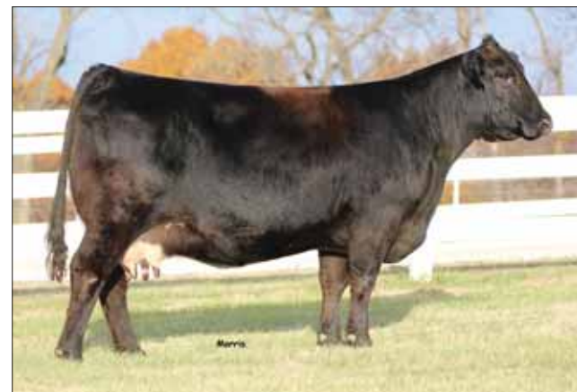
Donor of Lot 32A & 33, MAGS Xosa

Folks, here is a true sale highlight and chance to invest in fresh genetics! The donor dam, MAGS Xosa, a full sibling to the ever popular Xyloid sire is a stout featured, high performance, sound structured female that carries and abundance of rib shape. What's more the sire represented in this mating, Musgrave Headway, is a fresh pedigreed numerical giant! The bottom-line is, the result of this designer mating promises to produce top flight progeny.