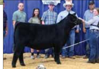
AUTO Crowning Day, full sister to Lot 22.