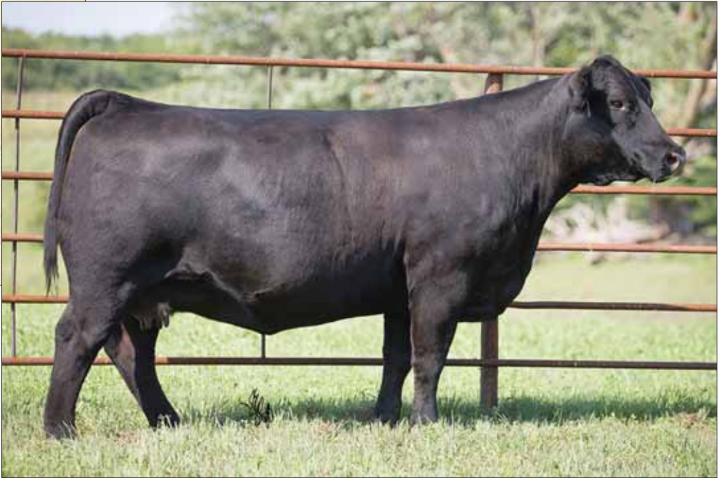
Donor, MAGS With Class

15 This marks a great opportunity to invest in both an amazing donor and sire. First the donor, MAGS With Class, that produced numerous national champions like the 2019 Grand Champion Lim-Flex and 2018 Rs. Grand Champion Lim-Flex at both National Junior Shows respectively. Visually she comes to us in a sound footed, square hiped, big bodied, attractive patterned package. On the sire's side of the equation, here's an opportunity to invest in a widely popular Angus bull that's impressed many with his shear mass and structural integrity, Barstow Cash. With out question, this high power mating promises to hit a home-run! Bid with confidence.