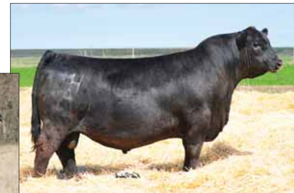
Sire, HA Cowboy Up 5405