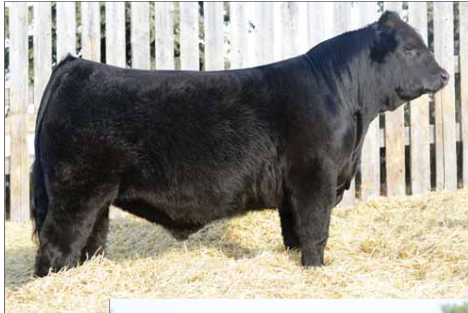
Sire, Riverstone Crown Royal

Buyer has the opportunity to select their favorite from four heifer calves. This is another super exciting mating in this offering. Riverstone Crown Royal is the premier sire of elite cattle that have the look and that can be turned out in production taking the world by storm. PBRS 5136C is one of our leading donors that never fails to impress us. She is a daughter of MAGS Anchor and from the great P Bar S Angus donor female, BUFF Eppionia 7307. She is made just like they should be- flexible in her movement, smooth in her lines and powerfully constructed. Buy with confidence in this elite blending of winning genetics.