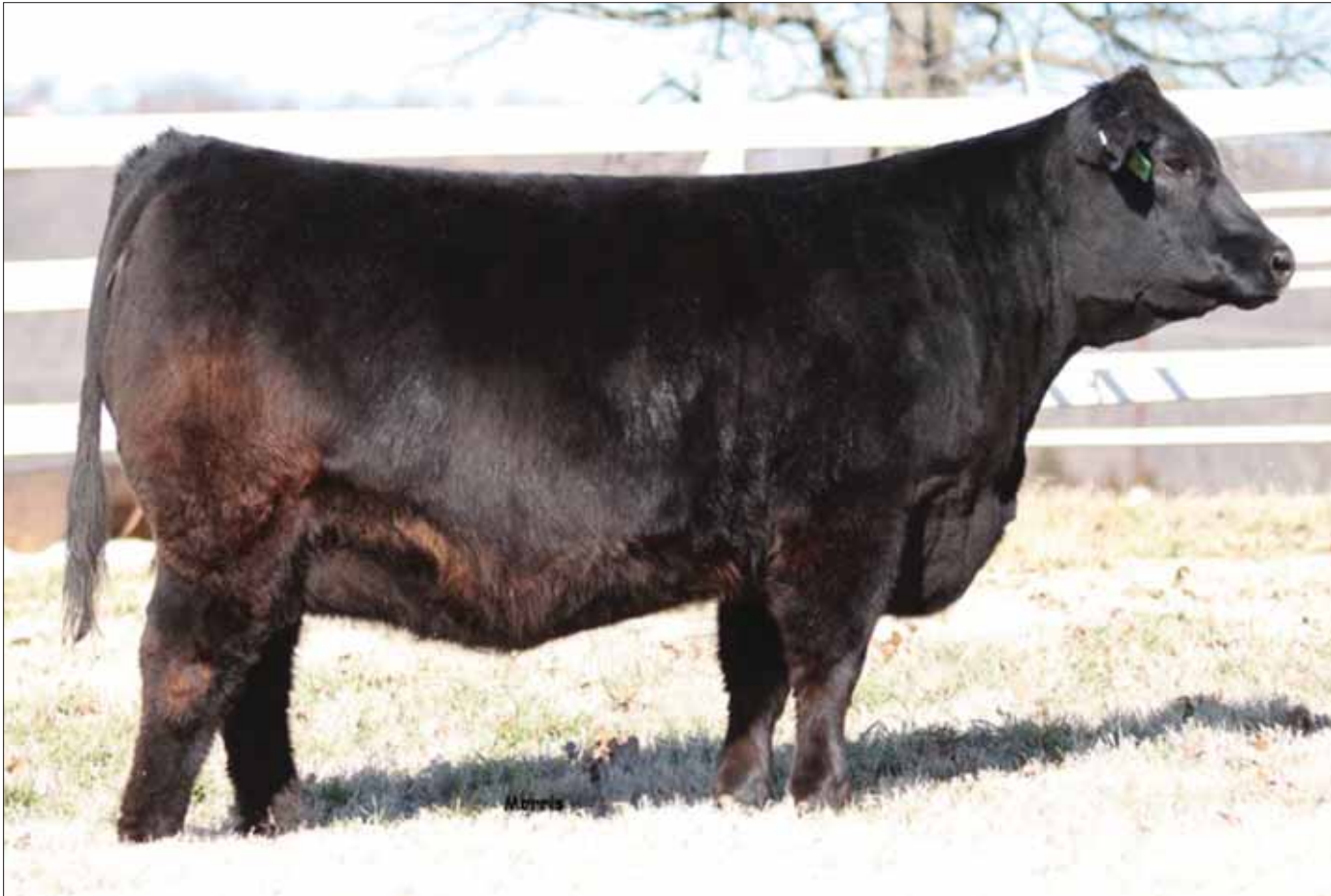
PBRs 79E full sib to Lot 14 embryos.

14 These two conventional embryos are definitely a highlight of this offering. They are homozygous black and homozygous polled and 60% Lim-Flex. These embryos are sired by the top herd sire in 2017, MAGS Aviator. He is known and trusted to produce cattle that are moderate made, structurally sound and smooth in their design. ADLL 5125C is quite the impressive DHVO Deuce daughter. Her dam is MAGS Unseat the Winner, an MYTTY In Focus female. You really don't have to analyze this lot very long because the quality of this mating is second to none. Be sure to have this one marked down for sale day! These embryos are full siblings to the top selling lot in the P Bar S April 2019 sale at $12,500 selling to J6 Farms of Gibbon, Nebraska.