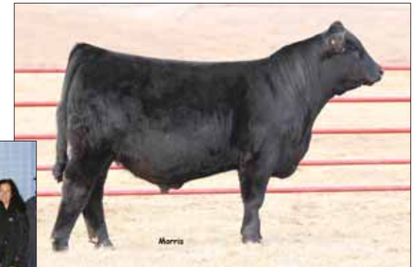
Sire, LVLS Bank Account 8116B