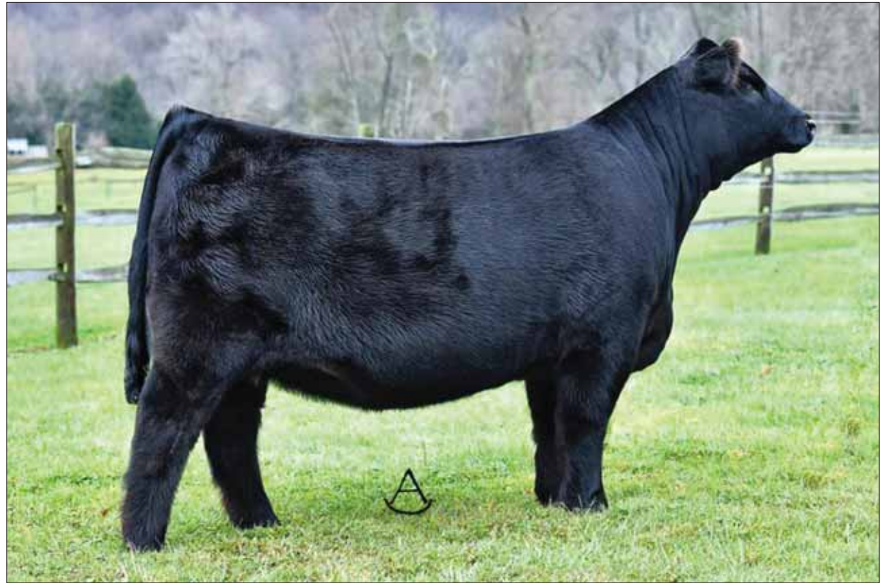
TMCK Earth Angel 433E, full sister to Lots 2.

2A TMCK GOINPLACES 726G ET LFF 2167855 | Lim-Flex (43%) | Het Polled | Homo Black | 02.22.19