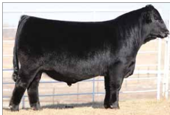
Sire, MAGS Firestone 218F