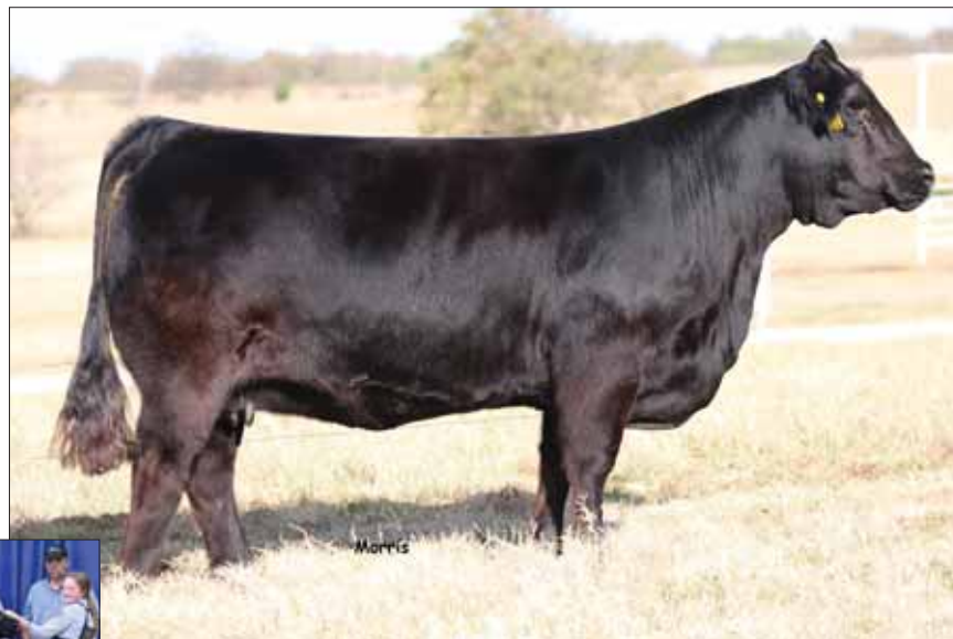
DAM, SBLX Xtra Special 214X

One of the featured donor cows for Stowers Limousin and KLS Farms is SBLX Xtra Special 214X. She is the once $52,000 valued female and many times show champion. She is proven daughter of the National Champion sire DHVO Deuce 132R and from the elite and now deceased MAGS Manuela. 214X has been a leading donor for both of these leading programs. Her mating to the purebred Angus sire, HA Cowboy Up has worked extremely well. The Cowboy Up x 214X progeny have been very sound structured, moderate framed and easy in their condition.