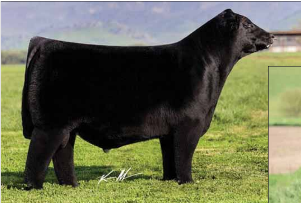
Sire, Colburn Primo 5153