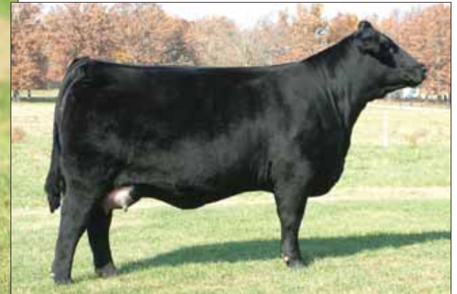
AUTO Rebeca, dam of Lot 6.

6 AUTO Gretna 222G is about as royally bred as the come. She is a Riverstone Crown Royal daughter to pay attention to. Her dam is the great AUTO Rebeca 292S. AUTO Rebeca is one of the all-time great donor females in the entire breed. Her milk EPD ranks in the top 20% of the breed. This female is homozygous polled and homozygous black. We are certain this female will make a lasting, positive impact in the breed and be recognized as a top producer in any program