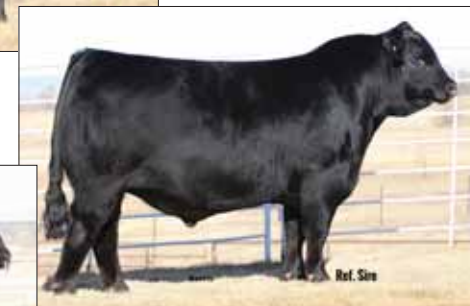
MAGS Cable 517C, sire of Lot 4B.