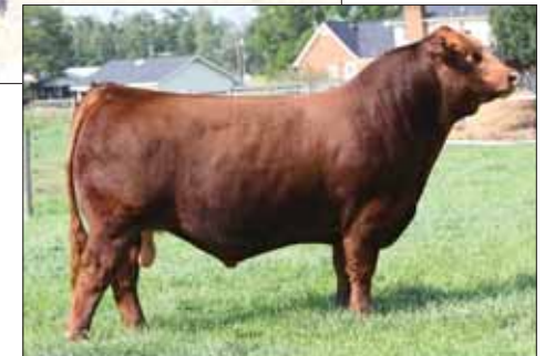
ELCX Englishman 769E, maternal sib to Lot 12.

Lot 12 Selling full possession. Davis Limousin maintains 50% embryo interest only (embryo interest will be that Davis has the rights to 50% of embryo production and they will pay 50% of the transplant production). If the female is sold in the future the new buyer from this sale will get 100% of the money and Davis will retain a minimum of 10 embryos in the future with whomever owns the female.