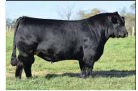
SIRE CJSL Creed 5042C