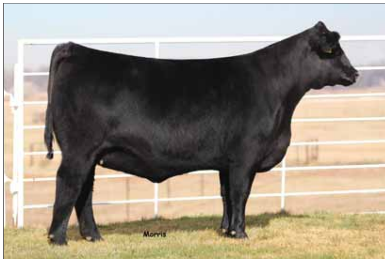
Donor, MAGS Calico 504C