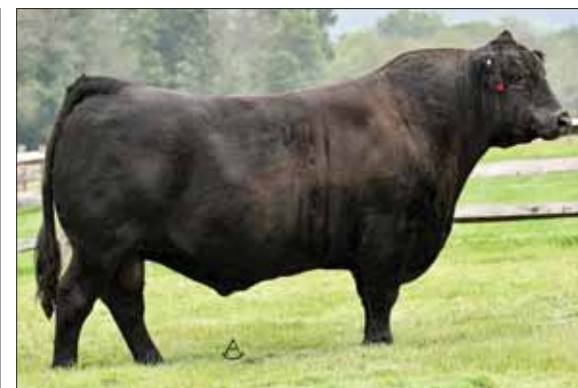
Sire, CJSL Creed 5042C