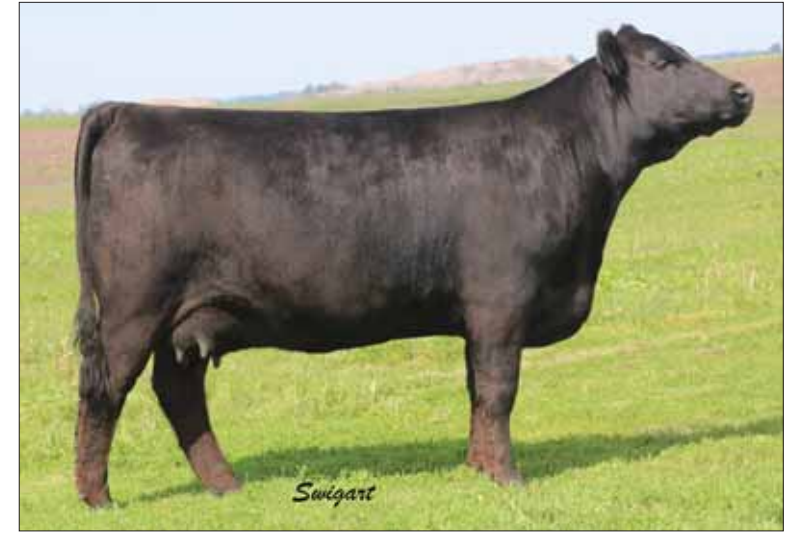
Dam, AUTO Angelina 225A