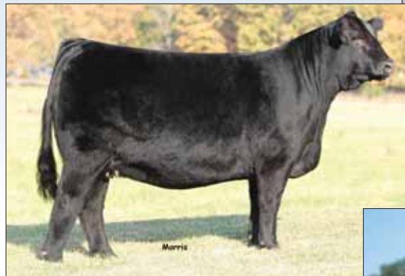
AUTO Usually Yours

It's not everyday you have the opportunity to invest in choice of embryos in an entire inventory from a progressive firm like Diamond Hill Cattle Co. Found in the 'tank' is a combination of both proven genetics and fresh pedigree twists all in the same breath. Just to name a few, cow families represented in the Diamond Hill embryo battery would feature the likes of PBRs Touch Me Gently, AUTO Bliss and EXLR Luvly. What's more, majority of the created embryos will come to us in some of the breed's most numerically impressive packages. The bottom-line is, this is a lot that projects to produce breed standouts that would be an asset to your genetic arsenal for years to come. For further details on inventory contact Diamond Hill Cattle Co. direct.