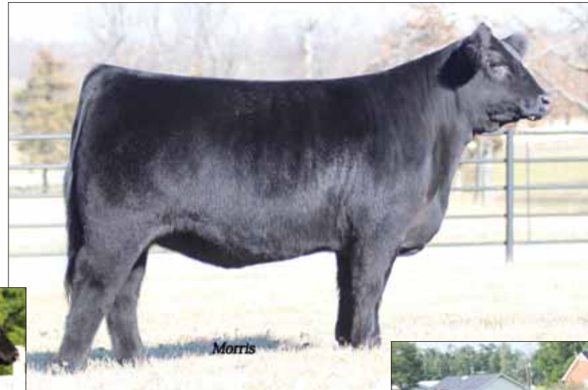
Dam, AUTO Poem 273Y