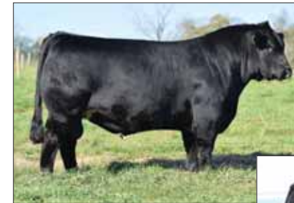
Sire, CJSL Dauntless 6257D ET