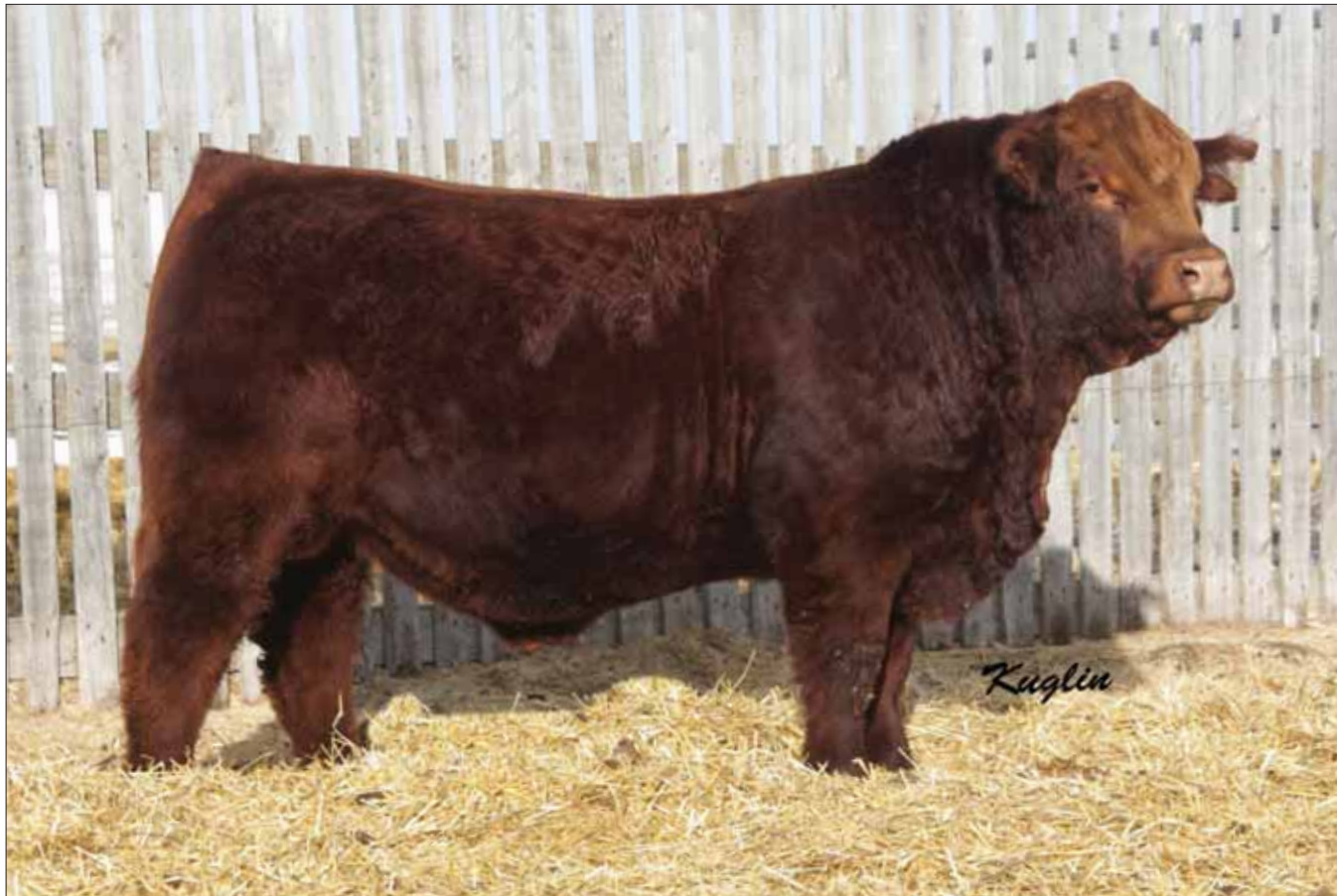
JYF Edmonton 519E