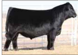
Sire, MAGS Firestone 218F