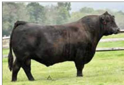
Sire, CJSL Creed 5042C