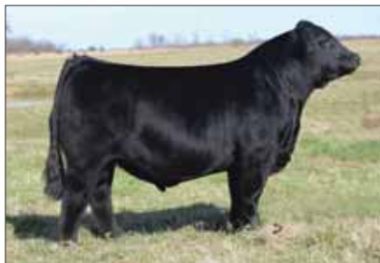
Sire, TASF Crown Royal 196F