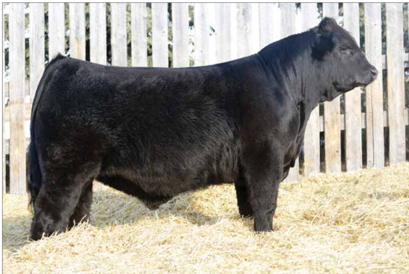
Riverstone Crown Royal