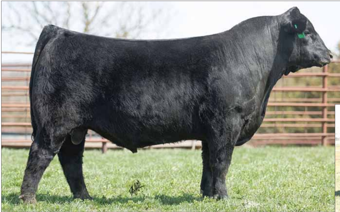
PBRS Roadhouse 7298E