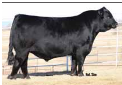
Sire, MAGS Cable