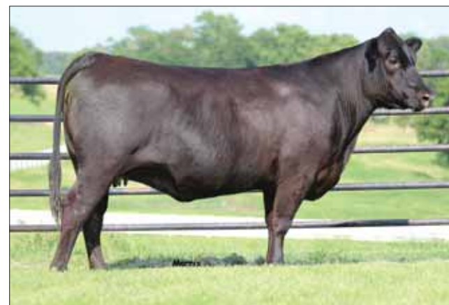
Donor of Lot 32B, LFL Zamora 2069Z