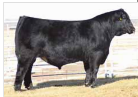
MAGS Ali 319A, sire of Lot 4C.