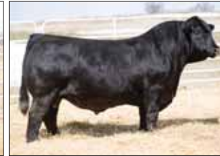
Sire, CJSJL Data Bank 6124D