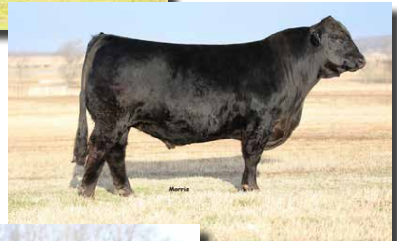
ELCX Caesar 331C - Ref. Sire

Here is a daughter of Win Vue Insight 673, a direct son of PVF Insight 0129 and a Connealy In Focus 4825 female, Win Vue Lady Objective 744. This female's dam is a MAGS Y-Axis daughter and from an AUTO Dollar General 122R cow. WNVU 837F is homozygous black and double polled. She is 37% Lim-Flex.