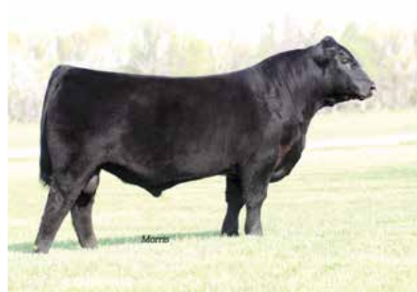
MAGS Y-Axis - Ref Sire