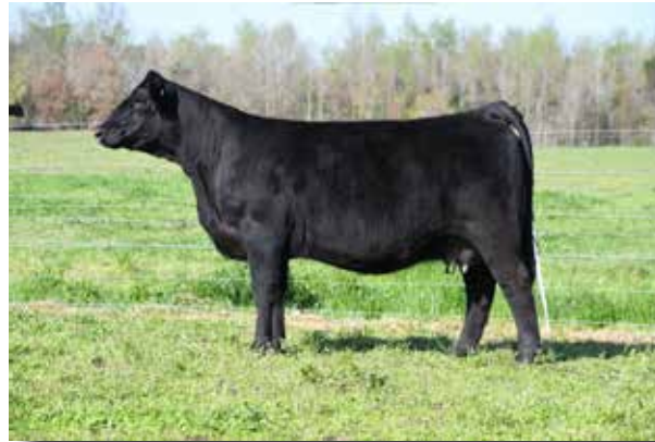
ELCX GOT IT - Lot 58