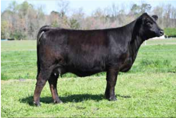
ELCX GET IT 510G - Lot 50