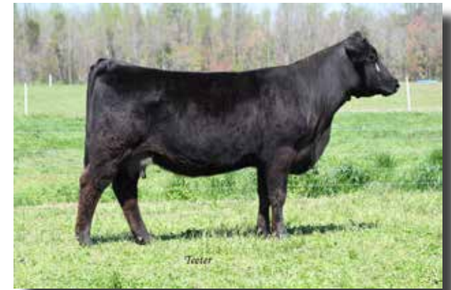
ELCX DELUXE 34D - Lot 52

ELCX Goldrush 549G is a 62% Lim-Flex daughter of MAGS Xyloid. Her dam is a JCL Lodestar 27L daughter. Longevity is the name of the game with this female. She has produced several individuals that have been tremendous standouts among their contemporaries. We admire this female's bone, foot size, flexible patterns and her agility in motion. She is homozygous black and double polled.