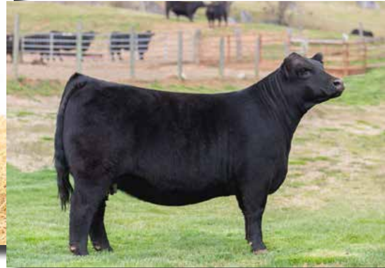
AUTO GLORIA 229G ET