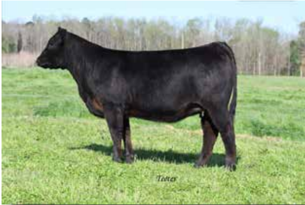
ELCX 927G - Lot 56