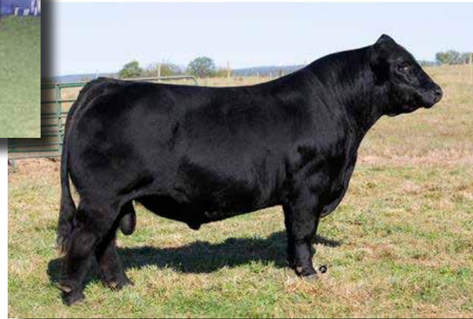
TASF CROWN ROYAL 960C

Owned By: ATKINSON FARM, SULPHUR, OK WIN VUE ENTERPRISES, BULLS GAP, TN CROSS CREEK FARMS, GRAY, TN