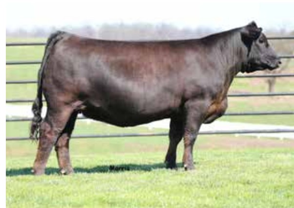
AUTO PARIS - Dam Lot 27