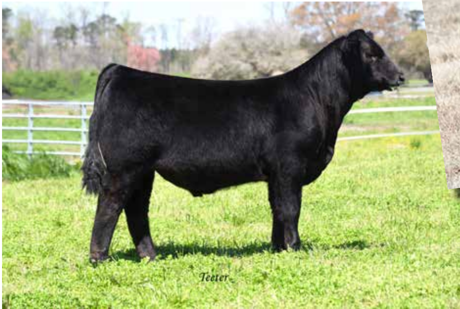
ELCX HIGH TIME 065H ET - Lot 5