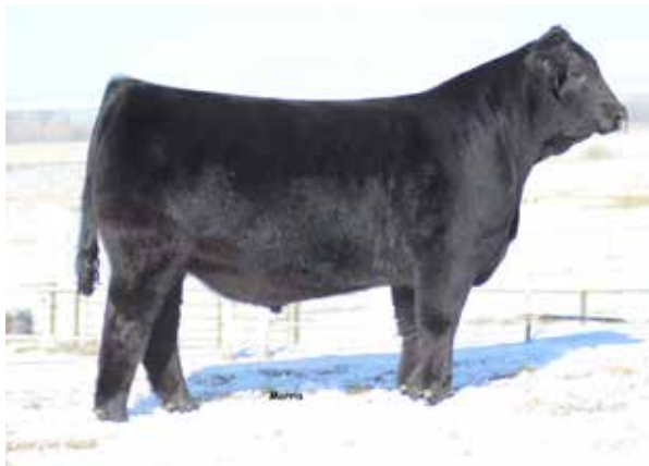
MAGS AVIATOR - Ref Sire