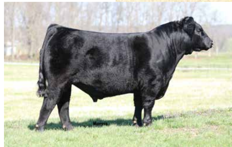
AUTO Real Deal 150B - Ref. Sire

An 81% Limousin daughter of ELCX Saga 414B you'll want to have on your short list! ELCX Saga 414B is the DHVO Deuce 132R son out of the tremendous donor female, DFCL HBHPC 1S. WNVU 831F's dam is an EF Xcessive Force daughter. She is double black and double polled.