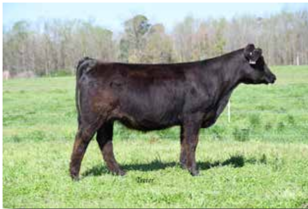
ELCX GOOD GOLLY 507G - Lot 54

Consignor: EDWARDS LAND & CATTLE COMPANY, BEULAVILLE, NC This gal will "empower" you to buy into this great Limousin breed if you haven't already! ELCX Empower 983E is a 50% Lim-Flex daughter of ELCX Bacardi 427B ET, an SAV Brilliance 8077 son from the infamous WLR Tainted Love 746X donor female. ELCX Empower 983E's dam is the son and only SBLX Zane. She is a daughter of MAGS Winston and from the phenomenal SBLX Underthecovers 201U female. This female is homozygous polled and quite the red beauty.