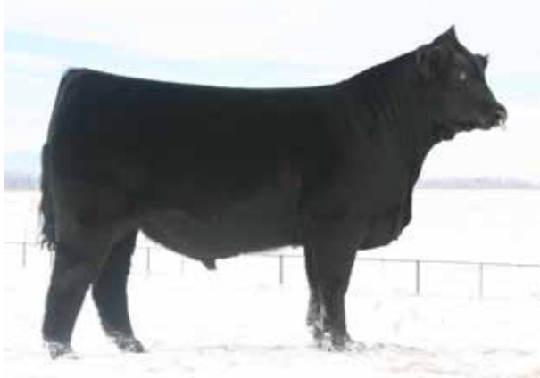
MAGS Xyloid - Ref Sire