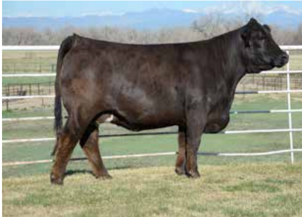
Dam of Lot 41 - MAGS UAHUKA