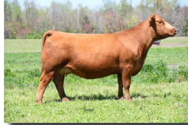
ELCX EMPOWER 983E - Lot 55

Consignor: EDWARDS LAND & CATTLE COMPANY, BEULAVILLE, NC