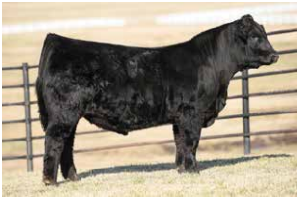
AUTO BLAQUE BLAZER 100F - Ref. Sire