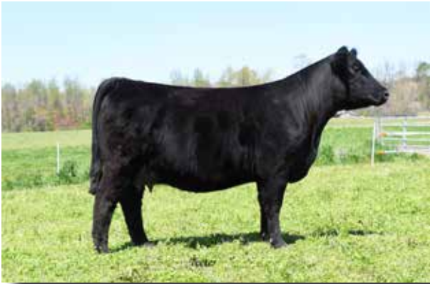
ELCX GODDESS 6G - Sire of Lot 53