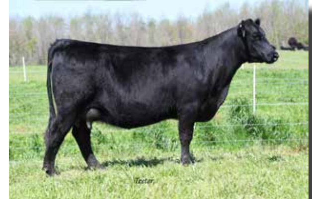
ELCX EXTRA SPECIAL 701E ET - Lot 49