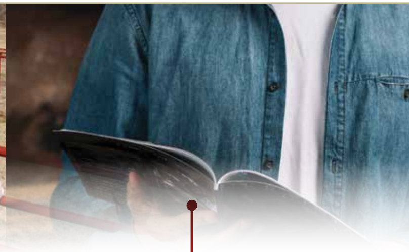
OFFICIAL BREED PUBLICATION