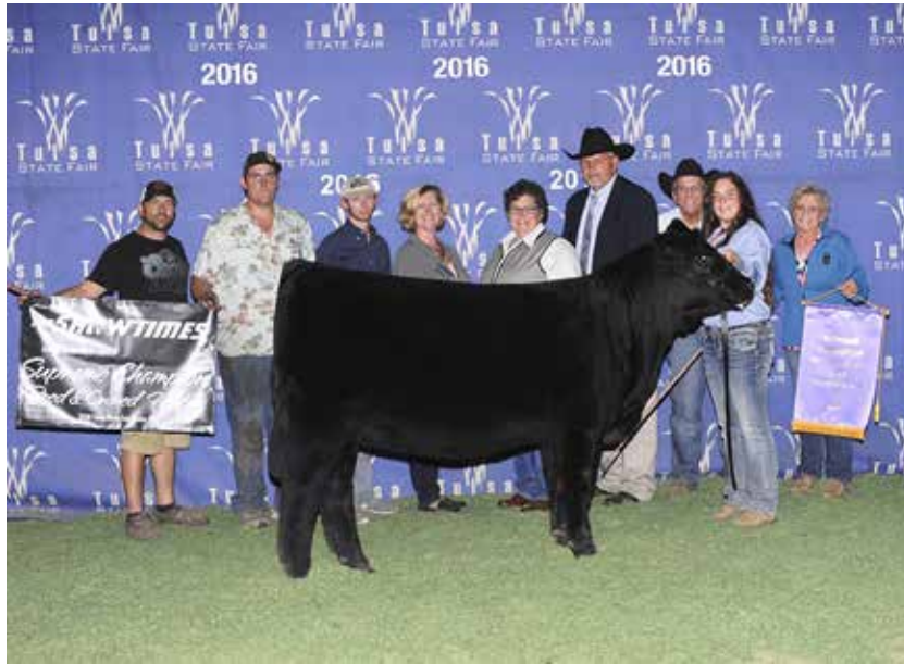
JCL CINNAMON LNLM 522C