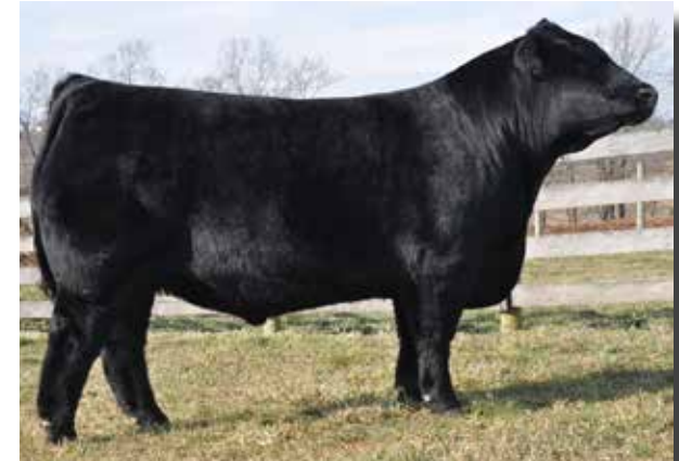
Sire of Lot 43 - EF XCESSIVE FORCE