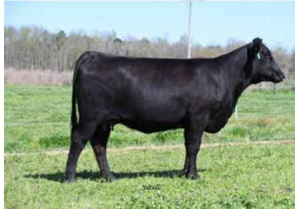
ELCX GOLDRUSH 549G - Lot 51

ELCX Get It 510G is a 71% Lim-Flex MAGS Xyloid daughter to get on your short list! Her dam is ELCX Cool Chick 510C, who comes from the potent mating of EXLR Review 7153R and the great PBRS Tainted Love 257T female. She is double black and double polled.