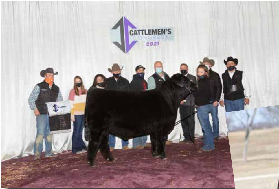
AUTO HOW IT'S DONE 1219H ET - Lot 2