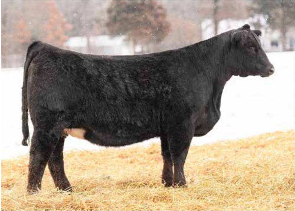
AUTO GUESS WORK 215G ET