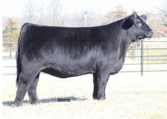
AUTO POEM - Dam Lot 49