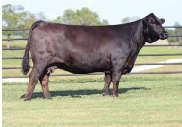
Granddam of Lot 40 - MAGS MANUELA