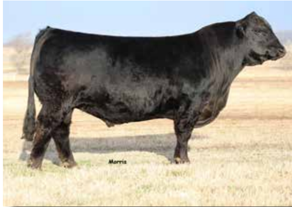
MAGS Zodiac - Ref Sire