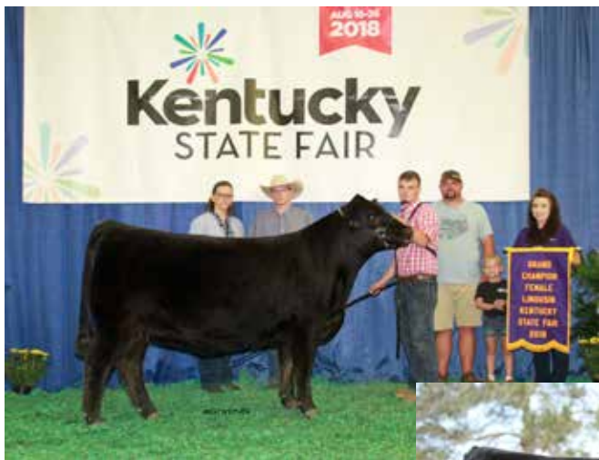
ELCX ELEVATE 684E ET -Open and ready to flush