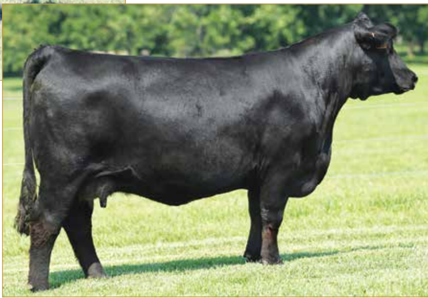
AUTO DONELLA 210D ET • Dam of Lot 33 embryos

White Valley Ranch is proud to offer some of their finest genetics. They are guaranteed heifers, 69% Lim-Flex, double polled and homozygous black. They are from AUTO Donella 210D, a powerful donor sired by EXAR Blue Chip and from a daughter of GPFF Blaque Rulon from the deceased MAGS Manuela 662M. The genetics found within this mating are some of the best in the business. These future calves will have AUTO Rebeca 292S and MAGS Manuela stacked in their pedigree and are some of the very best!