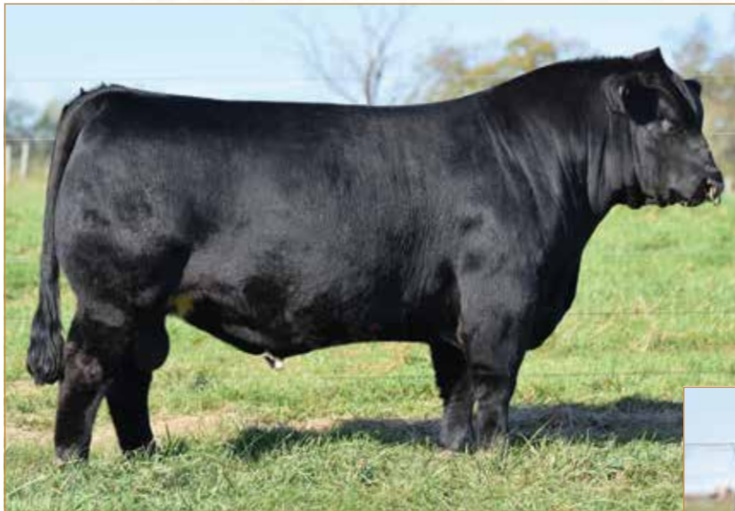
CJSL DAUNTLESS • Sire of Lot 32 embryos

MAGS APPLESEED MAGS ZEQUIN COLE WINDFALL 144W AUTO BLISS 265Y