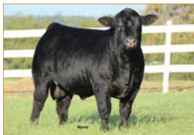
RLBH DAYS OF THUNDER • Full Brother to Lot 29