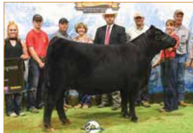
MAGS EADIE • Full sibling to Lot 39 embryos

MAGS YIP PBRs BUNK HOUSE 48B LBAF SHAWNEE 602