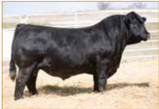
CJSL DATA BANK

68.5% LIM-FLEX • HOMO POLLED • DOUBLE BLACK