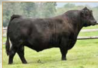
CJSL CREED 5042C Sire of Lot 52A embryos

Folks, here is a pick'em lot! Featured is your choice of embryos by one of the elite females in the Circle L program—CLLL YaSaySo 103Y! She is an extra stout featured, sound structured, high performance female that has earned a can't miss reputation. This direct daughter of the famed donor LH Radiant 323R ranks in the top 35% or better in 11 economically relevant EPDs. The two service sires are the proven and predictable CJSL Creed and the purebred, homozygous polled Wulfs Compliant AI sire. It's with great confidence we place these mating on offer for your appreciated appraisal.