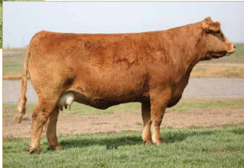
LIMOLYN XILDA • Dam of Lot 42 embryos

Outcross RED Lim-flex genetics on offer! Here is one of the rare opportunities to invest in service by the highly popular, off the market Red Angus AI sire, Bieber Hard Drive. The elite Canadian donor female, Limolyn Xilda is one of the proven foundation purebred donor females in the industry, boasting north of 20 registered progeny. The blending of this donor female and popular sire present an excellent genetic buying opportunity to help further the buyer's pursuit of RED outcross pedigreed, high performance, homozygous polled cattle.