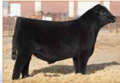
SILVEIRAS STYLE 9303 • Sire of Lot 37 embryos

GAMBLES HOT ROD SILVEIRAS STYLE 9303 SILVEIRAS ELBA 2520