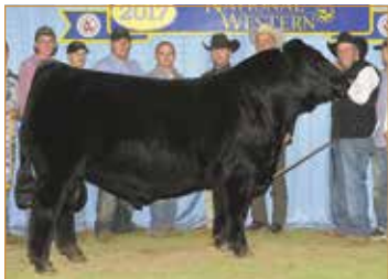
TASF CROWN ROYAL 960C ET