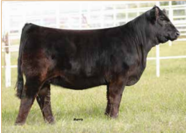
WVR FOREVER PRADA 308F

MAGS SASQUATCH MAGS PHANTOMS PRIZE LESF ASPHALT 9N EXLR REBECA 1019P