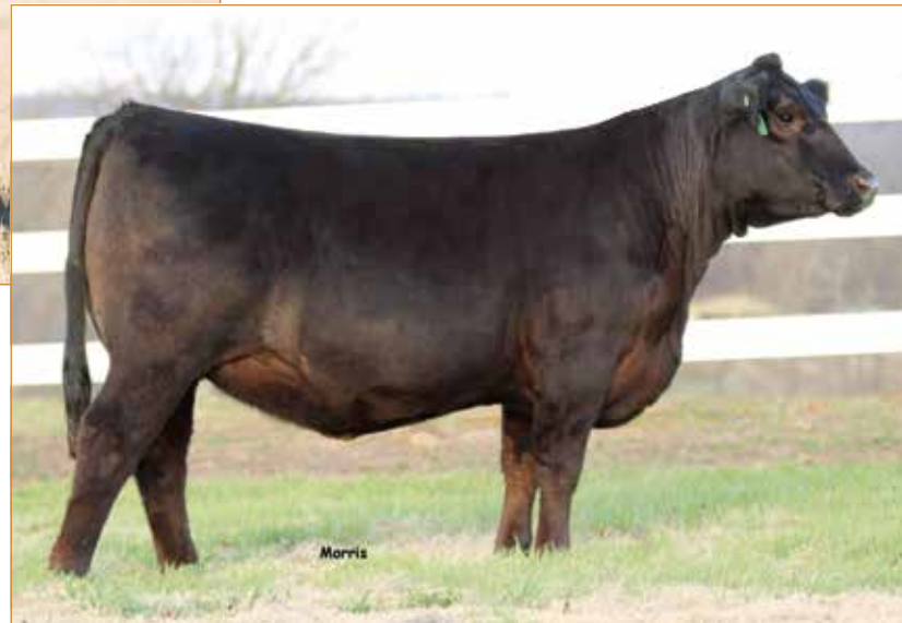
PBRS DEAL ME IN 6189D ET • Dam of Lot 49 embryos