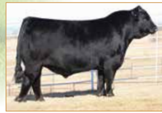
MAGS CABLE Sire of Lot 44A embryos

The combination of quality and variety is found in this intriguing genetic opportunity! These designer matings have strategically been made to compliment one of the breed's most proven and predictable Lim-Flex donors! COLE Miss Traveler 029X needs little introduction anchoring the Coleman Limousin ET program and being the dam to the widely popular COLE Absolute 05A AI sire that's a lead bull in the progressive Linhart Limousin herd. This double homozygous polled donor is huge footed, stout featured, big bodied and boasts a perfect udder configuration. The AI sires to choose from are some of the most popular and genetically fresh the breed has to offer. You be the judge and invest with confidence.