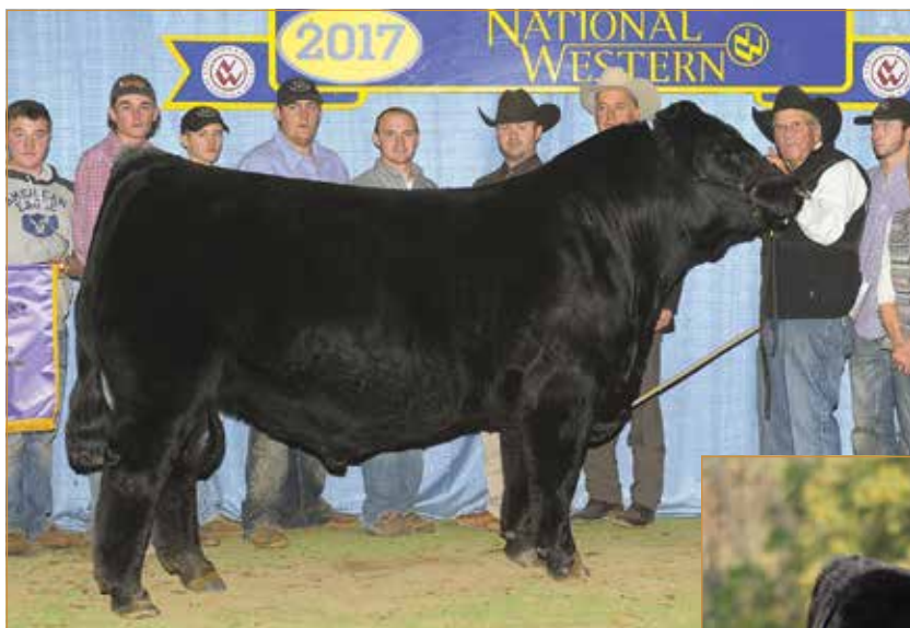
TASF CROWN ROYAL 960C ET • Sire of Lot 46 embryos

DAMERON FIRST CLASS SILVEIRAS SARAS DREAM 1339 AUTO BLACK DAKOTA 129J ELMW GINNIE P58G