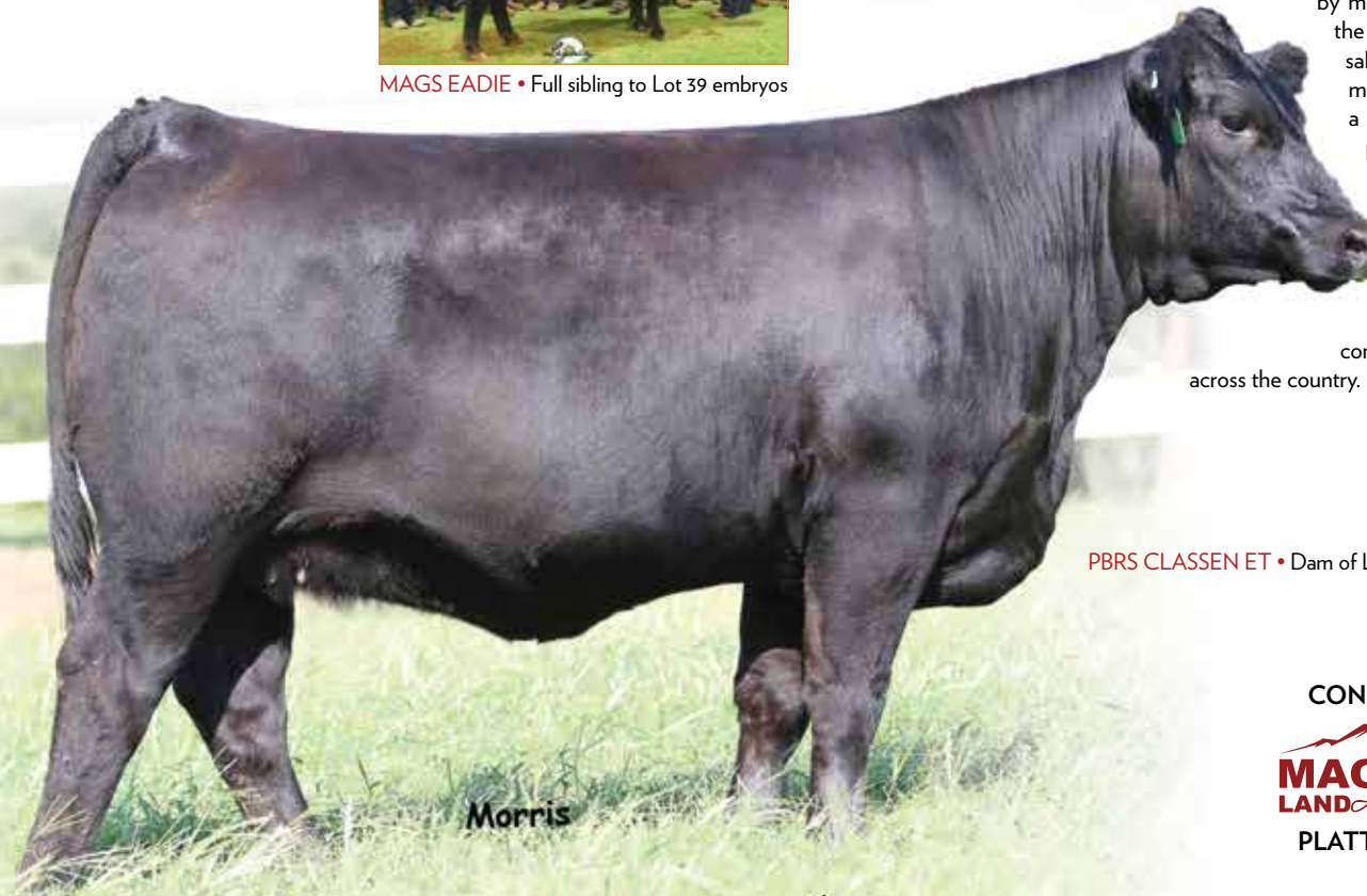
PBRs CLASSEN ET • Dam of Lot 39 embryos

Folks, here is a true sale highlight to invest in proven championship genetics! These embryos are full siblings to the 2018 National Junior Heifer Show Champion Lim-Flex female, MAGS Eadie, shown by Shelby Hubbard. The donor dam, PBRs Classen, is a sound structured, bold ribbed, attractive patterned female that was admired by many as she was one of the top sellers in the 2016 P Bar S Ranch annual production sale. The deceased AI sire in this designer mating, P Bar S Bunk House 48B, is creating a buzz around the country for creating progeny known for their natural growth performance, structural correctness and body depth. The bottom-line is, this elite mating promises to produce homozygous polled, good numbered, phenotypically exceptional calves that project to compete at the highest level in showing's across the country. Invest today.