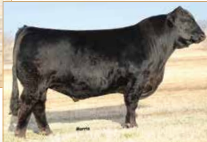
MAGS ZODIAC • Maternal sibling to Lot 43