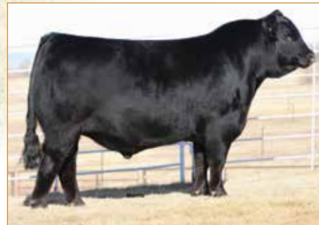
MAGS CABLE • Sire of Lot 16 embryos

This unique consignment epitomizes the crossroads of where phenotypic quality, huge numbers and genetic diversity meet. This amazing donor plus 5 designer embryos to be sold as one package offers you the opportunity to invest in a top-of-the-line donor and some of the breed's freshest and best genetics. The sire featured in the embryo portion of this lot is none other than the sound footed, heavy muscled, stout featured and widely popular AI sire, MAGS Cable who makes his residency in both the Graven and Magness programs respectively! The donor female is MAGS Zaneeta who has been admired by many for her flawless structural make up, body depth, huge marbling EPD and the fact she is a direct daughter of the prolific donor MAGS Puddles. We feel this package speaks for itself and represents the progressive direction of the Graven program. Bid with confidence.