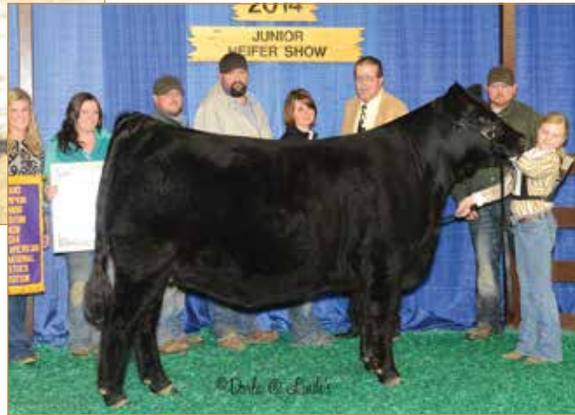
DHIL AMETT 3024A Daughter of Dam of Lot 21