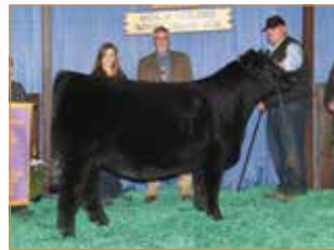
SHSK ELVERA 710E Full Sister to Lot 6A 2018 NAILE Open Show Reserve Champion Female