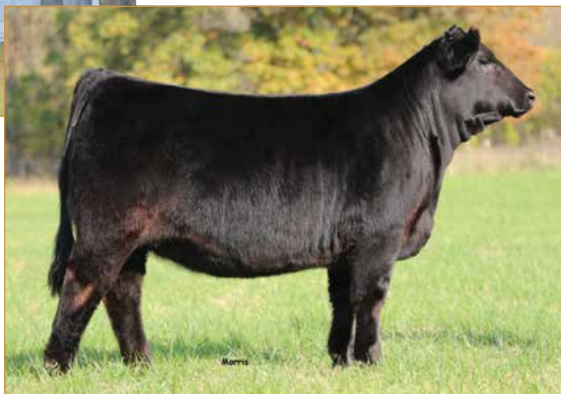
SEEE ETERNITY ET • Dam of Lot 46 embryos

Genetics of this caliber and quality are rarely offered to the buying public but, the 2018 A Night On The Town Sale in Las Vegas, Nevada, is your opportunity to invest in some of our breed's finest and this lot is no exception. Study the unique combination of the many times champion AI sire TASF Crown Royal and the youthful donor, SEEE Eternity, who goes back to the legendary Carousel's Pina Colada cow family that has produced scores of sale topping progeny. The donor dam was campaigned extensively with a high degree of success because of her high quality structural design and rare combination of perfectly portioned rib and muscle relative to frame size. No doubt, the ensuing offspring of this genetic lot will impress.