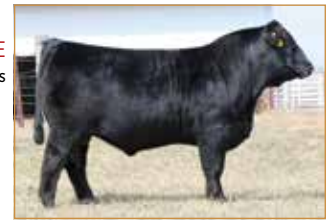
CELL ENVISION 7023E Sire of Lot 44B embryos