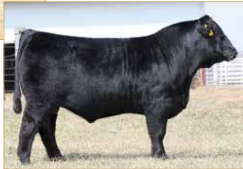
CELL ENVISION 4023E Sire of Lot 53B embryos