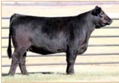
AUTO AJAY 206A • Dam of Lot 22

LIM-FLEX(54/49.2) • COW • HOMO POLLED (T) • HOMO BLACK (T) • 4/1/2016 • AUTO 265D • LFF2108356