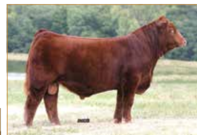
MAGSWL USUAL SUSPECT 538U Maternal Brother of Lot 3