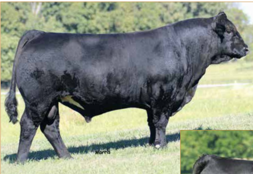
AUTO CRUZE 132X • Sire of Lot 33 embryos

DAMERON FIRST CLASS GREENS PRINCESS 1012 GPFF BLAQUE RULON MAGS MANUELA