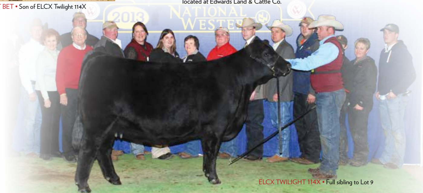
ELCX TWILIGHT 114X • Full sibling to Lot 9

The buyer gets his pick of the 7 full siblings to ELCX Twilight 114X. They are sired by the national champion DHVO Deuce 132R and from DFLC HBHPC 1S. The 1S donor is a daughter the multiple trait leading sire, JCL Lodestar 27L. Buyer pays 50% of the purchase price at sale time and the remaining 50% is due at the selection of their favorite calf at weaning. The calves are located at Edwards Land & Cattle Co.