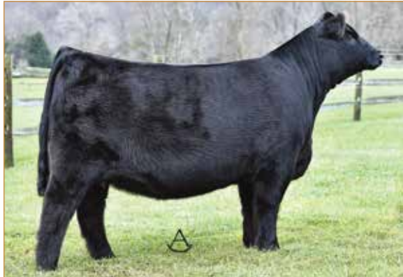
TMCK EARTH ANGEL • Maternal Sibling to Lot 40