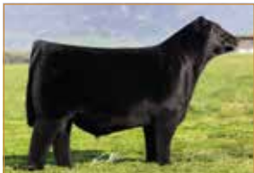
COLBURN PRIMO 5153 Sire of Lot 54B embryos