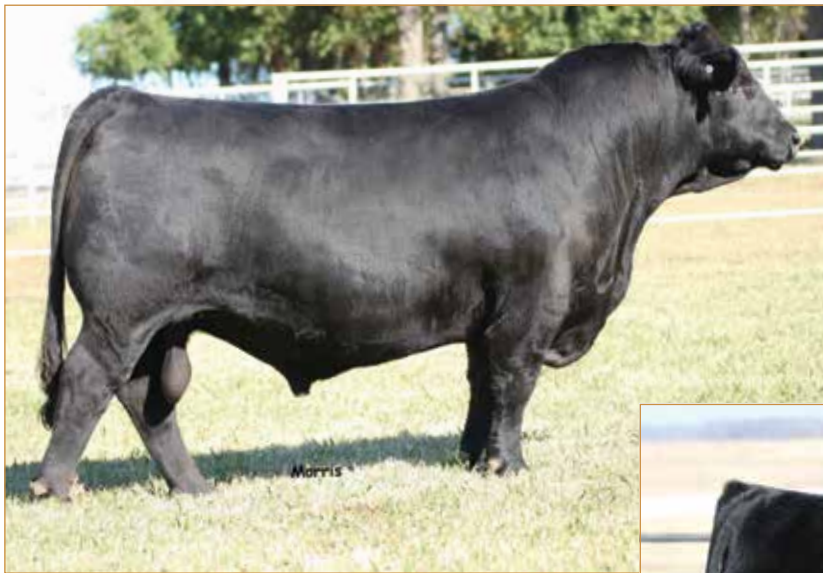
PBRS BUNK HOUSE 48B • Sire of Lot 45 embryos