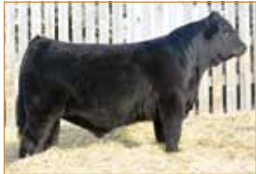
RIVERSTONE CROWN ROYAL Sire of Lot 54A embryos

LAL Marilyn Monroe 42W is the leading donor for Riverstone Cattle Co. and Boss Lake Genetics. She is one of their finest purebred Limousin donors! Her son, Cottage Lake Border Agent, was a top purchase by Marjon Farms in Indiana and Wies Limousin in Missouri. His first calf crop is in production with much anticipation. He is now deceased, but his progeny and influence is as strong as any purebred bull in the business. This donor, LAL Marilyn Monroe 42W, is a very well made female that is solid from the ground up. She has the prominent look, femininity and desirable conformation needed to produce greatness, which she has. Offering genetics from this female is a very special lot for this sale of the year in our breed.