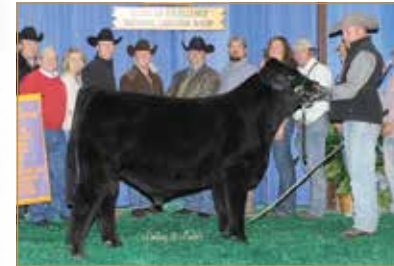
ELCX KINGS LANDING • 2016 NAILE