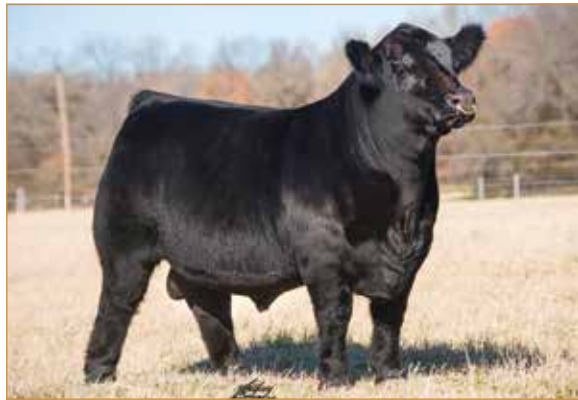
SSTO BEST BET • Son of ELCX Twilight 114X

HUNTS HI-LITER 245G LOGAN'S CHEERLEADER 280G DFLC DOUBLE SHOT BPB 41E DALTONS EDITH ERICA 250