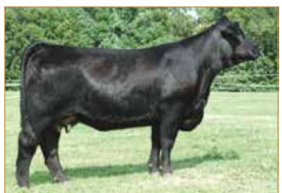
MAGS PHANTOMS PRIZE • Dam of Lot 3

PERCENTAGE(79/72.3) • BULL • HOMO POLLED (T) • HET BLACK (T) • 5/7/2018 • BJLR 565F • NXM2152770 • BW: 76 LBS. • ADJ WW: 821 LBS.