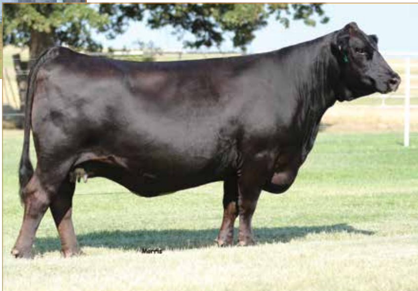
PBRS ALIX 387A • Dam of Lot 35 embryos

What a super mating we have here! These future calves are sired by the once national champion Limousin bull, TASF Crown Royal 960C. He is a double homozygous son of DHVO Deuce from the many times show champion female, TASF Whiskey Lullaby 357W. His first calves are dominating the winner's circle this year and has made many people stand up and take notice. His daughters have won the Tulsa State Fair, National Junior Heifer Show and the American Royal. We think his added thickness, overall power and substance of bone mated with the PBRS Alix 387A donor will be a big hit. She is a massive structured female that is extremely heavy in her bone structure and foot size. We admire her extra rib shape and depth of capacity. These future heifer calves are really going to be something special for the new owner.