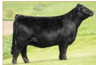
WLR PRADA Dam of Lot 6A and 6B