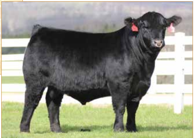
AHCC HEMI Full Sibling to Lot 15B