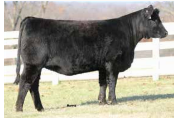
J BAR J DEWDROP Dam of Lot 53A and 53B embryos

The choice of these elite embryos are by two of the breed's hottest sires, the new PUREBRED AI sire CELL Envision 7023E and the highly popular MAGS Cable AI sire that needs little introduction! If you're looking for a genetic opportunity that promises to produce double homozygous, functionally sound bulls and tremendous cow prospects then here's the mating for you! The donor female, J Bar J Dewdrop, is simply one of the most phenotypically complete donor cows to walk the pastures of Circle L Limousin. She's moderate made, big bodied, boasts a perfectly constructed udder and as a bonus, packs a punch numerically by ranking among the breed's very best EPD-wise. Don't overlook this buying opportunity.