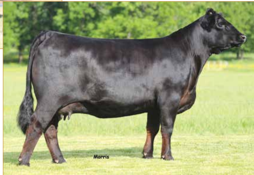
AUTO MABELLINE 267Z • Dam of Lot 47 embryos