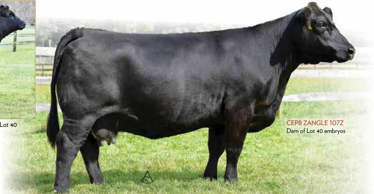
CEPB ZANGLE 107Z Dam of Lot 40 embryos