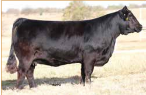
SBLX XTRA SPECIAL Dam of Lot 14

GPFF BLAQUE RULON AMY JO DHAN 20L EXLR LIMITED EDITION 765J AUTO CITY NIGHTS 214H