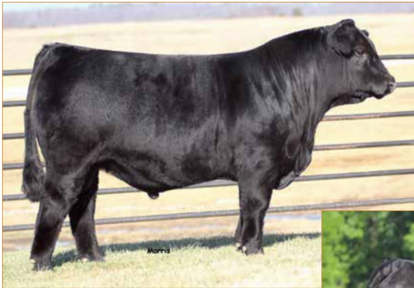
AUTO KING JAMES 162Z • Sire of Lot 47 embryos

Folks, here is a true sale highlight and a chance to invest in championship genetics! The donor dam, the former National Western Stock Show Grand Champion Female, AUTO Mabelleline 267Z, is sound structured, bold ribbed, muscular and attractive patterned and is one that produces at the highest level. The sire in this designer mating, AUTO King James, a product of the famed Pinegar Limousin program, is a direct descendant of the Luckie cow family and one that's known for producing attractive made, sound structured progeny. This elite mating promises to produce good numbered, phenotypically exceptional calves that project to compete at the highly level in showings across the country. Invest today!