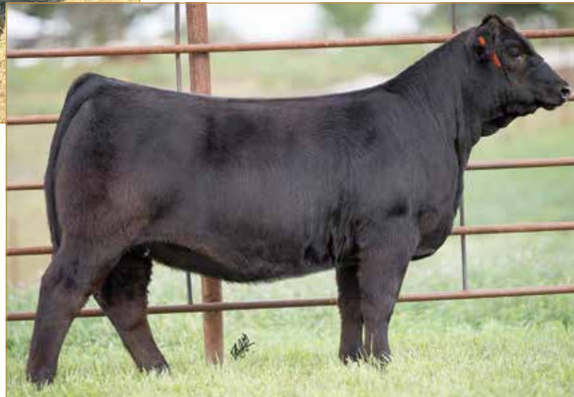
CELL EXPRESS LANE 7049E • Maternal sibling to Lot 48 embryos