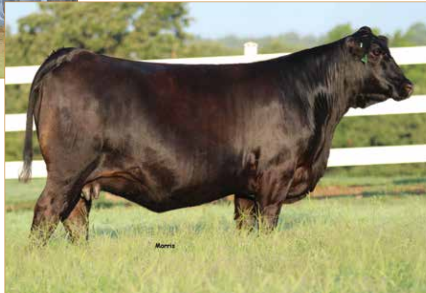
PBR5 6199D ET • Dam of Lot 36 embryos

TASF Crown Royal's first calves have dominated the winner's circle this year and have made many people stand up and take notice. His daughters have won the Tulsa State Fair, National Junior Heifer show and the American Royal shows. We think his added thickness, overall power and substance of bone mated with the extremely deep bodied female, PBR5 6199D, will result in something special. She is a 43% Lim-Flex daughter of MAGS Ali and from the elite P Bar S donor, MAGS Universal Time. She ranks in the top 1% of the breed for GEST, SC and $MTI, top 2% for CW and MB and top 10% for WW and YW.