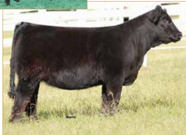
WVR FLYING WITH CLASS 310F