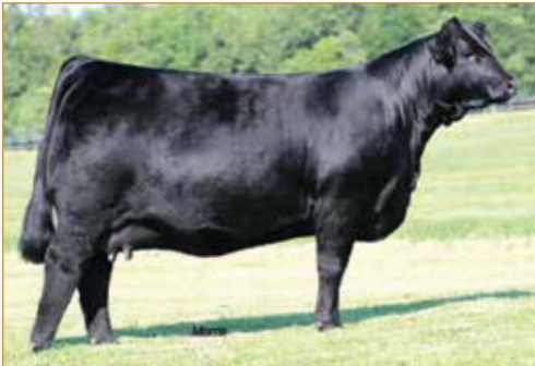
AUTO LUCKIE TOO 423Y Dam of Lot 11

KRVN NASKAR 013N MAGS NIGHT AMBUSH LESF ASPHALT 9N TYEJ DB SIZZLE