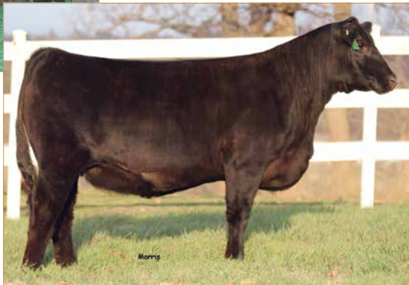
PBRS DIVA IN BLACK 6201D ET • Dam of Lot 51 embryos

Here is a set of embryos from the heart of the KLS Farms program. They are sired by the 2018 NAILE Grand Champion bull, ELCX Kings Landing. He is the son of the deceased MAGS Xyloid and from WLR Prada. His first calves are just weaned and boy are they some kind of good. He is massive in terms of bone and foot size and has that powerful show look to him. These embryos are from one of the top KLS Farms donors, PBRS Diva In Black 6201D. She is a double homozygous daughter of MAGS Ali and from the elite donor, MAGS Universal Time. This mating is one we feel certain will create positive results for the buyer.