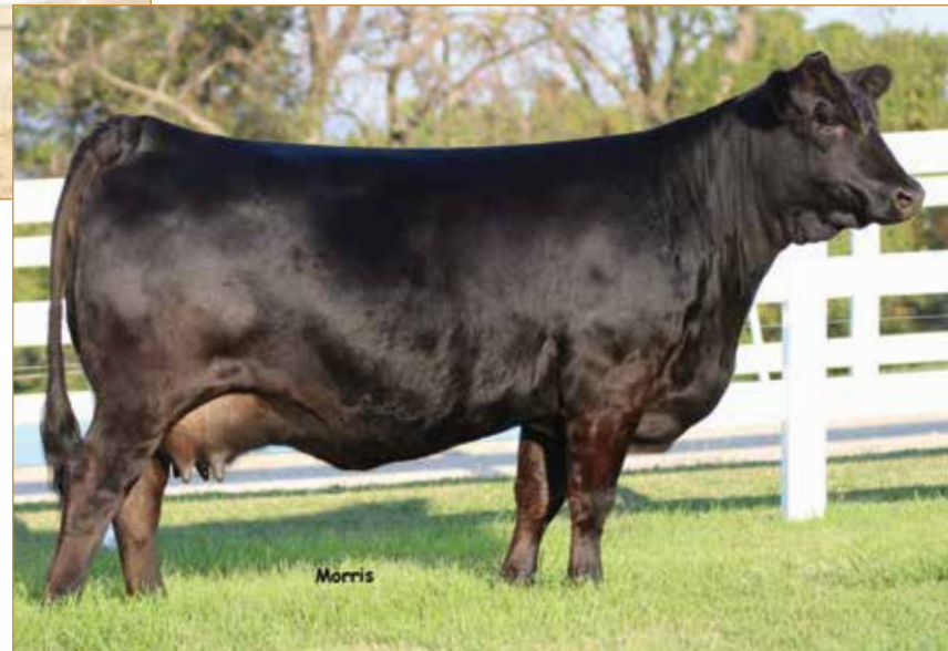
SBLX ZERO OUT • Dam of Lot 34 embryos