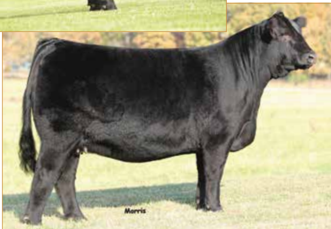
AUTO USUALLY YOURS Full Sib to Lot 5