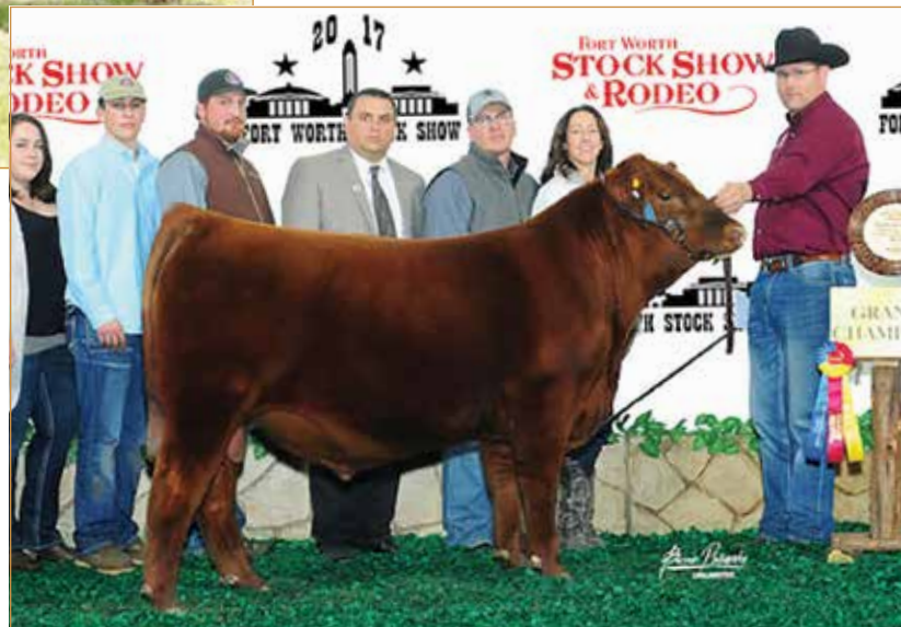
J6 MR. QUICK DRAW D328 • Son of Lot 23