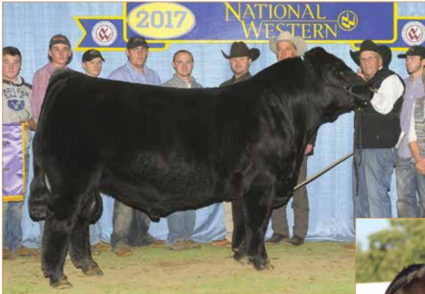
TASF CROWN ROYAL 960C ET • Sire of Lot 36 embryos

CONNELLY CONSENSUS 7229 MAGS YOKO G A R PREDESTINED MAGS RIO RITA