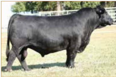
PBRs BUNK HOUSE 48B • Sire of Lot 39 embryos

MAGS YIP PBRs BUNK HOUSE 48B LBAF SHAWNEE 602