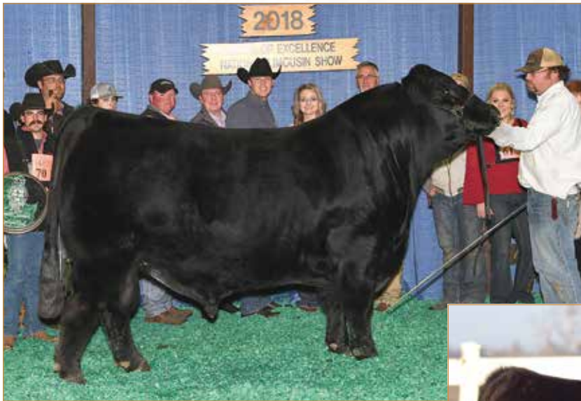
ELCX KINGS LANDING 599 D ET • Sire of Lot 51 embryos

CONNELY CONSENSUS 7229 MAGS YOKO G A R PREDESTINED MAGS RIO RITA