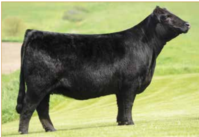
WLR PRADA Full Sib to Lot 5

GPFF BLAQUE RULON GPFF EXTRA SWEET ELITE BR MIDLAND EXLR REBECA 614H