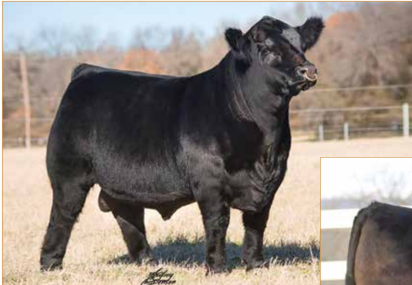
SSTO BEST BED 456B ET • Sire of Lot 49 embryos