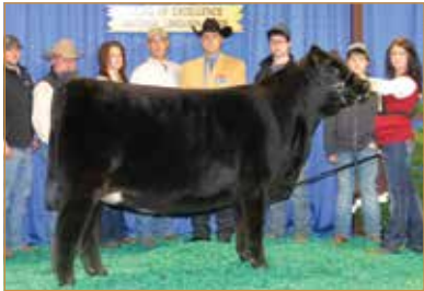
LLJB ABSOLUTE STYLE • Full sibling to Lot 37,

50% LIM-FLEX • HOMO POLLED • DOUBLE BLACK