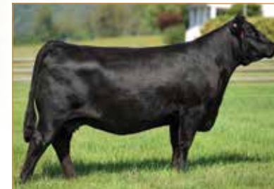
TMCK APPLAUSE 301A Dam of Lots 12A & 12B

Sale highlights are words fitting of this consignment of maternal siblings that are exceptionally well designed, homozygous polled, huge numbered females that come from the heart of the Tubmill Creek Farms' breeding program. Phenotypically, these own daughters of the highly prolific TMCK Applause 301A donor possess a combination of structural integrity, body depth and fleshing ability even the most discriminating cattlemen would appreciate. Numerically, they're in a league of their own—note they both rank in the top 15% of the breed or better for weaning weight, yearling weight and mainstream terminal index. On sale day assess the true value in this impressive pair of open heifers by the widely popular TMCK Cash Flow and MAGS Cable AI sires.