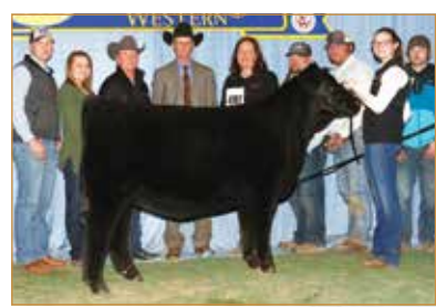
WLR EDEN • Maternal Sister to Lot 3

MAGS WINSTON MAGS AVIATOR MAGS XTRA REST