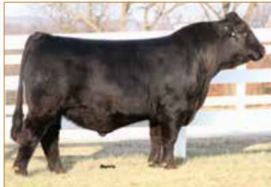
PBRs MAVERICK 6114D • Full Brother to Lot 22

MAGS WINSTON MAGS AVIATOR MAGS XTRA REST