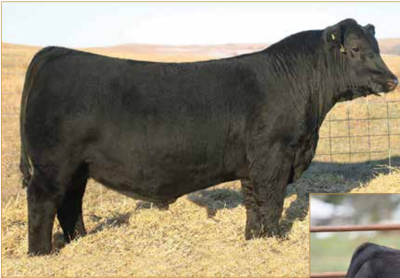
S A V ELATION 7899 • Sire of Lot 48 embryos

On offer is an opportunity to invest in some truly top shelf genetics! On the maternal side, PBRS Zink, a big-time donor valued at $30,000 at work in both the Linhart and Lake Side programs. She has earned a great reputation for producing sound made, performance driven progeny. On the paternal side, we have the first exposure to the Limousin breed—the world record $800,000 Angus AI sire, S A V Elation, which is one of the hottest Angus bulls in the business today. The bottom-line is, if you're seeking unique pedigreed, homozygous black cattle that promise to have a combination of stoutness and structural integrity, invest in these eggs sale day.