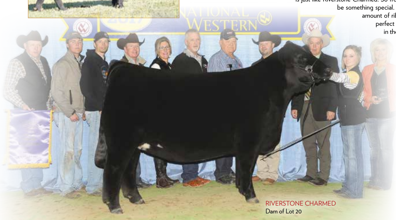
RIVERSTONE CHARMED Dam of Lot 20