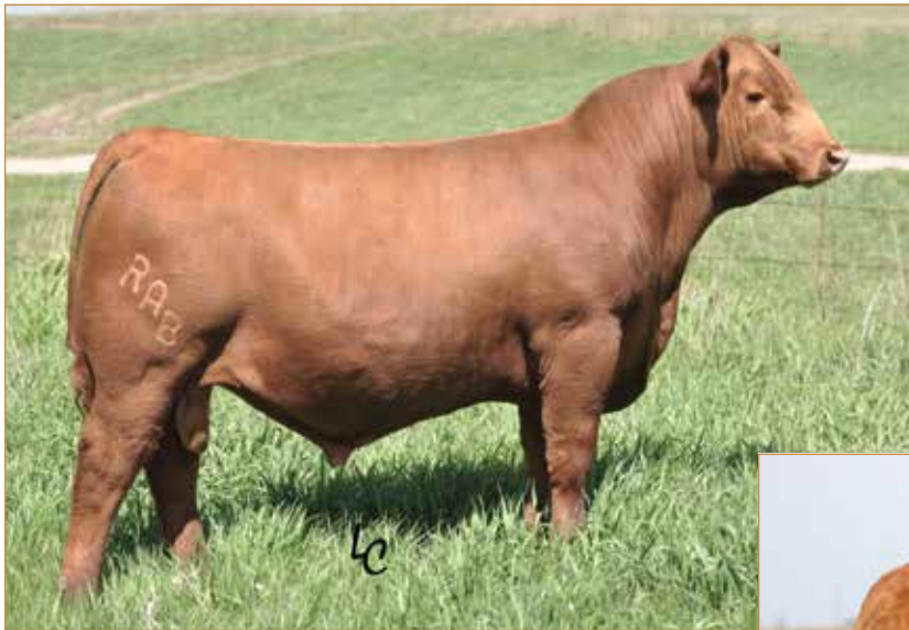
BIEBER HARD DRIVE Y120 • Sire of Lot 42 embryos

ROMN MADE TO ORDER ANCHOR B NIGHT CLUB EXLR 392J