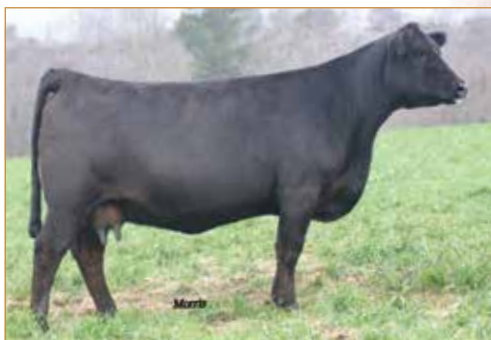
DFLC HBHPC 1S • Dam of Lot 50