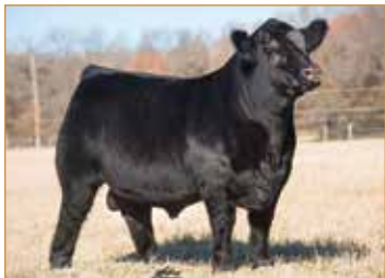
SSTO BEST BET 456B ET