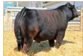
WULFS COMPLIANT K687C ET Sire of Lot 52B embryos