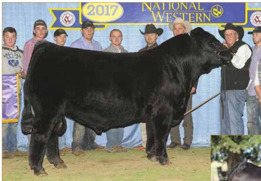
TASF CROWN ROYAL 960C ET • Sire of Lot 35 embryos

MAGS THE GENERAL AUTO CARMINDA 656S TWIN VALLEY PRECISIONE161 SUNSET SHAWNEE 3905