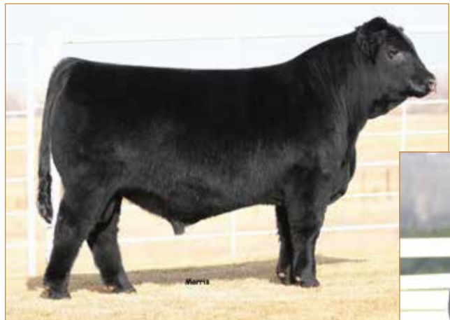
AHCC EARNING POWER Full Sibling to Lot 15A

LVLS FARMER JACK 5842M LVLS 7428L COLE WULF HUNT LVLS 9066N