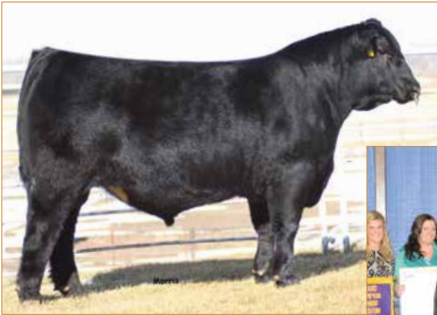
MAGS ALI Sire of Lot 21

BR MIDLAND EXG BLACKCAP R054 R3 AUTO BLACK DAKOTA 129J EXLR LUVLY 4100J