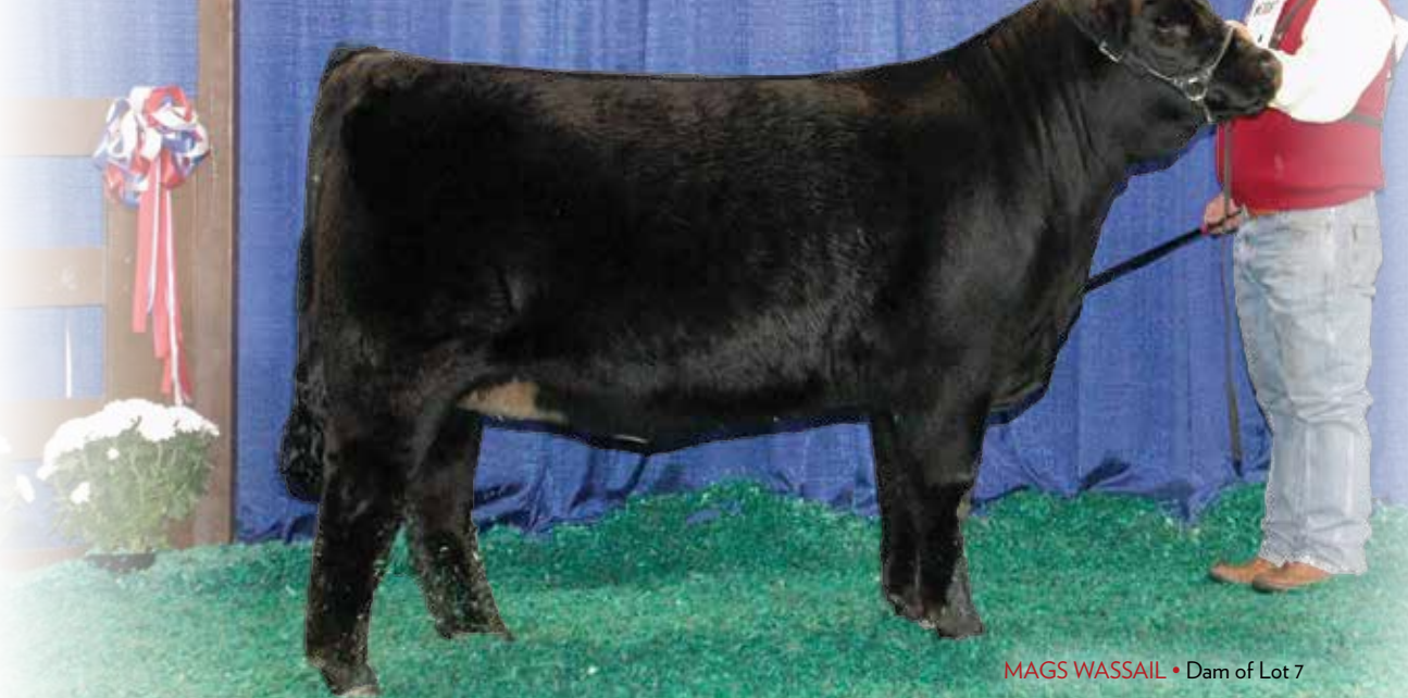
MAGS WASSAIL • Dam of Lot 7

Folks, here's your chance to be the judge! Study this rare opportunity brought to us by the progressive Linhart Limousin program to take your pick of the exceptional offspring from this big time mating. The designer flush at hand boasts some of the breed's most proven and desirable genetics that have excelled both in production and in the show ring at national levels. The syndicated AI sire featured in this mating, Musgrave Headway, is known for his fleshing ability, high growth performance, carcass merit and numerical superiority. The prolific donor dam is the many times champion, MAGS Wassail. Over the years she has produced more than 30 calves on file and is known for eye-appealing progeny that excel in terms of structural integrity. December 8 don't miss your chance to take your pick and invest in top flight genetics from a reputation program.