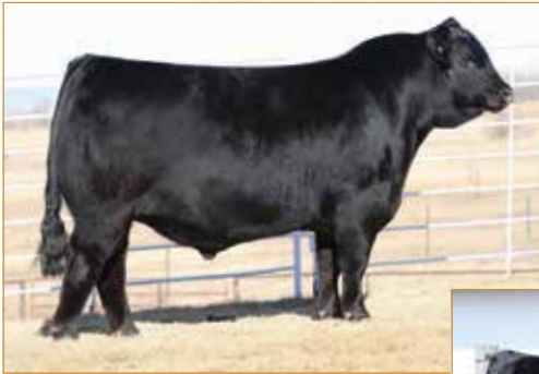
MAGS CABLE Sire of Lot 53A embryos

JCL LODESTAR 27L VERMILION E BLACKBIRD9546 COLEMAN PRODUCTION 608 COLE 64M