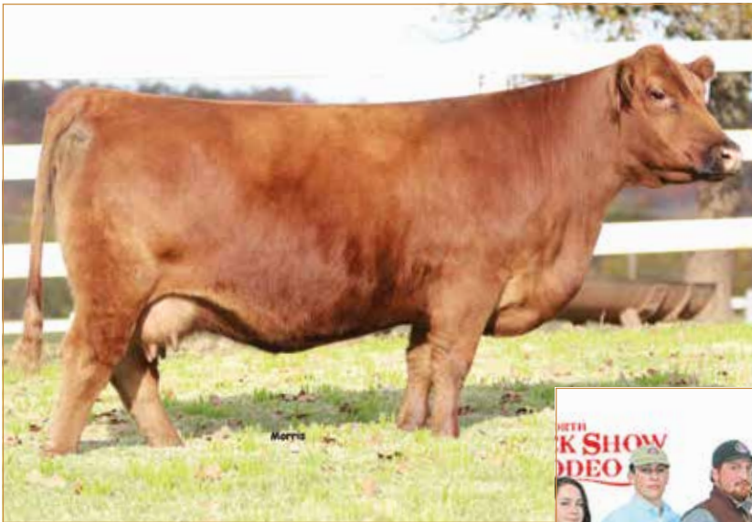
J6 TEMPTTEST B300 • Daughter of Lot 23

to create purebred Red Angus or use a Limousin, Lim-Flex or Simmental bull to created what we feel will be progeny that will highlight any program.