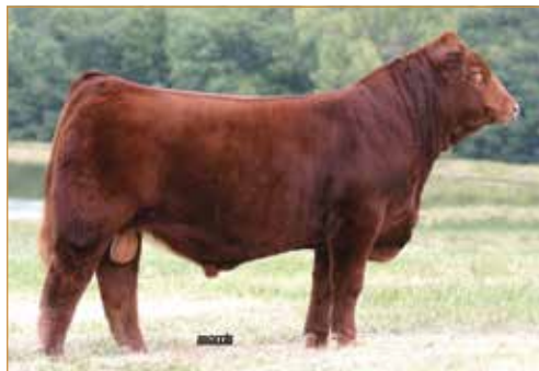
MAGSWL USUAL SUSPECT 538U Sire of Lot 50

HUNTS HI-LITER 245G LOGAN'S CHEERLEADER 280G DFLC DOUBLE SHOT BPB 41E DALTONS EDITH ERICA 250