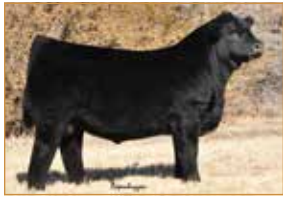
COTTAGE LAKE BORDER AGENT Son of Lot 54