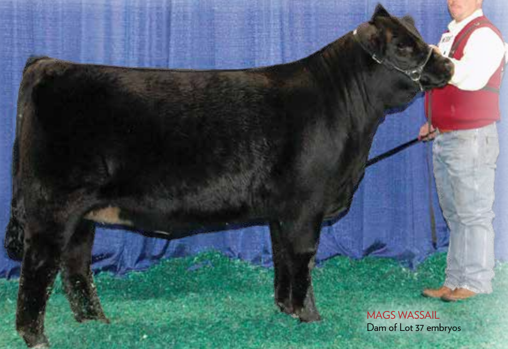
MAGS WASSAIL Dam of Lot 37 embryos

RARE OPPORTUNITY ABOUND. The resulting embryos will be full siblings to one of the great show females of our generation, LLJB Absolute Style 3056A, who recently produced more than $160,000 in revenue in just 6 progeny at the 2018 Linhart Limousin sale! This represents one of the very few chance to invest in genetics out of the famed MAGS Wassail donor who carries the moniker of a many time national champion female. The bottom-line is, this elite mating promises to produce homozygous polled, phenotypically exceptional calves that project the ability to compete at the highest level.