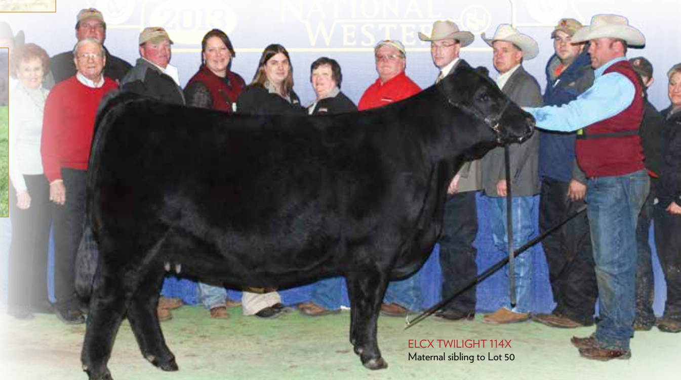
ELCX TWILIGHT 114X Maternal sibling to Lot 50

Here is your chance to own maternal siblings to ELCX Twilight 114X, the 2013 Denver National Western Grand Champion purebred Limousin female. The genetics found within these embryos are absolutely superb. They are from the dam of ELCX Twilight and sired by MAGSWL Usual Suspect. He is the Triple Crown winning bull and now breed leader for show cattle. His calves are as popular now as they have ever been. He has a huge foot, heaviness of bone and superb style and balance. When he is mated to easy doing, broody females the results are absolutely unreal. This is a prime example of how good things can be when done correctly.