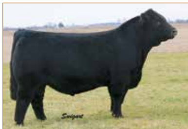
RLBH AIR FORCE ONE • Full Brother to Lot 29