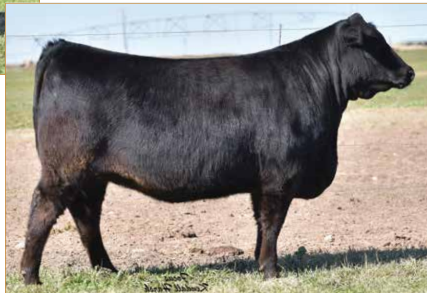
LFL EYE OPENER 7301E • Dam of Lot 32 embryos

The opportunity exists in this very lot to get a great one! The donor dam is an elite double homozygous female that combines rib and muscle to the highest degree. If you appreciate cattle that are bold in their rib shape, are loaded with center body mass and are expressive in their muscle pattern than this high performance female is one you'd like. From a pedigree standpoint, this own daughter of the in vogue MAGS Cable sire and out of a dam that traces back to the prolific donor, AUTO Bliss 265Y. Furthermore, this outstanding female impresses on paper ranking in the top 30% or better for these 10 economically relevant traits—CE, WW, YW, MK, TM, SC, CM, CW, MS and $MTI. On the paternal side of this equation enters CJSL Dauntless, a direct son of the famed national show champion turned, elite donor LLJB Absolute Style! There's little doubt this blending of genetics promises results that are sure to impress.