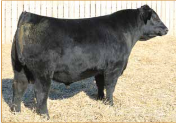
MUSGRAVE HEADWAY Sire of Lot 7

GPFF BLAQUE RULON AMY JO DHAN 20L EXLR DAKOTA 353G MAGS JEWEL