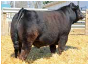
WULFS COMPLIANT K687C ET