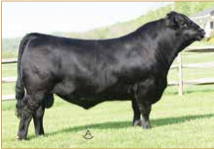
MAGS ALI TMCK CASH FLOW 247C TMCK NINA 17X

37% LIM-FLEX • HOMO POLLED • DOUBLE BLACK