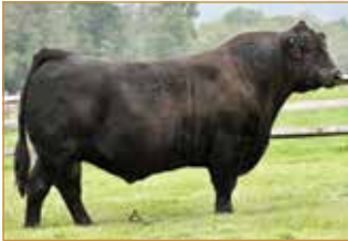
CJS� CREED 5042C Sire of Lot 38A embryos

51.5% LIM-FLEX • DOUBLE POLLED • HOMO BLACK