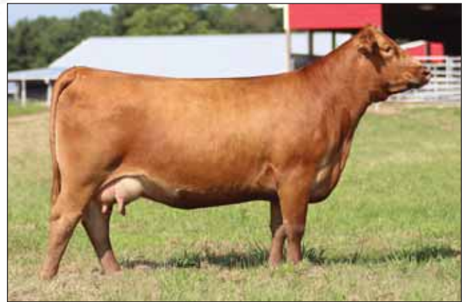
SBLX Zane, dam of Lot 9.