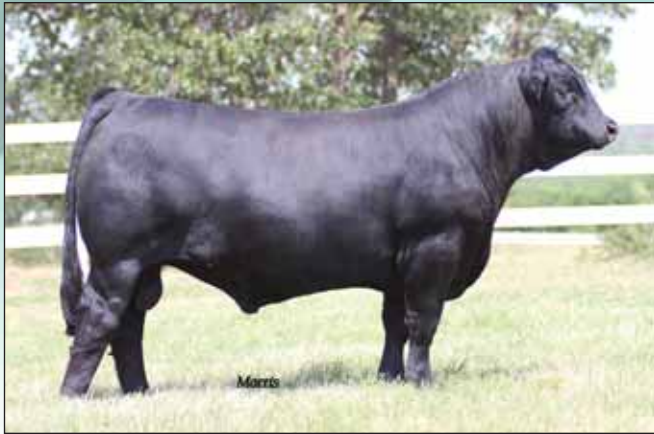
MAGS Zamindar, sire of Lot 11.