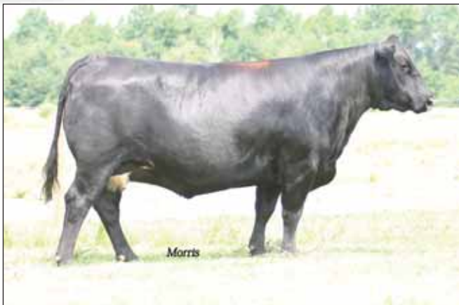
MAGS Satchel, dam of Lot 18.