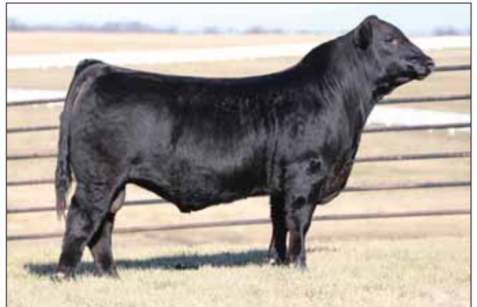
AUTO Transmission, a full sb to Lot 27 embryos.

Consigned by Riverside Valley Farm, Hohenwald, TN