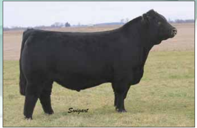
RLB Air Force One, sire of Lot 9.

Consigned by Owen Cattle Company, Hornbeak, TN