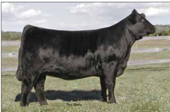
MAGS Wallpaper, dam of Lot 30.