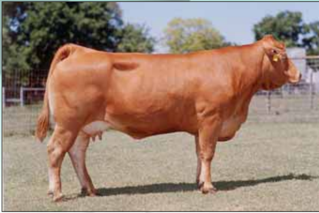
Laura's Accent 857C, dam of Lot 28 embryos.