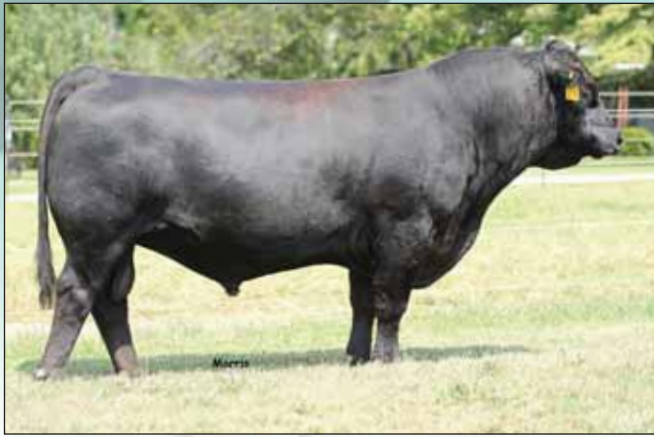
BDHC Ironman 2006Z, sire of Lot 17A.