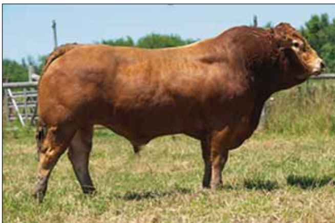
Posthaven Polled Yellowstone, sire of Lot 13.