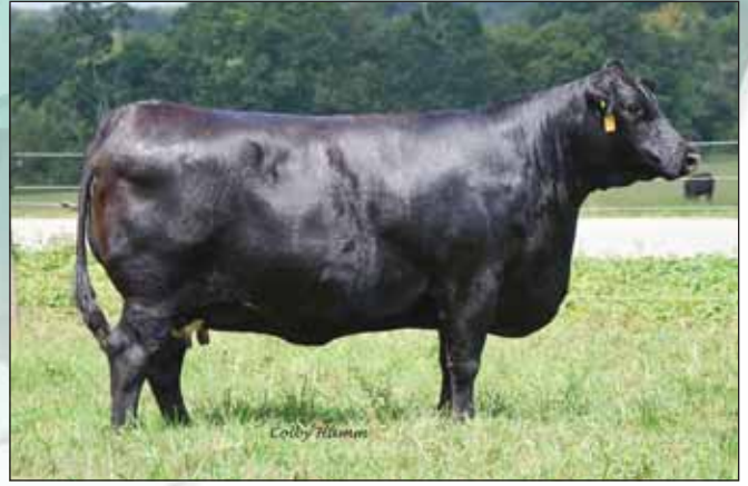
Win Vue Lady Deuce 073X, donor dam of Lot 25.

Consigned by Riverside Valley Farm, Hohenwald, TN