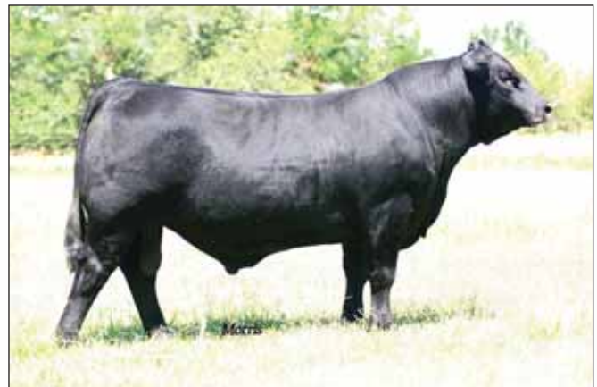
EBFL Ypsilanti 420Y, sire of Lot 16.