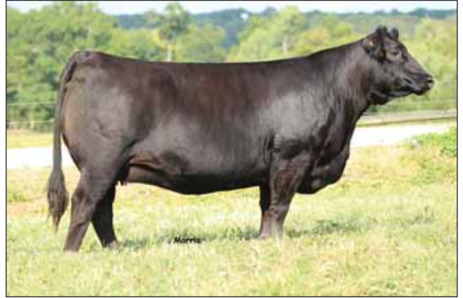
SBLX Maria 662Y, donor dam of Lot 26.

Consigned by Riverside Valley Farm, Hohenwald, TN