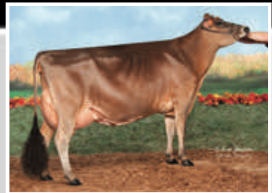
RATLIFF CHROME MINNIE-ET Selling as Lot 98

4TH DAM: TENN INDEX GHD MAID 80% 3-11 305 2 17550 5.8 1017 4.5 782 DHIR 2549C