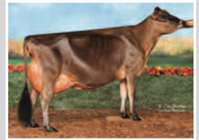
RANDOM LUCK SURPRISE ME Dam of Lot 30

8TH DAM: JO-BARS MOROCCO TRISTRAM JESTER 91% 10-01 299 2 13400 5.0 665 DHIR