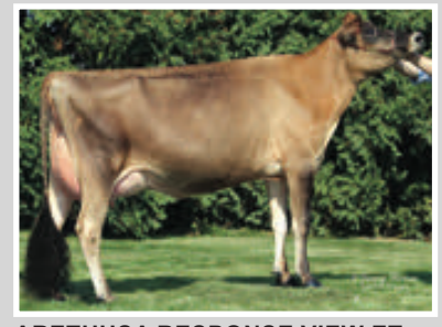
ARETHUSA RESPONSE VIEW-ET Grandam of Lot 96