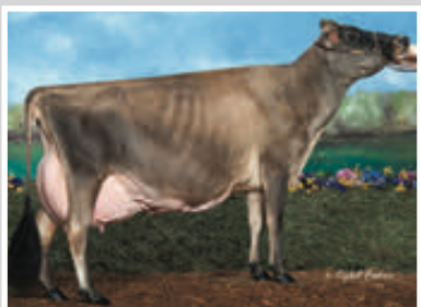
HURONIA CENTURION VERONICA 20J Fifth Dam of 1A and 1B