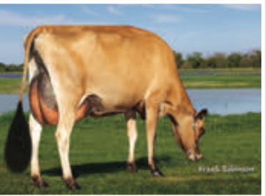
RATLIFF COLTON DIZA-ET Full Sister to the Dam of Lot 89