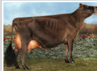
ARETHUSA PRIMETIME DEJA VU-ET Great-Grandam of Lot 63