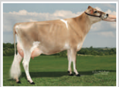
WF SIGNATURE BREE Great-Grandam of Lot 32