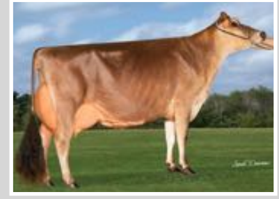
RATLIFF IRWIN VANCY-ET Sister to Lot 96