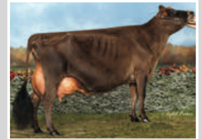
ARETHUSA PRIMETIME DEJA VU-ET Great-Grandam of Lot 28