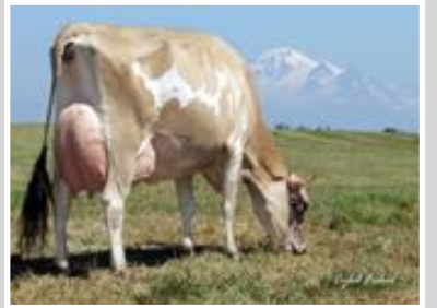
PLEASANT NOOK F PRIZE CIRCUS Fourth Dam of Lot 38