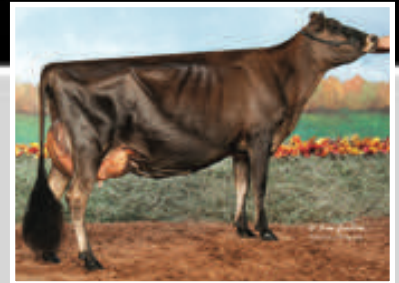
RIVER VALLEY EXCITATION FLAWLESS-ET

4TH DAM: AMLAIRD COUNCILLER EMMY 95% 6-10 305 2 18510 3.8 712 3.5 643 82DCR 2031C 3RD AGED COW, 2011 ALL AMERICAN JERSEY SHOW NOMINATED ALLBREEDS ACCESS AGED COW, 2010