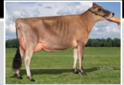
GMBV JOEL DAKOTA-ET Sister to the Dam of Lot 28

NEXT SIX DAMS ARE EITHER VERY GOOD OR EXCELLENT.