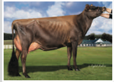
MI-SAN 2 VERBATIM EFFORTLESS Great-Grandam of Lot 16