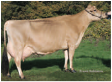
SUNSET CANYON LEMVIG MAID 4-ET Great-Grandam of Lot 21