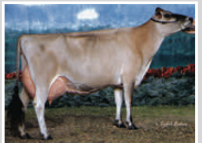
ROZVIEW DORIE D RACHEL Fourth Dam of Lot 92