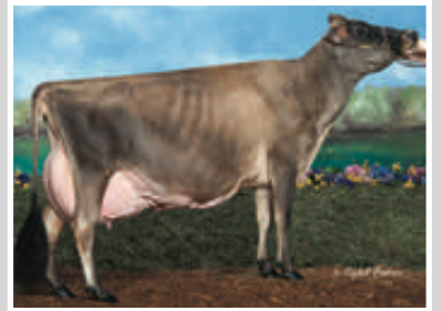
HURONIA CENTURION VERONICA 20J Great-Grandam of Lot 80