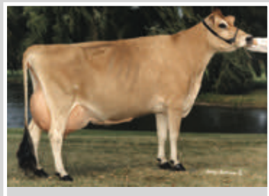
KENNEDYS DEACON PENNY Sixth Dam of Lot 31

5TH DAM: RATLIFF HERMITAGE PENELOPE 91% 3-05 305 2 15410 4.9 749 3.7 575 DHIA 1870C