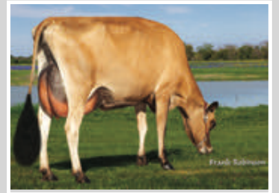
RATLIFF COLTON DIZA-ET Grandam of Lot 28