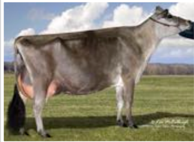
RENN KANDIE OF RATLIFF Grandam of Lot 91