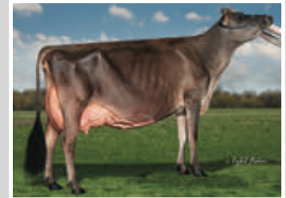
ARETHUSA PREMIER VENTOSA-ET Sister to the Grandam of Lot 36