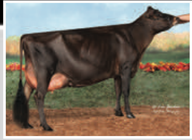
PACIFIC EDGE PREMIER DIVA-ET Full Sister to the Dam of Lot B

NEXT FIVE DAMS ARE VERY GOOD OR EXCELLENT IN CANADA