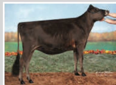
SCHULTE BROS COLTON FAME-ET Full Sister to Lot 17

BORN 09/25/2022 TATTOO S858/S858 PO FEMALE EFI 5.6%