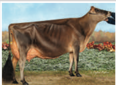
ELLIOTTS BLACKSTONE CHARLOTTE-ET Sister to the Dam of Lot 19

BORN 09/11/2022 PO BBR 100 FEMALE EFI 5.8% AMERICAN ID 27636/27636 JH1F JNSF