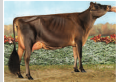
PAULLYN VANCE RAINELLE Dam of Lot 46

6TH DAM: COOL CREEK MAGNUM DAISY SUP-EX 90-2E (CAN)