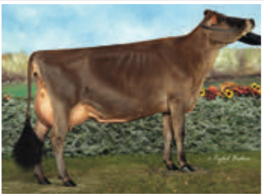
RATLIFF SAMBO DEMI-ET Sister to the Dam of Lot 89