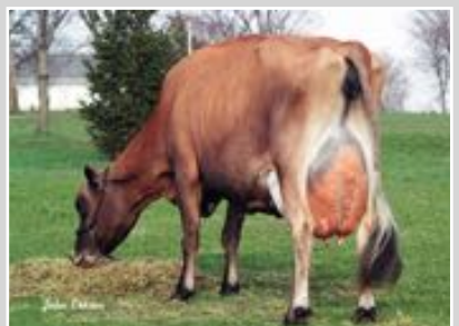
RESPONSES GIGI Fifth Dam of Lot 84