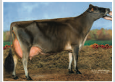
RATLIFF PRICE ALICIA Grandam of Lot 92