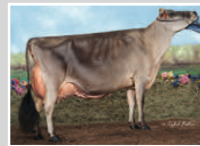
EXTREME ELECTRA Fifth Dam of Lot 10