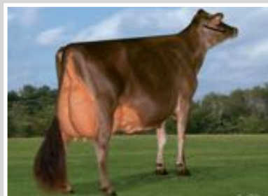
RATLIFF DUALY ATLEE-ET Sister to the Grandam of Lot 77