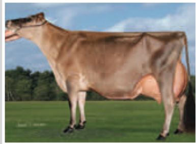
RATLIFF SULTAN VELVET Great-Grandam of Lot 7