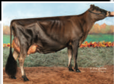
RIVER VALLEY EXCITATION FLAWLESS-ET