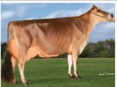
RATLIFF IRWIN VANCY-ET Sister to the Dam of Lot 61