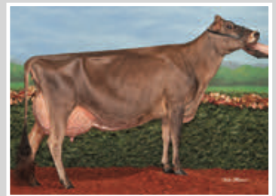
MARLAU COMERICA FABIENNE Great-Grandam of Lot 70