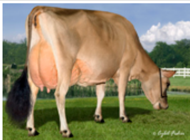
ARETHUSA ACTION LYDIA Fourth Dam of Lot 41