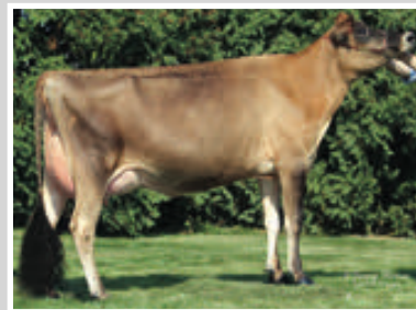
ARETHUSA RESPONSE VIEW-ET Grandam of Lot 94