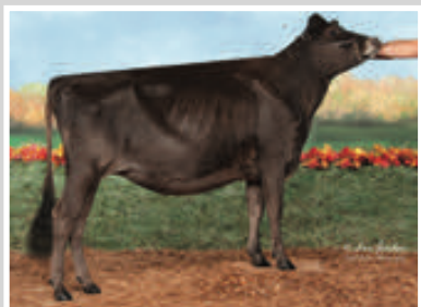
SCHULTE BROS COLTON FRANKIE-ET Full Sister to Lot 17