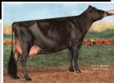
PACIFIC EDGE PREMIER DIVA-ET Full Sister to the Dam of Lot B

FEMALE EFI 7.8% PO PA -1441M -37F -35P -272CM$ -273NM$ -308FM$ 0.7PL 1.1DPR 0.8CCR 0.5HCR 3.18SCS PA TYPE 1.3 JPI 44%R -59