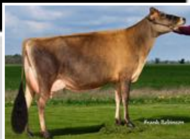
ARETHUSA PREMIER VAHLING-ET Grandam of Lot 33