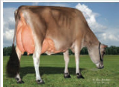
ARTHURACRES TEQUILA MARTHA-ET