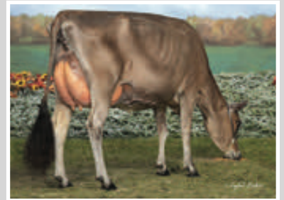
SCHULTE BROS COLT FIRST LADY-ET Full Sister to Lot 88