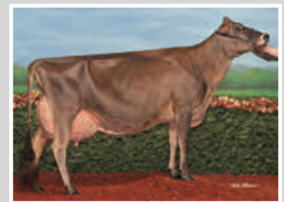
MARLAU COMERICA FABIENNE Fourth Dam of Lot 34