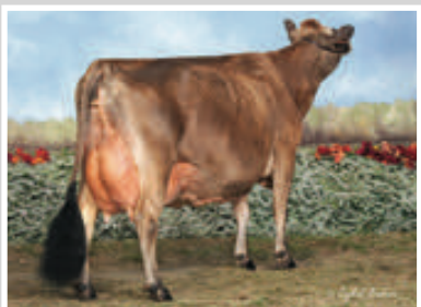
RATLIFF JADE CANDACE-ET Grandam of Lot C