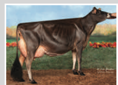
RIVENDALE VIP FAYE-ET Sister to the Grandam of Lot 34