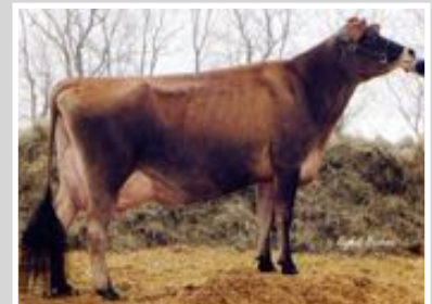
WF SAMBO BUNNY Fourth Dam of Lot 56