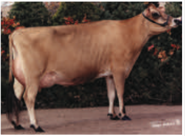
AVONLEA D JUDE KARMELE Great-Grandam of Lot 91