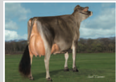
RATLIFF SAMBO DENALI-ET Full Sister to the Dam of Lot 90