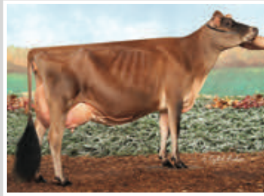
ARETHUSA HG SVANA-ET Sister to the Dam of Lot 75