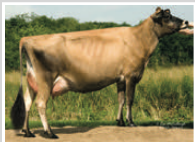
ARETHUSA VERONICAS VIXEN-ET Fifth Dam of Lot 15