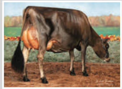
RIVER VALLEY EXCITATION FLAWLESS-ET Grandam of Lot 16

4TH DAM: PF TEQUILA MAKES IT EASY 93% 4-01 291 3 12550 4.5 559 3.6 449 94DCR 1516C INTERMEDIATE CHAMPION, 2012 INDIANA STATE FAIR 1ST JR 3-YEAR-OLD, 2012 INDIANA STATE FAIR