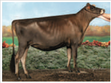
ARETHUSA FIZZ CABERNET-ET Dam of Lot 66