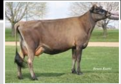
BJ JADE MIRACLE-ET Seventh Dam of Lot 26