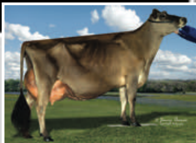
BIG GUNS JAMAICA VANILLA Grandam of Lot 47