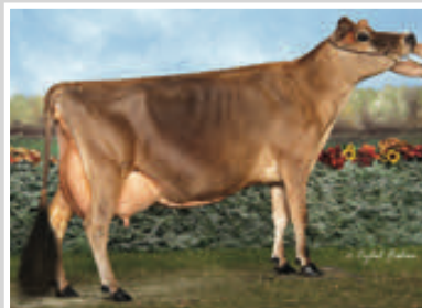
AMLAIRED COUNCILLER EMMY Grandam of Lot 39