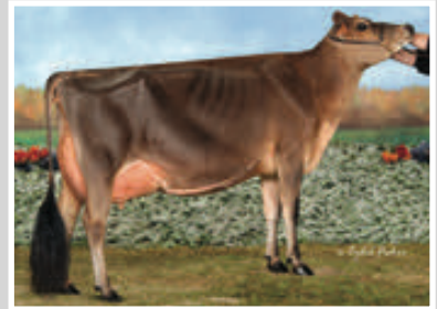
CHILLI PREMIER CINEMA-ET Grandam of Lot 48