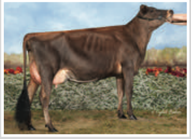
FAMILY HILL TEQUILA RUBY, E-91% Same Family as Lot 14

4TH DAM: FAMILY HILL JADE RACHEL 92% 9-03 305 2 19460 5.0 964 3.7 713 96DCR 2466C