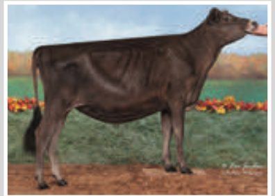
SCHULTE BROS COLTON FERGALICIOUS-ET Sister to the Dam Lot 24