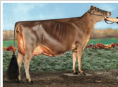
MUSQIE JOEL VILLETTA-ET Dam of Lot 45