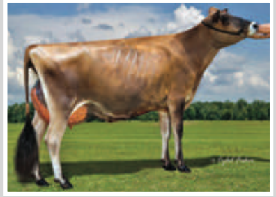
PLEASANT NOOK GUNS FOXY LADY Grandam of Lot 24