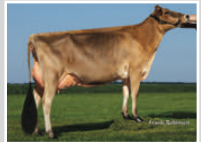
LOST-ELM APPLEJACK NADINE Grandam of Lot 52