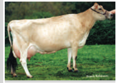
TENN HAUG E MAID Great-Grandam of Lot 98