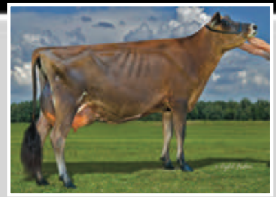
SVHEATHS HGUN COROLLA-ET Dam of Lot 22

NEXT DAM: ARETHUSA VERONICAS COMET-ET 95% 2-02 305 2 20500 4.3 879 3.6 743 DHIR 2437C SIRE: PIEDMONT NADINE FUROR GJPI -158 1%ILE