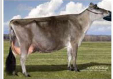
RENN KANDIE OF RATLIFF Great-Grandam of Lot 62