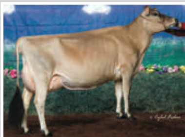
SILVER DREAMS CENTR LINDY Fifth Dam of Lot 41

SIRE: SUNSET CANYON ANDREAS USA 117597125 GT99K BBR 100 JH1F JNSF A1A2 94JE4036 CDCB GPTA S 04/01/2023 937DAUS 335HRDS 8%RIP 99%R -1990M 0.08% -81F 1%ILE 99%R 0.06% -62P -807CMS -802NM$ -785FM$ -816GM$ -2.9PL -2.4LIV -1.1DPR -0.8CCR -1.0HCR 3.20SCS 0.0MFV -0.5DAB -0.6KET -2.1MAS -0.5MET 0.5RPL -6.54HTI AJCA 04/01/2023 789DAUS GPTAT 98%R 0.9 GJUI 10.7 GJPI 95%R -185