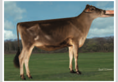
RED DIRT SUGAR T-ET Sister of Lot 30