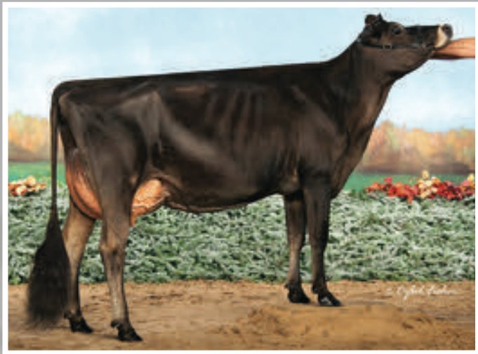
LLR TEQUILA EXCITEMENT, VG-89% Grandam of Lot 27