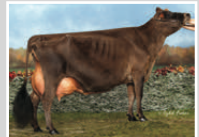
ARETHUSA PRIMETIME DEJA VU-ET Great-Grandam of Lot A