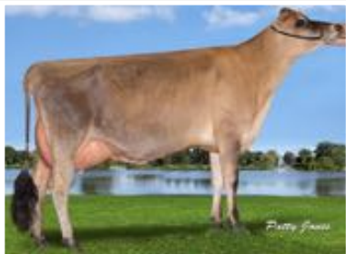
AVONLEA CF SUPREME-ET Excellent 90 (CAN) From the Same Family as Lot 3