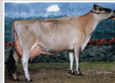
ROZEVIEV DORIE D RACHEL Sixth Dam of Lot 58