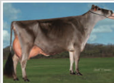
RATLIFF IMPRESSION ANNABELLA-ET Sister to the Grandam of Lot 77