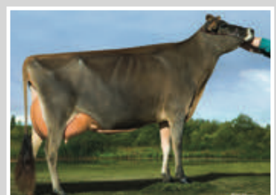
ARETHUSA SOCRATES VIBE-ET Sister to the Dam of Lot 12