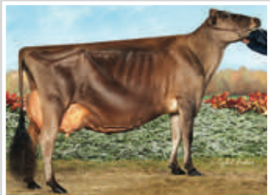
EDGEBROOK TEQUILA MADISON-ET Sister to the Dam of Lot 85