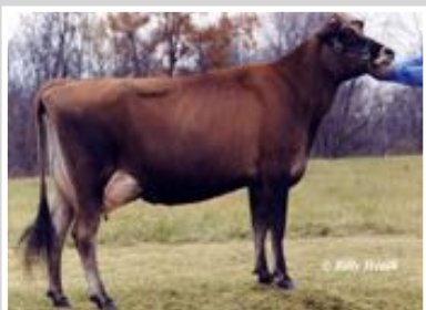
WF JUSTIN BESS-ET Fifth Dam of Lot 79