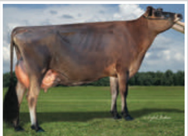
ARTHURACRES TEQUILA MARIA-ET Sister to the Dam of Lot 85