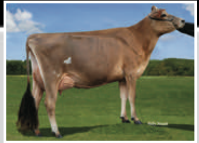
ELLIOTTS TORPEDO CYCLONE-ET Dam of Lot 48

4TH DAM: PLEASANT NOOK F PRIZE CIRCUS 97% 6-04 305 2 22920 4.5 1038 3.5 813 92DCR 2786C