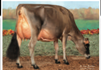
SPATZ APPLEJACK BAYLEE Grandam of Lot 32

7TH DAM: JRS VOLUNTEER BRITANI 93% RESERVE ALL AMERICAN 5-YEAR-OLD, 1991 8-05 305 2 18940 4.5 846 3.8 716 98DCR 2348C