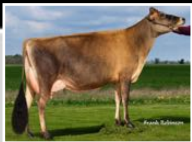
ARETHUSA PREMIER VAHLING-ET Grandam of Lot 37