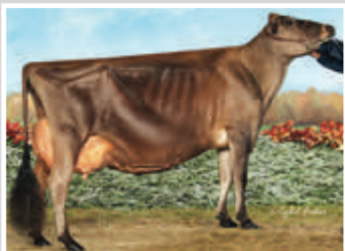
EDGEBROOK TEQUILA MADISON-ET