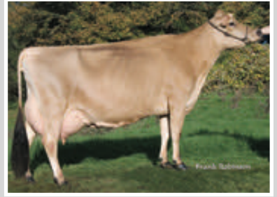
SUNSET CANYON LEMVIG MAID 4-ET Grandam of Lot 98