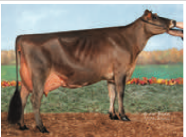
RATLIFF IRWIN VITA-ET Sister to the Dam of Lot 61

BORN 07/23/2021 PO FEMALE EFI 7.0% AMERICAN ID 1768/1768