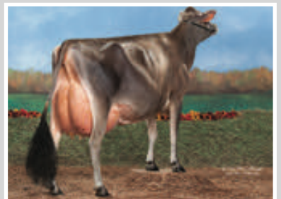
RATLIFF ACTION ADDIE-ET Sister to the Dam of Lot 92