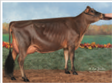
KUNDE VICTORIOUS LYDIA Selling as Lot 81

BORN 07/16/2019 TATTOO KJ/615 DHIA HERD # 48-14-0191 CONTROL # 615 FEMALE EFI 7.5% A2A2 1-11 302 2 15750 5.4 846 4.0 637 89DCR 2206C 2-11 248 2 16147 5.1 823 4.0 646 RIP 305 2X ME AVG 1L 20756M 1081F 830P 2874C