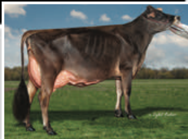
SVHEATHS TEQUILA CASSIE-ET Dam of Lot 35