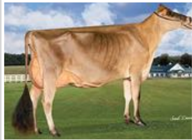
ARETHUSA COLTON CADBURY Sister to the Dam of Lot 19