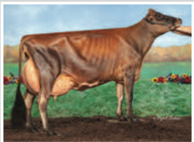
SUGAR & SPICE FIZZ VALLORY-ET Sister to the Dam of Lot 51