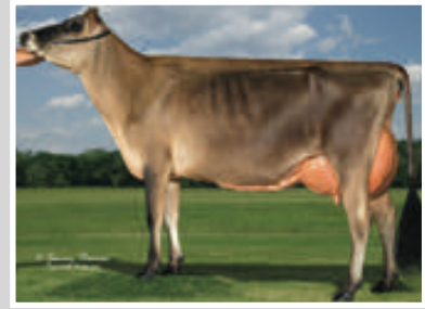
ELECTRAS ENCHANTING-ET Fourth Dam of Lot 10

NEXT DAM: ELECTRAS ENCHANTRESS 85% 3-00 248 2 14220 4.5 640 3.3 466 93DCR 1609C SIRE: GIPRAT BELLES JADE-ET JPI -52 4%ILE