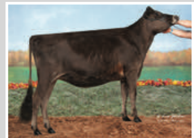
SCHULTE BROS COLTON FAME-ET Sister to the Dam Lot 24