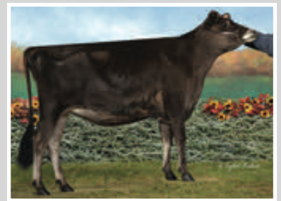
SCHULTE BROS GENTRY CLARABELLE-ET Sister to Lot 22