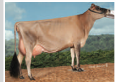
COWBELL SOCRATES MADEMOISELLE Fourth Dam of Lot 60