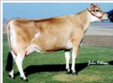
MAPLE LAWN D CHIEF CANDI Fourth Dam of Lot 83

BORN 06/01/2019 TATTOO /S857 DHIA HERD # 48-14-0191 CONTROL # 857 FEMALE EFI 6.8%