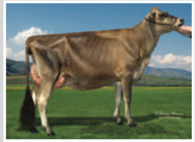
MM COLTON FOXY-ET Sister to the Dam of Lot 16