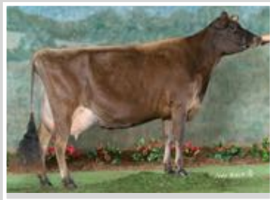
BRI-LIN RENS SOFIE Great-Grandam of Lot 75