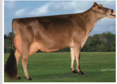
RATLIFF IRWIN VANCY-ET Sister to Lot 20