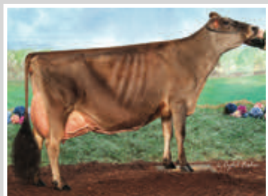
ARETHUSA RESPONSE VIVID-ET Great-Grandam of Lot 37