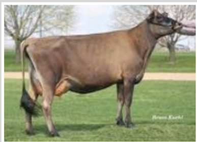
EDGEBROOK STYLEMASTER MERLOT-ET Grandam of Lot 85