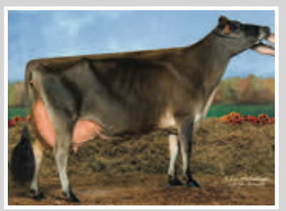
RATLIFF PRICE ALICIA Grandam of Lot 86