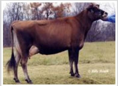
WF JUSTIN BESS-ET Sixth Dam of Lot 32