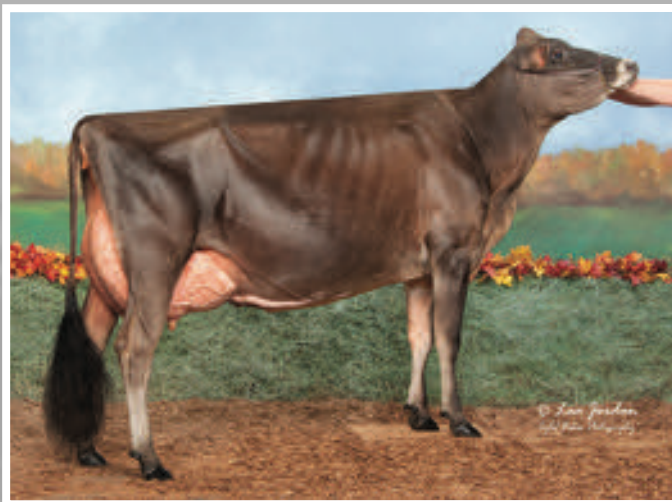
TOP GENE JOEL PASTEL, E-91% Dam of Lot 97