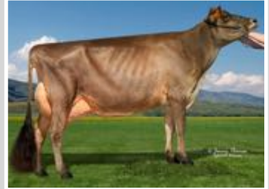
PACIFIC EDGE GUNMAN DEVIANT-ET Sister to the Dam of Lot B