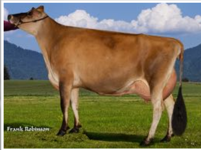
L'ORMIERE TEQUILA ROXE, VG-86% Grandam of Lot 4