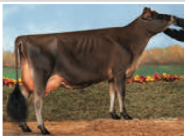
ELLIOTTS FAXON COMICAL-ET Grandam of Lot 35