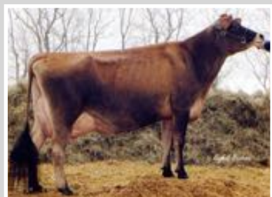
WF SAMBO BUNNY Fifth Dam of Lot 59

3-03 91% ST SR DP RA RW RL FA FU RH RUW UC UD TP TL RTR RTS 42 37 44 21 40 29 28 44 48 46 30 26 40 26 35 28 PPA -3817M -133F -112P / YD -3669M -144F -111P CDCB PTA 04/01/2023 2RECS 52%R 2%ILE -1665M 0.11% -59F 0.06% -50P -593CM$ -588NM$ -578FM$ -1.4PL -2.5LIV 0.1DPR 0.7CCR 0.1HCR 3.28SCS -584GM$ -0.2MFV -0.4DAB -0.3KET -0.2MAS -0.2MET 0.1RPL -4.55HTI PA TYPE 0.9 JUI JPI 48%R-134 SELLING AS LOT 79 8TH SR 2-YEAR-OLD, 2022 WORLD DAIRY EXPO 9TH SR 2-YEAR-OLD, 2022 ALL AMERICAN JERSEY SHOW