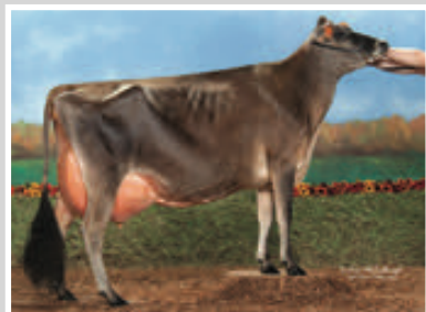
RATLIFF ACTION ANGEL Sister to the Dam of Lot 93