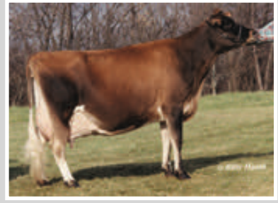
JRS VOLUNTEER BRITANI Seventh Dam of Lot 32