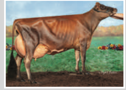
SUGAR & SPICE FIZZ VALLORY-ET Sister to the Dam of Lot 96