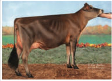
RATLIFF MONEY VIXEN Dam of Lot 1A and 1B