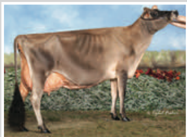
ARETHUSA VERONICAS COMET-ET Great-Grandam of Lot 35