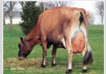
RESPONSES GIGI Fifth Dam of Lot 64