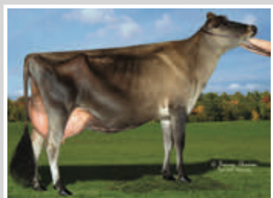
ARETHUSA IMPRESSION VILLENEUVE-ET Sister to the Grandam of Lot 37

MISTY MEADOW DAIRY TILLAMOOK, OR BREEDER & OWNER