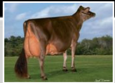
RATLIFF DUALLY ATLEE-ET Dam of Lot 92

4TH DAM: ROZVIEW DORIE D RACHEL 95% 4-07 305 2 19470 4.2 818 3.6 704 91DCR 2286C RESERVE INTERMEDIATE CHAMPION, 2002 ROYAL WINTER FAIR NOMINATED ALL-CANADIAN SR 2-YEAR-OLD, 2002