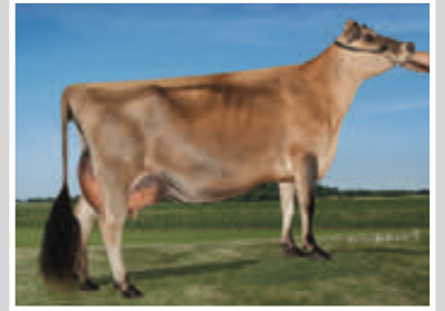
RANDOM LUCK FAVORITE FANTASY Sister to the Grandam of Lot 30