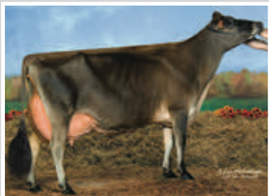
RATLIFF PRICE ALICIA Great-Grandam of Lot 77