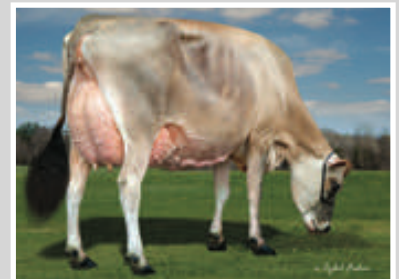
BILLINGS JOEL BULGHUR-ET Sister to the Dam of Lot 68