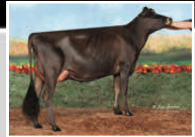
RATLIFF LO LALALA DANCER-ET Sister to the Dam of Lot 40

SISTER(S): RATLIFF SAMBO DESTINY-ET 91% 5-09 305 2 16310 5.7 935 3.8 614 97DCR 2124C RATLIFF SAMBO DEMI-ET 92% 2-11 305 2 19330 5.4 1050 3.6 696 96DCR 2406C RATLIFF ACTION DEVA-ET 91% 5-04 280 2 15960 5.2 823 3.5 553 93DCR 1911C RATLIFF SAMBO DYNASTY-ET 93% 5-03 305 2 16740 5.3 885 3.3 546 70DCR 1885C RATLIFF SAMBO DREAM-ET 94% 5-09 305 2 19230 5.4 1046 3.9 749 96DCR 2592C RATLIFF ACTION DAZZLE-ET 93% 3-08 305 2 20000 4.1 811 3.8 756 102DCR 2349C RATLIFF SAMBO DAPHNE-ET 95% 5-06 305 2 22550 6.2 1405 3.7 826 96DCR 2857C RATLIFF SAMBO DENALI-ET 94% 5-07 305 2 24340 4.8 1176 3.9 949 96DCR 3201C RATLIFF ACTION DIAMONDS & BLING-ET 95% 5-05 305 2 26720 5.2 1399 4.0 1060 95DCR 3670C RATLIFF ACTION DABBLE-ET 94% 6-04 305 2 23670 5.2 1229 3.5 833 97DCR 2879C RATLIFF IMPRESSION DIRTY-ET 92% 6-07 305 2 19930 5.4 1069 3.7 729 96DCR 2521C RATLIFF IMPRESSION DANCER-ET 91% 2-02 270 2 16190 4.9 799 3.5 561 86DCR 1938C RATLIFF IMPRESSION DONNER-ET 93% 5-04 305 2 23340 6.3 1470 3.9 900 96DCR 3115C RATLIFF IMPRESSION DULCE-ET 92% 2-02 305 2 14880 6.3 938 3.9 574 93DCR 1986C RATLIFF SAMBO DOODLE-ET 91% 3-10 305 2 19180 5.7 1094 3.7 711 90DCR 2459C RATLIFF COLTON DIZA-ET 92% 3-00 305 2 19340 5.4 1048 3.8 744 89DCR 2575C RATLIFF COLTON DARIEN-ET 93% 4-00 305 2 13780 5.4 750 3.9 532 98DCR 1841C