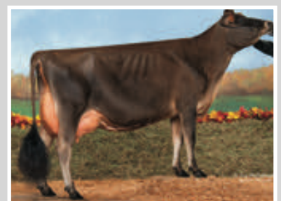
ELLIOTTS FAXON COMICAL-ET Grandam of Lot 22