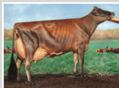
SUGAR & SPICE FIZZ VALLORY-ET Sister to the Dam Lot 94