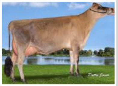
AVONLEA CF SUPREME-ET Excellent 90 (CAN) From the Same Family as Lot 72