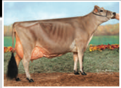
PAGE-CREST GATOR KANDI-ET Grandam of Lot 62

SISTER(S): RATLIFF DUAISEOIR KISS 86% 2-10 305 2 19670 3.8 755 3.6 710 96DCR 2194C RATLIFF JUSTICE KATRINA 82% 1-11 239 2 10350 4.7 483 3.5 366 85DCR 1265C PAGE-CREST JUSTIN KAN-DO-ET 88% 3-09 305 2 15590 4.3 673 3.9 601 91DCR 1913C PAGECREST ACTION KANDIE-ET 84% 1-10 283 3 17570 4.0 698 3.1 543 97DCR 1864C PAGE-CREST RAGIN KAJUN 92% PAGE-CREST NEVADA KASSIE-ET 85% 1-10 305 2 12200 5.2 630 3.8 462 92DCR 1598C PAGE-CREST KARMEL RESPONSE-ET 86% PAGE-CREST SPARKLER 762-ET 87% PAGE-CREST RESPONSE 781-ET 80% PAGE-CREST SPARKLER 770-ET 88% PAGE-CREST SPARKLER 773-ET 86% PAGE-CREST SPARKLER 772-ET 81% PAGE-CREST JAGUAR 809-ET 85% 3-08 305 2 20280 4.4 890 3.8 778 98DCR 2506C PAGE-CREST COMERICA KAPPY 90% 6-03 278 3 14210 5.7 814 3.6 506 99DCR 1749C PAGE-CREST IMP REESESS KISS-ET 93% 5-04 305 2 24890 4.6 1140 3.2 790 98DCR 2726C PAGE-CREST IMPRESSION KALLIE-ET 94% 2-04 274 2 11580 5.6 653 3.6 418 89DCR 1445C PAGE-CREST PREMIER KANDIE-ET 86%