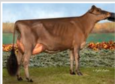
BIG GUNS ANDREAS VELVET-ET Sister to the Dam of Lot 47