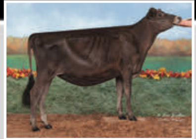
SCHULTE BROS COLTON FERGALICIOUS-ET Dam of Lot 24

4TH DAM: PLEASANT NOOK SAMBO FROLIC SUP-EX 91-6E (CAN) 11-07 305 2 22006 4.4 959 3.5 770 CAN 2601C 5 STAR BROOD COW IN CANADA, JULY 2015 1ST 5-YEAR-OLD, 2006 GOLDEN HORSESHOE PARISH 2ND 4-YEAR-OLD, 2005 GOLDEN HORSESHOE PARISH