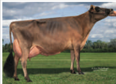
EDGEBROOK NEVADA NIBBLES Fourth Dam of Lot 69

BORN 03/06/2021 PO FEMALE EFI 6.8% AMERICAN ID 125/125 PA -2002M -72F -58P -645CM$ -643NM$ -647FM$ -1.4PL 0.5DPR 0.6CCR 0.5HCR 3.22SCS PA TYPE 0.9 JPI 33%R -143