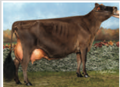
ARETHUSA PRIMETIME DEJA VU-ET Great-Grandam of Lot B

HAWARDEN IMPULS PREMIER USA 067107510 GT50K BBR 100 JH1C JNSF A2A2 29JE3756 RATLIFF COLTON DARIEN-ET 93% JE840003136709089 GT9K BBR 100 JH1F JNSF DHIA HERD # 92-23-0633 CONTROL # 1322 2-00 301 2 10600 5.6 598 4.0 421 98DCR 1457C 3-00 280 2 12820 5.5 705 3.8 483 93DCR 1671C 4-00 305 2 13780 5.4 750 3.9 532 98DCR 1841C 305 2X ME AVG 4L 11671M 675F 442P 1528C PPA -4350M -41F -106P / YD -4262M -49F -105P CDCB GPTA S 04/01/2023 4RECS 86%R 12%ILE -1783M 0.39% -11F 0.13% -41P -217CM$ -222NM$ -276FM$ 0.1PL -0.3LIV 1.1DPR 1.7CCR 1.2HCR 3.11SCS -201GM$ 0.0MFV -0.1DAB -0.5KET 0.2MAS 0.2MET 0.1RPL -0.60HTI AJCA 04/01/2023 GPTAT 85%R 1.5 GJUI 13.9 GJPI 81%R -44 UNANIMOUS ALL AMERICAN PRODUCE DAM, 2022 ALL AMERICAN SIRE: CHILLI ACTION COLTON-ET GJPI -64 3%ILE