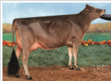
MAPLE LAWN LADD LAZONE Selling as Lot 83