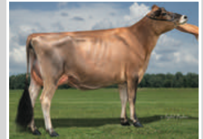
FELICIDAD ROCKSTAR FIONA-ET Dam of Lot 34