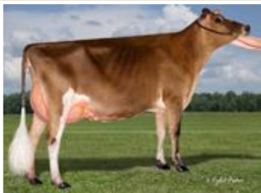
LOST-ELM TEQUILA NALA Sister to the Grandam of Lot 53

BORN 03/01/2022 PO FEMALE EFI 4.3% AMERICAN ID 1808/1808