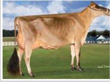
ARETHUSA COLTON CADBURY Sister to the Dam of Lot 66