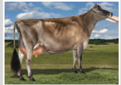
COWBELL ANDREAS MEMPHIS-ET Excellent-91% From the Same Family as Lot 60