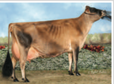
HURONIA CENTURION VERONICA 20J Great-Grandam of Lot 89