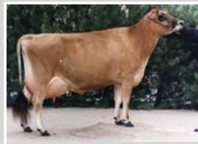
RATLIFF HERMITAGE PENELOPE Fifth Dam of Lot 31