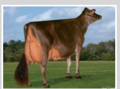
RATLIFF DUALLY ATLEE-ET Sister to the Dam of Lot 86