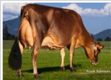
ARETHUSA VICTORIOUS PUEBLA Grandam of Lot 15