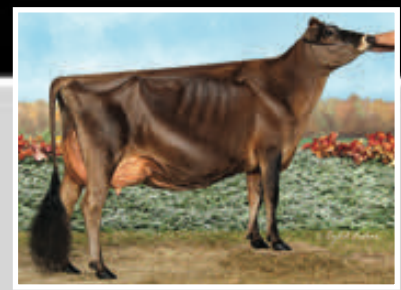
MB LUCKY LADY FELIZ NAVIDAD-ET Great-Grandam of Lot 34

NEXT DAM: MB LUCKY LADY FELIZ NAVIDAD-ET 93% 3-03 305 2 21520 5.3 1135 3.9 841 100DCR 2911C RESERVE INTERMEDIATE CHAMPION, ROYAL AGRICULTURAL WINTER FAIR 2016 ALL CANADIAN SENIOR TWO YEAR OLD, 2016 RESERVE GRAND CHAMPION, ROYAL AGRICULTURAL WINTER FAIR 2017 RESERVE 4-YR-OLD, ALL CANADIAN 2018 2ND 4-YR-OLD, ROYAL AGRICULTURE WINTER FAIR 2018 SIRE: TOWER VUE PRIME TEQUILA-ET GJPI -203 0%ILE