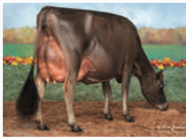
HO-CRAWF ANDREAS JOPLIN Dam of Lot 9