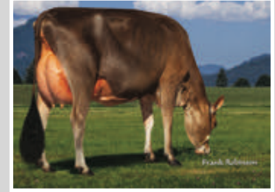
BJ COLTON MONIQUE-ET, VG-88% From the Same Family as Lot 26