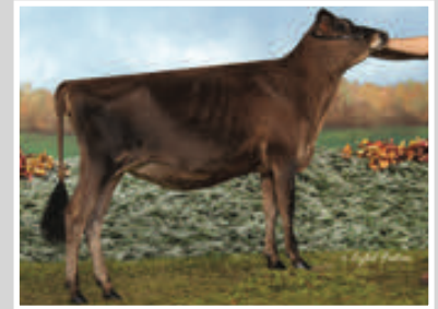
RATLIFF TEQUILA DAZZLED-ET Grandam of Lot 40