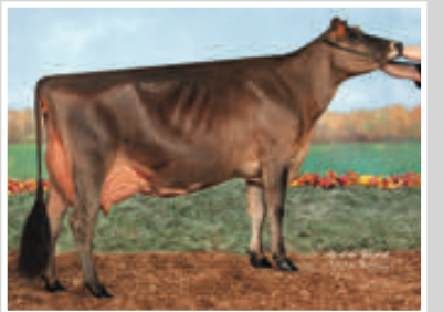
RATLIFF IRWIN VITA-ET Sister to Lot 80