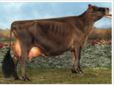
ARETHUSA PRIMETIME DEJA VU-ET Grandam of Lot 89