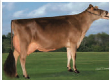
RATLIFF IRWIN VANCY-ET Grandam of Lot 1A and 1B