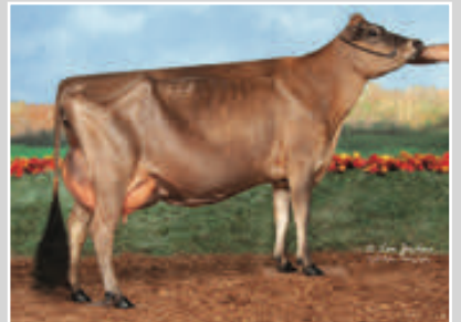
KILGUS COLTON GINGER-ET Sister to the Dam of Lot 64