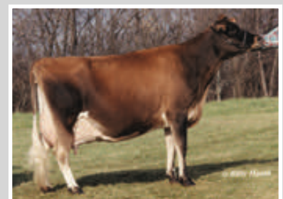
JRS VOLUNTEER BRITANI Sixth Dam of Lot 56