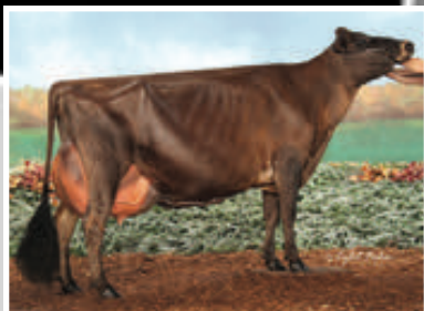
ARETHUSA TEQUILA VISION Grandam of Lot 61