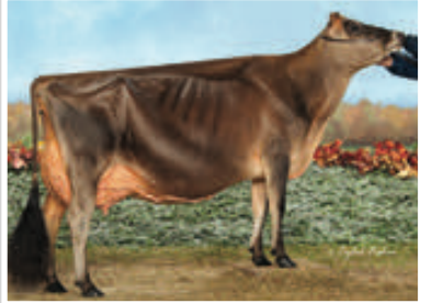
ELLIOTT'S BLACKSTONE CHARLOTTE-ET Sister to the Dam of Lot 66