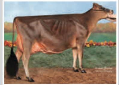
RATLIFF LADD VICKI Dam of Lot D

JARS OF CLAY BARNABAS USA 067342492 GT80K BBR 100 JH1F JNSF A2A2 7JE1294 AVONLEA IATOLA VICTORIA 94% JECAN00010989478 GT8K BBR 100 JH1F JNSF TATTOO /428X DHIA HERD # 33-87-0722 CONTROL # 16 3-01 305 2 17409 4.6 808 3.6 629 102DCR 2165C 305 2X ME AVG 3L 15062M 739F 558P 1926C PPA -1634M -55F -44P / YD -2402M -83F -61P CDCB GPTA S 04/01/2023 5RECS 90%R 11%ILE -1297M 0.09% -44F 0.08% -32P -245CM$ -247NM$ -277FM$ 1.1PL 1.3LIV 0.3DPR 0.4CCR -0.4HCR 3.08SCS -270GM$ -0.2MFV -0.4DAB -0.6KET 0.8MAS 0.3MET 0.2RPL -2.95HTI AJCA 04/01/2023 GPTAT 87%R 1.4 GJUI 13.2 GJPI 86%R -61