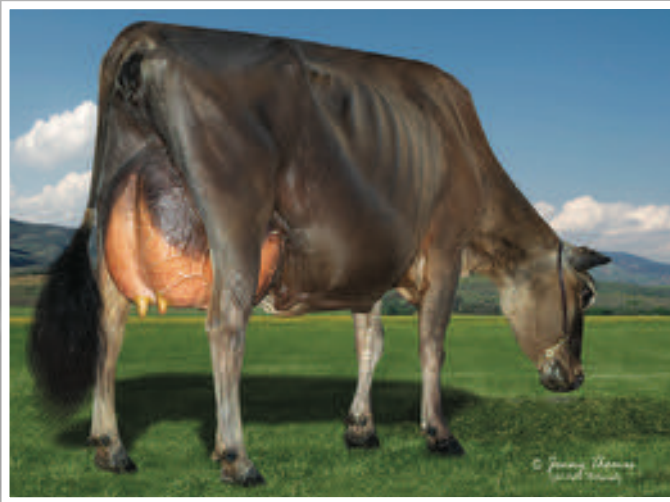
KASH-IN FEARLESS LADY {4} Dam of Lot 5