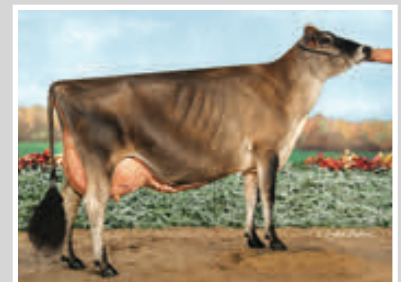
RATLIFF IMPRESSION DONNER-ET Sister to the Grandam of Lot 40