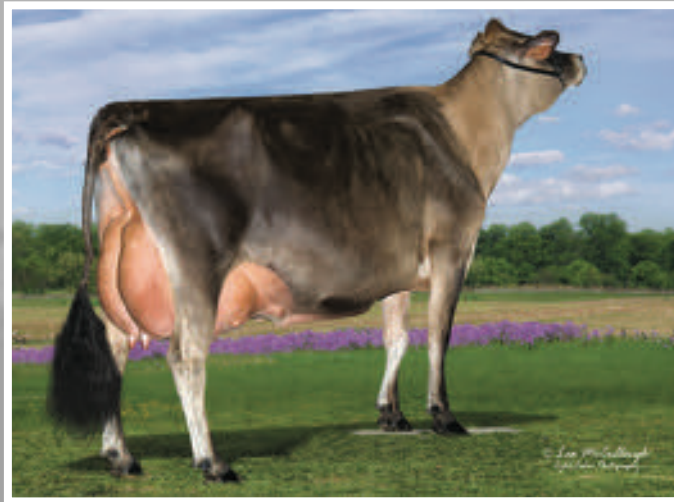
ARETHUSA PRIMETIME DEJA VU-ET, E-95% Fourth Dam of Lot 2