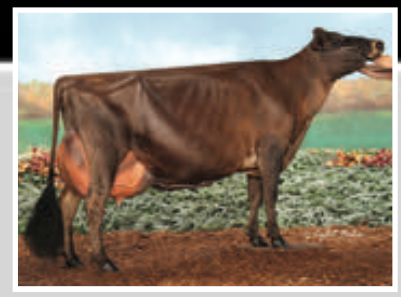
ARETHUSA TEQUILA VISION Dam of Lot 96