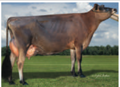
ARTHURACRES TEQUILA MARIA-ET