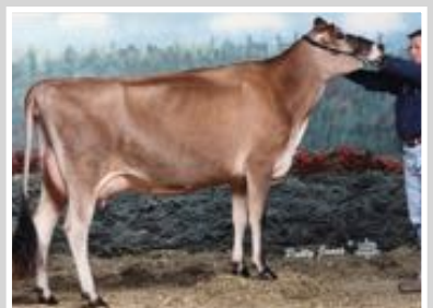
SHAMROCK JUDE JULIANNA Sixth Dam of Lot 6