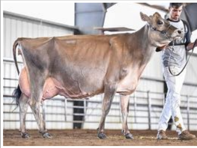
RJF GENTRY SHOT, E-92% Grandam of Lot 3