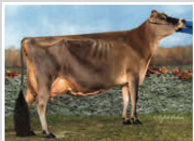
ARETHUSA VIXENS PRESTO Fourth Dam of Lot 15