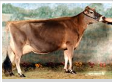
NORVAL ACRES PITINO CONSTANCE Great-Grandam of Lot C