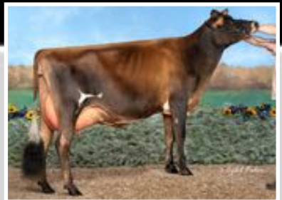
SOUTH MOUNTAIN VELOCITY JEWEL Grandam of Lot 6

7TH DAM: BOVI-LACI GROVE BELLE-ET VG 87 (CAN)