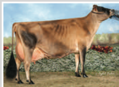
HURONIA CENTURION VERONICA 20J Fourth Dam of Lot 63

RIVER VALLEY VENUS VIP-ET JE840003126479167 GT99K BBR 100 JH1F JNSF A1A2 777JE10003 CDCB GPTA S 04/01/2023 819DAUS 285HRDS 21%RIP 98%R -2188M 0.15% -77F 1%ILE 98%R 0.07% -67P -616CM$ -613NM$ -601FM$ -662GM$ 0.7PL 2.2LIV 0.3DPR 0.3CCR -0.6HCR 3.15SCS 0.0MFV -0.1DAB -0.5KET 0.2MAS 0.9MET 0.4RPL -0.17HTI AJCA 04/01/2023 638DAUS GPTAT 98%R 1.5 GJUI 21.1 GJPI 94%R -140