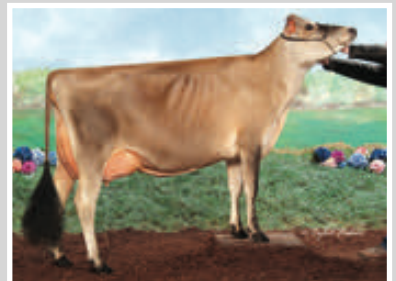
ELLIOTTS REGENCY CORRINA-ET Sister to the Dam of Lot 48