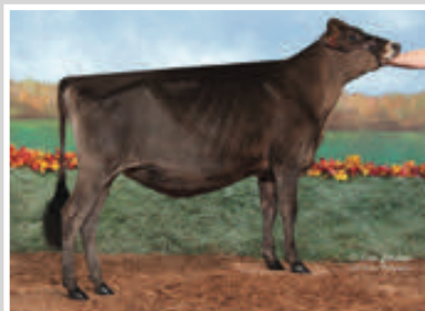
RBR-FRM FIZZ I-FANCY Sister to the Dam of Lot 23