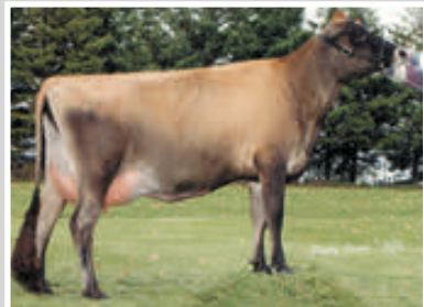
LIL BUSTER JUNO VICTORIA 21H Fifth Dam of Lot 7

BORN 12/03/2022 PO FEMALE EFI 7.2% AMERICAN ID 1900/1900