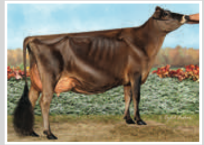
MB LUCKY LADY FELIZ NAVIDAD-ET Grandam of Lot 70

4TH DAM: HAUTPRE FUROR FABULOUS-ET VG 87 (CAN) 10-10 305 2 17153 6.1 1039 3.9 673 CAN 2330C 2022 6 STAR BROOD COW