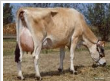
AUBURNVUE SOONER GINGER Fifth Dam of Lot 23

BORN 09/03/2022 PO FEMALE EFI 7.2% AMERICAN ID 13/13