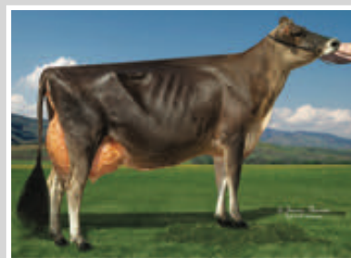
SV HEATHS TEQUILA CHLOE-ET Sister to the Dam of Lot 35

BORN 06/08/2022 PO BBR 100 FEMALE EFI 4.2% AMERICAN ID 19649/19649 JH1F JNSF