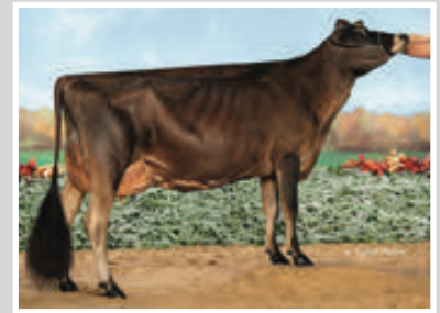
CAMPBELL TB EXCITATION FELICIDAD Sister to the Dam of Lot 70