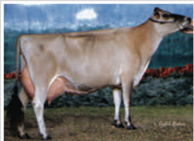
ROZEVIEV DORIE D RACHEL Fifth Dam of Lot 77