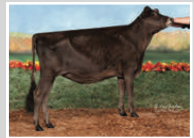
SCHULTE BROS COLTON CHEERIO-ET Full Sister to Lot 22