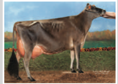
RATLIFF ACTION ANGEL Sister to the Grandam of Lot 78