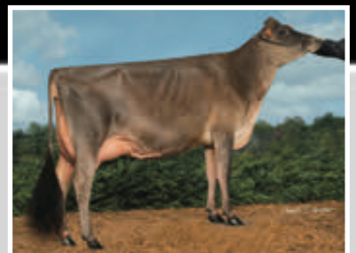
RATLIFF APPLE JACK ANSLEY-ET Dam of Lot 86

4TH DAM: ROZEVIEV DORIE D RACHEL 95% 4-07 305 2 19470 4.2 818 3.6 704 91DCR 2286C RESERVE INTERMEDIATE CHAMPION, 2002 ROYAL WINTER FAIR NOMINATED ALL-CANADIAN SR 2-YEAR-OLD, 2002