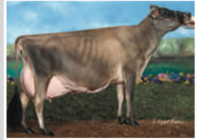
HURONIA CENTURION VERONICA 20J Great-Grandam of Lot 20