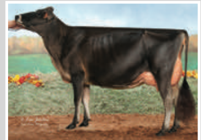
BILLINGS IMPRESSION BACKSTAGE Sister to the Dam of Lot 68