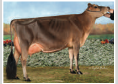
CHILLI PREMIER CINEMA-ET Grandam of Lot 38