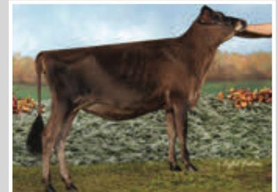
RATLIFF TEQUILA DAZZLED-ET Grandam of Lot A