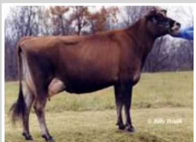
WF JUSTIN BESS-ET Sixth Dam of Lot 59

SISTER(S): RATLIFF VIP BRITNEY 87% RATLIFF MONEY BUTTERCUP 86% RATLIFF FIZZ BRILLIANCE-ET 87% RATLIFF ROCKSTAR BANDI-ET 85% RATLIFF VICTORIOUS BRANDY-ET SELLING AS LOT 57 RATLIFF VICTORIOUS BREEZE-ET SELLING AS LOT 56