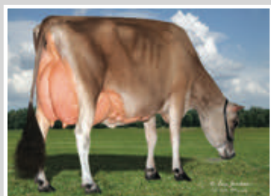
ARTHURACRES TEQUILA MARTHA-ET Sister to the Dam of Lot 85

BORN 03/12/2019 DHIA HERD # 48-14-0191 CONTROL # 1593 FEMALE EFI 4.3% AMERICAN ID 1593/1593 2-00 305 2 12450 4.2 519 3.9 490 92DCR 1513C 305 2X ME AVG 1L 15213M 624F 601P 1836C