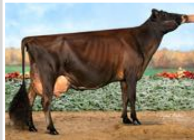
ARETHUSA IMPRESSION SUNSHINE-ET Sister to the Dam of Lot 75

BORN 12/01/2020 PO BBR 100 FEMALE EFI 5.9% AMERICAN ID 13993/13993 JH1F JNSF