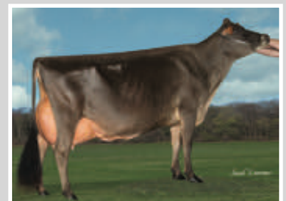
RATLIFF SAMBO DAPHNE-ET Sister to the Grandam of Lot 40