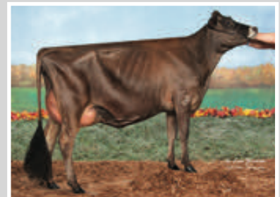
COWBELL SHOES MOMMA MIA Excellent-90% From the Same Family as Lot 60