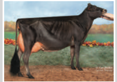
BJ TEXAS MADRID-ET, E-93% From the Same Family as Lot 26