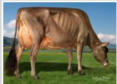
PACIFIC EDGE GUNMAN DEVIANT-ET Sister to the Dam of Lot B

TOLLENAARS IMPULS LEGAL 233-ET USA 061929249 GTHD BBR 100 JH1C JNSC A2A2 29JE3506 FERMAR PARAMOUNT JOY 95% JECAN000104419880 GT45K BBR 100 JH1C JNSF DHIA HERD # 33-87-0722 CONTROL # 31 2-00 305 2 15807 5.0 785 4.0 639 CAN 2146C 3-01 305 2 21400 5.2 1116 4.1 873 CAN 3001C 4-11 305 2 20860 5.1 1065 3.7 778 CAN 2692C 8-03 305 2 17130 5.1 870 3.5 594 103DCR 2053C 305 2X ME AVG 4L 21962M 1112F 848P 2894C CDCB GPTA S 04/01/2023 ORECS 89%R 3%ILE -1746M 0.07% -70F 0.10% -44P -532CM$ -534NM$ -568FM$ -1.1PL 1.8LIV 1.6DPR 1.0CCR -1.0HCR 3.16SCS -509GM$ 0.0MFV -0.1DAB -0.3KET 1.8MAS 1.3MET 0.4RPL 3.01HTI AJCA 04/01/2023 GPTAT 87%R 1.0 GJUI 7.8 GJPI 86%R-109