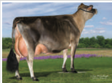
ARETHUSA PRIMETIME DEJA VU-ET Sister to the Grandam of Lot 94