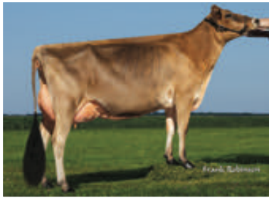
LOST-ELM APPLEJACK NADINE Grandam of Lot 53