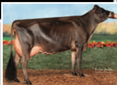
RATLIFF FIZZ BUBBLES-ET Selling as Lot 79

BORN 09/15/2019 DHIA HERD # 48-14-0191 CONTROL # 1649 FEMALE EFI 6.2% AMERICAN ID 1649/1649 1-11 245 2 10790 5.5 596 3.8 414 89DCR 1432C 2-10 225 2 12230 4.6 563 3.9 472 81DCR 1557C 305 2X ME AVG 2L 17408M 855F 662P 2232C