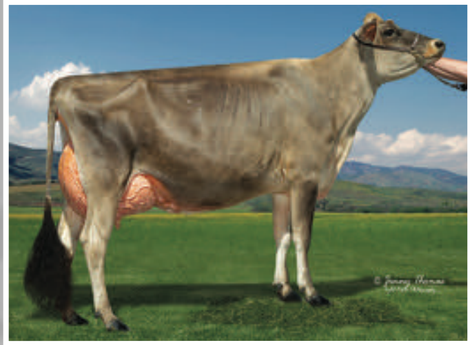
HEATHS APPLEJACK RIBBON, E-91% Dam of Lot 11