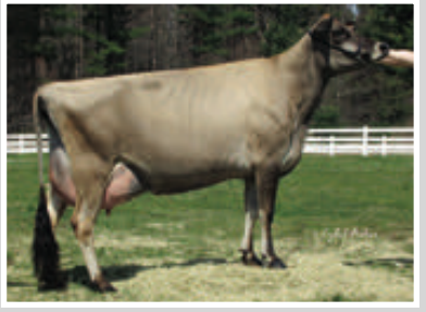
BRIDON DELUXE SHANTAL Fifth Dam of Lot 72