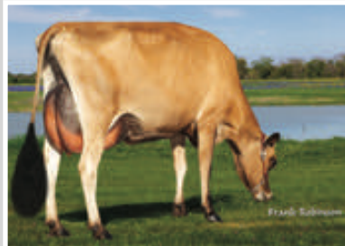
RATLIFF COLTON DIZA-ET Full Sister to the Grandam of Lot 63

NEXT SIX DAMS ARE EITHER VERY GOOD OR EXCELLENT.