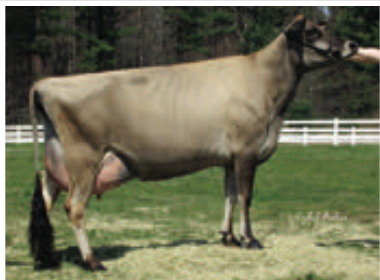
BRIDON DELUXE SHANTAL Sixth Dam of Lot 3

BORN 03/04/2023 PO FEMALE EFI 5.4% AMERICAN ID 1927/1927