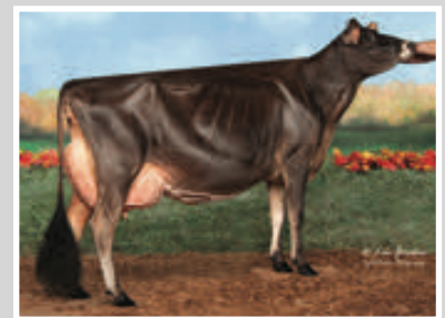
RIVENDALE VIP FAYE-ET Sister to the Dam of Lot 70