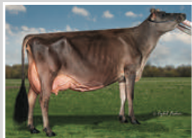
ARETHUSA PREMIER VENTOSA-ET Sister to the Grandam of Lot 37