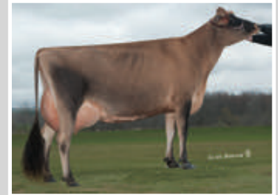
BJ GOVERNOR MONOPOLY-ET, E-95% From the Same Family as Lot 26