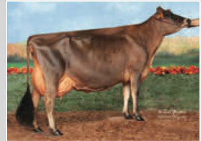
KILGUS VIC GRAND Dam of Lot 64

NEXT DAM: K&M CENTURION GABBY-ET 93% 9-06 305 2 18010 6.0 1083 3.9 697 102DCR 2412C SIRE: SOONER CENTURION-ET GJPI -68 3%ILE