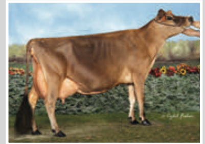
AMLAIRD COUNCELLER EMMY Fourth Dam of Lot 74