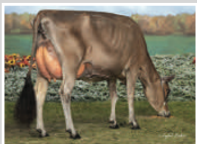
SCHULTE BROS COLT FIRST LADY-ET Full Sister to Lot 17