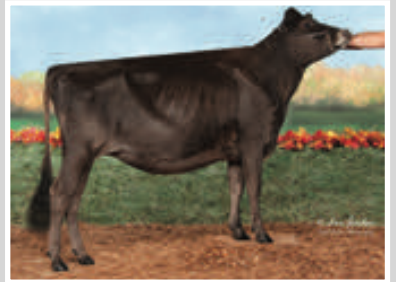
SCHULTE BROS COLTON FRANKIE-ET Sister to the Dam Lot 24