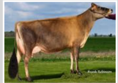
ARETHUSA PREMIER VAHLING-ET Full Sister to the Dam of Lot 12