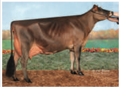
RATLIFF IRWIN VITA-ET Sister to Grandam of Lot 1A and 1B