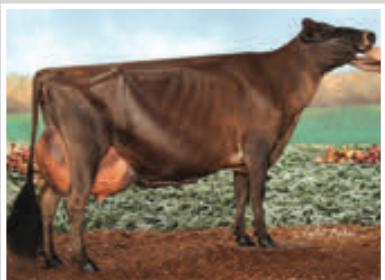
ARETHUSA RESPONSE VIEW-ET Fourth Dam of Lot 1A and 1B