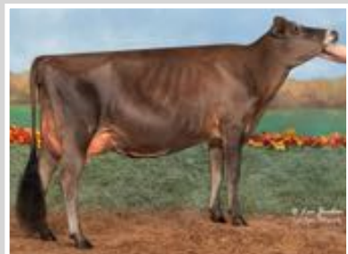
PACIFIC EDGE GENTRY DRAKE Sister to the Dam of Lot B

OFFERING A FIRST CHOICE FEMALE Sired by MR KATHIES KID ROCK OR GUIMO JOEL-ET AND OUT OF PACIFIC EDGE PREMIER DESTINY-ET. SIX CALVES (ALL SEXED FEMALES) TOTAL (4 JOEL AND 2 KID ROCK) ARE DUE JUNE 4, 2023. SALE TERMS: 50% DUE AT SALE TIME AND 50% DUE AT TIME OF SELECTION. SELECTION MUST BE MADE BY FOUR MONTHS OF AGE.