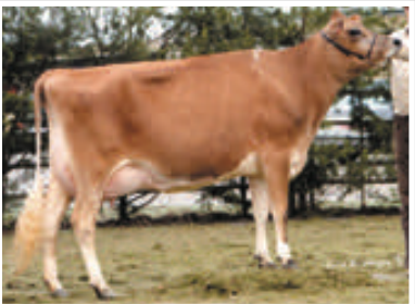
AVONLEA VALIANT KITTIE 15N, EX-3E (CAN) Fifth Dam of Lot 91

BORN 03/22/2018 DHIA HERD # 48-14-0191 CONTROL # 1520 FEMALE EFI 3.8% AMERICAN ID 1520/1520 1-11 305 2 16600 4.9 810 3.5 587 95DCR 2029C 3-03 305 2 20240 4.6 933 3.7 743 95DCR 2523C 4-03 232 2 18041 4.5 840 3.5 639 RIP 305 2X ME AVG 2L 21381M 994F 767P 2618C