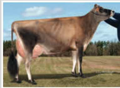
RATLIFF ACTION DAZZLE-ET Sister to the Grandam of Lot 67