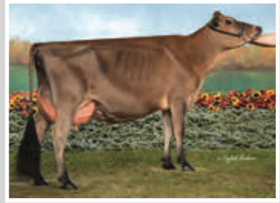
MM COLTON FEARLESS-ET Sister to the Dam of Lot 16