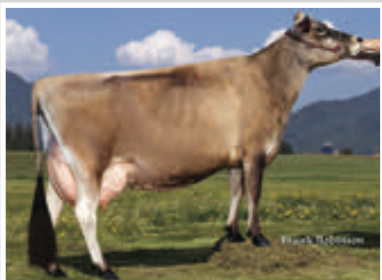
SUNSET CANYON IMPULS L MAID 4-ET Sister to the Grandam of Lot 21