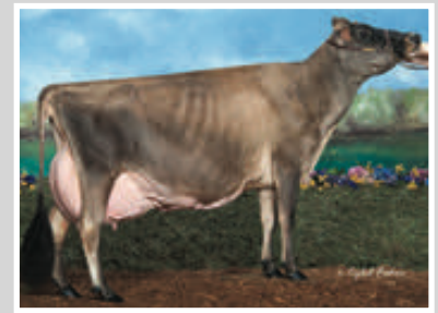
HURONIA CENTURION VERONICA 20J Great-Grandam of Lot 20