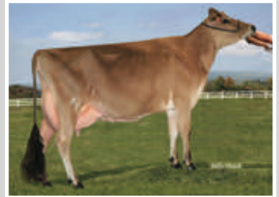
FAMILY HILL CONNECTION CHILLI-ET Great-Grandam of Lot 48