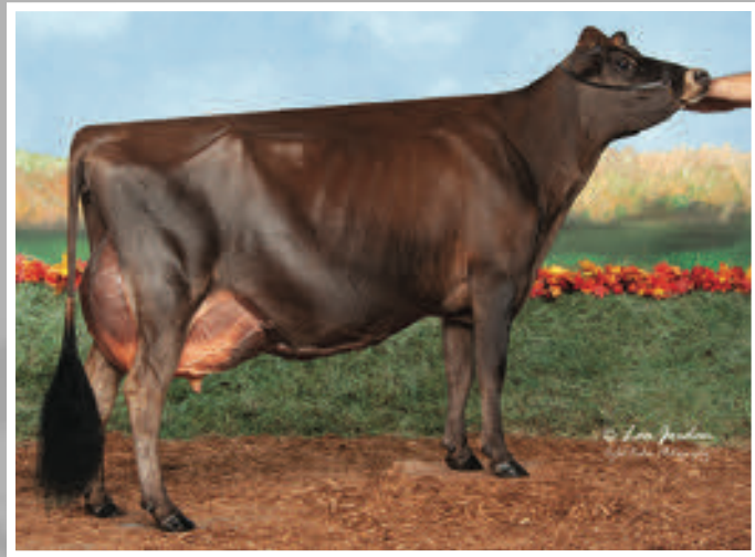
HO-CRAWF ANDREAS JOPLIN, E-92% Dam of Lot 9