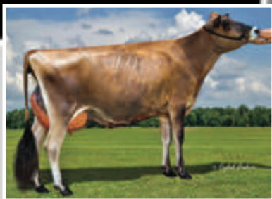
PLEASANT NOOK GUNS FOXY LADY Dam of Lot 17