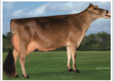
RATLIFF IRWIN VANCY-ET Sister to the Dam of Lot 18