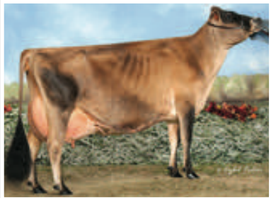
HURONIA CENTURION VERONICA 20J Great-Grandam of Lot 19