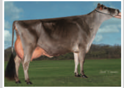
RATLIFF IMPRESSION ANNABELLA-ET Sister to the Grandam of Lot 78