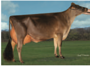
LOST-ELM HIRED GUN NORA Dam of Lot 53