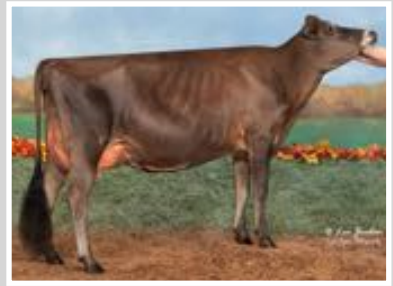
PACIFIC EDGE GENTRY DRAKE Sister to the Dam of Lot B