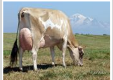
PLEASANT NOOK F PRIZE CIRCUS Fourth Dam of Lot 48