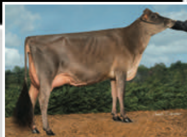
RATLIFF APPLE JACK ANSLEY-ET Grandam of Lot 77