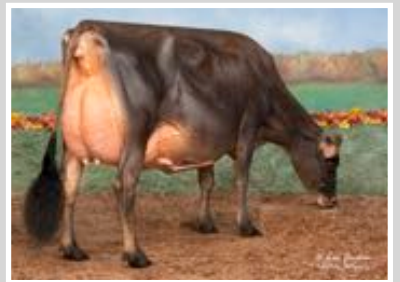
ELLIOTTS FIZZ CHARADE-ET Sister to the Dam of Lot 38