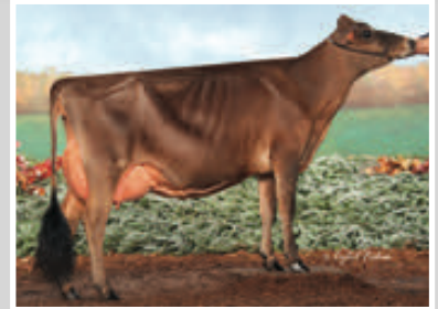
COWBELL VELOCITY BON JOUR Grandam of Lot 60

4TH DAM: COWBELL SOCRATES MADEMOISELLE 94% 7-03 305 2 22020 5.0 1110 3.4 740 96DCR 2556C