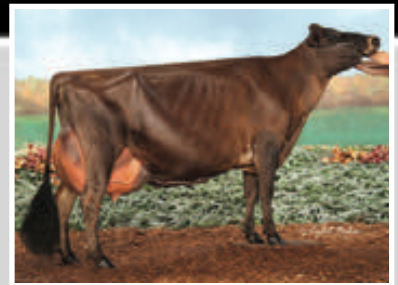
ARETHUSA TEQUILA VISION Grandam of Lot 18

SISTER(S): ARETHUSA KYROS VALORA 90% 6-09 305 2 13390 4.5 596 3.8 504 101DCR 1654C SUGAR & SPICE COLTON VIOLETA-ET 92% 3-06 301 2 17220 4.3 747 3.5 597 98DCR 2021C SUGAR & SPICE FIZZ VALLORY-ET 92% 4-05 299 2 19350 4.8 930 3.3 644 96DCR 2224C 6TH JR 2-YEAR-OLD, 2019 ALL AMERICAN RESERVE JUNIOR ALL AMERICAN JR 2-YEAR-OLD, 2019 SUGAR & SPICE FIREMAN VELOCITY-ET 86% SUGAR & SPICE FIREMAN VIOLET-ET 86% SUGAR & SPICE LH VIVIAN-ET 86% 2-08 303 2 17360 4.8 840 3.5 610 96DCR 2108C SUGAR & SPICE BRNBS VILLIAN-ET 91% 3-00 305 2 20860 5.4 1135 3.8 793 97DCR 2744C VIEWS CASINO VISIONARY-ET 90% 1-11 305 2 13740 4.3 592 3.7 507 55DCR 1651C SUGAR SPICE ANDREAS VALERIE-ET 85% SUGAR & SPICE VIP VIBRATO-ET 90% 2-00 280 3 15170 5.5 831 4.0 600 96DCR 2077C SUGAR & SPICE VIP VIOLIN-ET 87% KRULLCREST VIEWS VIENNA OF BSP-ET 88% KRULLCREST VIEWS VICTORIA OF BSP-ET 87% VIEWS CHOICE VANNA-ET 88%