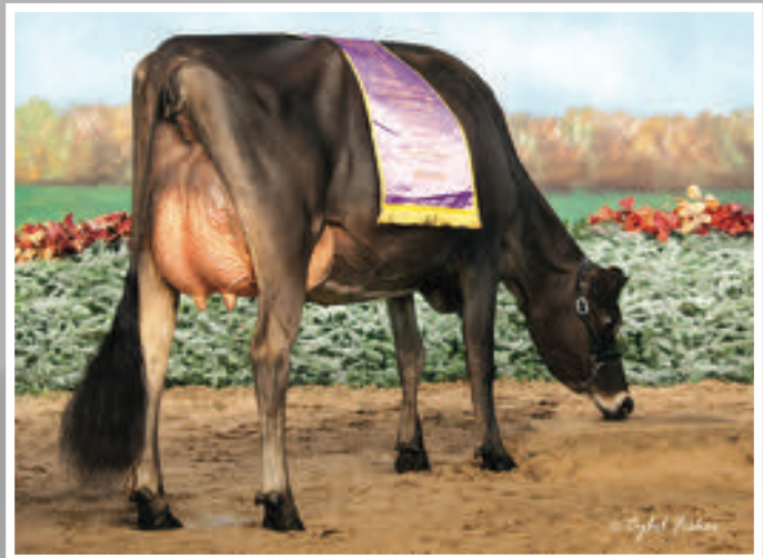
LLR TEQUILA EXCITEMENT, VG-89% Grandam of Lot 10