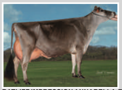
RATLIFF IMPRESSION ANNABELLA-ET Sister to the Dam of Lot 86