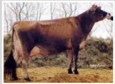
WF SAMBO BUNNY Fifth Dam of Lot 32