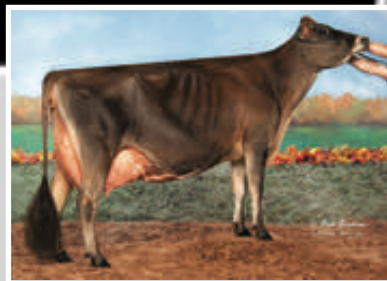
RATLIFF INDIANA CADENCE-ET Dam of the Embryo Carried by Lot 85