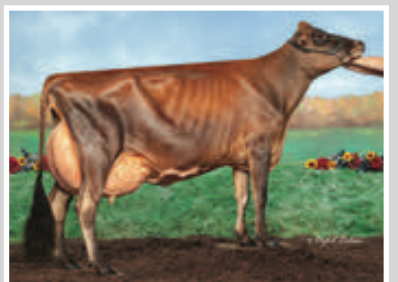
SUGAR & SPICE FIZZ VALLORY-ET Sister to the Grandam of Lot 18