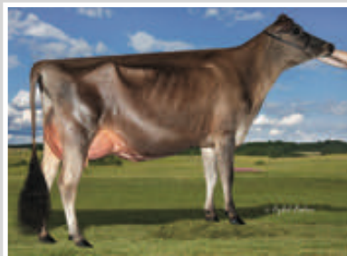
BIG GUNS ANDREAS VANISH-ET Sister to the Dam of Lot 47