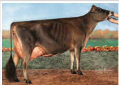
RATLIFF INDIANA CADENCE-ET Dam of Lot C

RATLIFF RUBEN CADENCE 89% 1-11 195 2 10630 5.0 527 3.5 371 83DCR 1282C