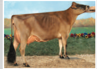
SSF BOEHEIM CANDACE Grandam of Lot 42

6TH DAM: SSF TOPTIN CHRISTINE 92% 8-11 305 2 20550 4.9 1008 3.2 648 99DCR 2236C