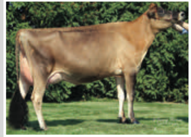
ARETHUSA RESPONSE VIEW-ET Grandam of Lot 20