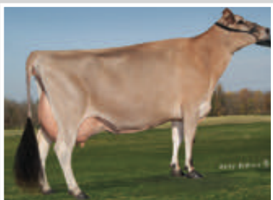
MAPLE LAWN IATOLA IVY Great-Grandam of Lot 23