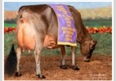
RANDOM LUCK SURPRISE ME Dam of Lot 30