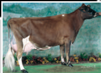
RATLIFF MISTER T PATCHES Fourth Dam of Lot 31

BORN 06/30/2022 PO FEMALE EFI 6.3% AMERICAN ID 1845/1845 PA -1822M -59F -54P -524CM$ -522NM$ -522FM$ -0.2PL 1.3DPR 1.9CCR 0.7HCR 3.17SCS PA TYPE 0.9 JPI 26%R -105