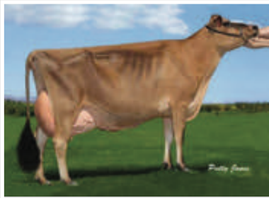
SHANTALS CGAR SHILOH-ET Fifth Dam of Lot 3