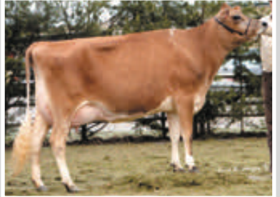
AVONLEA VALIANT KITTY 15N Sixth Dam of Lot 62