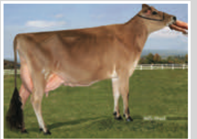
FAMILY HILL CONNECTION CHILLI-ET Great-Grandam of Lot 38