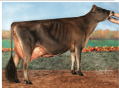
RATLIFF INDIANA CADENCE-ET Dam of the Embryo Carried by Lot 89

BORN 04/02/2018 BBR 100 DHIA HERD # 48-14-0191 CONTROL # 1535 FEMALE EFI 7.2% AMERICAN ID 1535/1535 JH1C JNSF 2-00 305 2 14870 6.3 937 4.5 675 93DCR 2341C 3-01 305 2 16850 6.4 1077 4.4 747 96DCR 2590C 4-01 292 2 18987 5.9 1116 4.3 823 RIP 305 2X ME AVG 2L 18400M 1146F 821P 2846C