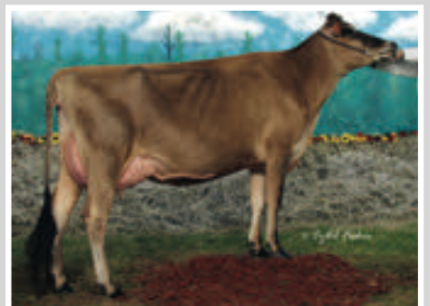
JULIANNAS DELUXE JUSTINE Fifth Dam of Lot 6