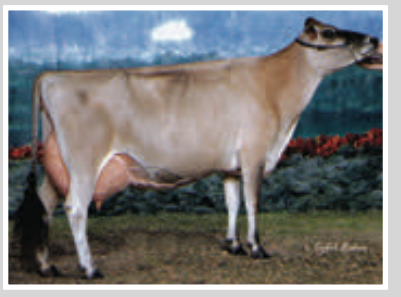
ROZEVIEV DORIE D RACHEL Fourth Dam of Lot 86