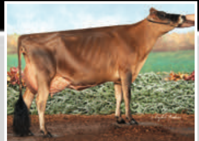
RATLIFF VELOCITY ALPHA-ET Grandam of Lot 78

SISTER(S): RATLIFF ACTION ANGEL 95% 7-01 305 2 24930 5.0 1250 3.4 855 96DCR 2954C RATLIFF SAMBO ASPEN-ET 93% 5-00 303 2 17310 4.9 849 3.7 649 98DCR 2245C RATLIFF AMADEO ACACIA-ET 92% 4-08 305 2 14080 5.0 705 3.5 496 98DCR 1714C RATLIFF TEQUILA AVELANCHE-ET 93% 3-09 305 2 23320 5.4 1270 3.7 857 95DCR 2964C RATLIFF IMPRESSION ANNIE-ET 92% 3-01 305 2 14790 4.8 714 3.6 528 95DCR 1825C RATLIFF IMPRESSION ARLENE-ET 92% 3-02 303 2 16760 5.7 952 4.0 675 94DCR 2337C RATLIFF IMPRESSION ANNABELLA-ET 95% 5-10 305 2 24160 5.3 1278 3.6 876 96DCR 3029C RATLIFF SAMBO APACHE-ET 93% RATLIFF SAMBO ANN-ET 93% RATLIFF EXCITATION ALMIRA-ET 92% RATLIFF DUALLY ATLEE-ET 95% 5-01 305 2 18590 5.3 976 4.1 766 96DCR 2627C