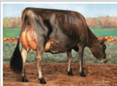
RIVER VALLEY EXCITATION FLAWLESS-ET Same Family as Lot 39

BORN 06/08/2022 PO BBR 100 FEMALE EFI 4.6% AMERICAN ID 19666/19666 JH1F JNSF