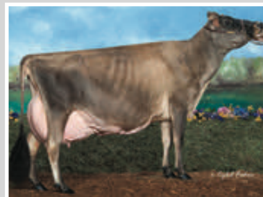
HURONIA CENTURION VERONICA 20J Great-Grandam of Lot 94