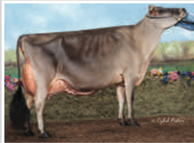
EXTREME ELECTRA Fifth Dam of Lot 27

BORN 09/01/2022 P1 BBR 100 FEMALE EFI 7.1% AMERICAN ID 20605/20605 JH1F JNSF CDCB GPTA S 04/01/2023 ORECS 73%R 16%ILE -1403M 0.26% -16F 0.09% -33P -137CM$ -143NM$ -187FM$ 1.4PL 0.3LIV 2.2DPR 3.0CCR 1.3HCR 2.96SCS -124GM$ 0.0MFV 0.0DAB -0.3KET 2.3MAS 0.6MET 0.3RPL 4.03HTI AJCA 04/01/2023 GPTAT 77%R 1.3 GJUI 13.0 GJPI 71%R -18