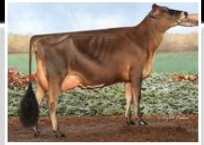
ELLIOTTS AJ CHICAGO-ET Dam of Lot 38