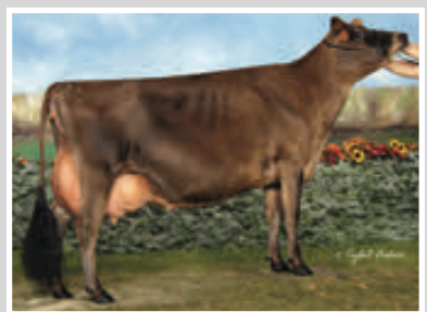
ARETHUSA PRIMETIME DEJA VU-ET Great-Grandam of Lot B