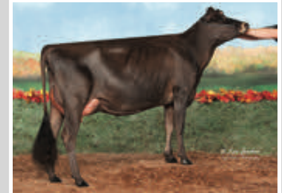
RATLIFF LO LALALA DANCER-ET Dam of Lot A

SISTER(S): RATLIFF SAMBO DESTINY-ET 91% 5-09 305 2 16310 5.7 935 3.8 614 97DCR 2124C RATLIFF SAMBO DEMI-ET 92% 2-11 305 2 19330 5.4 1050 3.6 696 96DCR 2406C RATLIFF ACTION DEVA-ET 91% 5-04 280 2 15960 5.2 823 3.5 553 93DCR 1911C RATLIFF SAMBO DYNASTY-ET 93% 5-03 305 2 16740 5.3 885 3.3 546 70DCR 1885C RATLIFF SAMBO DREAM-ET 94% 5-09 305 2 19230 5.4 1046 3.9 749 96DCR 2592C RATLIFF ACTION DAZZLE-ET 93% 3-08 305 2 20000 4.1 811 3.8 756 102DCR 2349C RATLIFF SAMBO DAPHNE-ET 95% 5-06 305 2 22550 6.2 1405 3.7 826 96DCR 2857C RATLIFF SAMBO DENALI-ET 94% 5-07 305 2 24340 4.8 1176 3.9 949 96DCR 3201C RATLIFF ACTION DIAMONDS & BLING-ET 95% 5-05 305 2 26720 5.2 1399 4.0 1060 95DCR 3670C RATLIFF ACTION DABBLE-ET 94% 6-04 305 2 23670 5.2 1229 3.5 833 97DCR 2879C RATLIFF IMPRESSION DIRTY-ET 92% 6-07 305 2 19930 5.4 1069 3.7 729 96DCR 2521C RATLIFF IMPRESSION DANCER-ET 91% 2-02 270 2 16190 4.9 799 3.5 561 86DCR 1938C RATLIFF IMPRESSION DONNER-ET 93% 5-04 305 2 23340 6.3 1470 3.9 900 96DCR 3115C RATLIFF IMPRESSION DULCE-ET 92% 2-02 305 2 14880 6.3 938 3.9 574 93DCR 1986C RATLIFF SAMBO DOODLE-ET 91% 3-10 305 2 19180 5.7 1094 3.7 711 90DCR 2459C RATLIFF COLTON DIZA-ET 92% 3-00 305 2 19340 5.4 1048 3.8 744 89DCR 2575C RATLIFF COLTON DARIEN-ET 93% 4-00 305 2 13780 5.4 750 3.9 532 98DCR 1841C