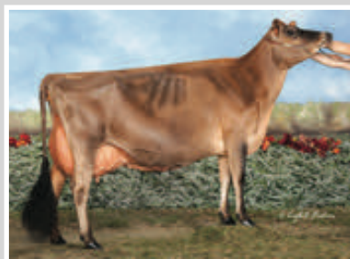
MILO VINDICATION SEASON-ET Grandam of Lot 75