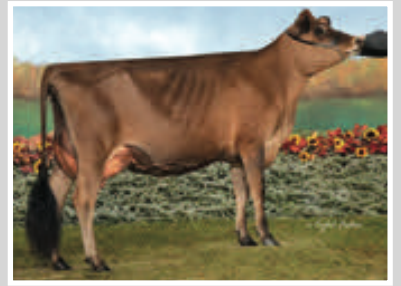
SCHULTE BROS COLTON CECILA-ET Full Sister to Lot 22