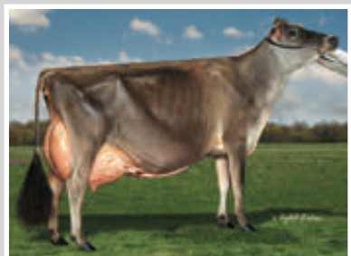
ARETHUSA HG VICTORIA-ET Sister to the Grandam of Lot 37