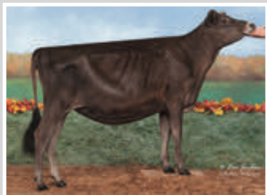
SCHULTE BROS COLTON FERGALICIOUS-ET Full Sister to Lot 17