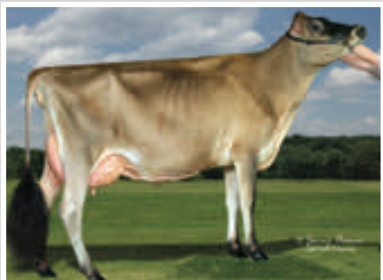
ARETHUSA COMETS CAPRI Sister to the Dam of Lot 19