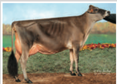
SPATZ APPLEJACK BAYLEE Grandam of Lot 59

BRED: 10/06/2022 DUE: 07/12/2023 TO MM BONTINO ROCK & ROLL-ET JE840003239149361 BBR 100 JH1F JNSF A1A2 CDCB GPTA S 04/01/2023 0%RIP 77%R -1077M 0.27% 2F 4%ILE 77%R 0.12% -15P -154CM$ -162NM$ -240FM$ -175GM$ -1.4PL -0.3LIV -1.1DPR -0.4CCR 0.1HCR 3.08SCS 0.0MFV 0.1DAB -0.1KET 0.0MAS 0.8MET 0.3RPL 0.79HTI AJCA 04/01/2023 ODAUS GPTAT 79%R 1.1 GJUI 10.2 GJPI 74%R -29 FALL YEARLING