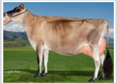
SOUTH MOUNTAIN COLTON JOSIE-ET Sister to the Grandam of Lot 6