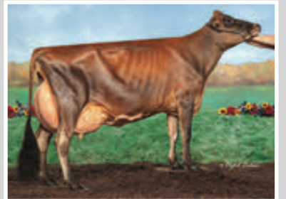
SUGAR & SPICE FIZZ VALLORY-ET Sister to the Dam of Lot 50

4TH DAM: GENESIS RENAISSANCE VIVIANNE VG 87 (CAN) 5-00 305 2 12110 4.2 514 3.8 461 CAN 1464C 7 STAR BROOD COW IN CANADA, SEPTEMBER 2012