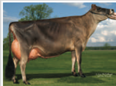
RATLIFF SAMBO DREAM-ET Sister to the Grandam of Lot 67