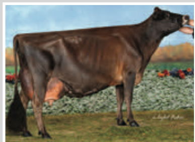
RATLIFF MINISTER PORSCHA-ET Great-Grandam of Lot 31

PPA -3995M -159F -111P / YD -4043M -177F -133P CDCB PTA 04/01/2023 1RECS 42%R 4%ILE -1869M 0.19% -54F 0.11% -48P -504CM$ -505NM$ -536FM$ -0.7PL 0.3LIV 2.2DPR 2.1CCR 0.2HCR 3.20SCS -472GM$ -0.1MFV 0.0DAB 0.0KET 0.5MAS 0.8MET 0.3RPL 0.34HTI PA TYPE 0.7 JUI JPI 31%R -91