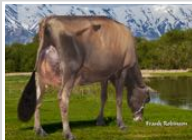
SVHEATHS ANDREAS CAMERON Sister to the Dam of Lot 35