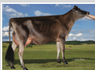
BIG GUNS ANDREAS VICTORY-ET Sister to the Dam of Lot 47

BORN 03/05/2022 PO FEMALE EFI 5.4% AMERICAN ID 86/86