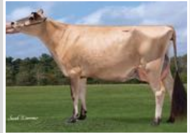
PAGE-CREST IMPRESSION KALLIE Sister to the Grandam of Lot 62