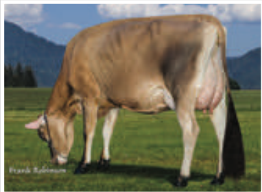
SUNSET CANYON VALEN L MAID 42481-ET Grandam of Lot 21

SISTER(S): SUNSET CANYON CENTURION L MAID 2-ET 94% 5-09 305 2 17730 5.8 1028 3.7 662 97DCR 2290C SUNSET CANYON LEGION L MAID 90% 5-06 305 2 21520 5.3 1139 3.7 797 98DCR 2757C SUNSET CANYON IMPULS L MAID 1-ET 92% 4-08 305 2 20230 5.9 1187 4.1 828 98DCR 2868C SUNSET CANYON IMPULS L MAID 4-ET 91% 3-11 305 2 22730 5.8 1310 3.7 847 95DCR 2930C SUNSET CANYON NAVARA LEMVIG MAID-ET 91% 5-02 305 2 18310 5.8 1054 3.9 714 98DCR 2471C SUNSET CANYON NAVARA LV MAID 1-ET 90% 5-00 305 3 19980 6.0 1193 4.0 804 102DCR 2784C SUNSET CANYON NAVARA LV MAID 2-ET 90% 4-00 305 2 21240 6.3 1336 4.2 887 98DCR 3073C SUNSET CANYON NAVARA LV MAID 3-ET 90% 4-03 305 2 21670 5.6 1210 3.8 827 98DCR 2862C SUNSET CANYON NAVARA LV MAID 4-ET 91% 3-04 305 2 20870 6.3 1310 4.0 845 83DCR 2926C SUNSET CANYON VALENTINO L MAID-ET 90% 4-08 300 3 23340 5.1 1197 3.8 892 104DCR 3087C SUNSET CANYON TOPEKA MAID 40683-ET 91% 5-01 305 3 23950 5.3 1262 3.8 907 95DCR 3138C SUNSET CANYON MRCHNT MAID 40766-ET 91% 4-05 305 2 23310 5.8 1343 3.9 907 97DCR 3139C SUNSET CANYON PLUS MAID 40991 {6}-ET 91% 3-03 305 2 18620 6.2 1154 3.9 725 96DCR 2509C SUNSET CANYON VALEN MAID MINNIE-ET 90% 4-02 305 3 20860 5.3 1108 4.0 824 96DCR 2853C