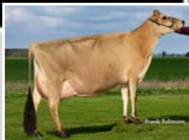
ARETHUSA PREMIER STARLIGHT-ET Dam of Lot 75