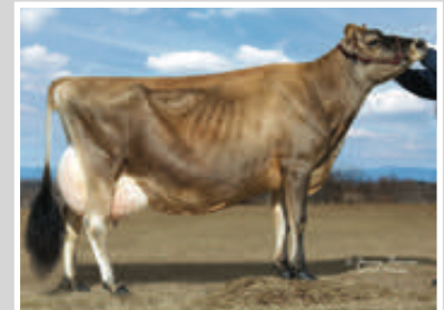
BILLINGS LS BOO BOO Grandam of Lot 68