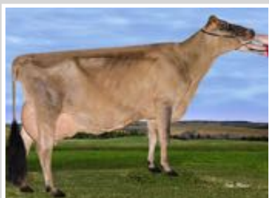
MUSQIE IATOLA VIXXS Grandam of Lot 45

BORN 03/23/2022 PO BBR 100 FEMALE EFI 7.5% AMERICAN ID 18848/18848 JH1F JNSF