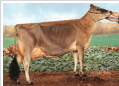
STONEY POINT COMERICA KATHIE Dam of Lot 13

BORN 10/10/2022 PO BBR 100 FEMALE EFI 5.8% AMERICAN ID 69883/69883 JH1C JNSF