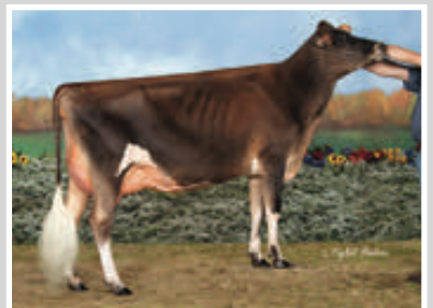
SOUTH MOUNTAIN TEQUILA JEM Great-Grandam of Lot 6