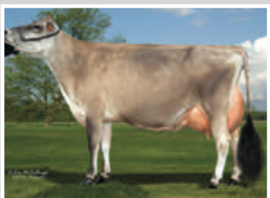
RATLIFF JADE CHELSEA-ET Sister to the Grandam of Lot C