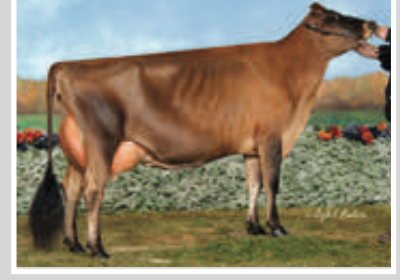
BJ TEQUILA MOPSY-ET, E-95% From the Same Family as Lot 26