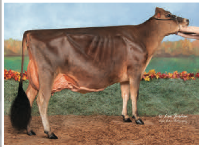
RATLIFF LADD VICKI, E-91% Dam of Lot 7