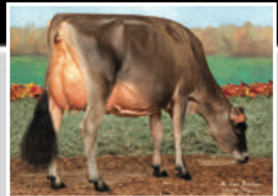
SPATZ APPLEJACK BAYLEE Dam of Lot 56

6TH DAM: JRS VOLUNTEER BRITANI 93% RESERVE ALL AMERICAN 5-YEAR-OLD, 1991 8-05 305 2 18940 4.5 846 3.8 716 98DCR 2348C