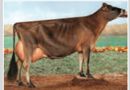
K&M TEQUILA GALALEE-ET Grandam of Lot 64