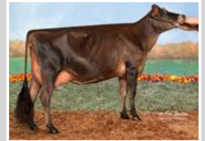
RATLIFF MONEY DELIRIOUS Sister to the Dam of Lot 28