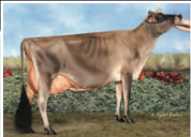
ARETHUSA VERONICAS COMET Granddam of Lot 66