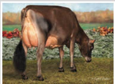
RATLIFF APPLEJACK PENNY Sister to the Grandam of Lot 31