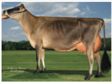
ELECTRAS ENCHANTING-ET Fourth Dam of Lot 27