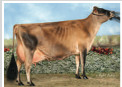
HURONIA CENTURION VERONICA 20J Great-Grandam of Lot 90