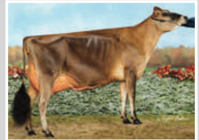
BILLINGS IMPRESSION OF BOOBOO-ET Dam of Lot 68

NEXT DAM: BILLINGS BERRETTA BREEZY 92% 5-10 305 2 17180 5.4 935 3.9 671 100DCR 2322C SIRE: MASON BOOMER SOONER BERRETTA {6} GJPI -67 2%ILE 4TH DAM: BREEZY HILL LESTER BREW 91% 5-02 305 2 13750 5.3 723 4.1 569 DHIR 1853C