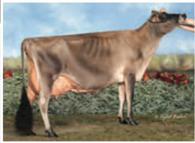
ARETHUSA VERONICAS COMET Grandam of Lot 19