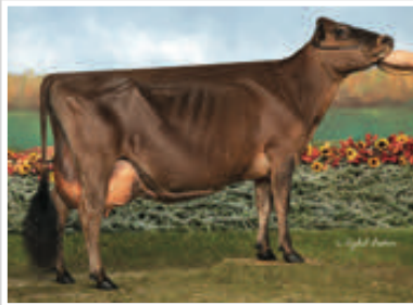
KASH-IN FEARLESS LADY {4} Dam of Lot 5

BORN 12/18/2022 P1 BBR 100 FEMALE EFI 6.8% AMERICAN ID 70454/70454 JH1F JNSF