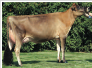
ARETHUSA RESPONSE VIEW-ET Great-Grandam of Lot 61