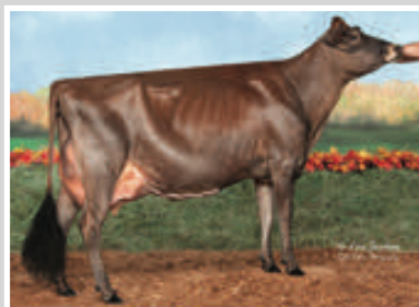
BIG GUNS ANDREAS VEGAS BOMB-ET Sister to the Dam of Lot 47