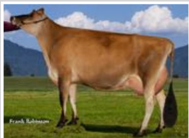
L'ORMIERE TEQUILA ROXE Dam of Lot 71