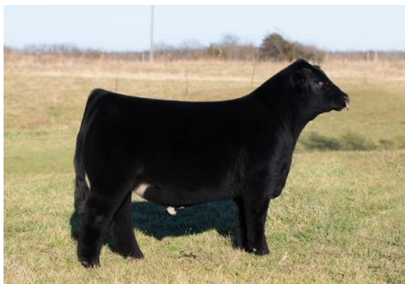
RATLIFF JUMPSTART 340J ET