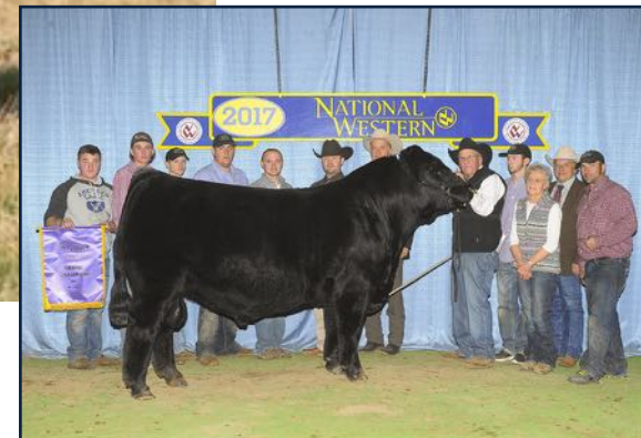
TASF CROWN ROYAL 960C ET