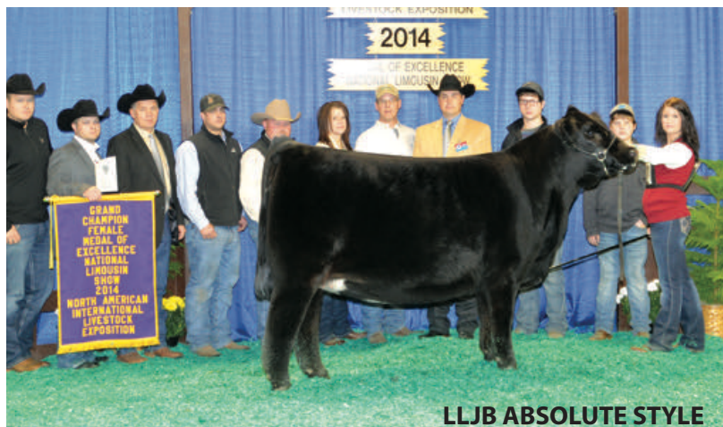
LLJB ABSOLUTE STYLE