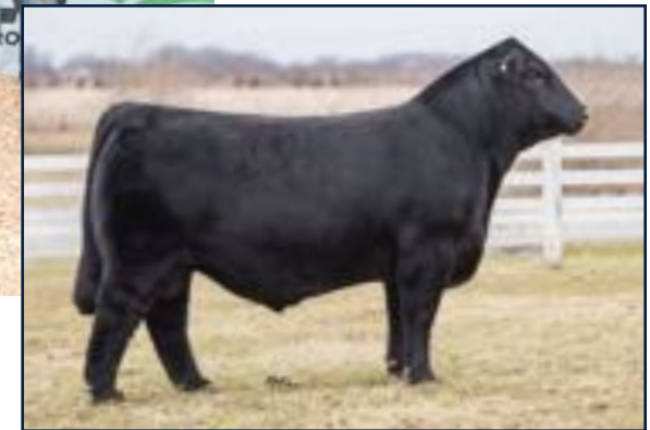
FWLY CAN DO