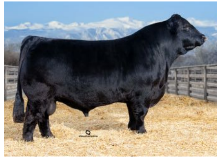
ELCX KINGS LANDING 599 D ET