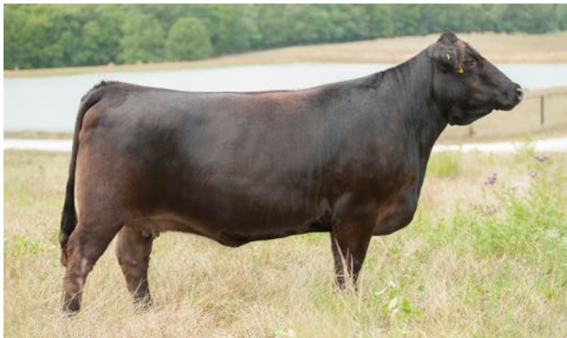
WLR UGLY BETTY 432U