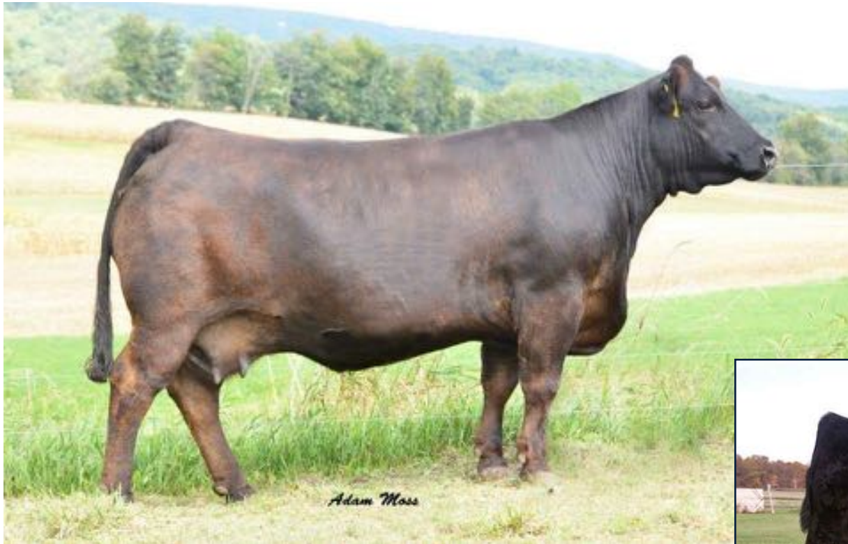
TYEJ DB SERENITY