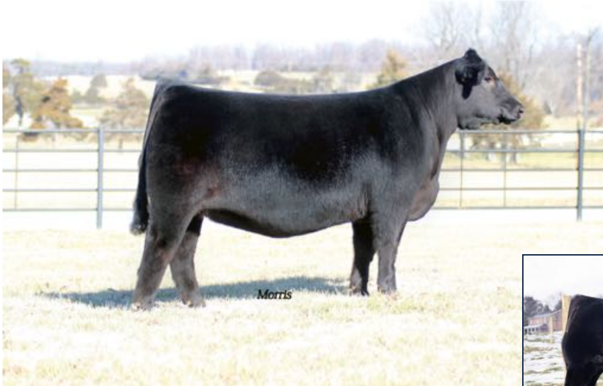
AUTO BLISS 265Y