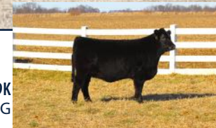
ATAK 4039K FULL SIBLING TO MATING