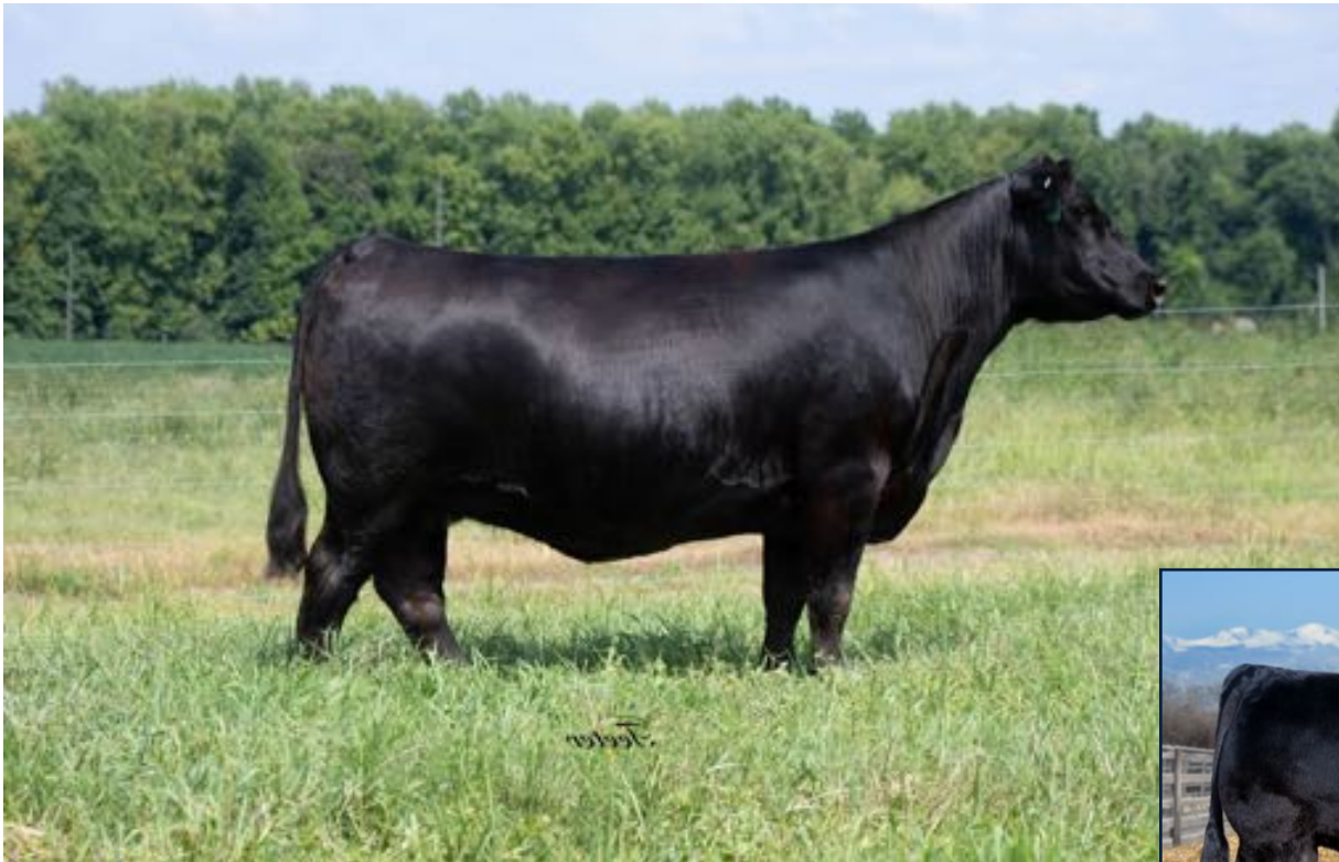
ELCX EXTRA SHOT 702E ET