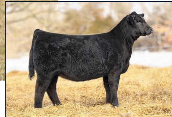
KLS SULL CHARMER ET