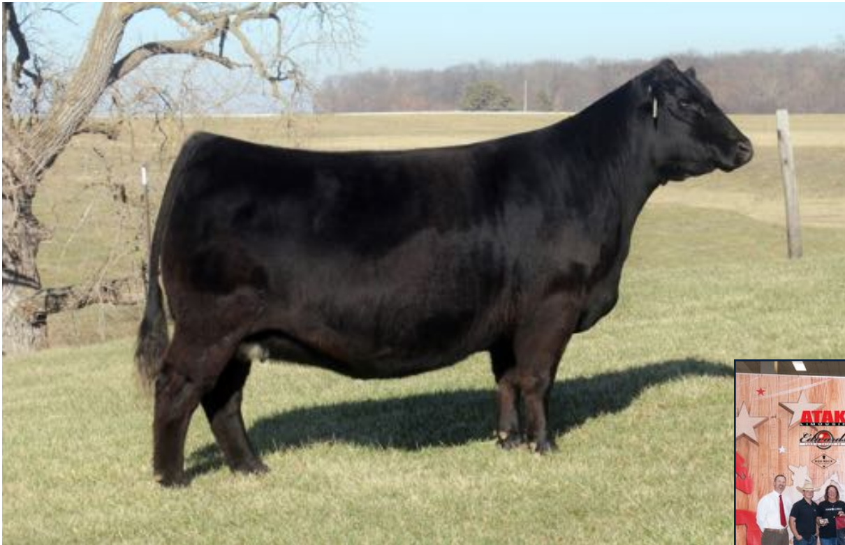
LMCC SCOTCH CAP 168F ET