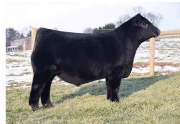
TASF HEINEKEN 405H ET