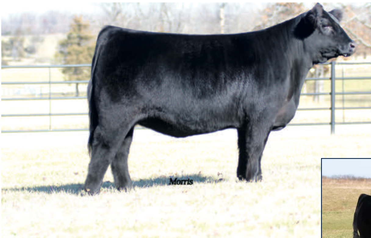
AUTO POEM 273Y