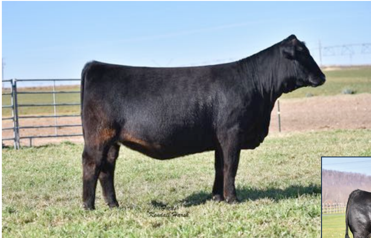
LFL ELEANOR 7103E ET