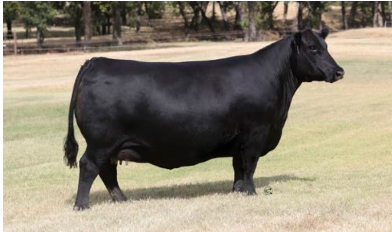
CONLEY SANDY 7530

GUARANTEE MIN 6, MAX 10 BUYER PAYS FLUSH EXP