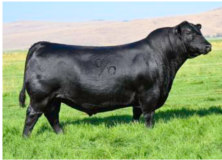
COLEMAN GLACIER 041