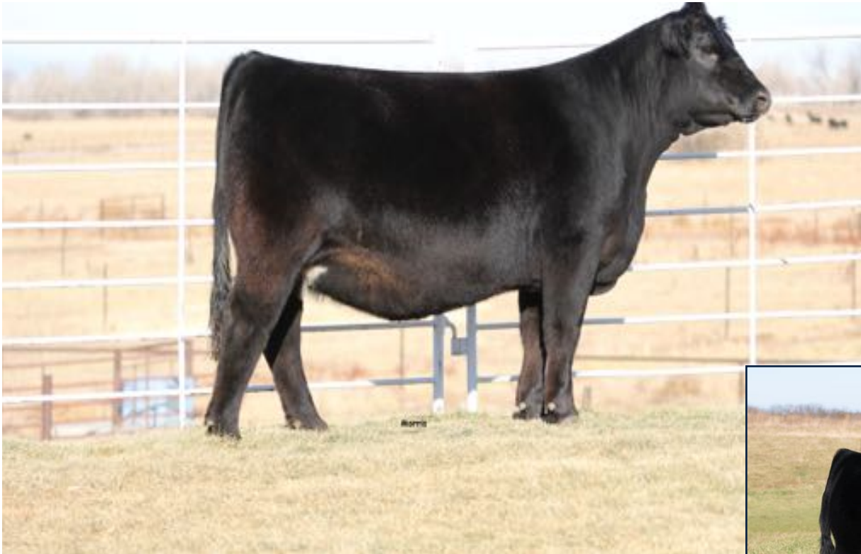
MAGS HEMERA 1641H ET