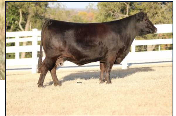
HBRL COVERIGRL 563C ET