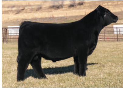
KLS SULL CHARMER ET

GUARANTEE MIN 6, MAX 10 BUYER PAYS FLUSH EXP