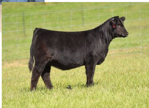
ELCX 332K Daughter of ELCX Extra Special 701E ET

GUARANTEE MIN 6, MAX 10 BUYER PAYS FLUSH EXP