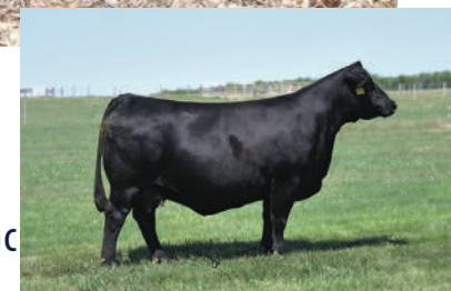
WULFS CARRIEANN 5201C

This elite Homo Polled Homo Black Purebred female comes from the heart of the Wulf Cattle ET Program, this elite member of their donor battery has produced embryos that have been shipped internationally. She is the dam of WULFS Future 5201F, a sire that has been heavily utilized with the Wulf program due to his ability to transmit many industry-relevant traits, such as growth, carcass merit, and feed efficiency. This summer a daughter of WULFS Future 5201F sold as the top-selling live lot in the 2022 Sale of Sales. WULFS Carrieann 5201C is a daughter of the heavily used WULFS Willard, making this donor a paternal sister the $70,000 WULFS Compliant K687C. On paper, this donor is a breed leader. She ranks in the top 2% for weaning weight, top 3% for yearling weight, top 15% for stayability, top 20% for docility, and top 25% for mainstream terminal index. If you're in the market to produce black purebred Limousin seedstock that is phenotypically elite, and industry relevant, make sure to have this lot on your shortlist sale day!