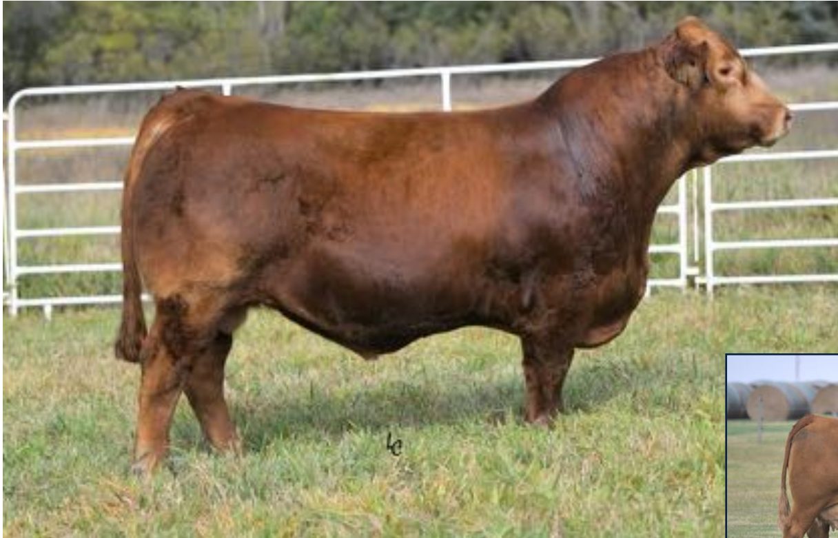
WULFS HICKOK 7056H

OFFERED BY WULF CATTLE/ L7 BAR LIMOUSIN /RUNNING CREEK RANCH