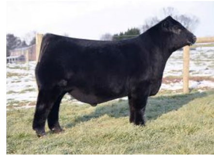
TASF HEINEKEN 405H ET