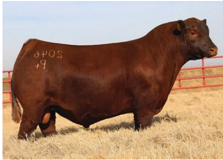
DUFF HD 2046