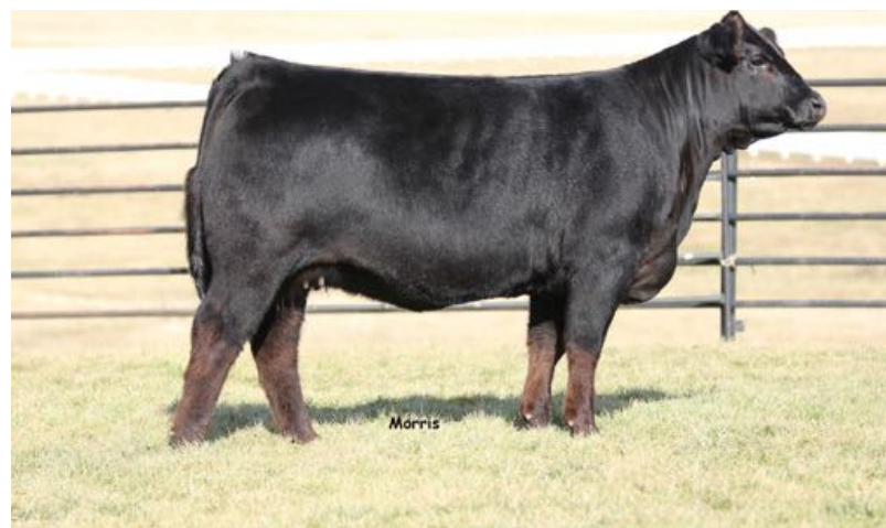
AUTO LUCKY III 210B