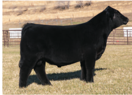
KLS SULL CHARMER ET