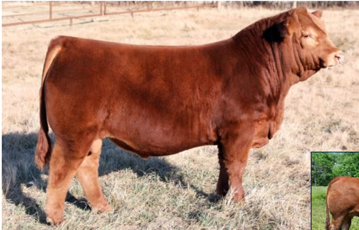
GREENWOOD COMMITMENT 705K