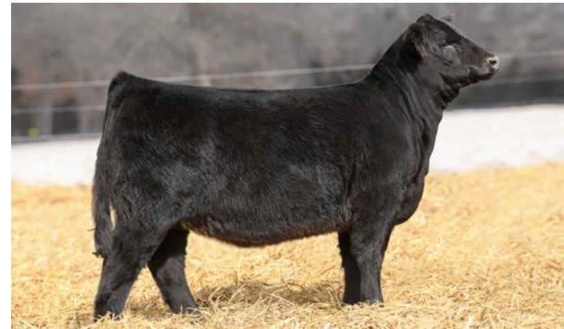
AUTO HIPE ET