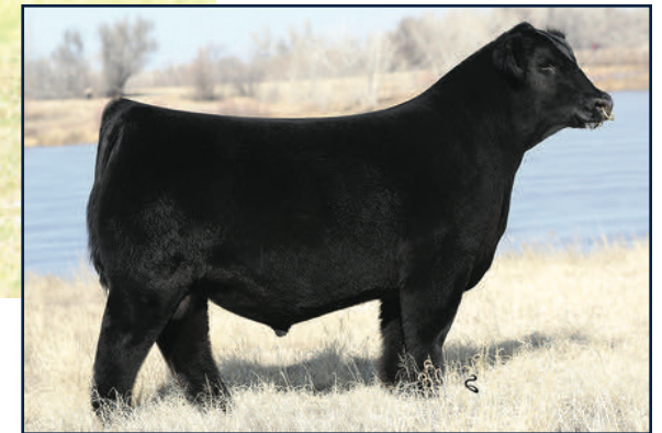
GATEWAY FOLLOW ME F163