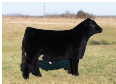
RATLIFF JUMP START 340 J ET