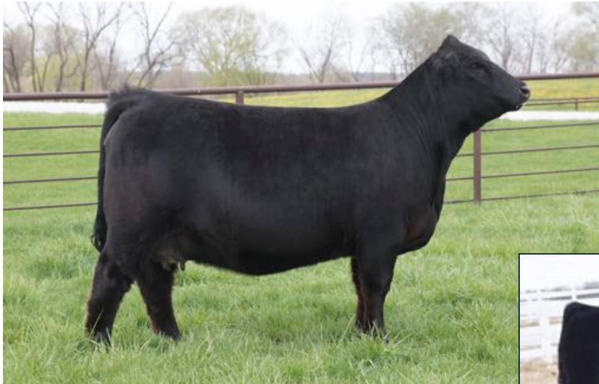
CELL 5065C ET