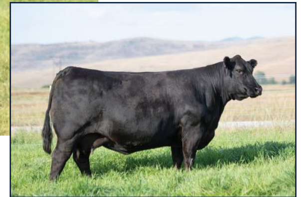
COLE MISS PRODUCTION 104Y