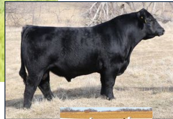
DEBV GLADIATOR 917G