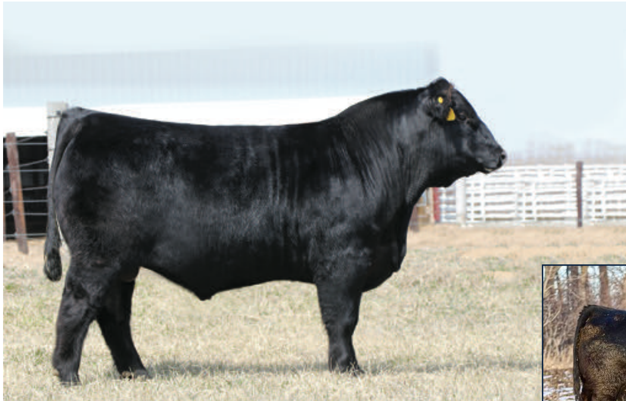
CELL ENVISION 7023E