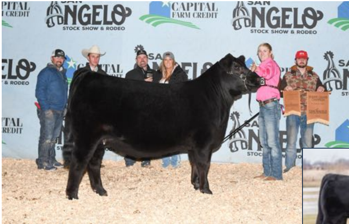
SSTO HIPPIE CHIC 0807H ET