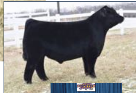
MRRC LEGAL 441E E