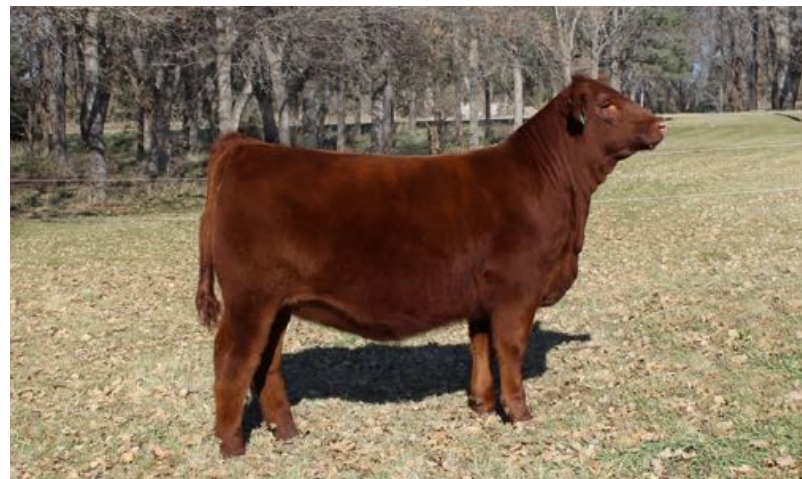
WULFS HARD CIDER 0028H

BULL OF BUYERS CHOICE. GUARANTEE OF 6 MAX OF 10 EMBRYOS. BUYER PAYS FLUSH EXPENSITURE