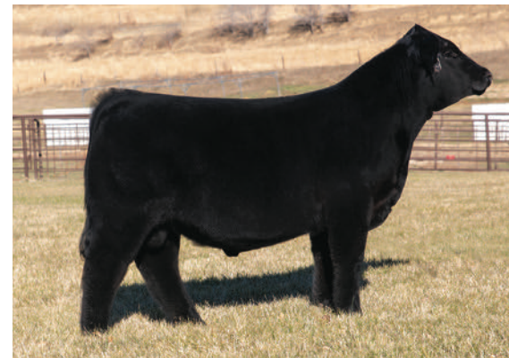
KLS SULL CHAMER ER