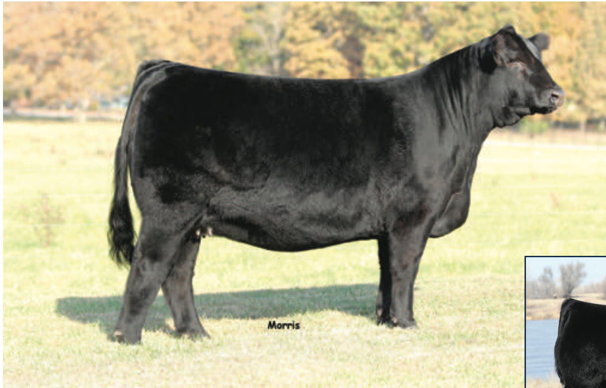
AUTO USUALLY YOURS 290A