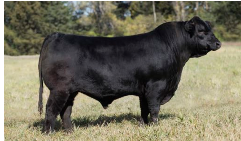
WULFS EISENHOWER 3616E