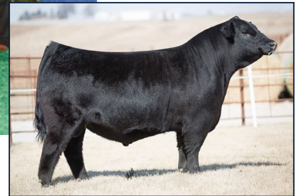
TGM COMPTON 1738