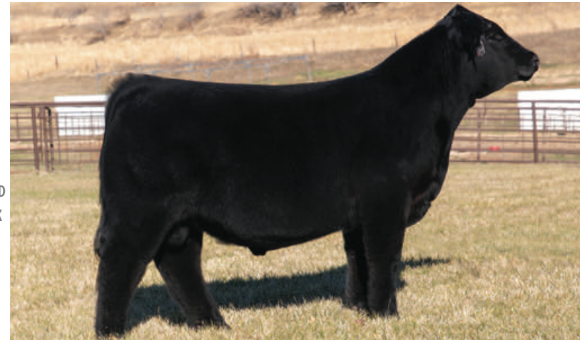
KLS SULL CHARMER ET