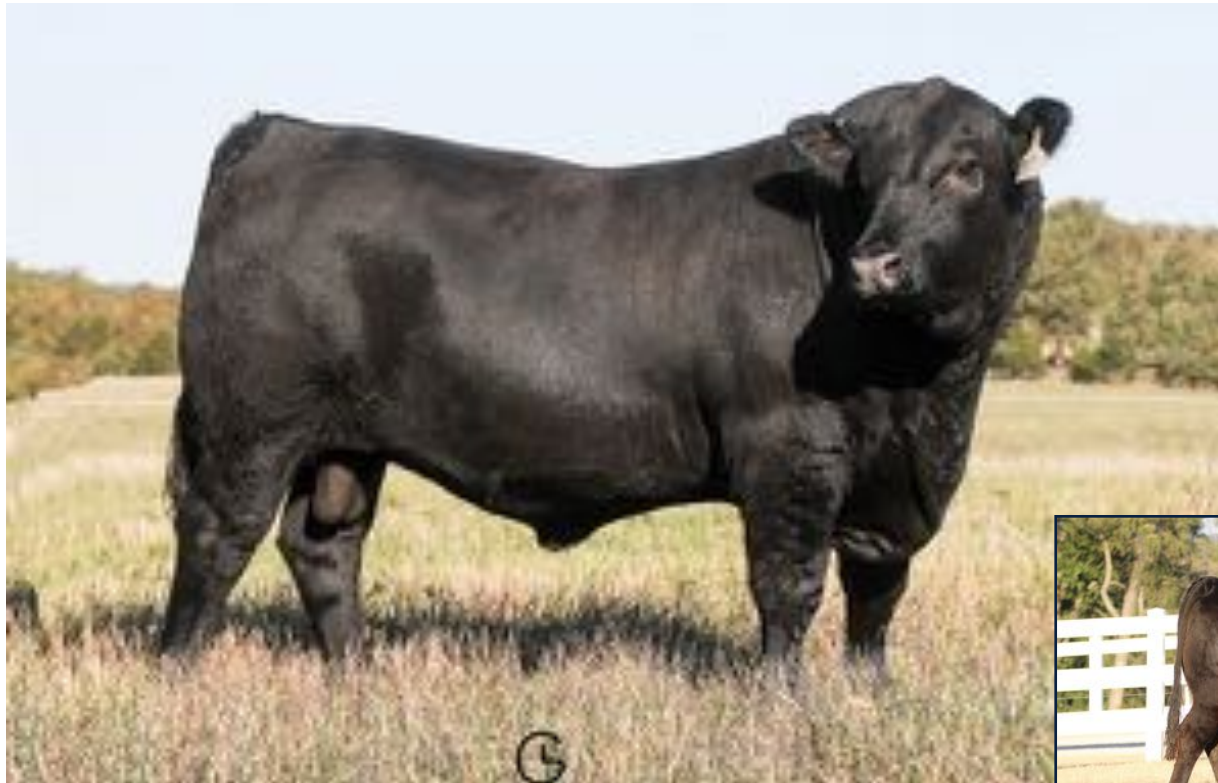
HBRL GATEWAY 9511G

OFFERED BY MAGNESS LAND AND CATTLE/BUCKRIDGE