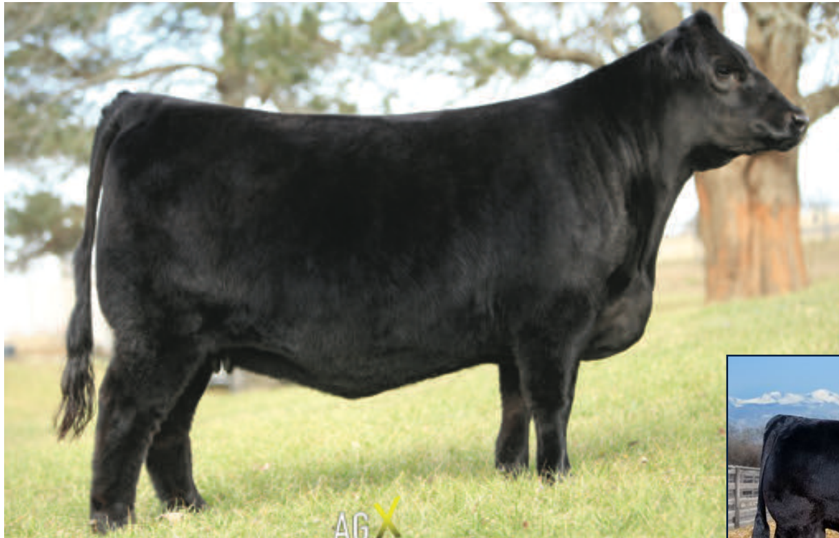
ELCX ELEVATE 684E ET