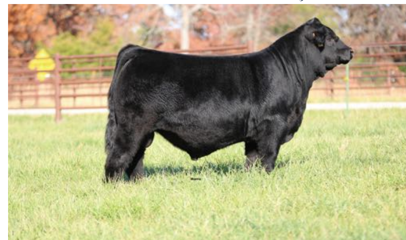
LDIL JUST RIGHT 128J ET