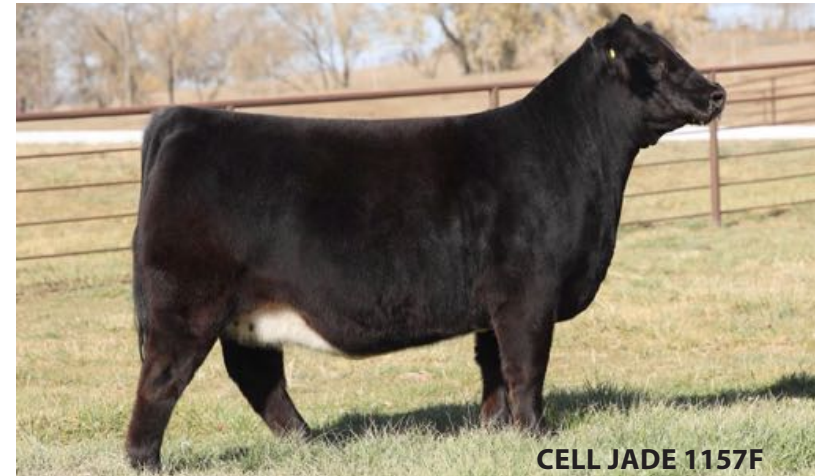
CELL JADE 1157F

GUARANTEE MIN 6, MAX 10 BUYER PAYS FLUSH EXP