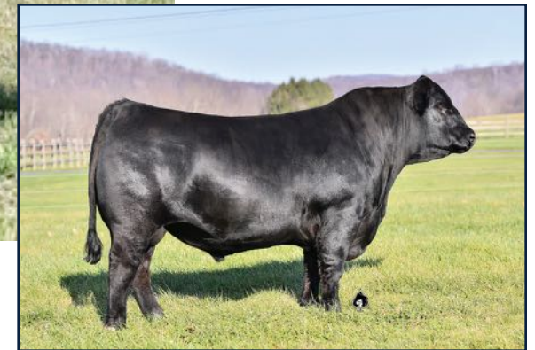
COLE GENESIS 86G