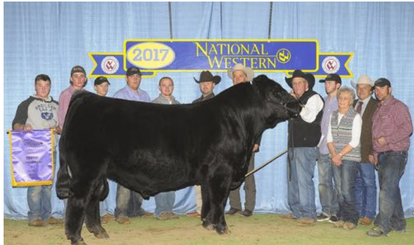
TASF CROWN ROYAL 960C ET