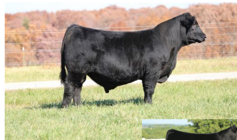
LDIL JUKEBOX 105J ET