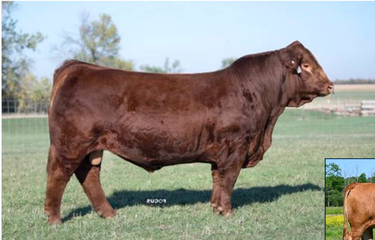
WULFS JOHN WAYNE H915J