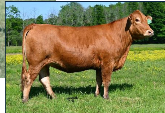
GBBL ROYAL DEBONNAIRE 208D