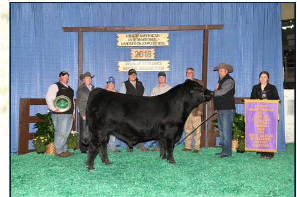
HWCB EYE OF THE STORM 406E