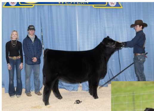
ELCX JACKIE O Daughter of ELCX Extra Special 701E ET