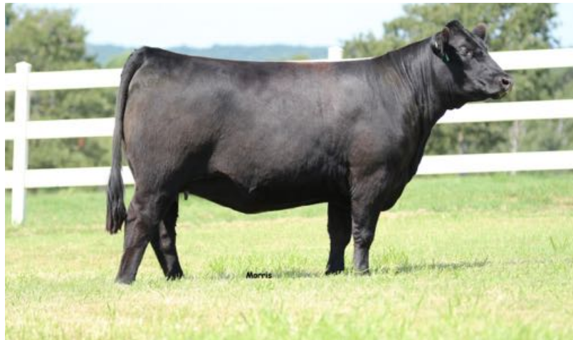
PBRS 5136C ET