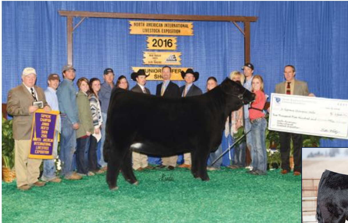
RIVERSTONED CHARMED MATERNAL SISTER TO OFFERING