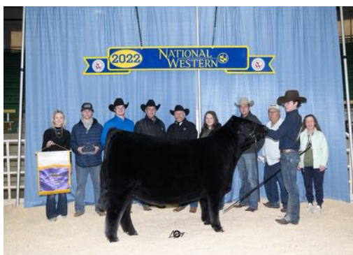
SEEE HOCUS POCUS FULL SIBLING TO MATING OFFERED

EXAR UPSHOT 0562B EXAR ROYAL LASS 1067 DHVO DEUCE 132R MAGS RUFFLES KRVN NASKAR 013N MAGS NIGHT AMBUSH LESF ASPHALT 9N TYEJ DB SIZZLE