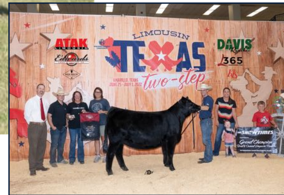
RESH SCOTCHCAP 133J CHAMPION B&O 2022 JR NATIONALS FULL SIBLING TO OFFERING