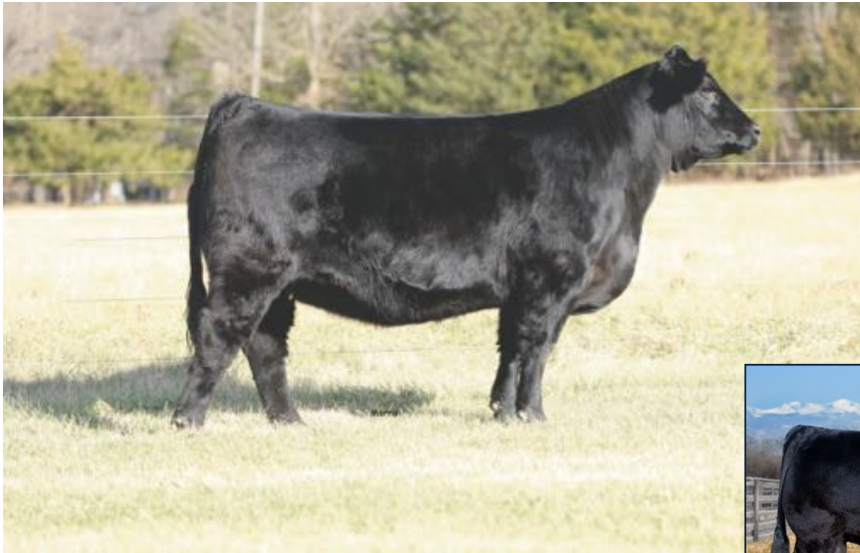
AUTO SOLO 419E ET