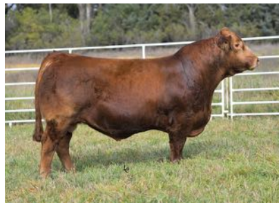
WULFS HICKOCK 7056H