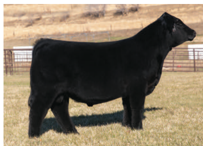
KLS SULL CHARMER ET