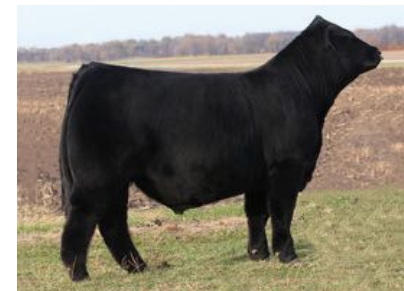
SSTO GUNS N ROSES 9408G ET