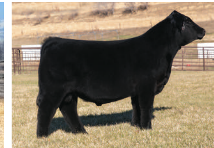
KLS SULL CHARMER ET