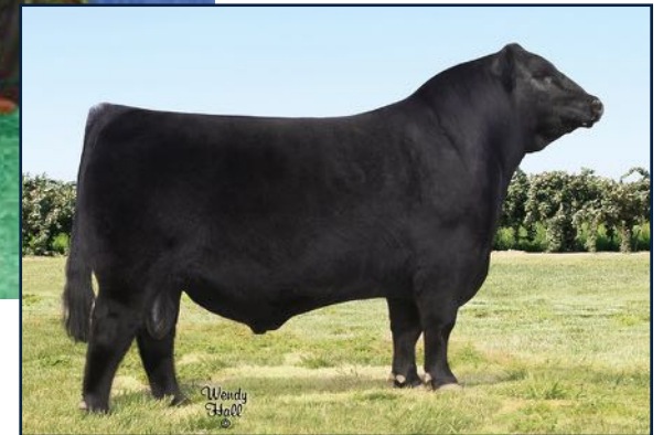
SILVEIRAS STYLE 9303