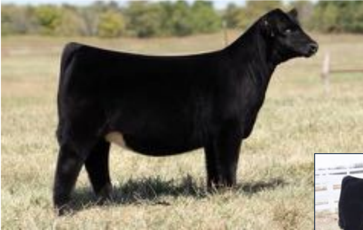
MAYC GOLD BUCKLE 624G DAUGHTER