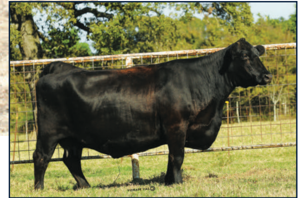
BOHI RED ROBIN 282R