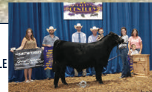
MAYC GOLD BUCKLE

MAYC Gold Buckle 624G was crowned Champion Bull at the 2020 North American International Livestock Exposition and Reserve Champion Bull at the 2020 American Royal. Admire him for his eye-catching rib dimension, bone, and structural correctness. This phenotypic comes from his winning lineage sired by MRRC Legal 441E, a son of Colburn Primo 5153 out of the one and only Riverstone Charmed 50C needs no introduction- she is the "Larissa" Ratliff show heifer that will go down in history as one of the greatest show females of all time. Not only did she make her mark during her storied show career, she is now generating progeny that command top dollar and completely dominate any arena they walk into. MAYC Gold Buckle 624G dam is the great FWLY Purple Ribbon who had an outstanding show career racking up banners everywhere she went. Don't miss this exclusive opportunity to breed greatness with MAYC Gold Buckle!