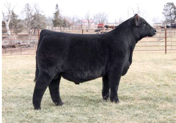
CELL KEYSTONE 221K ET