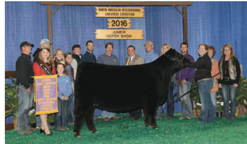
KDJ QUEEN RUTH 502

UDE Queen Ruth 9044 is a unique and powerful breeding piece that is sired by the $450,000 Coleman Bravo 6313, one of the most phenotypically eye-appealing bulls in the Angus breed that is backed by the famed Donna cow family. Her dam is the highly productive KDJ Queen Ruth 502 donor, this daughter of the ever-popular PVF Insight 0129 was the 2021 Roll of Victory Show Dam of the year. We purchased this elite donor from the 2019 Udell Cattle Co. production sale where this female and her maternal siblings led off the prestigious event. We admired this individual for her tremendous amount of center body dimension, genuine base width and brood cow look. A female of this quality and lineage has the potential to make exceptional Lim-Flex breeding stock.