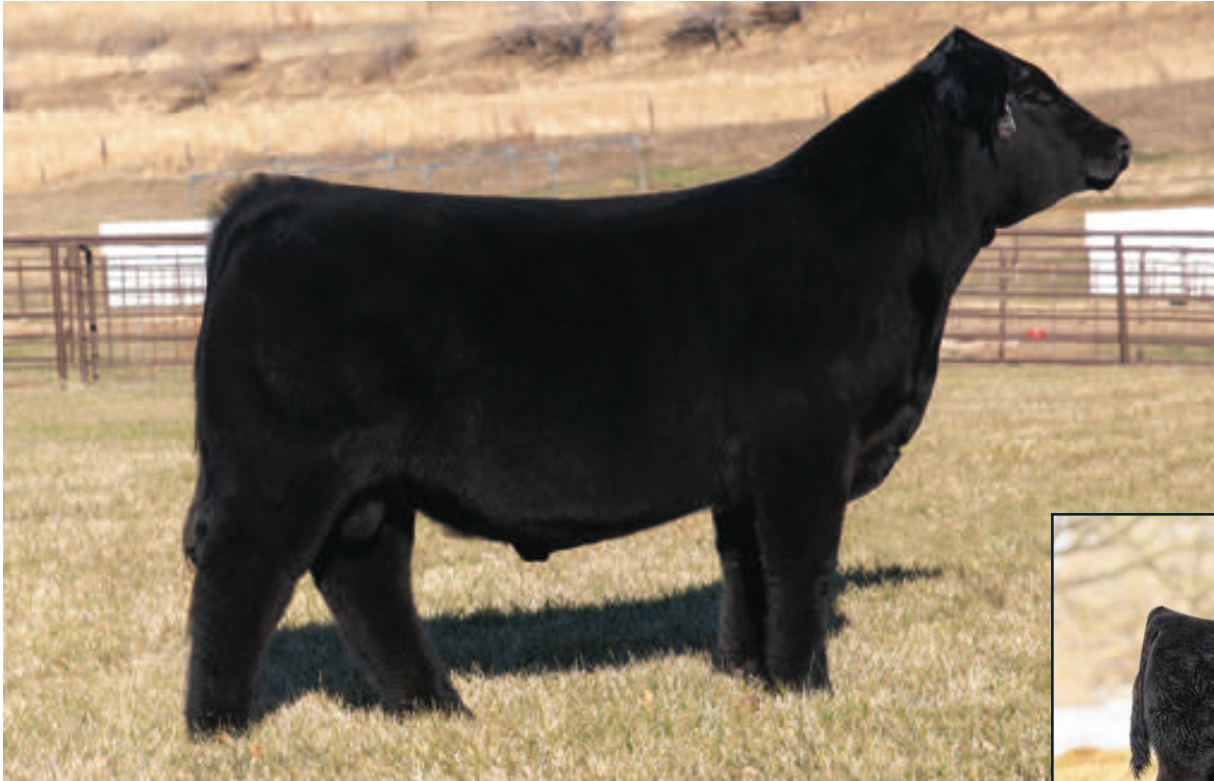
AUTO HARBOR ET