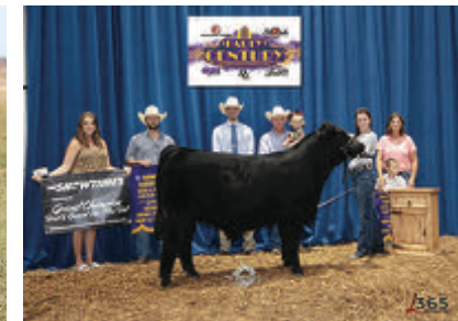
MAYC GOLD BUCKLE 624G