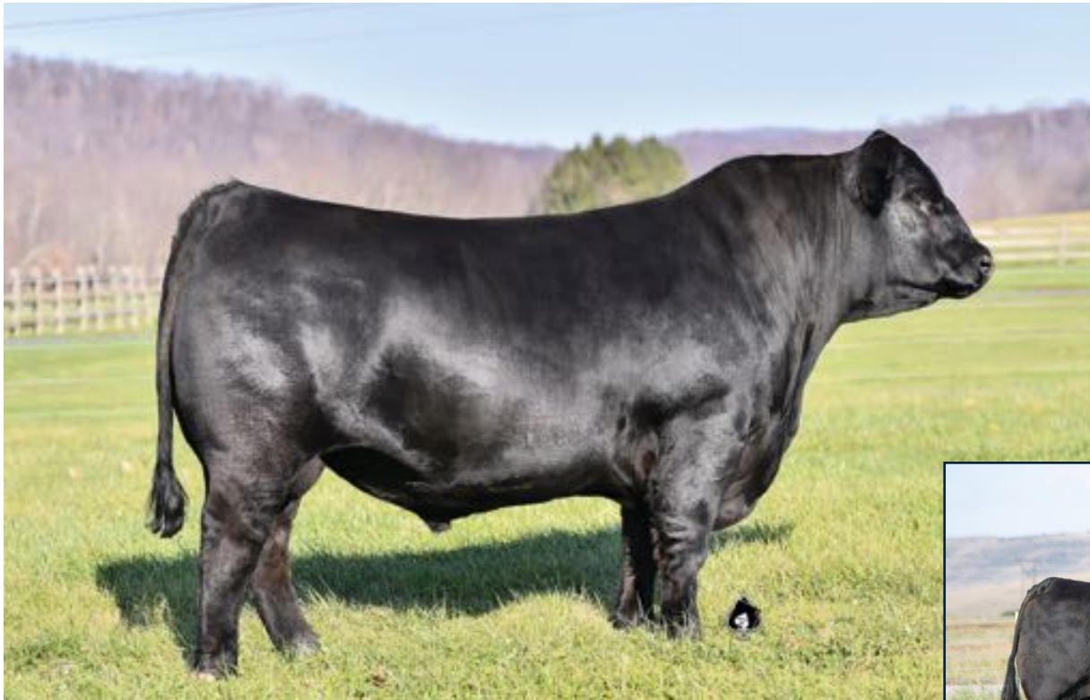
COLE GENESIS 86G