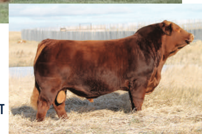
HUNT CREDENTIALS 37C ET