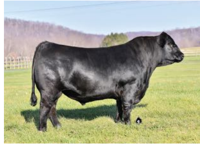
COLE GENESIS 86G