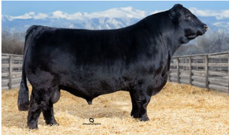
ELCX KINGS LANDING 599 D ET