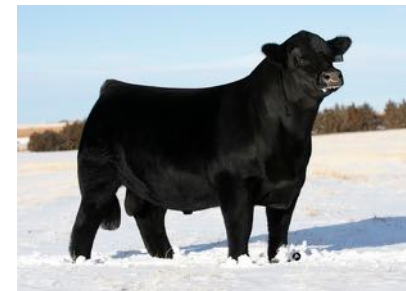
SCHILLING GAME OVER