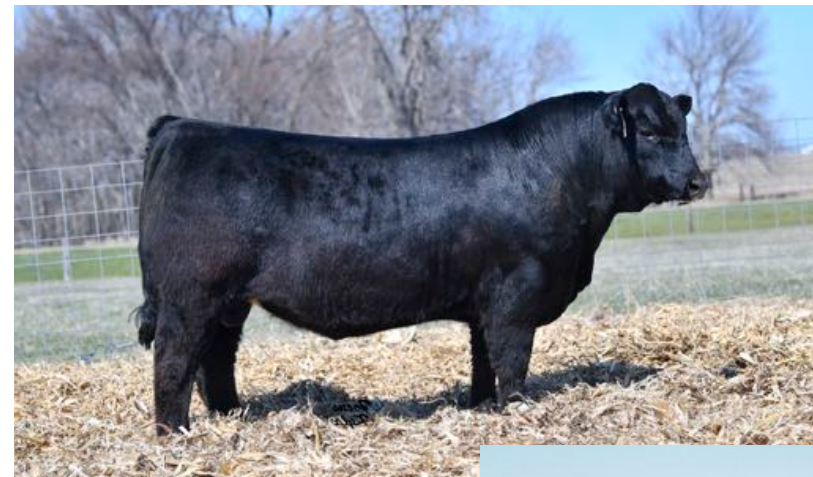
WULFS GAMEBOY C911G ET