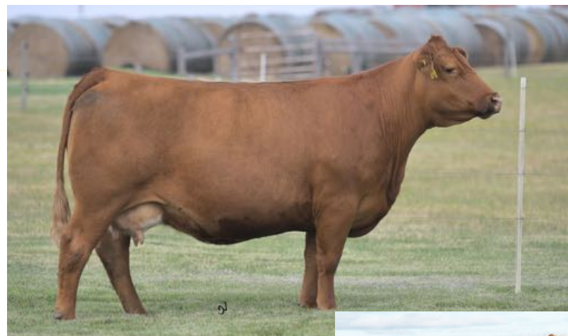
WULFS EDWINNA 7056E

Extremely exciting opportunity to purchase some of the freshest and most valuable genetics that the prestigious Wulf Cattle operation has to offer. Wulfs Edwinna 7056E has made herself a very impressive resume for her age, producing a feature lot in the 2020 Wulf Cattle Opportunity with her first calf, Wulfs Gallagher 7056G, who was a top seller bringing $17,000 selling to Wieczorek Limousin. History repeated itself with her second calf, Wulfs Hickok 7056H, who was the lead bull in the Reserve Champion Lim-Flex Pen of three at the Cattlemen's Congress, then commanded top dollar at the 2021 Wulf Cattle Opportunity sale for $22,500 selling to Running Creek Limousin and Peterson L7 Bar Limousin. Producing two top-cut bulls in Wulf Cattle's vast population is no coincidence and made herself a strong bid for a donor career in the program. Phenotypically this young female has a beautiful pattern and exceptional udder conformation. Numerically she has breed-leading EPDS highlighted by a massive birth-to-yearling spread ranking in the top 10% birth weight, top 10% weaning weight and top 5% yearling weight. What's more, she ranks in the top 1% for milk, top 2% scrotal circumference, top 1% docility, top 10% ribeye area, top 20% marbling, and top 10% mainstream terminal index. Don't miss these elite embryos sale day!