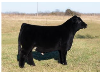
RATLIFF JUMP START 340J ET

GUARANTEE MIN 6, MAX 10 BUYER PAYS FLUSH EXP