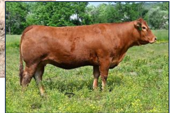
CARVER'S RED ALERT 263E