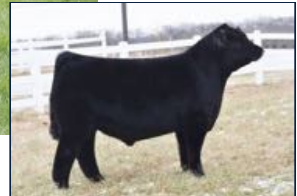
MRRC LEGAL 441E ET