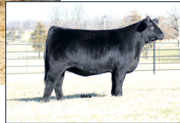
AUTO POEM 273Y