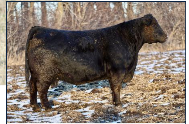
WULFS ABLAZE 3012A