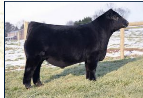
TASF HEINEKEN 405H ET