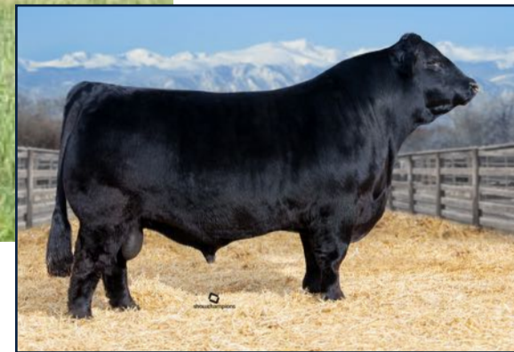
ELCX KINGS LANDING 599 D ET