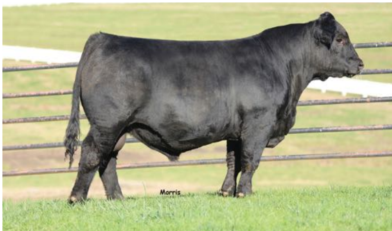
AUTO POWER PLUS 133B ET