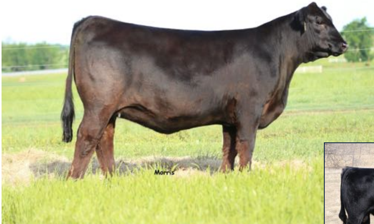
MAGS AMERICAN BEAUTY 694A