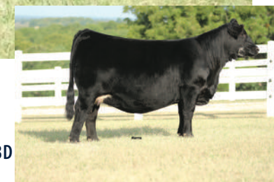
AUTO CALLIE 403D