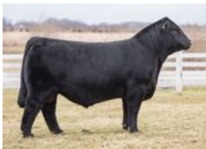
FWLY CAN DO