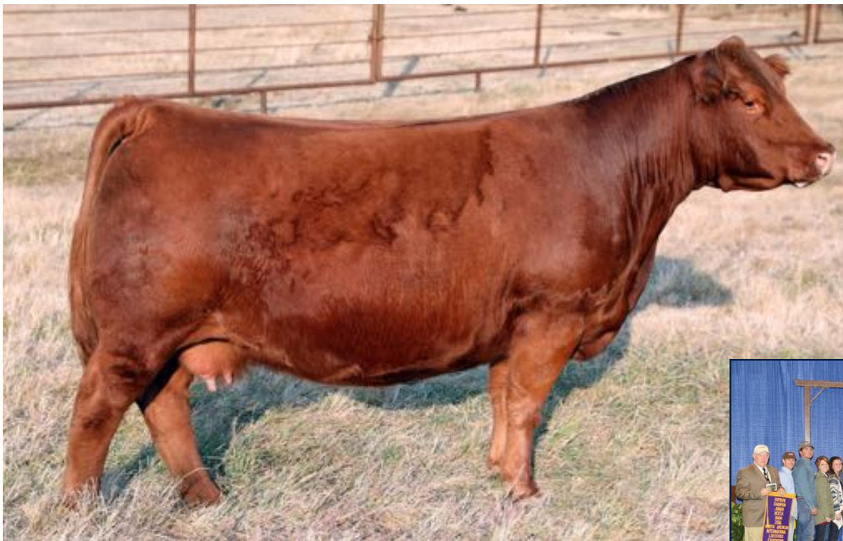
GREENWOOD PLD BIRCH

RIVERSTONED CHARMED Tinkerbell, maternal grand dam