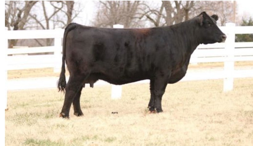
AUTO ROYAL GLOW 206G ET

AUTO Royal Glow 206G was procured from the heart of the elite Pinegar Limousin program. This daughter of Riverstone Crown Royal will get your blood pumping. She is out of a terrific female, AUTO Casper C, a daughter of EXAR Classen 1422B and AUTO Rebeca 292S. Daughter of Riverstone Crown Royal, a full brother to the well-known Riverstone Charmed female. She is flawless in her build, elegant in her lines, and ever-appealing in motion. With a foundation like this, this flush is destined for sheer greatness.