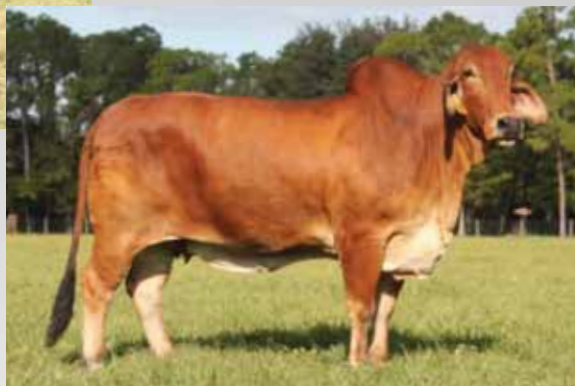
MS SS 164