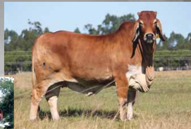
TJF Miss Stunner 284/0