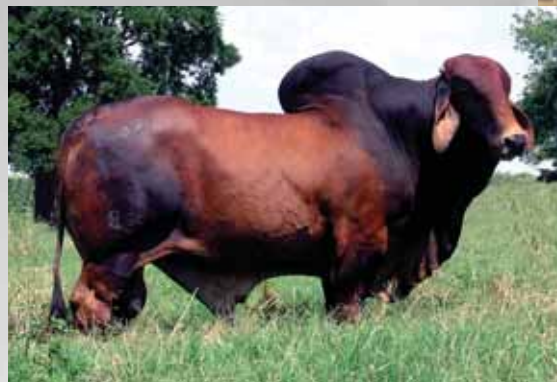
+Mr. 3H X-Ray 825