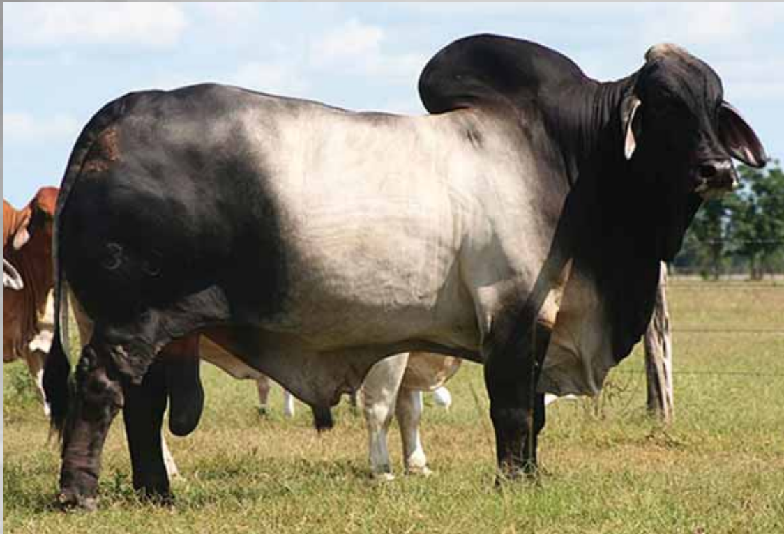
+Mr. V8 380/6