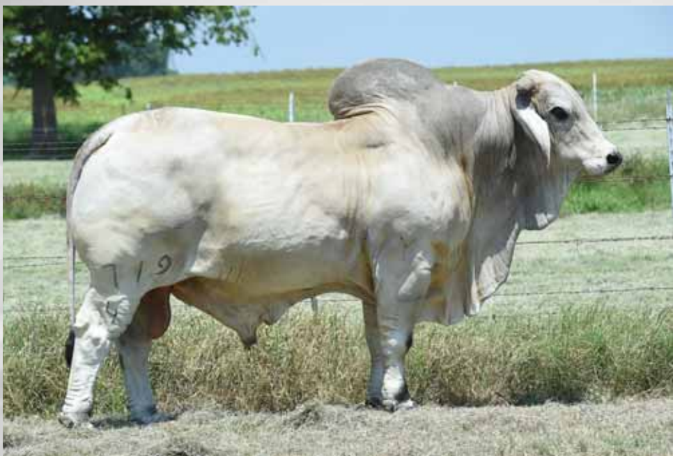
+JDH Impression Manso