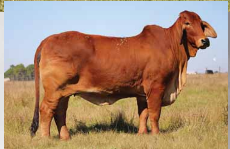
TJF Miss Red Velvet