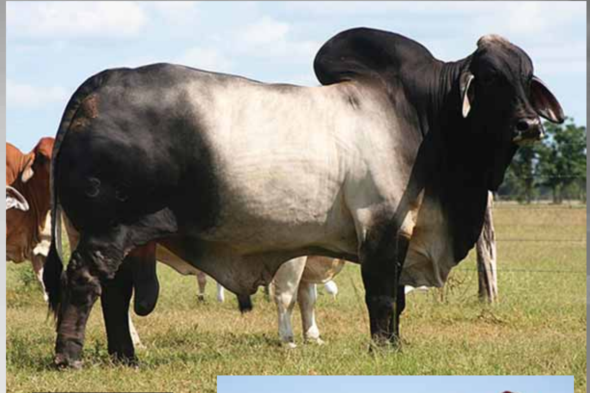
+Mr. V8 380/6

In the ABBA sire summary, +Mr. V8 380/6 was a triple trait leader for weaning weight, yearling weight and ribeye area. He is a performance bull who still maintains style. He is heavy muscled, very attractive, totally balanced in his phenotype, expresses massive breed character, and most importantly - is totally athletic and structurally correct from every angle. As a two-year-old he weighed 2,190 pounds with a hip height of 63 inches. He ranks in the top 1% for WW, top 1% for YW, and top 3% for marbling. He also ranked as the #3 high indexing sire in the 2012 ABBA Carcass Evaluation Program.