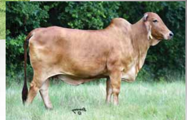
HK Ms. Passport 557