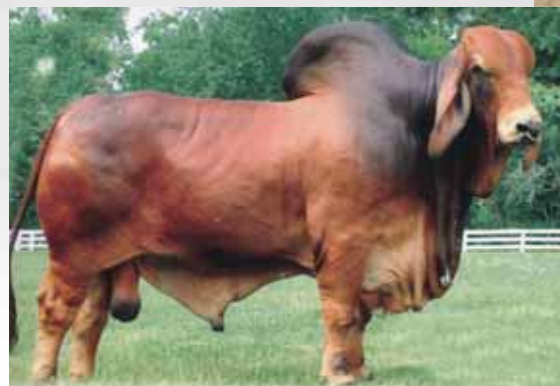
BB Mr Sting-Ray 10/0