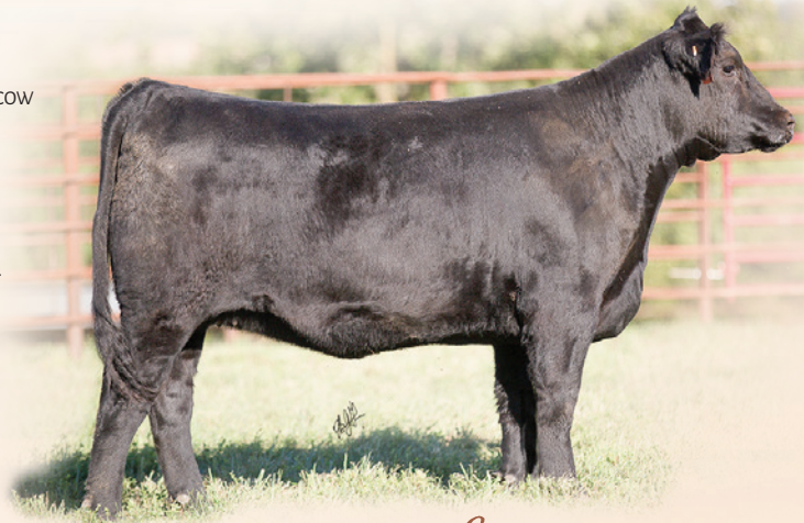
China LOT 60

We really like how this double homozygous daughter of COLE Absolute combines power and profile into a package that is off the charts for WW, YW, CW and REA EPDs.