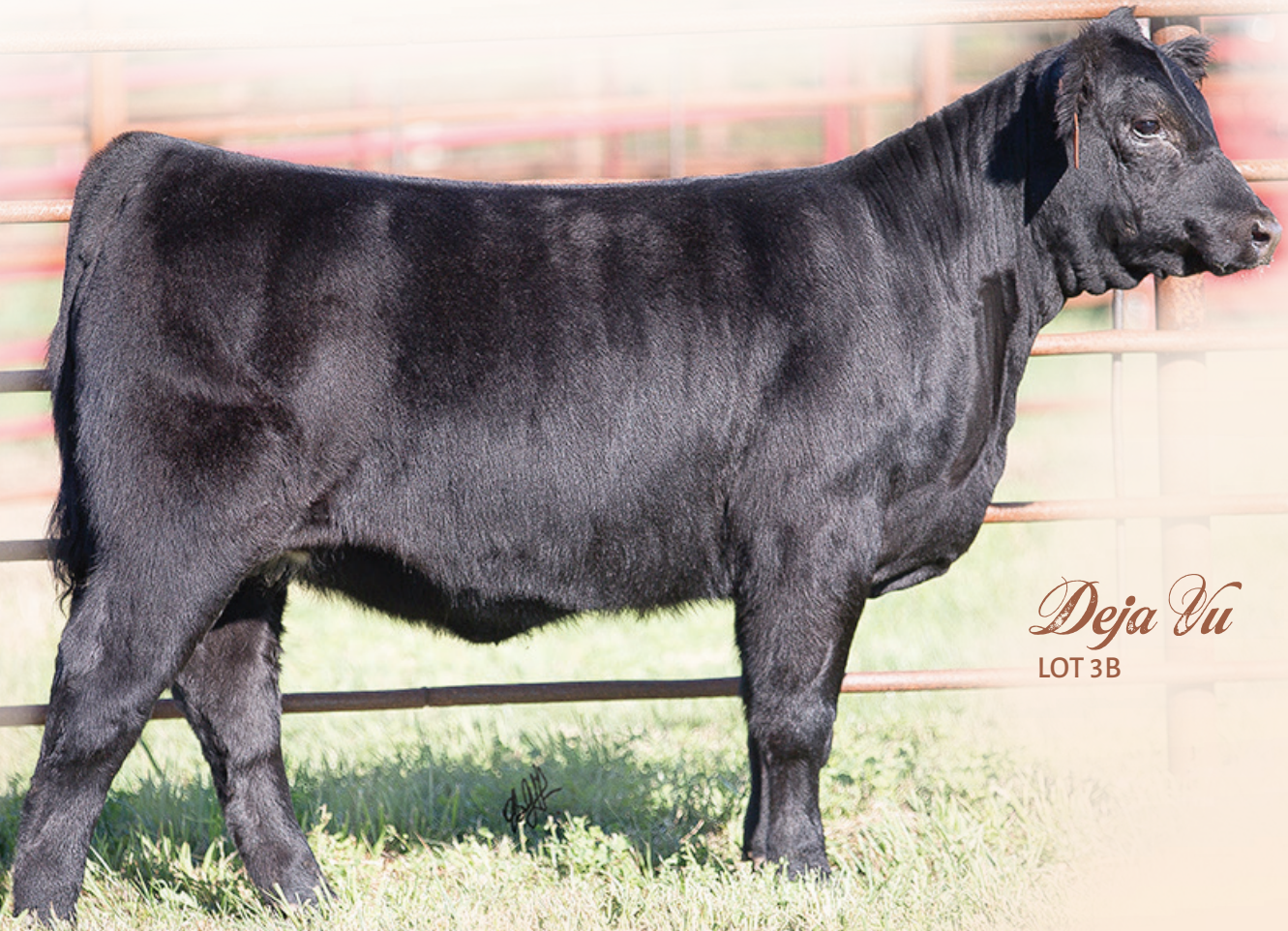
Deja Vu LOT 3B

This full sister to Lot 3A shows the amazing consistency of the Tootsie Pop line. While not mirror images of each other, these two flushmates have many of the same things in common—great front ends, depth of flank and fluidity of movement. Given their genetic heritage, we are confident that whichever way you go, you will be rewarded with a competitive show heifer and even greater cow.