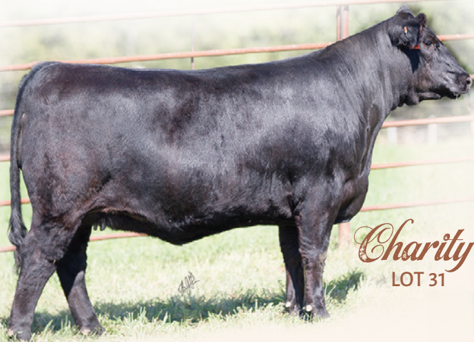
Charity LOT 31