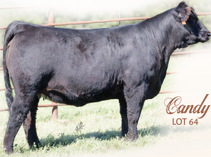
Candy LOT 64