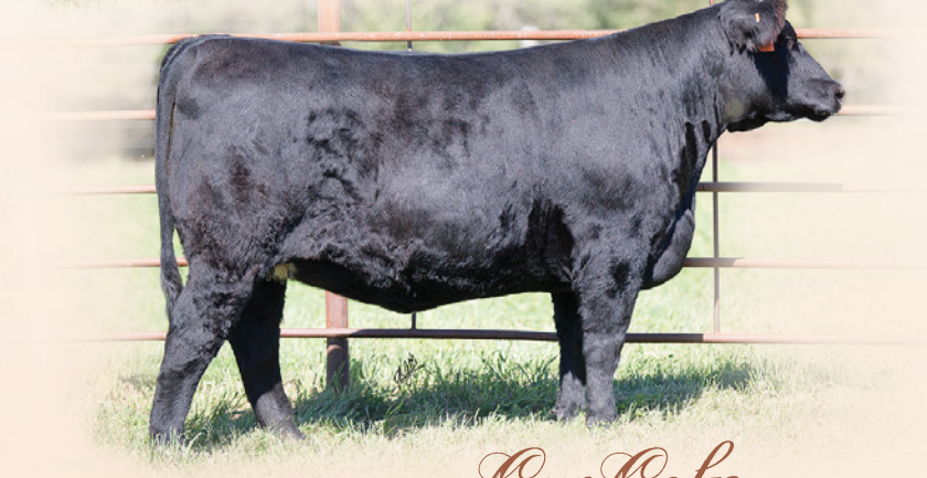
Cup Cake LOT 49