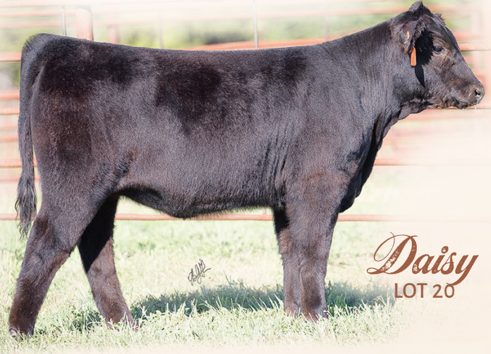
Daisy LOT 20