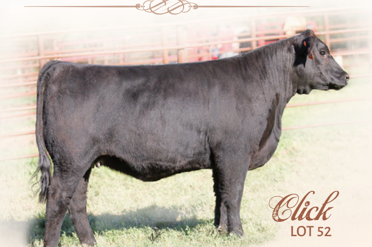
Click LOT 52