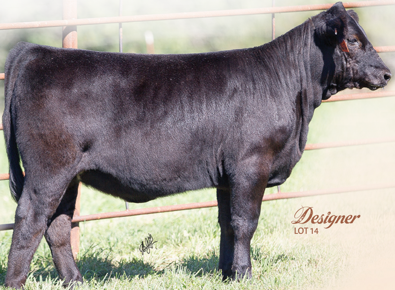
Designer LOT 14