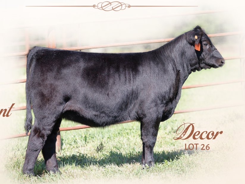
Decor LOT 26