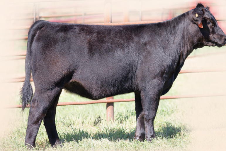
Declaration LOT 17