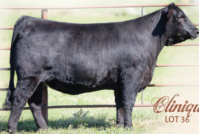
Clinique LOT 36