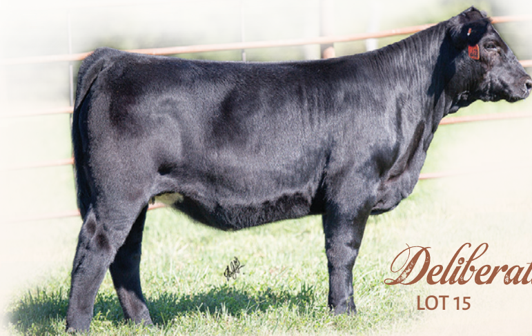
Deliberation LOT 15