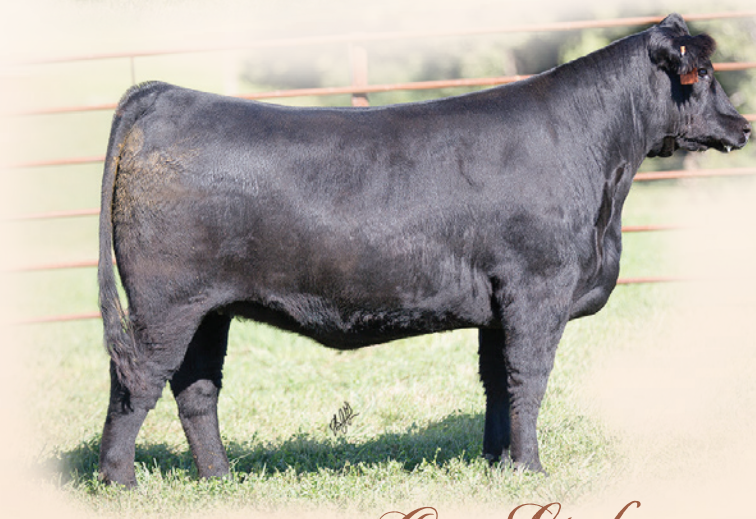
Cow Girl LOT 63