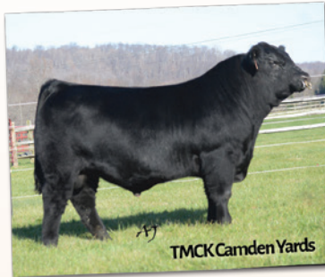
TMCK Camden Yards