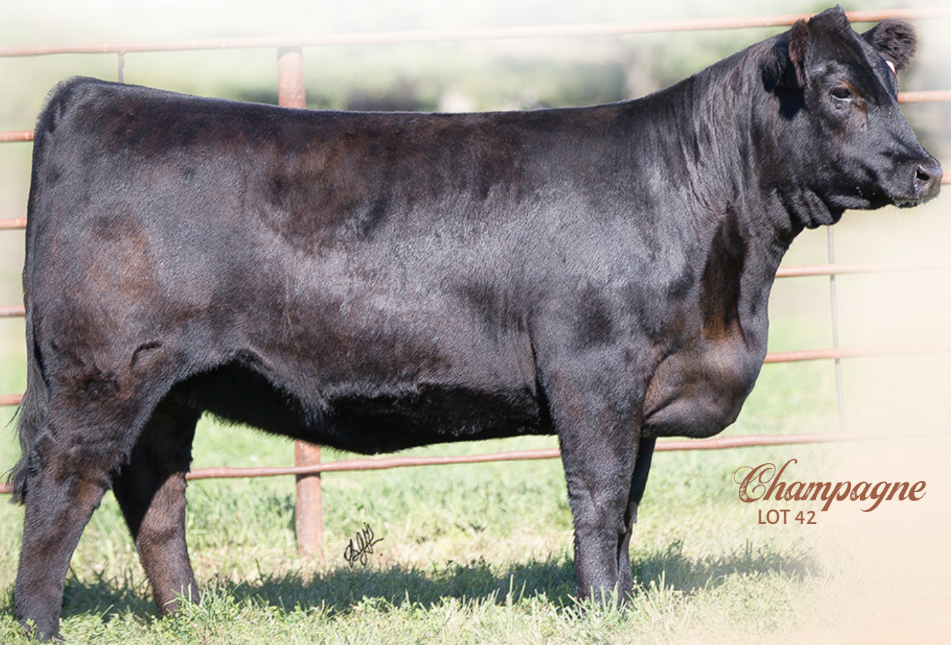
Champagne LOT 42