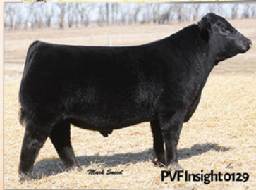
PVF Insight 0129