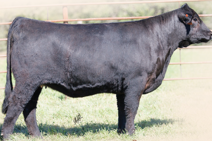
Cabaret LOT 33