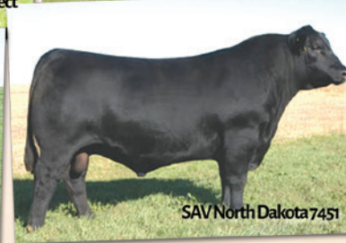
SAV North Dakota 7451