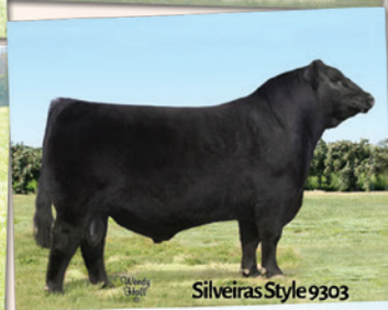
Silveiras Style 9303