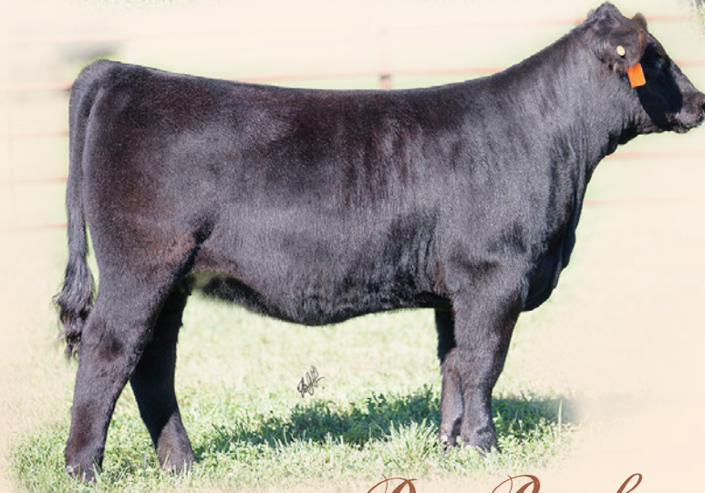
Day Break LOT 9