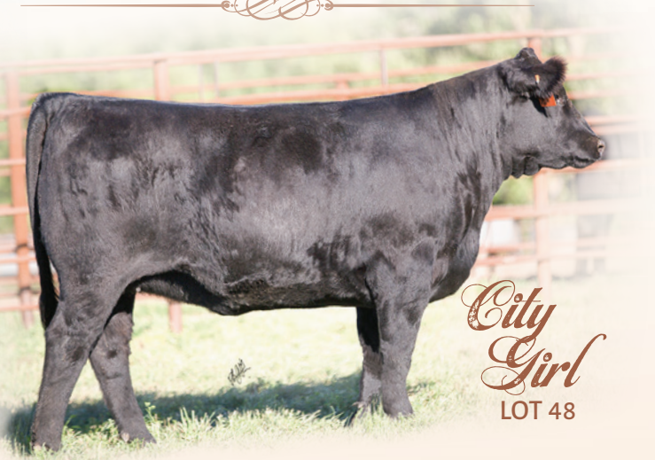
City Girl LOT 48