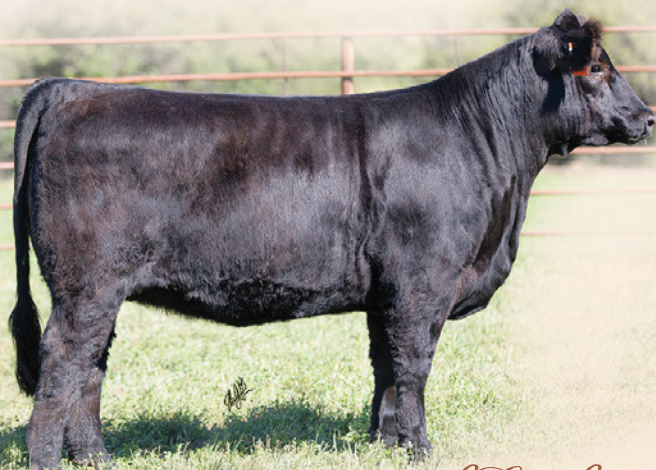
Cool Girl LOT 37