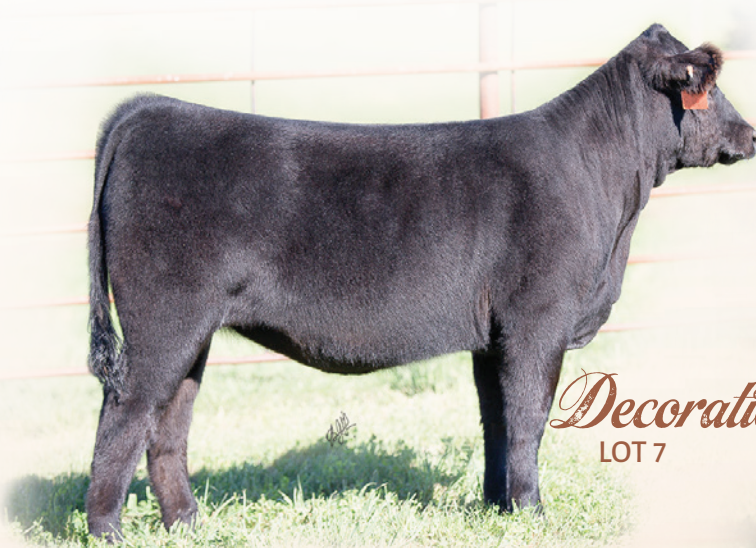
Decoration LOT 7