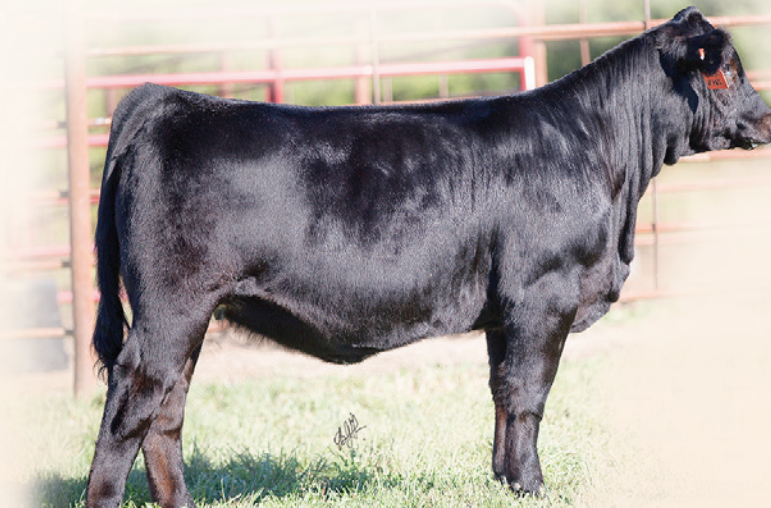
Dolly LOT 24