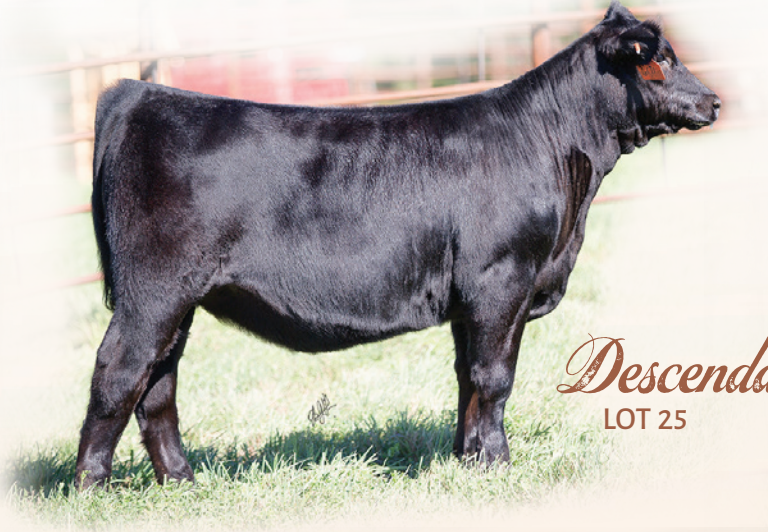
Descendant LOT 25