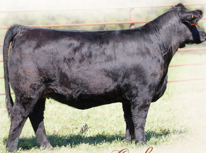
Cookie LOT 35