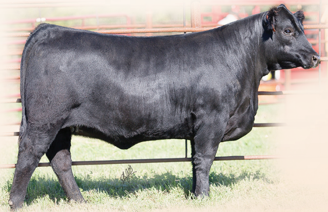
California Girl LOT 66

Total performance, wrapped up in a homozygous black, Lim-Flex package. Think of the ways you can breed a female with a 128 YW EPD and a top 35% ranking for marbling.