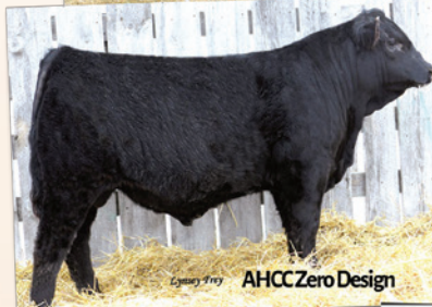
AHCC Zero Design