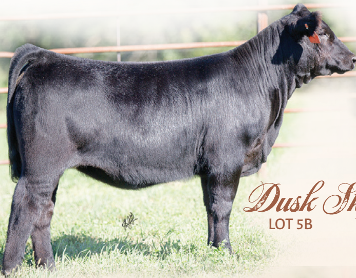
Dusk Sky LOT 5B