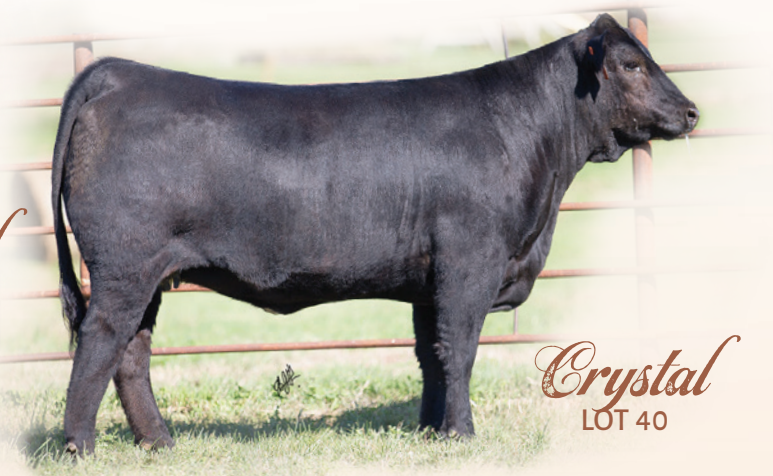
Crystal LOT 40