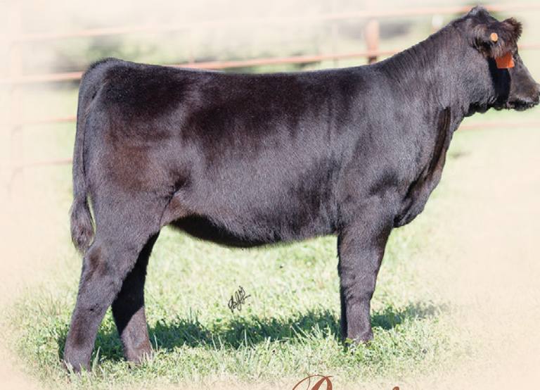
Dancing LOT 27