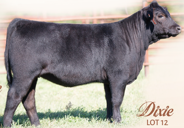
Dixie LOT 12