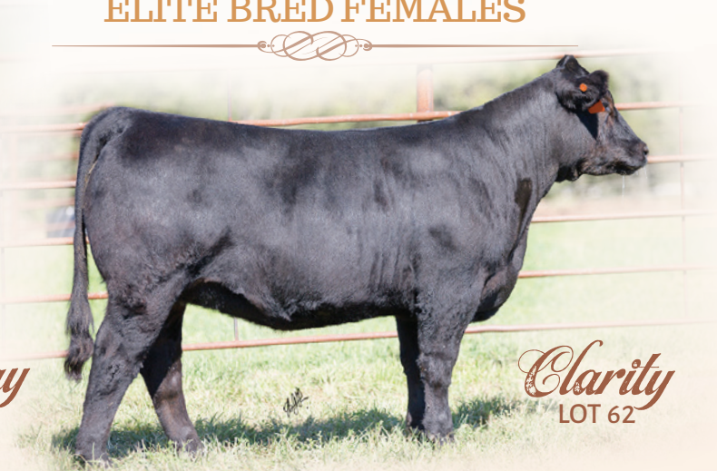
Clarity LOT 62