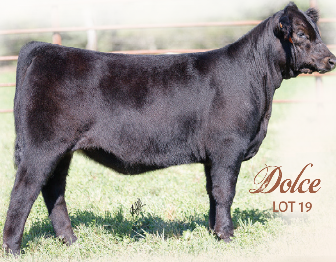
Dolce LOT 19