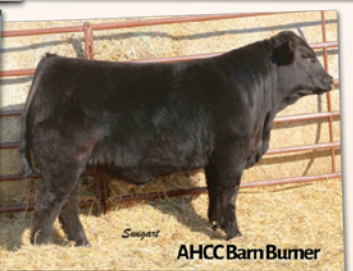
AHCC Barn Burner