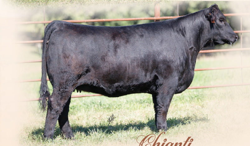
Chianti LOT 53