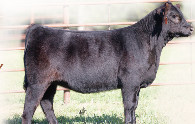
LOT 23 Designation