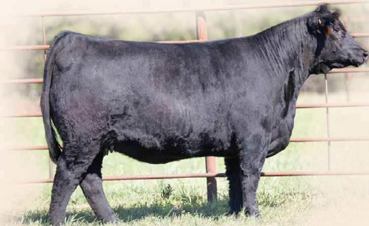
Cinderella LOT 45