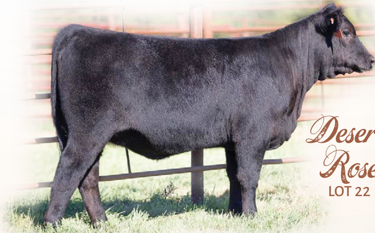
Desert Rose LOT 22