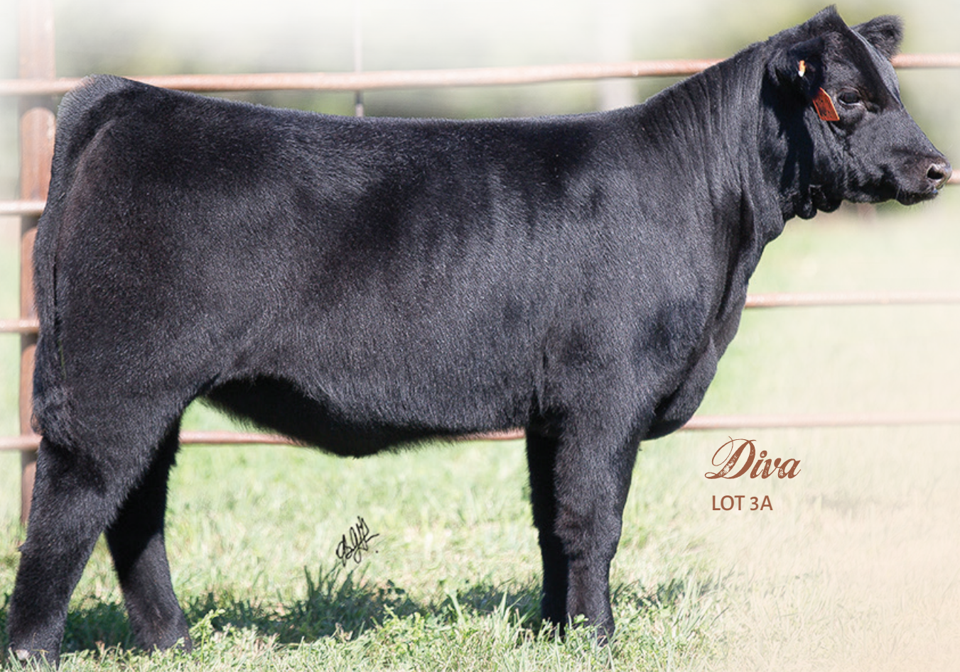
Divia LOT 3A