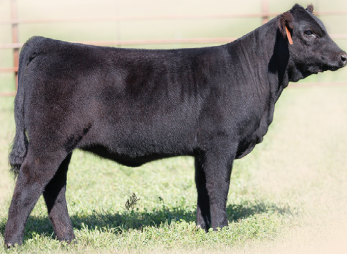
Daphne LOT 21