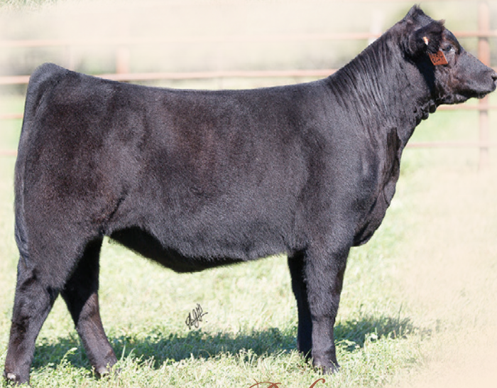
Delirious LOT 5D