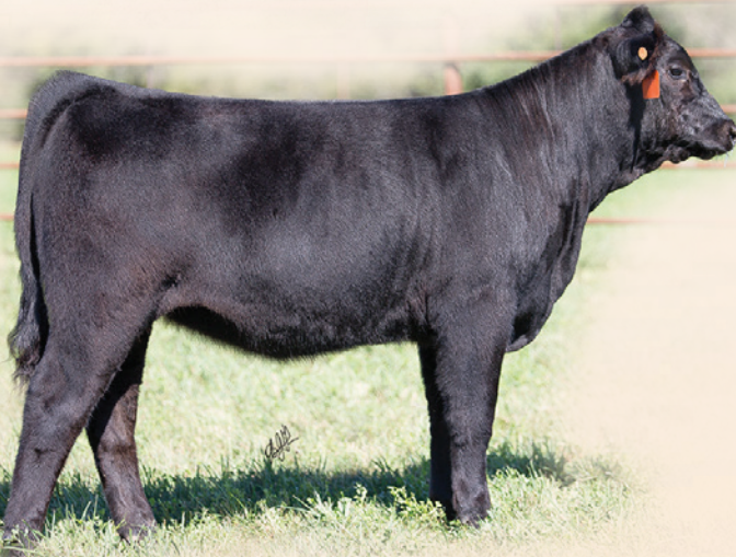
Dee Dee LOT 13