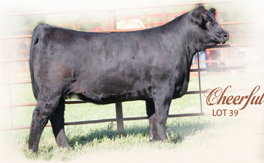
Cheerful LOT 39