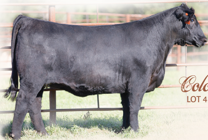
Colorful LOT 43