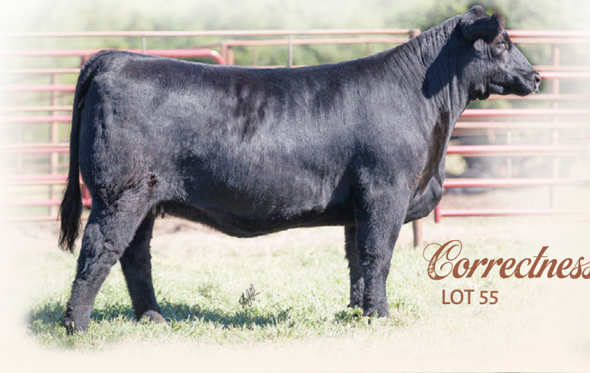
Correctness LOT 55