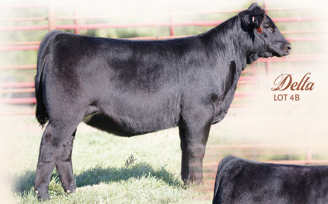
Delta LOT 4B