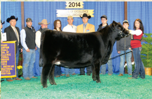
LLJB Absolute Style 3056A Full Sister to Lot 1