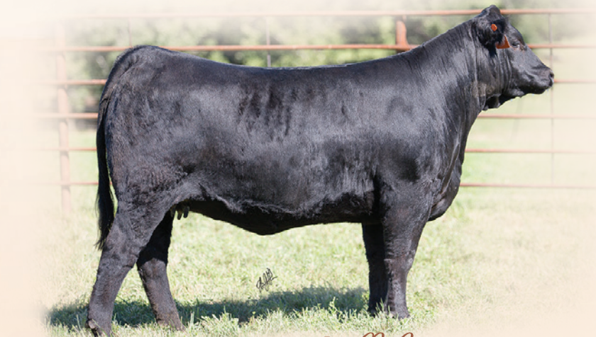
Collaboration LOT 57