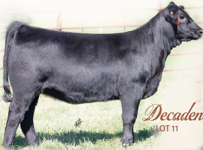
Decadence LOT 11