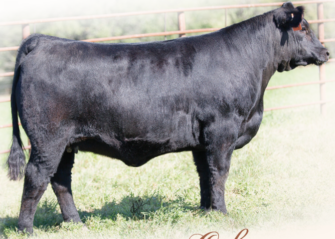
Cabo LOT 65