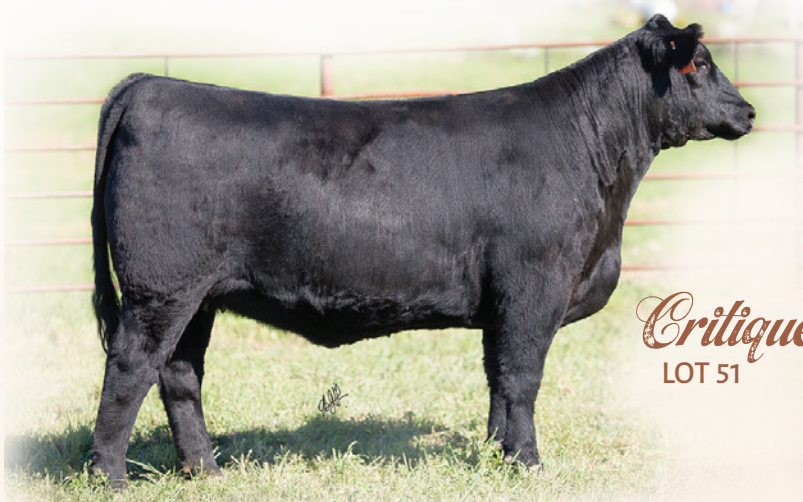
Critique LOT 51