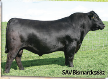
SAV Bismarck 5682