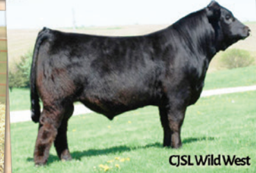
CJS� Wild West