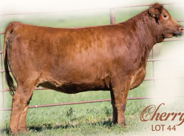
Cherry LOT 44