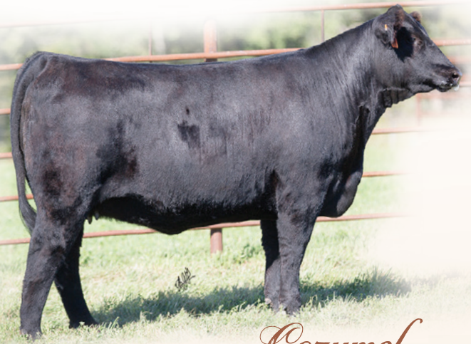
Cozumel LOT 59