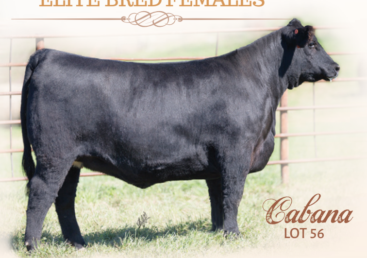
Cabana LOT 56