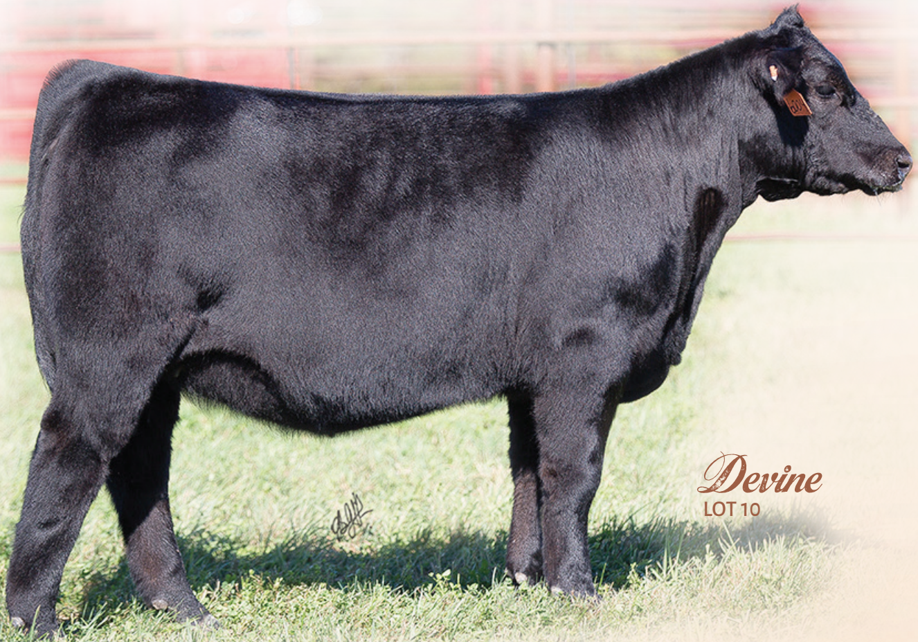
Devine LOT 10