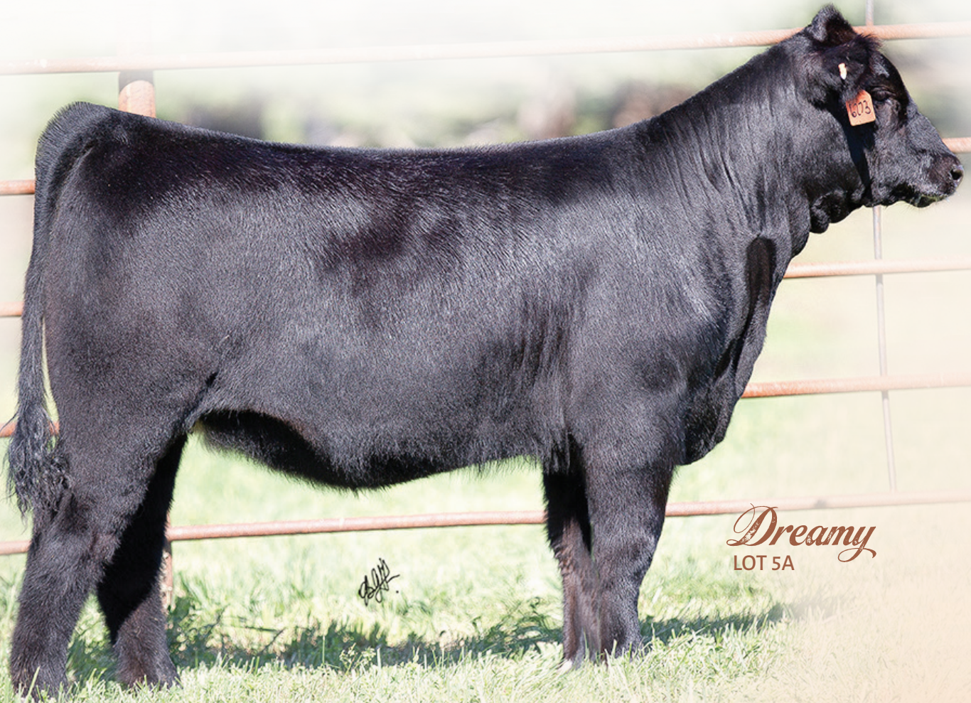
Dreamy LOT 5A