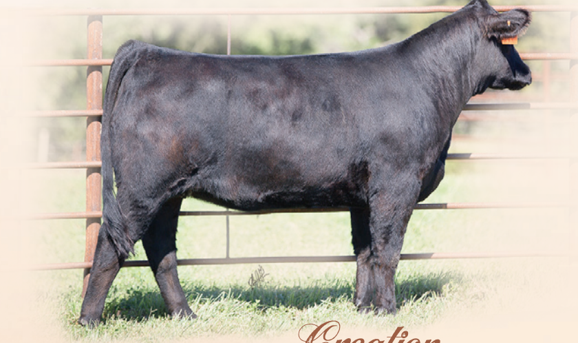
Creation LOT 41