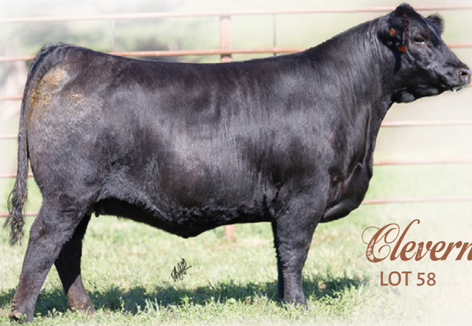
Cleverness LOT 58