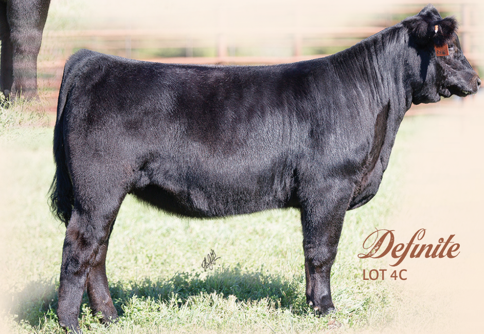
Definite LOT 4C