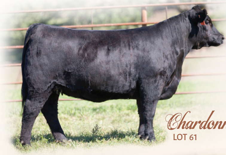
Chardonnay LOT 61