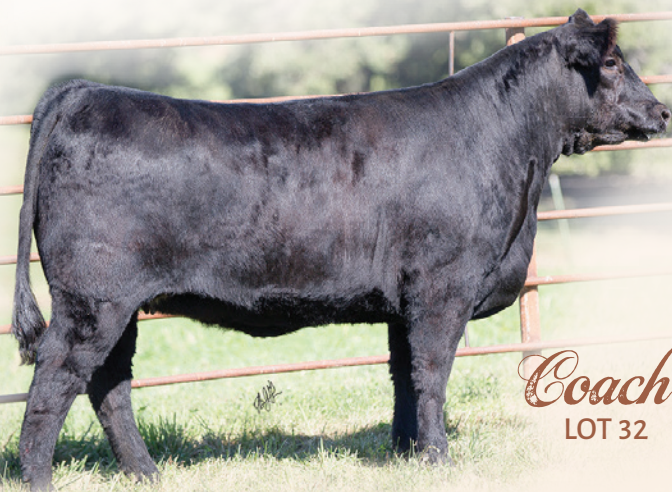
Coach LOT 32