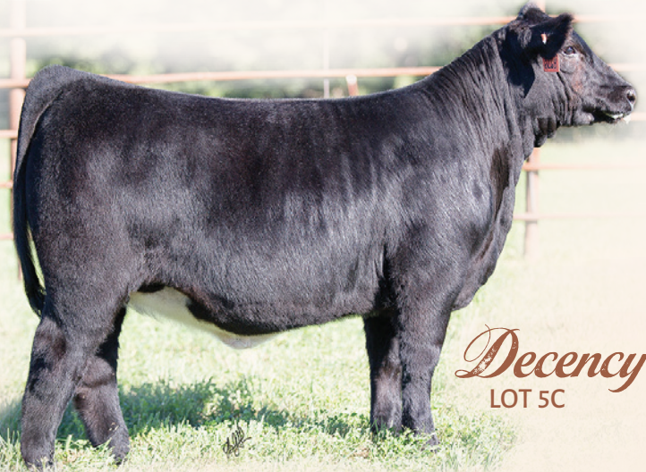
Decency LOT 5C