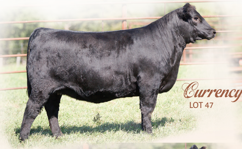
Currency LOT 47