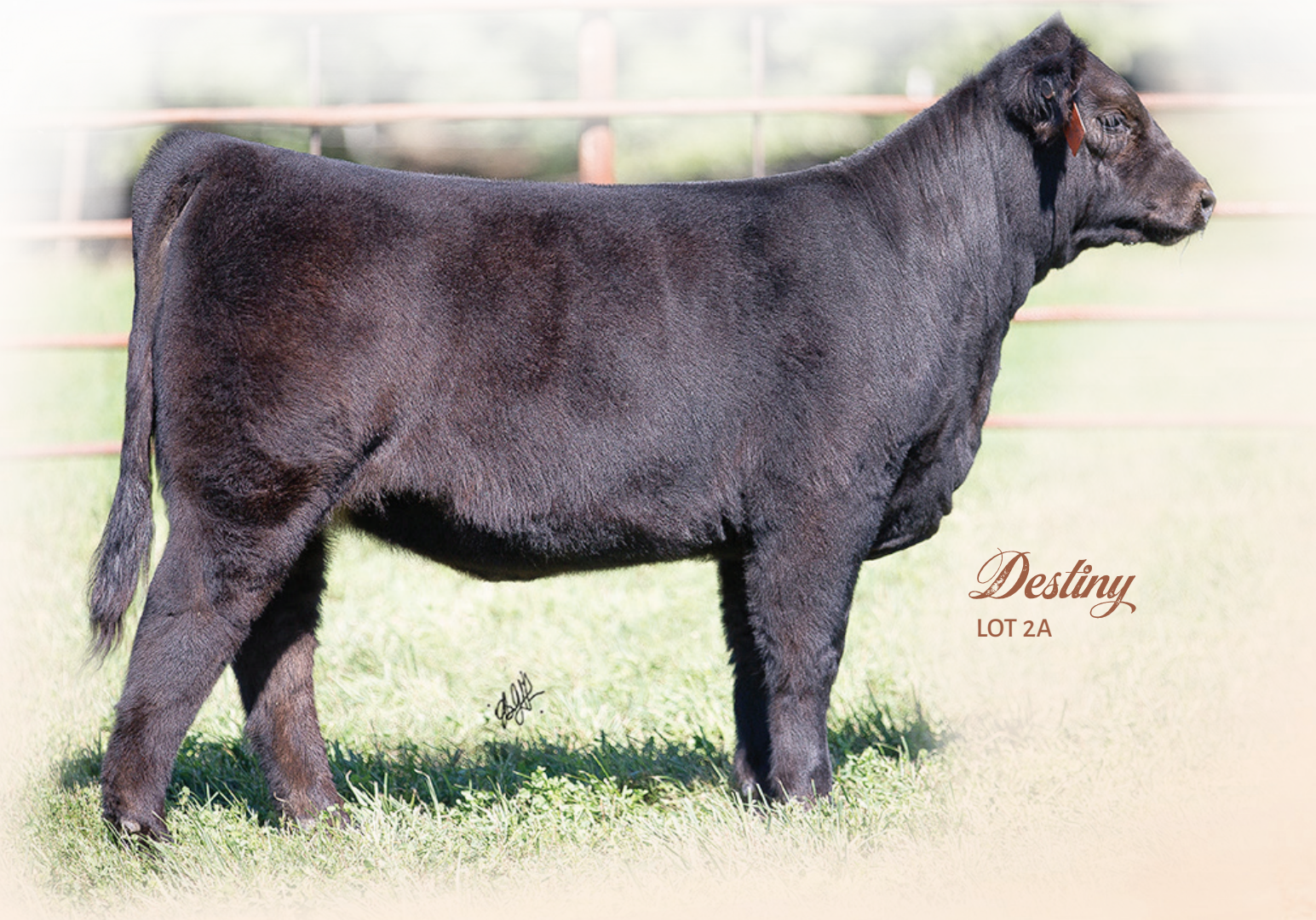
Destiny LOT 2A