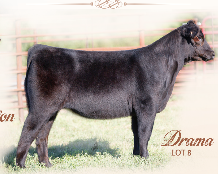
Drama LOT 8