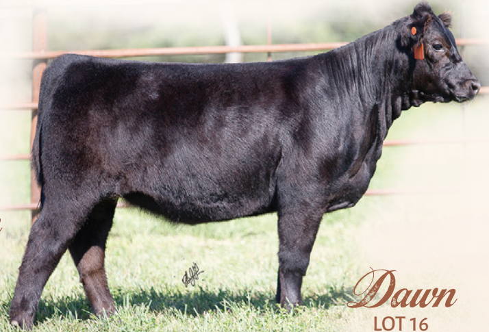
Dawn LOT 16