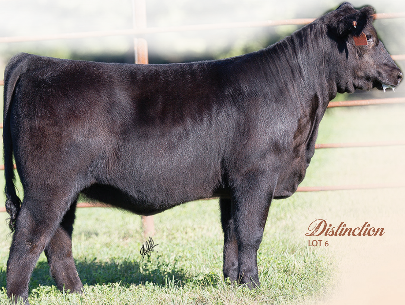
Distinction LOT 6