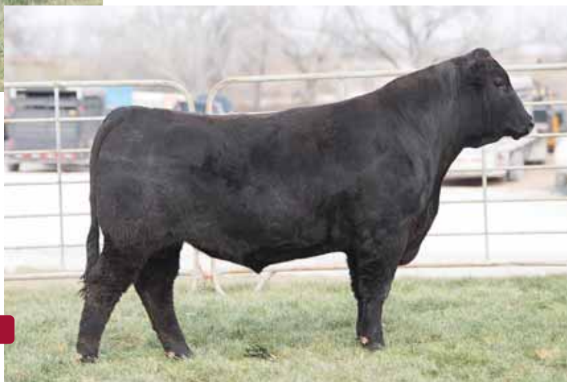
LOT 40 RRDC LVLS 297C