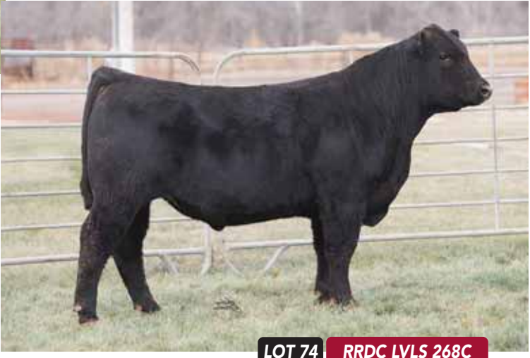
LOT 74 RRDC LVLS 268C