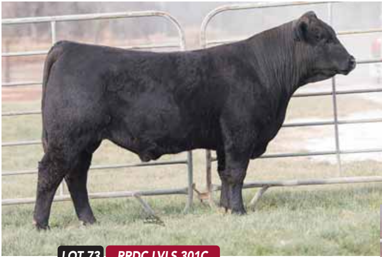
LOT 73 RRDC LVLS 301C