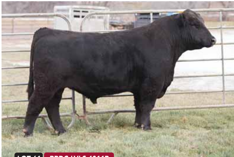
LOT 61 RRDC LVLS 4011B