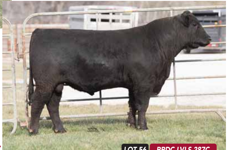
LOT 56 RRDC LVLS 287C