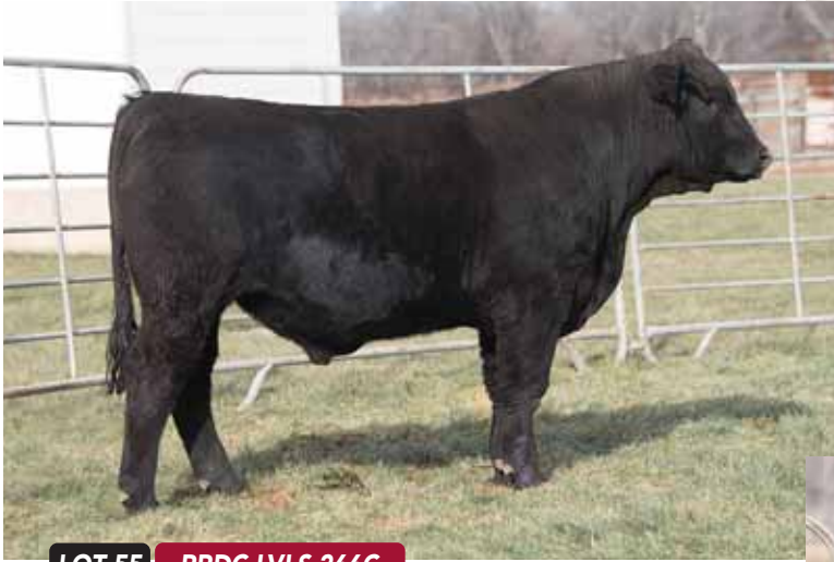
LOT 55 RRDC LVLS 266C