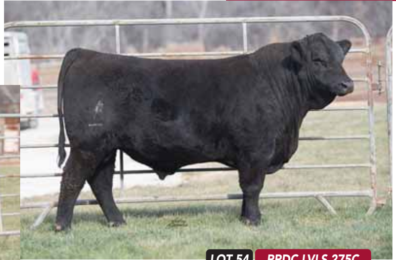
LOT 54 RRDC LVLS 275C