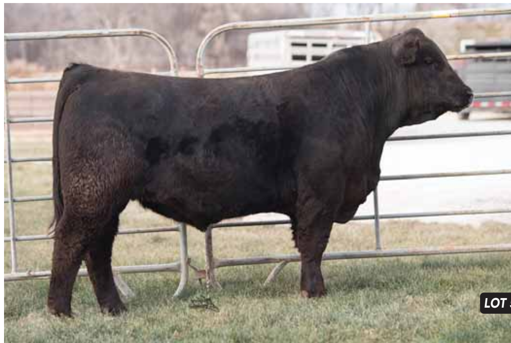
LOT 52 RRDC LVLS 290C