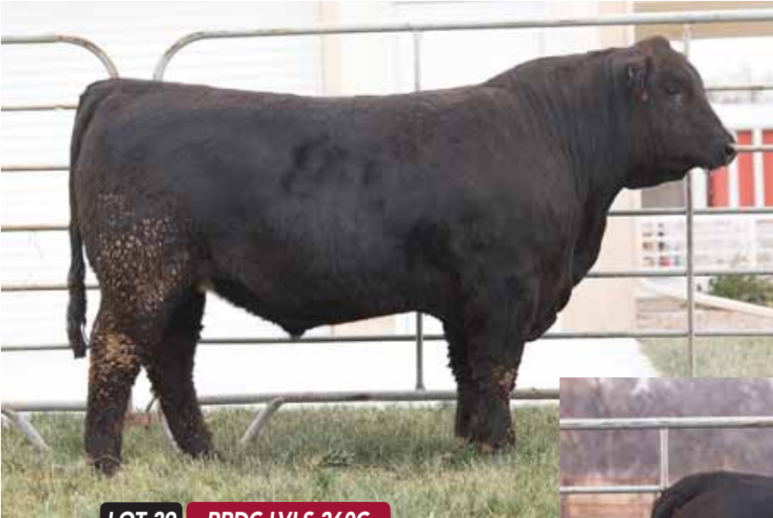
LOT 29 RRDC LVLS 260C