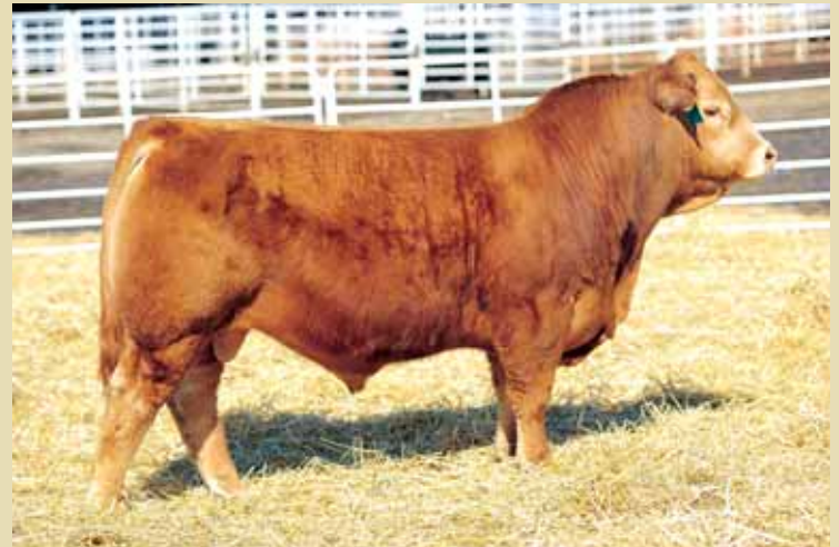
WZRK ATLAS 8012A SONS

Atlas was our top selection out of the elite offering from the Wieczorek program, this HOMO polled Red A.I. sire that is featured in the Grassroots line-up, is certainly one that has a dynamic performance profile and intriguing phenotype. His fleshing ability, softness through his mid-rib and outcross pedigree will have a significant impact on our herd. Study the maternal attributes that he brings to the table and you can't help but be impressed.