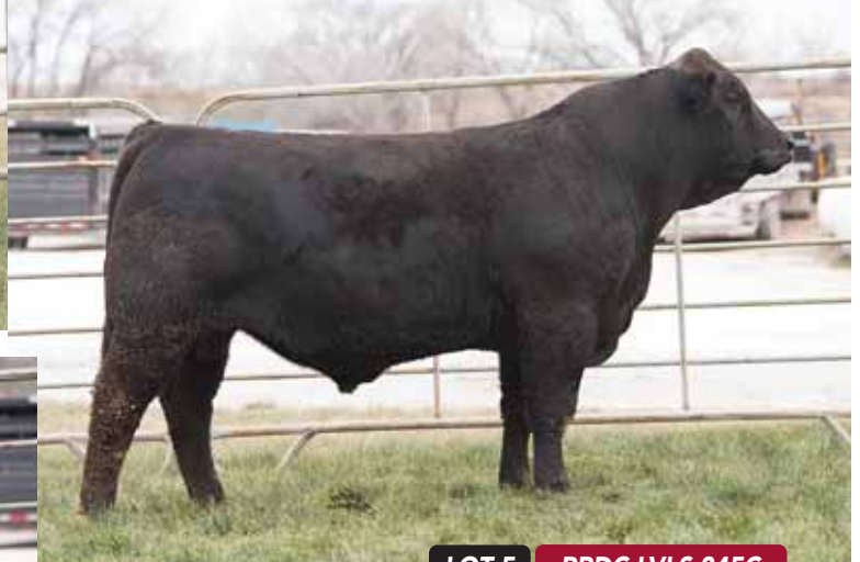
LOT 5 RRDC LVLS 245C