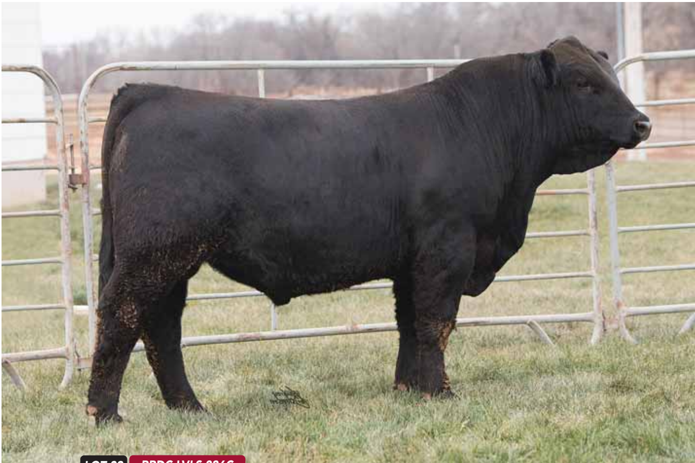
LOT 83 RRDC LVLS 236C