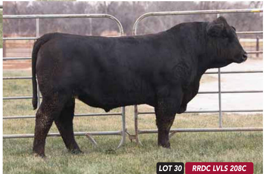
LOT 30 RRDC LVLS 208C