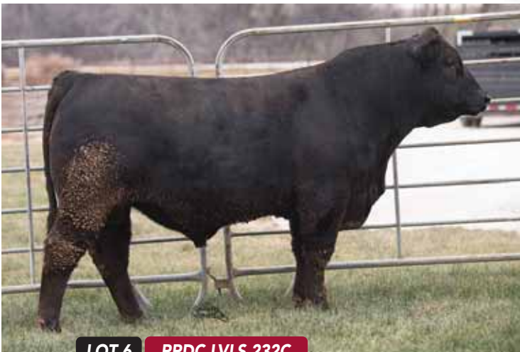
LOT 6 RRDC LVLS 232C