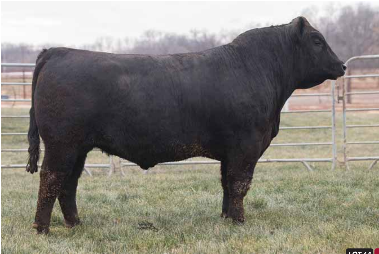
LOT 64 RRDC LVLS 211C