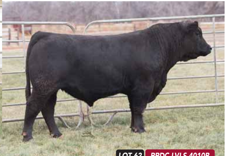
LOT 62 RRDC LVLS 4010B