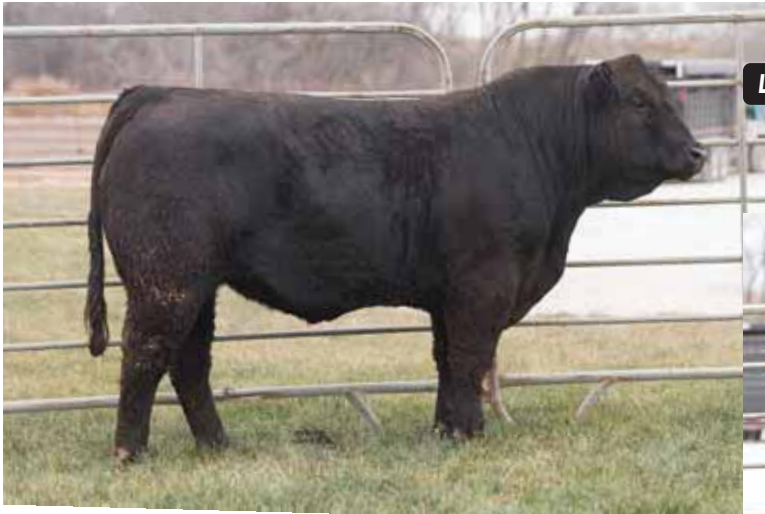
LOT 4 RRDC LVLS 213C