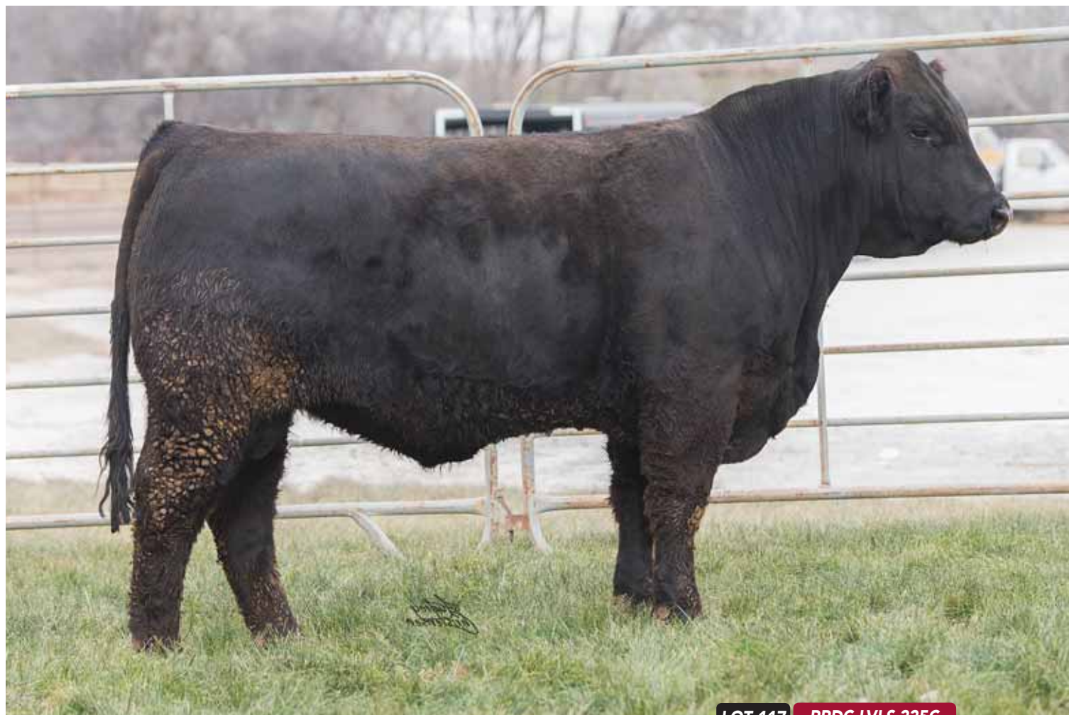
LOT 117 RRDC LVLS 335C