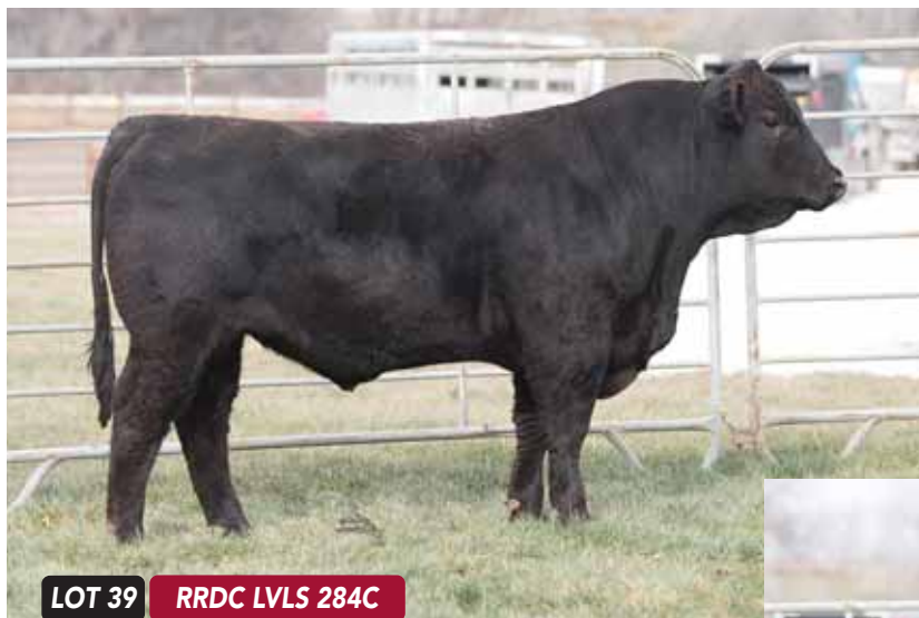
LOT 39 RRDC LVLS 284C