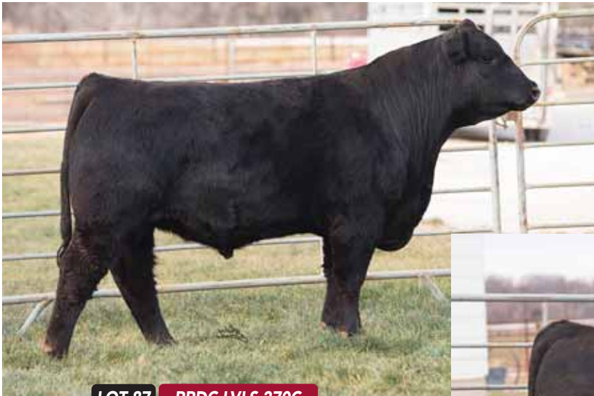
LOT 87 RRDC LVLS 270C