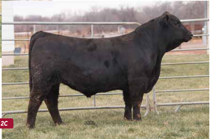
LOT 88 RRDC LVLS 212C