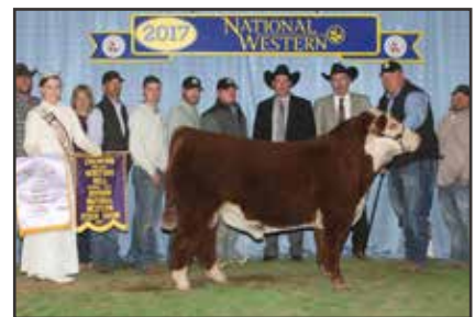
KOLT CHICAGO 2004 2017 NWSS Reserve Grand Champion Polled Hereford Bull. Full Brother to Lot 2