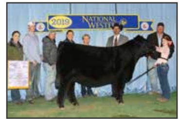
SHSK ELVERA 710E ET 2019 NWSS Reserve Grand Champion Limousin Heifer