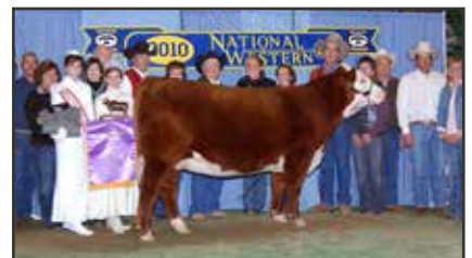
H POETIC JUSTICE 8042 2010 NWSS Grand Champion Horned Hereford Heifer Maternal Sister to Dam of Lot 10