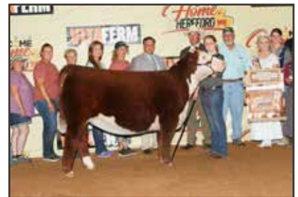
DAM OF EMBRYOS SELLING

BUYER PAYS 3 * $ BID. GUARANTEEING 1 PREGNANCY PER EMBRYO PACKAGE IF TRANSFERRED BY A CERTIFIED TECHNICIAN.