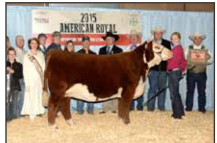
WPF 90W 2020 ROMALEE 4054 ET

2015 American Royal Supreme Champion Junior Breeding Heifer Maternal Granddam of Lot 1A