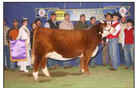
TCC MS DIANA 01 2012 NWSS Grand Champion Polled Hereford Heifer Dam of Lots 15-17

HEIFER CALF BORN 4/15/23 SIRE: LCX PERFECTO 11B ET (AHA 43517583).