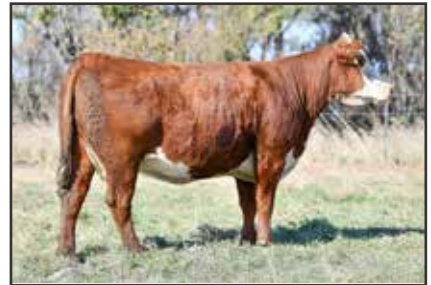
R MISS WRANGLER 207 Dam of Lot 5