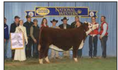
PURPLE JOLENE 150D ET 2018 Reserve Grand Champion Horned Hereford Heifer Maternal Sister to Dam of Lot 19

LOT 19A STEER CALF BORN 3/27/23 SIRE: UPS 7616 SENSATION 0541 (AHA 44197481).