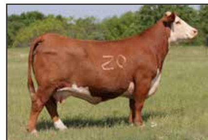
BCC TARA 228Z

DAM: BCC MISS MAYBERRY 523C ET BCC MISS MAYBARRY 064X