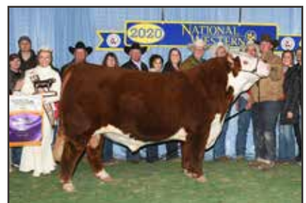
SR DOMINATE 308F

2020 NWSS Supreme Champion Hereford Sire of Lot 1A