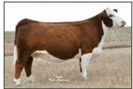
CHEZ STRAWBERRY WINE ET 204Z Famous Dam of Lot 2

AI BRED 3/30/23 TO H THE PROFIT 8426 ET (AHA 43916400). EST DUE 1/6/24.