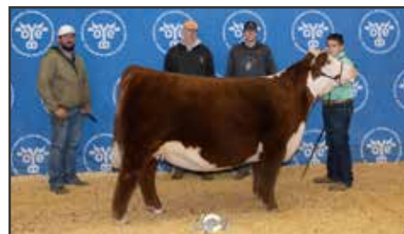
KGB GIANNA 925 2021 OYE Reserve Division Champion Polled Hereford Heifer Daughter of Lot 23