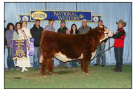
CH HIGH ROLLER 756 2020 NWSS Division Champion Polled Hereford Bull Sire of Lot 9

PE 6/1/23-8/15/23 TO GKB 8123 BELLE AIR 1968 (AHA 44305639).