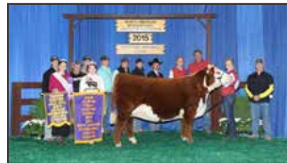
WPF 90W 2020 ROMALEE 4054 ET

PE 6/1/23-8/15/23 TO GKB 8123 BELLE AIR 1968 (AHA 44305639).