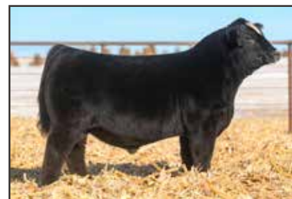
KCC1 COUNTERTIME 872H $230,000 Sire of Lot 110

DAM: CHEZ STCC MILEY 5034C GF/HS MILEY X243