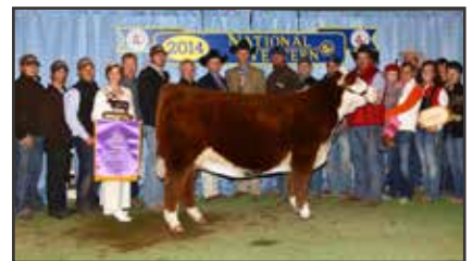
H JT MIRANDA 2033 ET 2014 NWSS Grand Champion Polled Hereford Heifer Maternal Granddaughter of H Pure Poetry 446