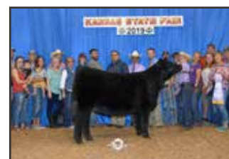
RATLIFFS FLIRT 892F ET