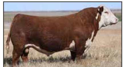
TFR KR CA CHING 1449 ET Sire of Lot 10

AI BRED 6/27/23 TO H THE PROFIT 8426 ET (AHA 43916400).