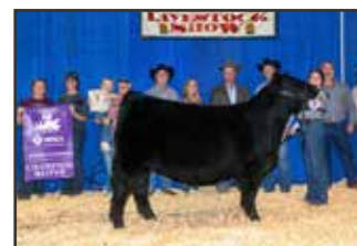
FIRES BLACK BETTY 30J