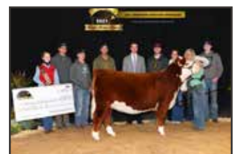
BACC 228Z TARA 054 ET

2023 FWSS Grand Champion Horned Hereford Heifer Full Sister in Blood to Lots 101 & 102