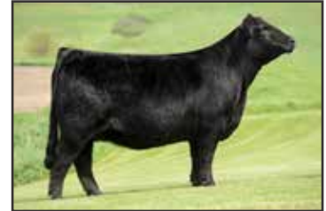
WLR PRADA Dam of Lots 25 & 26

OFFERING 50% EMBRYO INTEREST. TERMS ANNOUNCED SALE DAY. WILL CALVE BY SALE DAY TO BRDG 50 CENT 911J (LFM 2385859).