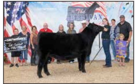
SHSK BENJIE 205H ET 2021 National Junior Limousin Show 5th Overall LimFlex Heifer

AI BRED 4/13/23 TO STCC TECUMSEH 058J (ASA 3958195). EST DUE 1/20/24.