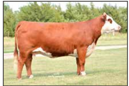
R SWEET RED WINE 039 Famous Maternal Sister to Lot 5

SIRE: UPS 7616 SENSATION 0541 (AHA 44197481).