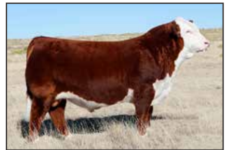
NJW 79Z 22Z MIGHTY 49C

2017 NWSS Reserve Grand Champion Horned Hereford Bull Sire of Lot 4A