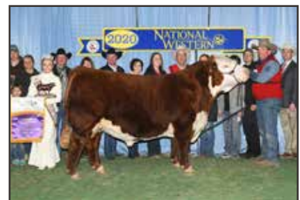
H THE PROFIT 8426 ET 2020 NWSS Grand Champion Polled Hereford Bull Service Sire to several females throughout the offering!