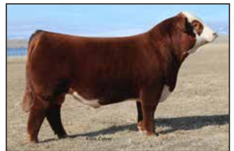
C ARLO 2135 ET

2017 FWSS Reserve Grand Champion Horned Hereford Heifer Full Sister to Lot 17