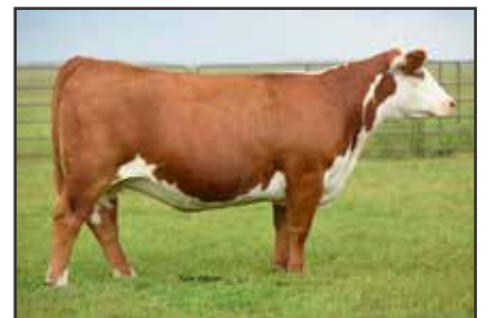
H JT DELHAWK ANNSLEY 2140 ET Maternal Granddam of Lot 12

AI BRED 7/1/23 TO CH HIGH ROLLER 756 ET (AHA 43875385).