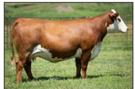
H MS O103 MARIAH 4488 ET

PE 7/15/23-8/30/23 TO CH HIGROLLER 756 ET (AHA 43875385).