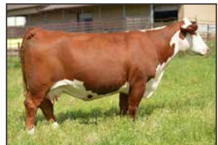
CSF 435 LADY 9200 Dam of Lot 6

LOT 6A HEIFER CALF BORN 6/2/23 SIRE: CH HIGH ROLLER 756 ET (AHA 43875385).