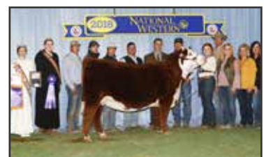
ECR/CHEZ/KRCK DANDY 6892 ET 2018 NWSS Grand Champion Horned Hereford Heifer Full Sister to Lot 13