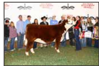
BACC 228Z TARA 108 ET

2023 Cattlemen's Congress Grand Champion Horned Hereford Heifer Full Sister in Blood to Lots 101 & 102