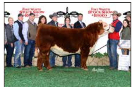
CH HIGH ROLLER 756 2020 FWSS Reserve Grand Champion Polled Hereford Bull Sire of Lot 9