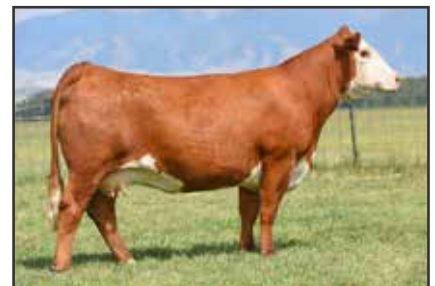
H MS O103 MARIAH 4437 ET

Prolific donor dam at Hoffman Ranch Full Sister to Lots 7 & 8