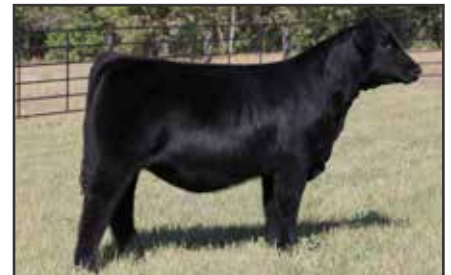
FIRES ROYAL FLIRT 7347K ET

2021 NAILE Supreme Champion Junior Breeding Heifer Maternal Sister to Dam of Lots 105-108