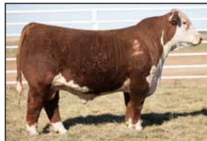
GKB 8123 BELLE AIR 1968

Service sire to several females throughout the offering!