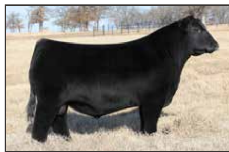
CONLEY LEAD THE WAY 0738

WILL CALVE BY SALE DAY TO SO REMEDY 7F (ASA 3419044).