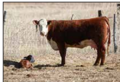
H W4 MARIAH 0103 ET Dam of Lots 7 & 8