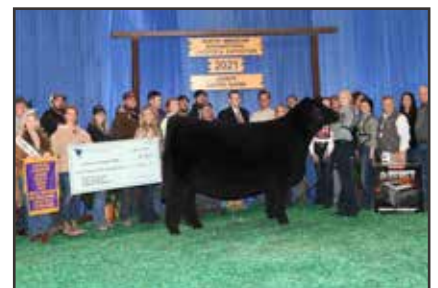
RATLIFF HOW BOUT IT 008H ET

2021 NAILE Supreme Champion Junior Breeding Heifer Maternal Sister to Dam of Lots 105-108