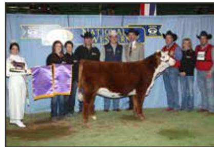
H W4 MARIAH 0103 ET 2011 NWSS Grand Champion Horned Hereford Heifer Dam of Lots 7 & 8

AI BRED 5/17/23 TO H THE PROFIT 8426 ET (AHA 43916400). PE 6/1/23-8/15/23 TO CH HIGH ROLLER 756 ET (AHA 43875385).