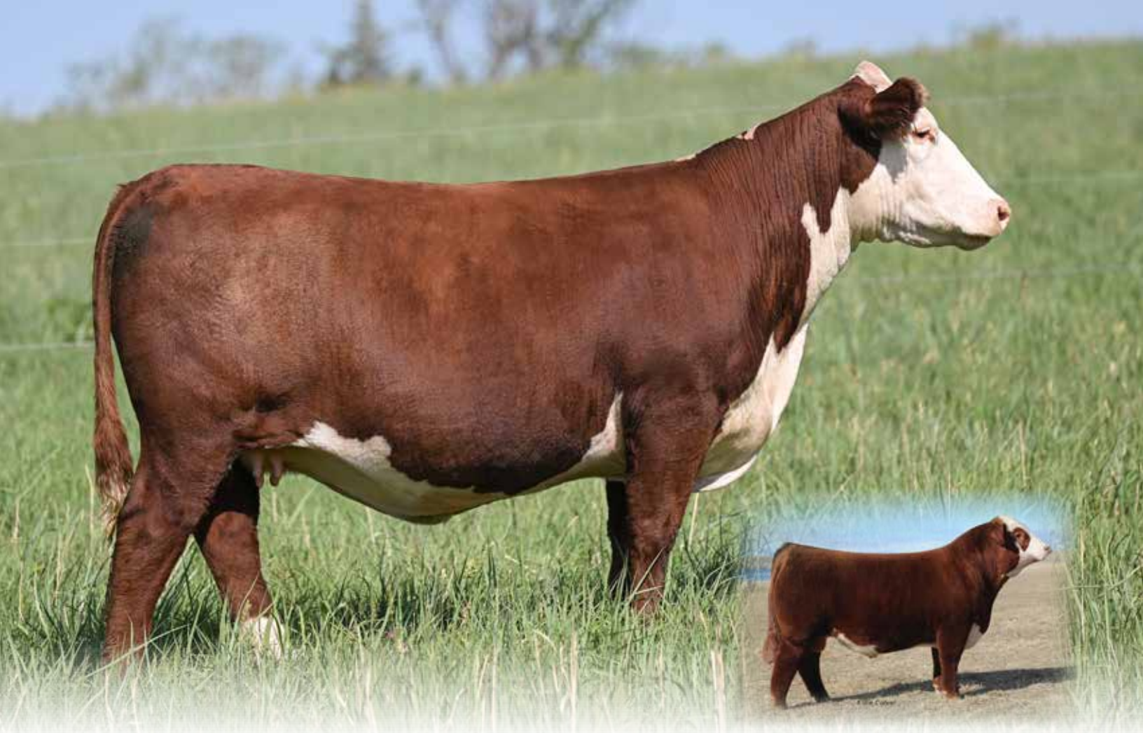
SIRE OF EMBRYOS