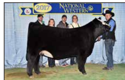
CHEZ STCC MILEY 5034C Dam of Lot 110