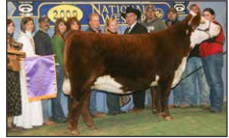
BF FLIRTATIOUS 713T

AI BRED 4/21/23 TO H THE PROFIT 8426 ET (AHA 43916400). EST DUE 1/28/24.