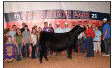
JSZC HH TSSC LARISSA 101G ET