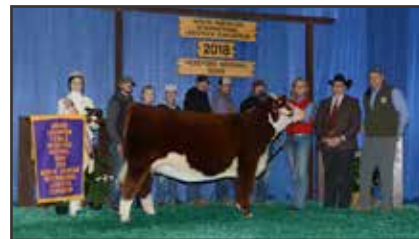
AUBREY'S CARLY 4054 11E ET

Dam of Lot 1 - 2015 American Royal & NAILE Grand Champion Hereford Heifer