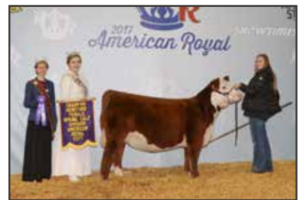
RJL TJ LCC ADDICTIVE 7441

DAM: MF 308N ADDY 1302 ET MF 62J NATALIE 122L 308N