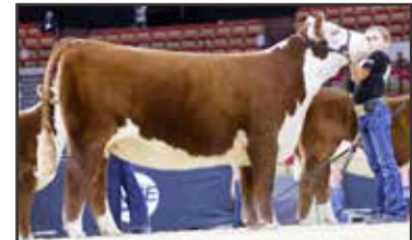
KOLT HCC ANNSLEY 414 2023 JNHE Class Winner. Daughter of Lot 11