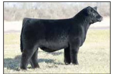
FIRES ZION 17H ET

Full Brother to Lot 108 & Sire of Lot 109