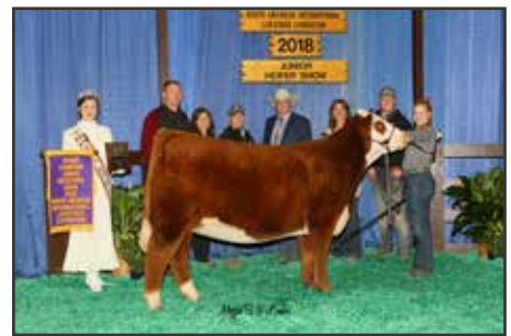
LAND MISS WHO MAKER 713 ET 2018 NAILE Grand Champion Hereford Heifer Maternal Sister to Lots 15-17

HEIFER CALF BORN 6/18/23 SIRE: UPS 7616 SENSATION 054 (AHA 44197481).