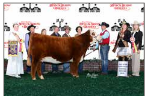
SULL DIANA 5555C ET

2017 FWSS Reserve Grand Champion Horned Hereford Heifer Full Sister to Lot 17