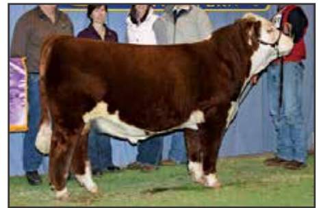
DELHAWK KAHUNA 1009 ET 2011 NWSS & FWSS Grand Champion Horned Hereford Bull Maternal Brother to Dam of Lot 18

AI BRED 4/19/23 TO SR DOMINATE 308F ET (AHA 43954712). EST DUE 1/26/24.