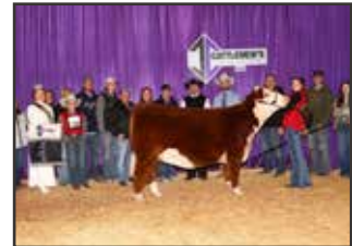
BACC 228Z TARA 108 ET

2023 Cattlemen's Congress Grand Champion Horned Hereford Heifer Full Sister in Blood to Lots 101 & 102