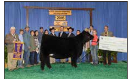
RIVERSTONE CHARMED 50C

2017 NAILE Grand Champion Chianina Bull Sire of Lots 105 & 106