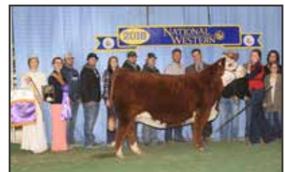
NCC 743 BRECKYNN C1857 ET 2018 NWSS Grand Champion Polled Hereford Heifer Full Sister to Sire of Lot 19

AI BRED 8/2/23 TO CH HIGH ROLLER 756 ET (AHA 43875385).