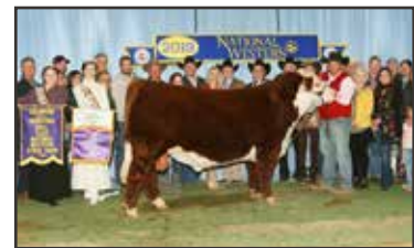
H DEBERARD 7454 ET 2019 NWSS Grand Champion Polled Hereford Bull Full Brother to Lot 14