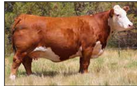
BCC MISS MAYBARRY 064X