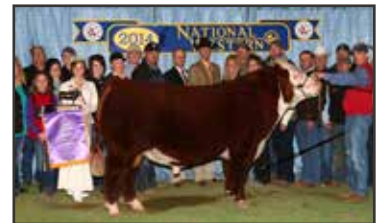
ECR WHO MAKER 210 ET 2014 NWSS Grand Champion Polled Hereford Bull Full Brother to Lot 13

SIRE: BNT AMERICAN MADE 906 ET (AHA 44077914).