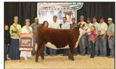
OCC LADY CASH 512 ET 2016 JNHE Grand Champion Polled Hereford Heifer Full Sister to Lot 13