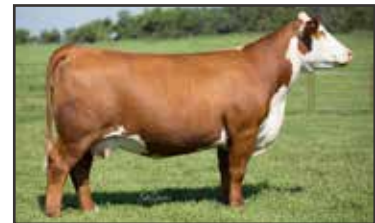
RST GAT NST Y79D LADY 54B ET Dam of Lot 14

AI BRED 7/19/23 TO CH HIGH ROLLER 756 ET (AHA 43875385).