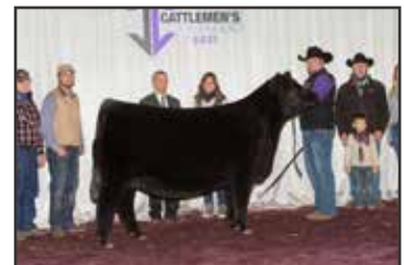
RATLIFF GOOGLE 911G ET 2021 Cattlemen's Congress Grand Champion Limousin Heifer Dam of Service Sire to Lot 25