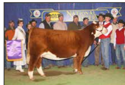
TCC MS DIANA 01

2012 NWSS Grand Champion Polled Hereford Heifer Dam of Lots 103