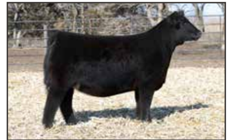
FIRES KARLEY'S FLIRT 20IK ET