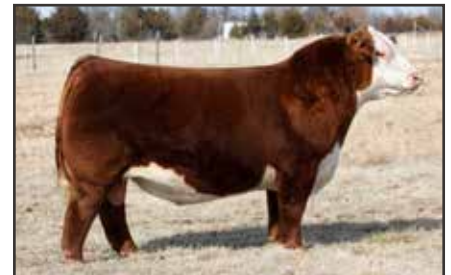
CH HIGH ROLLER 756 ET Sire of Lot 104