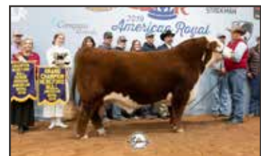
H MONTGOMERY 7437 ET 2019 American Royal Grand Champion Polled Hereford Bull Full Brother to Lot 14