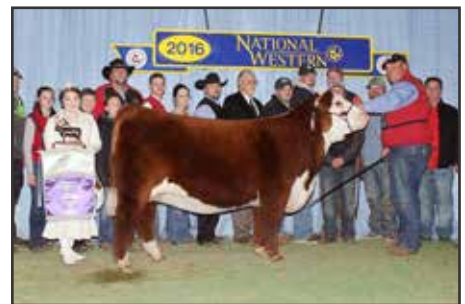
SULL TCC DIANA 4064B ET 2016 NWSS Grand Champion Horned Hereford Heifer Maternal Sister to Lots 15 & 16 Full Sister to Lot 17