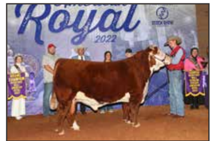
H FRONT RUNNER 1495 ET 2022 American Royal Grand Champion Hereford Bull Dam is a full sister to H H/G ELB Annsley 85F ET