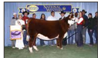
LAR ANNSLEY 843F 2020 NWSS Grand Champion Polled Hereford Heifer Member of the famed "Annsley" cow family!

PE 6/1/23-8/15/23 TO GKB 8123 BELLE AIR 1968 (AHA 44305639).