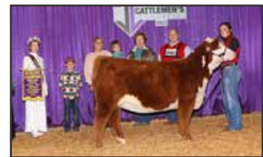
H H/C ANNSLEY 10Z 2022 Cattlemen's Congress Reserve Division Champion Full Sister to Lot 11