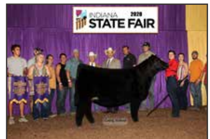
JSZC TSSC LARISSA 49C ET