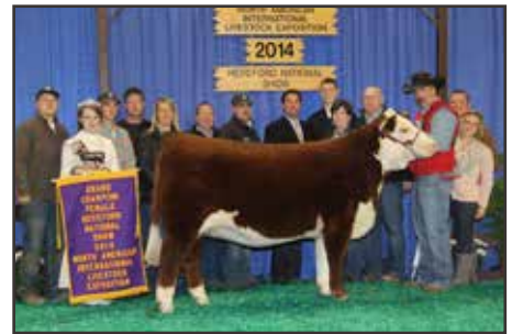
DELHAWK SAPPHIRE 102A 2014 NAILE Grand Champion Hereford Heifer Maternal Sister to Dam of Lot 18