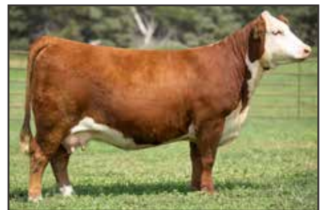
H SCG HCC DIANA 736G ET Featured donor in the Vickland Show Cattle program! Full Sister to Lot 15