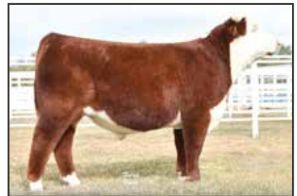
K RUSTIC 711 ET $120,000 NWSS Mile High Sale high seller! Sire of Lots 3 & 4