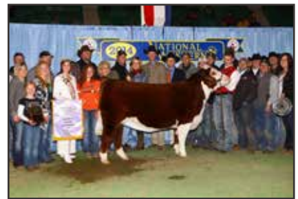
CHEZ STRAWBERRY WINE ET 204Z 2014 NWSS Reserve Grand Champion Polled Hereford Heifer Dam of Lots 2-4

AI BRED 4/1/23 TO H THE PROFIT 8426 ET (AHA 43916400). EST DUE 1/8/24.