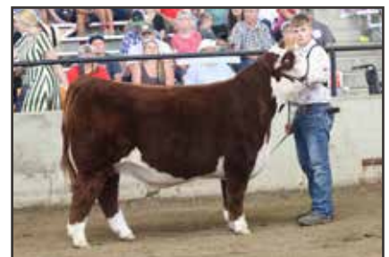
MATERNAL BROTHER TO EMBRYOS SELLING

2020 JNHE Reserve Grand Champion Bred & Owned Heifer.