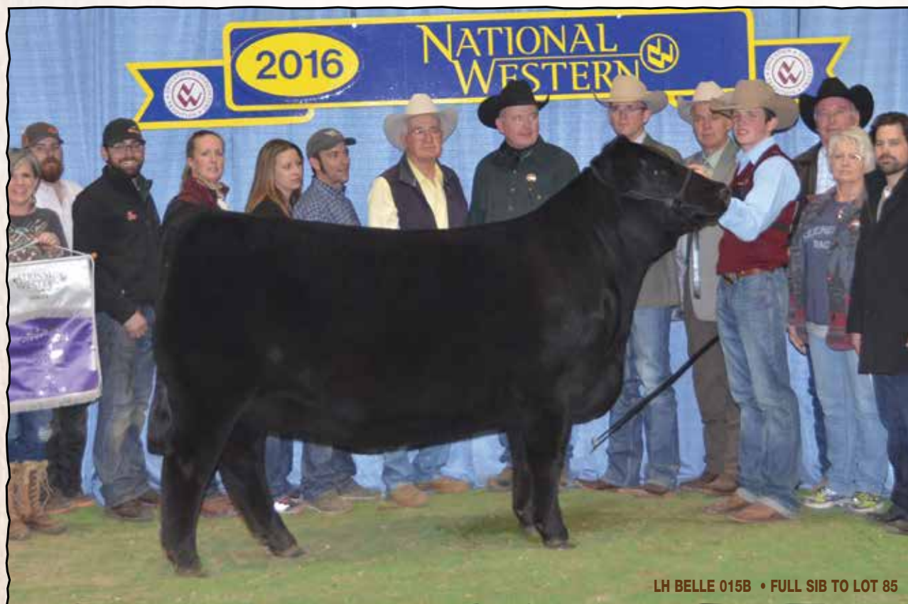
LH BELLE 015B • FULL SIB TO LOT 85