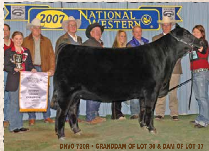
DHVO 720R • GRANDDAM OF LOT 36 & DAM OF LOT 37