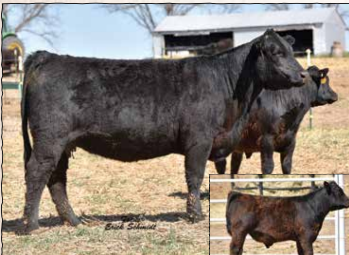
LOTS 55 & 55A

55 71% LIM-FLEX COW BD: 10/10/13 LFL AFTER HOURS 3100 A HOMO BLACK (P-2) HET POLLED (T) BLAW 3100A LFF2046389