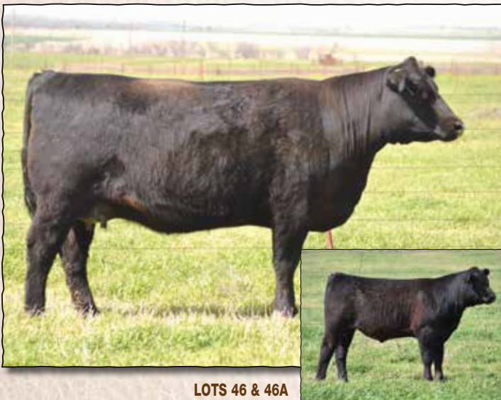
LOTS 46 & 46A