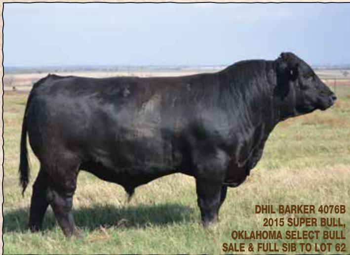
DHIL BARKER 4076B 2015 SUPER BULL, OKLAHOMA SELECT BULL SALE & FULL SIB TO LOT 62