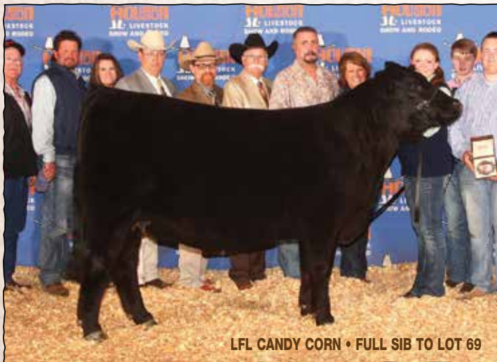
LFL CANDY CORN • FULL SIB TO LOT 69

69 87% PUREBRED COW BD: 6/4/11 LFL STAR STRUCK 1054 Y HOMO BLACK (T) HET POLLED (T) BLAW 1054Y NPF1990201