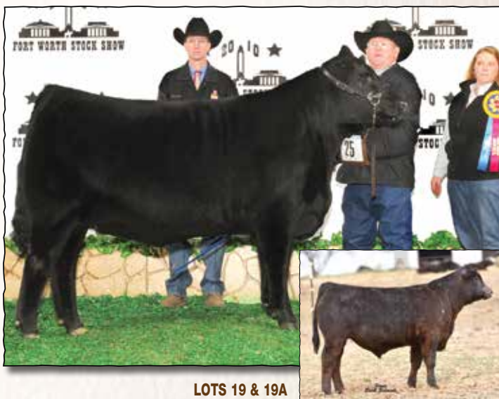
LOTS 19 & 19A