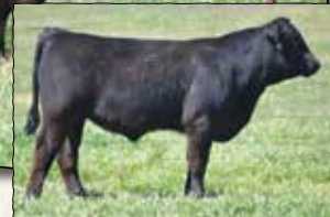
LOTS 41 & 41A