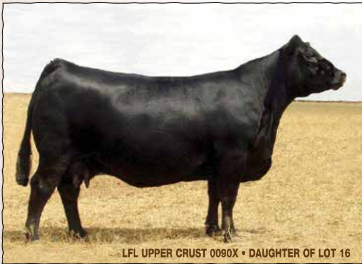
LFL UPPER CRUST 0090X • DAUGHTER OF LOT 16