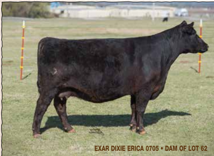
EXAR DIXIE ERICA 0705 • DAM OF LOT 62