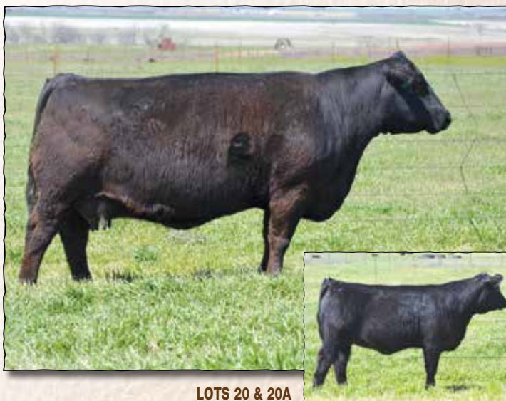
LOTS 20 & 20A