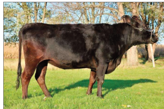
DAM: Synergy Itomichi Hiko 35C