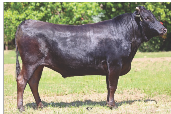
SIRE: Arubial Bond Q007

A double bred Mayura Itoshigenami JNR need we say more! The sire here is Arubial Bond Q007, who is a Mayura Itoshigenami JNR x Mayura Itoshigenami JNR x Michifuku x Shikikan x JVP 068 x the Tetufuku maternal line. He boasts sky high genomic EBVs of +3.3 MS, +0.54 MF, and +10.4 REA!! He is mated to a high growth and maternal traits Hikokura donor in SYNERGY ITOMICHI HIKO 35C (ET). She is an Itomichi ½ daughter of the $56,000 Stonyrun Hikokura 15 cow who sold to G$ Ranches in our 2018 sale. Her genomic EBVs include a +17 200D Wt, +30 400D Wt, +42 600D Wt, +5 Milk, and +34 Carcass Wt. This mating of high carcass traits on elite maternal and growth traits will produce balanced cattle to increase profitability on any operation.