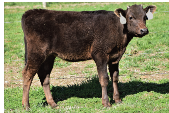
DAM: Synergy F154 Chiyotake 530G