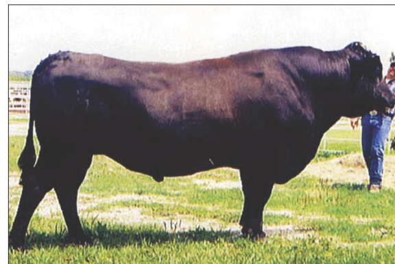
SIRE: World K's Shigeshigetani 1593

Lot 1 is an ideal pairing of elite carcass traits in World K's Shigeshigetani and a high growth Sumo Michifuku F154 daughter, in Synergy F154 Chiyotake 530G. World K's Shigeshigetani is a highly proven and leading EBV sire who currently has a +2.2 MS and +9.9 Ribeye Area with 103 carcasses on his proof. He also has fantastic results published in herds like Lone Mountain Ranch where he has averaged 30.50% IMF over 56 carcasses and Mayura Station where he averaged an 8.50 AUS-Meat MS on 22 carcasses. Synergy F154 Chiyotake 530G is one of the oldest Sumo F154 daughters in the USA and comes from the highly proven Takeda Chiyotake maternal line. She has top 1% EBVs for 200D Wt, 400D Wt, 600D Wt, and Carcass Wt EBVs! Her Indexes are incredible too at +$291 WBI, +$266 SRI, and +$211 FTI. Parent average for these embryos is an incredible +$265 Self Replacing Index with a +1.5 MS, +5.3 REA, and +33 Carcass Wt!