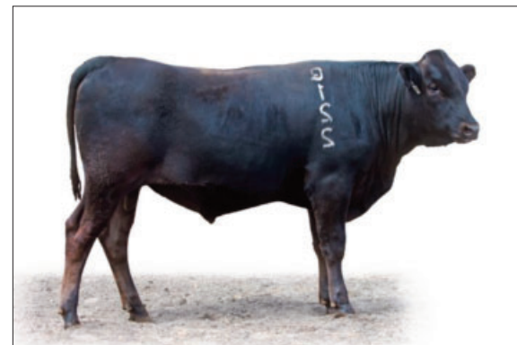
SIRE: Circle 8 Bulls Q122

Synergy 003 Suzutani 523G is one of the best Suzutani pedigreed females in the world with a sire stack of 003 x Michifuku x Takazakura (Shikikan's full sister) x Suzutani!! She also possesses top notch genomic EBVs +1.7 MS, +3.8 REA, and +0.33 MF! The sire is the high genomic EBV bull, Circle8Bulls Q122, who topped the 2020 Elite Wagyu Sale for $42,000. He has GEBVs of +2.2 MS, +3.3 REA, +39 CW, and Top 1% Indexes! He is a Sumo F154 who exceeds his father and is stacked on the well regarded Aizakura maternal line. Again, these embryos will produce balanced and profitable genetics for carcass production while limiting risk! (Sire is not registered in the US)