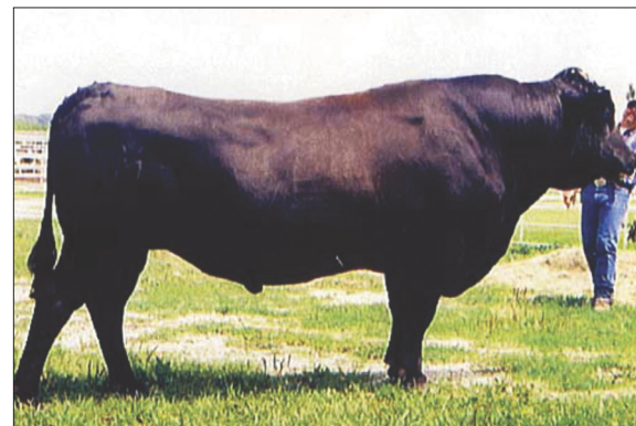
SIRE: World K's Shigeshigetani 1593

Here is another pairing of World K's Shigeshigetani and a high growth Sumo Michifuku F154 daughter, in Synergy F154 Chiyotake 534G. World K's Shigeshigetani is a highly proven and leading EBV sire who currently has a +2.2 MS and +9.9 Ribeye Area with 103 carcasses on his proof. He also has fantastic results published in herds like Lone Mountain Ranch where he has averaged 30.50% IMF over 56 carcasses and Mayura Station where he averaged an 8.50 AUS-Meat MS on 22 carcasses. Synergy F154 Chiyotake 534G is one of the oldest Sumo F154 daughters in the USA and comes from the highly proven Takeda Chiyotake maternal line. She has top 1% EBVs for 200D Wt, 400D Wt, 600D Wt, and Carcass Wt EBVs! Her Indexes are incredible too at +$258 WBI, +$237 SRI, and +$194 FTI. Parent average for these embryos is an incredible +$250 Self Replacing Index with a +1.5 MS, +4.8 REA, and +32 Carcass Wt. Here is a chance to get the highly proven Shigeshigetani stacked on the elite GEBV new proven sire Sumo F154!