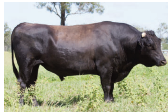
SIRE: SUMO Cattle Co Michifuku F126

MONJIRO MICHIKO J655635 TF ITOHANA 2 SUMO MICHIFUKU U2208 HIRASHIGETAYASU J2351 HONGEN GEANCA F Z5015 WORLD K'S MICHIFUKU LAKE WAGYU Y043