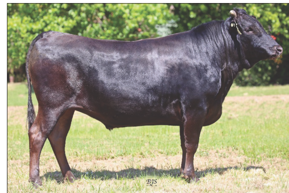
SIRE: Arubial Bond Q007 (AI) (ET)

A double bred Mayura Itoshigenami JNR need we say more! The sire here is Arubial Bond Q007, who is a Mayura Itoshigenami JNR x Mayura Itoshigenami JNR x Michifuku x Shikikan x JVP 068 x the Tetufuku maternal line. He boasts sky high genomic EBVs of +3.3 MS, +0.54 MF, and +10.4 REA!! He is mated to a high growth Synergy F154 Chiyotake 530G, who is one of the oldest Sumo F154 daughters in the USA. She descends from the highly proven Takeda Chiyotake maternal line and has top 1% EBVs for 200D Wt, 400D Wt, 600D Wt, and Carcass Wt EBVs! Her Indexes are incredible too at +$291 WBI, +$266 SRI, and +$211 FTI. Parent average for these embryos is an incredible +$281 Self Replacing Index with a +2.0 MS, +5.6 REA, and +34 Carcass Wt! These embryos combine the breed leading genetics of Mayura Itoshigenami JNR with Sumo Cattle Co Michifuku F154!