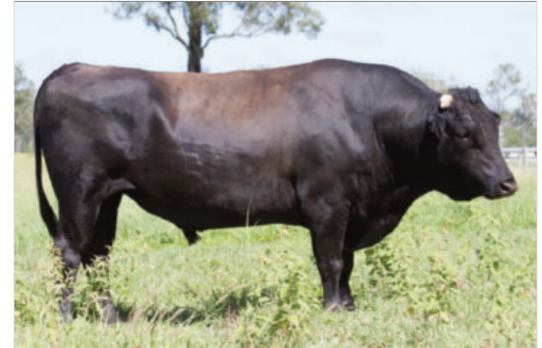
SIRE: SUMO Cattle Co Michifuku F126

WORLD K'S MICHIFUKU MONJIRO SUMO CATTLE CO MICHIFUKU F126 MICHIKO J655635 SUMO CATTLE CO HANA C152 TF ITOHANA 2 SUMO MICHIFUKU U2208 GOORAMBAT TERUTANI F146 TERUTANI 40/1 GOORAMBAT STONYRUN GOORAMBAT F C0021 GOORAMBAT J0338 PEPPERMILL GROVE D139 LAKE WAGYU F D044