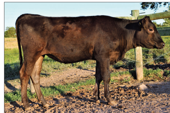
DAM: Synergy F154 Chiyotake 534G