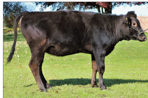
DAM: Synergy F154 Chiyotake 536G