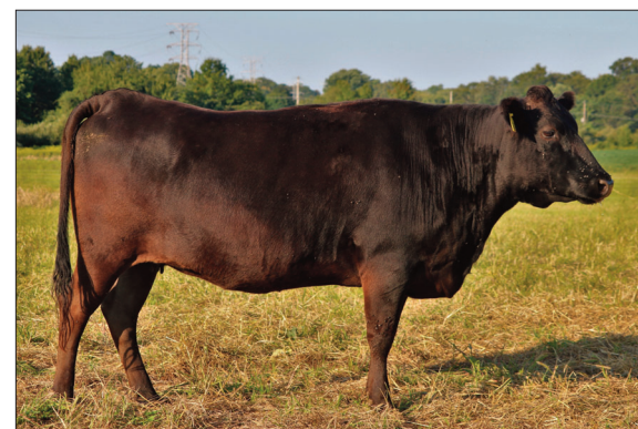
MATERNAL GRANDAM: BPF MS Mich 109