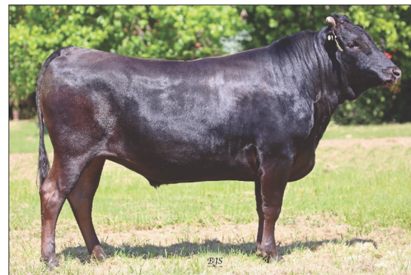
SIRE: Arubial Bond Q007

A double bred Mayura Itoshigenami JNR need we say more! The sire here is Arubial Bond Q007, who is a Mayura Itoshigenami JNR x Mayura Itoshigenami JNR x Michifuku x Shikikan x JVP 068 x the Tetufuku maternal line. He boasts sky high genomic EBVs of +3.3 MS, +0.54 MF, and +10.4 REA!! He is mated to a high growth Synergy F154 Chiyotake 536G, who is one of the oldest Sumo F154 daughters in the USA. She has an elite Takeda Chiyotake maternal line sire stack of Sumo F154 x Peppermill Grove D139 x Michifuku x TF 147 x Chiyotakes! Parent average for these embryos is +$245 Self Replacing Index with a +2.0 MS, +6.2 REA, and +21 Carcass Wt! Don't miss this lot combining the breed leading genetics of Mayura Itoshigenami JNR with Sumo Cattle Co Michifuku F154!