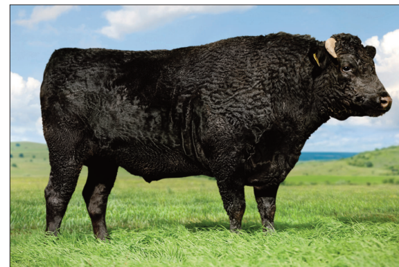
SIRE: Mayura L0010

The sire here is the phenom Mayura L0010, the $105,000 Mayura Itoshigenami JNR son with multiple top 1% GEBVs and Indexes! He has a +2.5 MS, +7.1 REA, and +40 Carcass Wt! He comes from the elite Aizakura maternal line and his dam has averaged a 9.33 MS, 1,087 lbs HCW, and 16.34 In2 REA over 3 head. The donor dam here is Synergy F154 Chiyotake 534G, one of the oldest Sumo F154 daughters in the USA and comes from the highly proven Takeda Chiyotake maternal line. She has top 1% EBVs for 200D Wt, 400D Wt, 600D Wt, and Carcass Wt EBVs! Her Indexes are incredible too at +$258 WBI, +$237 SRI, and +$194 FTI. Parent average for these embryos is an incredible +$273 Self Replacing Index with a +1.6 MS, +3.3 REA, and +48 Carcass Wt. Here is a chance to get Mayura Itoshigenami JNR genetics stacked on an elite GEBV Sumo F154 daughter!