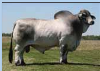
Paternal grandsire, +Mr H Maddox Manso 684

BW: 2.4 | WW: 13.9 | YW: 25.1 | MILK: 7.4