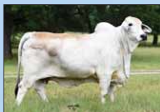
Maternal great-grandam, +-GS MS Mulhim Manso 314

When we were putting this offering together we all agreed on the first 15 pretty well. It was Lady Ferrari that a few of the team had to give in on as we would really like to have kept her due to her pedigree, structure and “cowy” look. This is the third of the Presumida/Rufus cross being offered. You can look at her two sisters earlier in the sale and see the similarities that they all offer being big boned, deep ribbed and thick ended. You can also read how much we think of this genetic cross incorporating what has proven to be one of our best donors and cow families and crossing it with the 2016 International Champion Red Bull that has proved to really be a herd sire. We’re a little sad to see this one go but we are SUPER excited to see her work for the new buyer!