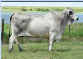
Dam, Miss B-F 48/6