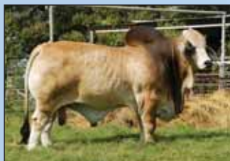
Sire, JDH SIR Stratton Manso 823/4

BW: 2.5 | WW: 25.1 | YW: 41.5 | MILK: 2.1