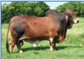
Sire, Mr. Fontenot 333

We are again offering you a bull prospect from the heart of our herd that blends two of the most influential animals at Moreno Ranches. This low birthweight show bull prospect is sired by the 2016 ABBA International Champion Red Bull Mr. Fontenot 333 "Rufus." We are extremely excited about our first calves from this outcross red sire as he is injecting his outstanding phenotype into his offspring as they are structurally sound, stout constructed, heavy muscled and deep ribbed. The dam to this elite prospect is the premier donor Miss B-F 48/6. Her pedigree combines three of the breeds icons in JDH Bross Manso, (+) JDH Datapack and (+)JDH Copano Manso. As might be expected with such a power-packed pedigree, she has been a remarkable donor in the Moreno Ranches program having produced six offspring that have accumulated points in ABBA Shows and a herd sire retained by Moreno Ranches. Take advantage of one of the most proven matings that we can offer as he will be one that will be a herd influencer for years to come.