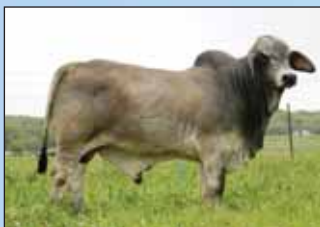
Sire, JDH Mr Manso 734