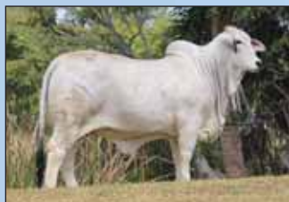
Dam, Moreno Ms Lady Presumida 376

BW: 1.9 | WW: 14.8 | YW: 25.5 | MILK: 6.2