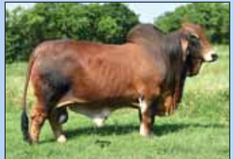
Sire, Mr. Fontenot 333

The name says it all! This young bull is certainly a rising star and will be one that will mark his place in the breed due to his show ring performance and his stout build but more importantly his “cutting edge” pedigree. Rising Star is the result of blending two of the top Moreno Ranches show animals to ever exist. His sire is Mr. Fontenot 333 “Rufus”, the 2016 ABBA International Champion Red Bull and Moreno Ms. Lady Rumbera, the 2017 ABBA Red Show Cow of the Year. Not only are his parents the epitome of greatness, but he offers a proven outcross pedigree combining the foundation genetics of HK, Fontenot Red Brahmans and of course the iconic +JDH Elmo with our leading donor +HK 557 that produced the 2017 International Champion LB Myles. You asked for a top bull prospect and we dug deep and are making him available in this special sale. Take advantage of this opportunity, buy yourself genetic lead time and be at the forefront of the breed!