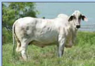
Dam, TTT Ms Suvette Marti 661

BW: 2.6 | WW: 15.5 | YW: 28.2 | MILK: 5.5