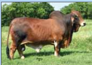
Sire, Mr. Fontenot 333

If you are thinking that you've seen this pedigree before, you are correct. She is a full sister to lot 15 as well as the highlight of our Catalyst V Sale. Just as her siblings, she has the functional build being deep bodied, eye appealing with great breed character all in a deep red package. Not only does Rapunzel provide an ideal phenotype but is backed by one of our most proven matings being sired by the 2016 ABBA International Champion Red Bull Mr. Fontenot 333 "Rufus" and out of the premier donor Miss B-F 48/6. This pedigree combines an outcross to many of today's popular bloodlines which only gives Rapunzel more value. She not only combines the already proven Rufus and his foundation pedigree but some of the most performance oriented genetics in the breed with JDH Bross Manso, (+) JDH Datapack and (+)JDH Copano Manso. Each mating that we produce at Moreno Ranches is well thought out and we just don't know how we could have made this one any better.