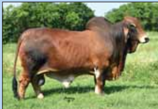
Sire, Mr. Fontenot 333

When we were selecting our offering, we couldn't decide between Rosemary and her sister lot 7 so we decided to offer them both and let you make the decision. Just like her sister, Rosemary offers the complete package combining eye appeal, balance, volume, muscle and bone. This is another opportunity to buy a daughter from Mr. Fontenot 333 "Rufus" the 2016 ABBA International Champion Red Bull that is doing us such a great job. Her dam is a paternal half sister to the leading donor Aspe that has produced show winners and top sellers alike. When purchasing females at this age you have to consider not only how they will show but the impact that they will play in your herd. With the pedigree and maternal traits that Rosemary offers we would have to think that she will be one that will be a big time donor!