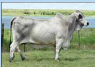
Dam, Miss B-F 48/6