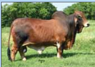
Sire, Mr. Fontenot 333

Merry Christmas! The buyer of this one is truly going to get a “gift”! This is an outstanding female that will no doubt be a show ring contender with her outstanding look but also a lead donor with her proven pedigree. She is out of what is proving to be one of our top donors, Moreno Ms. Lady Presumida. Presumida’s progeny have topped the Fall Shows as well as our recent sales. Presumida represents some of the most proven cow lines in the Brahman breed and note that every animal in her pedigree has reached Register of Renown Status. To only add to this already impressive “package” is her sire Mr. Fontentot 333 “Rufus,” the 2016 International Champion and our leading red sire of the year. You can’t go wrong with this one!