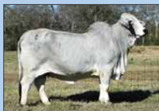
Maternal grandam, +Miss B-F 201/9

When we were putting this offering together we all agreed on the first 15 pretty well. It was Lady Ferrari that a few of the team had to give in on as we would really like to have kept her due to her pedigree, structure and “cowy” look. This is the third of the Presumida/Rufus cross being offered. You can look at her two sisters earlier in the sale and see the similarities that they all offer being big boned, deep ribbed and thick ended. You can also read how much we think of this genetic cross incorporating what has proven to be one of our best donors and cow families and crossing it with the 2016 International Champion Red Bull that has proved to really be a herd sire. We’re a little sad to see this one go but we are SUPER excited to see her work for the new buyer!