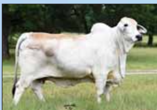
Maternal great-grandam, +-GS MS Mulhim Manso 314