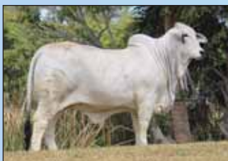
Dam, Moreno Ms Lady Presumida 376