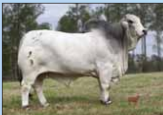
Maternal brother, DF Snowman 91/6