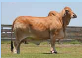
Dam, Moreno Ms. Lady Ritmo 712