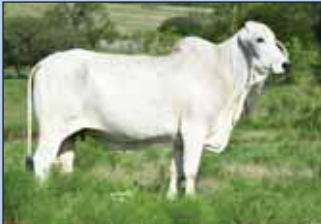
Dam, +TTT Suva's Echo Lady 700