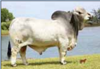
TTT Suva Bob Manso 786/3, a full sib.

Selling half interest and full possession.