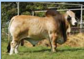
Sire, JDH SIR Stratton Manso 823/4

Check out this genetic combination! A daughter of JDH Sir Stratton Manso that we own exclusively with J.D. Hudgins-Locke Division. Stratton is a top son of the National Champion & Internationally proven +JDH Elmo Manso and out of the great +JDH Lady Sandy Manso who is not only a top (+) Madison/(+)Woodman cross donor but has produced five herd sires and the dam to Butterbean the 2016 National Champion Red Bull and 2017 Red Show Bull of the Year. Stratton has produced extremely well for us and others resulting in winners and top sellers around the world. To only strengthen this offering is her dam +JDH Lady Miranda who is also the dam to the National Champion and Register of Renown DF Snowman. We simply don't know how else we could have built a better and more proven pedigree. Even though she has a strong pedigree, you have to appreciate her in the flesh as she is as fancy as they come being super feminine, well balanced and eye appealing. There's no doubt that she will be a favorite on sale day!