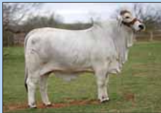
Dam, Miss RB 515/1