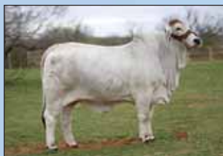
Dam, Miss RB 515/1

Proven genetics! Lady Sonny is a flushmate to lot 8. As you can tell, the field to make this sale was pretty strong and for this mating to have produced two that got in is pretty impressive. She is sired by JDH Sir Stratton Manso that we own exclusively with J.D. Hudgins-Locke Division. Stratton has done us, J.D. Hudgins and many others around the world a great job by producing cattle that win in the show ring and are in demand by buyers. We love his proven pedigree that combines the iconic +JDH Elmo Manso with one of the most proven cows in the breed, +JDH Lady Sandy Manso who has produced five herd sires and the dam to Butterbean the 2017 Red Show Bull of the Year. Sonny's dam is Miss RB 515/1 a top donor that we own with RB Ranch. 515/1 is sired by the top producing sire +JADL Rey TE that most recently sired "Ring King" the National Champion, Reserve International Champion, ABBA Show Bull of the Year and the #1 show point earner of the past 20 years. If you like them to have the brood cow look being deep ribbed, big boned with ideal breed character, then you are going to really like Lady Sonny.