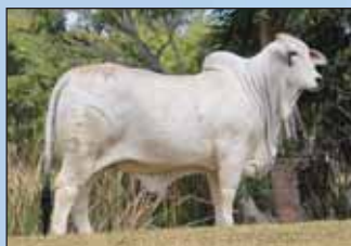
Dam, Moreno Ms. Lady Presumida 376