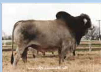
Maternal grandsire, +TTT Mr. Mayro Suva 845

Selling half embryo interest and full possession.