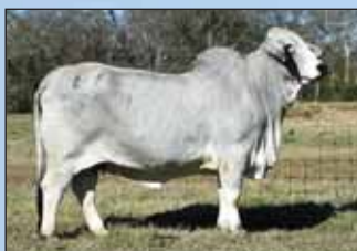
Maternal grandam, +Miss B-F 201/9