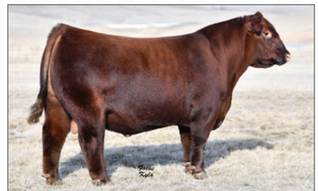
ROJAS TR CHIVAS 17109 Sire of Lot 28