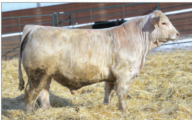
CAG TR BC FRANCHISE 8606F Sire of Lot 19

A moderate framed, complete, sound structured daughter of LT Authority. Authority is a past $160,000 high seller for Lindskov-Thiel. His cattle are highly maternal and are making nice females.