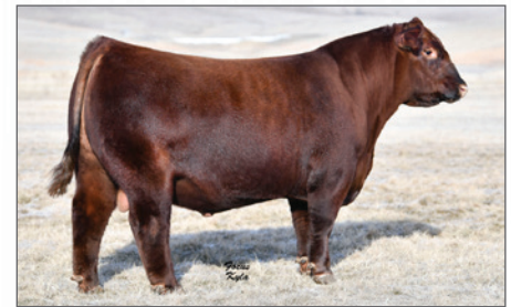
ROJAS TR CHIVAS 17109 Sire of Lot 37