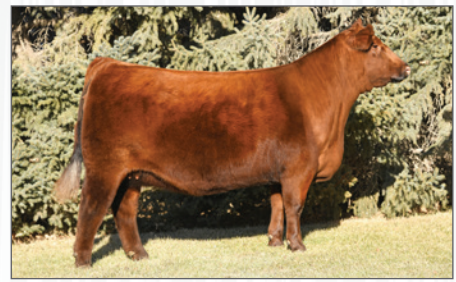
ROJAS NAVARRE 6054 Sire's Dam of Lot 38