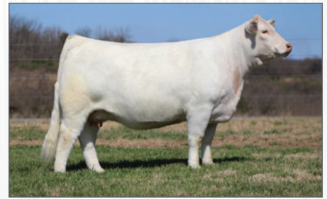
JACKIE O Dam of Lot 5 & 6