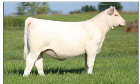
HF BELLE 113, Sells at Lot 1