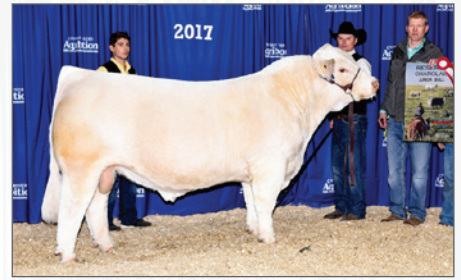
SHARODON DOUBLE VISION 1D Sire of Lots 15 & 16