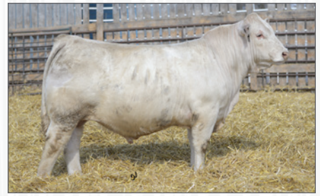
WCR ICON 756 Sire of Lot 9