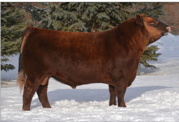
DAMAR TRUMP C512 Grandsire of Lots 42 & 43

DUE FEBRUARY 27TH TO ERKS MULBERRY 9918 A high-quality category 3 female carrying the service of ERKS Mulberry.