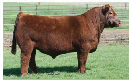
PZC TMAS FIRESTORM Maternal Sire of Lot 39