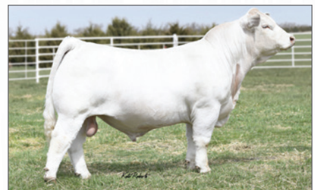
TR CAG CARBINE'S VISION 9700 Sire of Lot 2