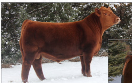
AHL FLASHBACK 446B Maternal Sire of Lot 32

Another high-quality daughter of Tango. Lot 31 is a long spined, feminine, and attractive March born heifer that reads to have a shot more growth. We feel that this heifer is very basic built and fault free.