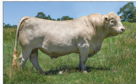
SAT GRIDMAKER 6306 $27,000 Sire of Lot 11