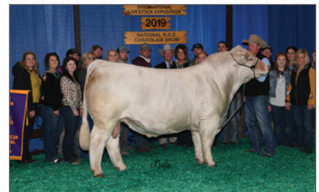
TR CAG CARBON COPY Sire of Lot 5 & 6