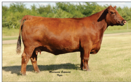
GT CITA 4060 Maternal Grandam of Lot 36