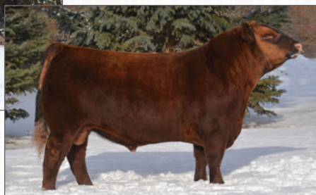
DAMAR TRUMP C512 Sire of Lot 32