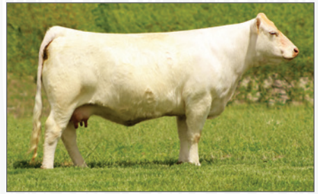
MDL MISS EDGE 810 Maternal Grandam