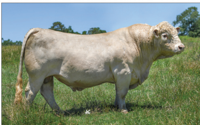
SAT GRIDMAKER 6306 P ET Sire of Lots 11 & 20

Another great combination of pedigrees here. Franchise x Rhinestone x Diablo. Lot 19 has a bright future when you factor her physical build with her pedigree. Moderate, feminine, and attractive.