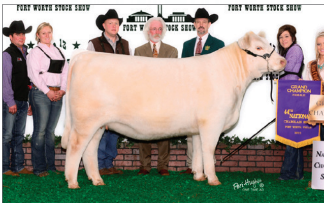
TR MS MONTELLA 1572Y Maternal Granddam of Lot 17

Lot 16 is a three-quarter sib to Lot 15. You really must appreciate her basic, fault free build and sound structure. These are the type of no-holes cattle that stay around for years. Her service sire, HF Progressive, was a highlight of the 2021 National Sale and sold to Aces Wild Ranch.