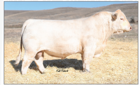
LT AUTHORITY 7229 PLD Sire of Lot 18