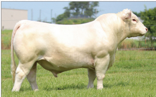
HF PROGRESSIVE 003 P ET Service Sire of Lot 16

Another outcross pedigree that will give the new owner a lot of flexibility coming mating time. This is a direct daughter of Double Vision, the Canadian outcross sire. Lot 15 is a complete package with an attractive build and nice hip.