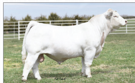
TR CAG CARBINE'S VISION 9700 ET Service Sire to many bred heifers