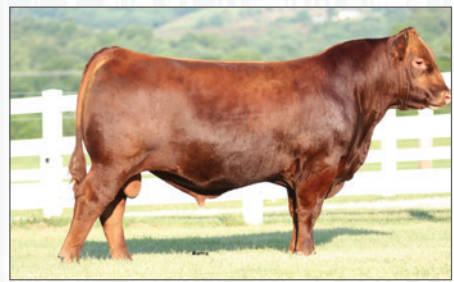
ERKS MULBERRY 9918 Service Sire of Lot 36