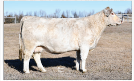
TR MS RANDI 0633X Paternal Grandam of Lot 7