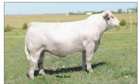
RMB TR RHINESTONE Maternal Sire

This Carbine's Vision x Rhinestone x Montezuma combination is cut from the same cloth as her sisters lotted before. Sound, complete and fault free in her make up. Bruce has several of the C&S females working for him and they have been highly productive over the past couple years. Lot 4's best days might lay ahead as a cow and potential donor.