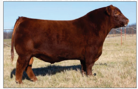
TWG TANGO 156D Sired of Lot 27