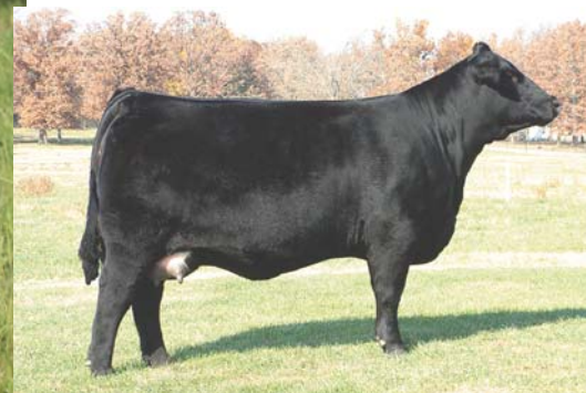
AUTO Rebeca 292S, dam of Lot 3.