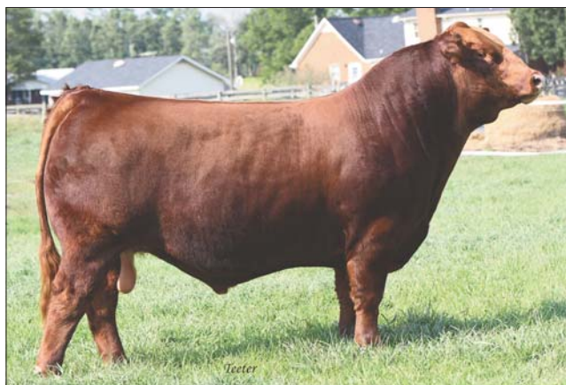
ELCX Englishman 769E