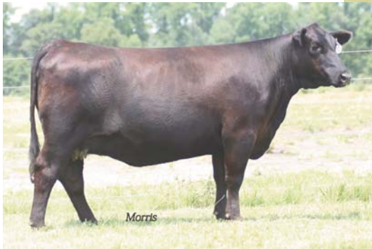
EBFL San Jose 170X, dam of Lot 20.

Lim-Flex (53) Cow HP / HB ELCX 137J LFF2518136 05.17.2021