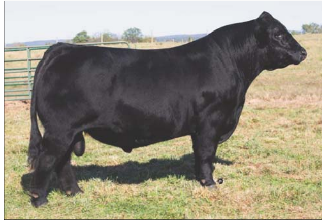
TASF Grey Goose 333G