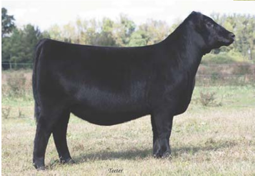
ELC Jules Chip J066, full sister.

Angus Cow Polled / Black H074 AAA +20403520 12.14.2020