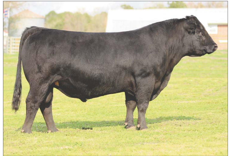
ELCX Caesar 331C, sire of Lot 15 & 16.

The heifer calf at side is ELCX Kammie 020K, a double black and double polled daughter of ELCX Camp Fire 508C, the OKSU The Profit 4301 son. This April heifer calf is 52% Lim-Flex. BW: 72 lbs.