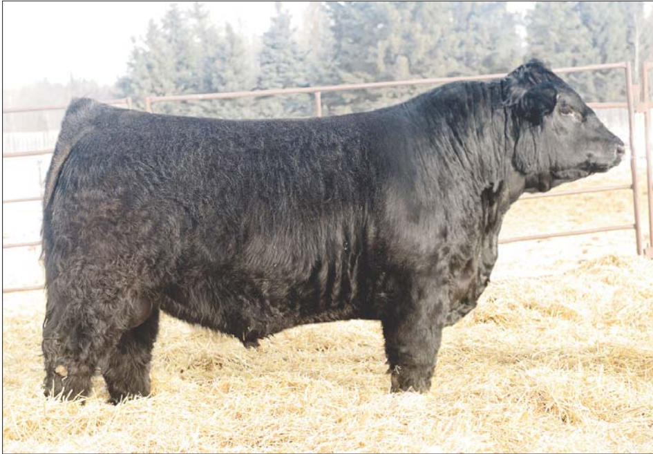
Riverstone Exodus ET, sire of Lots 31, 32 and 33.

PB Limousin (93) Cow HP / HB ELCX 656H NPF2509269 11.28.2020