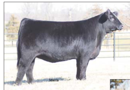
AUTO Poem 273Y, dam of Lot 4 embryos.

Consigned by KLS Farms, Chatham, LA, Sullivan Farms, Dunlap, IA and Edwards Land & Cattle Co.