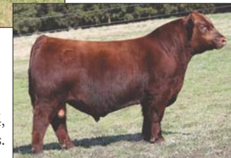
EGL GCC Red Eagle E7194, sire of Lot 5A & 5B embryos.