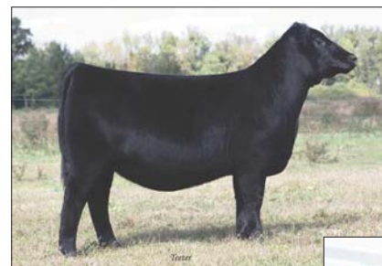
ELC Jules Chip J066, dam of Lot 6A & 6B embryos.