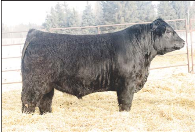
Riverstone Exodus ET