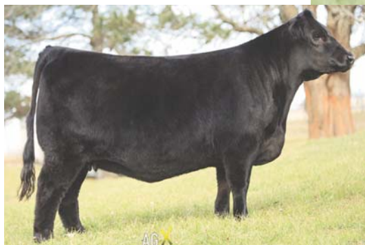
ELCX Elevate, full sister to Lot 2.

Lim-Flex (62) Cow Polled / HB TAYS 221J LFF2481025 09.24.2021