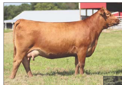
SBLX Zane, dam of Lot 5A & 5B embryos.