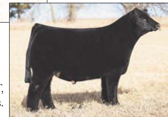
Ratliff Jump Start 340J ET, sire of Lot 4 embryos.