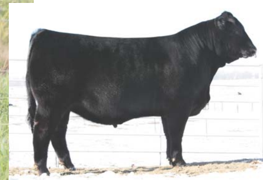
MAGS Winston, sire of Lot 17

Lim-Flex (51) Cow HP / DB ELCX 8223J LFF2509720 01.05.2021