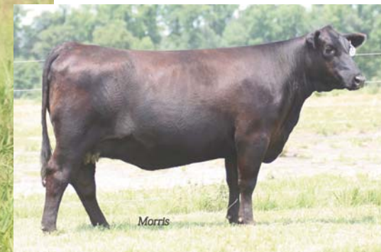
EBFL San Jose 170X, dam of Lot 19.

Lim-Flex (53) Cow HP / HB ELCX 131J LFF2518139 05.05.2021