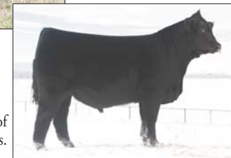
MAGS Xyloid, sire of Lot 6A & 6B embryos.