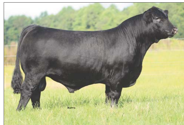
HWCB Eye of the Storm 406E

Lim-Flex (50) Bull HP / Red ELCX 769E LFM2140418 12.20.2017