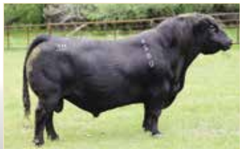
HF Crossfire 280D, sire of Group 8