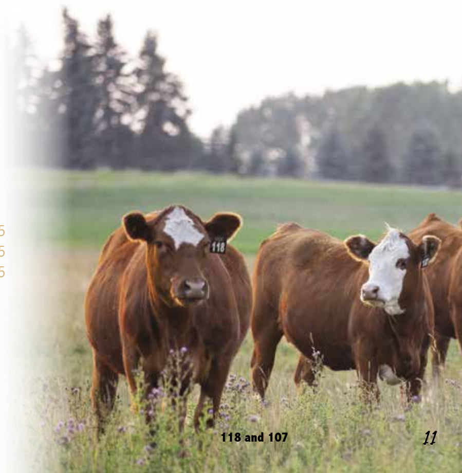
118 and 107