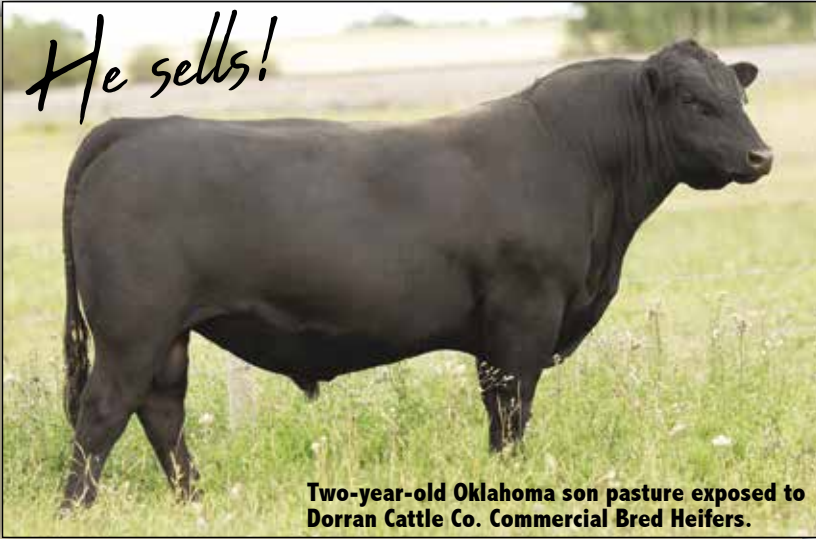
Two-year-old Oklahoma son pasture exposed to Dorran Cattle Co. Commercial Bred Heifers.