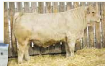
AI sire to 140