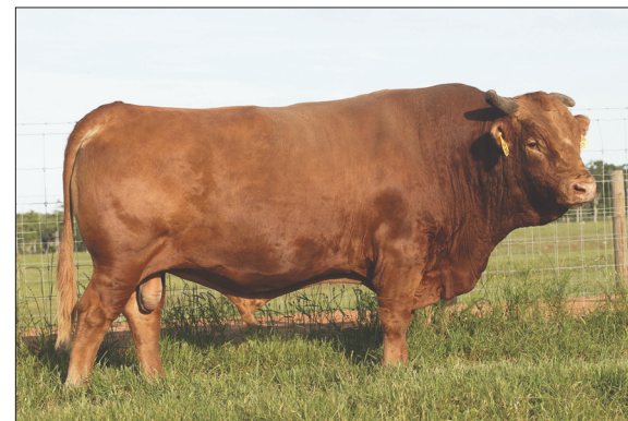
SIRE: HB Big Al Q502