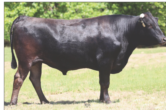
SIRE: Arubial United P0342

This lot is sired by the ARUBIAL UNITED P0342 bull who has fantastic balanced and breed leading genomic EBVs. He is in the top 1% of the breed for all 4 Indexes and is highlighted by his +1.8 MS, +2.9 REA, +61 CW, +6 Milk, and +60 600 Day Wt! He is sired by the Sumo F126 bull who has averaged an 8.6 MS in the Sumo herd and is stacked on a highly proven Macquarie Wagyu cow. The donor dam here is a Hikokura maternal line cow with an impressive sire stack of TF 148 x TF 151 x Michifuku x Itohana 2 x Hikokuras. She has elite genomic EBVs of +1.6 MS and +0.34 MF and has produced one carcass in our program with a Marble Score of 9 on the AUS-MEAT Scale, 16.01 In2 REA, and 892 lbs HCW all at only 27 Months and 410 DOF. Her fantastic carcass traits have transmitted well and are an ideal compliment to Arubial United.