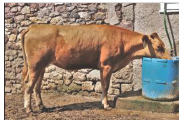
DAM: BRW Leoti 011D