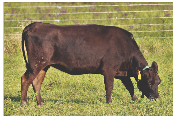
DAM: Synergy Haru Y5 Suzu