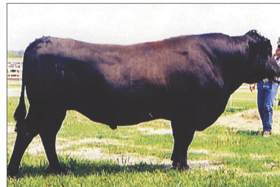
SIRE: World K's Shigeshigetani 1593

The dam here is one of the highest Indexing Genjiro daughters in the breed! If that wasn't enough, she is from the Suzutani maternal, bringing together the legendary Okutani and Suzutani lines into a single pedigree that traces back to a full sister to Shigeshigetani. She has elite growth and carcass weight genomics all in the top 5% of the breed. She is paired with a fellow breed leading Suzutani maternal line sire in World K's Shigeshigetani. He is the perfect compliment to her growth and maternal traits with a +2.1 MS and +10.1 REA! His numbers are highly proven with an incredible 103 carcasses on his Breedplan proof now. These embryos are offer the rare opportunity to get a double bred Suzutani with elite breed leading parent average EBVs!