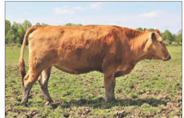
DAM: BLF MS Henshin II