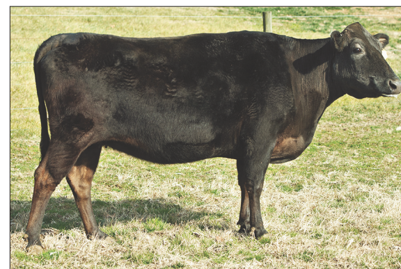
DAM: MS Sigenami