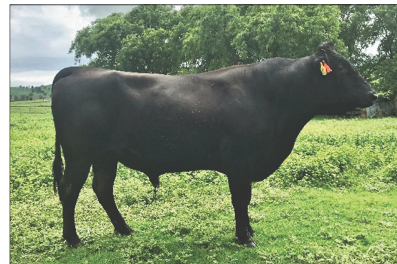
SIRE: Sumo Cattle Co Michifuku L195

Another lot of embryos from the marvelous SYNERGY SYN MICH SUZI 158D donor! She needs little introduction with her elite pedigree of Michifuku x TF 151 x Takazakura (Shikikan's Full Sister) x Suzutani! Her dam is the famous $52,000 Suzito 3 cow, who Bar V Wagyu bought in our 2018 sale. She has elite genomic EBVs including a +1.1 MS, +5.9 REA, and +0.36 MF! She is paired with the high genomic EBV sire Sumo Cattle Co Michifuku L195, who's semen is not commercially available. Sumo L195 is currently the 8th highest Self Replacing Index bull in the breed! He is a son of the well know Sumo F154 sire but ranks higher on the Self Replacing Index, led by his tremendous growth and carcass weight EBVs. His elite GEBVs include a +27 200D Wt, +40 400D Wt, +62 600D Wt, +54 Carcass Wt, and +1.8 MS! He is backed by an elite Sumo breeding featuring marbling and growth back to Takeda Farms import cow TF Hikohime \frac{3}{4} . These embryos merge the elite carcass traits of the Suzutani maternal line with the tremendous growth and carcass weight of the Hikokuras!