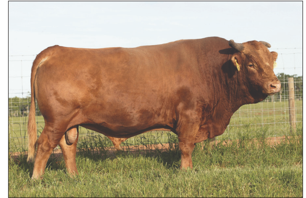
SIRE: HB Big Al Q502

More embryos by the legendary HB Big Al. He is the Dai 10 Mitsumau son of the Queen of Akaushi, Akiko. Big Al has been highly proven in the Heartbrand program and others to be one of the best marbling Akaushi bulls ever! To top it off he has amazing growth and milk capabilities making him one of the best all-round Akaushi sires ever. He is mated to an elite pedigreed Bald Ridge Henshin daughter who's pedigree reads Henshin x Kalanga Red Star x Heartbrand Red Emperor x Tamamaru x Fuyuko. The Fuyuko maternal line has produced elite proven sires in the Heartbrand herd of late including Heartbrand Joe S5394S and Heartbrand Terminator. Both of whom are elite EPDs in the American Akaushi Association. These embryos will produce highly profitable and functional cows or bulls for herd building.