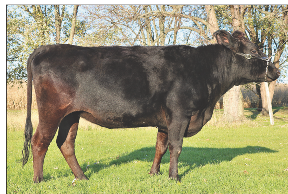
DAM: Synergy Itomichi Hiko 35C