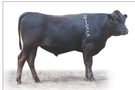
SIRE: Circle8bulls Q122

SYNERGY HARU Y5 SUZU has a sensational sire stack of Haruki 2 x Michifuku x JVP 068 x Takazakura x Haruki 2 (Full Sister to Shigeshigetani) x Suzutani! She has genomic tested with the fantastic growth, maternal traits, and ribeye area of her sire Haruki 2. This coupled with her elite carcass traits maternal line of the Suzutanis should inspire confidence that these embryos will produce balance profitable genetics for carcass production. The sire is the high genomic EBV sire Circle8Bulls Q122, who topped the 2020 Elite Wagyu Sale for $42,000. He has GEBVs of +2.1 MS, +3.3 REA, +39 CW, and Top 1% Indexes! He is a Sumo F154 who exceeds his father and is stacked on the well regarded Aizakura maternal line. Again, these embryos will produce balanced and profitable genetics for carcass production while limiting risk!