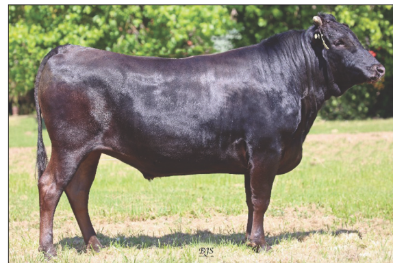
SIRE: Arubial Bond Q007

A double bred Mayura Itoshigenami JNR need we say more! The sire here is Arubial Bond Q007, who is a Mayura Itoshigenami JNR x Mayura Itoshigenami JNR x Michifuku x Shikikan x JVP 068 x the Tetufuku maternal line. He boasts sky high genomic EBVs of +3.2 MS, +0.57 MF, and +10.3 REA!! He is mated to a high growth and maternal traits Hikokura donor in SYNERGY ITOMICHI HIKO 35C (ET). She is an Itomichi ½ daughter of the $56,000 Stonyrun Hikokura 15 cow who sold to G$ Ranches in our 2018 sale. Her genomic EBVs include a +17 200D Wt, +30 400D Wt, +42 600D Wt, +5 Milk, and +34 Carcass Wt. This mating of high carcass traits on elite maternal and growth traits will produce balanced cattle to increase profitability on any operation.