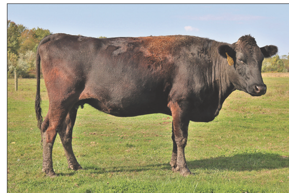
DAM: Synergy Syn Mich Suzi 158D