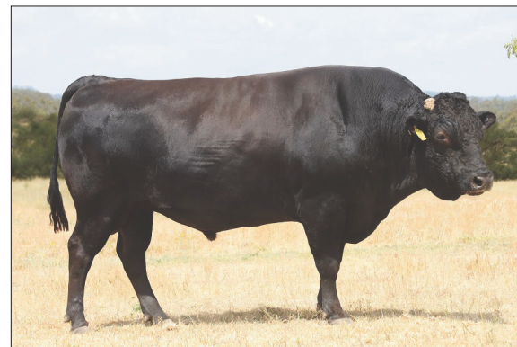
SIRE: SUMO Cattle Co Michifuku F154

This lot is sired by is SUMO CATTLE CO MICHIFUKU F154, the breed leading proven bull who need little introduction. He has elite Breedplan EBVs of +2.2 MS, +0.54 MF, +47 CW, elite growth, top 1% Indexes and is backed by 28 carcasses! He has also averaged an incredible 8.6 MS with a 1,016 lbs HCW in the Sumo herd on 21 carcasses. His growth and carcass traits balance is an ideal match for this Suzutani maternal line donor. She has a sensational sire stack of Haruki 2 x Michifuku x JVP 068 x Takazakura x Haruki 2 (Full Sister to Shigeshigetani) x Suzutani! This donor, SYNERGY HARU Y5 SUZU, has genomic tested with the fantastic growth, maternal traits, and ribeye area of her sire Haruki 2. This coupled with her elite carcass traits maternal line of the Suzutanis should inspire confidence that these embryos will form a solid base for future breeding and flush programs. The mating predictor of these embryos shows them to excels in all areas; growth, maternal traits, carcass weight, ribeye area, marble score, and marble fineness!