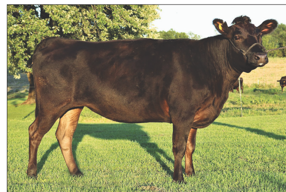
DAM: Synergy Syn Genj Suzu 66E