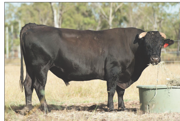
SIRE: Westholme Hiramichi Tsuru

Lot 1 is a pairing of the best Tajima and Kedaka maternal lines in the Wagyu breed, Suzutani and Hatsuhi! The donor dam here has one of the best combinations of elite genomic EBVs with a top-notch pedigree to back it up. She is a World K's Michifuku daughter of the $52,000 Suzito 3 cow Bar V Wagyu bought in our 2018 sale. Her sire stack reads Michifuku x TF 151 x Takazakura (Shikikan's Full Sister) x Suzutani! The sire is one of Westholme's best proven all-round sires, Westholme Hiramichi Tsuru. He has breed leading EBVs and is one of only 5 sires with the combination of 1.2 MS, 44 CW, and 4 Milk. His semen is virtually impossible to find and has sold for up to $2,000/ straw at Auction! His maternal line, the Hatsuhi, is widely considered the best Kedaka/Tortori female line exported from Japan. Having produced elite sires such as Kitahatsuhi 97/1, Peppermill Grove D139, Longford F E0241, and Goorambat Doublesixty K473. These embryos are a unique mating of elite Kedaka (Hatsuhi) and Tajima (Suzutani) cow families that should not be overlooked!