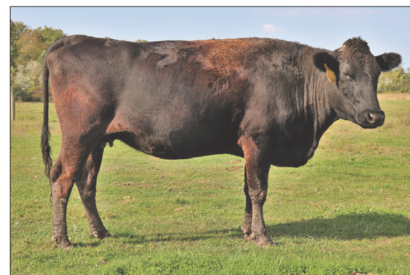
DAM: Synergy Syn Mich Suzi 158D