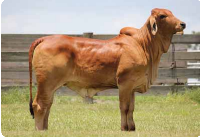
Lot 57 Moreno Ms. Lady Rimelda 136/ 1

57 Moreno Ms. Lady Rimelda 136/1 bw: 2.2 yw: 27.6 ww: 16.5 milk: 3 C 945373 / 136/ 1 / Cow / 12.12.15 / Horned / Red