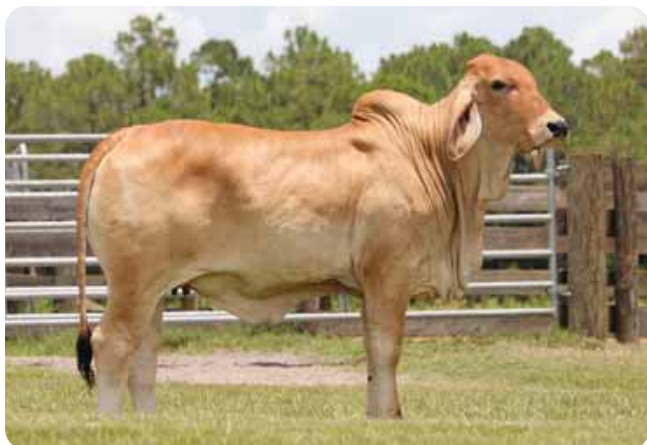
Lot 14 Moreno Ms. Lady Raquel 42/1