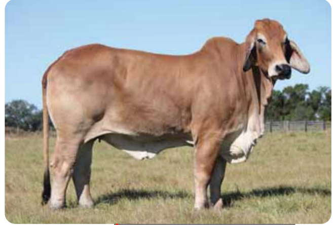
Donor TJF Ms Francene 128/9

All IVF procedures must be completed between September 4 and November 1, 2016 at Trans Ova Genetics in Centerville, Texas. Contact 866.924.4586.