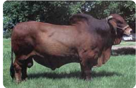
#CIGSA Mr 162/0, sire of Lot 19 & 20.