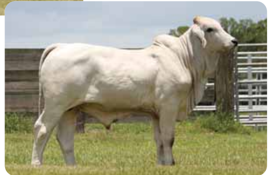
Lot 55 Moreno Mr. Imponente 605

53 Moreno Ms. Lady In It To Win It 140/i bw: 1.4 yw: 31.3 ww: 17.6 milk: 0.5