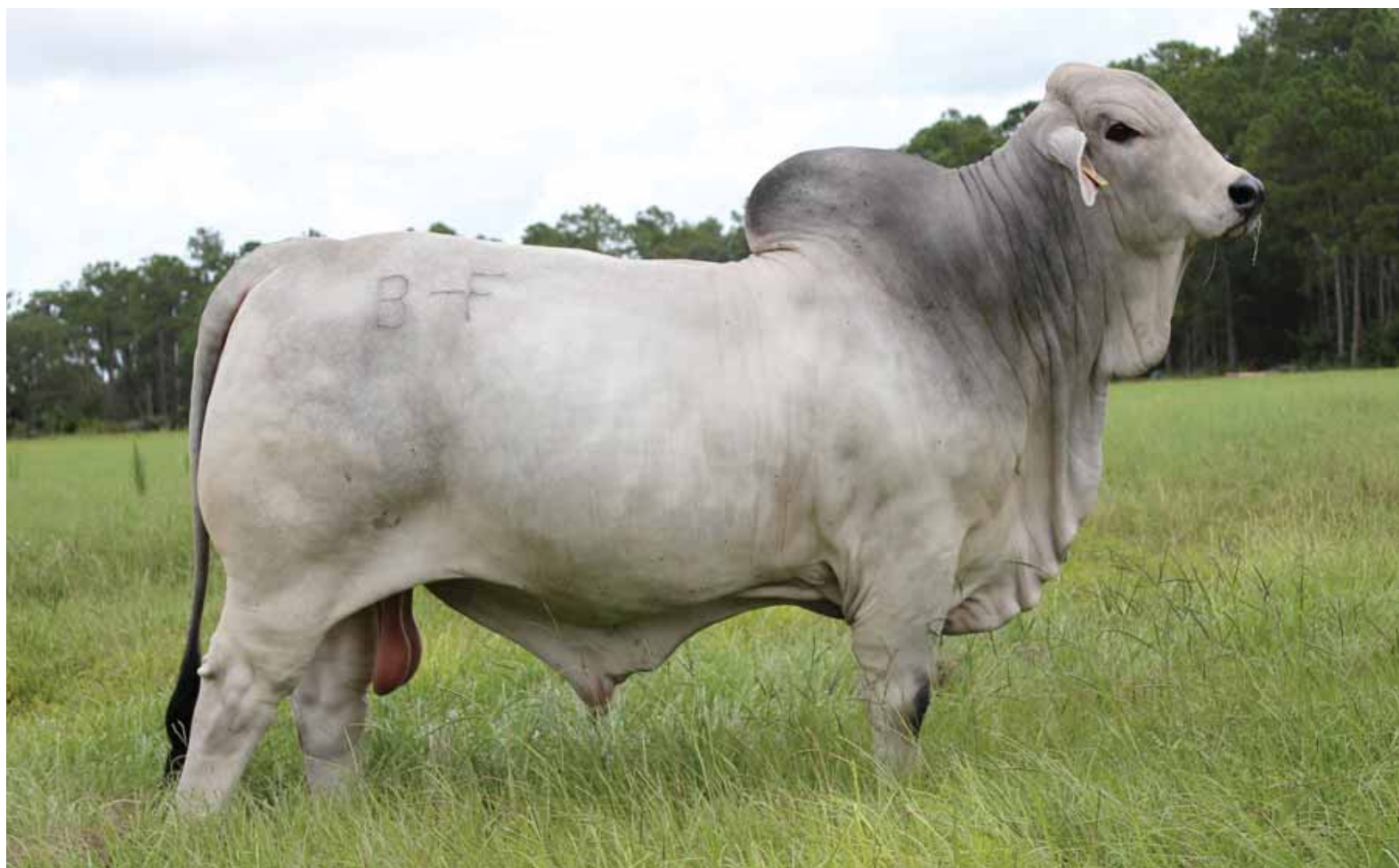
Lot 42 Mr. B-F 255/1