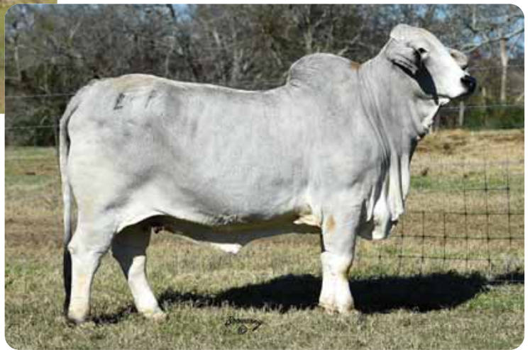
+Miss B-F 201/9, dam of Lots 59 - 61.

59 Moreno Ms. Lady Gordita I86/i C 945933 / 186/ 1 / Cow / 04.02.16 / Horned / Gray