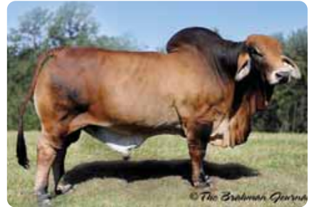
+Mr. 3X-HK Oro Rojo 800, sire of Lots 44 & 45.