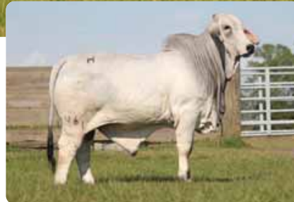
Moreno Mr Kickass 461, son of Lot 41.