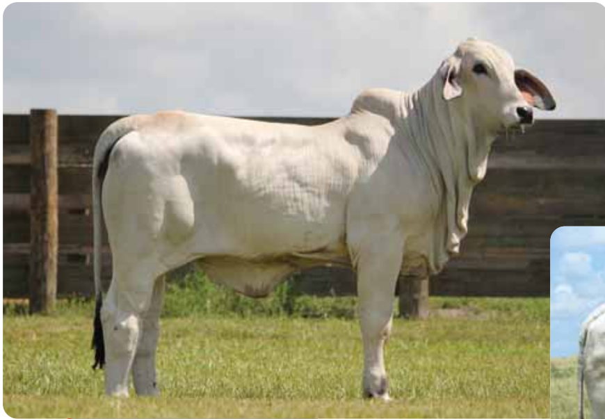
Lot 10 Moreno Ms. Polled Divia 120/1