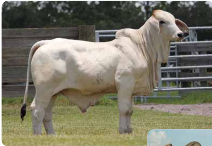
Lot 52 Moreno Mr. Rocks 597

All IVF procedures must be completed between September 4 and November 1, 2016 at Trans Ova Genetics in Centerville, Texas. Contact 866.924.4586.