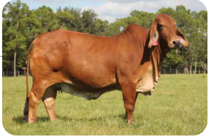
2009 National Champion Red Female