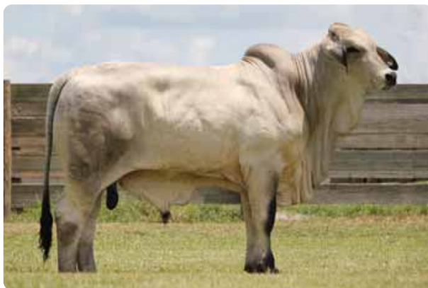
Lot 24 Moreno Mr. Power Honk 50I

We are certain this young bull that represents the M check brand will make a positive impact in any program. He is the product of a mating that was well thought out and strategically planned.