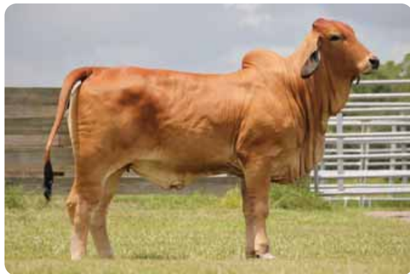
Let 29 Moreno Ms. Lady Renata 154/ 1