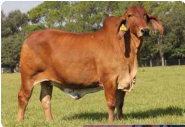
Lot 13 Miss MK 4/512