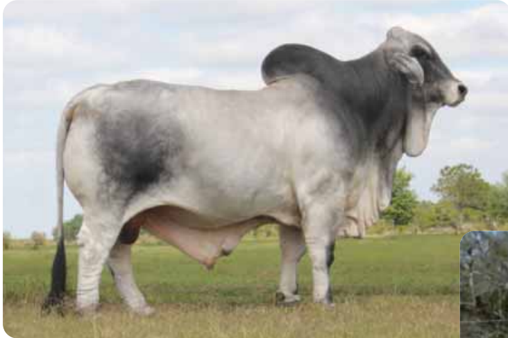
JDH Goudeau Manso 174/0, sire of Lots 59 - 61.