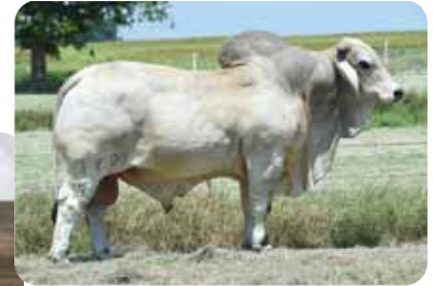
JDH Impression Manso 719/4, sire of Lots 53 - 56.