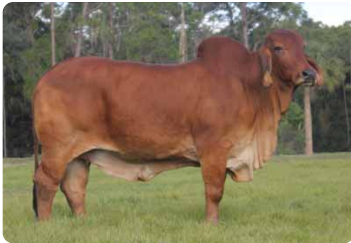
Donor BB LP Wham Bam 913

Take a look at how long and clean fronted this young female is. She is so impressive from the side angle and seems to be very level and strong down her top line. This heifer is well balanced and very desirable on the move. She is a daughter of JDH Impression Manso and from the elite donor BB LP Wham Bam 913.