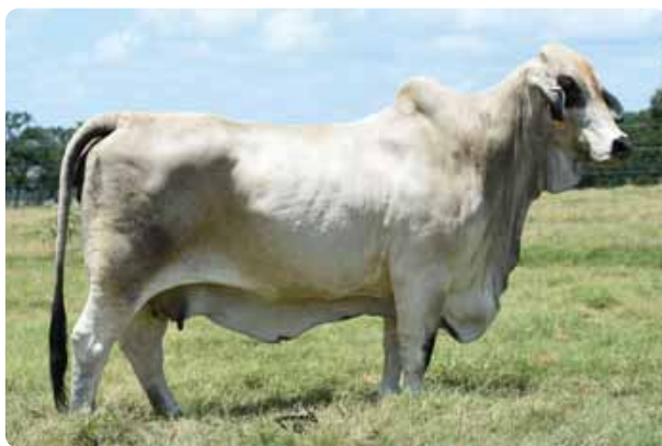
Donor Miss B-F 48/ 6

All IVF procedures must be completed between September 4 and November 1, 2016 at Trans Ova Genetics in Centerville, Texas. Contact 866.924.4586.