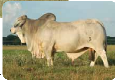
Mr. Royal K 48/ 8, sire of Lot 52.

Moreno Mr. Rocks is a young herd sire prospect that has tremendous rib shape and volume. He is so "cool" looking and is just puppy dog gentle. This gray bull has a massive amount of rib shape and volume. He is structurally correct and stands with a tremendous amount of bone and foot size. If you want a bull that has the power, performance and desirable conformation then consider what Mr. Rocks has to offer.