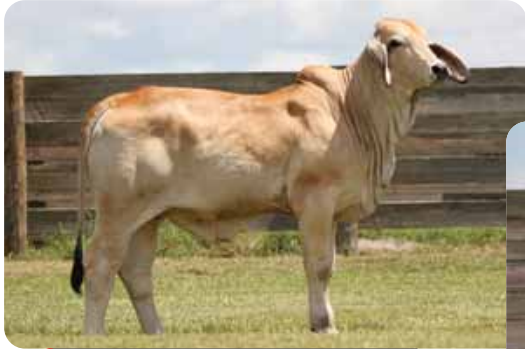
Lot 53 Moreno Ms. In It To Win It 140/i