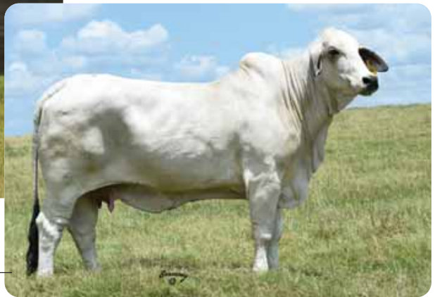
Donor Miss V8 564/6