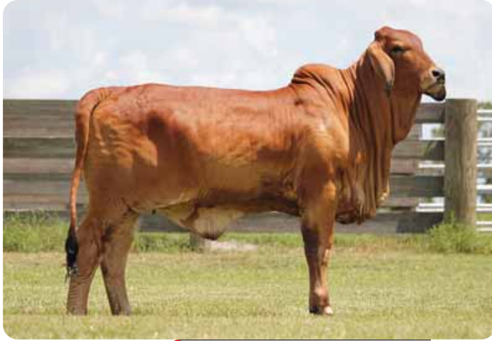
Lot 48 Moreno Ms. Lady Rebekah 30/i

48 Moreno Ms. Lady Rebekah 30/i bw: 1.8 yw: 19 C 941976 / 30/ 1 / Cow / 09.03.15 / Horned / Red ww: 12.2 milk: 7.3