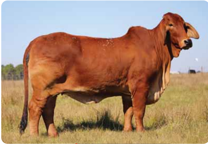
Donor TJF Miss Red Velvet 110/7