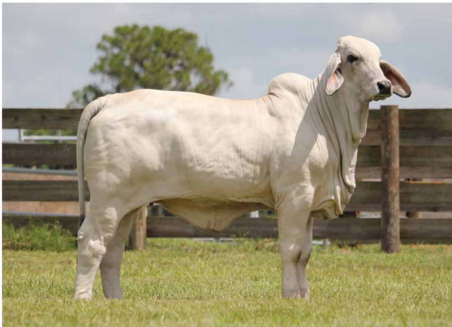
Lot 22 Moreno Ms. Lady Sterling 86/ 1