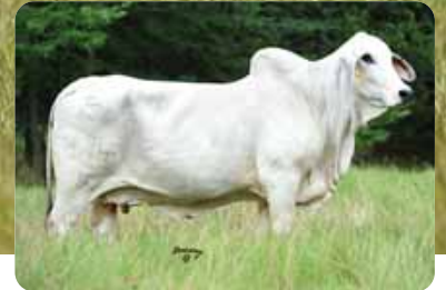
JME Ms REM Poncrata 474/6, dam of Lot 12.