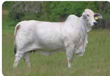
Lady H Lisa Manso 947/7, dam of Lot 7.

Moreno Ms. Lady Clairly is one of the breed leading females from the heart of the extensive embryo transplant program at Moreno Ranches. This heifer represents all good things and we feel has a very bright future for the new owner. We love her foot size, strength of top, depth of body and femininity up through her front end. This is a true combination heifer that has an amazing pigment.