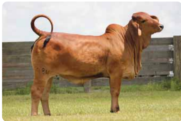
Let 28 Moreno Ms. Lady Ryan It 984

JDH ALINA MANSO (268/ 3) C 779334 +MR. 3H X-RAY 825 (825) B 775361 +MISS 3-S KELLI 848 (848) C 778518 +BB MR STING-RAY 10/ 0 (10/ 0) B 804910 SRS MISS DALLAS (660) C 804841