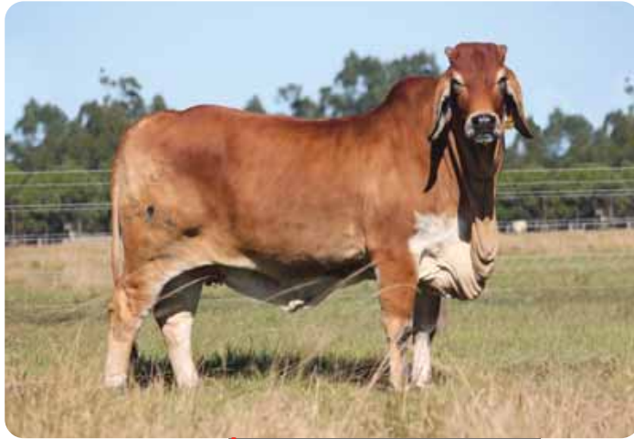
Donor TJF Miss Stunner 284/o

Wow! Moreno Ms. Lady Rebekah is a very feminine and long bodied heifer that comes from the heart of the Moreno embryo calf transplant keeper pen. She is a daughter of JDH Impression Manso and from the TJF Mr. Smokin Gun daughter TJF Miss Stunner 284/ 0. This heifer is very calm as you would expect and just take a look at her length of body and levelness from her hooks to pins. We appreciate her sound structure and above breed average performance. She is full of red beef!