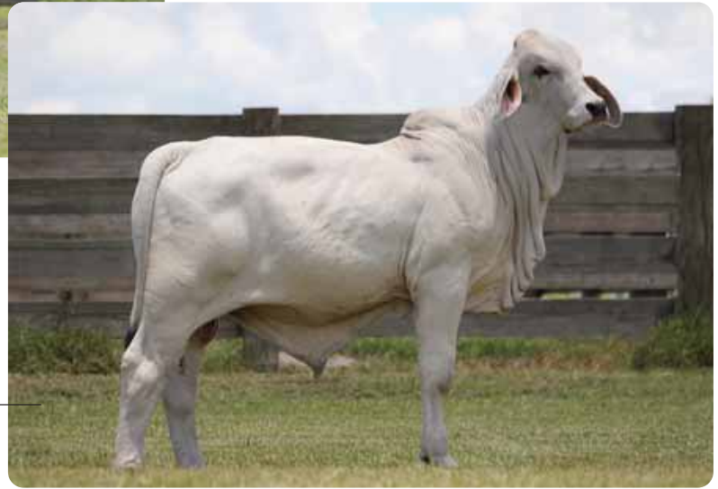
Lot 47 Moreno Mr. Galvin 603

46 Moreno Ms. Lady Gertudre I58/1 C 943403 / 158/1 / Cow / 02.11.16 / Horned / Gray