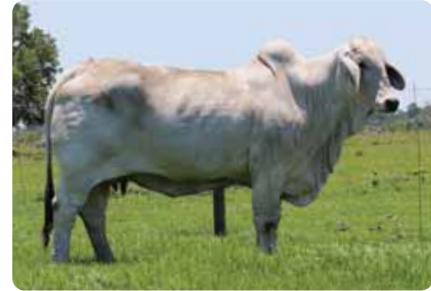
+Miss B-F 42/7, dam of Lots 46 & 47.