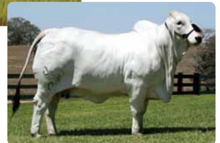
Lady H Mae Manso 66/9, full sister to Lot 41.