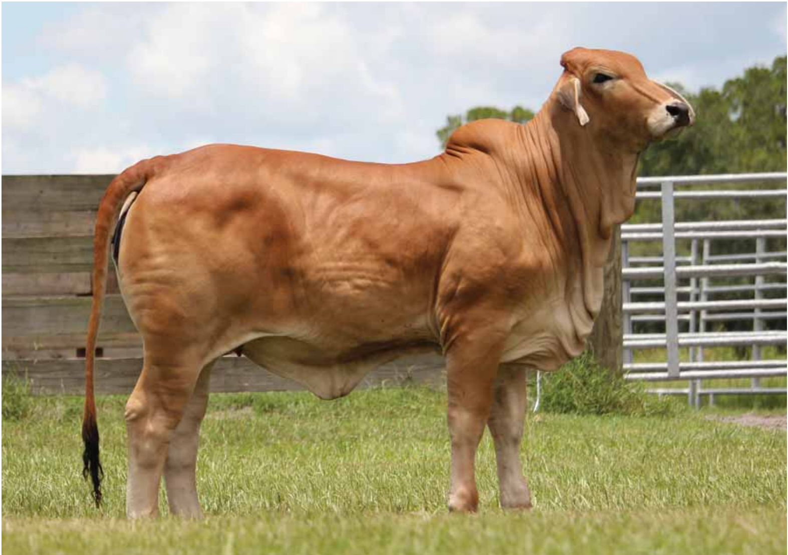
Lot 16 Moreno Ms. Lady Risitas 80/ 1