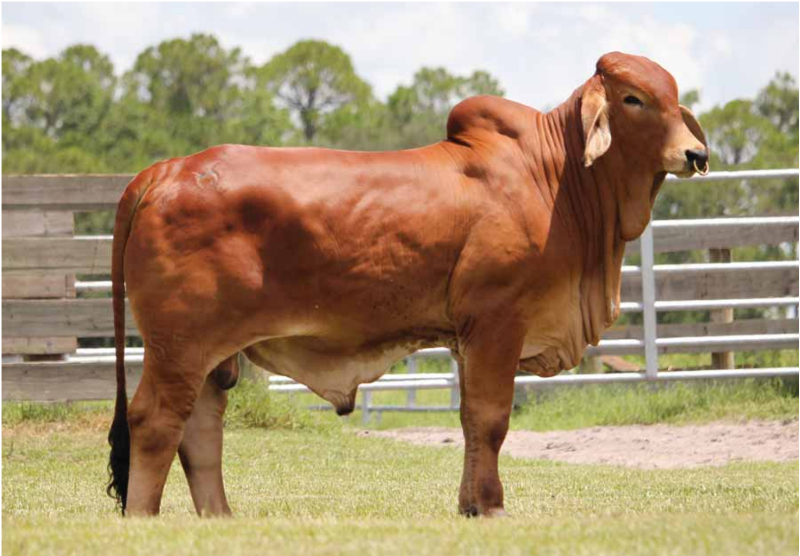
Lot 50 Moreno Mr. Resistant 55 I