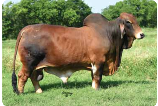
Sire Mr. Fontenot 333 "Rufus"

He has been mated to TJF Ms Francene 128/ 9 where we think the results are going to be spectacular.