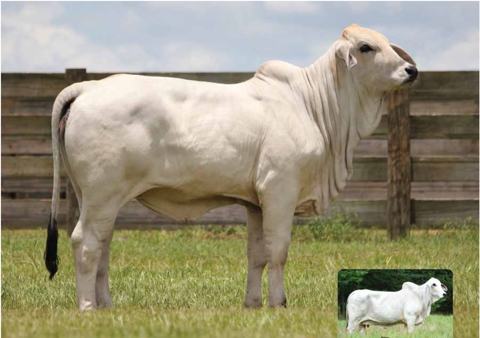
Lot 12 Moreno Ms. Polled Pauline 92/1