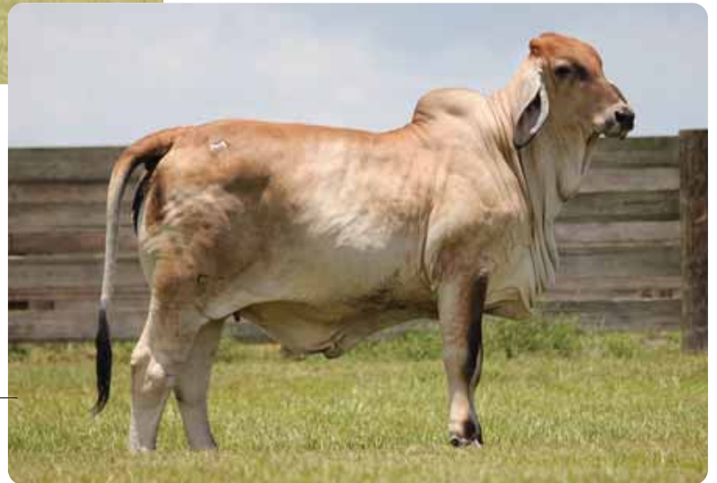
Lot 45 Moreno Ms. Lady OMG 150/1