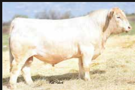
LT RANSOM 8644

CE 4.8 BW 2.3 WW 54 YW 94 MILK 17 GERRARD PREACHER 31U GERRARD PASTOR 35Z GERRARD ROXANNE 18P SVY AD INVINCIBLE P 748T SVY STARSTRUCK 8X SVY STARSTRUCK 559R