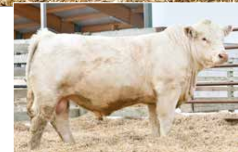
BALAMORE GODZILLA 925G - MATERNAL SIB TO LOT 30