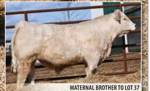
MATERNAL BROTHER TO LOT 37