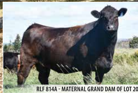
RLF 814A - MATERNAL GRAND DAM OF LOT 20