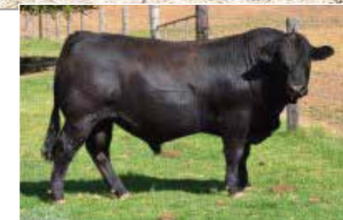
MARYVALE FEDERA 0067F - SIRE OF DAM OF LOT 16