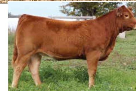
PINCH HILL FOOTLOOSE 812F - DAM OF LOT 18 AS A CALF