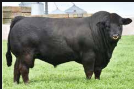
BALAMORE ENDEAVOR 701E

CE 13 BW 1.2 WW 53 YW 75 MILK 23 WARRIGAL HIGH VISION FLEMINGTON LEGEND L12 FLEMINGTON POLLED PRIDE H1 WULFS YONKERS K682Y AFTER HOURS CELEBRITY AFTER HOURS YOGI