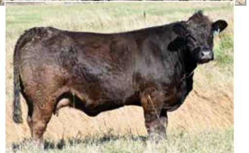
TMF MISS 302A - MATERNAL GRAND DAM OF LOT 12