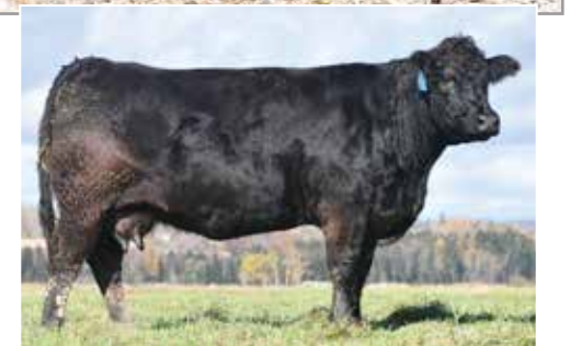
MISS TMF 1E - DAM OF LOT 6