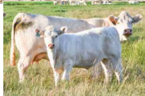
DAM AND MATERNAL SISTER TO LOT 42