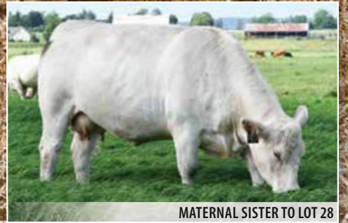
MATERNAL SISTER TO LOT 28