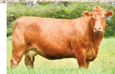
BALAMORE BARBARA 423B - DAM OF LOT 22