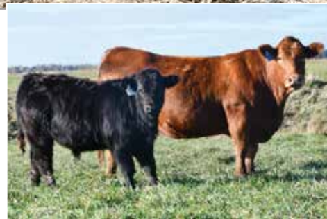
DAM AND FULL BROTHER TO LOT 5 (SUMMER 2021)