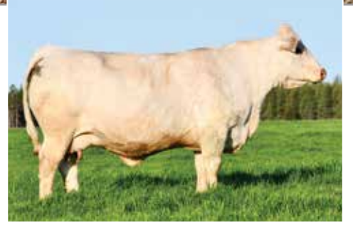
CEDARDALE MISS 45C - DAM OF LOT 28