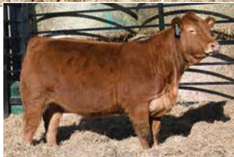
MATERNAL SISTER TO LOT 21