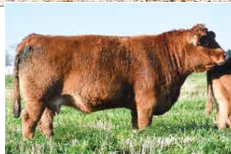
637D - DAM OF LOT 7