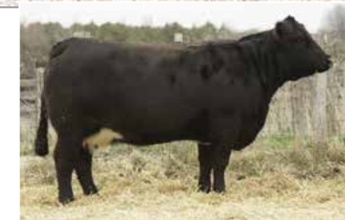
TMF MISS 612W - MATERNAL GRAND DAM OF LOT 10