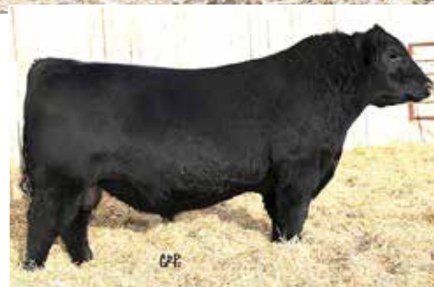
PLEASANT VALLEY LUTE 1207 - SIRE OF LOT'S 48 & 49