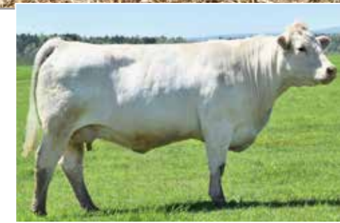
CEDARDALE MISS 105C - DAM OF LOT'S 32 & 33