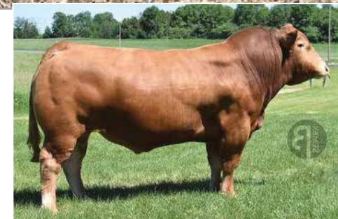
B BAR GRANITE 57C - SIRE OF LOT 53