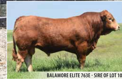
BALAMORE ELITE 763E - SIRE OF LOT 10