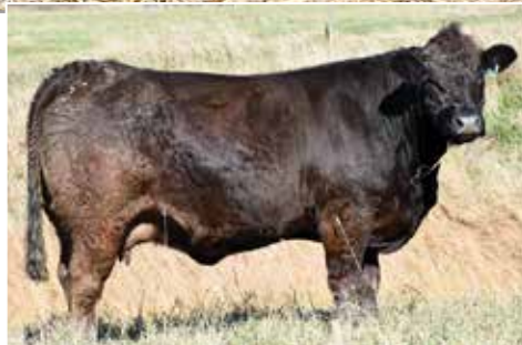
TMF MISS 302A - MATERNAL GRAND DAM OF LOT 3