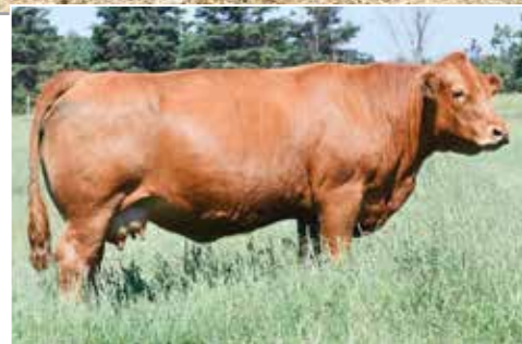
RLF 148D - DAM OF LOT 1