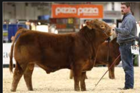
AFTER HOURS GAMBLER 131G

CE 13 BW 1.2 WW 53 YW 75 MILK 23 WARRIGAL HIGH VISION FLEMINGTON LEGEND L12 FLEMINGTON POLLED PRIDE H1 WULFS YONKERS K682Y AFTER HOURS CELEBRITY AFTER HOURS YOGI