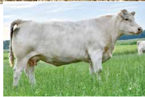
STEPPLER MISS 208C - DAM OF LOT 31