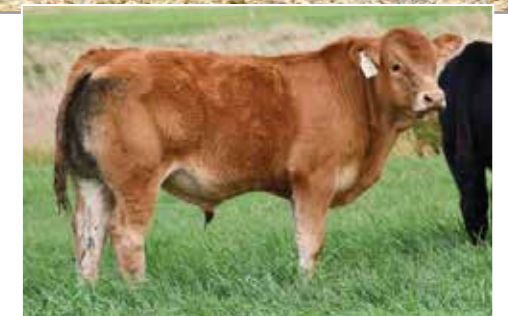
LOT 2 - SUMMER 2020