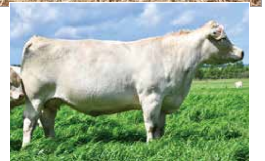
CORNERSTONE CANDY 14C - DAM OF LOT 37