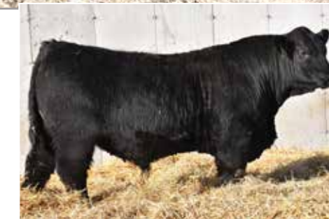
MATERNAL BROTHER TO LOT 47