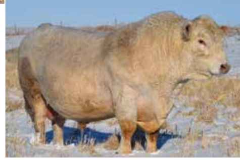
BALAMORE DRIFTWOOD 196D - MAT BROTHER TO LOT 27