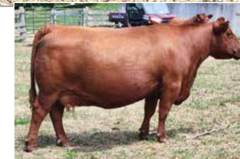
DAM OF LOT 51