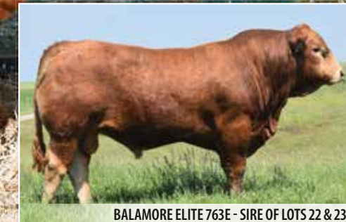
BALAMORE ELITE 763E - SIRE OF LOTS 22 & 23