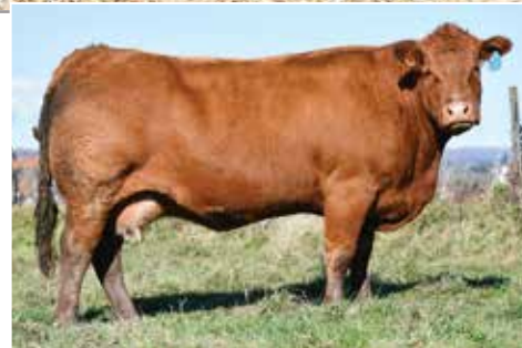
MISS 151D - DAM OF LOT 11