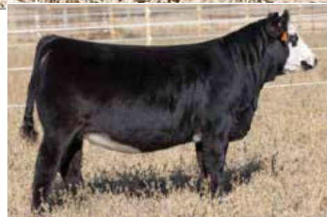
DOUBLE BAR D SUSE 438F - DAM OF LOT 46