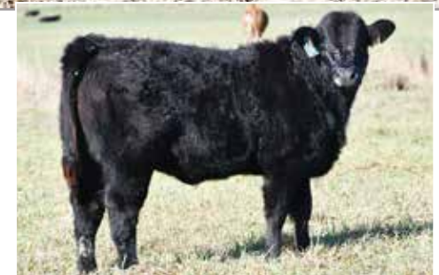
MATERNAL SISTER TO LOT 4