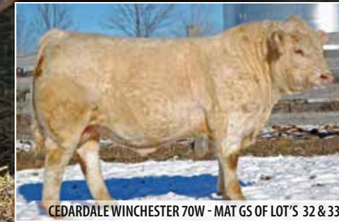
CEDARDALE WINCHESTER 70W - MAT GS OF LOT'S 32 & 33