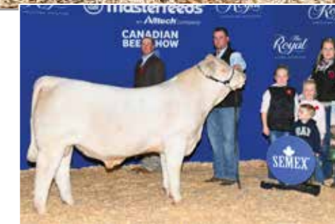
CEDARDALE GUNNER 99G - FULL SIB TO DAM OF LOT 35