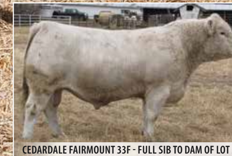
CEDARDALE FAIRMOUNT 33F - FULL SIB TO DAM OF LOT 35