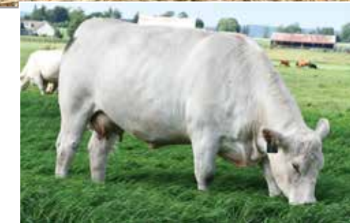
BALAMORE EXOTICA 702E - MAT GRAND DAM OF LOT 43