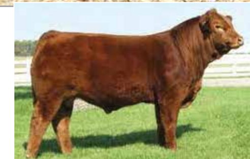
TMF WESTWOOD 505W - SIRE OF DAM OF LOT 14