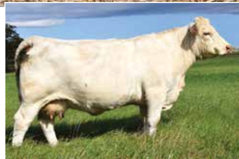
CEDARDALE MISS 55B - DAM OF LOT 36