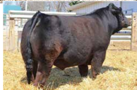
WULFS COMPLIANT K687 - SIRE OF DAM OF LOT 9