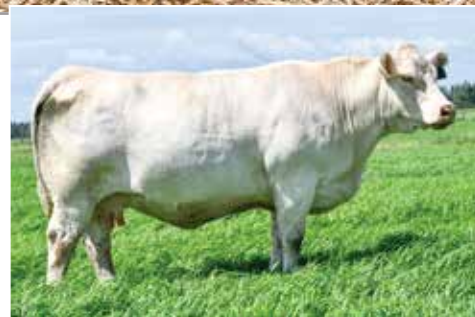
LJC ADA 3A - DAM OF LOT 34