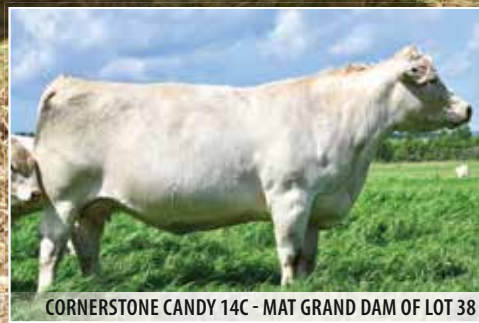
CORNERSTONE CANDY 14C - MAT GRAND DAM OF LOT 38