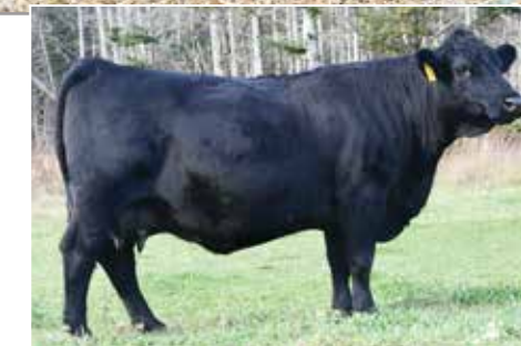
MRC MISS UREIKA 48D - DAM OF LOT 45