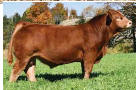
BALAMORE HALIFAX 019H - MATERNAL BROTHER TO LOT 19