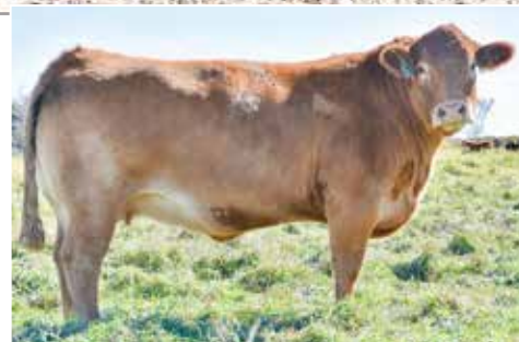
BALAMORE BO PEEP 419B - MAT GRAND AM OF LOT 52