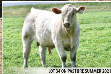
LOT 34 ON PASTURE SUMMER 2021