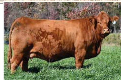
MATERNAL SISTER TO LOT 15