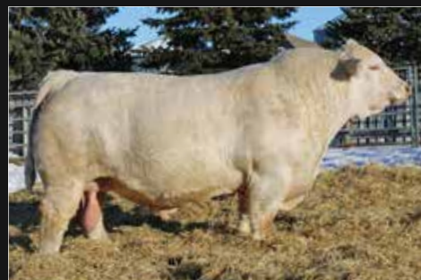
ELDER'S BLACKJACK 788B

CE 4.8 BW 2.3 WW 54 YW 94 MILK 17 GERRARD PREACHER 31U GERRARD PASTOR 35Z GERRARD ROXANNE 18P SVY AD INVINCIBLE P 748T SVY STARSTRUCK 8X SVY STARSTRUCK 559R