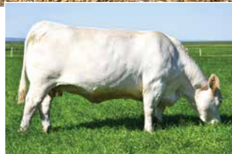
CEDARDALE MISS 3B - MATERNAL GRAND DAM OF LOT 25