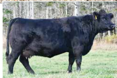
BALAMORE EMERALD 703E - DAM OF LOT 44