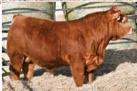
BALAMORE JETTA 131J - FRONT VIEW