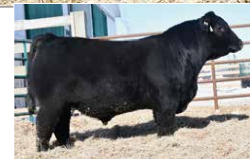
FULL BROTHER TO LOT 49