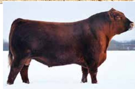
SIRE OF LOT 50