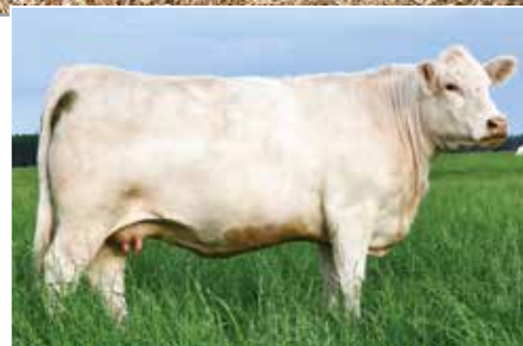
BALAMORE DAHLIA 46D - DAM OF LOT 29