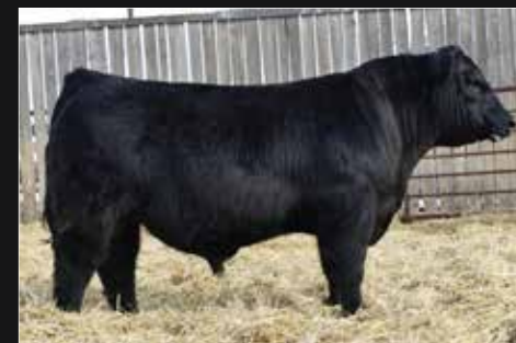
DAINES INSIGHT 27E

CE 0.0 BW 3.0 WW 47 YW 73 MILK 19 PVF INSIGHT 0129 DAINES SIR INSIGHT 33C DAINES MISS LEGEND 141S DAINES T510 124P DAINES MISS T510 22U DAINES MISS LEGEND 24P 54S