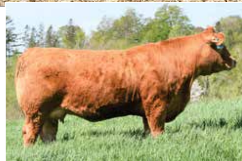
BALAMORE GOLD DIGGER 917G - DAM OF LOT 20