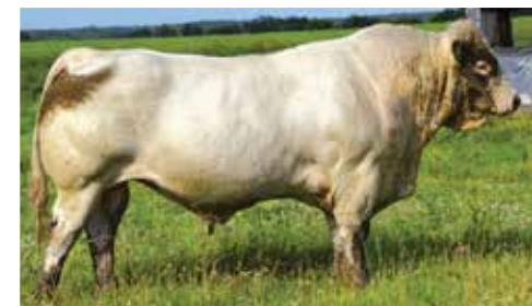
STEPLER JACKSONVILLE 335Z - SIRE OF DAM OF LOT 39