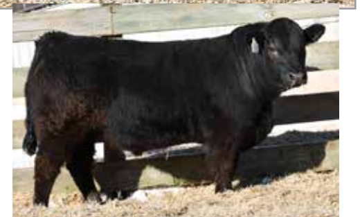
MATERNAL BROTHER TO LOT 24

CONSIGNOR - HILTZ LIVESTOCK Jay Hiltz — 902-227-1102