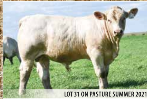
LOT 31 ON PASTURE SUMMER 2021