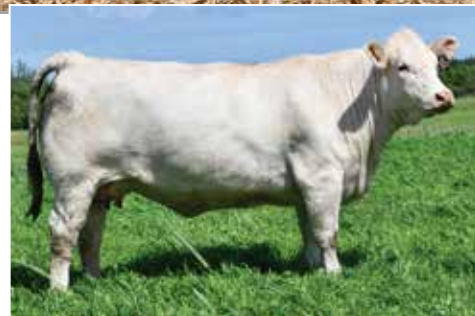
BALAMORE FARRAH 838F - DAM OF LOT 40