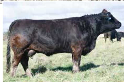
CLARKS EXTRAVAGANT KISS - DAM OF LOT 13