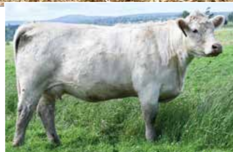
BALAMORE FANTA 806F - DAM OF LOT 38