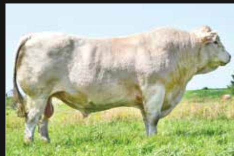
LT VIKING 8156 PLD

CE 15.9 BW -6.6 WW 46 YW 88 MILK 22 LT QUEST 2203 PLD LT JOURNEY 5208 PLD LT MOLLY 3011 PLD LT BLUE VALUE 7903 ET LT SHEILA 337 PLD LT MISS BREEZY 524