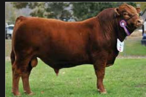
BIRUBI KAISER K140

CE 3 BW 2.2 WW 86 YW 116 MILK 21 RLF YARDLEY 601Y BALAMORE ENDEAVOR 701E CLARKS AFFECTIVE KISS RPY PAYNES ELVIS 34X WGL ABERCROMBIE 35A WGL XAMINER 7X