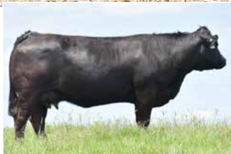
BALAMORE CHARLOTTE 577C - DAM OF LOT 17