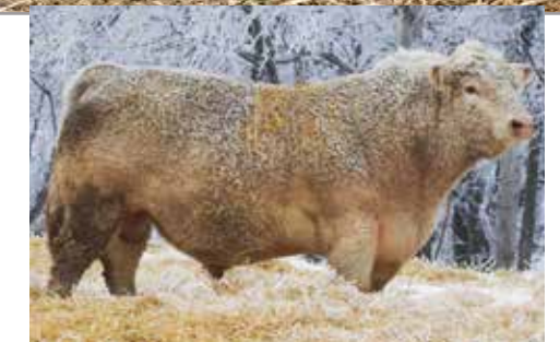
SPARROWS COPENHAGEN 210Z - MAT GRAND SIRE OF LOT 26