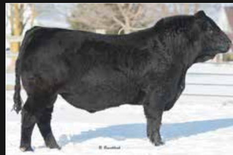
BALAMORE GRYPHON 930G

CE 10 BW 0.0 WW 81 YW 120 MILK 12 WULFS TAILOR MADE 2107T RLF YARDLEY 601Y RLF 406W WULFS SPRING LOADED 3158Y CLARKS AFFECTIVE KISS DKC UNFORGETTABLE KISS