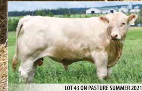
LOT 43 ON PASTURE SUMMER 2021