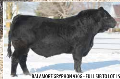
BALAMORE GRYPHON 930G - FULL SIB TO LOT 15