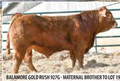
BALAMORE GOLD RUSH 927G - MATERNAL BROTHER TO LOT 19