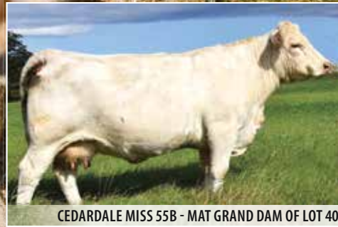
CEDARDALE MISS 55B - MAT GRAND DAM OF LOT 40