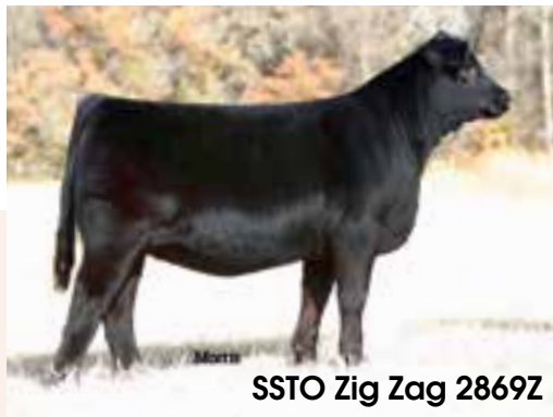
SSTO Zig Zag 2869Z