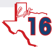
Full sisters of Lot 15