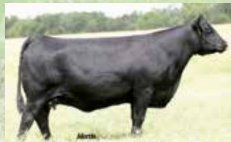
MA C094 Of 875 Sleep Easy