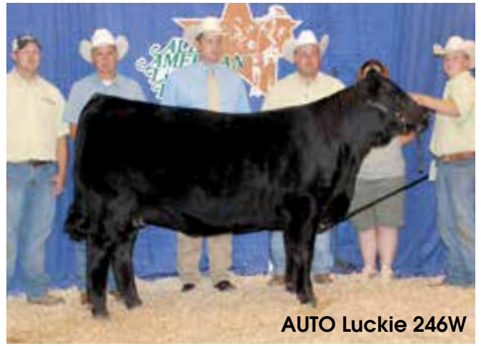
AUTO Luckie 246W