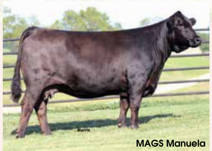
Dam of Lot 4