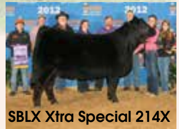
SBLX Xtra Special 214X