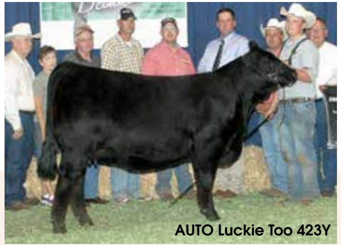
AUTO Luckie Too 423Y