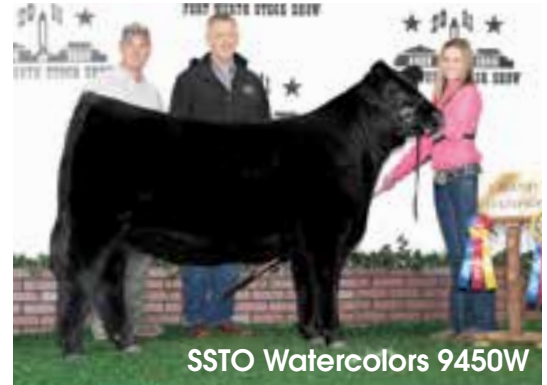
Dam of Lot 11