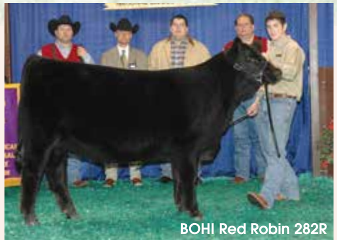
Dam of Lot 1