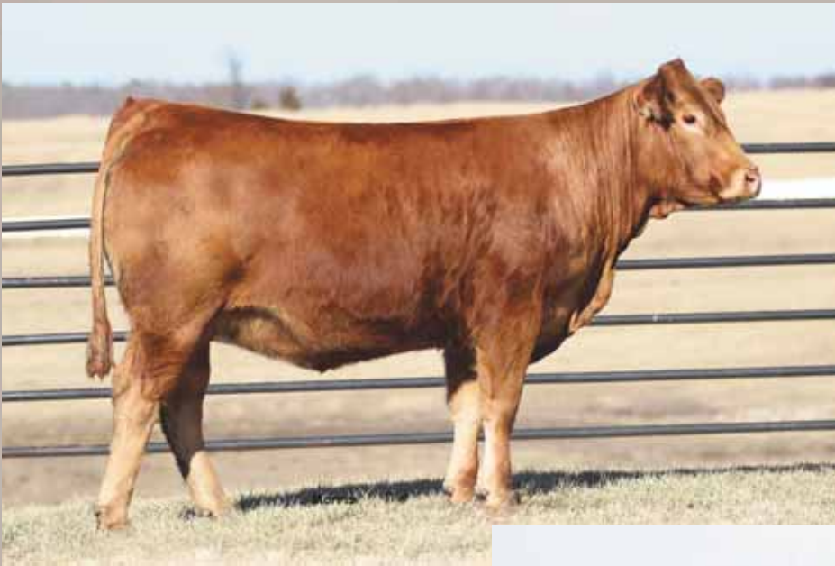
LOT 78 AUTO Sparkler 699Y