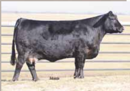
KRVN Progeny 175P, dam of Lot 54.