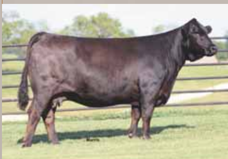
MAGS Manuela, dam of Lot 40.

AUTO Adele 213A is a result of the blending to two of the strongest cow families in the entire breed with AUTO Rebeca 292S and MAGS Manuela. This young February yearling heifer is a 68.8% Lim-Flex and sired by the $37,500 half interest sire AUTO Will Power 160X. He was selected by our good friends at Edwards Land & Cattle Co., Beulaville, NC. 160X is a son of GAR Predestined and from AUTO Rebeca 292S. The blending of the AUTO Will Power 160X with that of the premier donor MAGS Manuela has resulting into something really special with this young heifer. She scanned a 14.9 for REA and 3.67 for IMF. She ranks well in terms of percentages in our breed and we think she has a bright future in the show ring and then in production.