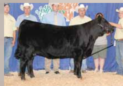
AUTO Luckie 246W, dam of Lots 3 & 4.