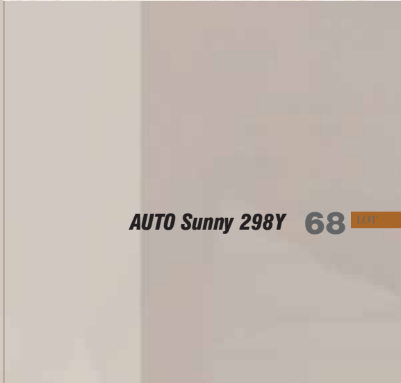
AUTO Sunny 298Y LOT 68