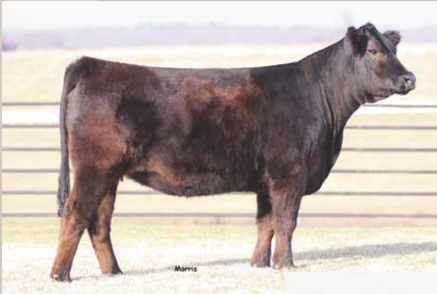
LOT 67 AUTO Cozy 424Y