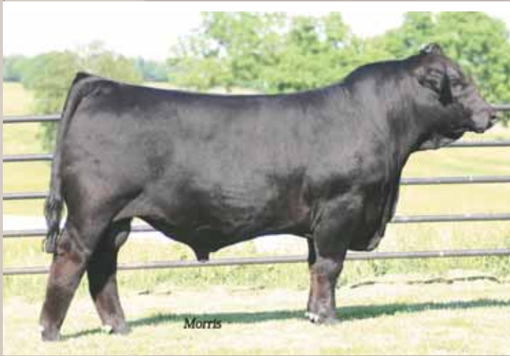
MAGS Out Front 136Y