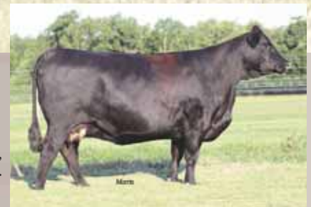
SBLX Unna 391U, dam of Lot 63.