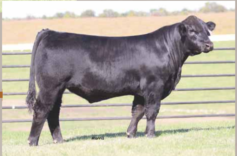
AUTO New Day 338Z 10