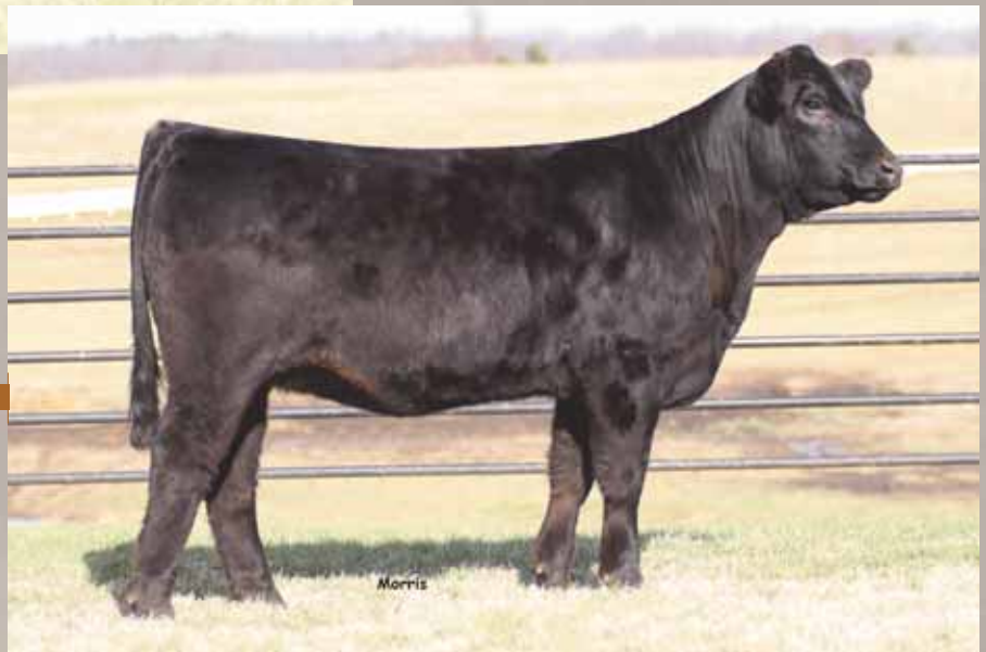
AUTO Zinnia 404Z LOT 65