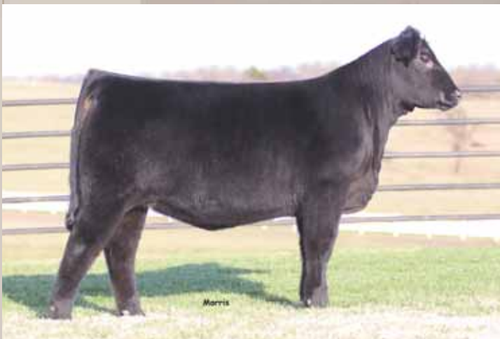
Class winner at 2014 National Western Stock Show