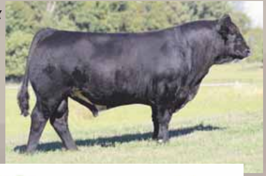
AUTO Cruze 132X