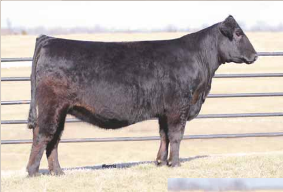
LOT 76 AUTO Spotlight 413Y