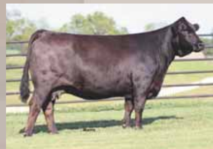
MAGS Manual, dam of Lots 47 & 48.