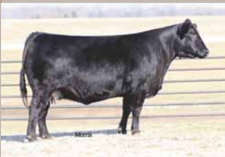
BOHI Sunset 6156S, dam of Lot 75.

What a really nice and big numbered replacement female we have with AUTO Dalhia 209Z. Sired by the past National Champion Deuce and out of one of our proven donors BOHI Sunset 6156S, this female is homozygous black and double polled. She offers a 1.0 birth EPD, 62 weaning EPD, 109 yearling EPD and a 51 MTI. This 75% Lim-Flex first calf heifer is from BOHI Sunset 6156S, the $20,000 valued donor that is working for Sugar Bush Cattle, Inc., Allen, MI and Stowers Limousin, Bridgeport, TX. She is the big time donor and daughter of BR Midland from the Carrousel Peaches 4330P donor. She represents proven and very prominent genetics that have worked so well for the Pinegar program.