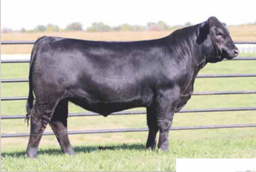
LOT 9 AUTO Cornerstone 343Z