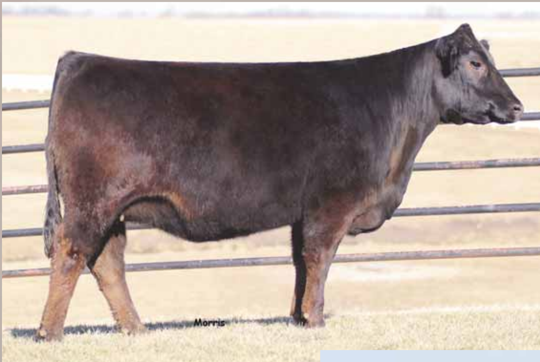
LOT 72 AUTO Downtown 208Z