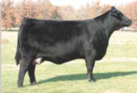
AUTO Rebeca 292S, dam of Lot 51.

40% CED 10% WW 7% YW 20% MA 5% MARB 5% MTI