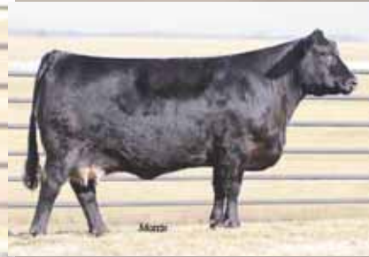
KRVN Progeny 175P, dam of Lot 67 & 68.