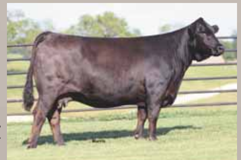
MAGS Manuela, dam of Lot 35.

AUTO Abianne 215A represents a lineage of cattle that has proven over time that they will work and work very well. This young polled, homozygous black female is a full sister in blood to the breed's first grand champion Lim-Flex female, BOHI Red Robin. Red Robin the $60,000 valued donor that is owned by Council Family Limousin, Madisonville, TX and Stowers Limousin, Bridgeport, TX and she continues to produce excellence for both firms and her progeny have been very well accepted in the market place. One of her daughters sold in the Council Family sale at $32,000 to DeMar Farms, Canton, TN. AUTO Abianne 215A has as much future in production as any female in this prestigious sale. She is clean up through her head and neck, straight in her lines and very sound from her knee to the ground.