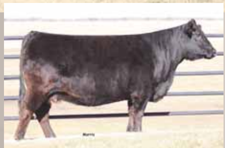
PBRS Umbelina 806U, dam of Lot 70.