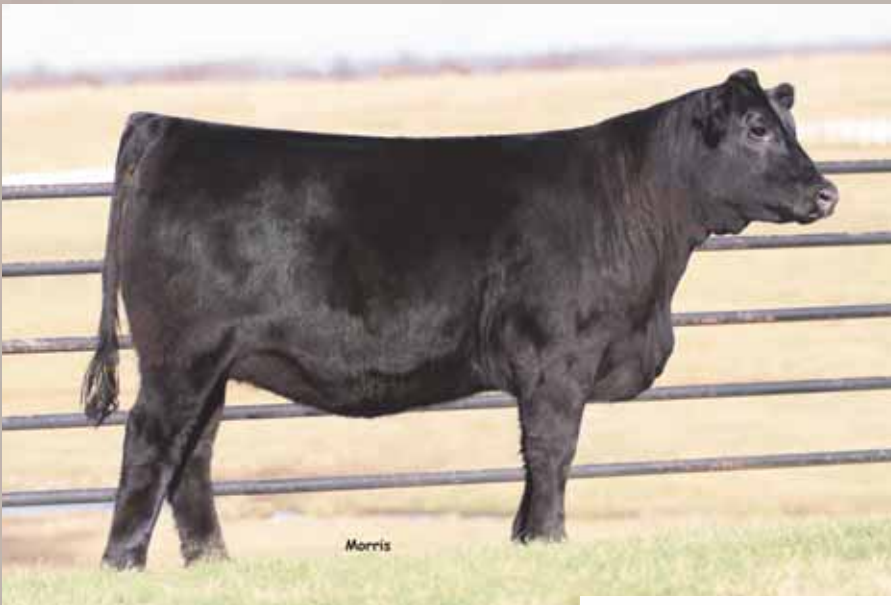
LOT 56 AUTO Katie 1421Z