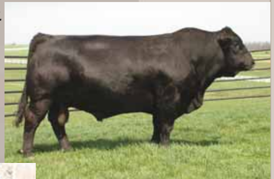
AUTO American Idol 162L