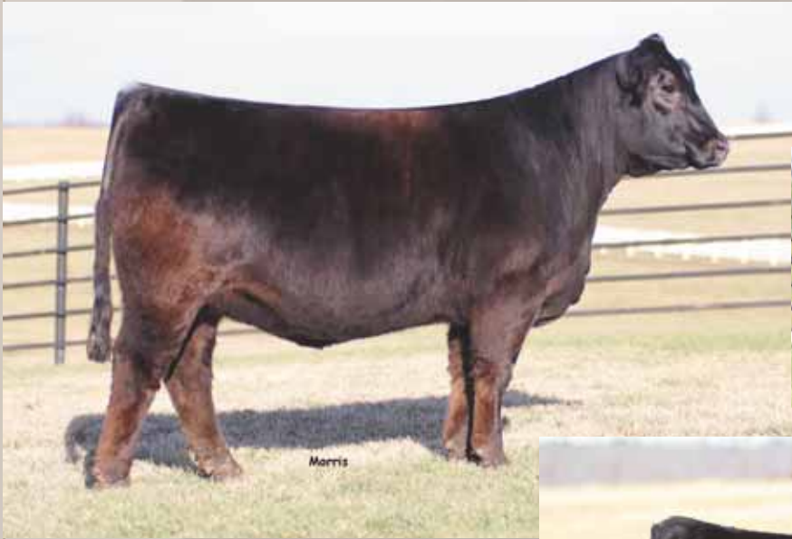
LOT 58 AUTO Mercedes 249Z