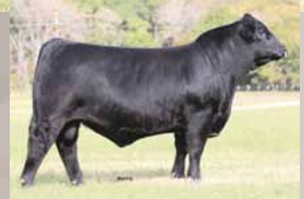
JEPS Broadway, brother to Lot 69.