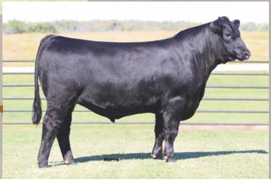
AUTO Mac Daddy 177Z 6 LOT