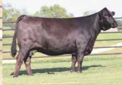
MAGS Manuela, dam of Lots 58 & 59.