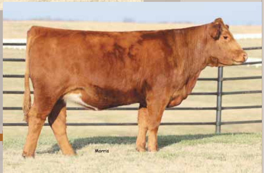
AUTO Red Bird 285Y 73