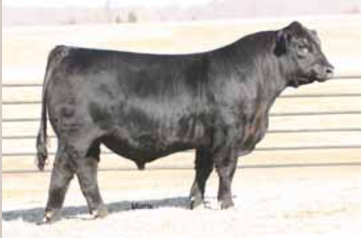
AUTO Will Power 160X