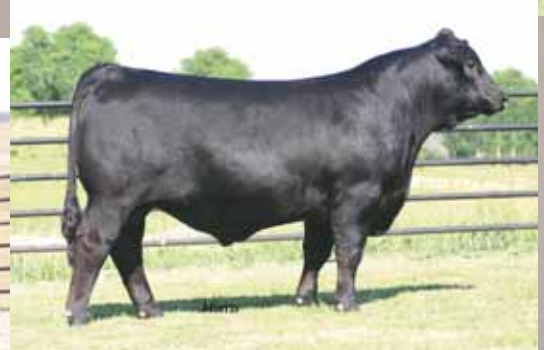
MAGS Robin Hood 276Y