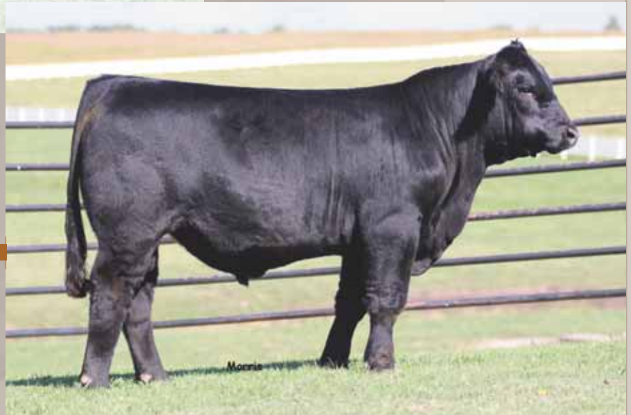
AUTO Pocket Aces 148Z 8