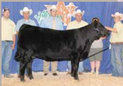
AUTO Luckie 246W, dam of Lot 57.