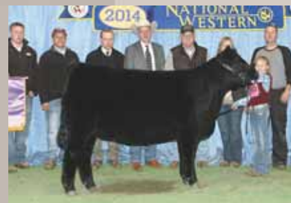
AUTO Mabelline 267Z, Denver 2014 Champion Lim-Flex Female, full sister to Lots 47 & 48.