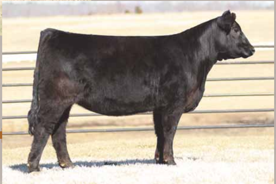
AUTO Zandra 447Z 59