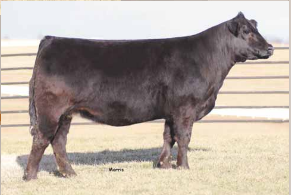
AUTO Jessca 249Y 79