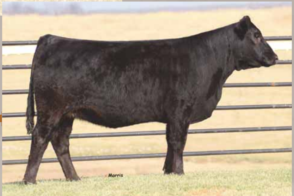
AUTO Zoe 201Z 77