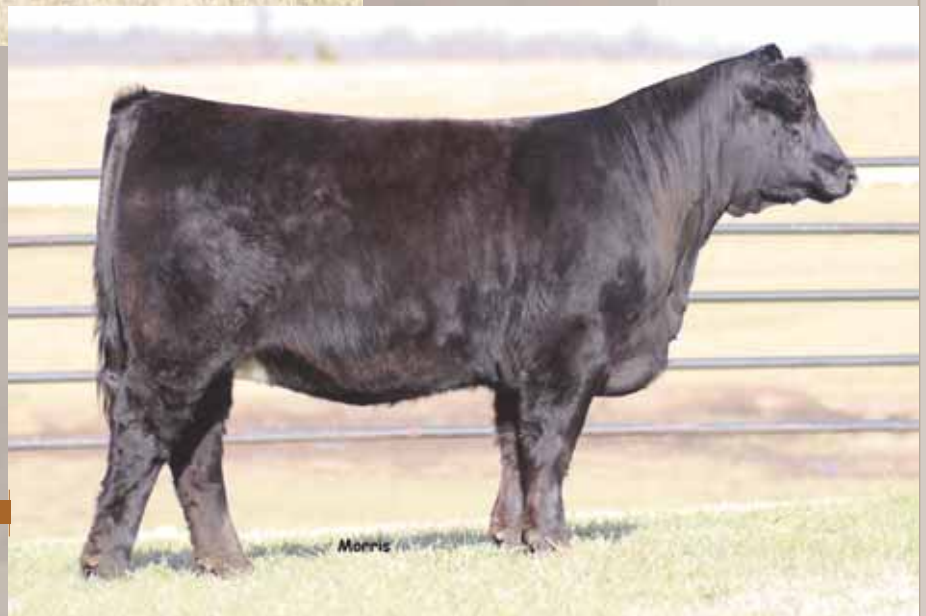
AUTO Salty 270Z 61