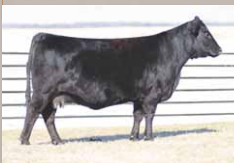
AUTO Angel 236U, dam of Lot 50.

AUTO Angel 1236Z is a purebred double homozygous heifer that is one terrific female. She is a daughter of AUTO Cruze 132X, the $35,000 half interest herd sired owned by Sugar Bush Cattle, Allen, MI and Pinegar Limousin. He is a son of MAGS The General and is from the elite donor AUTO Rebeca 292S. Her dam AUTO Angel 236U is a full sister in blood the multiple trait leading sire AUTO Dollar General 122R that is now working for GV Limousin in Garnett, KS. This young first calf heifer sells bred to the $100,000 valued and complete outcross sire EBFL Ypsilanti 420Y. This coming two year old female offers a breed leading set of EPD's and ranks in the top percentages of many of the economically important traits.