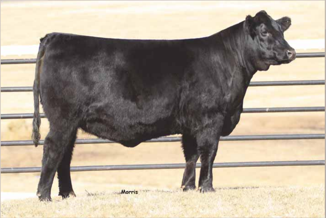
47 AUTO Zoey 280Z