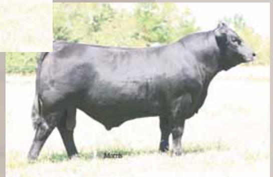
EBFL Ypsilanti 420Y