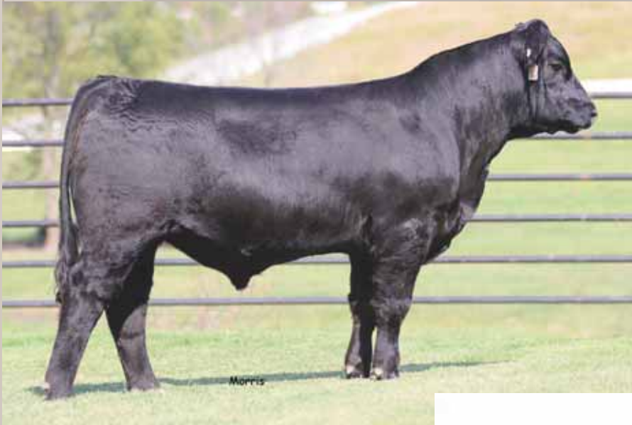
LOT 5 AUTO Midnite Special 160Z