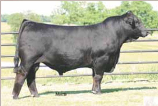
MAGS Outfront 136Y