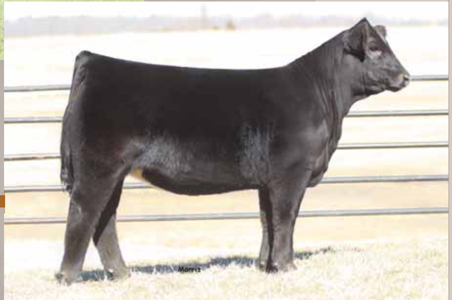
AUTO Amerie 228A LOT 37 2014 Denver National Limousin Show division 1 champion female