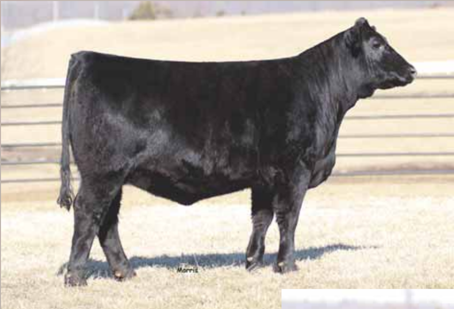
LOT 60 AUTO Eraline 1452Z