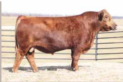
MAGS Choctaw 4839Y