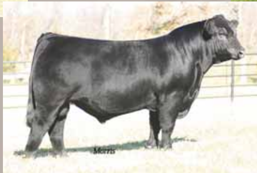
AUTO Grand Am 156Y