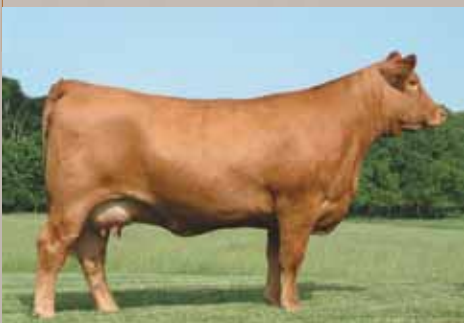
AUTO Lana 255L, dam of Lot 34.

Here is a full sister to the lot 2 bull of this sale. She is a very well made and exciting 50% Lim-Flex heifer that is black and homozygous polled. She is a daughter of the great Angus sire Dameron First Class bull and from the $50,000 valued Pinegar donor AUTO Lana 255L. We admire her massive foot size, softness of pasterns and that powerful donor cow look that she possesses. She ranks in the top 1% of the breed for yield grade and top 3% of the breed for milking ability. This young Lim-Flex female is very feminine up through her head and neck and very strong down her topline and square out of her rump. She is extremely deep in her flank and stands very upright and proud of her lineage.