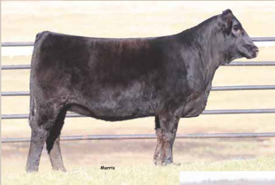
LOT 64 AUTO Macey 401Z