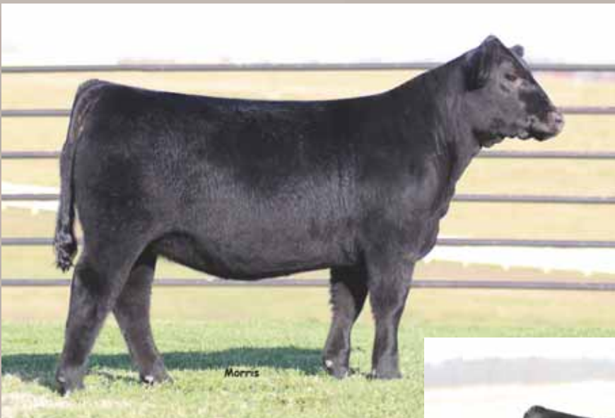
LOT 36 AUTO Marie 4330A