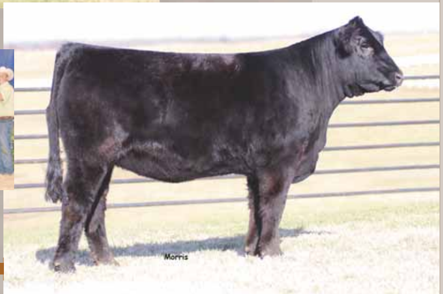
AUTO Clover 295Z 57