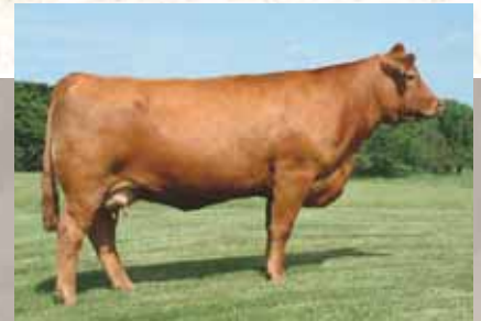
EXLR Molly 7103K, dam of Lot 71.