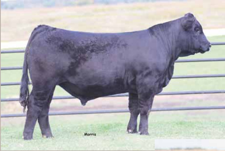
LOT 7 AUTO Fanfare 170Z