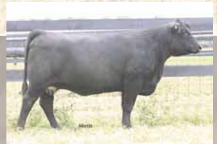
SBLX Unknown 104U, dam of Lot 62.