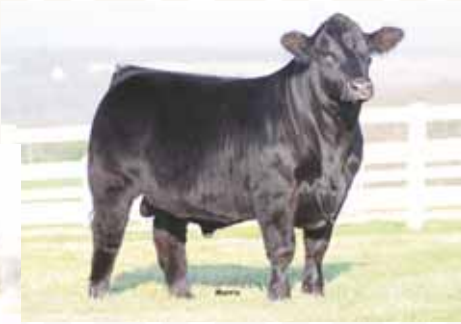
ELCX Turning Point 641Z