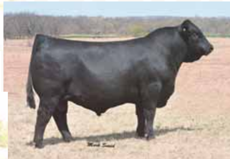
OKSU The Profit 3401