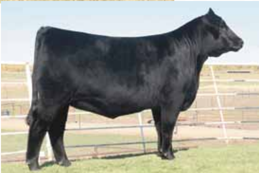
MAGS Young Hand, dam of Lot 41 embryos.