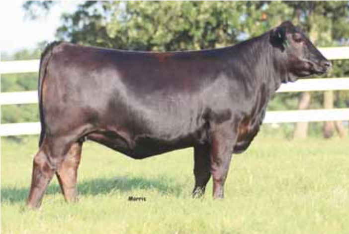
LOT 34 PBRs Applause 3103A