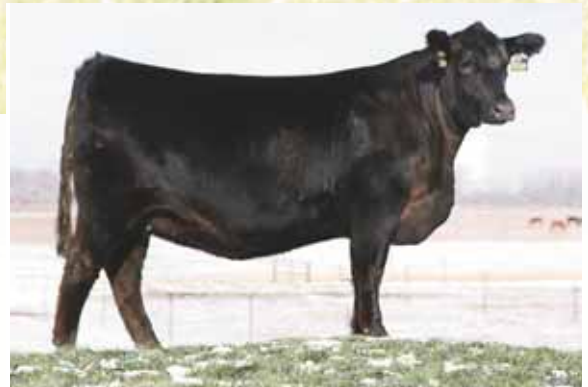
MAGS Universal Time, the $31,000 half interest valued donor and dam of Lot 1 and Lot 1A.