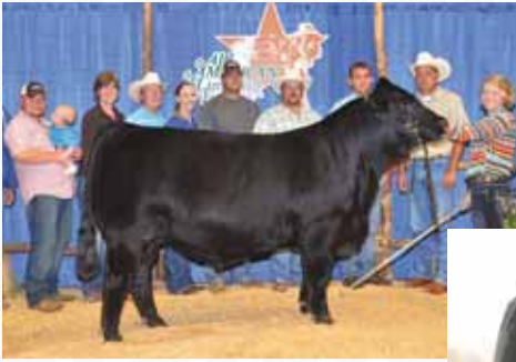
RLBH Air Force One