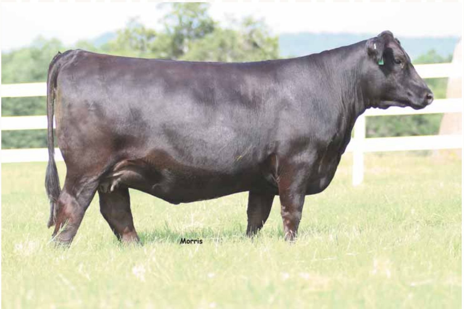
LOT 49 PBRs Zaahida 612Z