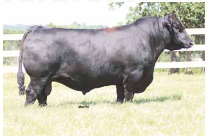
PBRs Milestone 137Y, sire of Lot 79.

BW: 74 lbs.; WW: 735 lbs.; YW: 1,186 lbs.