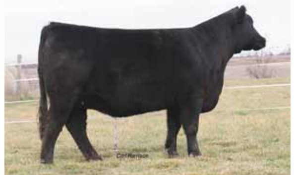
EF Your Call 587Y, dam of Lot 78.