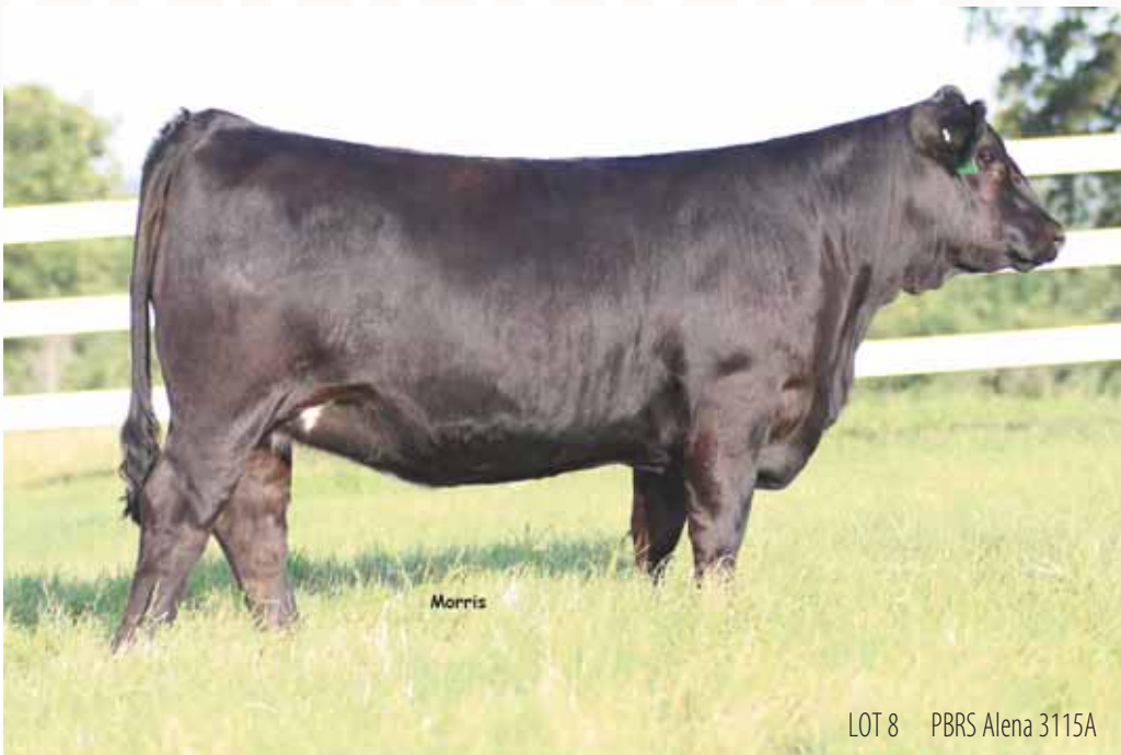
LOT 8 PBRS Alena 3115A

These four heifers represent one of the very best embryo flushes ever created at P Bar S Ranch. The mating of the purebred bull MAGS Yip with the leading P Bar S Ranch Angus donor LBAF Shawnee 602 has created results that you could only imagine. These four heifers are homozygous polled, homozygous black and made very well. We love and admire their structural correctness, their heaviness of bone, extra shot of thickness and for sure their depth of rib shape and volume. These heifers are huge numbered and are some of the best scanning cattle you could incorporate in your program. We admire their low birth weight EPD's, their 100 plus yearling weight numbers, high 20's for milk and breed leading marbling numbers. Their IMF scan data are all some of the best you can get with the highest being 5.25 and others in the high 4's.