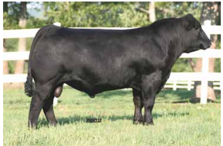
PBRs Upper Echelon 820U, sire of Lot 80.

W: 76 lbs.; WW: 739 lbs.; YW: 1,190 lbs.