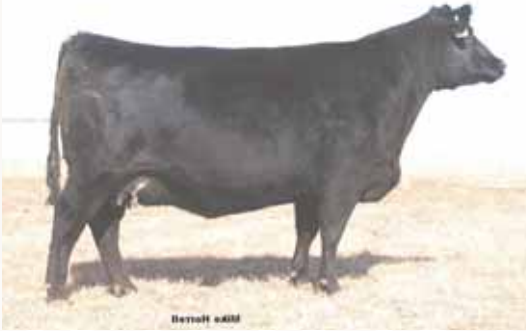
Oak Hill Miss Wix 72S, dam of Lot 40.