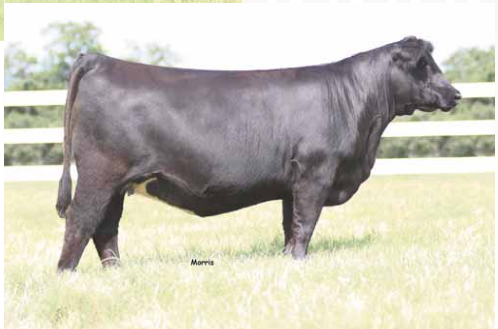
LOT 45 PBRS Zagir 642Z