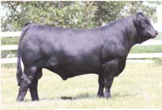
MAGS Zamindar, sire to Lot 40 embryos.