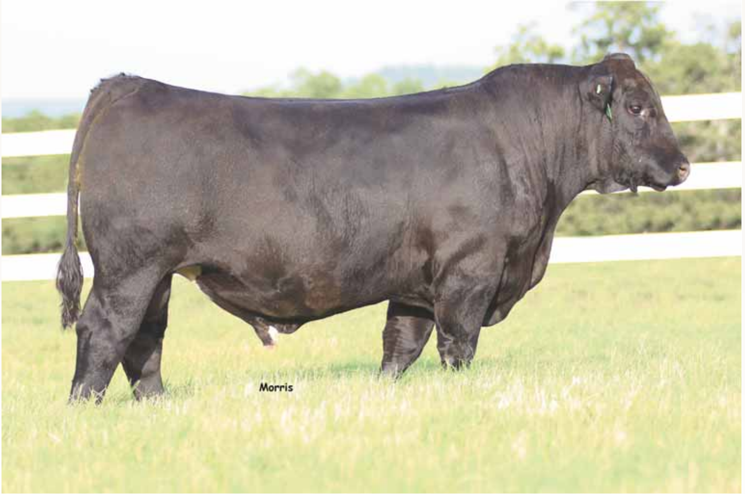
LOT 74 PBRs Abdacadabra 3116A