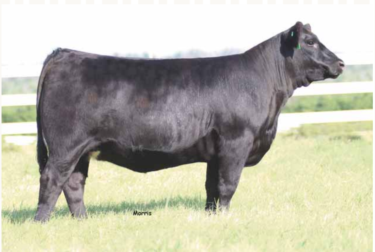
LOT 21 PBRS All Fired Up 33A