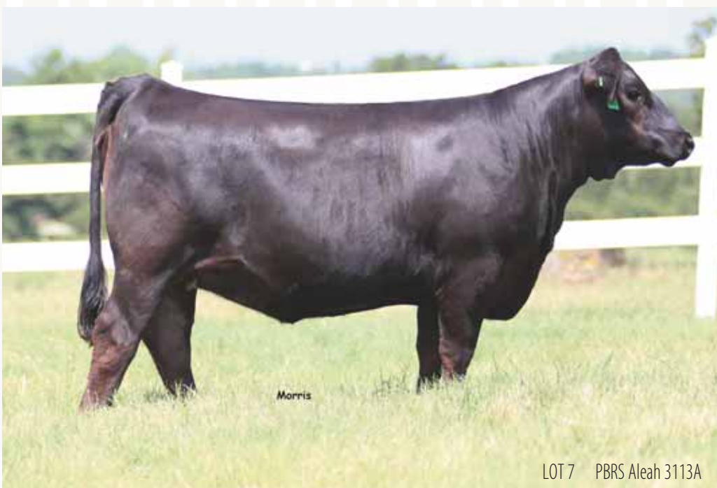
LOT 7 PBRS Aleah 3113A