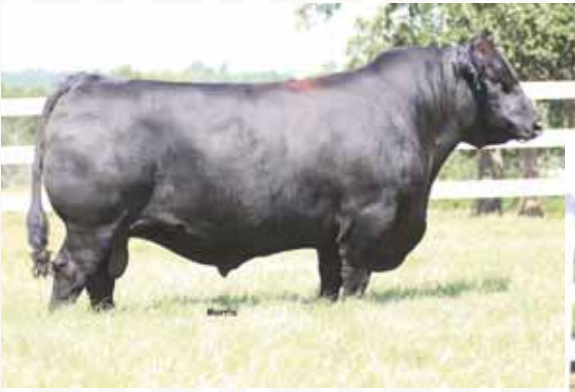
PBRs Milestone 137Y