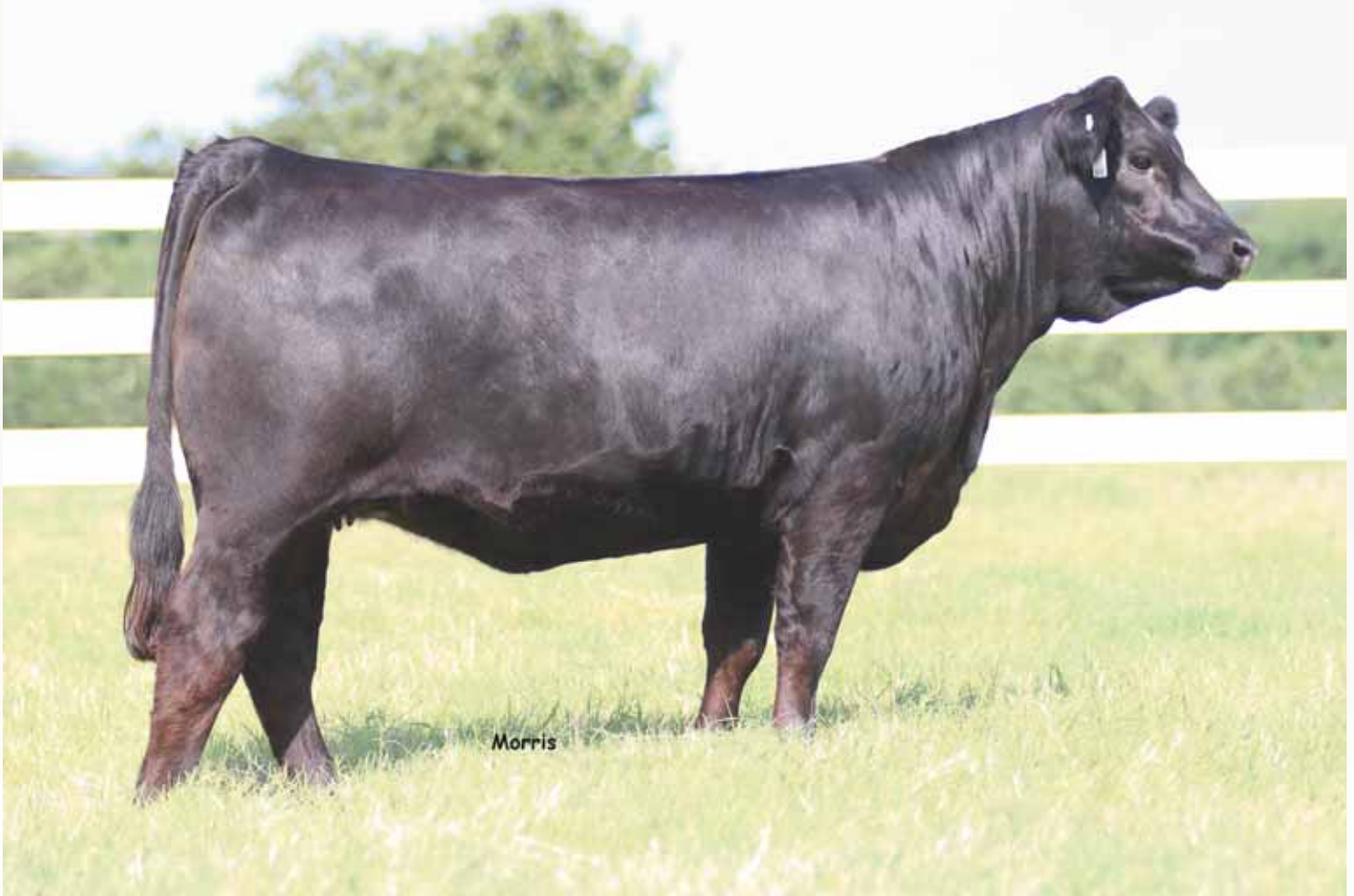
LOT 24 PBRS Zandeleigh 2110Z