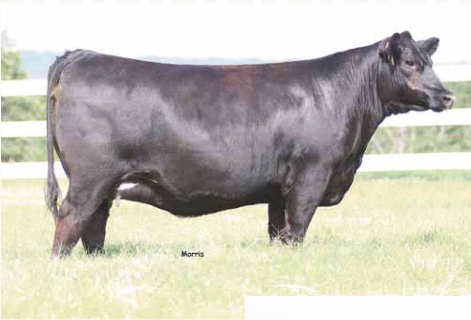
LOT 42 P Bar S Oklahoma 202Z