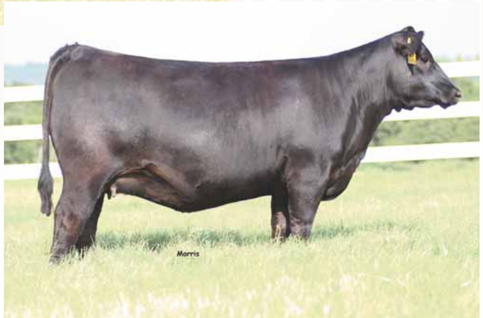
LOT 43 P Bar S Oklahoma 204Z