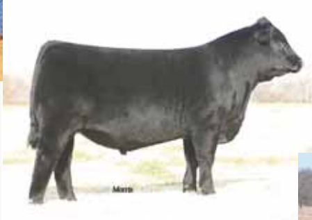
CALO Brickyard 902W