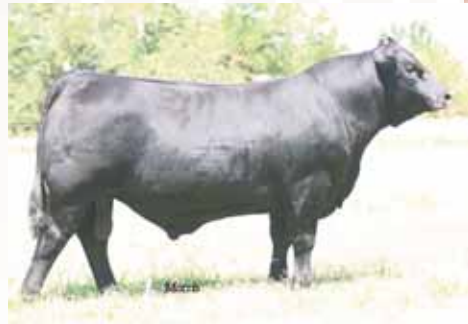
EBFL Ypsilanti 420Y