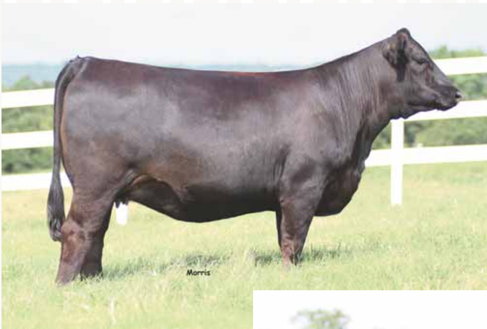
LOT 44 PBRS Zaharu 562Z