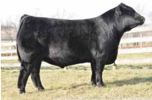
EF Xcessive Force, sire to Lot 41 embryos.