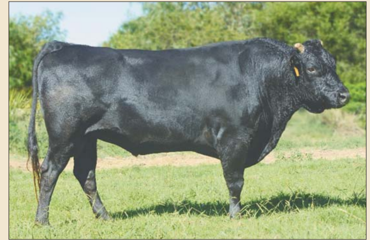
MAYURA ITOSHIGENAMI JNR Sire of Lot 29.