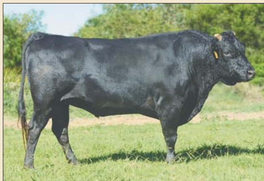
MAYURA ITOSHIGENAMI Sire of Lot 6.