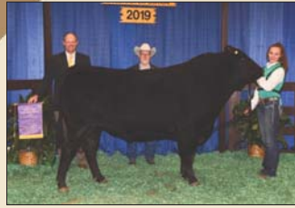
M6 GROW & GRADE 710E Sire of Lot 57B