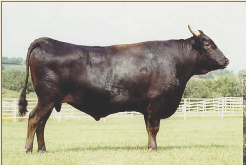
KITATERUYASUDOJ J12810 Sire of Lot 38.