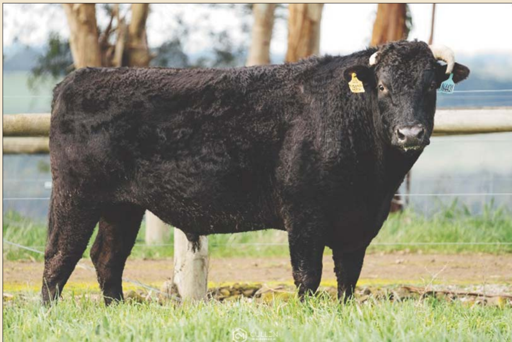
TYDDEWI N4431 ET