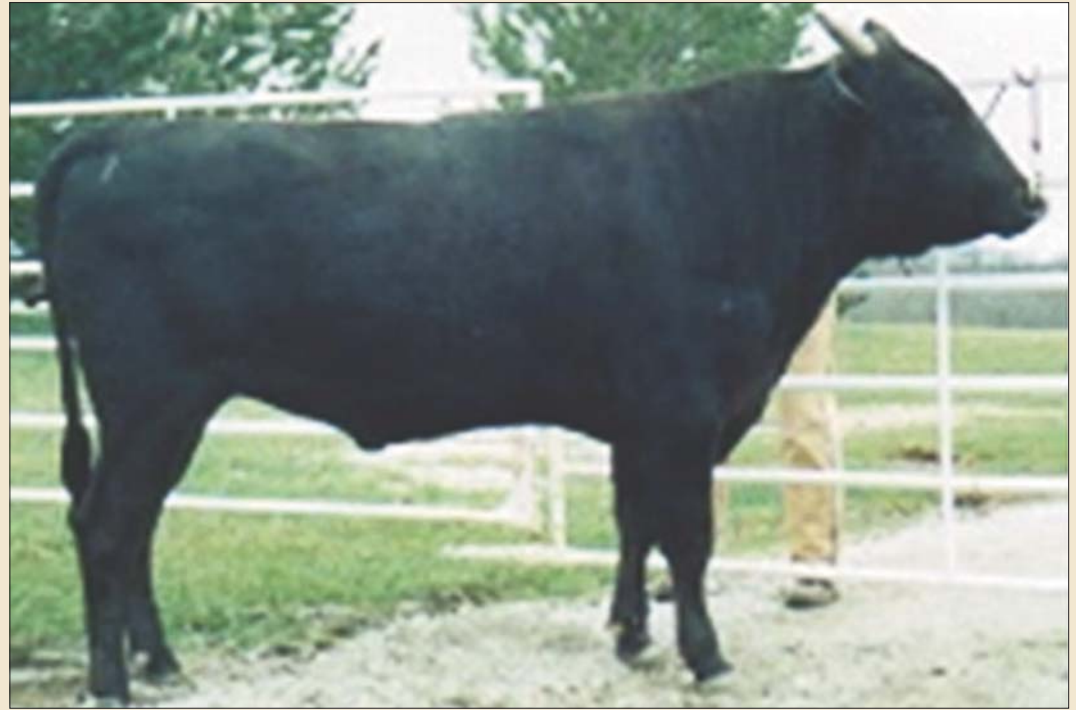
TF KIKUTSURUDOI Sire of Lot 23