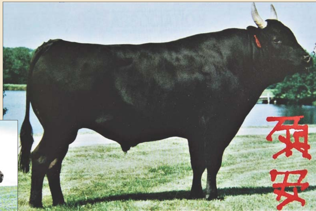
JVP KIKUYASU 400