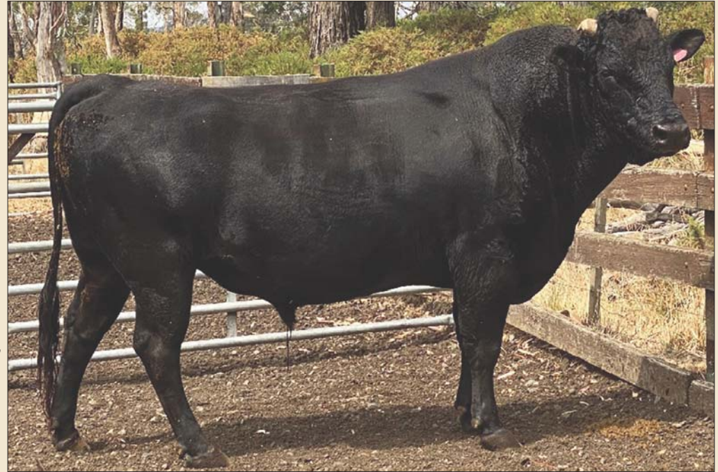
MIRRAGONG LITTLE KEITHIE Sire of Lot 55.