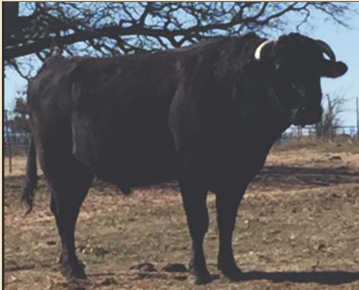
BIG JOHN 55W Sire of Lot 34