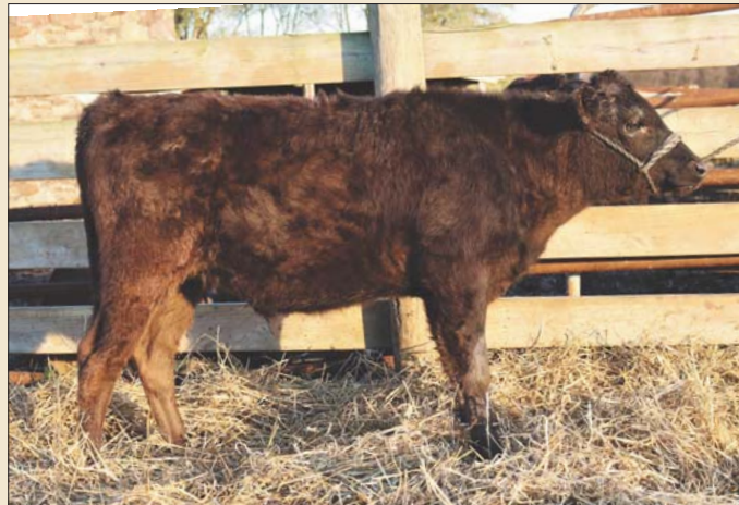
SYNERGY JNR SUPERIOR S594 ET