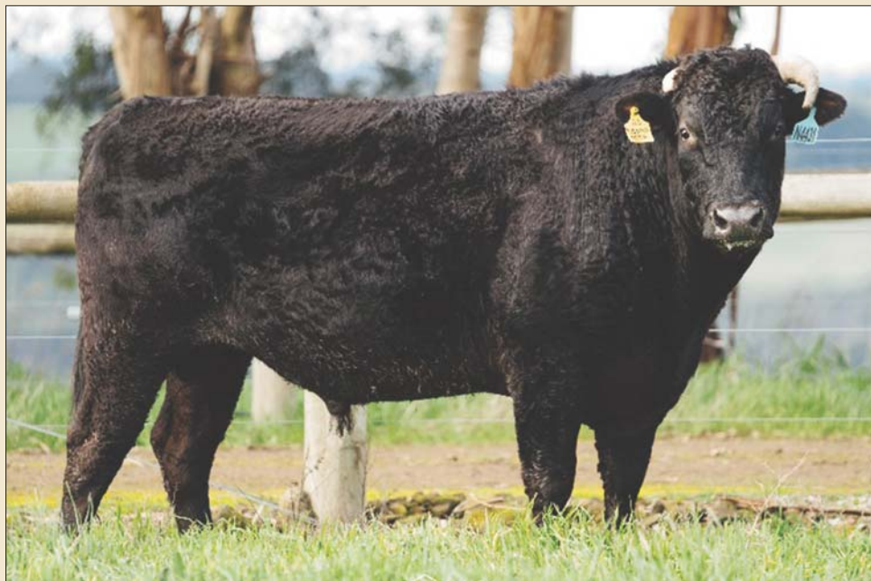
TYDDEWT N4431 ET Sire of Lot 58.