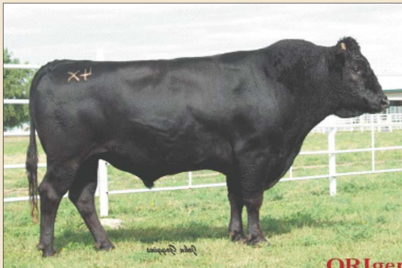
BR ITOMICHI/0602 4632