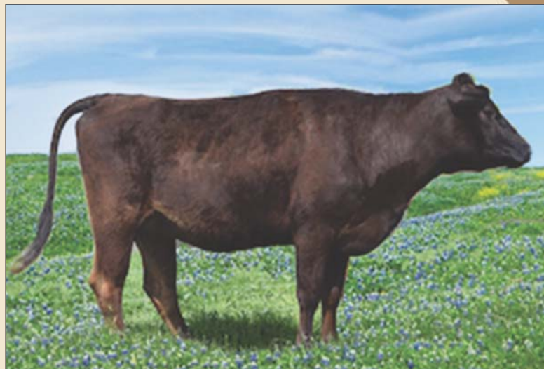
JC MS SHIGEFUKU 114