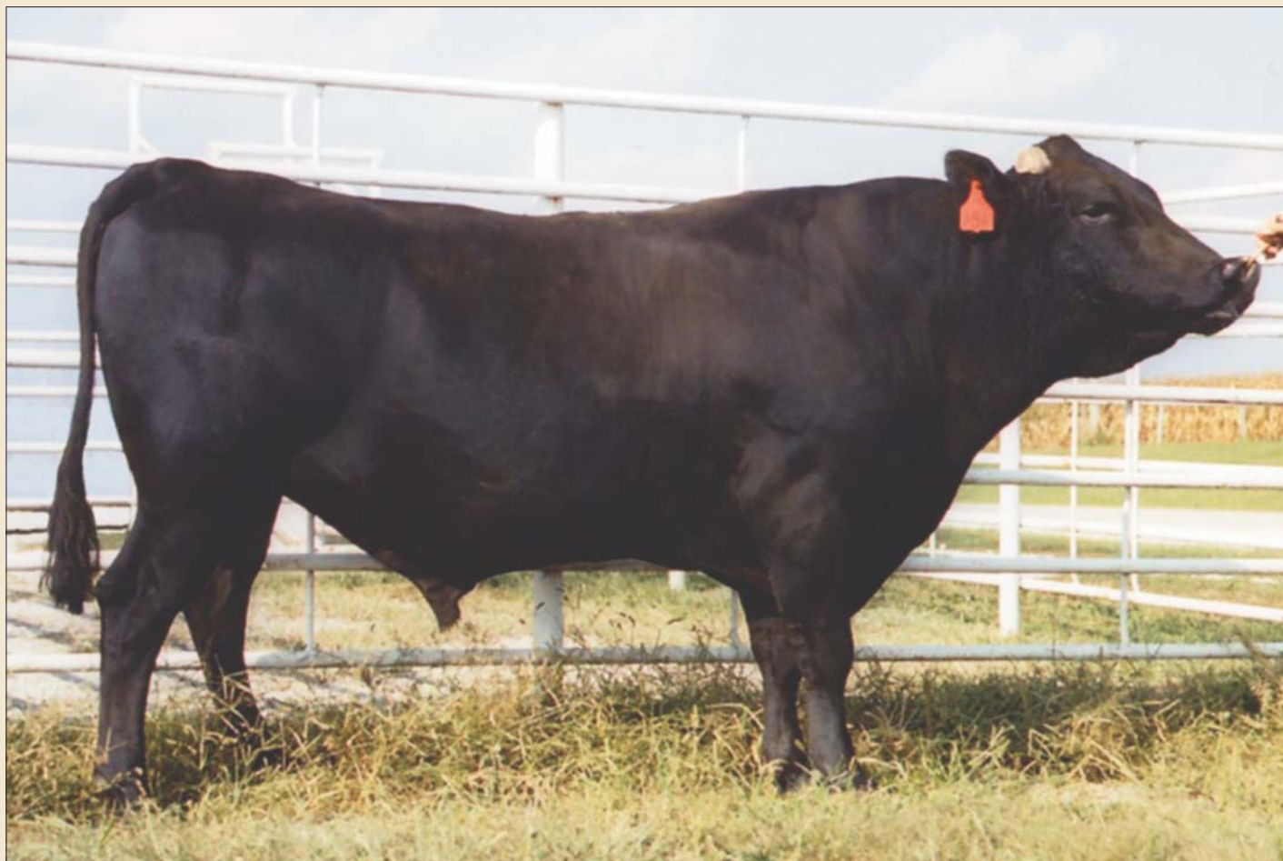
ITOZURU DOI Sire of Lot 25