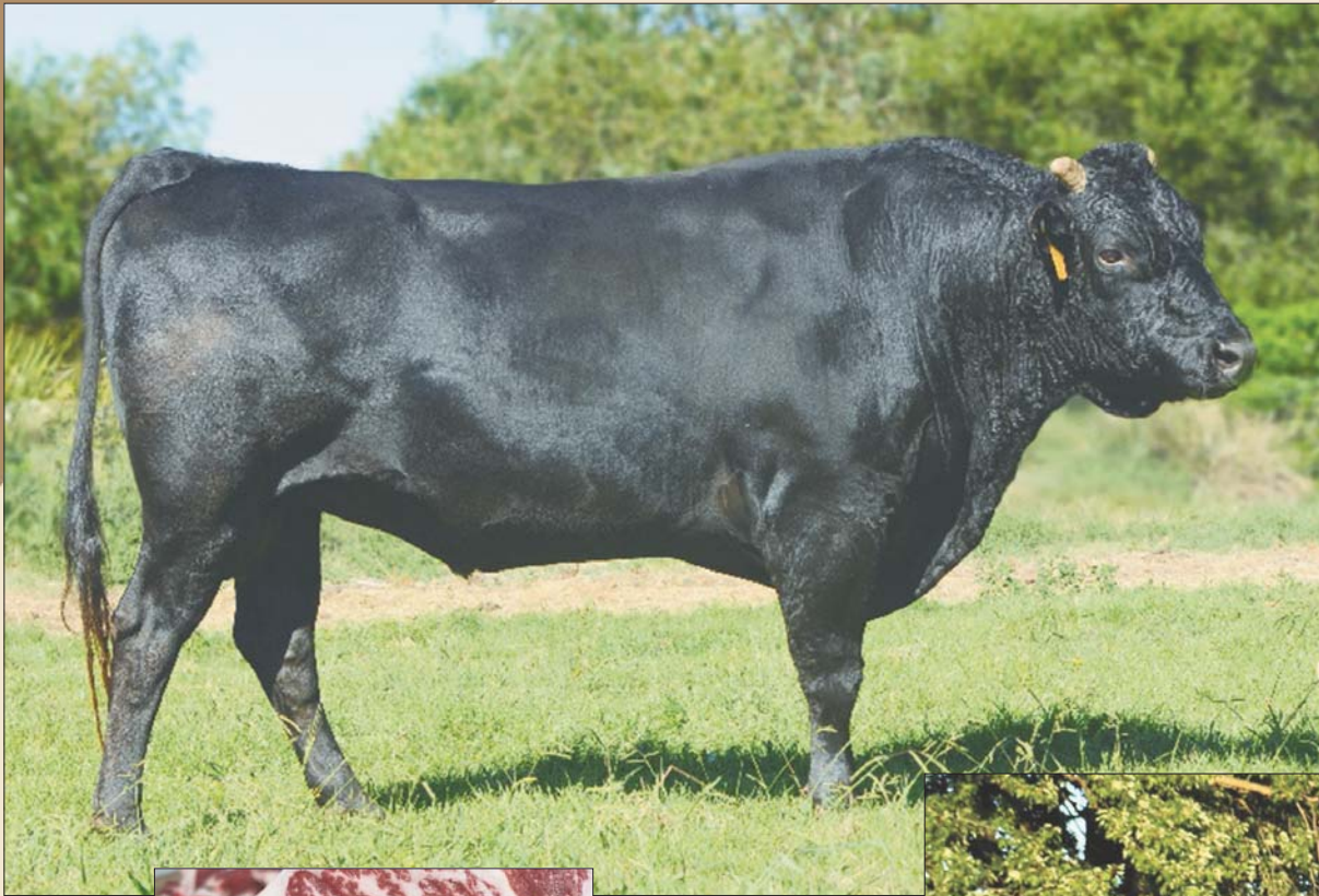
MAYURA ITOSHIGENAMI Sire of Lot X.