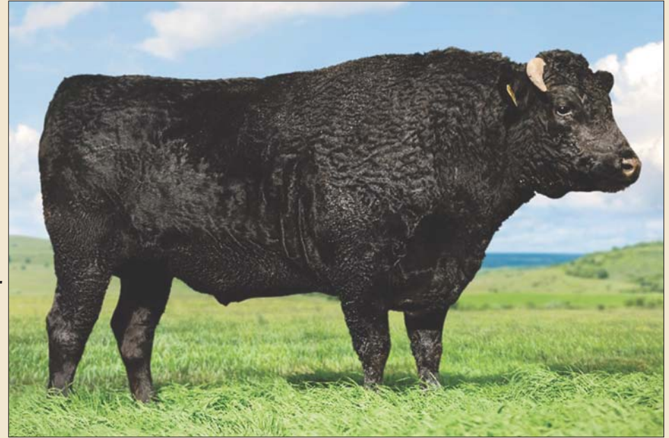
MAYURA L0010 ET Sire of Lot 33