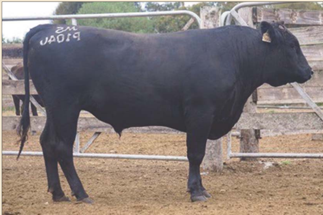
MAYURA PROLOGUE P1040 Sire of Lot 34