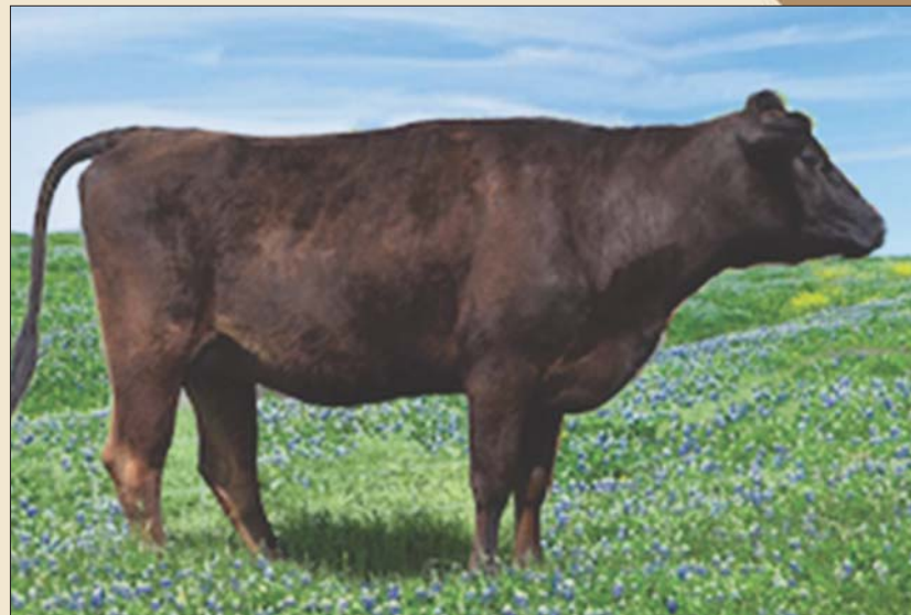
JC MS SHIGEFUKU 114 Dam of Lot 62.