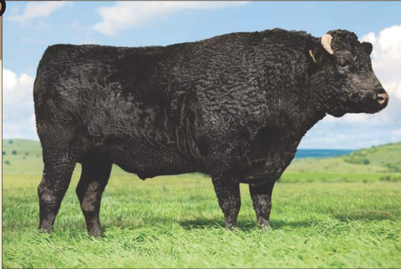
MAYURA L0010 ET Sire of Lot 59.