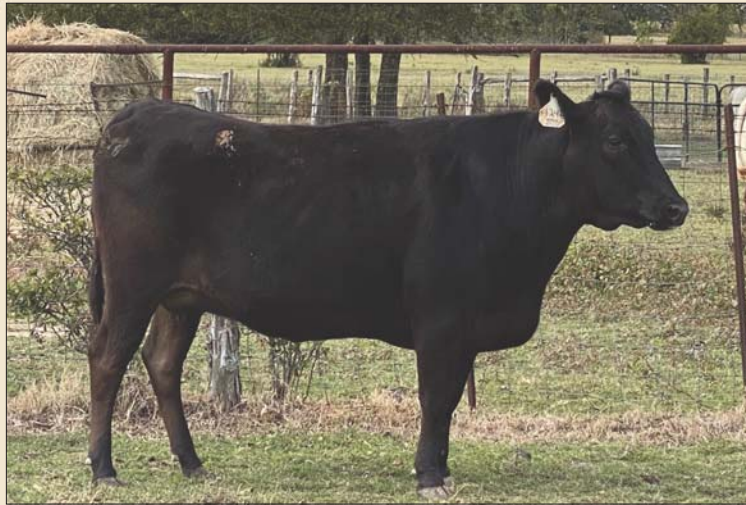
MOR MS HISAKO NAMI 124G ET Dam of Lot 43.