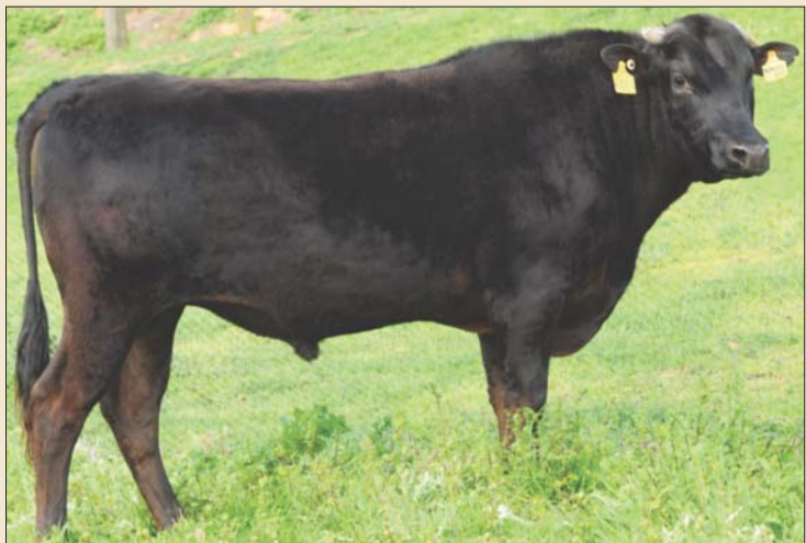
GOORAMBAT MR MARBLE K483