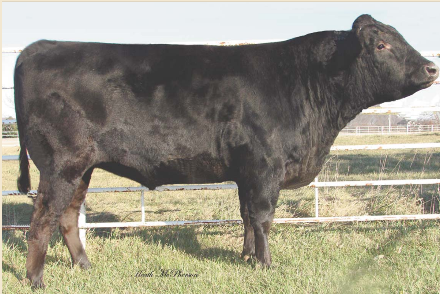
SR Y13 SANJI Sire of Lot 34