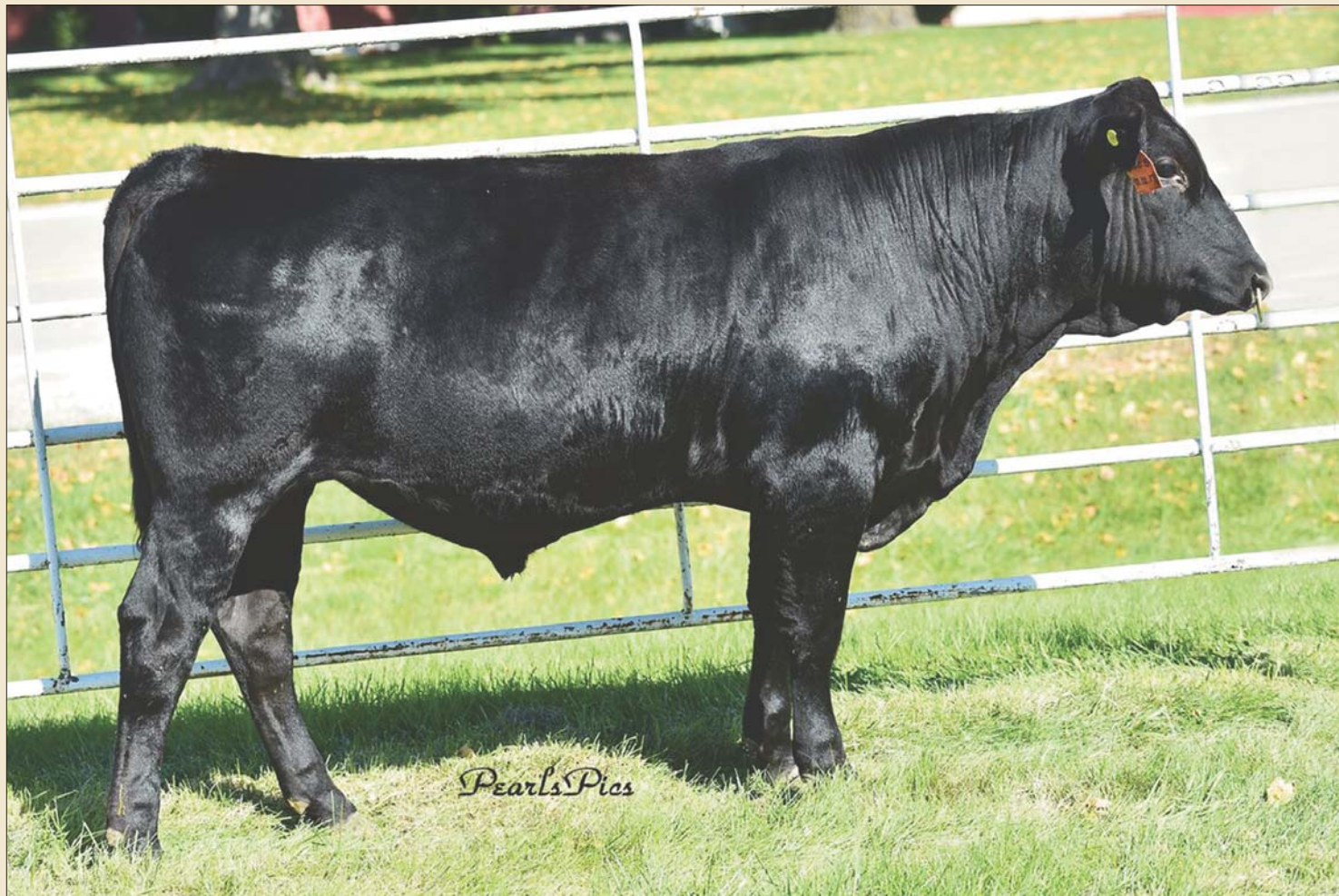
BARV TAZSURU 753E ET Sire of Lot 47.