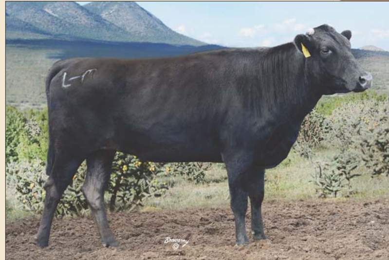
LMR MS KITAGUNI 8168U Grandam of Lot 30.