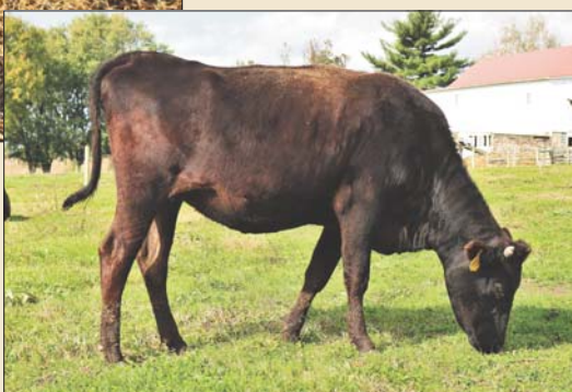
SYNERGY TF148 SUZUTANI 527G Dam of Lot 6.