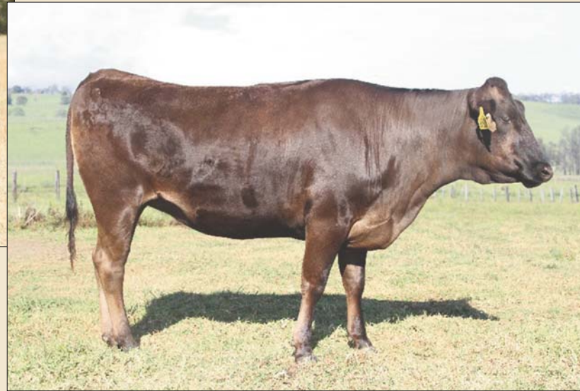
SUMO CATTLE CO FUKU K136 Dam of Lot 18.