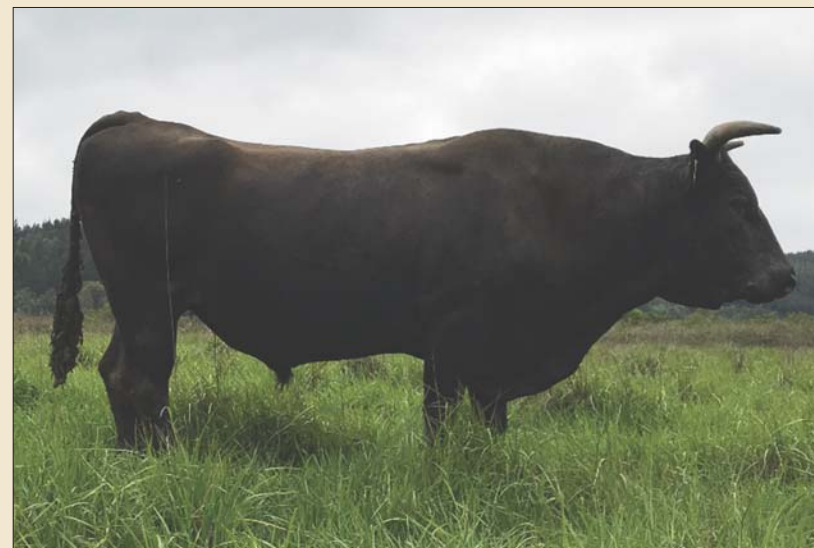
CHR ITOZURU DOI 2408