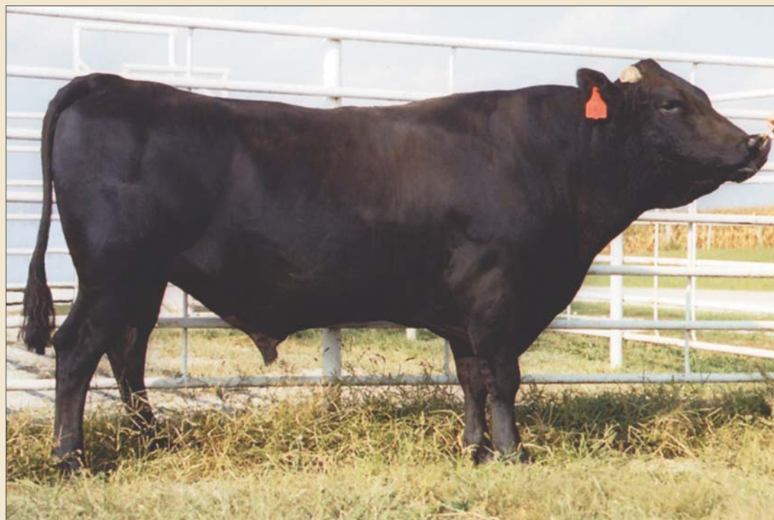
ITOZURU DOI Sire of Lot 31.