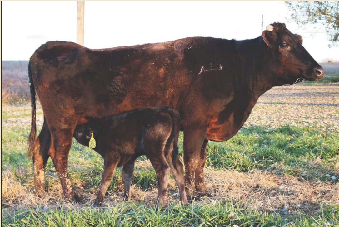
NOTE: Lot 8 is selling open and no calf at side.