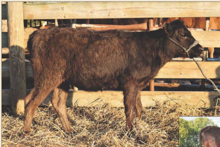
SYNERGY JNR SUZUTANI S590 ET Lot 6