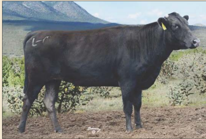
LMR MS KITAGUNI 8168U Dam of Lot 29.