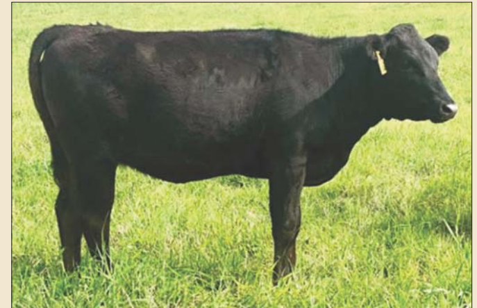
SUMO CATTLE CO CHIYOTAKE Q368 Dam of Lot 27