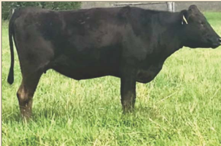
SUMO CATTLE CO FUKU P528