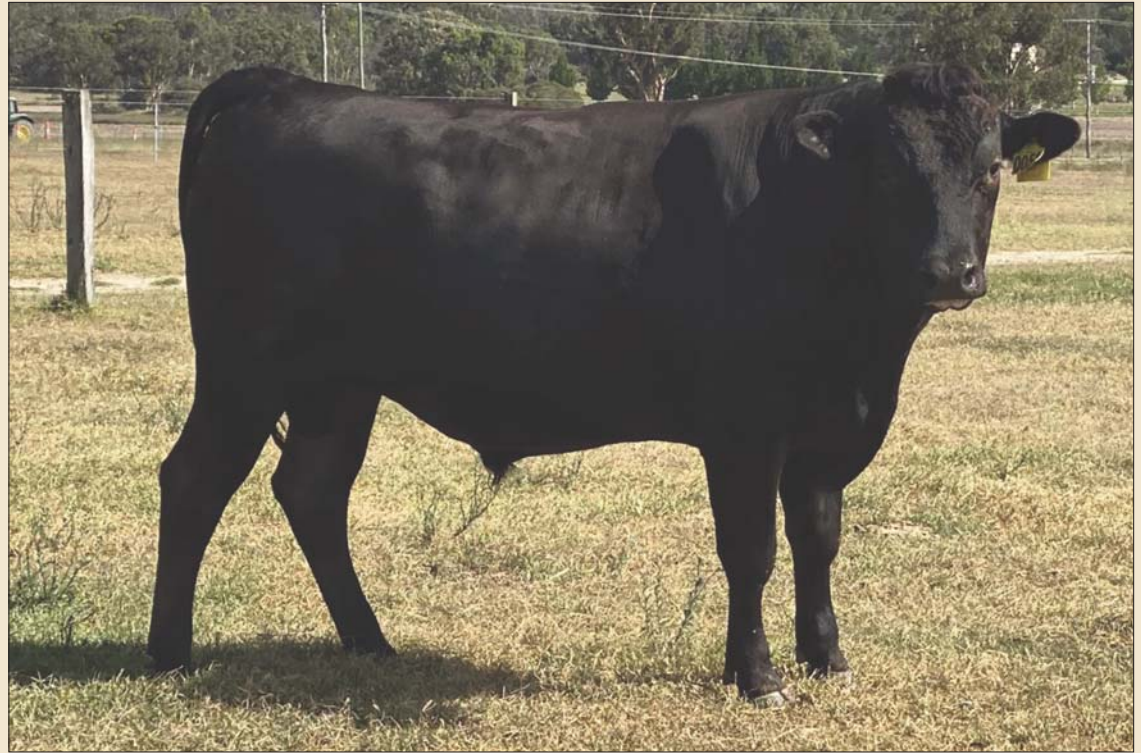
SUMO CATTLE CO MONIJO Q51