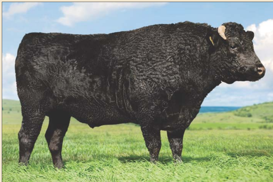
MAYURA L0010 ET Sire of Lot 42.