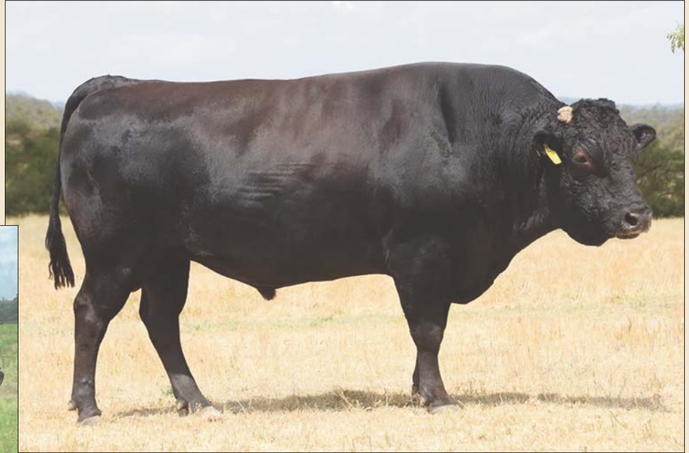
SUMO CATTLE CO MICHIFUKU F154 Sire of Lot 39.