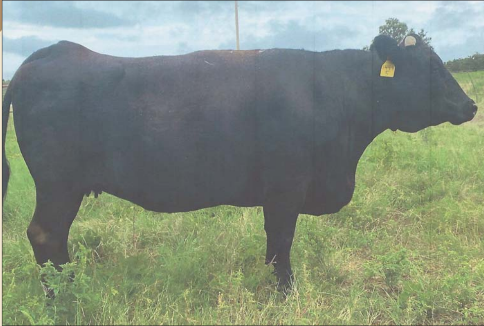
HW KIKOKAGE 29A Dam of Lot 39.