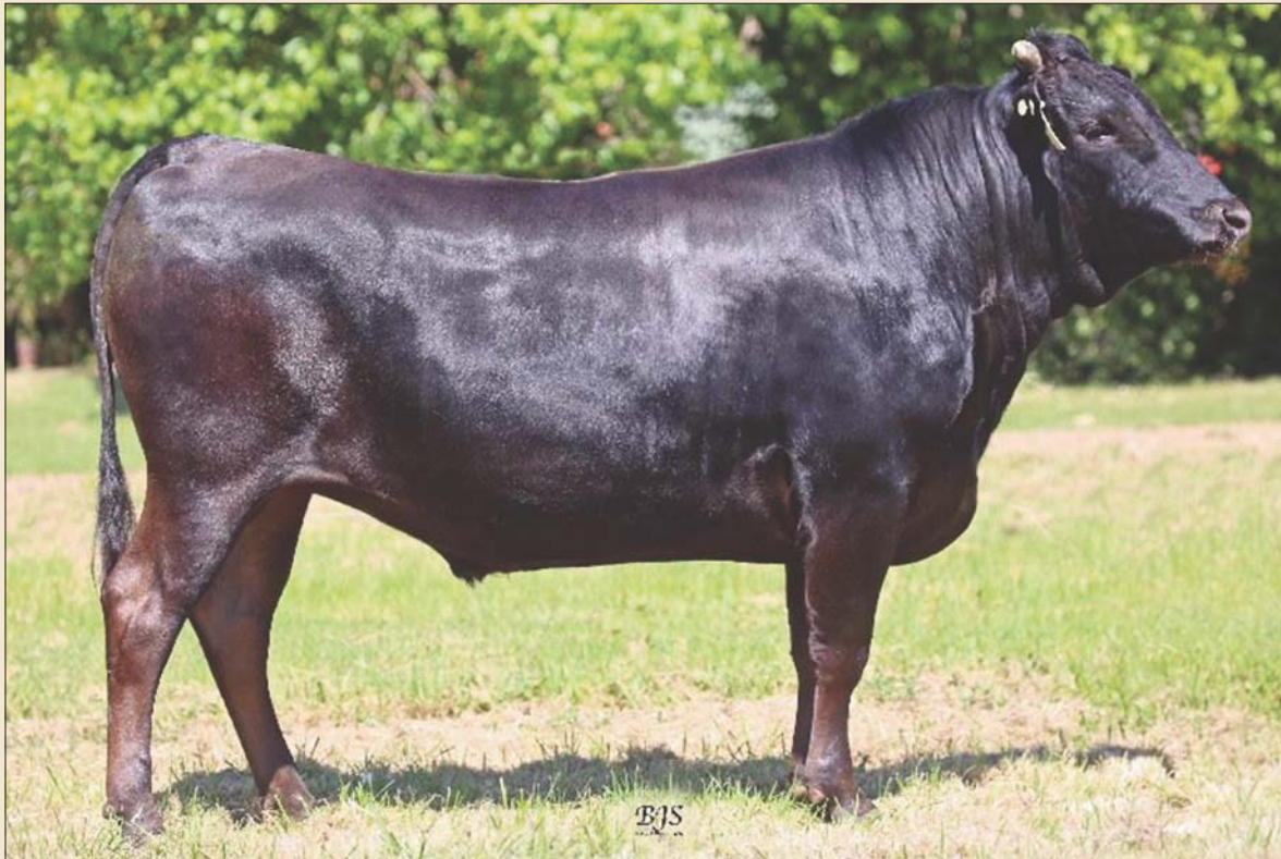
MYM ARUBIAL BOND Q007 ET Sire of Lot 49.