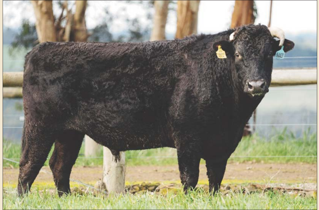
TYDDEWI N4431 ET Sire of Lot 53.