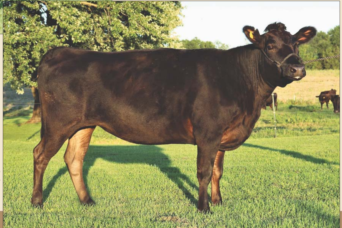
SYNERGY SYN GENJ SUZU 66E Dam of Lot X.