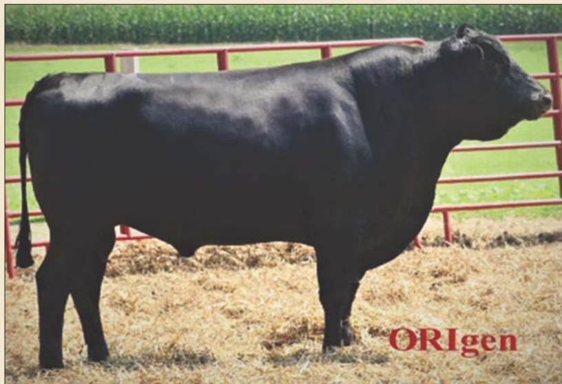
MFC KIMITOFUKU 434B Sire of Lot 62.