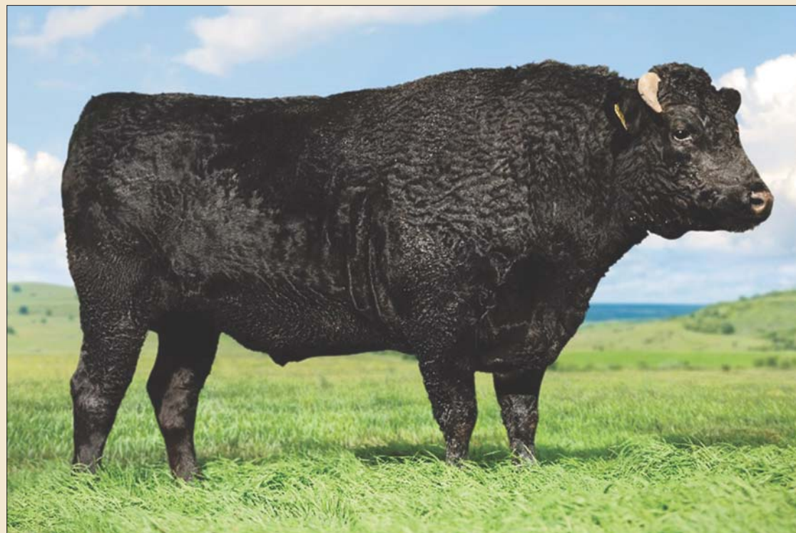
MAYURA L0010 ET Sire of Lot 11.