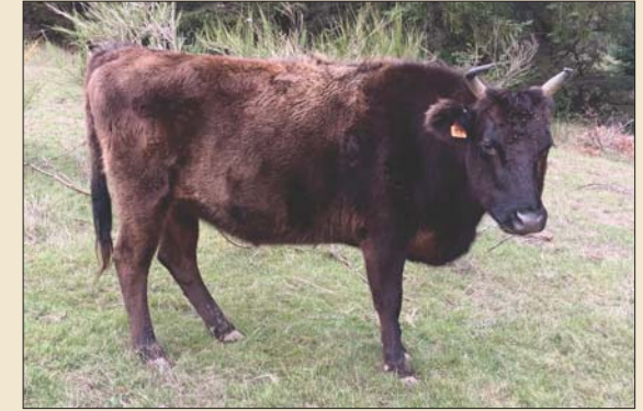
PRW MS. YASUFUKU-B82 Dam of Lot 57A & 57B.