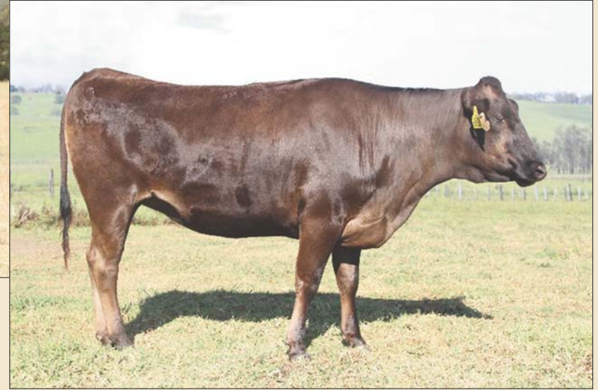
SUMO CATTLE CO FUKU K136 Dam of Lot 17