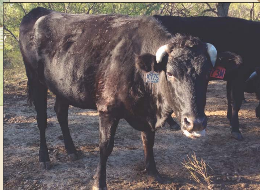
CAROLYN Dam of Lot 38.