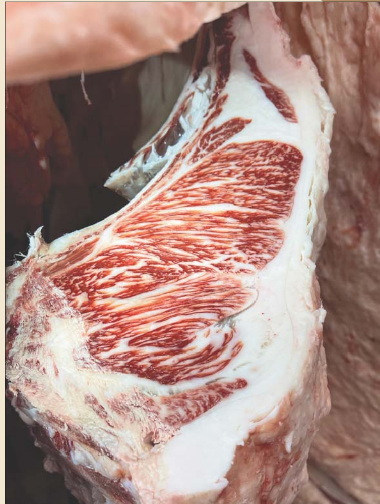
WSI ITOSHIGETERU Progeny carcass.