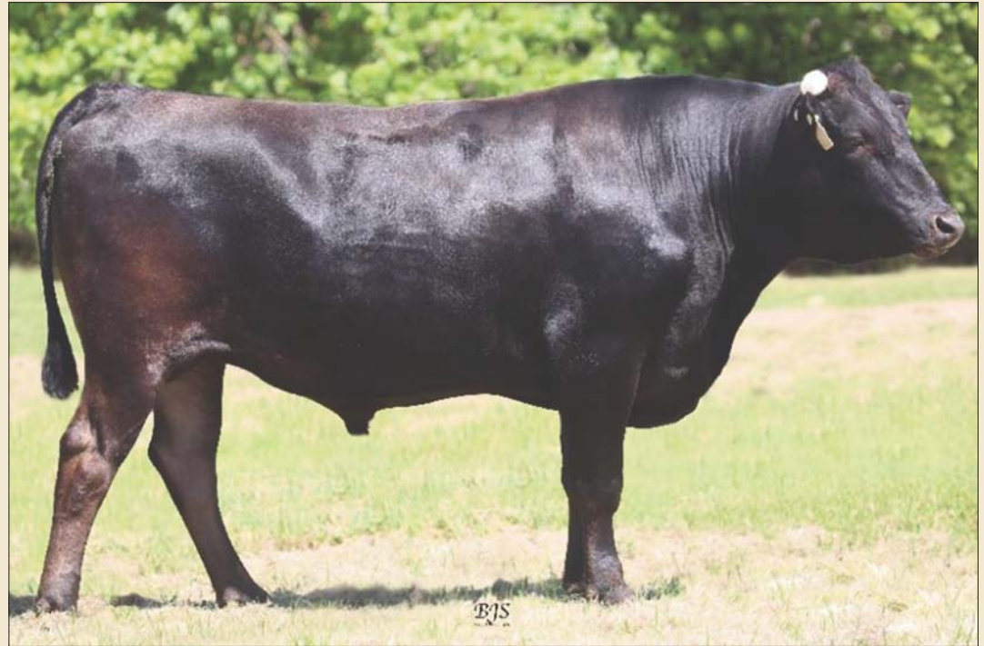
MYM ARUBIAL UNITED P0342 Sire of Lot 51.