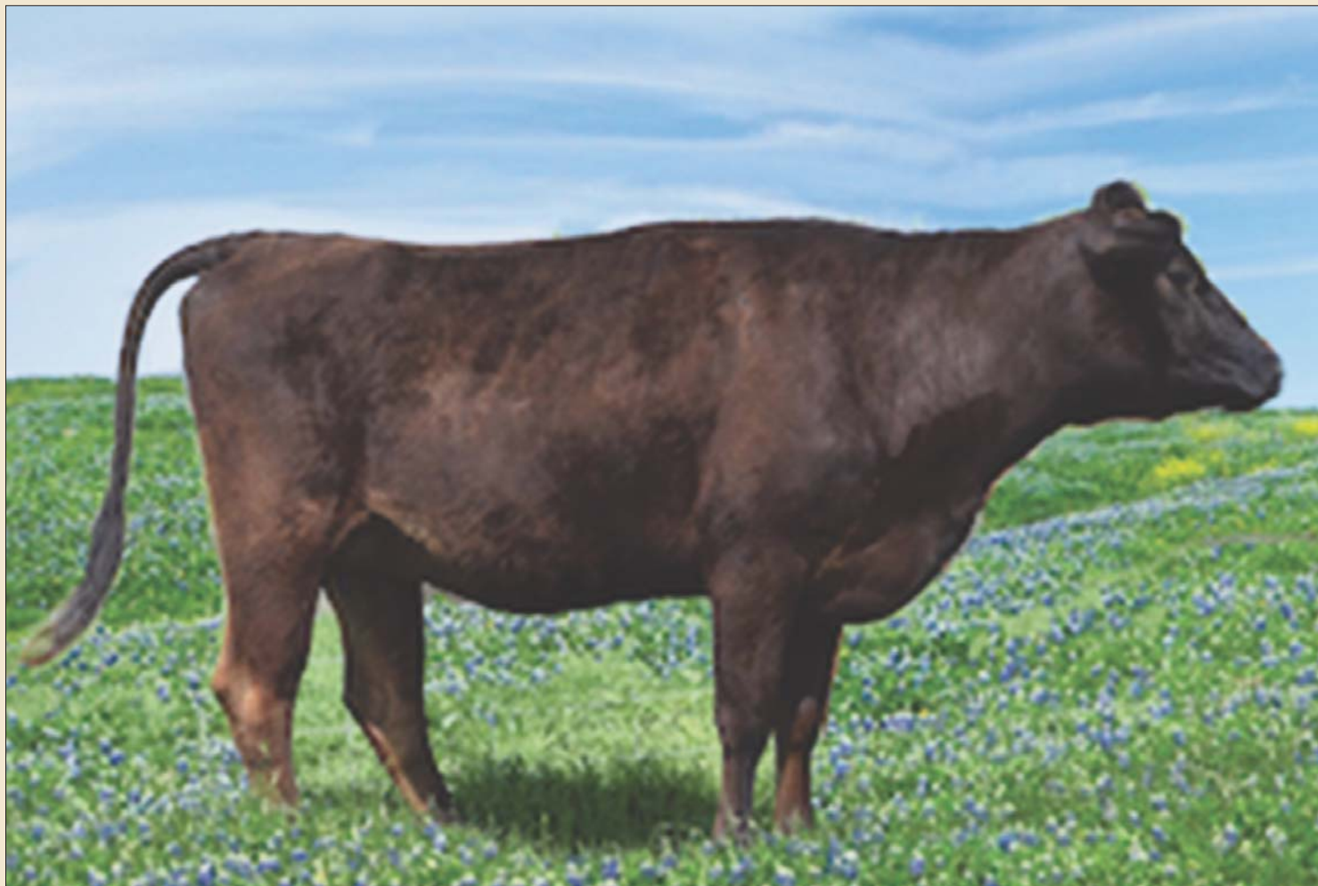
JC MS SHIGEFUKU 114 Dam of Lot 60.