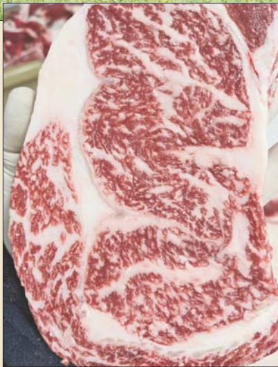
3/4 sib to S594's Dam.