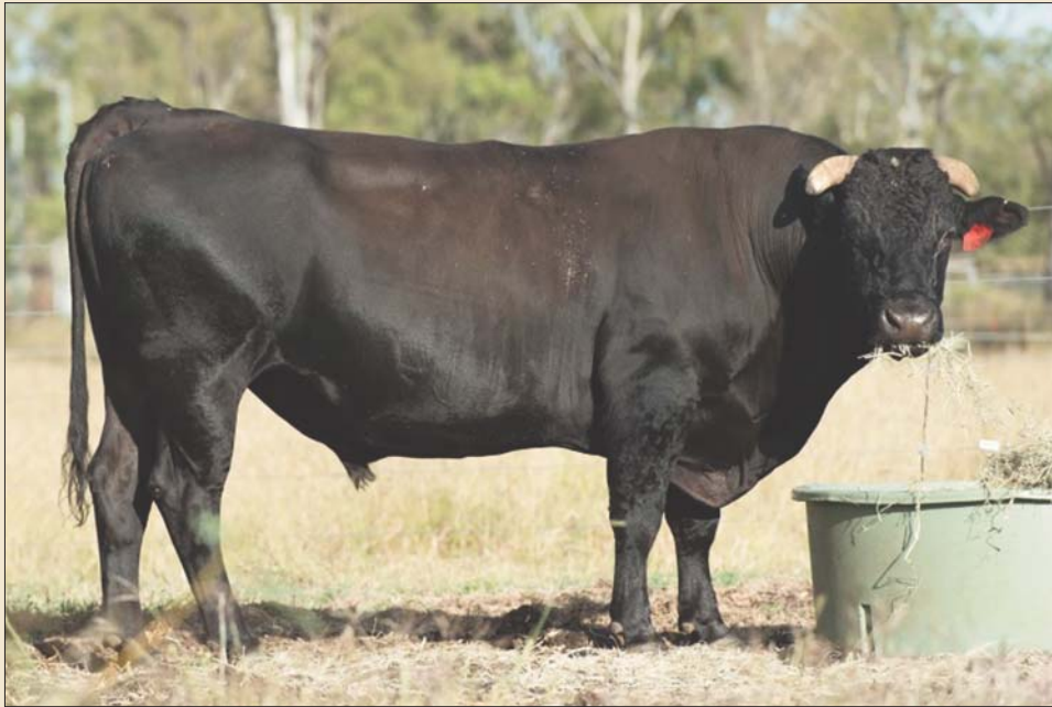
WESTHOLME HIRAMICHI TSURU Sire of Lot 24