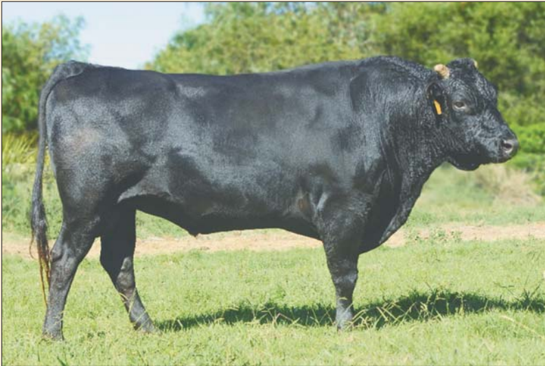
MAYURA ITOSHIGENAMI JNR Sire of Lot 30.