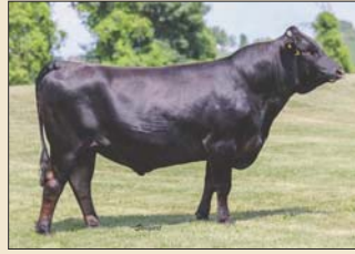
BAY 001 MONTARO 257F AI Sire of Lot 57A