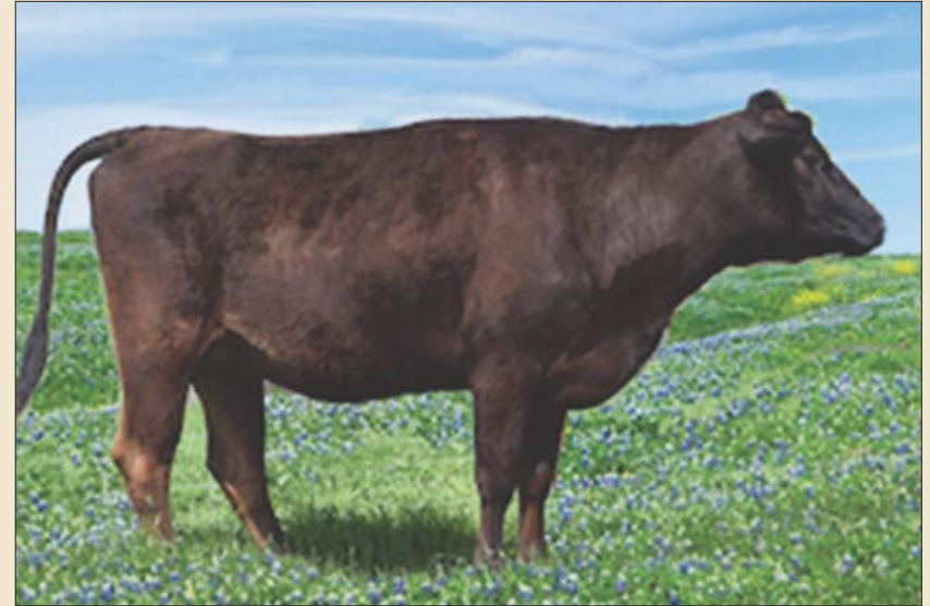
JC MS SHIGEFUKU 114 Dam of Lot 59.