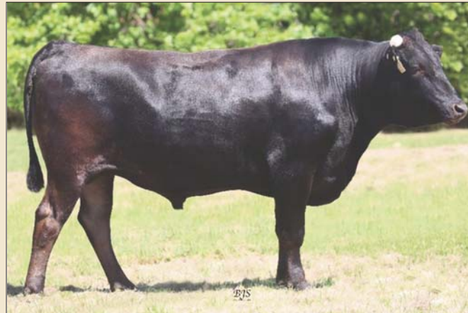
ARUBIAL UNITED P0342 Sire of Lot 27