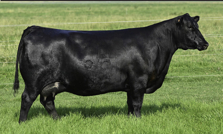
Coleman Donna 7181 Dam of Embryos

Coleman Donna 7181 x Coleman Glacier 041