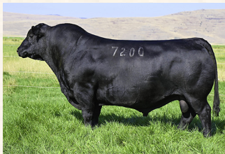
Coleman Rock 7200 Sire of Embryos

“5207” is a Pathfinder female, with a calving interval of 352 days on her first 4 calves, BR 4/95, NR 4/109, and YR 3/108. She has bred back first straw AI for the 3rd year in a row. “5207” is extremely angular, deep sided, perfect udder, and a big, long level hip. We’re overly excited for her future here. “5207” consistently has one of our best calves each year, her son by Coleman Resource 710 was one of our high selling bulls in our 2021 Bull sale. “5207” just weaned a big stout bull by Coleman Rock 7200. These embryos will be full sibs to the bull she just weaned, who is a standout. Rock was the $240,000 record selling bull in our 2022 female sale to Ingram Angus and Sandford Cattle. Demand for Rock is at an all-time high across the World right now. The cattleman’s kind is a perfect way describe the early indicators on Coleman Rock 7200. Rock would currently be one of the heaviest used sires here at Coleman Angus. He sires cattle with extra three-dimensional shape with added performance in the right size package. His offspring have tons of center body and