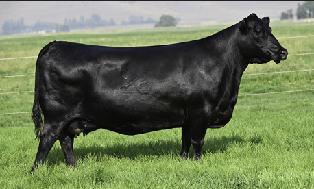
Coleman Eriskay 291 Dam of Embryos

Coleman Eriskay 291 x Coleman Resource 708