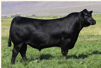
J Trademark 1037 Sire of Embryos

"7100" has one of the best sets of ET calves here this spring, she's making here mark here! "7100" is the dam of our herd bull "Logo 947", that Little Goose Ranch in WY bought spring possession from us in our 2020 bull sale. First calves this spring out of "947" look incredibly good. "7100" has been extremely productive here for us, we are excited to be partners with Shady Brook in TN on this tremendous young female. "7100" reminds me a lot of Donna 504 when she was this age, extremely long, tons of power, excellent udder. I feel she is one of the really good young females on the ranch here. "Trademark" is a bull we're excited to add to our program. We're excited to be working with Conley Angus on this elite herd-sire. Trademark was selected as the $165,000 top selling bull of the Cattleman's Cut Bull Sale. He is a low-birth weight calving ease bull, with double digit calving ease direct, with an outcross pedigree for our program. "Trademark" has caught the attention of cattleman from all across the country. He has tremendous performance, added