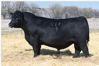
Sitz Barricade 632F Sire of Embryos

These are IVF embryos (Trans Ova), we are selling three embryos in this mating and guaranteeing one pregnancy. Buyer has the option to take six embryos out of this mating and we will guarantee 2 pregnancies. These embryos are exportable to Canada.