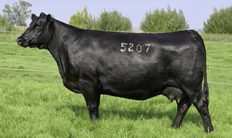
Coleman Donna 5207 Dam of Embryos

Coleman Donna 5207 x Sitz Barricade 632F