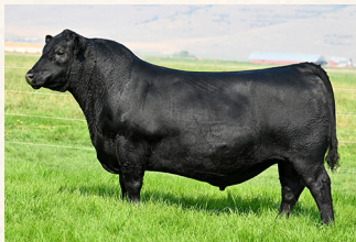
Coleman Banker 9215 Sire of Embryos

"3125" checks all of the boxes for us as an ideal Angus female, progeny ratios of birth ratio 4@94, nursing ratio 4@110, and a yearling ratio of 4@110. She has proven herself the old-fashioned way, in the pasture. She brings so much to the table with her massive amount of rib and body, perfect udder, and overall femininity. "3125" is the best "Right Time" daughter we have seen and had the opportunity to work with. Extremely excited for here future here. These embryos are sired by the now deceased "Banker" who is a bull we kept to use in our program, visitors have loved him here this summer. "Banker" is extremely impressive, exceptionally smooth, extremely sound on the move, stout, with about as much rib shape and depth as you can put in one. Banker's flush sisters that calved here this summer are as impressive as anything we have ever calved here. We