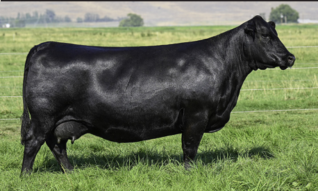
Coleman Donna 6206 Dam of Embryos

Coleman Donna 6206 x Coleman Glacier 041