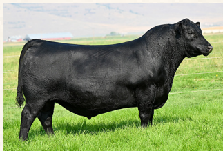
Coleman Banker 9215 Sire of Embryos

Donna 1234 is an incredibly special female, she has BR 6/90, NR 6/104 and YR 5/102. Donna 1234 is now 11 years old, tremendous longevity, we've got lots of daughters out of her in production here, they are working very well for us. Some of the very last embryos we will be selling out of her. "1234" is picture perfect to look at. She has a Charlo daughter that weaned her first calf, and she is impressive. Donna 1234 has a calving interval of 353 days on her first 3 calves. These embryos are sired by the now deceased "Banker" who is a bull we kept to use in our program, visitors have loved him here this summer. "Banker" is extremely impressive, exceptionally smooth, extremely sound on the move, stout, with about as much rib shape and depth as you can put in one. Banker's flush sisters that calved here this summer are as impressive as anything we have ever calved here. We have plugged Banker in here extremely hard, Banker's first calves are very impressive.