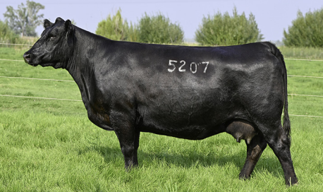
Coleman Donna 5207 Dam of Embryos

Coleman Donna 5207 x Coleman Charlo 0256