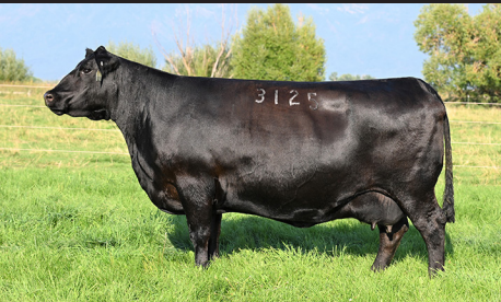
Coleman Donna 3125 Dam of Embryos

Coleman Donna 3125 x Coleman Banker 9215