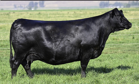
Coleman Donna7232 Dam of Embryos

Coleman Donna 7232 x Coleman Banker 9215