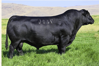
Coleman Rock 7200 Sire of Embryos

“7100” is a Pathfinder Female. “7100” has production records of 3/95 for BR, 3/109 NR, and 3/109 YR. “7100” has one of the best sets of ET calves here this spring, she’s making here mark here! “7100” is the dam of our herd bull “Logo 947”, that Little Goose Ranch in WY bought spring possession from us in our 2020 bull sale. First calves this spring out of “947” look incredibly good. “7100” has been extremely productive here for us, we are excited to be partners with Shady Brook in TN on this tremendous young female. “7100” reminds me a lot of Donna 504 when she was this age, extremely long, tons of power, excellent udder. I feel she is one of the really good young females on the ranch here. Rock was the $240,000 record selling bull in our 2022 female sale to Ingram Angus and Sandford Cattle. Demand for Rock is at an all-time high across the World right now. The cattleman’s kind is a perfect way describe the early indicators on Coleman Rock 7200. Rock would currently be one of the heaviest used sires here at Coleman Angus. He sires cattle with extra three-dimensional shape with added performance