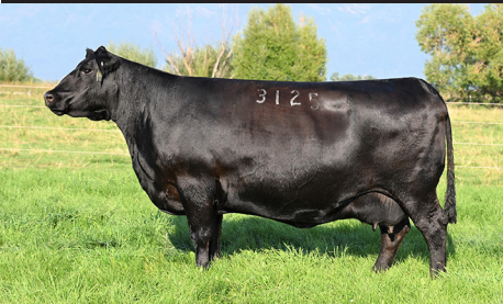
Coleman Donna 3125 Dam of Embryos