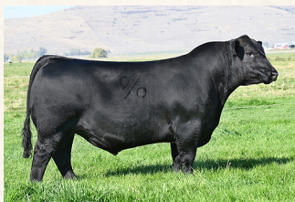
Coleman Glacier 041 Sire of Embryos

“8130” was a feature in our 2022 female sale. “8130” has a production record of BR 2/96, WR 2/105, and YR 1/102. She stems from the Pathfinder Donor, “0277”, who is the flush sister to Charlo 0256. “8130” has as much muscle as you can put in one, perfect udder, extremely long sided, and tremendous profile. We don’t have many embryos out of her, so take advantage of this mating. She has a Glacier heifer calf on her side now that is awesome. “Glacier” has been a standout since he was born. Glacier’s first calves are on the ground, they are very impressive as babies. Glacier has the best feet I’ve ever seen on a bull before, extremely sound, and athletic, with a great herd bull look and presence. He’s the bull the industry has been looking for. Glacier’s flush sisters are calving this spring, and look impressive, perfect udders, great feet, stout, with a great look. We believe it all starts with the mother cow; Glaciers Pathfinder dam is the fourth consecutive generation to make it the donor pen here. “439” has ratios of BR 5/93, NR 5/107, and