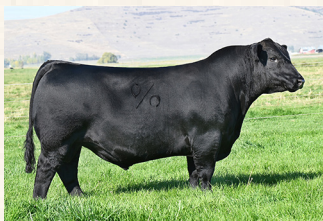
Coleman Glacier 041 Sire of Embryos

“7181” is a Pathfinder female here, with a calving interval of 3/360, BR 3/98, NR 3/107, and YR 1/106. “7181” has been a visitor favorite since she was a calf here, extremely deep bodied, big hip, with a beautiful udder. “7181” is the kind of females that made “Charlo” famous. 7181 has been extremely productive here, her second calf was one of the featured “Summer” heifers last falls in our female sale and brought $24,000. Her third calf was a $21,000 feature in our recent female sale, and a visitor favorite all summer. We don’t sell many embryos out of this female, so pay attention here. “Glacier” has been a standout since he was born. Glacier’s first calves are on the ground, they are very impressive as babies. Glacier has the best feet I’ve ever seen on a bull before, extremely sound, and athletic, with a great herd bull look and presence. He’s the bull the industry has been looking for. Glacier’s flush sisters are calving this spring, and look impressive, perfect udders, great feet, stout, with a great look. We believe it all starts with the mother cow; Glaciers Pathfinder dam is the fourth consecutive generation to make it the donor pen here. “439”