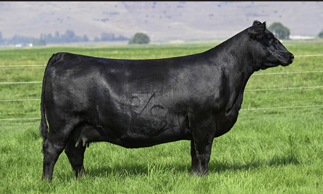
Coleman Donna 9220 Dam of Embryos