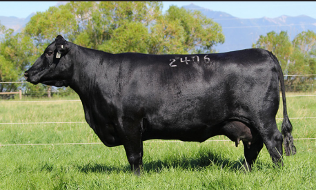
Coleman Everelda Entense 2406 Dam of Embryos

Coleman Everelda Entense 2406 x Coleman Resource 708