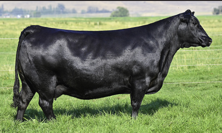
Coleman Abigale 8130 Dam of Embryos

Coleman Abigale 8130 x Coleman Glacier 041