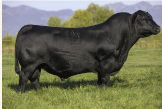
Coleman Resource 708 Sire of Embryos

“291” has been a particularly good female here. “291” is the dam of “Navigator 614” a proven bull that is leaving an extremely good set of daughters here, and whose sons have been topping our sales. “Navigator” throws as much true muscle as any bull we have ever used here. “Navigator” sons were very well received in our 2019 bull sale. We sold out of semen on Navigator last spring but have some more now available. “291” has 6 calves with a calving interval of 367, BR 8/88 NR 8/105 and YR 7/101. “291” has a perfect udder, long sided, deep ribbed and complete. Not very often you have a female that is extreme low BW like “291” and then throws this much performance. Sire of these embryos is a bull that has become known as “708” here at Coleman Angus. “708” reminds me of the early days when bulls proved themselves in the pasture one calf at a time, and everyone started calling them by their tattoo. “708” has been a visitor favorite here this fall, we bred him to a bunch of females and have been flushing him to our top donors. Here’s the first opportunity to purchase embryos out of him. Get on board with “708” he’s the real deal, proving himself the old-fashioned way, one