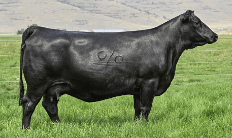
Coleman Chloe 975 Dam of Embryos