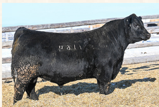
Coleman Galactic 1164 Sire of Embryos

“291” has been a particularly good female here. “291” is the dam of “Navigator 614” a proven bull that is leaving an extremely good set of daughters here, and whose sons have been topping our sales. “Navigator” throws as much true muscle as any bull we have ever used here. “Navigator” sons were very well received in our 2019 bull sale. We sold out of semen on Navigator last spring but have some more now available. “291” has 6 calves with a calving interval of 367, BR 8/88 NR 8/105 and YR 7/101. “291” has a perfect udder, long sided, deep ribbed and complete. Not very often you have a female that is extreme low BW like “291” and then throws this much performance. “Galactic” was the $150,000 top selling yearling bull of our 2022 Spring Bull Sale, going to Voss Angus in Iowa. We are extremely excited to get our first set of calves out of Galactic next spring.