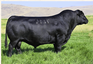
Coleman Rock 7200 Sire of Embryos

Donna 1234 is an incredibly special female, she has BR 6/90, NR 6/104 and YR 5/102. Donna 1234 is now 11 years old, tremendous longevity, we've got lots of daughters out of her in production here, they are working very well for us. Some of the very last embryos we will be selling out of her. "1234" is picture perfect to look at. She has a Charlo daughter that weaned her first calf, and she is impressive. Donna 1234 has a calving interval of 353 days on her first 3 calves. Big time mating here! Rock was the $240,000 record selling bull in our 2022 female sale to Ingram Angus and Sandford Cattle. Demand for Rock is at an all-time high across the World right now. The cattleman's kind is a perfect way describe the early indicators on Coleman Rock 7200. Rock would currently be one of the heaviest used sires here at Coleman Angus. He sires cattle with extra three-dimensional shape with added performance in the right size package. His offspring have tons of center body