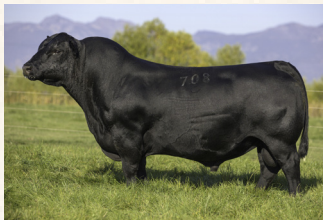
Coleman Resource 708 Sire of Embryos

C oleman Everelda Entense 2406 - This Pathfinder donor female is a direct daughter of Coleman Juneau 044 and back to the foundation Everelda Entense in our program, BT Everelda Entense 613L. Ingram Everelda Entense 7621, a daughter, sold one-half interest for $40,000 for a $80,000 valuation in the 2021 fall production sale at Ingram Angus. Through that same event she produced the top selling bull at $37,000 one-half interest for a $74,000 valuation, Ingram Intensity 0300, (sire of Lot 13 in this event) who is enrolled at Breeder Link. Everelda Entense 2406 is a flat-out producer, as she records a progeny production record of BR 8@94, WR 8@109, YR 6@104, and IMF 2@110, with a calving interval of 8/361. Sire of these embryos is a bull that has become known as "708" here at Coleman Angus. "708" reminds me of the early days when bulls proved themselves in the pasture one calf at a time, and everyone started calling them by their tattoo. "708" has been a visitor favorite here this fall, we bred him to a bunch of females and have been flushing him to our top donors. Here's the first opportunity to purchase embryos out of him. Get on board with "708" he's the real deal, proving himself the old-fashioned way, one great daughter at a time. "Resource 708" is a bull we are extremely