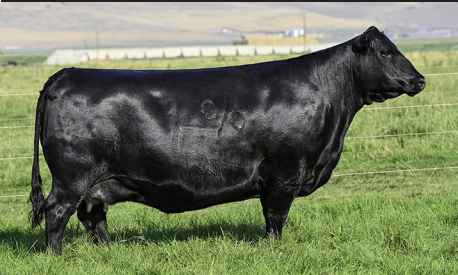
Coleman Donna 7100 Dam of Embryos