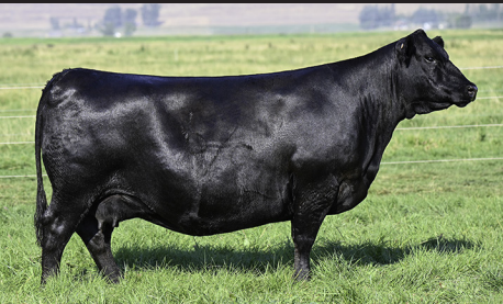
Coleman Donna7232 Dam of Embryos