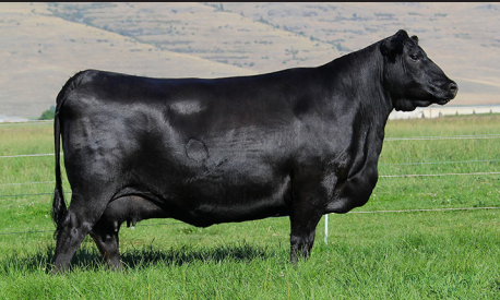
Coleman Donna 1234 Dam of Embryos

Coleman Donna 1234 x Coleman Banker 9215