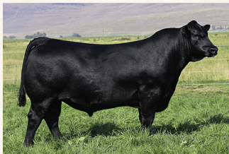
J Trademark 1037 Sire of Embryos

“6206” is a very Maternal Pathfinder female that we have pulled out of production and started flushing. “6206” has an impeccable record here, calving interval of 364 on her first 4 calves, BR 4/95 NR of 110 and YR of 105. She has her fifth calf on her now, has always bred 1st straw AI in her life. Her son was one of our feature bulls in our 2022 Bull Sale and was one of the sale toppers. “6206” has proved herself the old-fashioned way, in the pasture. Her heifer calf by Triumph has been a visitor favorite here this summer. Perfect udder, and feet on her also. Study her pedigree, lots of very proven maternal bulls in there. “Trademark” is a bull we’re excited to add to our program. We’re excited to be working with Conley Angus on this elite herd-sire. Trademark was selected as the $165,000 top selling bull of the Cattleman’s Cut Bull Sale. He is a low-birth weight calving ease bull, with double digit calving ease direct, with an outcross pedigree for our program. “Trademark” has caught the attention of cattleman from all across the country.