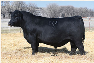
Sitz Barricade 632F Sire of Embryos

"5207" is a Pathfinder female, with a calving interval of 352 days on her first 4 calves, BR 4/95, NR 4/109, and YR 3/108. She has bred back first straw AI for the 3rd year in a row. "5207" is extremely angular, deep sided, perfect udder, and a big, long level hip. We're overly excited for her future here. "5207" consistently has one of our best calves each year, her son by Coleman Resource 710 was one of our high selling bulls in our 2021 Bull sale. "5207" just weaned a big stout bull by Coleman Rock 7200. Sitz Barricade, a featured Genex sire, is a new bull we have started using, lots of body, deep ribbed, and good footed. Extremely exciting mating here for sure. These are IVF embryos (Trans Ova), we are selling three embryos in this mating and guaranteeing one pregnancy. Buyer has the option to take six embryos out of this mating and we will guarantee 2 pregnancies. These embryos are exportable to Canada.