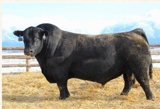
Coleman Charlo 0256 Sire of Embryos

“5207” is a Pathfinder female, with a calving interval of 352 days on her first 4 calves, BR 4/95, NR 4/109, and YR 3/108. She has bred back first straw AI for the 3rd year in a row. “5207” is extremely angular, deep sided, perfect udder, and a big, long level hip. We’re overly excited for her future here. “5207” consistently has one of our best calves each year, her son by Coleman Resource 710 was one of our high selling bulls in our 2021 Bull sale. “5207” just weaned a big stout bull by Coleman Rock 7200. The progeny out of Charlo are very good, exactly what we have been looking for, tremendous amount of natural base width, wide topped, and a true power bull, all in a sleep all night heifer bull. Charlo is seeing tremendous use all around the world. It’s been very rewarding to see progeny out of Charlo topping many sales around the country. His daughters here in