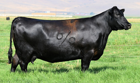
Coleman Everelda Entense 4327 Dam of Embryos

Coleman Everelda Entense 4327 x J Trademark 1037