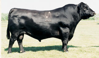
N Bar Emulation EXT Sire of Embryos

mating and we will guarantee 2 pregnancies. These embryos are exportable to Canada. These embryos have been sexed for females, 90-95% accurate.