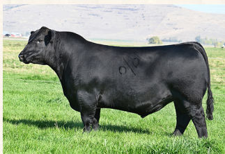
Coleman Glacier 041 Sire of Embryos

C oleman Everelda Entense 2406 - This Pathfinder donor female is a direct daughter of Coleman Juneau 044 and back to the foundation Everelda Entense in our program, BT Eveleda Entense 613L. Everelda Entense 2406 is a flat-out producer, as she records a progeny production record of BR 8/94, WR 8/109, YR 6/104, and IMF 2/110, with a calving interval of 8/361. Ingram Everelda Entense 7621, a daughter, sold one-half interest for $40,000 for a $80,000 valuation in the 2021 fall production sale at Ingram Angus. Through that same event she produced the top selling bull at $37,000 one-half interest for a $74,000 valuation, Ingram Intensity 0300, (sire of Lot 10 in this event). "Glacier" has been a standout since he was born. Glacier's first calves are on the ground, they are very impressive as babies. Glacier has the best feet I've ever seen on a bull before, extremely sound, and athletic, with a great herd bull look and presence. He's the bull the industry has been looking for. Glacier's flush sisters are calving this spring, and look impressive, perfect udders, great feet, stout, with a great look. We believe it all starts with the mother cow; Glaciers Pathfinder dam is the fourth consecutive generation to make it the donor pen here. "439" has ratios of BR 5/93, NR 5/107, and YR 5/106. 439 has been