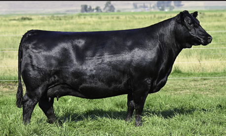
Coleman Donna 8265 Dam of Embryos