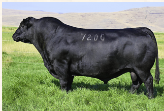
Coleman Rock 7200 Sire of Embryos

“3125” checks all of the boxes for us as an ideal Angus female, progeny ratios of birth ratio 4@94, nursing ratio 4@110, and a yearling ratio of 4@110. She has proven herself the old-fashioned way, in the pasture. She brings so much to the table with her massive amount of rib and body, perfect udder, and overall femininity. “3125” is the best “Right Time” daughter we have seen and had the opportunity to work with. Extremely excited for here future here. Rock was the $240,000 record selling bull in our 2022 female sale to Ingram Angus and Sandford Cattle. Demand for Rock is at an all-time high across the World right now. The cattleman’s kind is a perfect way describe the early indicators on Coleman Rock 7200. Rock would currently be one of the heaviest used sires here at Coleman Angus. He sires cattle with extra three-dimensional shape