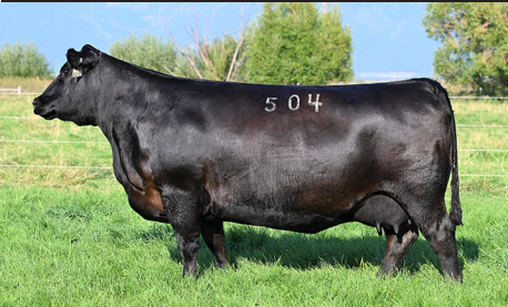
Coleman Donna 504 Dam of Embryos