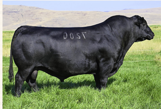
Coleman Rock 7200 Sire of Embryos

“7181” is a Pathfinder female here, with a calving interval of 3/360, BR 3/98, NR 3/ 107, and YR 1/ 106. “7181” has been a visitor favorite since she was a calf here, extremely deep bodied, big hip, with a beautiful udder. “7181” is the kind of females that made “Charlo” famous. 7181 has been extremely productive here, her second calf was one of the featured “Summer” heifers last falls in our female sale and brought $24,000. Her third calf was a $21,000 feature in our recent female sale, and a visitor favorite all summer. We don’t sell many embryos out of this female, so pay attention here. Rock was the $240,000 record selling bull in our 2022 female sale to Ingram Angus and Sandford Cattle. Demand for Rock is at an all-time high across the World right now. The cattleman’s kind is a perfect way describe the early indicators on Coleman Rock 7200. Rock would currently be one of the heaviest used sires here at Coleman Angus. He sires cattle with extra three-dimensional shape with added performance in the right size package. His offspring