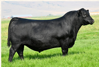
Coleman Banker 9215 Sire of Embryos

//7232" has production records of BR 2/97, NR 2/104, and YR 2/106. She has a tremendous herd bull on her now from our summer calving group. "7232" is throwing a tremendous amount of performance in her progeny, she has the power to change one! "7232" is extremely long, big hiped, with a beautiful udder. This Resource X Donna 714 cross has been one of the best we have ever made here. "7232" has the potential to make a big time "Herd Bull". These embryos are sired by the now deceased "Banker" who is a bull we kept to use in our program, visitors have loved him here this summer. "Banker" is extremely impressive, exceptionally smooth, extremely sound on the move, stout, with about as much rib shape and depth as you can put in one. Banker's flush sisters that calved here this summer are as impressive as anything we have ever calved