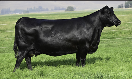
Coleman Eriskay 291 Dam of Embryos

Coleman Eriskay 291 x Coleman Galactic 1164