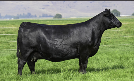
Coleman Donna 9220 Dam of Embryos