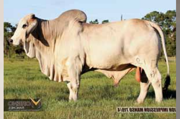
Service Sire, JDH Impression Manso 719/4.

P.E. 02.15.14 to 04.19.14 to JDH Impression Manso 719/4. BW WW YW MILK