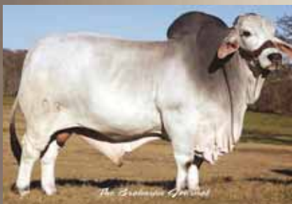
Service sire, JDH Mr. Ashton Manso 193/4.

A sale feature is this unbelievable bred heifer Moreno Ms. Chocheta 128. She is a known daughter of JDH Sir Walter Manso 549/6. He is the leading Moreno Ranches sire and son of +JDH Sir Marri Manso that has generated millions of dollars in Brazil and in the U.S. This heifers sire JDH Sir Walter Manso is the only son of +JDH Sir Marri Manso of this caliber working in the United States. This young female is very deep flanked with tons of capacity. She is easy in her condition, very stylish and complete in her design. We love her squareness from her hooks to her pins and her sound hind leg set. She was the Miami International calf champion in 2013 and now sells bred to JDH Mr Ashton Manso 193/4. He is one of the most legendary bulls in the JD Hudgins program. He has made a huge impact in the Brahman breed and his lineage will live on forever. Take a close look at this bred heifer and realize the money generating potential found within this genetic package.