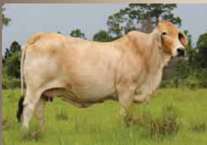
Dam, Mr Miss Treinta 228