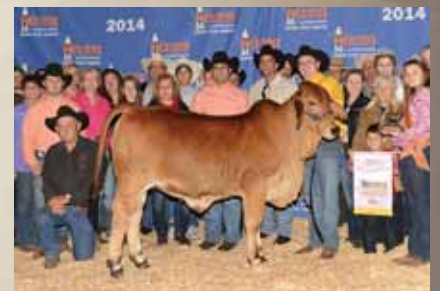
Maternal half sister to Moreno Ms. Lady Royal 238