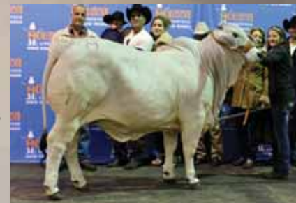
Moreno Ms. Mimosa 140 - 2014 International Sale high selling heifer