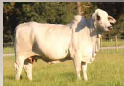
Dam, JDH Lady Calver Manso 766/3