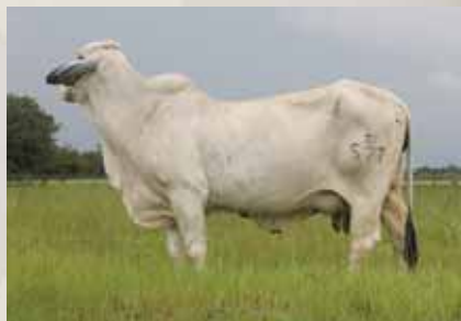
Dam, Miss MK 6/577