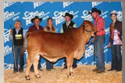
Maternal half sister to Moreno Ms. Lady Royal 238