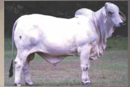
Sire, Mr. V8 980/5

One of the senior herd sires and now deceased Mr V8 980/5 is the sire of these 8 daughters. Out of 14 animals in his pedigree there are 11 that have achieved the registered renown status. His semen is limited in the U.S. and the select few daughters at Moreno Ranches continue to amaze us. These young daughters are true breeding pieces that were selected from the heart of the progressive Moreno Ranches program. They were designed to further the Moreno success but a decision was made to highlight this special sale with them. Moreno sold a daughter in the 2014 International Brahman sale at $26,000 and another daughter was a top seller at $10,500 in the Fall '13 Moreno Catalyst Sale. The acceptance and appreciation for these daughters has been astounding and knowing that the sire is deceased makes it that much more appealing.