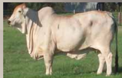
Maternal granddam, +GS MS Mulhim Manso 314