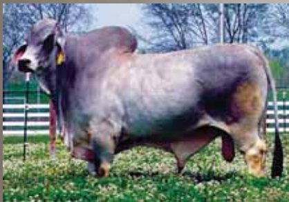
Sire, JDH Sir Walter Manso 549/6.

A.I. 12.15.13 to JDH Mr Ashton Manso 193/4