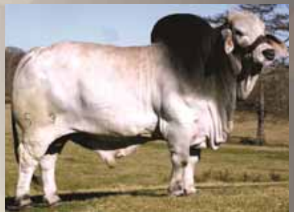
Paternal grandsire, JDH Mr. Deed Manso 53/4

(=)JDH PRESCOT MANSO (82/6) B 764877 SIDH LADY ELLIS MANSO (178/2) C 590390 JDH MR BEVAN MANSO (726/3) B 801950 =JDH MISS DARA MANSO (486/3) C 807932 +BNA THE DEACON MANSO253 (253/0) B 802443 +JDH MISS AIDA MANSO (254/6) C 801183 MSP MR. MULHIM MANSO 594 (594) B 776468 +GS MISSY DIDOR 277 (277) C 817567