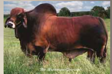
Service Sire, LB Mr Derringer Manso 953/3

A.I. 1.12.14 to LB Mr Derringer Manso T.E. 953/3