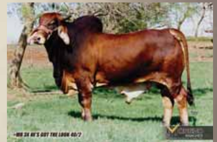
Paternal great-grand sire, +Mr. 3X He's Got The Look 40/2