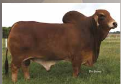
Sire, SRS Mr Troubadour 933