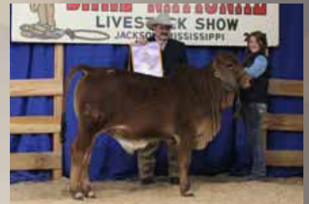
2014 Dixie National Reserve Calf Champion