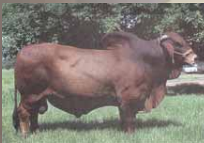
Sire, #CIGSA Mr 162/0