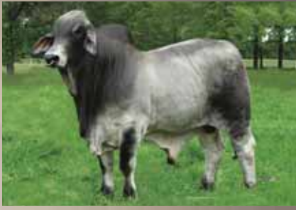
Sire, +MR KC Justice Manso 847