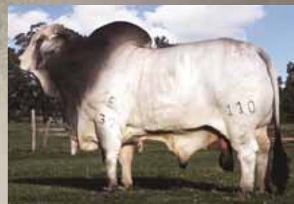
Sire, #JADL Rey Te 110