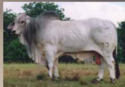
Sire, +MR. V8 777/4