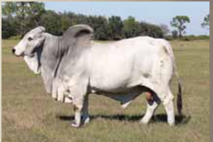
Sire, Mr Slugger 12/7