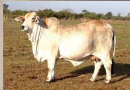
Dam, MISS B-F 201/9