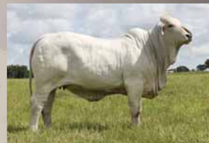
Moreno Ms. Pina Colada 124 - 2013 The Brahman Catalyst Sale top selling Lot.