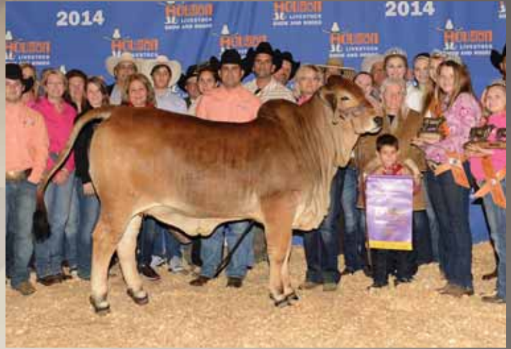
Maternal half sister to Lot 42, Moreno Ms. Lady Ruby 214.