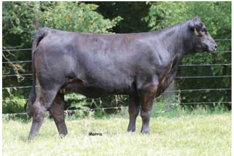
LOT 26 RVF SEDUCTION 561Y

BLACK DIAMOND QUAIL RUN RAMONA BP BLACK CAT DHAN 152G GPFF AMBER JO HUNTS HI-LITER 245G LOGAN'S CHEERLEADER 280G SY POLLED 770W LB PRETTY FANCY 217R