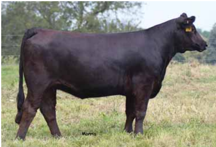
LOT 36 R/V Neon Moon 554Y