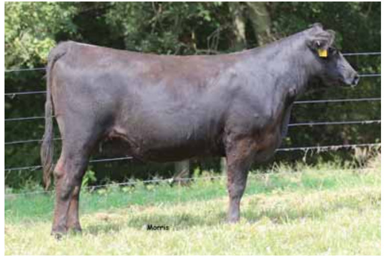
LOT 27 RVF ALL STARTS HERE 553Y

WULF'S COUNT DOWN 9251C CANE RIDGE DAPHNE 011D GENERAL LEE LOJW 40S DFLC BPC 20U GPFF BLAQUE RULON WIN VUE RAMBLIN RUBY 04K WAR ALLIANCE 9126 8006 LONGACRES IDESSA 878-319