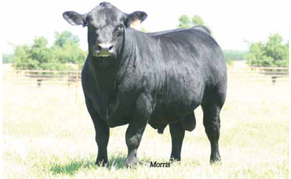
EBFL Ypsilanti420Y, service sire to Lots 40 - 43.