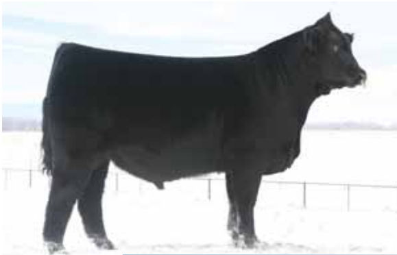
MAGS Xyloid, sire to Lot 6 embryos.

Consigned by Tichenor Farms, Centertown, KY