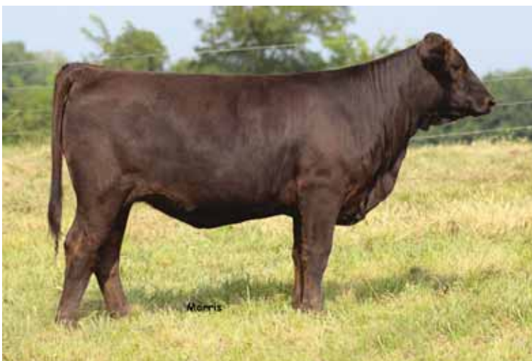
LOT 14 JEPS 103Z