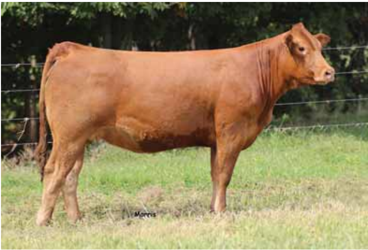
LOT 32 RVF Future idol 558Y

AUTO ROUGH IDLE 141J JCL BLACK OUT AUTO AMERICAN IDOL 162L STBR DEMETRIA 669D WULFS DELIGHT 4114D WULF'S CHALLENGER 6044Y MISS WOLFETTE 9081X WIN VUE LODESTAR HP 602 JCL LODESTAR 27L STARS 'N STRIPES 485W MISS BWSG ELEANOR 86E HBFL THELMA 9P WCF COOKIE TIME 531 WEEZ MISS SALLY