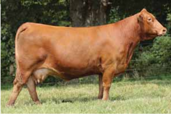
Miss Wulfette 8310U, dam to Lot 5 embryos.