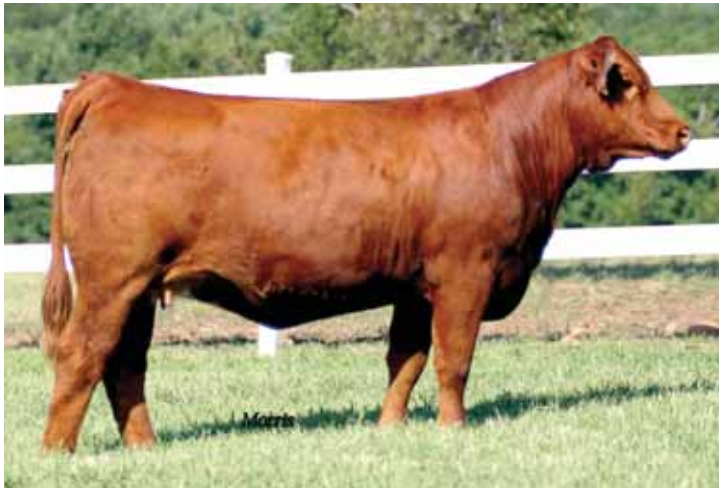
PBRS Watch This 988W, dam of Lot 53.

Consigned by Massey Limousin, London, KY