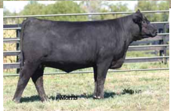
RVDR Xtra Treat 1038X, dam of Lot 10.