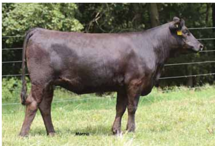
LOT 30 RVF Zoloft 572Z

Consigned by Riverside Valley Farm, Hohenwald, TN