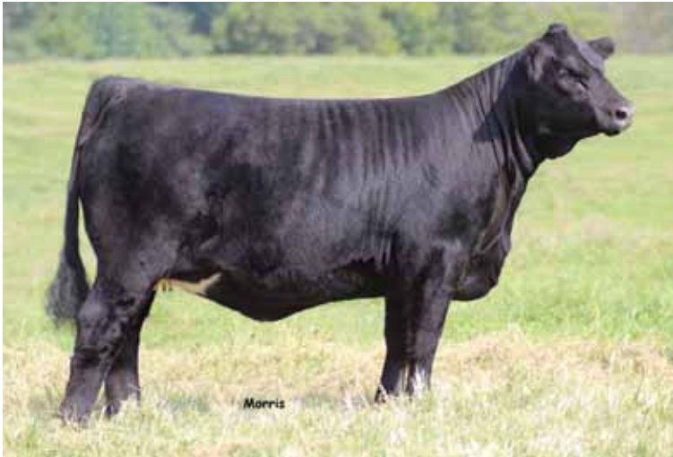
LOT 12 R VF Erica 589Z