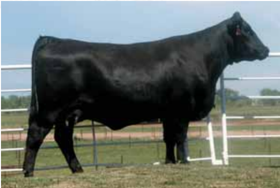
MAGS Rockcross, dam to Lot 6 embryos.