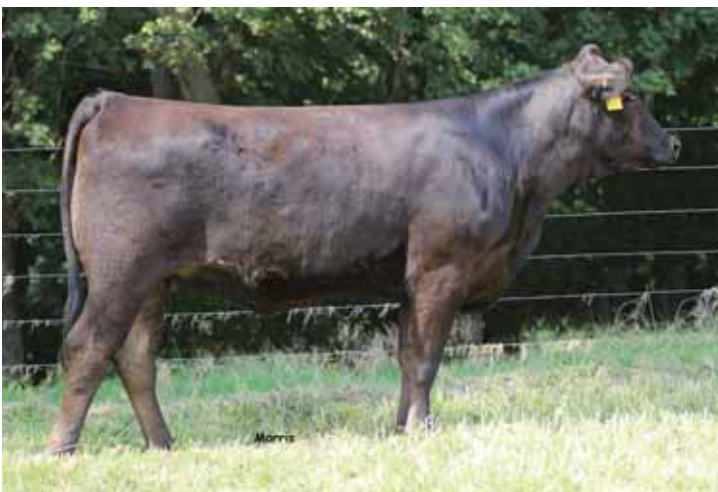
LOT 47 RVF Dream On 549Y

Consigned by Riverside Valley Farm, Hohenwald, TN