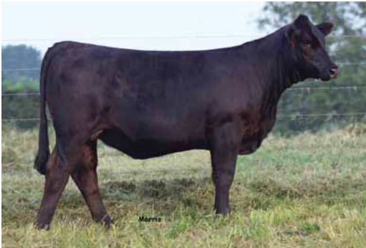
LOT 13 MCC Bright Lights 89Z