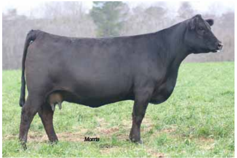
DFLC HBHPC 1S, dam of Lot 18.

DFLC HBHPC 1S JCL LODESTAR 27L DFLC HBPC 25L