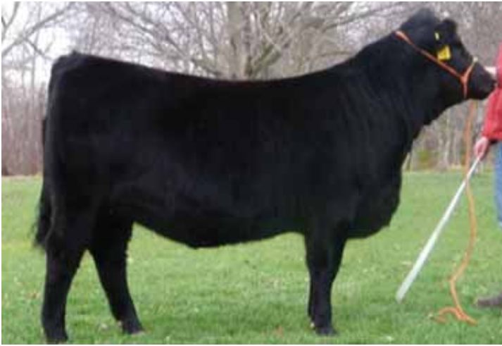
LOT 44 JEPS Sherri 61Y