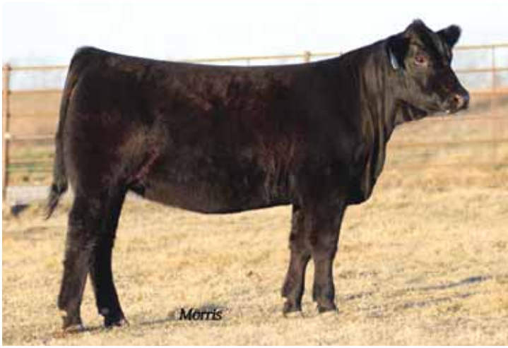
LOT 52 JEPS 368Z