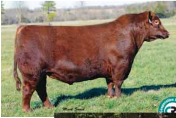
Brown JYJ Redemption Y1334, sire to Lot 5 embryos.