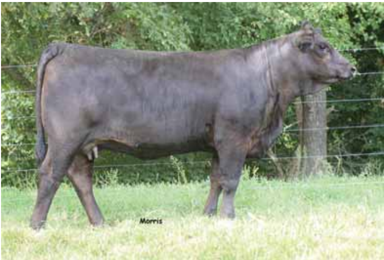
LOT 33 RVF Glory Stealer 567Y

AUTO DOLLAR GENERAL 122R LVL5 SECRET WEAPON 4408K BLACK GENERAL MIST 09W AUTO KYRIA 232K JCL EBONY MIST JCL BLACK OUT LL MISS KNOLL WCF COOKIE TIME SLVL CORL OREO COOKIE JJKH NEW COOKIE 229N WCF KATARINA CC RCDA TALIS POLL 111A MISS 0101X