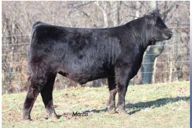
LOT 19 JEPS 363Z