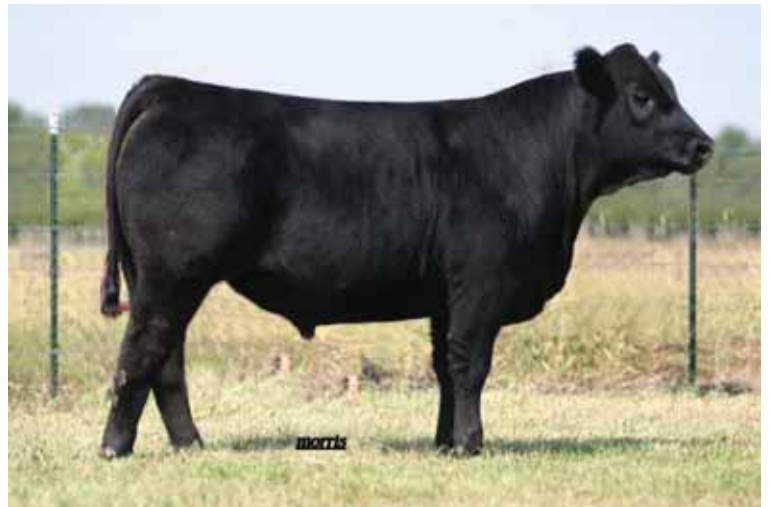
LVLS 3202U, service sire for Lots 51 - 61.

Thanks for your consideration of our product. We take pride in propagating quality Limousin and Lim-Flex cattle and are in hopes you appreciate them as much as we do.