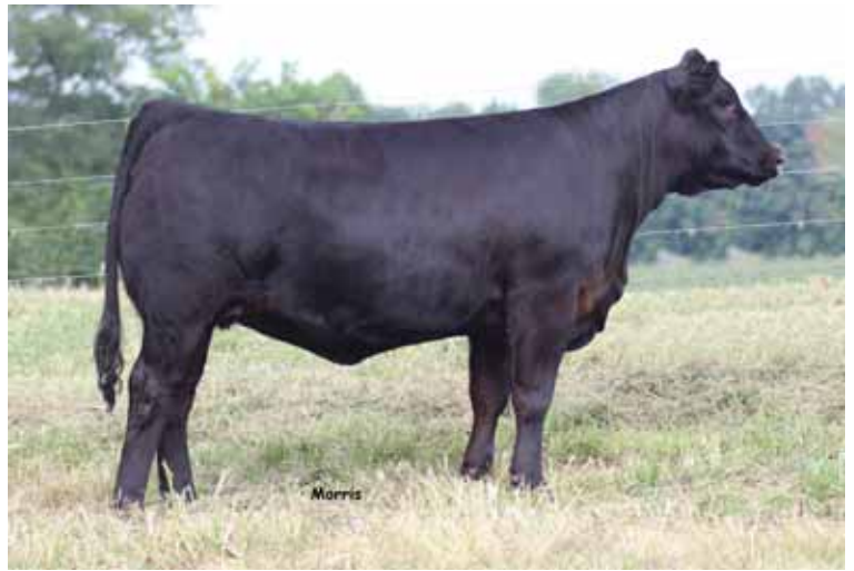
LOT 25 JEPS ZAVANNAH 361Z

HUNTS HI-LITER 245G LOGAN'S CHEERLEADER 280G VERMILION 31 STACLER 3491 CH ENV BLACKBIRD C5941 WULFS REALTOR 1503R WULFS MEADOW GRASS 2149M MYTTY IN FOCUS DIAMOND ROSE R044