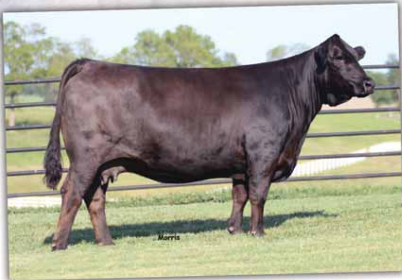
Dam of Lot 2, MAGS Manuela