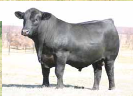
AUTO Will Power 160X, sire of Lot 11.