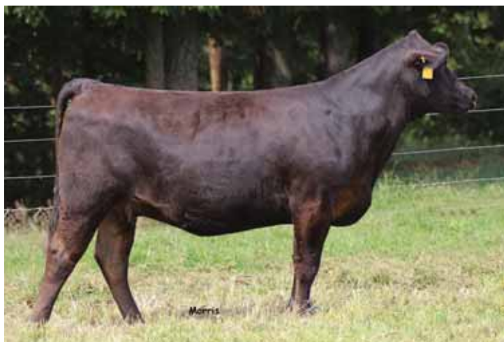
LOT 31 RVF Country Idol 552Y

Consigned by Riverside Valley Farm, Hohenwald, TN