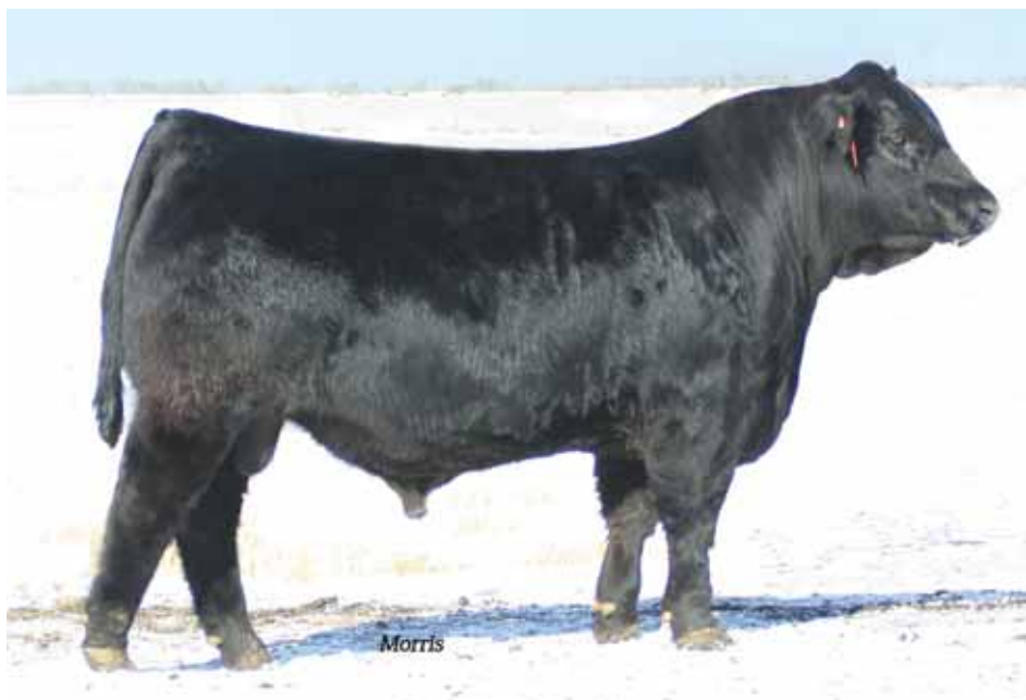
LVLS Yukon 398Y, service sire to Lots 21 - 24.

Lots 21 - 24 are consigned by Milam Cattle Co., Olmstead, KY