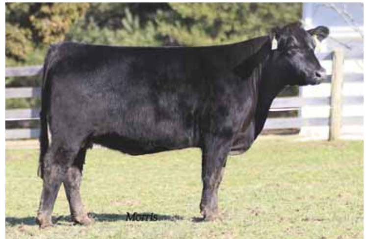
LOT 23 CJLM Miss 30X