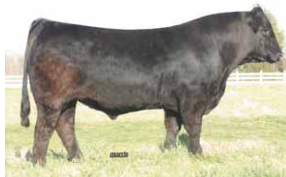
BOHI Titlelist 7050T