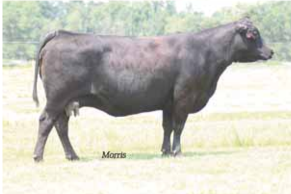
EXLR Rebeca 1014S, dam of Lot 29 embryos