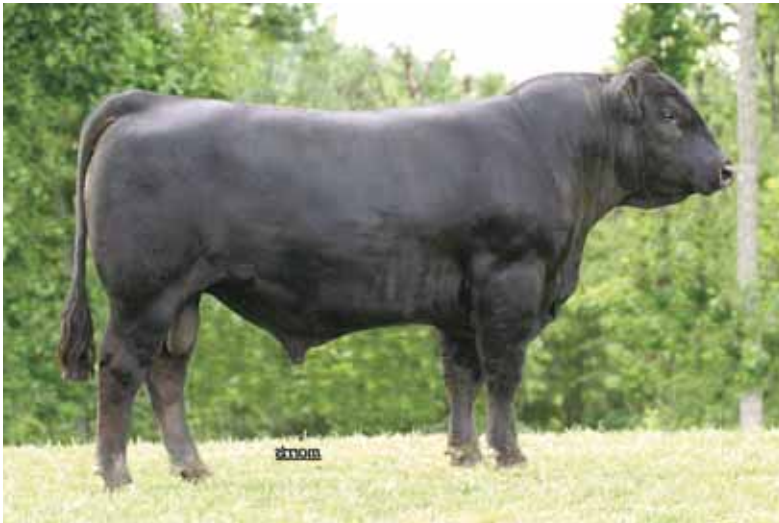
CJLM Putnam 423U, sire to Lot 62.