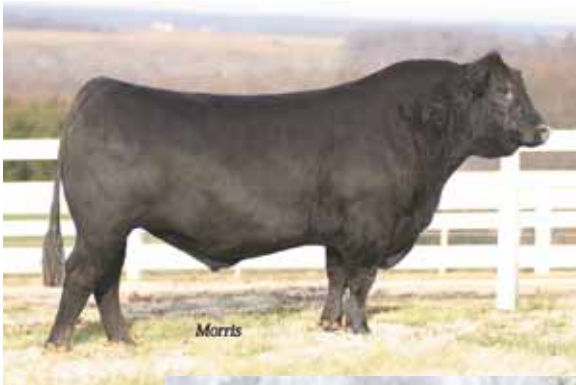
MAGS USA Choice, sire to Lot 30 embryos