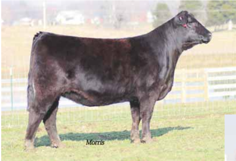
LOT 2 NHCA Yours Truly 316Y