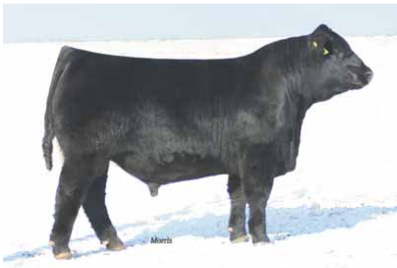
LVLS Creston 9101Y, service sire to Lot 35

LOT 35A - CJLM 8040Z - 10.25.12, PB Limousin, DB/DP. Sired by MINE Southern Lode 8130U.