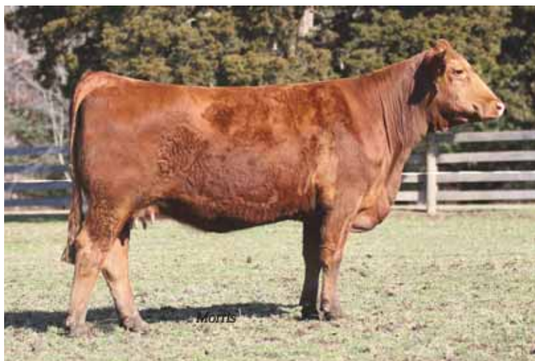
LOT 48 CJLM Winter Berry 395T