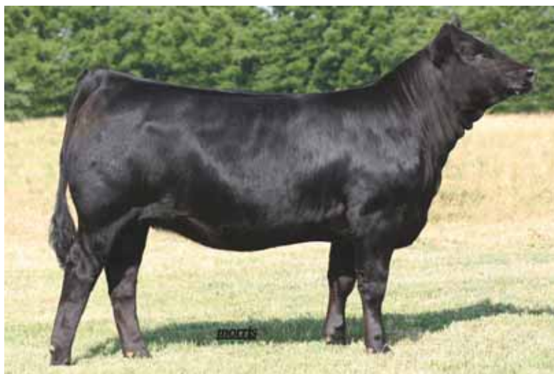
LOT 38 HAHK Una Chica 093U