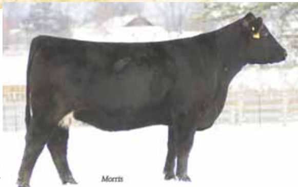
RVDR Ultra Annie 2802U, dam of Lot 30 embryos