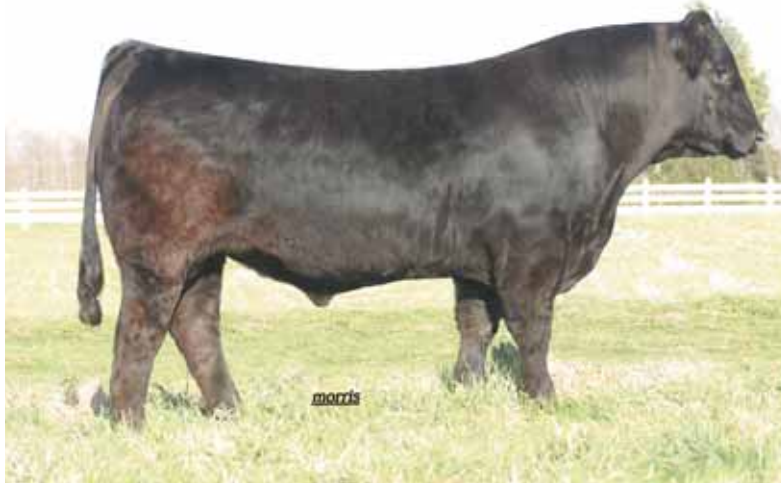
BOHI Titlelist 7050T, sire to Lot 53