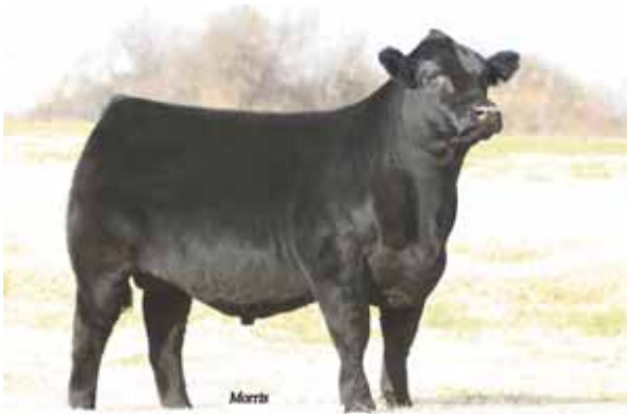
CALO Brickyard 902W, sire of Lot 28 embryos