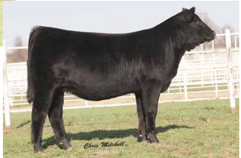
LOT 3 DVFC Nina 402Y