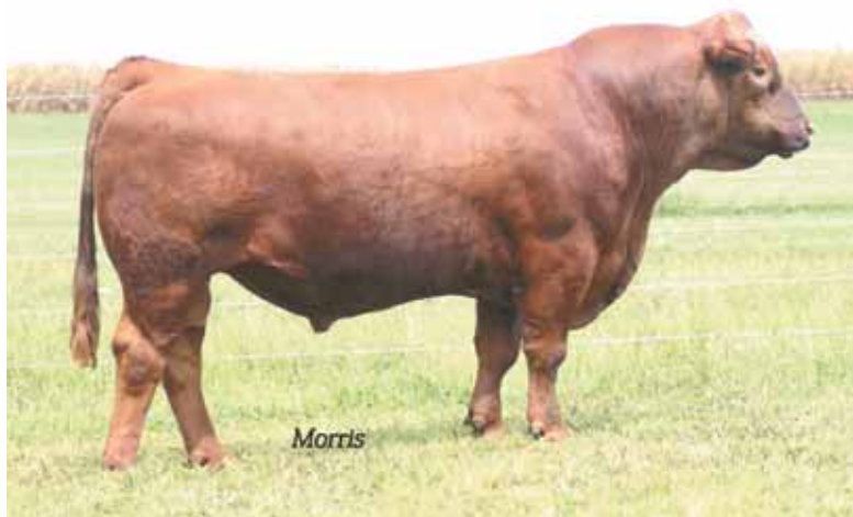
RVDR Winner, sire of Lots 48 & 49.