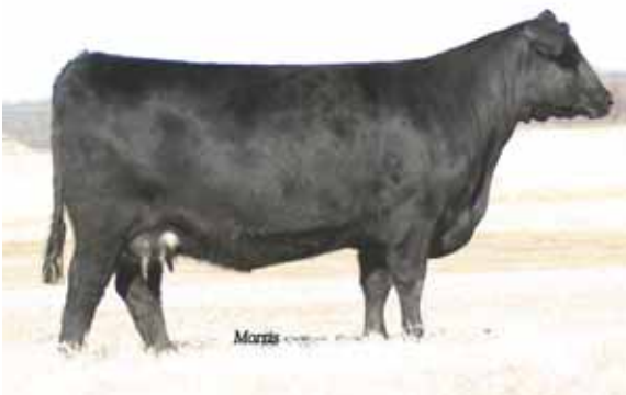
MAGS Rubics Cube, sire to Lot 32 embryos