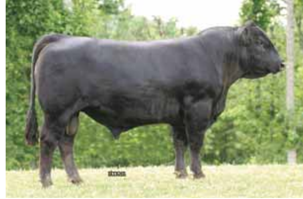
CJLM Putnam 423U