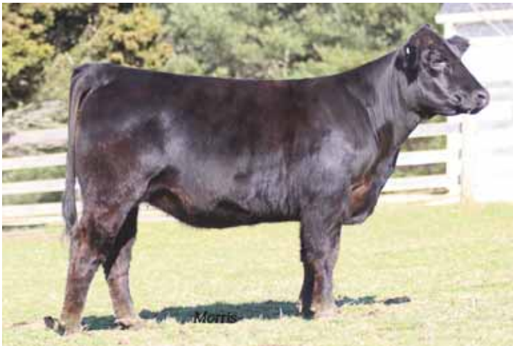
LOT 25 CJLM Miss 081X