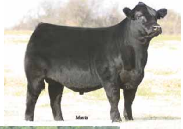
CALO Brickyard 902W, sire of Lot 28 embryos