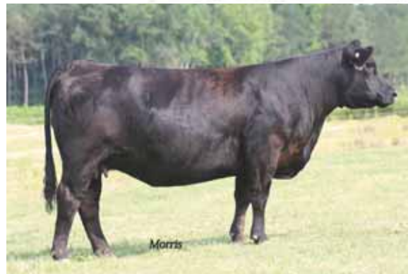
AUTO Mistee 229U, dam of Lot 28 embryos