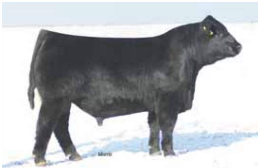
LVLS Creston 9101Y, service sire to Lots 24 & 25.