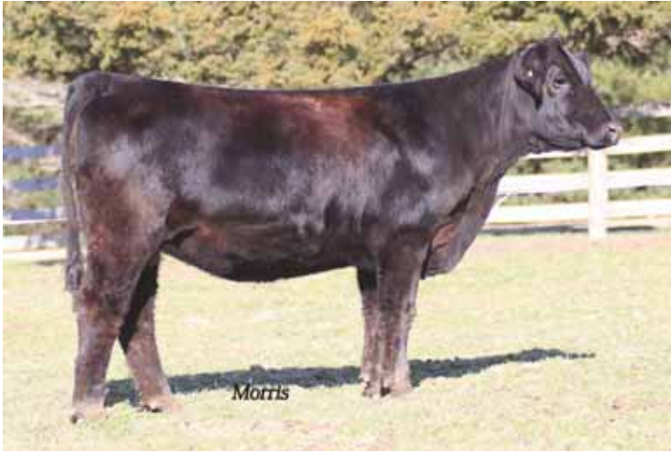
LOT 24 DPBN Thankful 087X