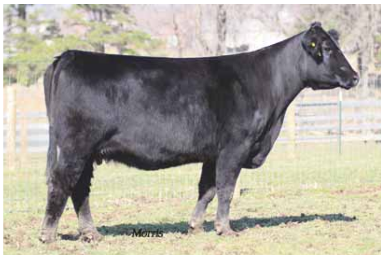
LOT 37 DL Rellic's Undeniable