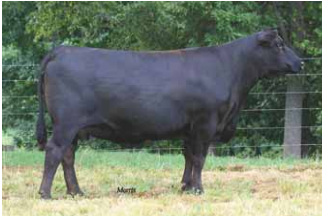
FULC Super Fox 314S, dam of Lot 8