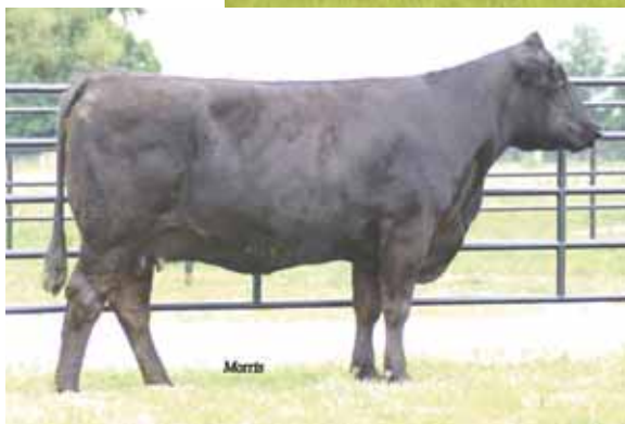
LH Resourceful 324R, dam to Lot 31 embryos