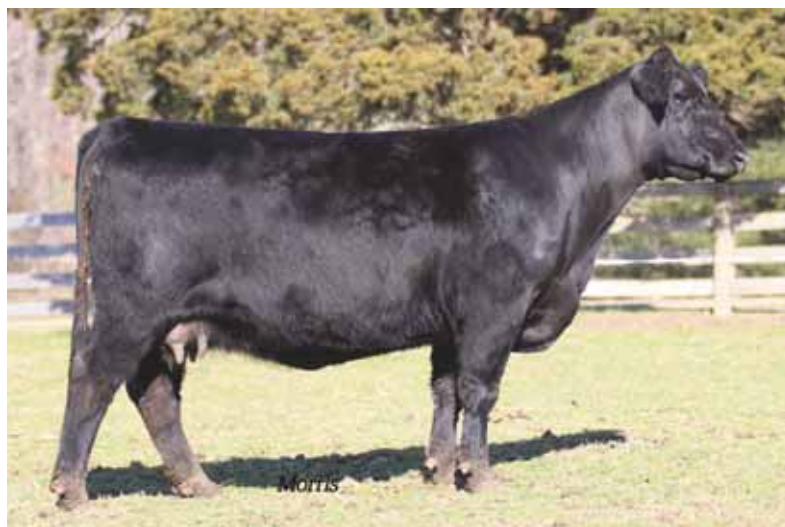
LOT 36 PBRs 578U