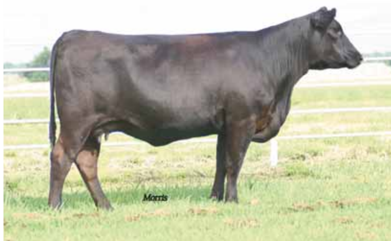
LOT 50 OKSU Helga 8401