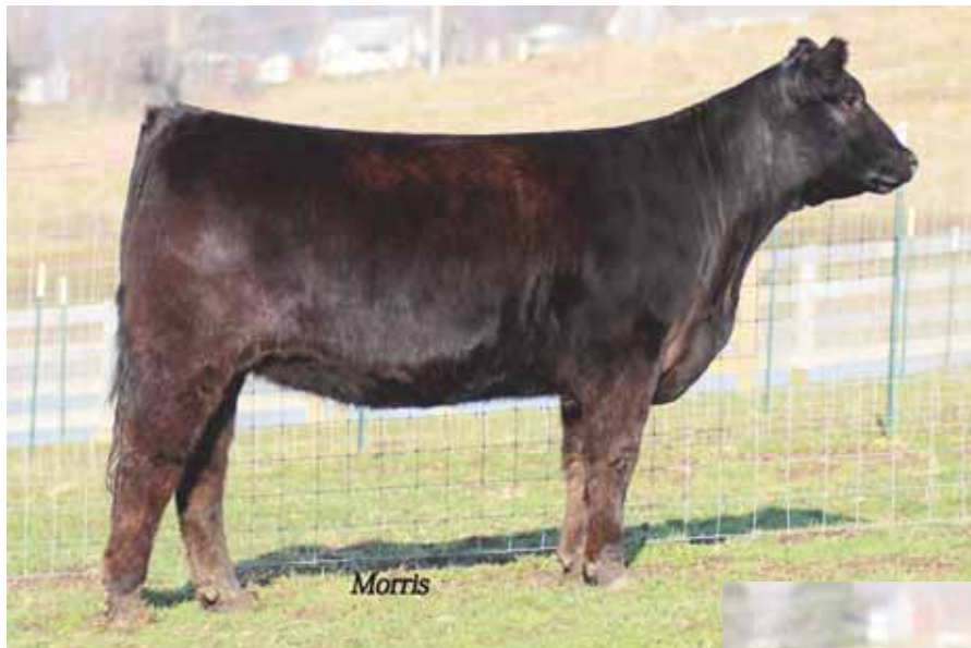
LOT 5 MINE 1073Y