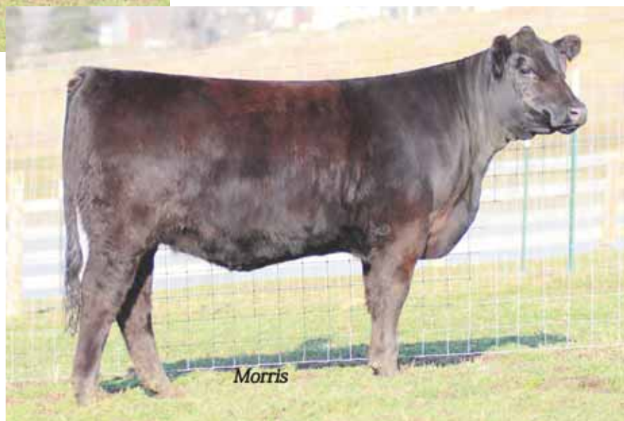
LOT 6 MINE 1075Y