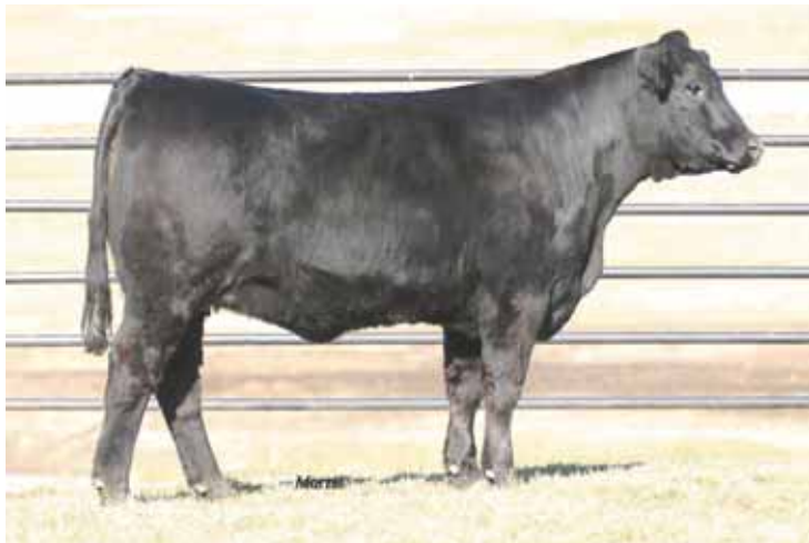
LOT 19 AUTO Castle 215X