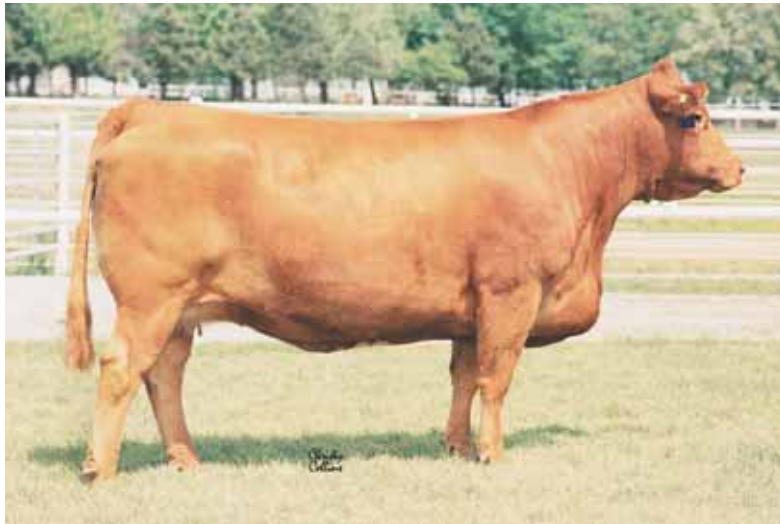
LVLS Rebeca, sister to Lot 42.