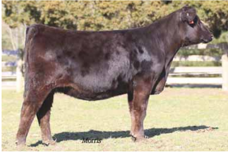
LOT 18 DPBN Thankful 087X