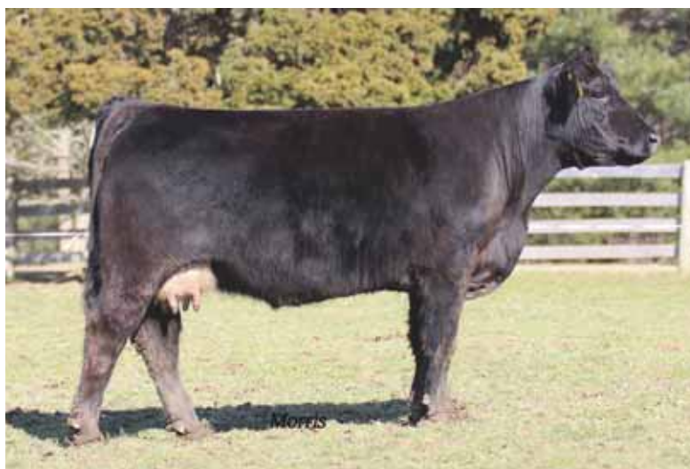
LOT 44 AUTO Tabitha 200T