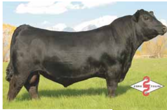
Coleman Regis 904, sire to Lot 31 embryos