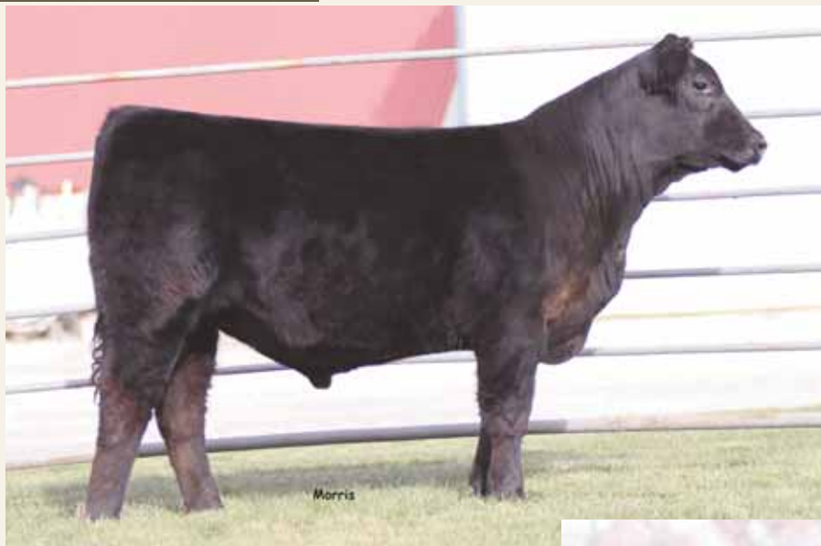
LOT 6 ... RRDC ANDROID 3016 A