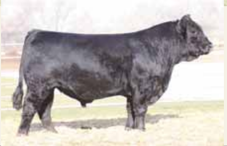
MAGS Xtra Wet