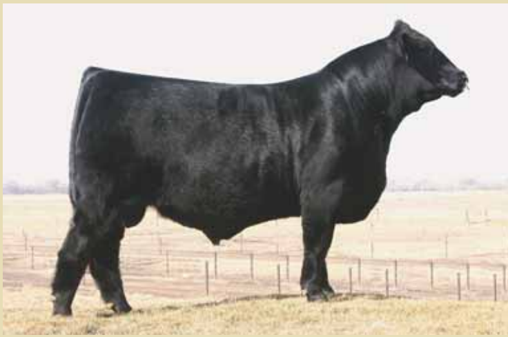
MAGS With Rythmn