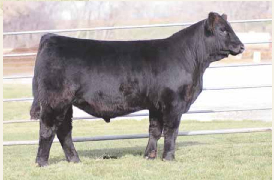
LOT 5 ... RRDC ACHILLES 3017 A