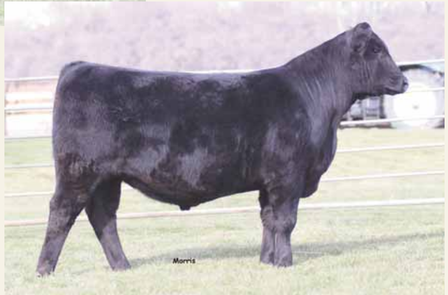
LOT 3 ... RRDC ABRACADABRA 3019 A