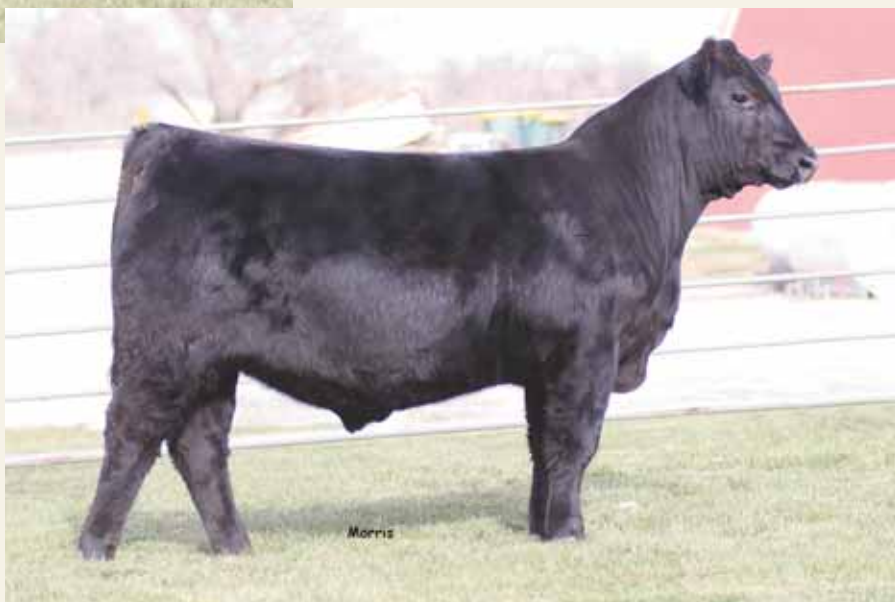
LOT 7 ... RRDC AMOS 3009 A