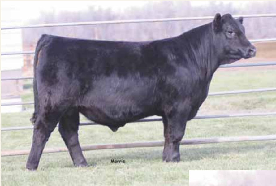
LOT 2 ... RRDC AMIGO 3015 A