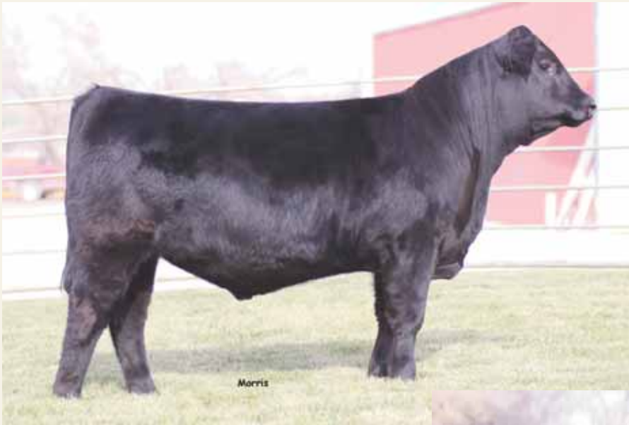
LOT 4 ... RRDC ADMIRAL 3011 A