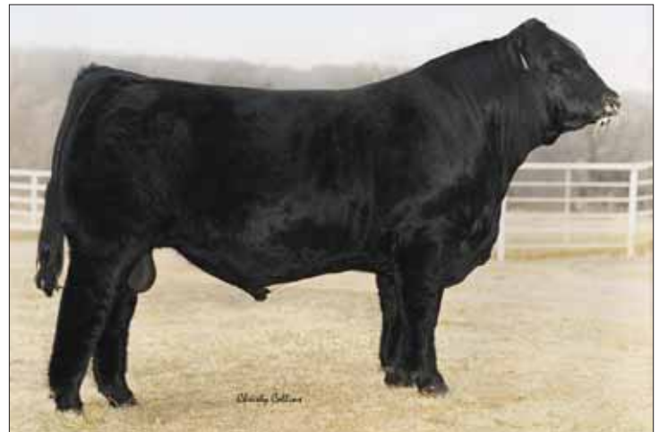
REFERENCE SIRE ... AUTO BLADK DAKOTA 129J