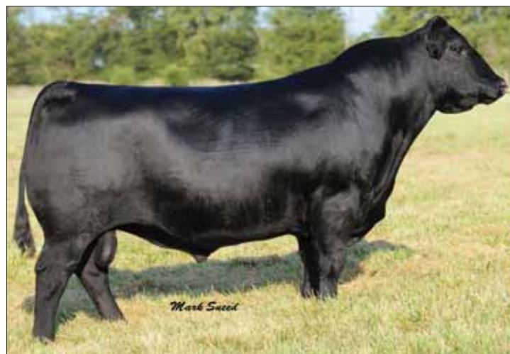
REFERENCE SIRE ... CONNEALY FINAL PRODUCT