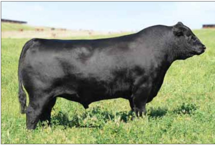
REFERENCE SIRE ... CONNEALY CONSENSUS 7229