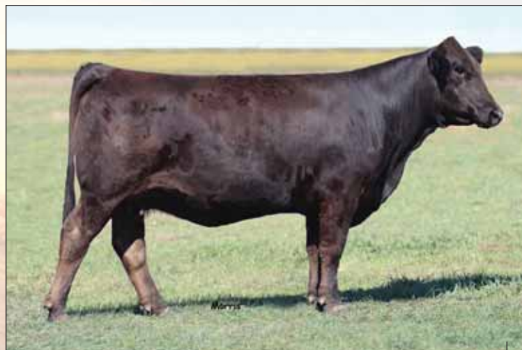
LOT 43 - MCBN WENDY 961W