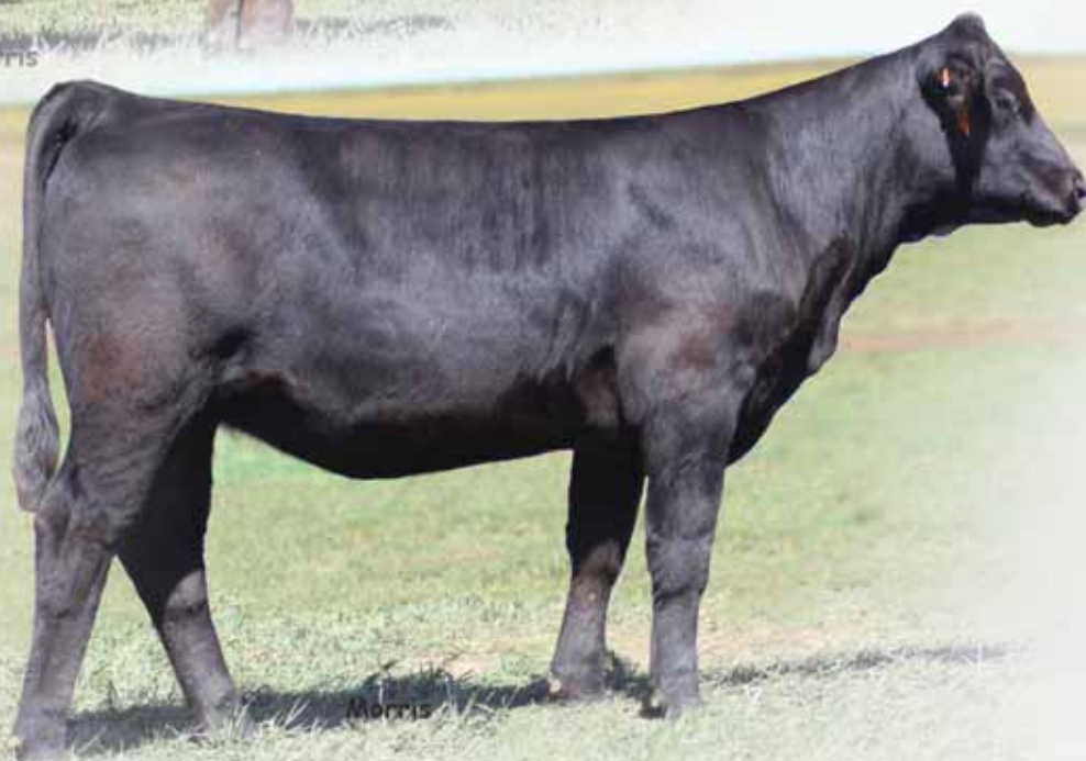
LOT 6 - LVLS ABOUT TIME 954A