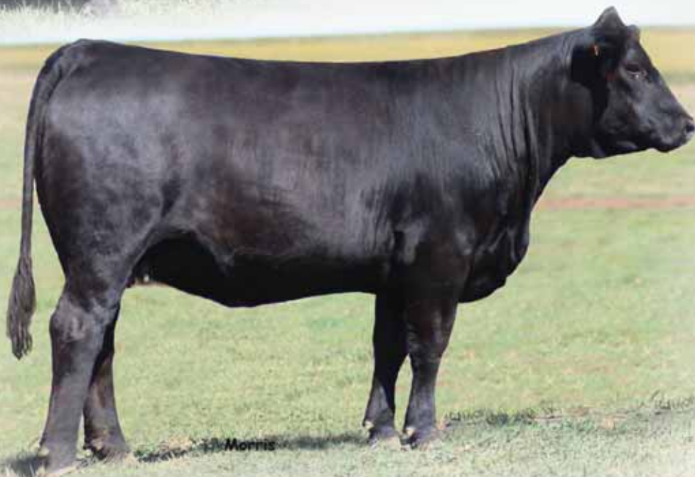
LOT 23 - LVLS ZAILE 6618Z