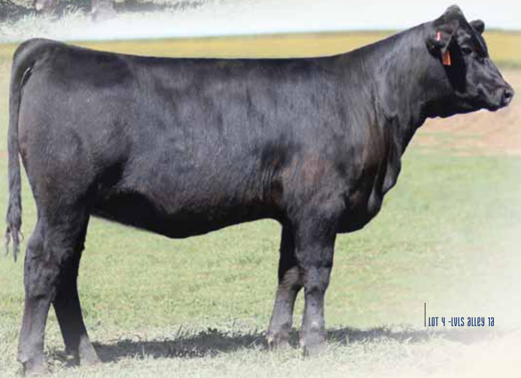
LOT 4 - LVLS ALLEY 1A