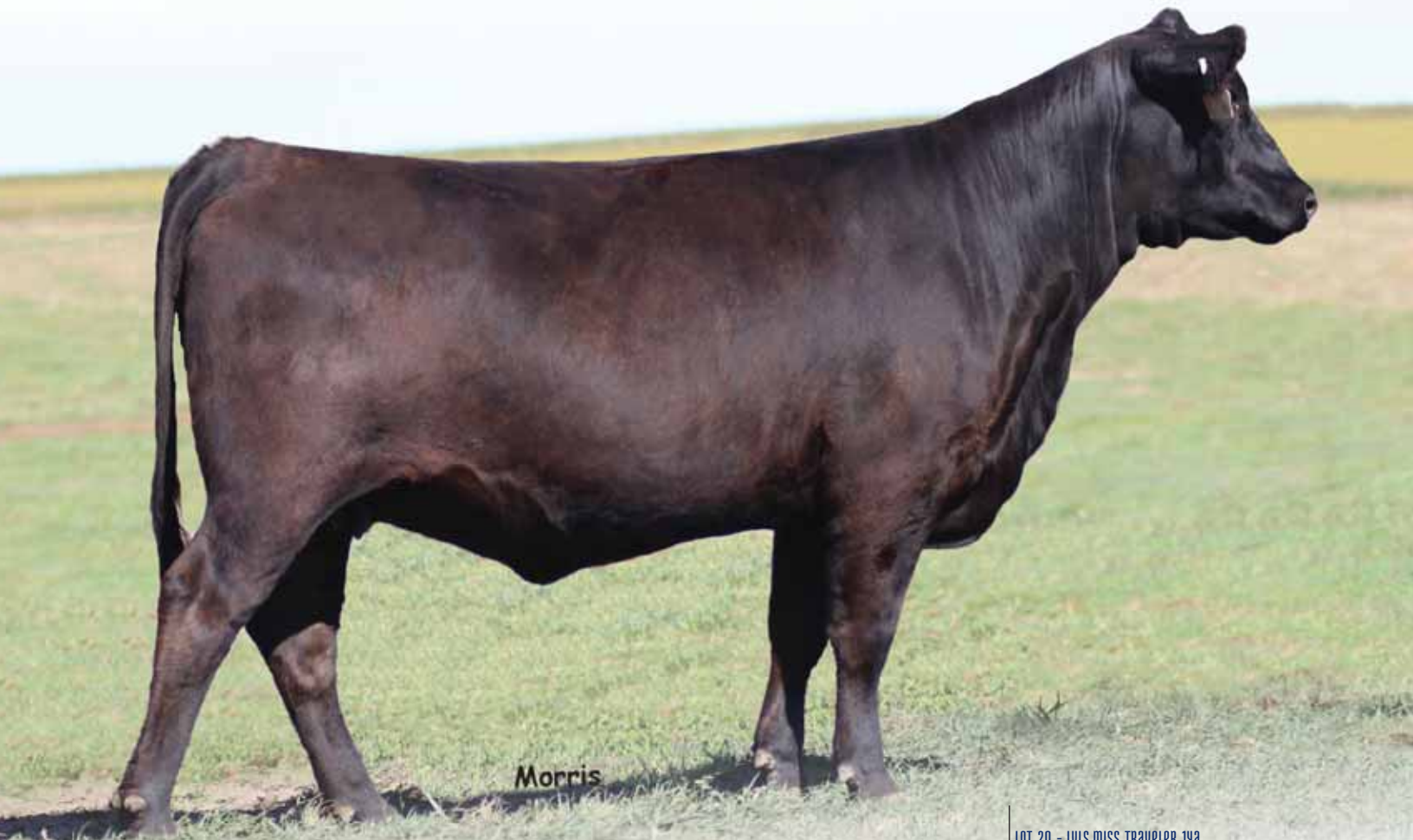
LOT 20 - LVLS MISS TRAVELER 14Z