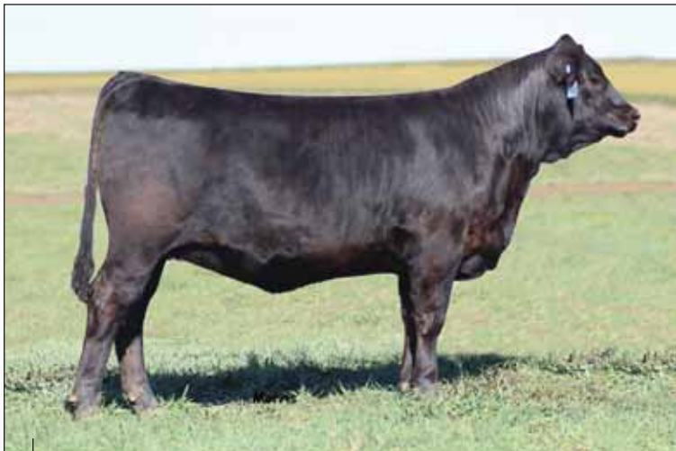
LOT 7 - LVLS ALL STAR 8102A