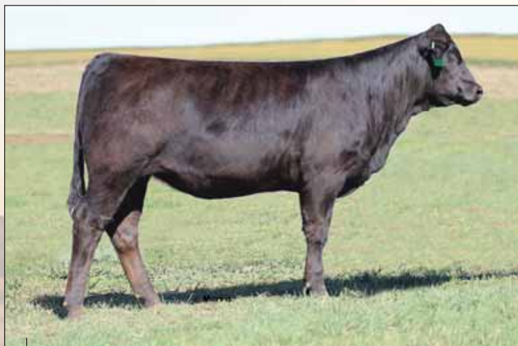
LOT 15 - LVLS AUBREY 6794A