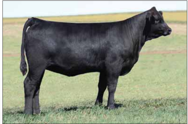
LOT 16 - LVLS 17A