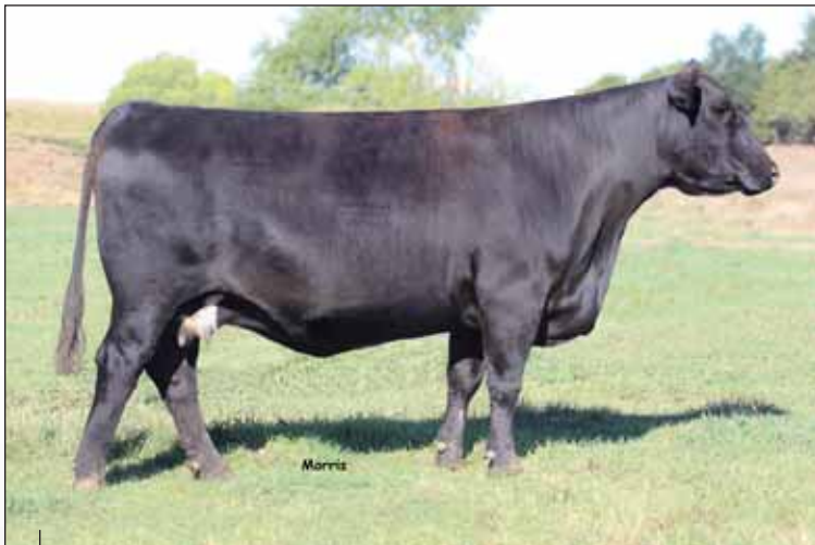
LOT 36 - LVLS MISS DESIGN 9073R