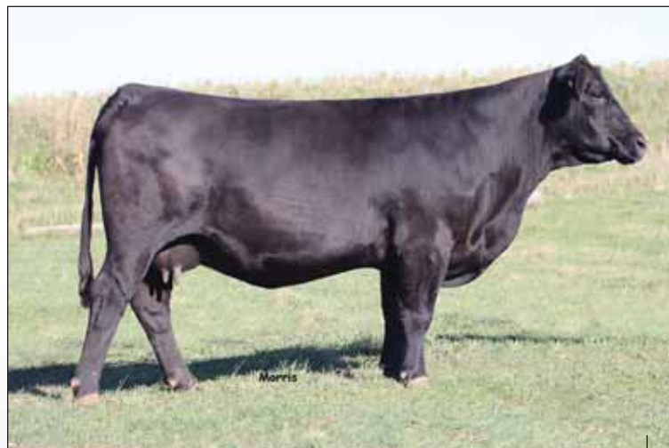
LOT 54 - LVLS MISS BANDO 775W