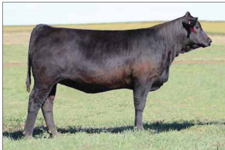
LOT 10 - LVLS ASIA 2240A