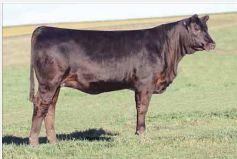
LOT 14 - LVLS ALL GOOD 2205A