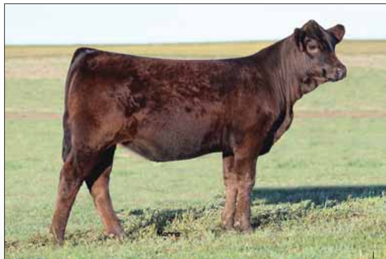
LOT 57 - LVLS 2933S