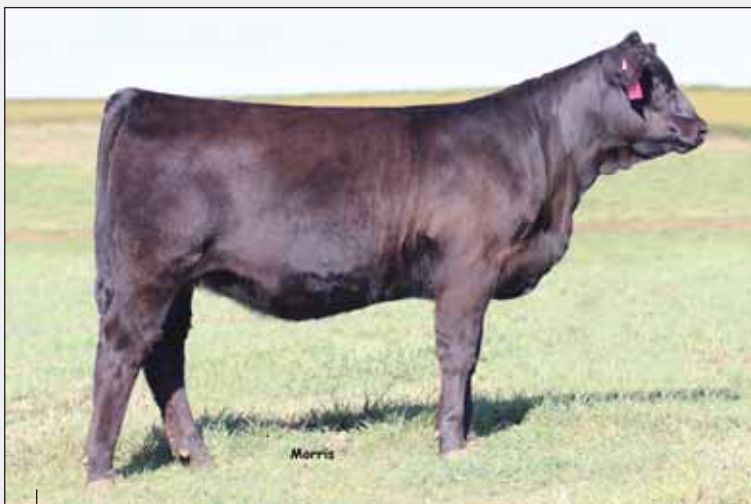
LOT 8 - LVLS ARIEL 9132A