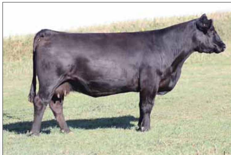
LOT 49 - LVLS 9115T