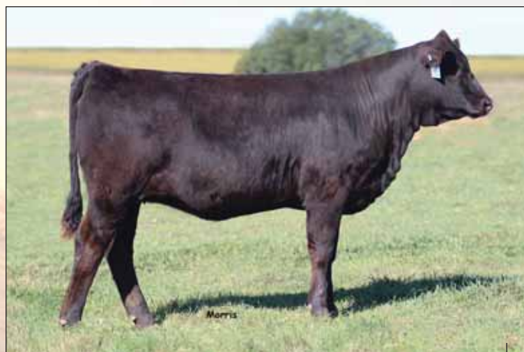
LOT 12 - LVLS ALICE 1942A