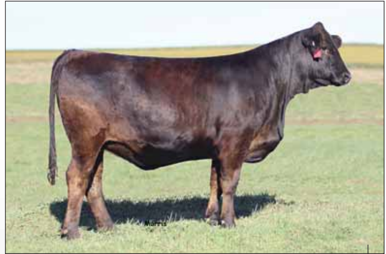
LOT 24 - LVLS MISS UNKNOWN 9175Z