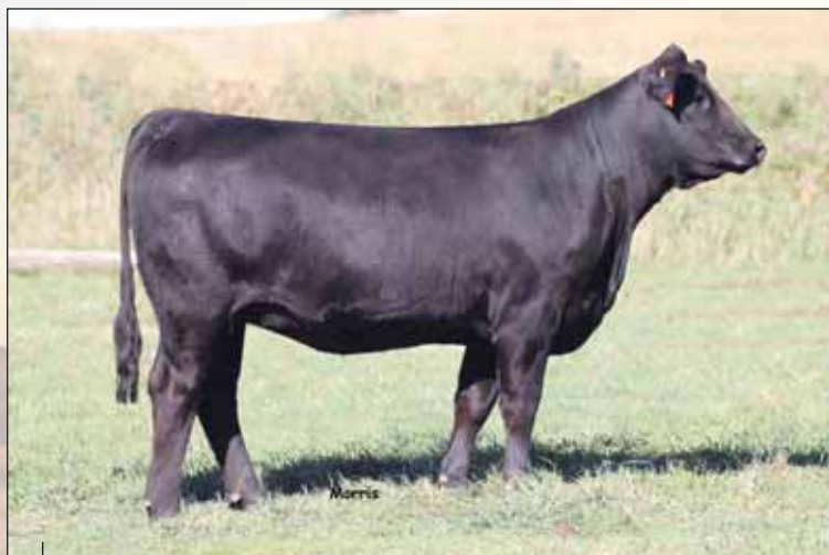
LOT 30 - LVLS ZABEL 9078Z