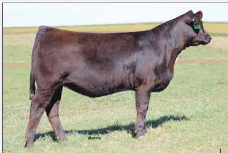
LOT 11 - LVLS MISS ROSE 1793A