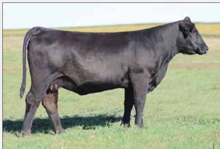
LOT 42 - LVLS YOUR SET 489Y