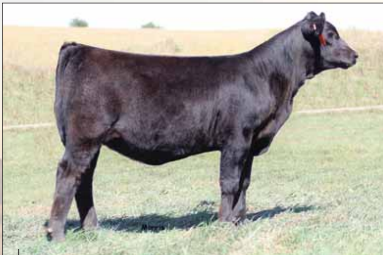
LOT 9 - LVLS ALL WASHED 5049A