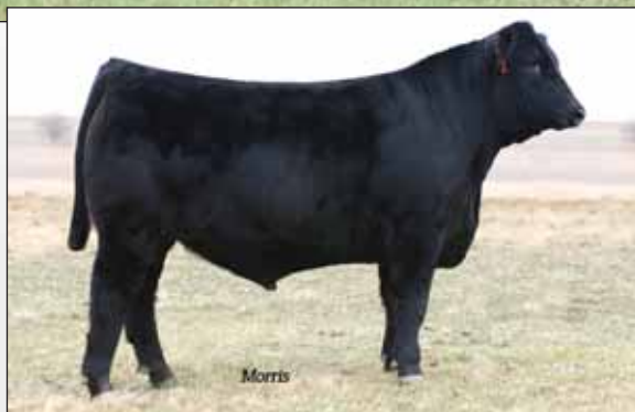
LVLS 4025Z, son of Lot 52 purchased by Smoot Limousin