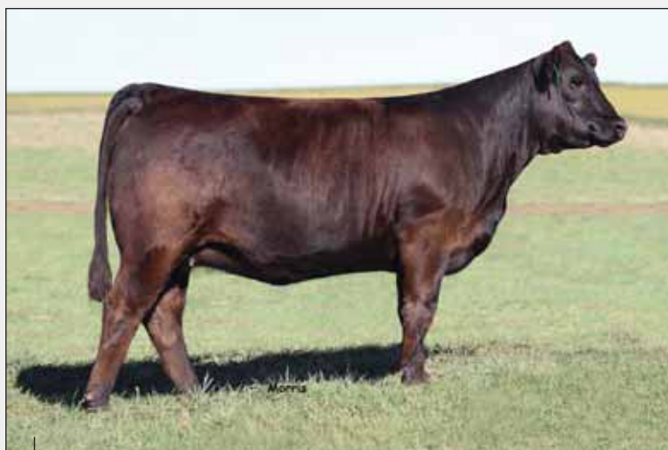
LOT 29 - LVLS MISS 4867Z