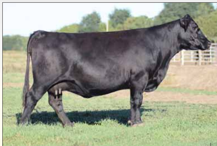
LOT 51 - LVLS Blackcap 100X