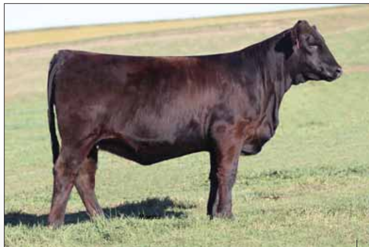
LOT 31 - LVLS MISS 9131Z