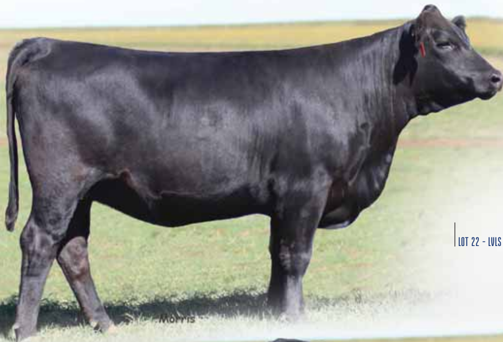
LOT 22 - LVLS MISS PRODUCT 8205Z