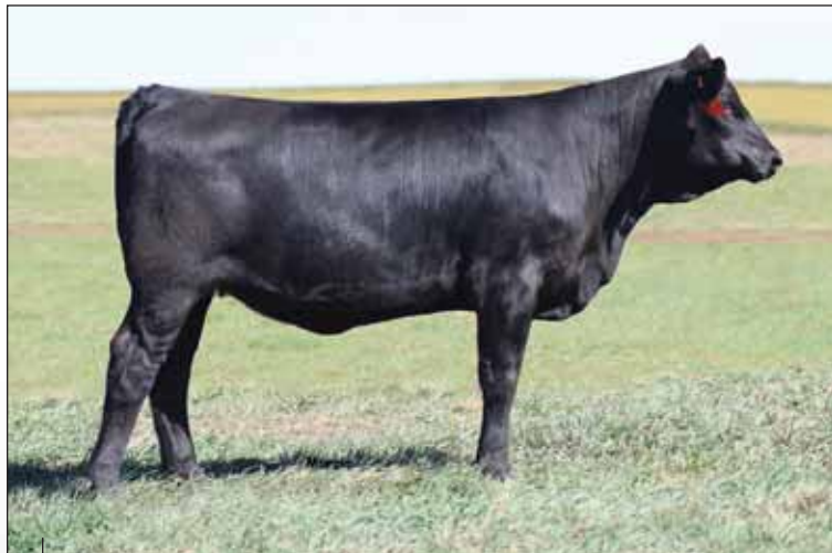
LOT 13 - LVLS ALICE 9068A