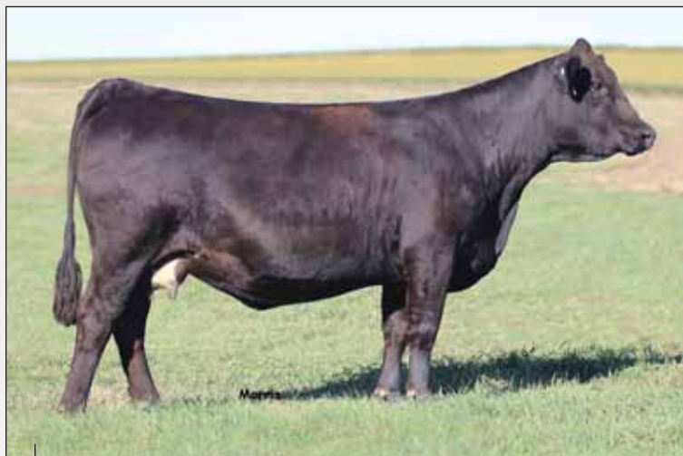
LOT 56 - MCBN WHITLEY 970W