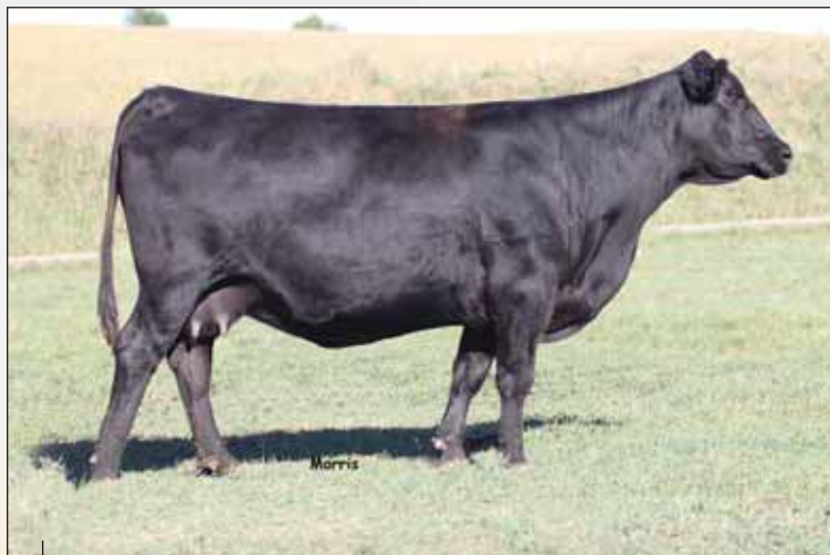
LOT 53 - LVLS MISS ND 1407 775 S