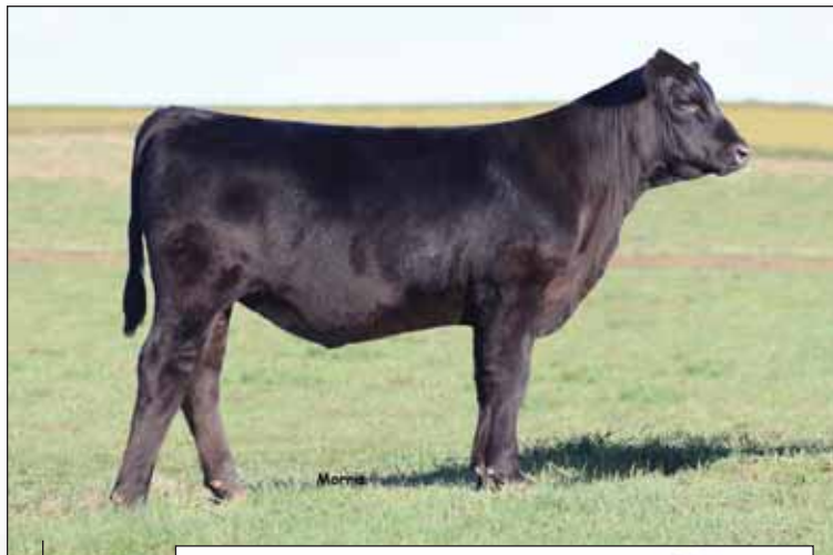
LOT 52 - LVLS APPLE PIE 4026A