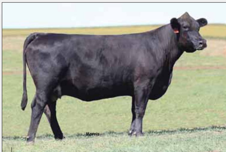
LOT 46 - LVLS 9798U