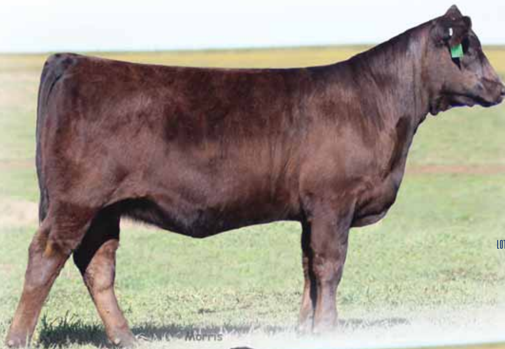
LOT 5 - LVLS ANALICE 9750A