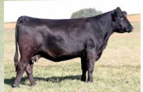
LVLS Miss Blackbird 111U, dam of Lots 3 & 4