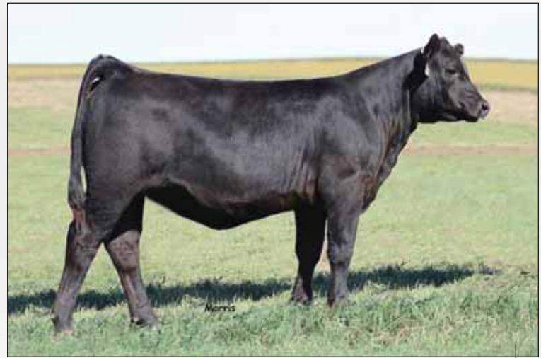
LOT 17 - LVLS ABBIE 62A