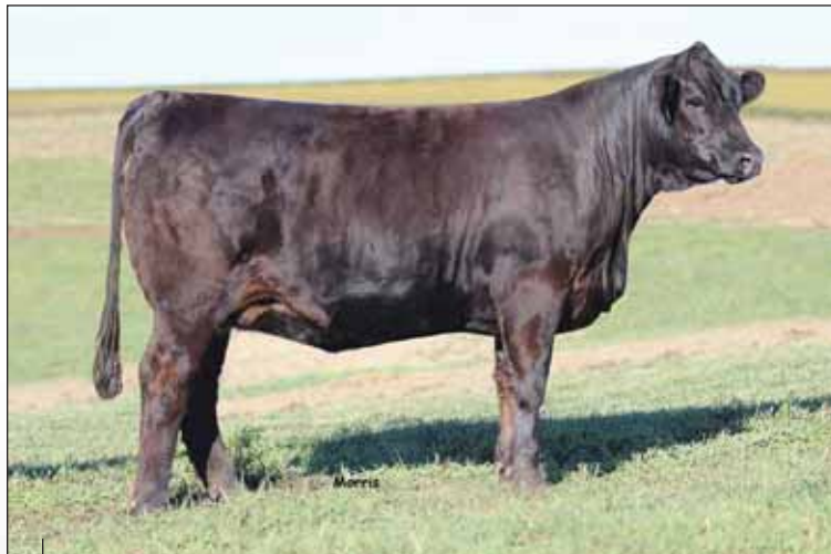
LOT 28 - LVLS MISS 6792Z