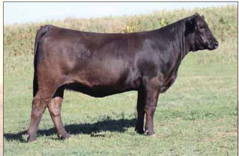
LOT 27 - LVLS ZESTY 9098Z