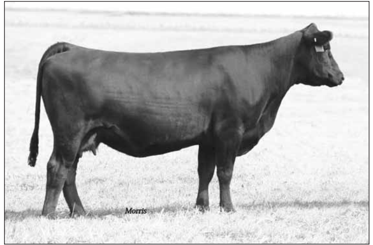
LVLS 842T, dam of Lot 52.