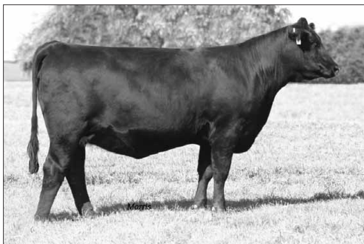
LVLS 1067X, half sister to Lot 13.