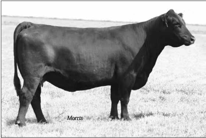
LVLS 8115T, dam of Lot 29