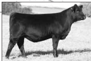
LVLS 100Y, Full sib to Lot 81