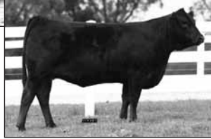
MCBN 702T, dam of Lot 56