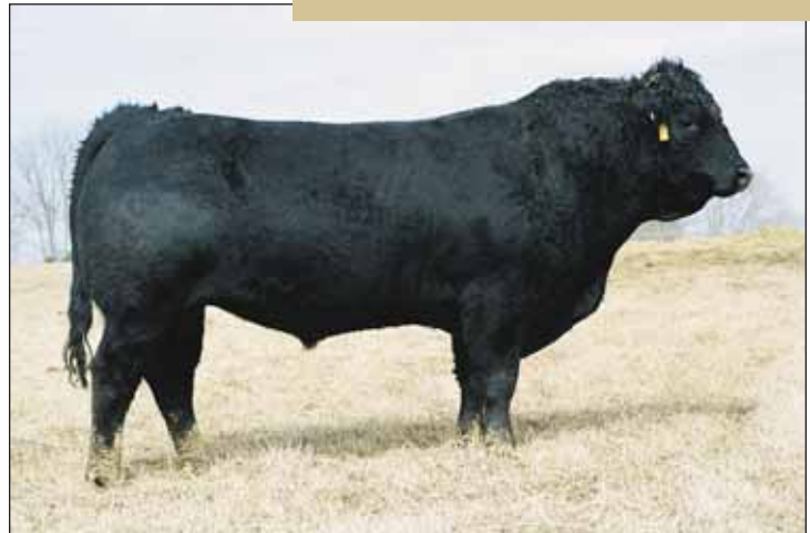
REFERENCE SIRE ... LVLS Top Criteria 8862P