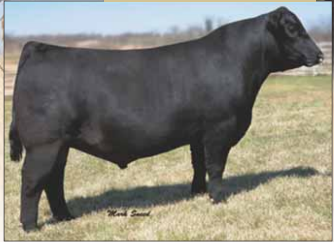
REFERENCE SIRE ... SAV Brilliance 8007