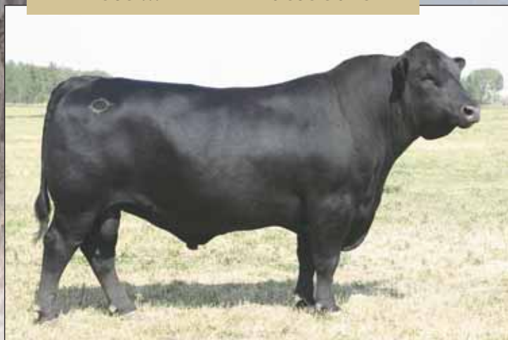
REFERENCE SIRE ... MYTTY In Focus

Video's on all bulls are available for viewing at www.lonelyvalley.com and www.DVAuctions.com .