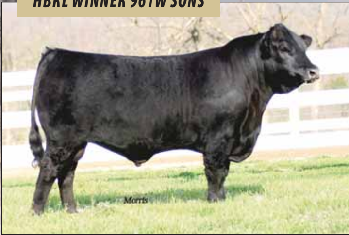
REFERENCE SIRE ... HBRL Winner 961W