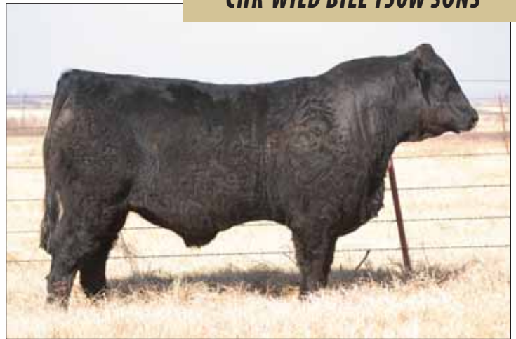
REFERENCE SIRE ... CHR Wild Bill 150W