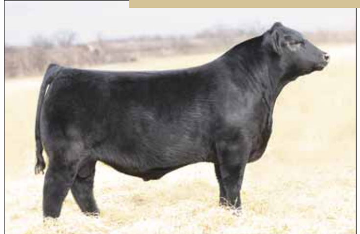
REFERENCE SIRE ... EXAR Upshot 0562B