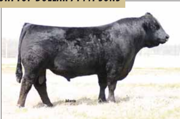
REFERENCE SIRE ... BOHI Top Dollar 7114T