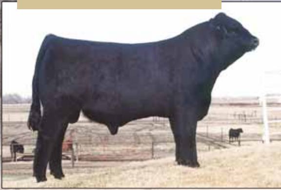
REFERENCE SIRE ... LVLS Secret Weapon