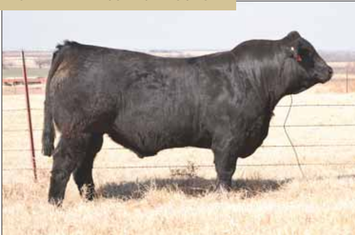
REFERENCE SIRE ... CHR White Rose 162W