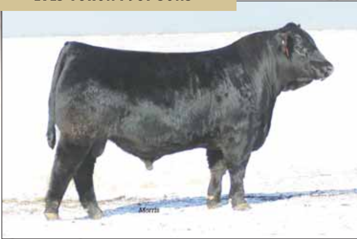
REFERENCE SIRE ... LVLS Yukon 798Y