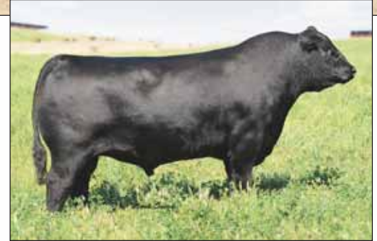
REFERENCE SIRE ... Connealy Consensus